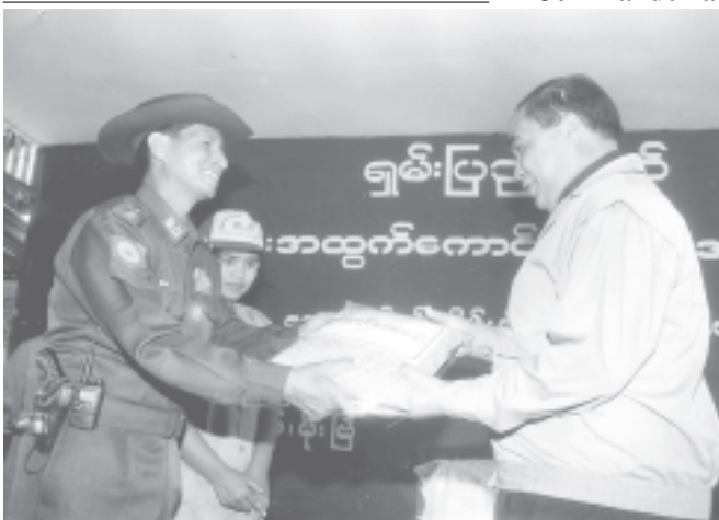
Commander Maj-Gen Khin Maung Myint presents Shweyinaye paddy seeds to a farmer.

The commander inspected the harvesting of paddy. Per acre yield from model farm is 147.53 baskets of paddy. The cultivation target in the southern Shan State is over 600,000 acres.—MNA