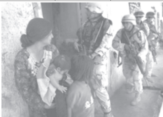
An Iraqi woman and her children leave their home as US troops from the First Infantry Division enter the building during search for weapons in Baqouba, Iraq, on 26 June, 2004.

tion voiced by Cuban President Fidel Castro last June 21, when he warned that a war against Cuba could never be won by the invading power. They urged for justice for five Cubans convicted in the United States for allegedly acting against the country's national security.