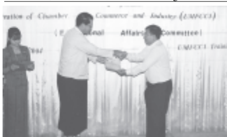
Completion certificates of International Trade Course presented by members of Educational Work Committee. — MNA

Later, they also visited Shwedagon Pagoda. — MNA