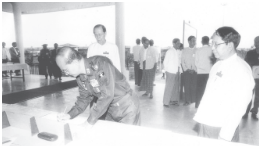
Chairman of National Convention Convening Commission Secretary-2 of State Peace and Development Council Lt-Gen Thein Sein signs the attendance register to attend the Plenary Session of National Convention.