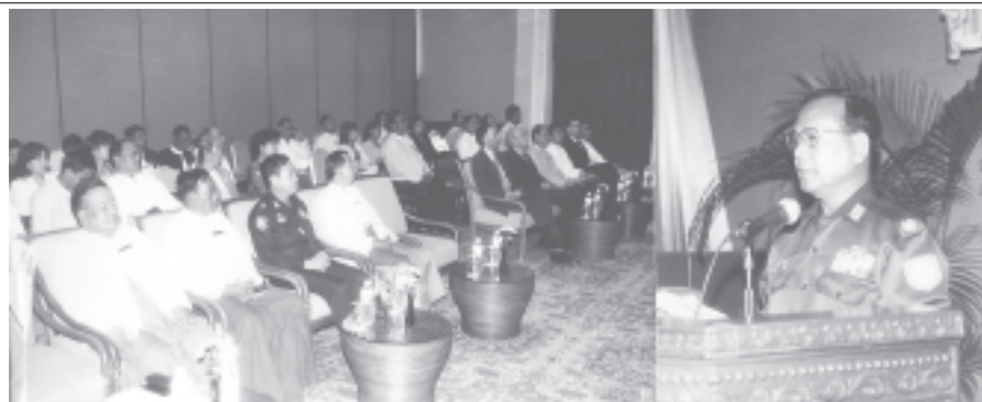
Minister for Commerce Brig-Gen Pyi Sone makes a speech at the Workshop on Implementation of Agreement on Technical Copyright.