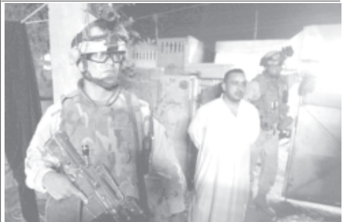
An Iraqi man waits while US Army soldiers search his home for weapons during a raid in Abu Ghraib, on the outskirts of Baghdad, Iraq, on 26 June, 2004.