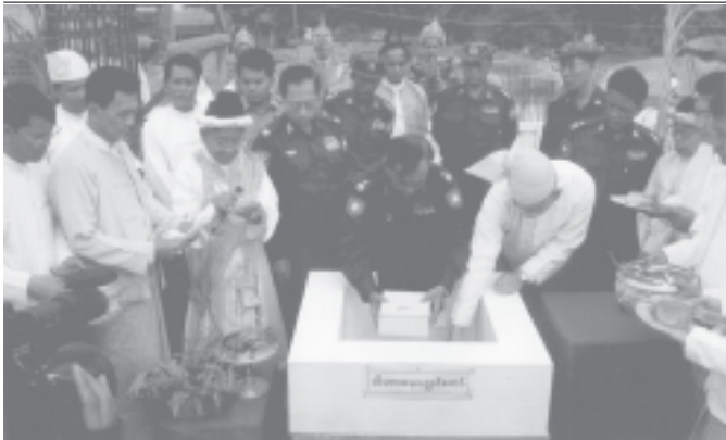
Minister for Culture Maj-Gen Kyi Aung lays gem casket at ceremony of laying three Kyahngan pillars of Arimadanapura Bagan golden palace.