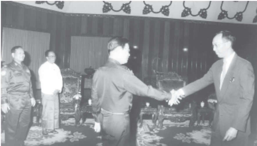
Prime Minister General Khin Nyunt greets Deputy Director General Mr Geoffrey Yu of World Intellectual Property Organization (WIPO).