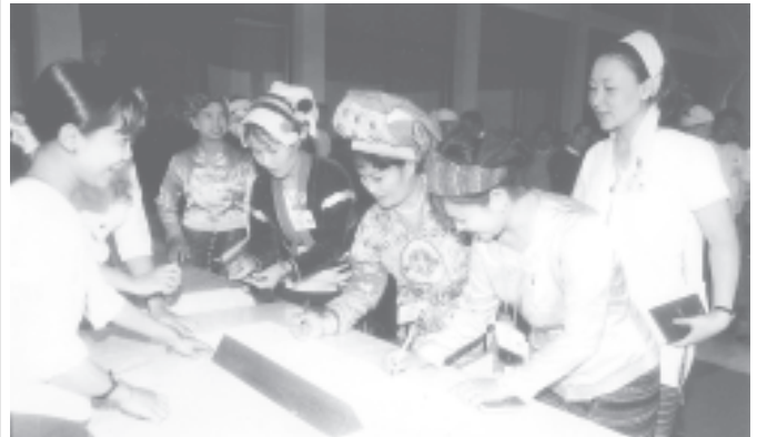
Delegates sign attendance registers to attend Plenary Session of National Convention.