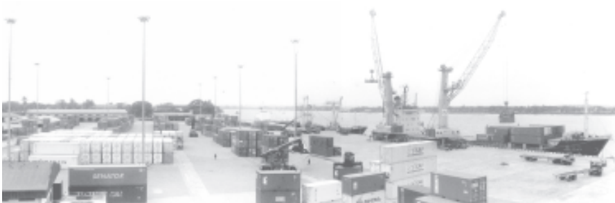
Ahlon wharves Nos 1 and 2 being operated by Asia World Port Management Co Ltd.

According to the agreement, the company would have to build the port on BOT system and operate the port for 25 years. The amount of investment was nearly