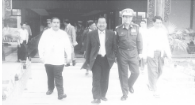
Minister for Labour U Tin Winn being seen off at Yangon International Airport. — MNA

Head of Office of the Ministry of Labour U Aung Ko also accompanied the minister. — MNA