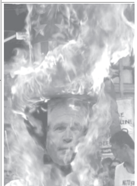
Demonstrators burn an effigy of US President George W Bush during anti-NATO and anti-Bush demonstrations in the Kadikoy District, on the Asian side of Istanbul, on 27 June, 2004. Tens of thousands of Turks chanted anti-Bush slogans and protested US President George W Bush's visit to their country as Turkish public opinion remains strongly against the US-led invasion of Iraq.

In another blow, NATO defence ministers postponed a decision yesterday to set new targets to ensure that their armed forces can deploy and sustain themselves on far-flung missions. —Internet