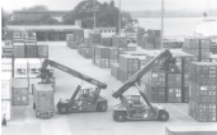
Machinery at work seen at the Ahlon wharf of Asia World Port Management Co Ltd.

"Economic development through stability" and "Emergence of a modern developed nation" are the two national goals, with which, emphasis is placed on the efforts to boost the country's economy through the invitation of local and foreign technocrats. At the same time, incentive is being given to the involvement of national entrepreneurs in these measures.