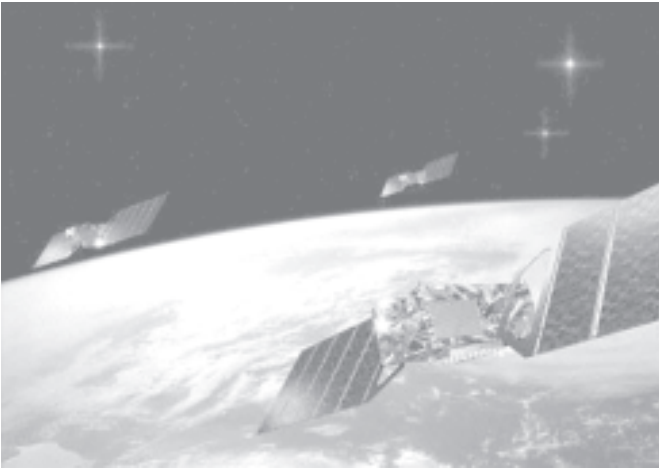
A computer image shows three satellites that will form part of the Galileo navigation system network. The United States and the EU signed a cooperation accord to ensure compatibility between their rival satellite positioning systems.