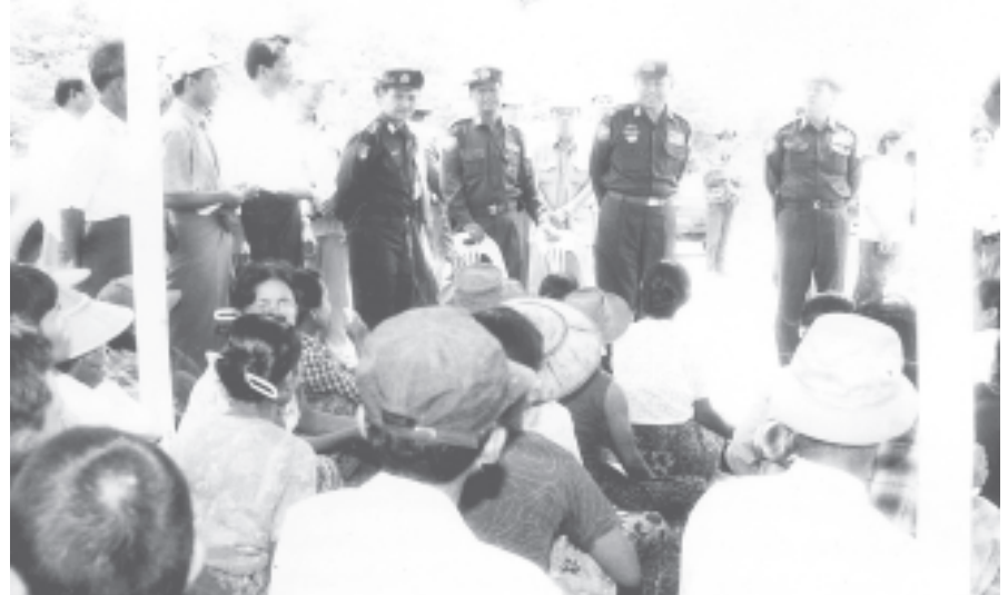
Lt-Gen Khin Maung Than meets with local people of Taungbwe Village in Padaung Township.