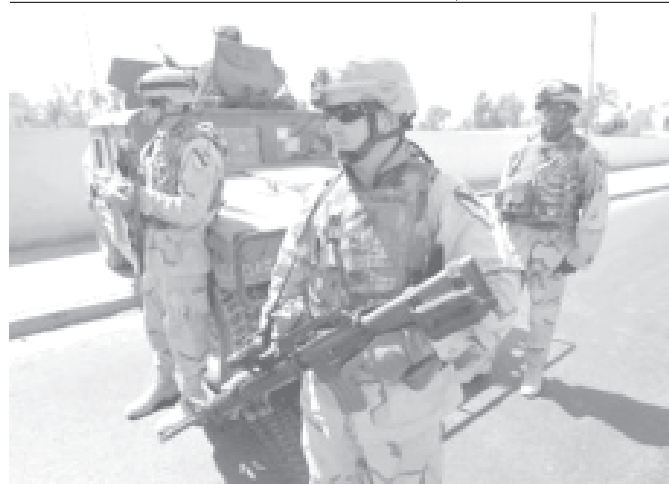
US Army soldiers set up a roadblock after a car bomb threat was reported in the Qadisiyah section of Baghdad, on 27 June 2004. The US Army expects an increase in guerilla attacks ahead of the handover of Iraqi sovereignty on 30 June.