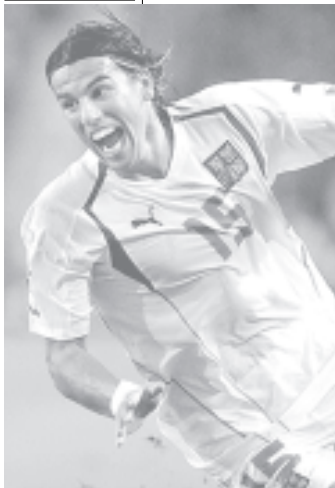
Czech forward Milan Baros celebrates after scoring the third goal for his team during their 3-0 victory over Denmark in a Euro 2004 quarter-final match. Baros scored twice.