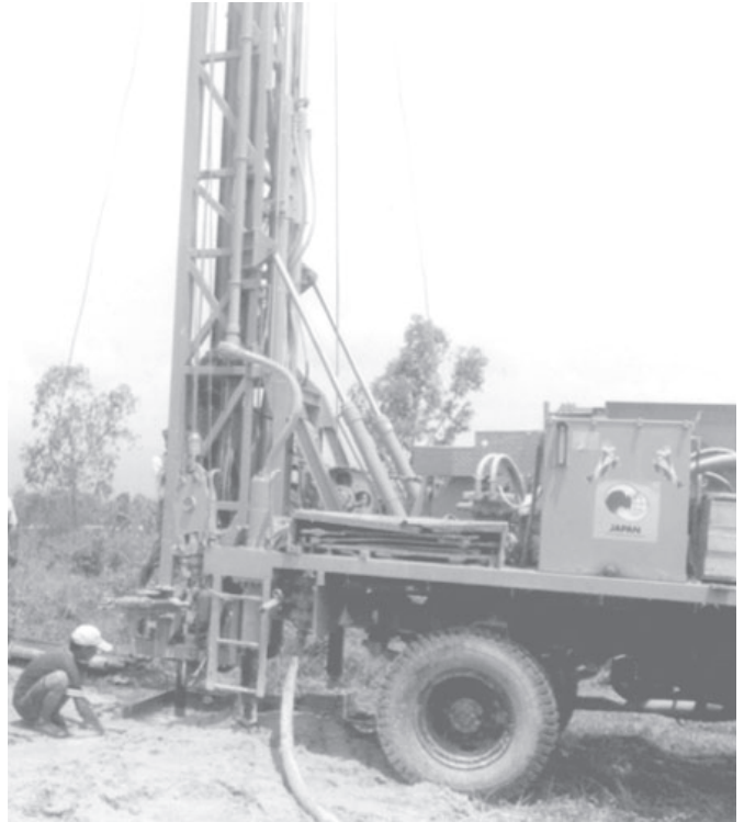
A drilling machine at work to sink a tubewell in Muse, Shan State (North).