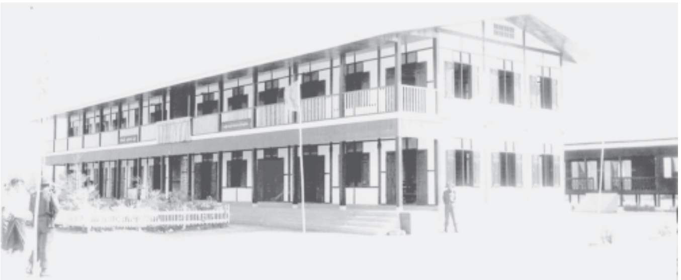
To promote the education standard of the rural areas, new schools have been opened throughout the nation. Photo shows new school building built in Linyin Village, Sagaing Township, Sagaing Division.