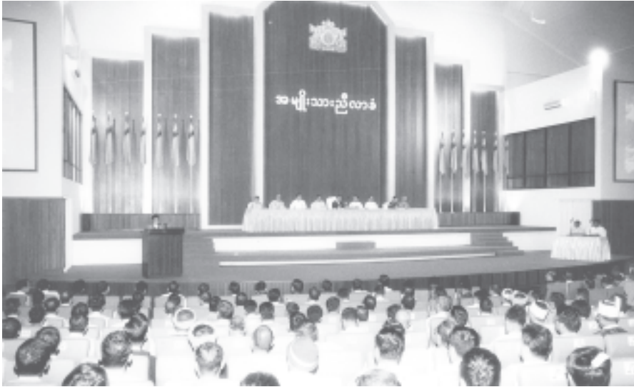
The Plenary Meeting of the National Convention in progress.