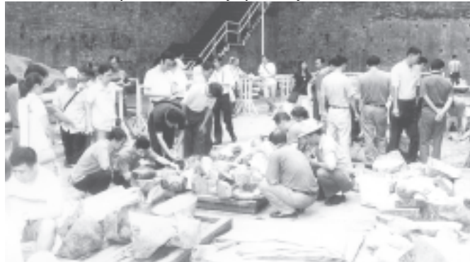
Local and foreign gem merchants view jade and gems at the special sales of jade and gems 2004.