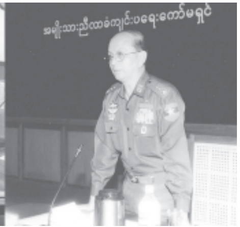
Chairman of the National Convention Convening Commission Secretary-2 Lt-Gen Thein Sein addresses the meeting.