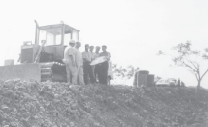
Heavy machinery were used to construct 8 miles 3 furlongs Aungheik-Seiktha road in Maubin Township, Ayeyawady Division.