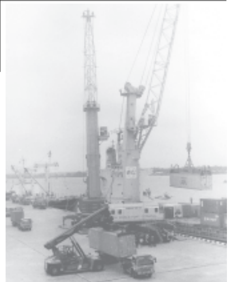
Containers being loaded onto and unloaded from a foreign vessel at No-2 Ahlon wharf.