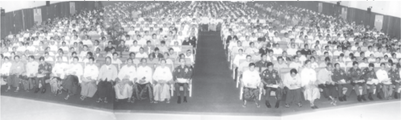
Delegates attend Plenary Session of the National Convention.

The National Convention is the concern of all our national races.