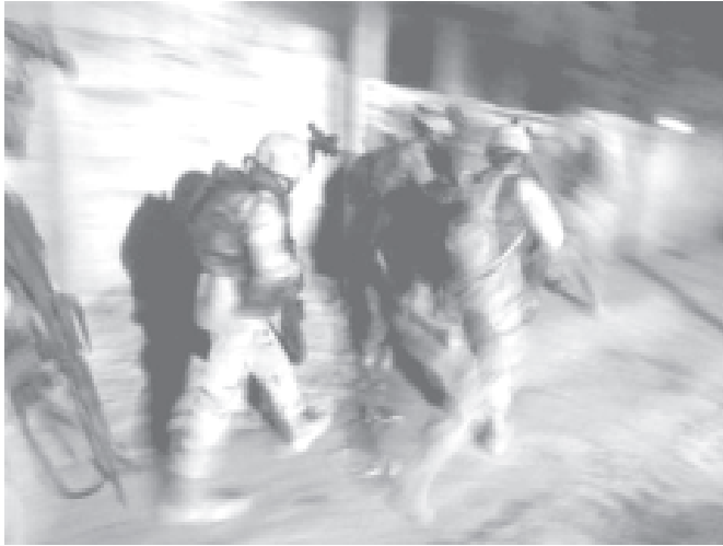
US Army soldiers raid a section of Abu Ghraib, on the outskirts of Baghdad, Iraq, while searching for weapons on 26 June, 2004.