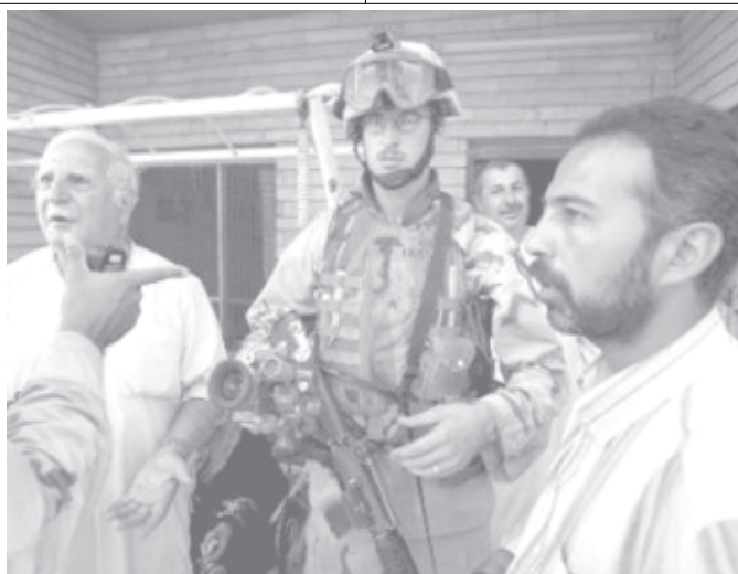
US Army soldiers question Iraqi men while searching for weapons in the Yarmouk section of Baghdad on 27 June 2004. The US Army expects an increase in guerilla attacks ahead of the handover of Iraqi sovereignty on 30 June.

Christian Aid put the figure at $13bn (£7.1bn).