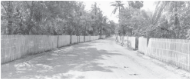
A smooth village road constructed in Padagyi model village in Kyauktan Township, Yangon Division.