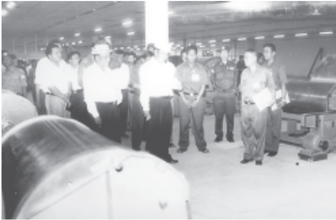
Minister U Aung Thaung inspects installation of machine parts at Pwintphyu Textile Factory project, Magway Division.