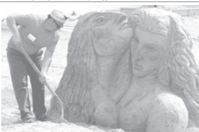
A sculptor puts the finishing touches to his sand sculpture of two women in Kiev, on 26 June, 2004. A sand sculpture festival opened on Saturday in the Ukrainian capital and more than 20 sculptors participated in the event. — INTERNET

"This is a raw attempt to exert political control over scientists and scientific evidence in the area of international health," Waxman wrote. — MNA/Reuters