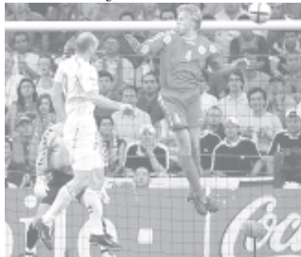
Czech forward Jan Koller (L) heads the ball to score the opening goal despite Danish defender Martin Laursen (R) during the Euro 2004 quarter final match between Czech Republic and Denmark.