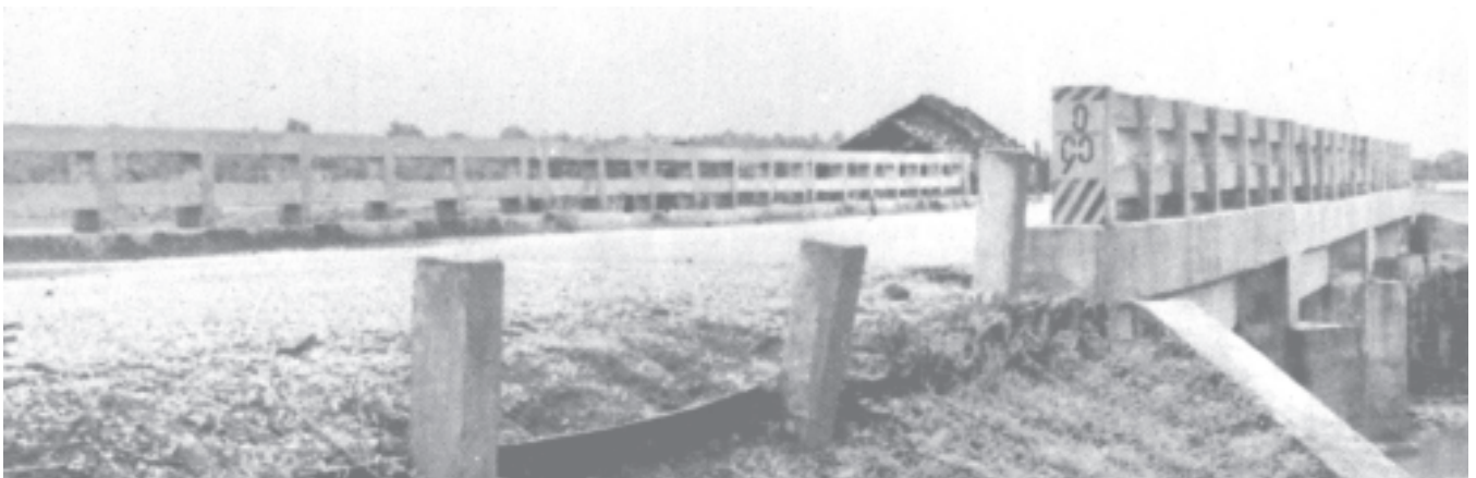
A bridge on Hpa-an-Naunglon-Gyaing-Kyondoe road in Kayin State was built for the convenience of people.