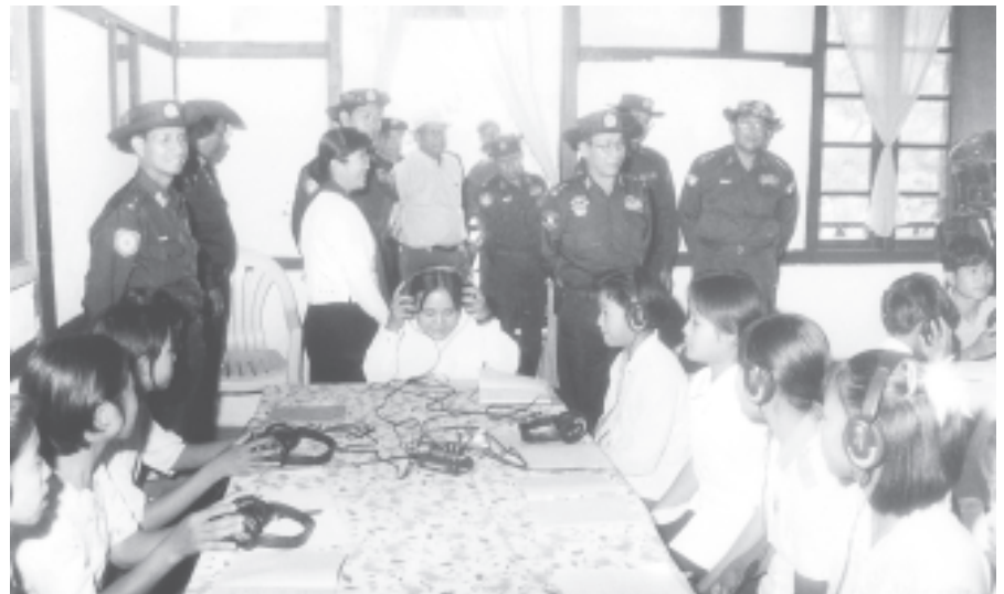
State Peace and Development Council Secretary-1 Lt-Gen Soe Win inspects multimedia classroom at Pruhsa Basic Education High School.