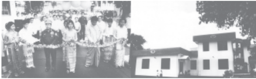
Minister for Information Brig-Gen Kyaw Hsan formally unveils the signboard of the e-library in Kyauktan.