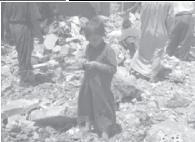
Residents of Fallujah, Iraq neighbourhood comb through the wreckage of their homes which were destroyed in a US airstrike on 19 June, 2004.