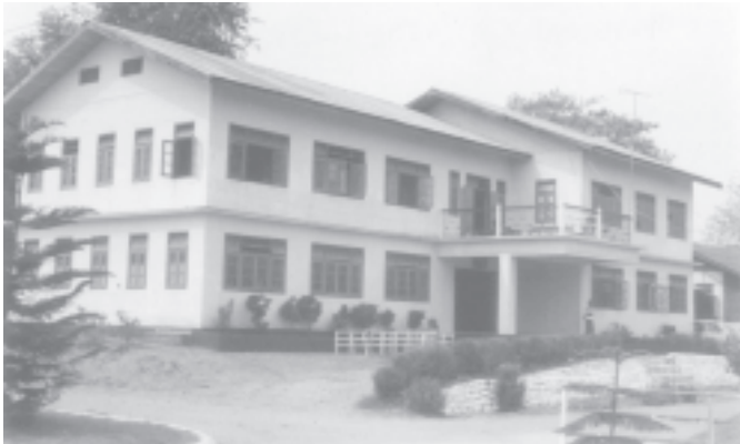
To provide better health care for local people, annex to People's Hospital was built in Kalay, Sagaing Division.