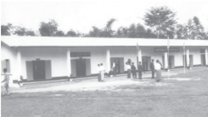
New school building in Shanywalay Village Basic Education Primary School in Kyaikmaraw Township, Mon State.