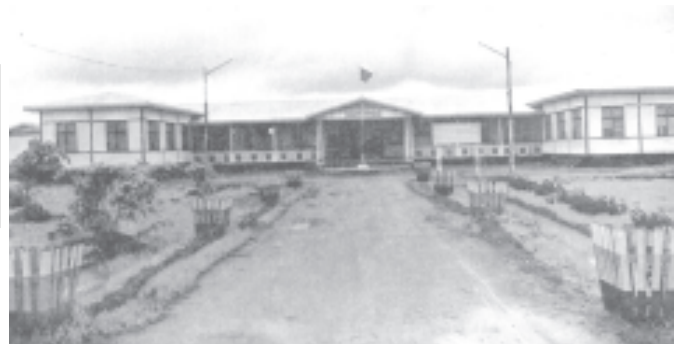
A station hospital built in Ayemyathaya village, Okpo Township, Bago Division. — IPRD