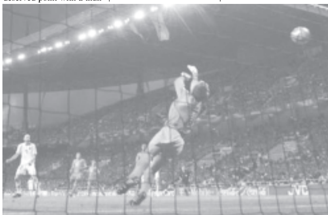
Netherlands' goalkeeper Edwin van der Sar (C) lets in the second goal from the Czech Republic as Jan Koller (L) watches in their Euro 2004 Group D soccer match at the Municipal Stadium in Aveiro, on 19 June, 2004.