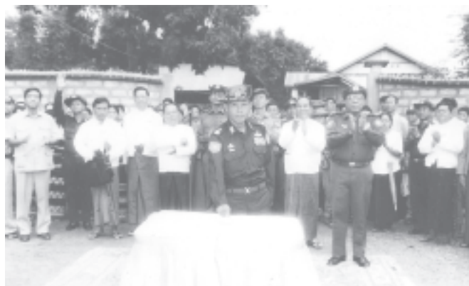
Commander Maj-Gen Myint Hlaing formally unveils the signboard of the NPE Sub-printing House in Lashio. — MNA

Commander Maj-Gen Myint Hlaing delivered an address. He said that newspaper is an effective medium informing the people of economic, education, health and economic devel-