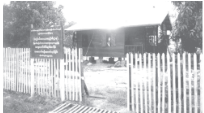
Rural house in Shwepyigon Village, Yedashe Township, Bago Division. — PBANRDA