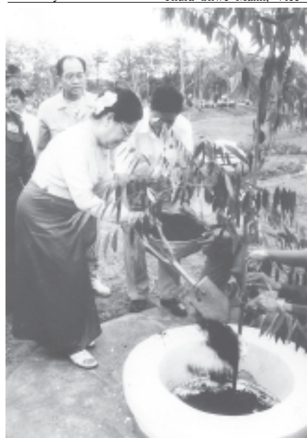
MWAF President Dr Daw Khin Win Shwe plants a gangaw tree in Union National Races Village hailing Myanmar Women's Day.—MNA

A total of 500 various kinds of trees was planted at the ceremony.—MNA