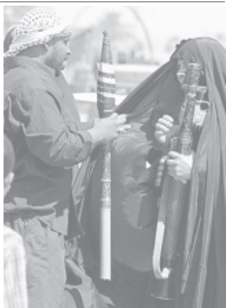
A militiaman shows to an Iraqi Shiite Muslim woman how to use a rocket-propelled grenade as she takes part in a march in support of Shiite cleric Moqtada Sadr's Army of Mehdi militia in Sadr City recently.