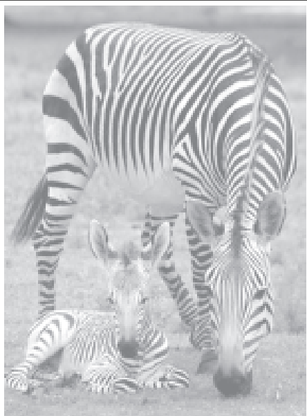
A two-day-old baby Hartmann's zebra rests under the protective care of its mother on the Serengeti Plain, on 18 June, 2004, at Busch Gardens Tampa Bay in Tampa, Fla. The baby, whose sex is still unknown was born on 16 June, and is the 18th in the endangered mountain zebra herd.

Vietnam, which shipped abroad 3.86 million tons of rice valued at 727 million US dollars last year, posting year-on-year rises of 19.2 per cent and 0.2 per cent respectively, exported roughly two million tons of the commodity worth 438 million US dollars in the first five months of this year, down 0.1 per cent in volume but up 17.2 per cent in value, according to the General Statistics Office.—MNA/Xinhua