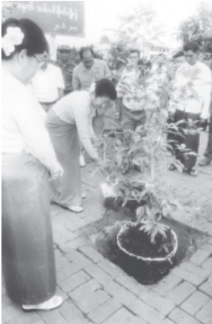
MWAF Honorary Patron Daw Mya Mya San, wife of Vice-Senior General Maung Aye, plants a star-flower tree.