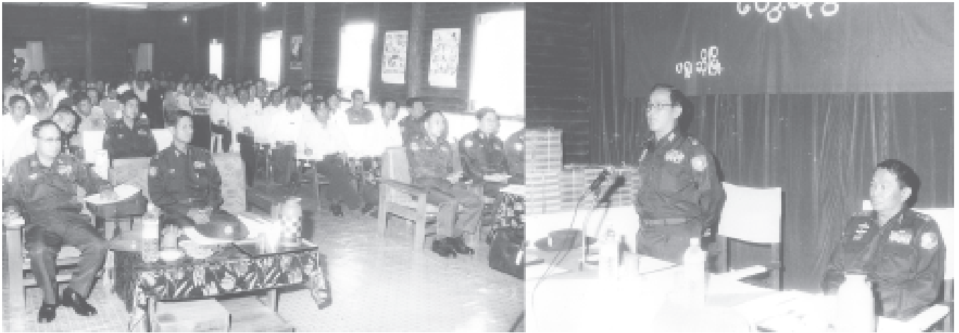
Secretary-1 Lt-Gen Soe Win meets departmental officials and local people in Pruhsa Township.