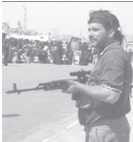
A militiaman stands guard as Iraqi Shiites demonstrate in support of Moqtada Sadr's Army of Mehdi militia on 19 June, 2004. A bomb killed one Portuguese worker and two Iraqis while clashes with US troops in Baghdad left around 20 people dead or wounded as Iraq lurched towards independence less than a fortnight away.