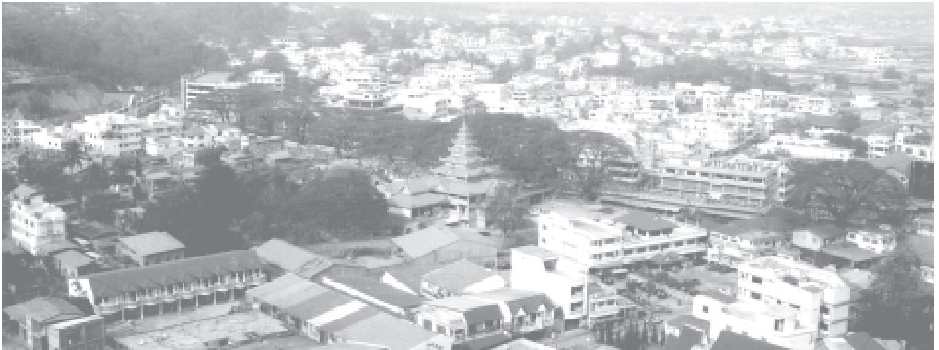
Developing Tachilek in eastern Shan State.