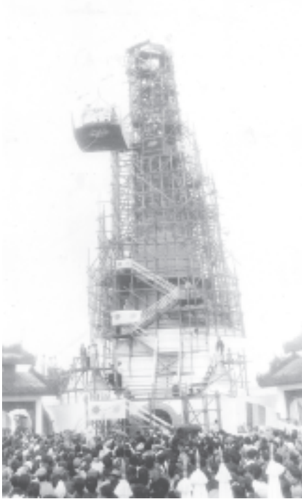
Nayset Layset Pagoda in Loikaw. — MNA

Nayset Laset Pagoda, 111 feet high, was built with the donations of the government, the Tatmadawmen and families, Myanmar Police Force members and families, departmental personnel and wellwisher including local national races. — MNA