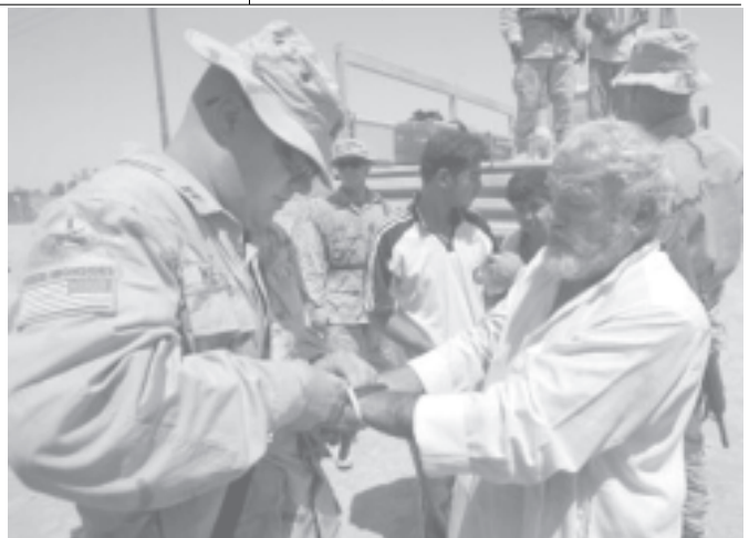
US Army soldiers release a group of five Iraqi detainees at Camp Victory, near Abu Ghraib, Iraq, on 19 June, 2004. The detainees were among 17 arrested two days earlier in a raid in nearby Agar Kuf.