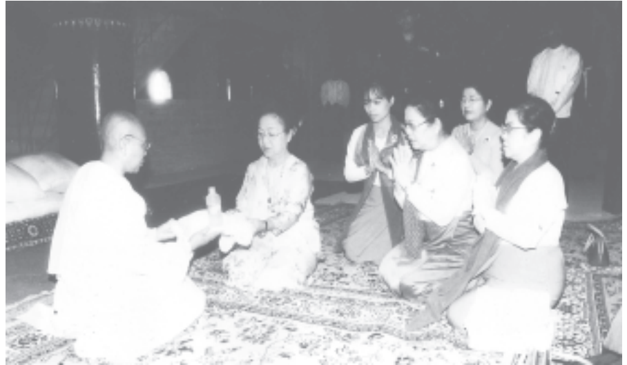
MWAF Honorary Patron Daw Kyaing Kyaing, wife of Senior General Than Shwe, offers rice and edible oil to Nun Daw Dhammesi.

YANGON, 20 June — The Myanmar delegation led by Minister for Labour U Tin Winn arrived back here by air yesterday evening after attending the 92nd Annual Conference of International Labour Organization held in Geneva, Switzerland. The minister and party were welcomed back at Yangon International Airport by Minister for Mines Brig-Gen Ohn Myint, Minister for Home Affairs Col Tin Hlaing, Deputy Minister for Labour Brig-Gen Win Sein, departmental officials of the Ministry of Labour and families. Members of the delegations, Director-General U Soe Nyunt of Labour Department, Director-General U Win Mra of the Ministry of Foreign Affairs, Director-General U Yu Lwin Aung of the Office of Central Inland Freight Handling Committee, UMFCCL Vice-President of U Win Aung and Assistant Director U Win Myint of Labour Department also arrived back.MNA