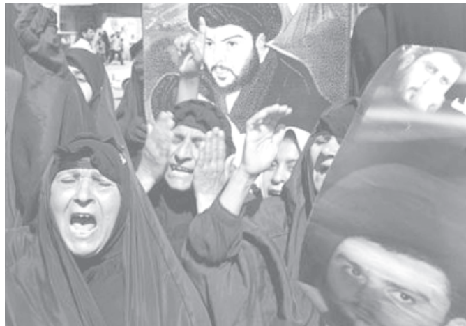
Iraqi women march through the street in the Sadr City district of Baghdad, Iraq, to protest against US military forces entry into the neighbourhood and to show support for the Shiite cleric Muqtada al-Sadr on 19 June, 2004.

The same official had said Friday that oil exports could resume Saturday at a rate of 700,000 barrels per day (bpd) if welding finished and test runs on the 42-inch line succeeded. Coalition Provisional Authority spokesman Dominic d'Angelo said the exports could resume on Sunday at a rate of 500,000 to 600,000 bpd if the repairs were completed. "Pressure has to build up in the pipeline first," he said. —Internet