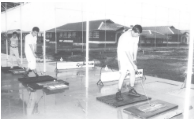
Delegates to National Convention playing golf.

With hands linked firm around the National Convention.