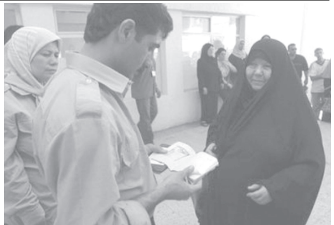
Iraqi officials, working at the border crossing between Iraq and Iran at al-Munthriya, Iraq, check travel documents for travellers arriving and leaving Iraq, on 19 June, 2004.

public for weeks. But the result came as little surprise as the WTO has never in its nine-year life overturned preliminary findings. So confident was Brazil of victory that Foreign Minister Celso Amorim said earlier this week that the decision would "have an enormous political impact". —MNA/Reuters