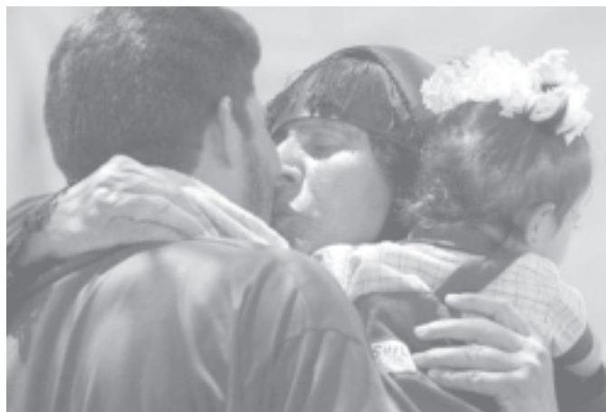
An Iraqi detainee, left, embraces family members during an hour of visitation inside the Abu Ghraib prison on the outskirts of Baghdad, Iraq, on 19 June, 2004. Most of the 2,600 prisoners at the prison are now allowed one visit per week.