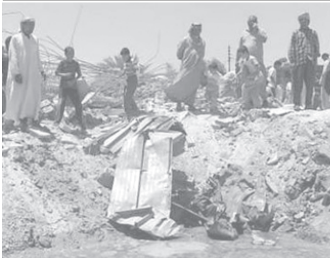
Iraqis gather around a hole in the ground caused by a rocket which landed overnight in Iraq's western city of Fallujah, on 19 June, 2004.