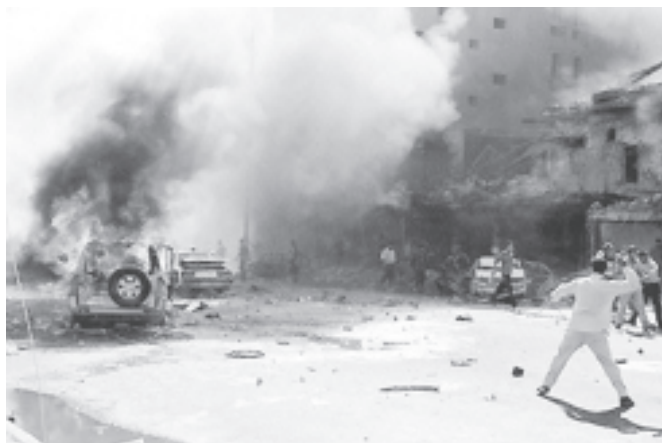
A lone Iraqi throws a stone at a burning vehicle as others search the debris of a building at the scene of a car bomb in a main shopping area of Baghdad on 14 June, 2004.