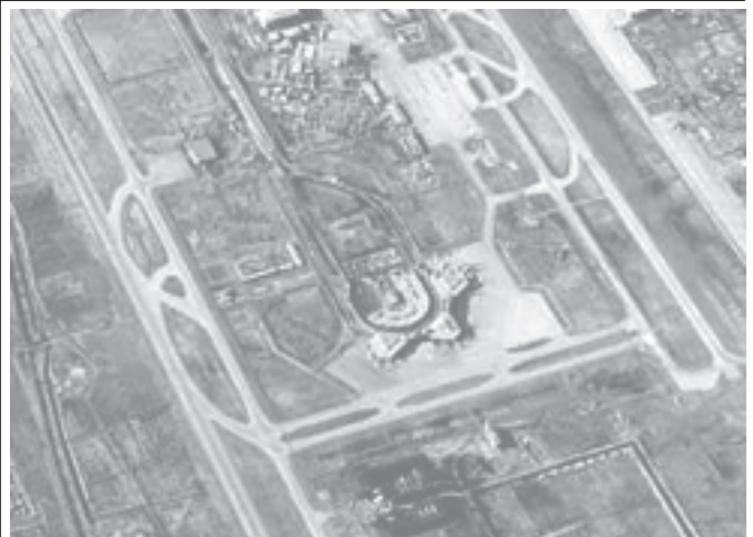
US-led forces will begin handing control of Baghdad's international airport over to Iraqi authorities after the formal end of occupation at the end of June, aviation officials said on 16 June, 2004. Baghdad airport has been the main US military base in Iraq since last year's invasion that toppled Saddam Hussein. The airport is seen on 10 July, 2003.

Oil Minister Thamir Ghadban earlier told Reuters that there had been two sabotage attacks in the south and it was not immediately clear whether they were against the same or different pipelines. — MNA/Reuters