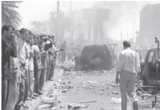
Onlookers gather at the scene of a car bomb in a main shopping area of Baghdad on 14 June, 2004.