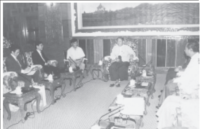
Minister for Industry-1 U Aung Thaung receives China Metallurgical Construction (Group) Corporation (MCC) President Mr Xianghun Xu and party.

Later, Lt-Gen Khin Maung Than and party left there by car and arrived back in Yangon in the afternoon. — MNA