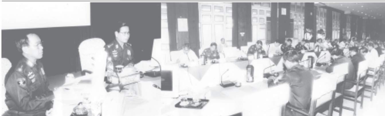
Chairman of Myanmar Education Committee Prime Minister General Khin Nyunt addresses Meeting 2/2004 of Myanmar Education Committee.— MNA