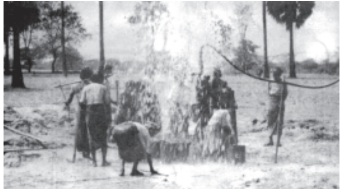
An artesian well at Kyundaw village in Taungdwingyi Township. — PBNRDA