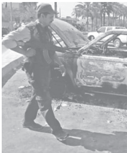
An Iraqi police officer passes a destroyed police vehicle after an overnight attack on a police station in the town of Salman Pak, south east of Baghdad, on 16 June, 2004. — INTERNET

The Ministry of Home Affairs will also make similar cuts for those serving national service in the island state's police force and the civil defence force. — MNA/Xinhua