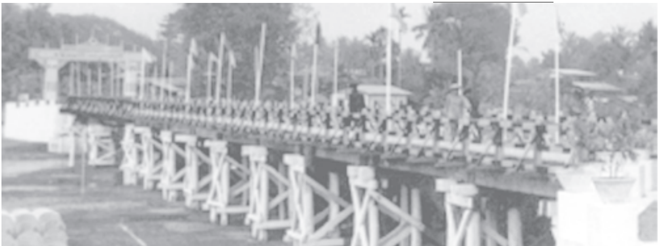
Nantmaung Creek Bridge in Momeik, Shan State (North).