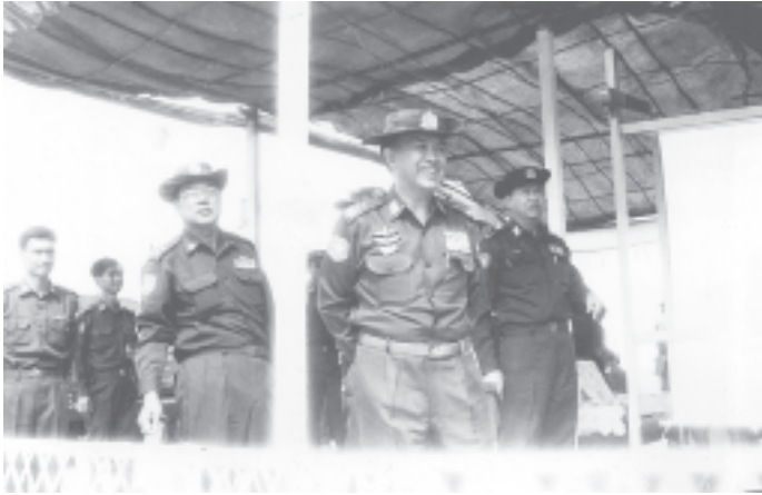
Lt-Gen Khin Maung Than inspects digging of feeder canals connecting Louthout Creek in Hmawza Village-tract, Pyay Township. (News on page 16) — MNA