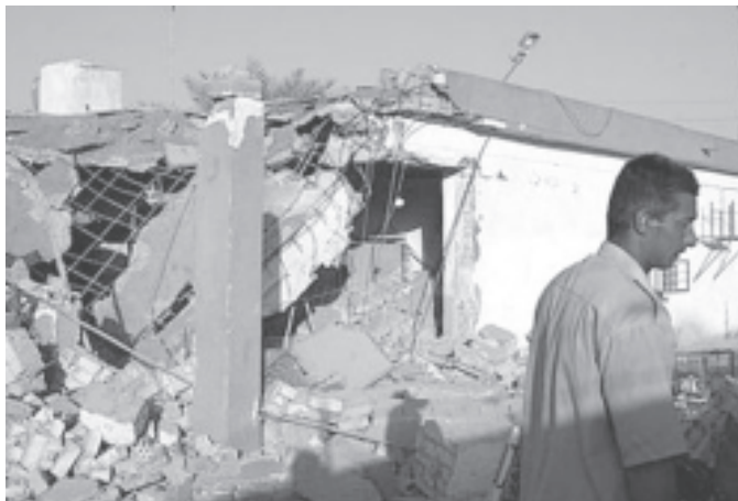
An Iraqi man walks through a police station that was destroyed in an explosion in Yusufiyah, Iraq, on 11 June, 2004.