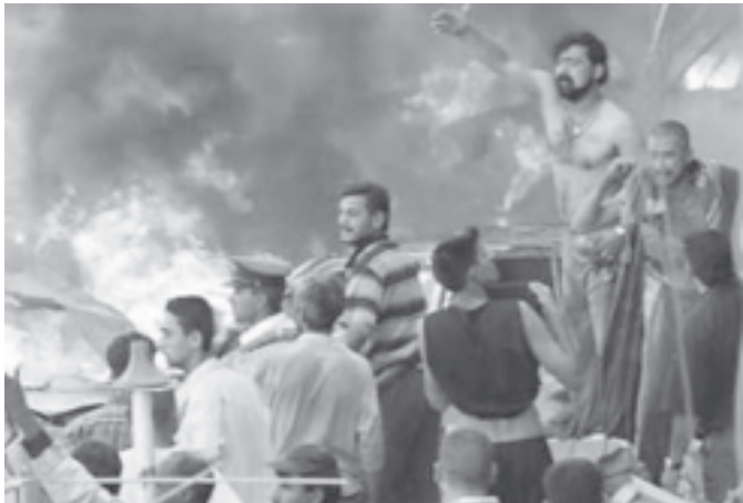
Iraqis rush to the scene of a car bomb attack in the centre of the Iraqi capital of Baghdad on 14 June, 2004.