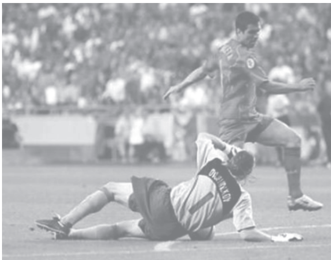
Russia's goalkeeper Sergey Ovchinnikov (L) challenges Portugal's Pauleta (R) for the ball on the edge of the penalty area leading to a red card for the Russian goalkeeper during their Group A Euro 2004 soccer match at the Luz Stadium in Lisbon, on 16 June, 2004. Portugal defeated Russia 2-0.