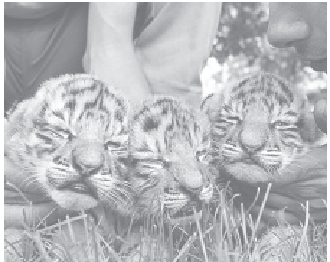
Three tiger cubs are displayed by zookeepers after their birth at the zoo of Pessac, south-eastern France.