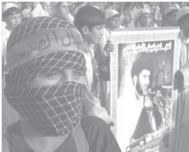
Children in the Sadr City district of Baghdad, Iraq, march holding a portrait of Shiite cleric Muqtada al-Sadr during a demonstration in support of al-Sadr and against the US military in Iraq on 16 June, 2004.

Miller, who was in charge at the Guantanamo Bay, Cuba, told her during a visit to Baghdad that "at Guantanamo Bay, we learned that the prisoners have to earn every single thing that they have," Karpinski said.