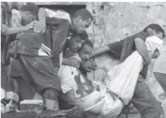
Rescuers carry a wounded man from the rubble of a building demolished by a bomb in the centre of the Iraqi capital of Baghdad on 14 June, 2004.