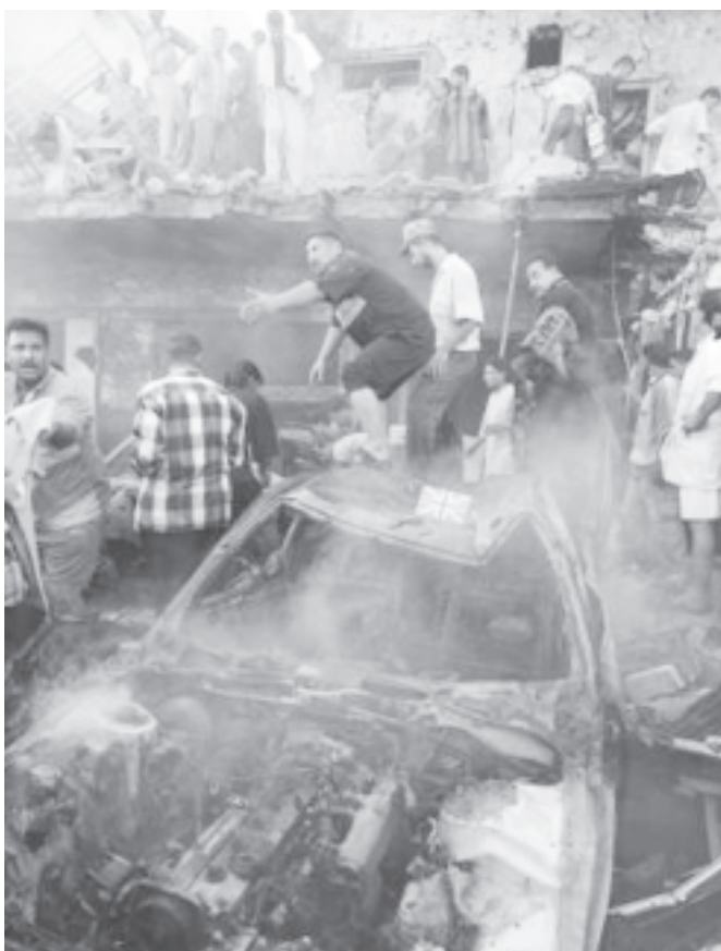
Iraqi rescuers climb on the destruction caused by a car bomb in central Baghdad on 14 June, 2004.