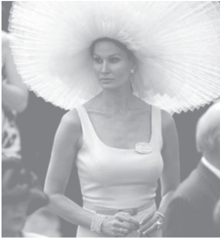
A lady racegoer wears a large brimmed pink hat at Royal Ascot in Berkshire, southern England, on 16 June, 2004. The five-day society and sporting event is a highlight on the British social calendar, with Britain's Queen Elizabeth attending most days.