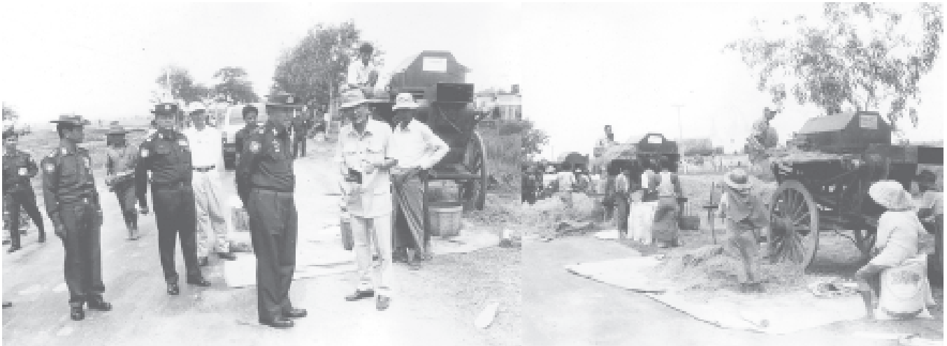
Lt-Gen Khin Maung Than inspects demonstration of paddy winnowing in Paungtamaw Village-tract, Pyay Township.