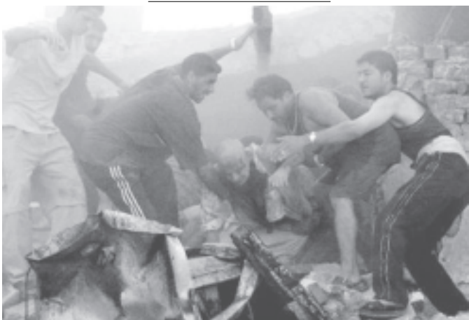
A crowd of Iraqis carry an injured man from a damaged building after a car bomb exploded in central Baghdad, Iraq, on 14 June, 2004.