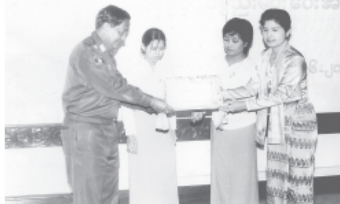
Minister for Social Welfare, Relief and Resettlement Maj-Gen Sein Htwa accepts donations from wellwishers.