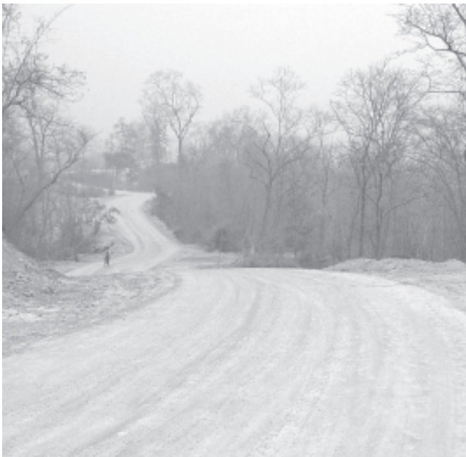
Monywa-Kalewa Road, reflects the goodwill of the Tatmadaw Government. MYANMA ALIN