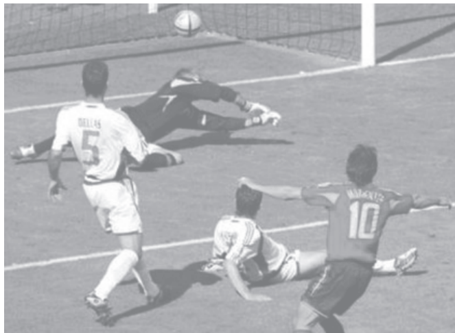
Spain's Fernando Morientes (R) shoots the ball past Greece's goalkeeper Antonios Nikopolidis (top) to score, as Traianos Dellas (L) and Costas Katsouranis (on ground) watch, during their Euro 2004 Group A soccer match at the Bessa Stadium in Porto on 16 June, 2004.

Prime Minister Thaksin Shinawatra criticized the team following last Wednesday's loss which left Thailand third in Asian zone Group Five with three points from as many games. United Arab Emirates top the group with seven points. — MNA/Reuters