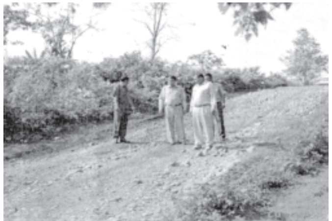
Kachin State Development Affairs Committee built 5,100 feet long Mongna rural road in Waingmaw Township. —PBNRDA