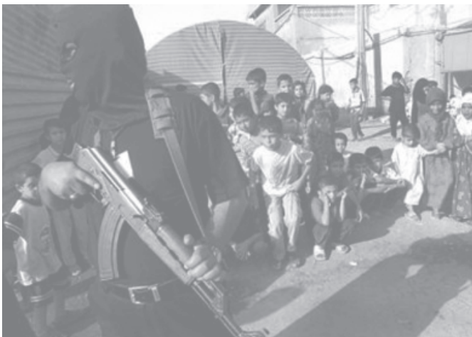
Children in the Sadr City district of Baghdad, sit along the street to watch a militia member loyal to the Shiite cleric Moqtada al-Sadr as he and others hold a demonstration in support of al-Sadr and against the US military in Iraq on 16 June, 2004.

Three US soldiers were killed Wednesday in a rocket attack on a US logistics base near Balad. — Internet