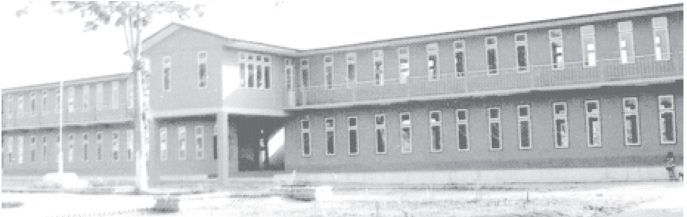
The youth development training school in Kengtung, Shan State (East) has been built for the development of nationalities in border areas.—PBNRDA