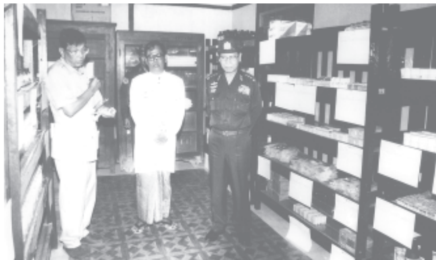
Prime Minister General Khin Nyunt and party see over Pale Township People's Hospital, Sagaing Division on 12 June.

After fulfilling the requirements for regional development, Prime Minister General Khin Nyunt gave an address. He said he came to Budalin as he had never been there although the township was not far from Monywa. He also spoke of the need to cultivate more paddy and produce more rice so as to ensure local food sufficiency. He continued that the projects for local rice sufficiency should not remain only on paper, instead they should be implemented effectively.