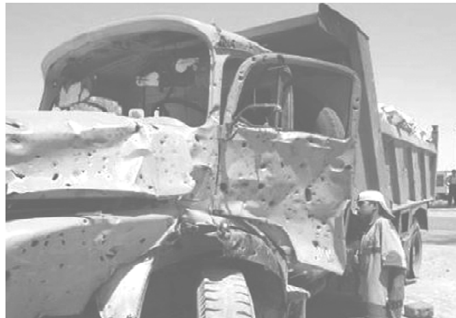
An Iraqi boy looks over the damage to a truck after a suicide car bomb attack in the capital Baghdad on 13 June, 2004. A suicide car bomber blew up his vehicle as police tried to stop him reaching a US and Iraqi base in Baghdad on Sunday, killing at least eight civilians and four police officers, according to the US military.