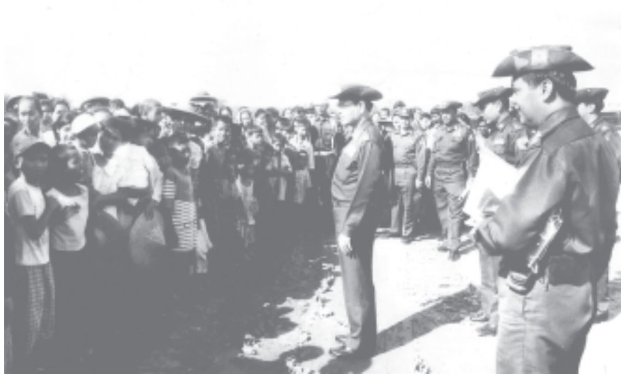
Prime Minister General Khin Nyunt inspects progress of work for dam project near Shwesaye village, Budalin, Sagaing Division on 12 June.

On the occasion, the Prime Minister heard reports on cultivation of monsoon and summer paddy, beans and pulses, edible crops, kitchen crops, cotton and other crops; arrangements for extension of paddy-sown acreage and increased output, local food sufficiency, measures for education and health sectors, and water supply tasks.