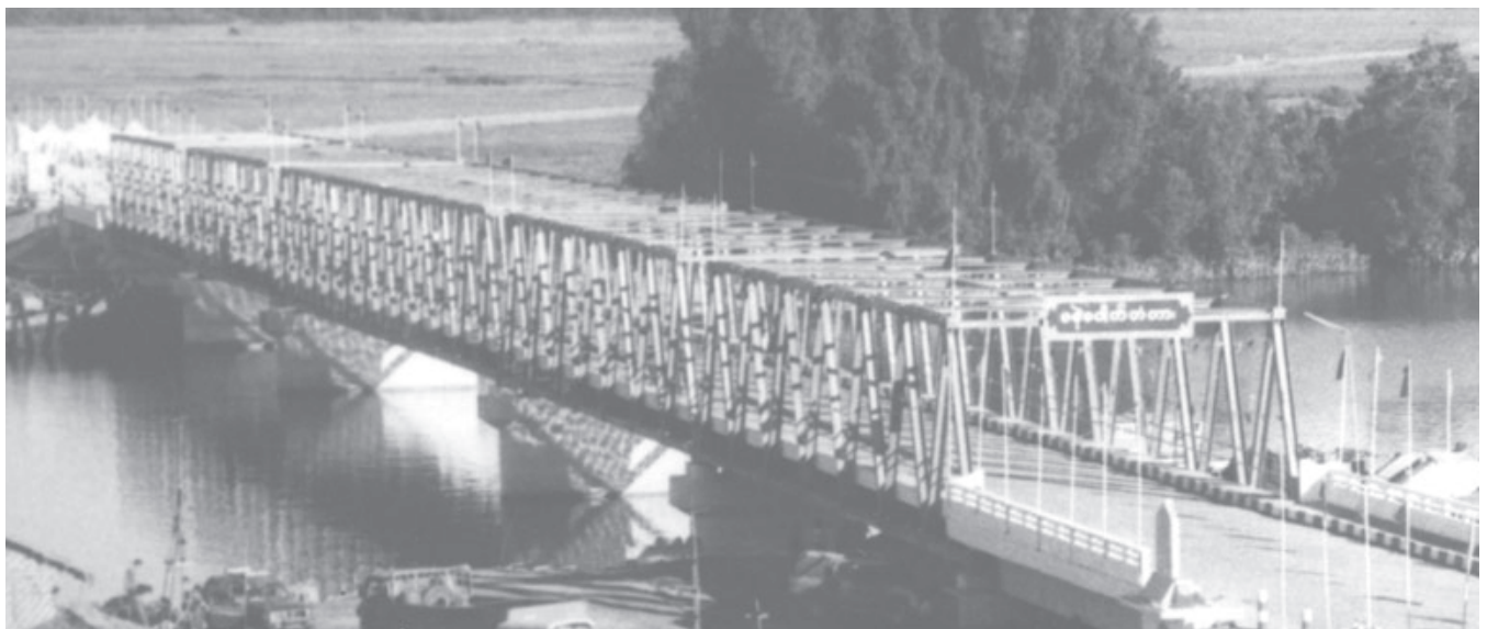
Sanepauk Bridge on Yangon-Kyaunkpyu Road in An Township, Rakhine State.