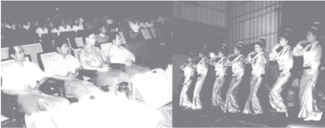
Secretary of National Convention Convening Commission Minister for Information Brig-Gen Kyaw Hsan and members and delegates enjoy dances entertained by artistes of Fine Arts Department.