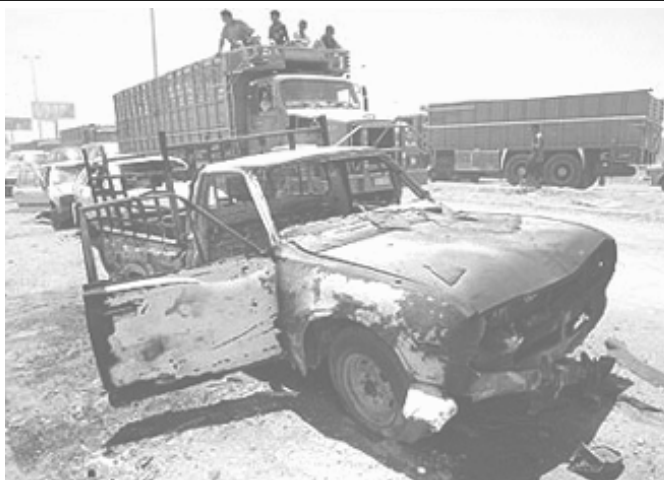
Burnt out vehicles are seen strewn along the main road on 13 June following a car bomb in southern Baghdad.