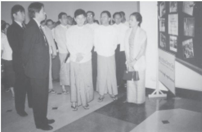
Minister for Health Dr Kyaw Myint views booths displayed at the ceremony to mark World Blood Donor Day. — MNA

Next, those present participated in discussions, followed by a general round of discussions. The meeting ended with the concluding remarks by NCCC Chairman Secretary-2 Lt-Gen Thein Sein — MNA