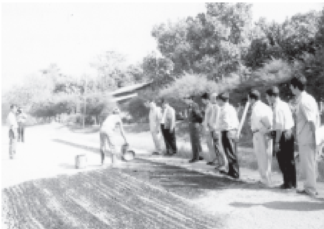
Tarring a rural road linking Kyakansu village in Hmawby Township and Ngazutaung village in Hlegu Township in Yangon Division.—PBANDRA