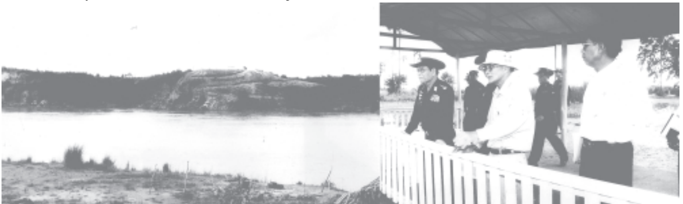
Prime Minister General Khin Nyunt and party inspect chosen site for building of dam near Shwesaye Village, Buddalin, Sagaing Division on 12 June.