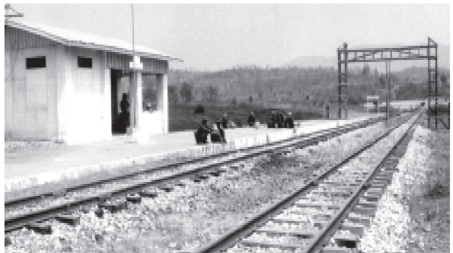
Pynthaya-Htiri railroad Section ready to serve the interest of travellers.