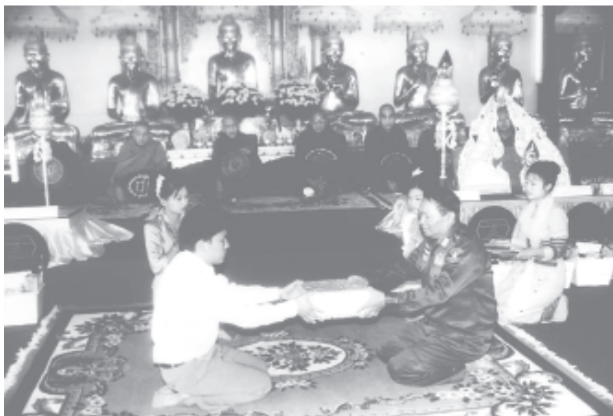
Lt-Gen Aung Htwe accepting cash donations from wellwishers.