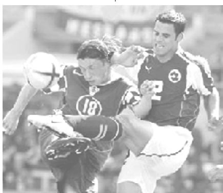
Croatia's Ivica Olic (18) and Switzerland's Bernd Haas battle for the ball during their Group B Euro 2004 first round match on Sunday.