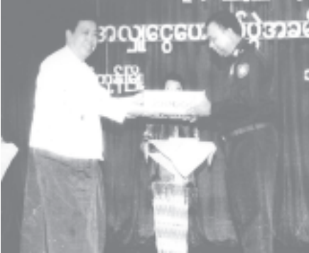
Minister for Culture Maj-Gen Kyi Aung accepts donations of wellwishers for renovation of Lemyethna pagoda, Tagaung.

YANGON, 14 June — Cash donation ceremony was held for the renovation of Lemyethna pagoda of