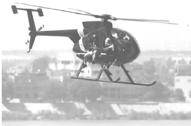
An unidentified helicopter patrols over the Tigris River in Baghdad, Iraq, on 13 June, 2004. Explosions were heard earlier in the Green Zone headquarters area of the American-run occupation authority, seen in the background.