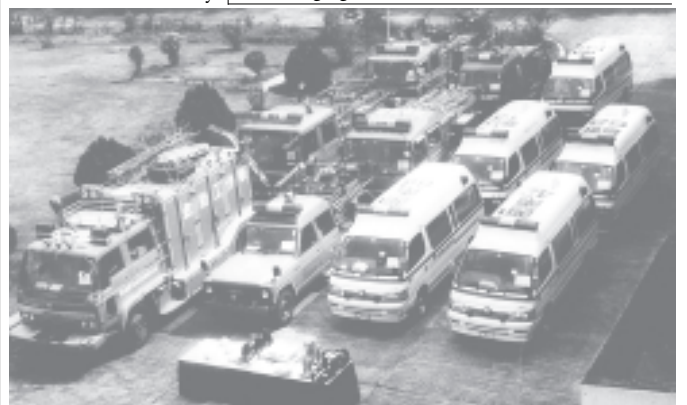
This photo shows altogether 11 vehicles donated by Ibaraki Prefecture of Japan. — MNA