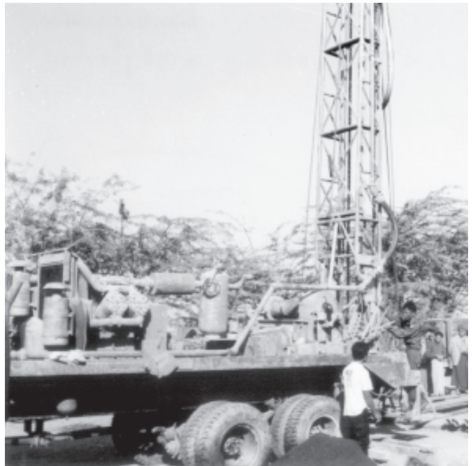
Heavy machinery at work to drill tube-wells at Natyegan village, Magway Township, Magway Division.