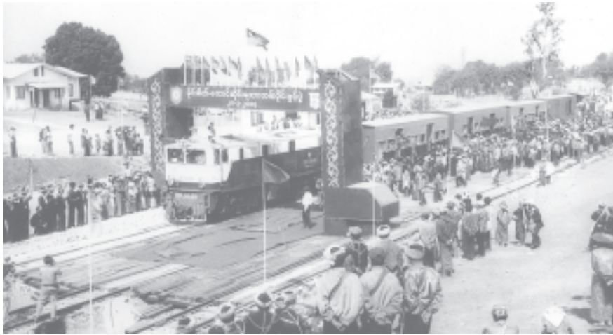
The inauguration of Mongseik-Kaunghsai section of Shwenyaung-Namhsan Railroad in Shan State (South).