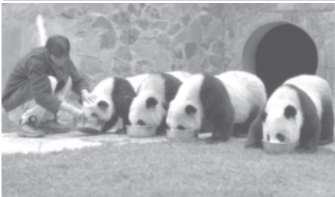
A Chinese worker feeds giant pandas at Wolong Giant Panda Research Centre, in China's southeastern province of Sichuan, on 10 June, 2004.

The men were competing for a 500-Australian-dollar (345-US-dollar) holiday weekend on Queensland's Gold Coast. They now face fines of up to 75,000 Australian dollars or two years in prison.— MNA/Reuters