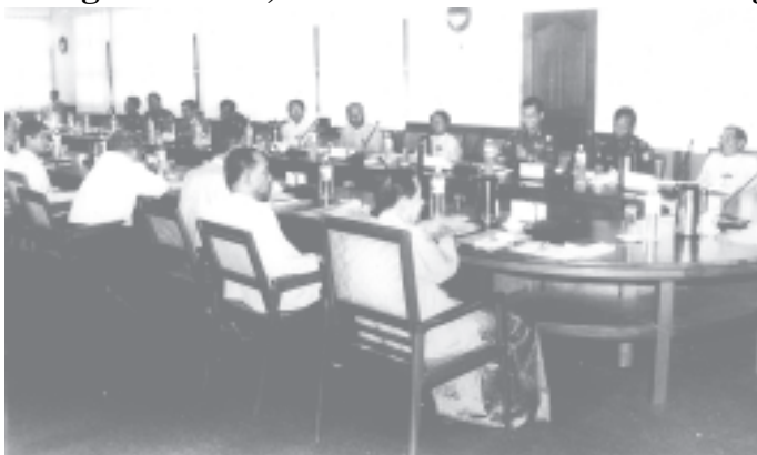
Secretary-2 Lt-Gen Thein Sein addresses Coordination Meeting (No 10/2004) of NCCC, Work Committee and Management Committee.