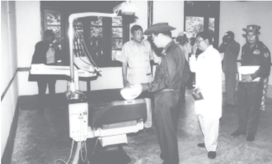
Chairman of National Health Committee Prime Minister General Khin Nyunt and party inspect Kalewa People's Hospital, Sagaing Division on 12 June.