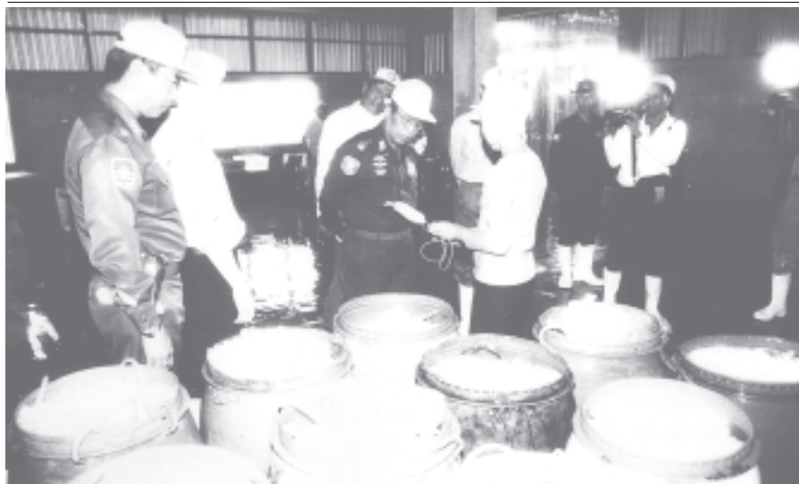
Lt-Gen Maung Bo inspects cold storage of Ahsaungkaung Industries Co Ltd in Myeik.

A total of 10-day-old 300,000 prawns will be bred in each pond. These tasks will be carried out by Tha Htoo Aung Co, USDA, Htoo Htoo Toe Co, (See page 11)