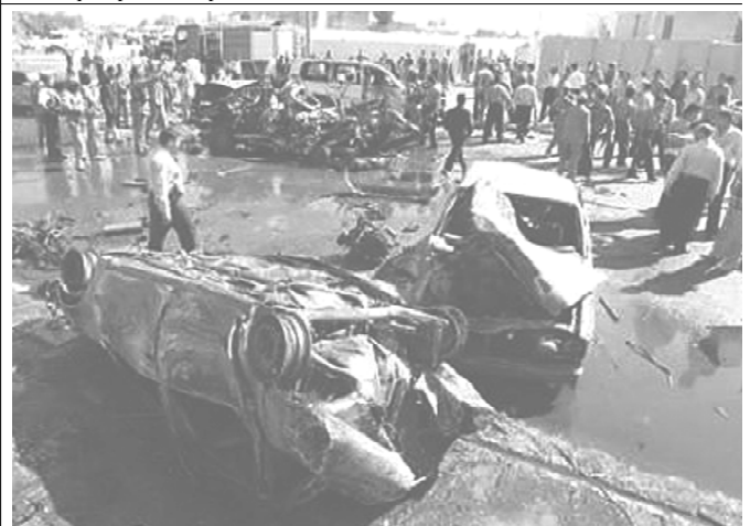
Iraqi police investigate the scene of a car bombing in the northern city of Mosul on 8 June, 2004. A suspected suicide car bomb killed nine civilians and wounded at least 25 near the mayor's office in the northern Iraq city of Mosul, the US military, Iraqi police and witnesses said. — INTERNET