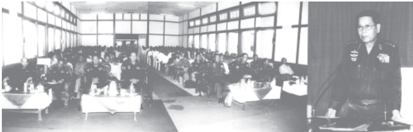
Prime Minister General Khin Nyunt meets with local authorities, members of social organizations and local people in Pale Yadana Hall, Pale, Sagaing Division on 12 June.