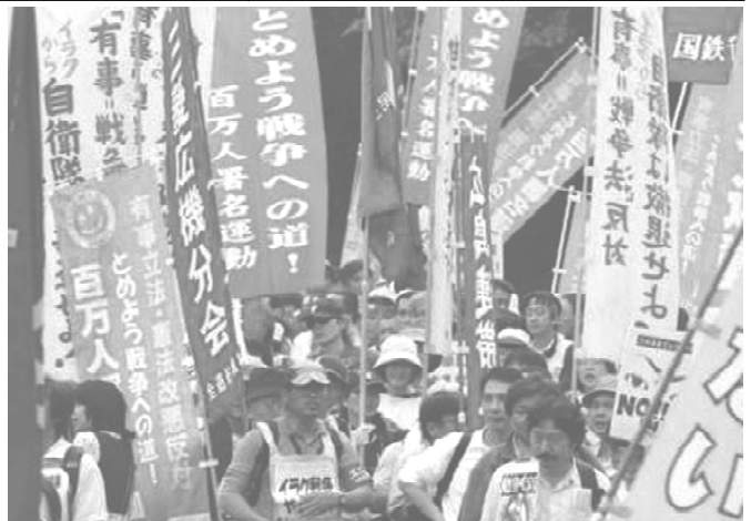
Demonstrators demand that the Japanese government withdraw its troops from Iraq during a protest in Tokyo on 13 June, 2004. About 1,600 demonstrators participated in the rally and demonstration calling for the pull-out of Japanese troops from Iraq, organizers said.

He pointed out that international community is too eager to see positive results from the six-party talks, which is, however, in his view, may takes years after years to bear fruits. What is the most important thing to promote the six-party talks mechanism is patience, he stressed.