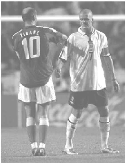
France's captain Zinedine Zidane, left, pats the shoulder of England's captain David Beckham at the end of the Euro 2004 Group B soccer match between England and France at Luz Stadium, in Lisbon, Portugal, on Sunday 13, June 2004. While Beckham missed a penalty, Zidane scored from the penalty spot in the last minute to clinch a 2-1 win for France. Switzerland and Croatia are the other teams in Group B.