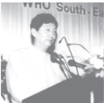
Minister for Health Dr Kyaw Myint addresses 29th Session of WHO South-East Asia Advisory Committee on Health Research. —MNA

The meeting continues till 16 June. —MNA