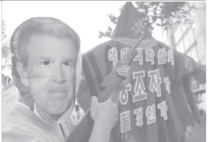
A South Korean protester, wearing a mask made from a picture of US President George W. Bush, imitates US soldiers' alleged maltreatment of an Iraqi prisoner, at an anti-US rally in Seoul on 12 June, 2004.