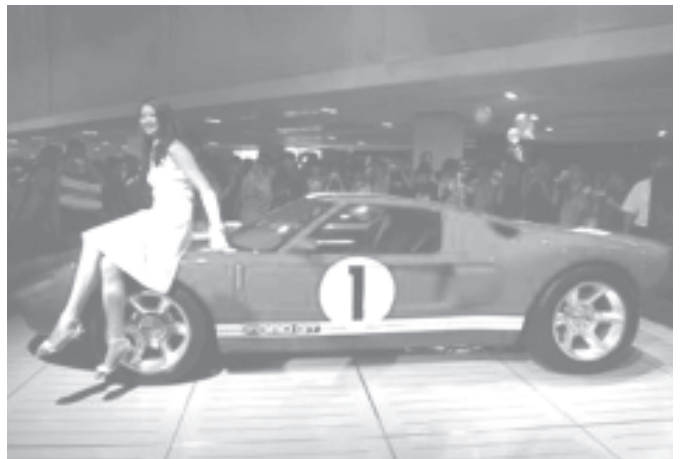
A Chinese model poses with a Ford GT sports car at the Beijing Auto Show in China's capital on 12 June, 2004. China's booming economy has led to rocketing car production and sales, with car makers from all over the world seeking a piece of the action.