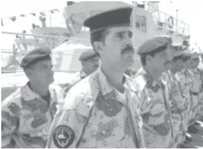
Iraqi sailors stand to attention during a handover ceremony from the British navy of the naval base in Umm Qasr, Iraq, on 12 June, 2004.