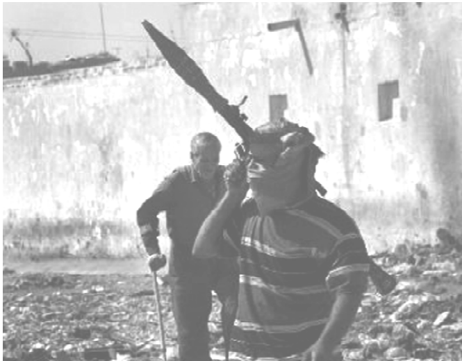
An Iraqi militant, loyal to Shiite cleric Muqtada al-Sadr, walks through Iraq district of Sadr City on 5 June 2004 during clashes with US troops.

She said the soldiers returned fire when they came under attack at a spot outside Taji, a town just north of the Iraqi capital, wounding one of the attackers. —Internet