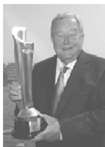
UEFA president Lennart Johansson