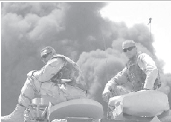
Two US soldiers sit atop their armoured vehicle as black smoke billows behind from a damaged pipeline in Iraq.