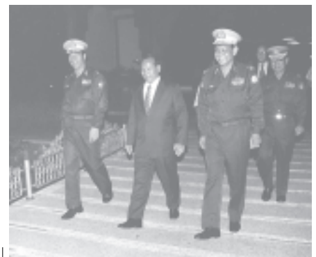
Minister for Commerce Brig-Gen Pyi Sone being seen off at the airport.— COMMERCE

Minister for Commerce Brig-Gen Pyi Sone was accompanied by Director-General U Nyunt Aye of the Directorate of Trade.— MNA