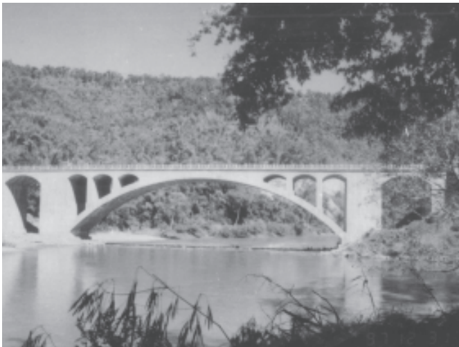
For convenience of local people, Wantapin bridge was built in Shan State (East). PBNRDA