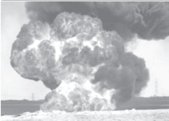
An oil pipeline burns in the desert near Beiji, Iraq about 250 kilometres (155 miles) north of Baghdad on 9 June, 2004.