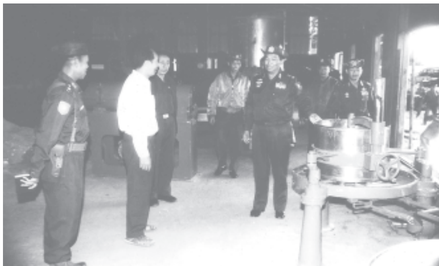
Lt-Gen Aung Htwe inspects tea processing factory in Tamoenye, Kutkai Township.— MNA

On arrival at the construction site of 50-bed hospital in ward 3 of Laukkai, Lt-Gen Aung Htwe and party heard reports on location of the hospital and its area and design, formation of rooms, purpose of the construction of the