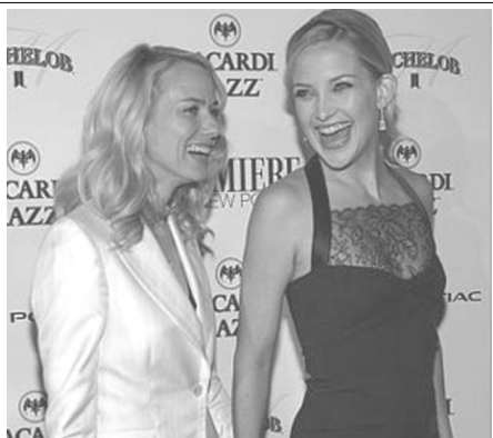
Naomi Watts, left, and Kate Hudson greet one another at the Premiere magazine ceremony honouring this year's New Power Award winners, on 3 June, 2004. The magazine's event honours Hollywood's new power players.

The programme also aims to improve performance of the Iraqi banking sector, he added.