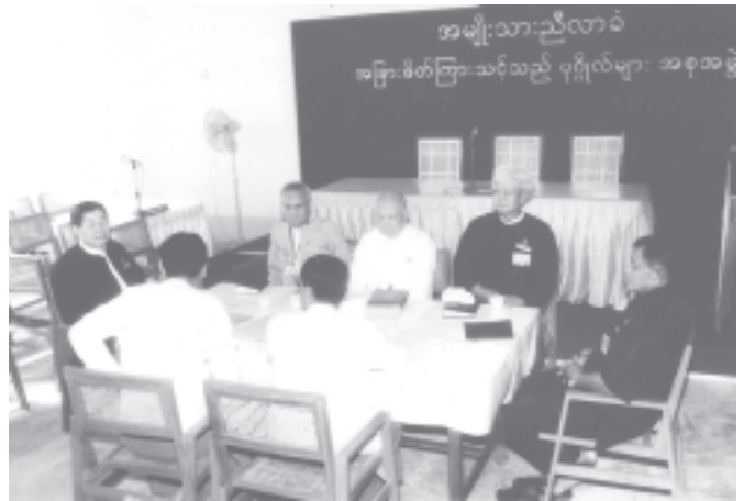
Group discussions of other invited persons.