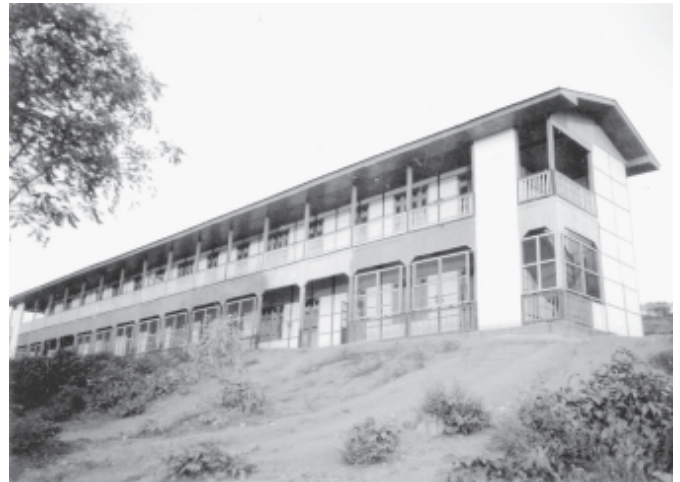
Basic Education High School, Myinggying region, Kayah State.