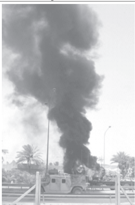
A US armoured vehicle secures the area as fire and billowing black smoke from a burning truck fills the air in the northwestern Baghdad neighbourhood of al-Khadra on 9 June, 2004.