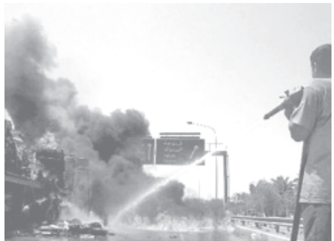
An Iraqi firefighter tries to extinguish a burning truck carrying tires after a roadside attack on the highway outside of Baghdad, Iraq, on 9 June, 2004.

Egypt and Saudi Arabia, alarmed by the implications of the initiative declined an invitation to the summit.