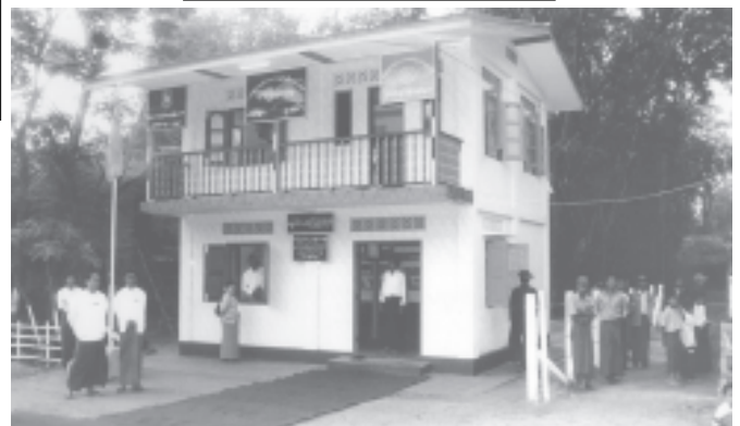
The photo shows a library built in Kwanmoe Dain Model Village, Kayah Township, Yangon Division, to disseminate knowledge to rural people. — MNA