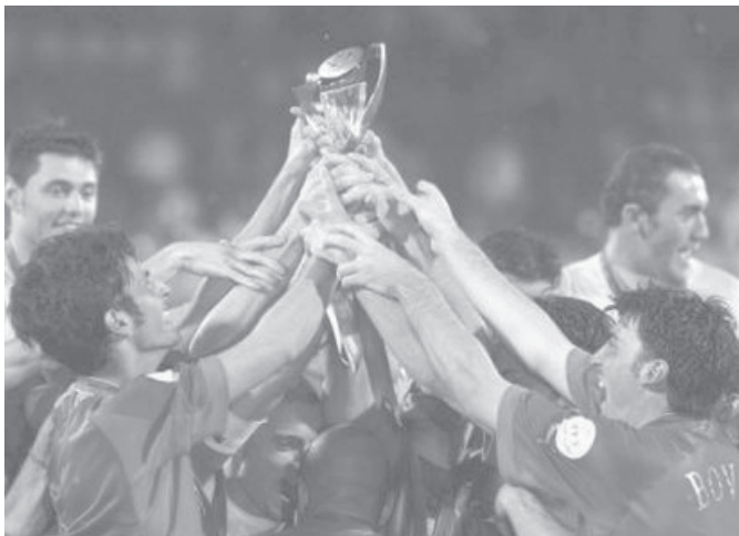
Italian players celebrate with the trophy after winning the Under 21 European Championship against Serbia and Montenegro in Bochum on 8 June, 2004. Italy won the match 3-0.

Sweden looked to be heading for defeat in normal time but with seconds remaining substitute Markus Rosenberg scored to level at 2-2. Carlitos scored the winning goal in the second period of extra time.