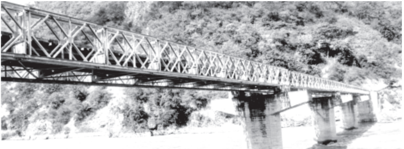
Var bridge built across Manipur river on Kalay-Haka road in Falam Township, Chin State is 340 feet long.