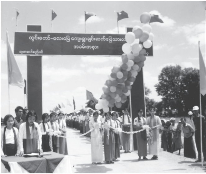
The opening of Village-to-village road linking Twintaw and Laymyay Villages in Buthalin Township, Sagaing Division.