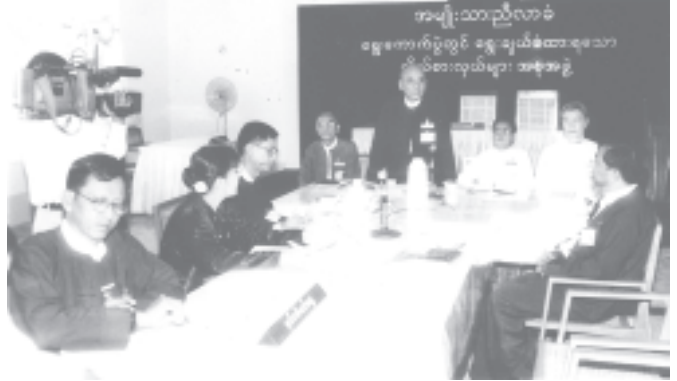
Group discussions of delegates of representatives-elect.