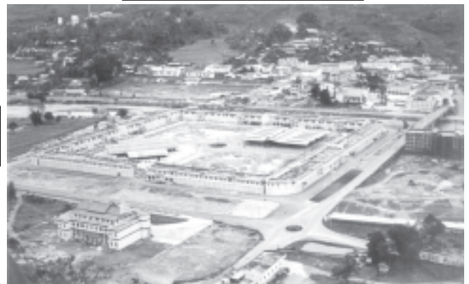
The panoramic view of developing Mongla in Shan State (East).