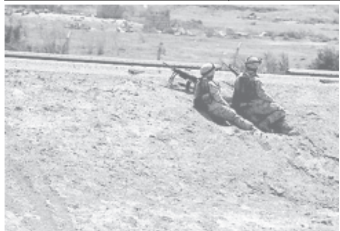
US Marines bunker down in the sand on the edge of the main highway leading to the southern edge of Fallujah, 60 kms west of Baghdad, on 9 June.