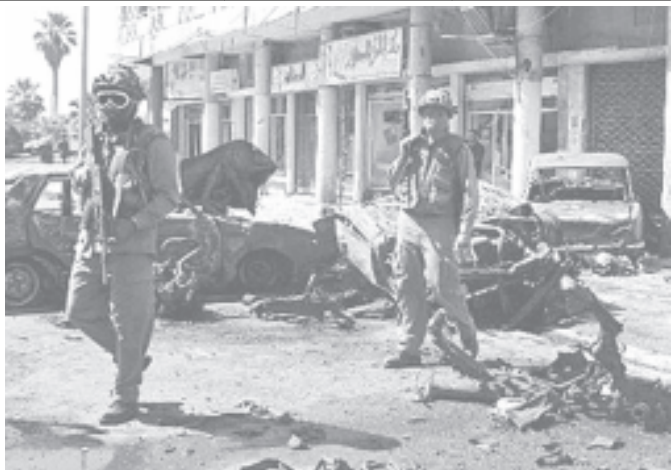
Soldiers guard the site of a car-bomb explosion in Mosul, Iraq, on 8 June, 2004. Two car bombs exploded in separate cities in Iraq on Tuesday, killing at least 14 Iraqis and one US soldier. Dozens were wounded, including 10 American soldiers.