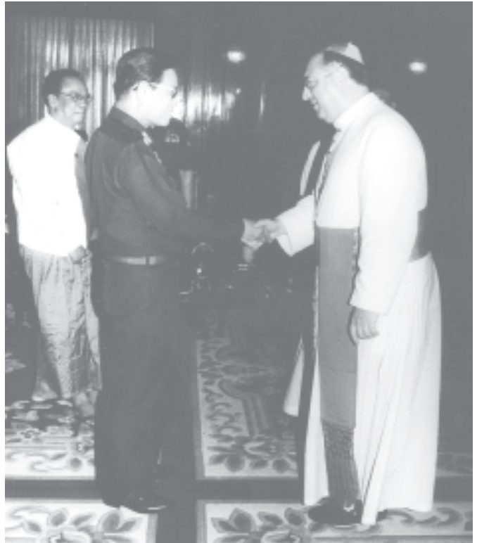
Prime Minister General Khin Nyunt greets Apostolic Delegate from Rome for Myanmar, Brunei Darussalam, Laos and Malaysia and who is also the Apostolic Nuncio for Thailand, Cambodia and Singapore, Office in Bangkok. — MNA