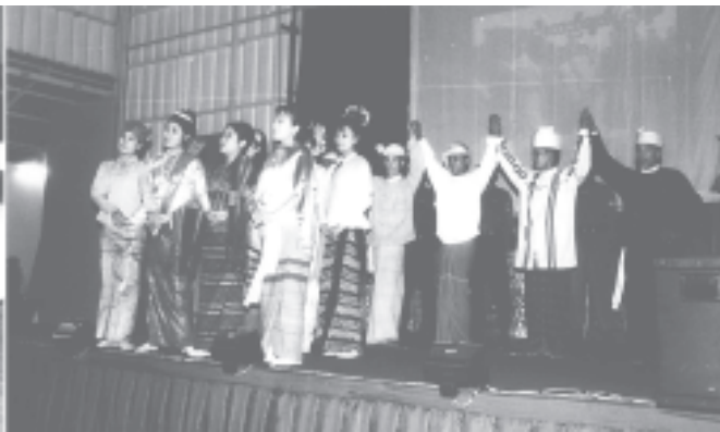
NCCC Chairman State Peace and Development Council Secretary-2 Lt-Gen Thein Sein and National Convention delegates enjoy a dance number.