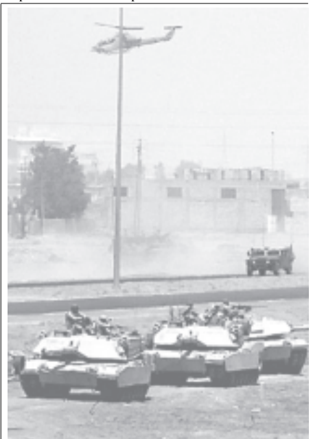
A helicopter hovers overhead as US Abraham tanks gather on the ground along the main highway leading to the southern edge of Fallujah, 60 kms west of Baghdad, on 9 June, 2004.