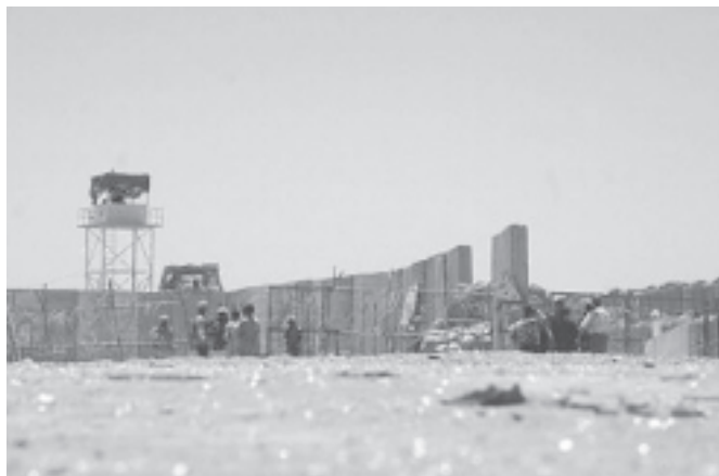
Shattered glass on the ground outside a US military base after a car bombing in Baquba on 8 June, 2004.