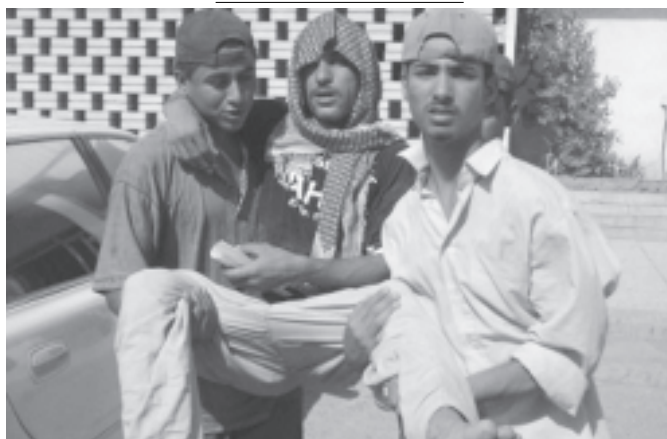
A victim is carried into the local hospital in Baquba following a car bomb attack on 8 June, 2004.