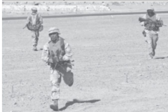
US Marines from the 2nd Battalion of 1st Marine Division run after an RPG (rocket propelled grenade) came close to hitting one of their Humvee vehicles, on the highway connecting Amman and Baghdad, near Fallujah, on 8 June, 2004.

Attacks on Iraq's vital oil pipeline to Turkey have again halted crude flows, leaving Baghdad unable to sell Kirkuk oil for several more weeks, a source at state oil marketer SOMO said on Tuesday.