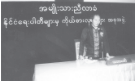
Group discussions of delegates of political parties in progress. — MNA