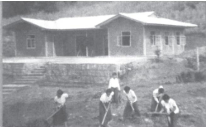
Newly built basic education primary school in Mongma village in Shan State (East). PBANRDA