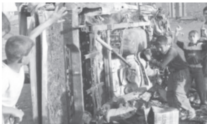
Iraqi children climb on a destroyed vehicle after it was hit by a roadside bomb in the northern city of Mosul on 7 June, 2004.