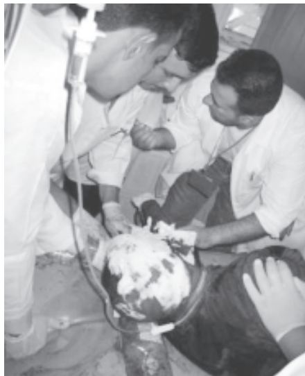
Iraqi doctors attend to an injured Iraqi man at a hospital in Baquba, Iraq, after a car bomb explosion on 8 June, 2004.