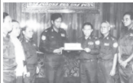
Minister for Finance & Revenue Maj-Gen Hla Tun hands over a computer set and a projector worth over K 2 million to Col Ye Thway. — MNA

The minister explained the purpose of the donation and presented the donations to Col Ye Thway of the hospital, who then presented a certificate of honour and expressed gratitude to him. — MNA