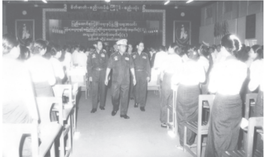
Senior General Than Shwe cordially meets trainees at opening ceremony of Myanmar and International Studies Course No 6 and Special Refresher Course No 7. — MNA

To fulfil the power requirements of the growing national economy and developing social economy and life styles, Paunglaung Hydroelectric Power Project, with 280-megawatt capacity, Yeywa Hydroelectric Power Project,