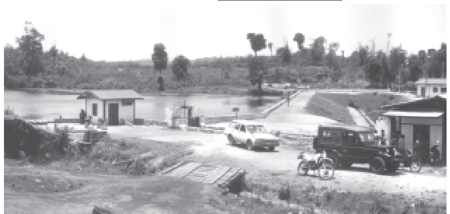
Nankon Lake Hydel Power Project in Kehsi Township, Shan State, generates 15 kilowatts of electricity.