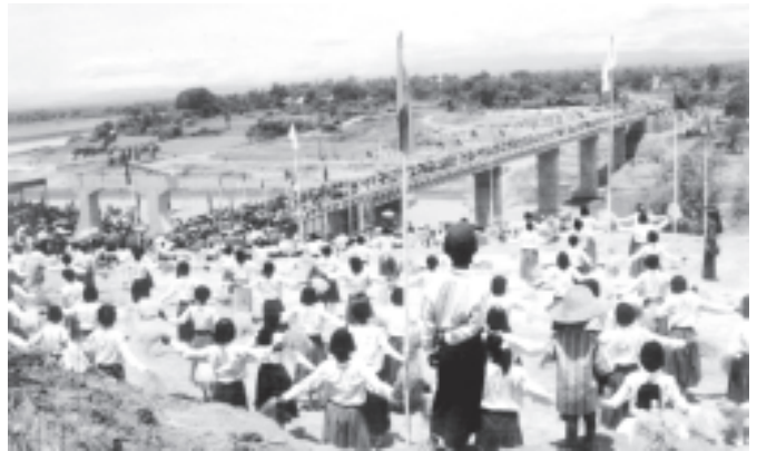
Saidu Bridge built across Myitha River to link Chin State and Yaw region.