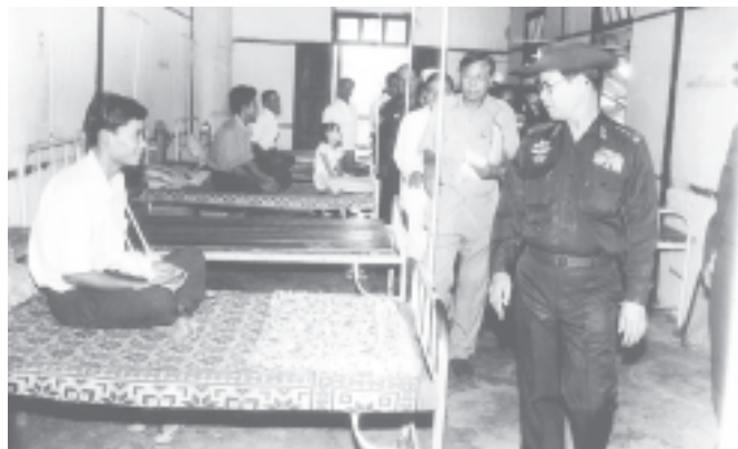
Prime Minister General Khin Nyunt inspects Kanhtaunggyi station hospital in Myebon Township.

to make efforts for uplift of quality of life of rural people and their socio-economic life in implementation of the five rural development tasks with the help of social organizations. The people on their part are to participate in the development tasks and to work hard for boosting production of agricultural products which are beneficial to them and the State. The Prime Minister and party paid respects to members of the Sangha led by Agga Maha Gandhavacaka Bhaddanta Nanda Kicçayanabhivamsa of Taikkyi Kyaung Sayadaw at Pynnya Beikman Yeiktha Kyaung. They then presented offertories to the members of the Sangha. The Prime Minister and party inspected the development of Myebon Township and greeted local people. The Prime Minister and party went to Sittway and they arrived back here in the evening.—MNA