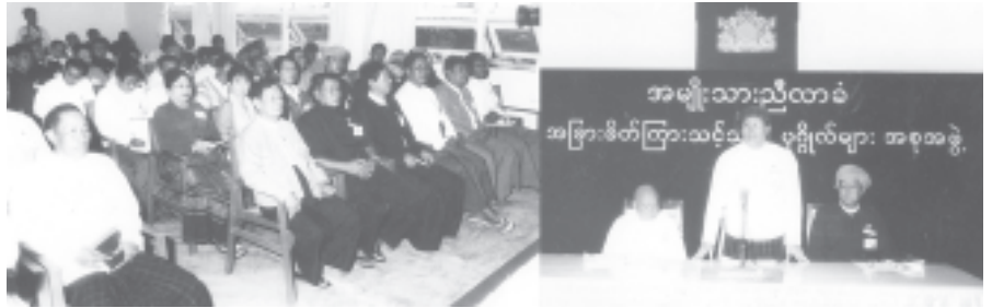
Group discussions of delegates of other invited persons. — MNA