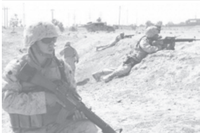
US soldiers take positions to help provide security off the side of a road outside Fallujah on 7 June, 2004.