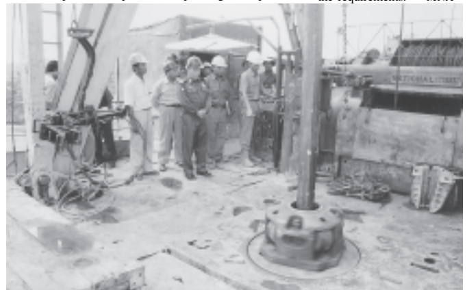
Minister for Energy Brig-Gen Lun Thi inspects drilling of well No 35 in Thagyitaung oil field in Pauk Township. — ENERGY

production tasks. The minister instructed them to manufacture products to meet the target and fulfilled the requirements. — MNA