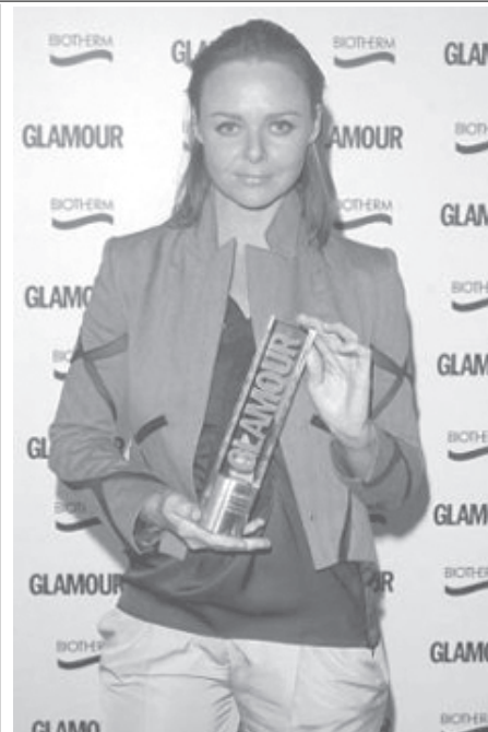
Stella McCartney holds her Fashion Designer of the Year Award during the first-ever Glamour Women of the Year Awards in central London on 8 June, 2004.