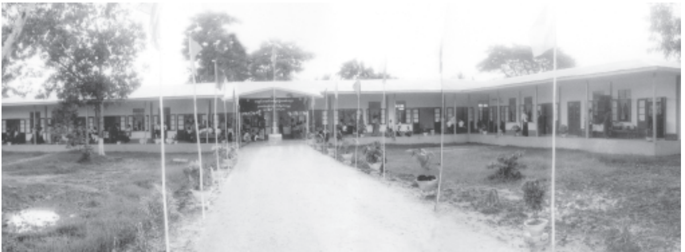
The new building worth K 32 million for post-primary school at Peikswe Village in Twantay Township.