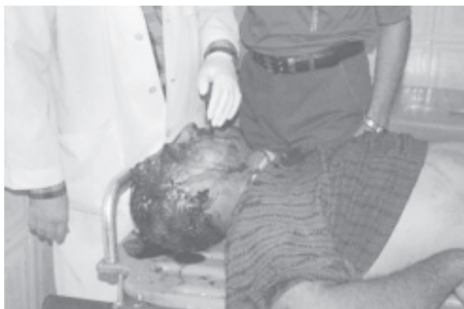
A victim is wheeled into the emergency room of a hospital in Baquba following a car bomb on 8 June, 2004.