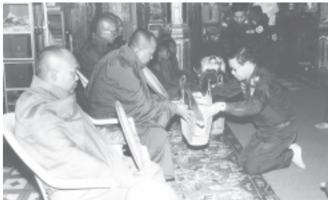
Prime Minister General Khin Nyunt presents offertories to Sayadaws at Pynnya Beikman Yeiktha monastery in Myebon Township.

He said township level officials are to carry out relief measures with goodwill and