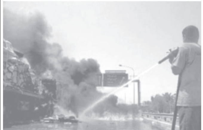
An Iraqi fire fighter tries to extinguish a burning truck carrying tires after a roadside attack on the highway outside of Baghdad, Iraq, on Wednesday, 9 June, 2004.