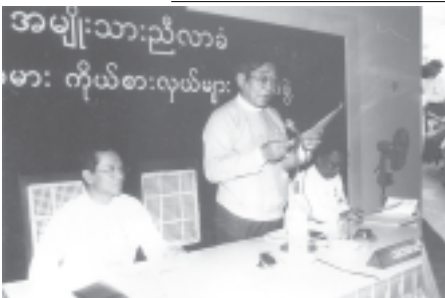
Group discussions of delegates of workers in progress.

that should be included in the framing of the Constitution. The meeting came to an end at 9.35 am with the concluding remarks by the chairman.