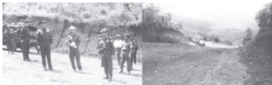
Lt-Gen Aung Htwe inspects the Thetaung bypass between Hsenwi-Kunlong road.