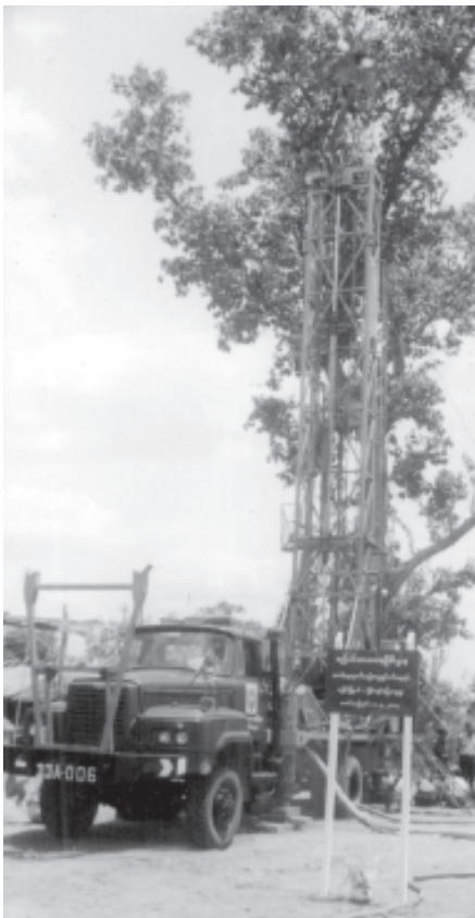
A drilling machine at work to supply potable water to rural people in Myitkyin model village in Mahlaing Township, Mandalay Division.