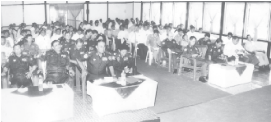
Prime Minister General Khin Nyunt meets local authorities, departmental officials and local people at the hall in Myebon Township.