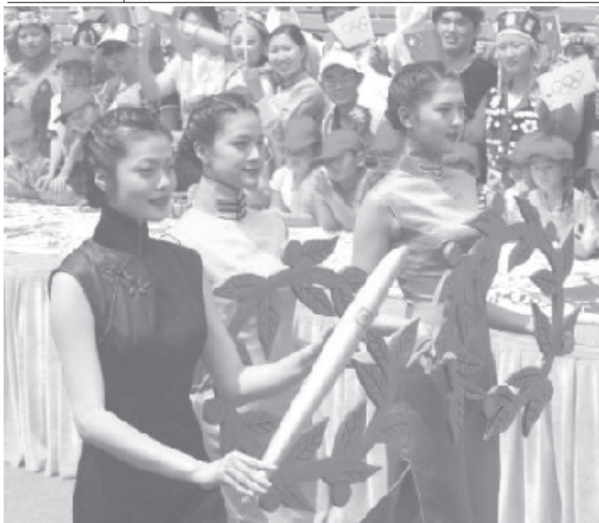
Chinese women deliver the Olympic torch to officials in the car park below the Great Wall of China at Mutianyu, northeast of Beijing on Tuesday 8 June, 2004. The unlit torch was displayed near the Great Wall after arriving in Beijing on earlier Tuesday, the fifth stop in its 78,000-kilometre (46,800-mile) journey across six continents, 27 countries and 33 cities. The torch relay will begin in Beijing on Wednesday.

The 53-year-old, who travelled to Istanbul on Monday, said he would be taking the whole of his former Real Madrid coaching team with him to his new club. "After four very intense seasons working together at Real Madrid we are all really keen to get back to work," he said.—MNA/Reuters