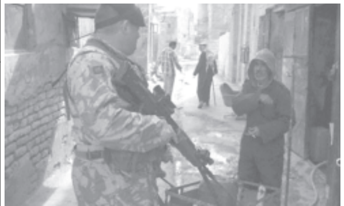
A British soldier talks to an Iraqi man during a patrol through an alley way in the southern city of Basra. British military police are investigating far more complaints against the country's troops in Iraq on 7 June 2004 than first thought, with 75 reported incidents being looked into, the Ministry of Defence said.

that the mandate for the multinational force would be reviewed after 12 months or at the request of the transitional government that will take power early next year — but it gave no deadline for the force's mandate to end. The final draft adds that the mandate will expire after elections to be held by 31 Dec., 2005 under a new constitution. It also declares that the council "will terminate this mandate earlier if requested by the government of Iraq."—Internet