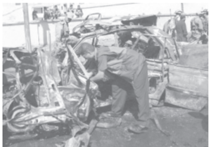
An Iraqi security man looks inside the remains of a burnt out vehicle following a car bomb and a roadside bomb in the northern city of Mosul. Twelve people were killed and dozens wounded in car bomb attacks in Iraq ahead of a UN vote on a resolution to give international legitimacy to the new interim government in Baghdad on 7 June, 2004. — INTERNET

He said that Pakistan appreciates Chinese cooperation and valuable assistance in various projects like Pakistan Aeronautical Complex, Kamra, HMC, Taxila, Gwadar Port and Thar Coal Projects. — MNA/Xinhua