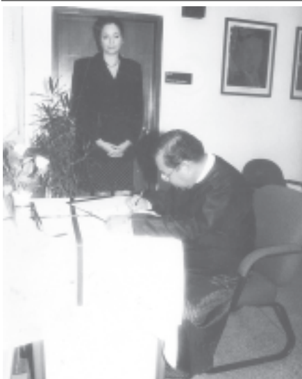
Deputy Minister U Khin Maung Win signs the Book of Condolences at the US Embassy.

(ဋ) လိုအပ်ပါက နီးစပ်ရာဆေးပေးခန်းဆေးရုံများသို့ အချိန်မီသွားရောက် ပြသစစ်ဆေးကုသခွင့်ယူပါ။ ကျန်းမာရေးဝန်ကြီးဌာန