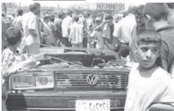
Iraqis crowd around a destroyed car after a US military tank ran over it in northern Baghdad on 8 June, 2004.