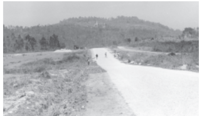
Development Affairs Committee in Muse, Shan State (North), constructed Muse Town circular road for better transportation in the region.