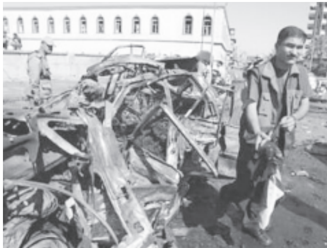
Two car bomb attacks killed 13 Iraqis and a US soldier in Mosul on 8 June, 2004.