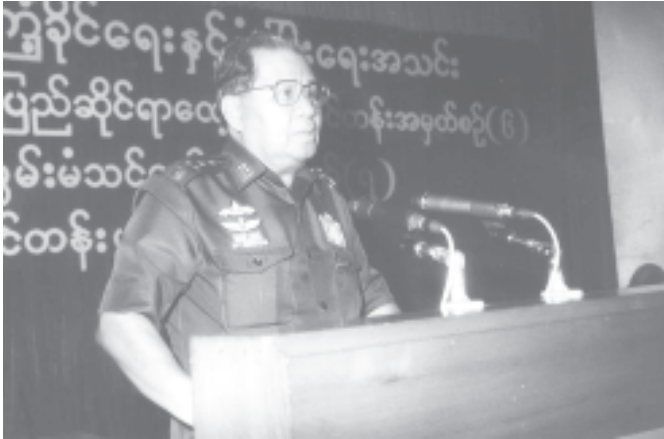
USDA Patron Chairman of the State Peace and Development Council Commander-in-Chief of Defence Services Senior General Than Shwe addresses opening of Myanmar and International Studies Course No 6 and Special Refresher Course No 7 at Pyidaungsu Hall of USDA Training Centre in Hmawby Township.—MNA