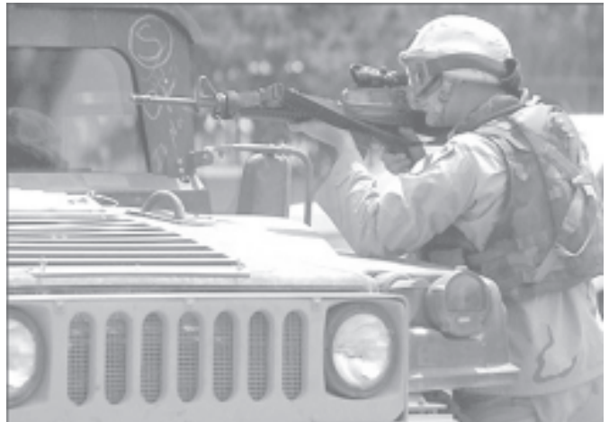
A US soldier stands behind his jeep and takes aim following a car bomb on Kindi street, in a western Baghdad neighbourhood on 31 May, 2004.