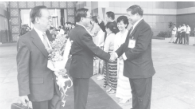
Secretary-1 Lt-Gen Soe Win being seen off by the Myanmar Ambassador to Malaysia and embassy staff at the airport.

sectors. Prime Minister General Khin Nyunt said that Myanmar greatly values her relations with Malaysia, thanking the country for its support for Myanmar in international and regional affairs. Myanmar is glad to see Malaysia's important role for Myanmar's development, he said, adding that his visit is to widen and strengthen the existing bilateral relations. The Malaysian Prime Minister