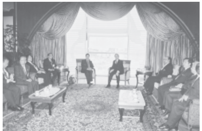
Prime Minister General Khin Nyunt and Malaysian Prime Minister Dato Seri bin Haji Ahmad Badawi hold a special meeting at the latter's office.

The Prime Ministers of the two countries cordially discussed matters relating to bilateral relations and cooperation, especially, in the trade, investment, tourism, health and technological