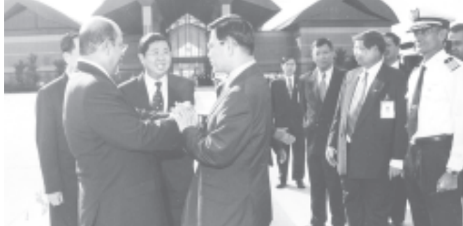
The Malaysian Foreign Affairs Minister and party bid farewell to Prime Minister General Khin Nyunt at Kuala Lumpur International Airport. — MNA