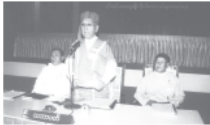
Group discussions of delegates of national races in progress.