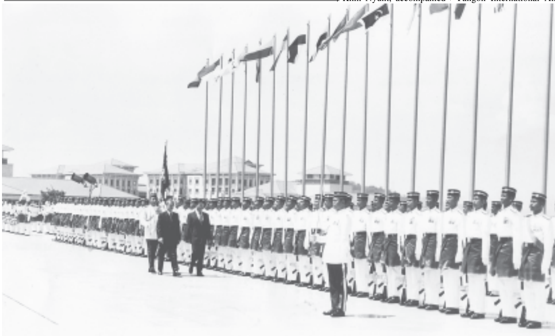
Prime Minister General Khin Nyunt and his Malaysian counterpart Dato' Seri bin Haji Ahmad Badawi inspect the Guard of Honour.