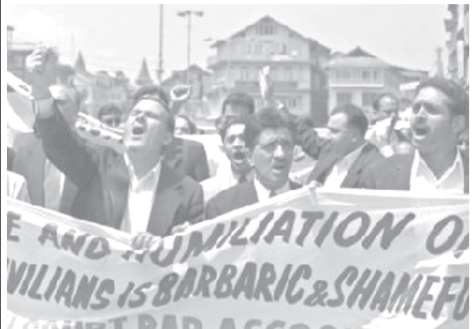
Kashmiri protesters shout slogans during an anti-American protest in Srinagar on 29 May, 2004.