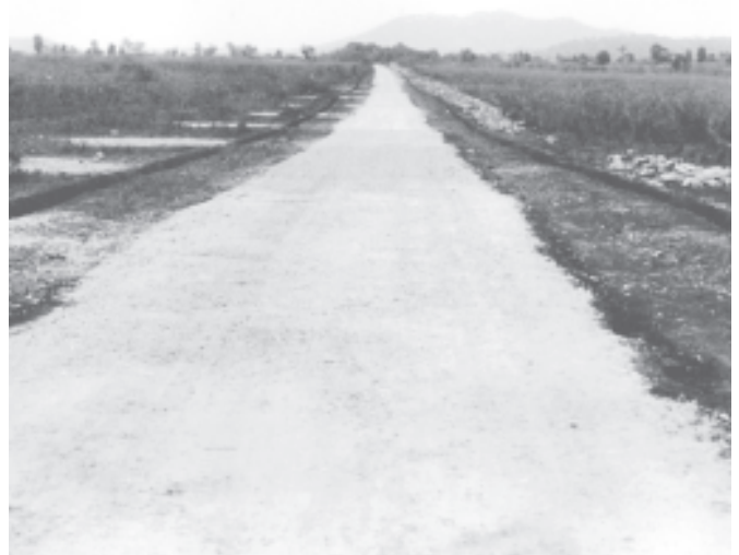
Transportation plays a vital role in national development. The photo shows Mongnaung-Kehsi-Hamngai-Pankaytu Road in southern Shan State.