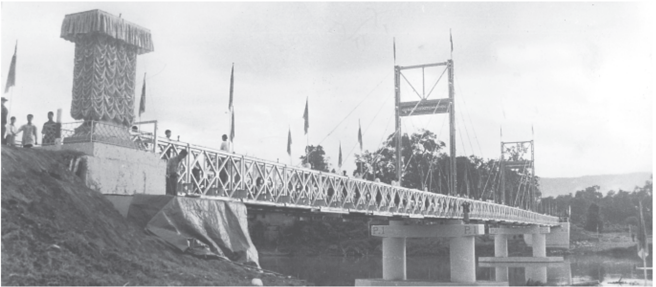
The 400-foot Yu Creek bridge on Tamu-Zedi Road in Sagaing Division is an important facility for the development of the Kabaw Valley, lying in the north-west of the nation and it will help develop the region.