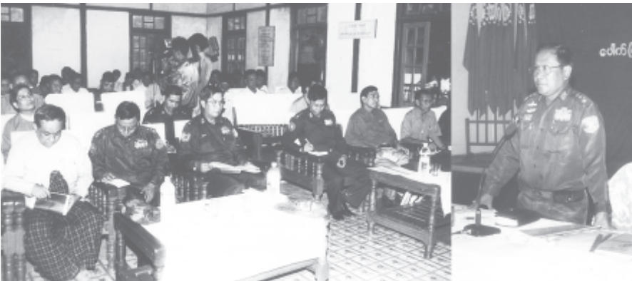
Lt-Gen Ye Myint delivers address at meeting with departmental personnel and townselders in Pauk.