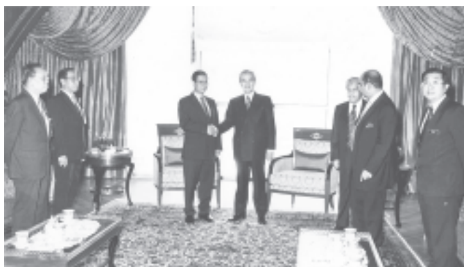
Malaysian Prime Minister Dato Seri bin Haji Ahmad Badawi greets Prime Minister General Khin Nyunt at the former's office.