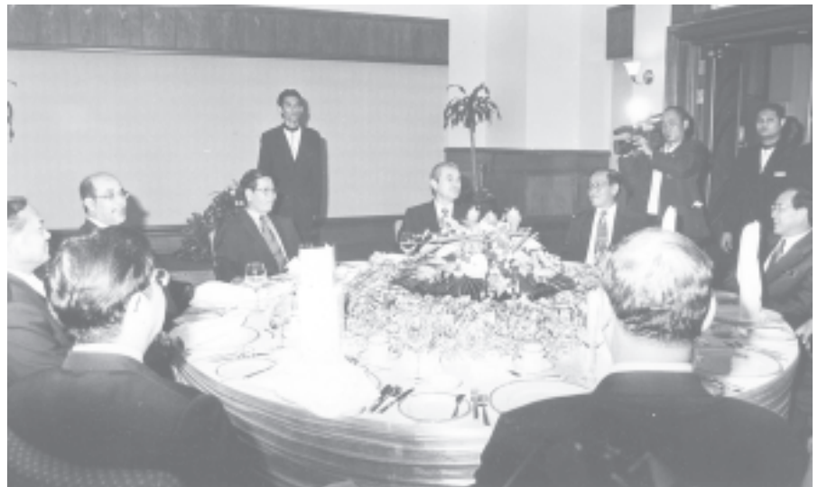
Prime Minister General Khin Nyunt and party attend the luncheon hosted by Malaysian Prime Minister Dato Seri bin Haji Ahmad Badawi at the IOI Marriot Hotel.