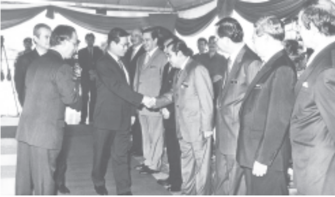
Malaysian dignitaries being introduced to Prime Minister General Khin Nyunt.