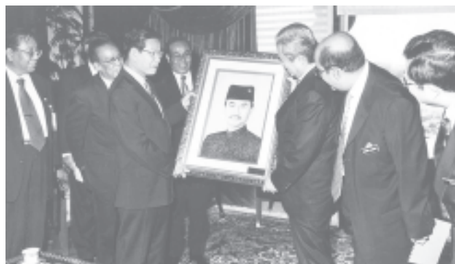
Prime Minister General Khin Nyunt presents a souvenir to his Malaysian counterpart Dato Seri bin Haji Ahmad Badawi.