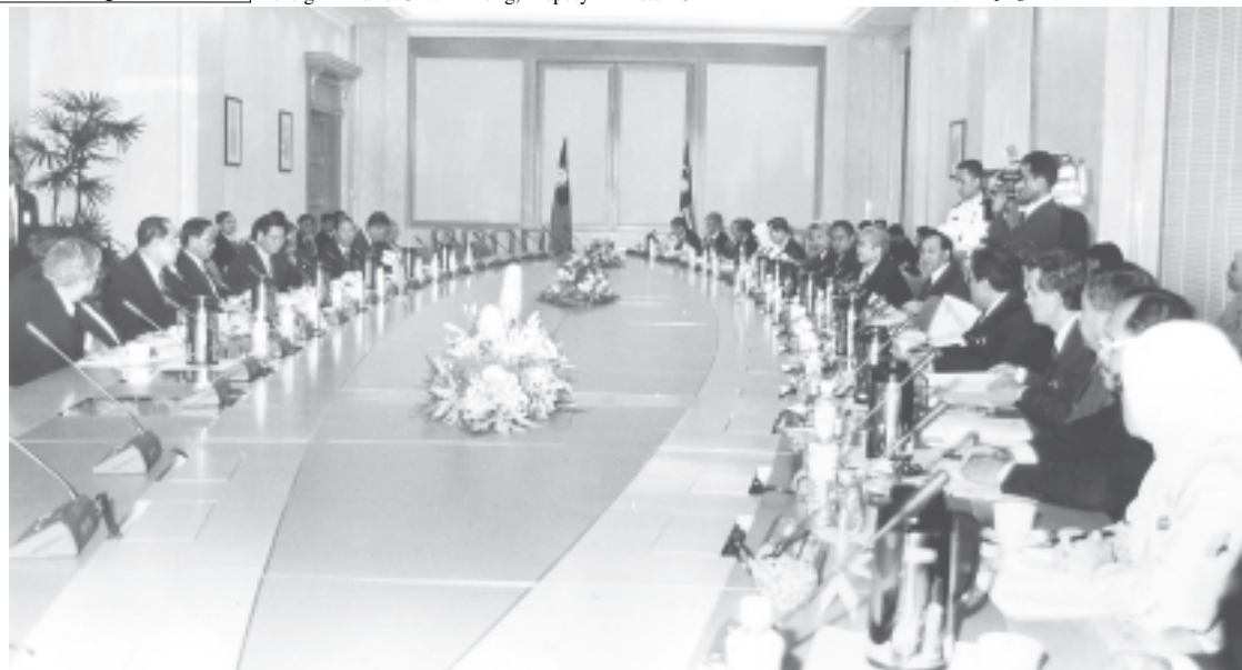
Prime Minister General Khin Nyunt and his Malaysian counterpart Dato Seri bin Haji Ahmad Badawi hold a meeting at the Office of the Prime Minister.

Afterwards, the meeting between two countries followed at the meeting hall of the Prime Minister's Office at 3 pm. It was attended by Prime Minister General Khin Nyunt, Secretary-1 of the State Peace and Development Council Lt-Gen Soe Win, Minister for Commerce Brig-Gen Pyi Sone, Minister for Foreign Affairs U Win Aung, (See page 9)