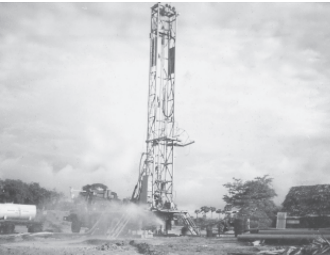
The government is spending a large sum of money on water supply projects in rural areas. The photo shows machinery used to sink artesian wells as deep as over 1000 feet in Taungdwingyi Township, Magway Division.