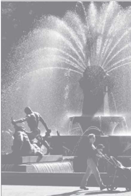
People pass the Archibald Fountain in Sydney's Hyde Park. Australians have been warned they face an environmental crisis unless they stop squandering scarce water resources in the world's most arid inhabited continent.