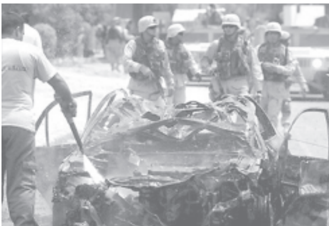
US soldiers stand guard as an Iraqi extinguishes debris of a vehicle following a car bomb on Kindi street, in a western Baghdad neighbourhood on 31 May, 2004.

The British Foreign Office has updated its travel advice, advising against all but essential travel to Saudi Arabia and warning visitors to "take great care". — MNA/Xinhua