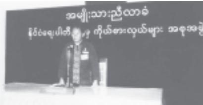
Group discussions of other invited persons in progress. — MNA