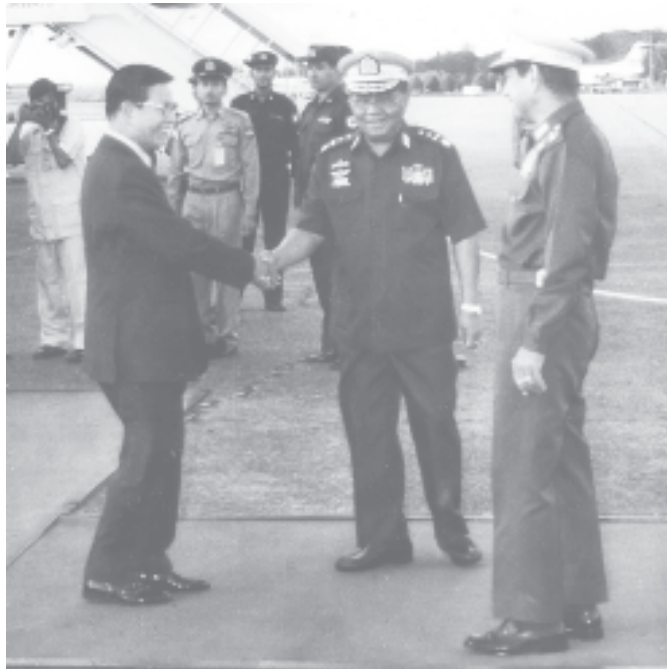
Senior General Than Shwe and party welcome back Prime Minister General Khin Nyunt at the airport.