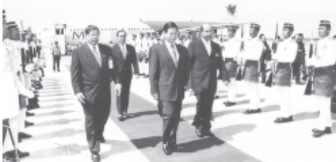
Prime Minister General Khin Nyunt and party being welcomed by the Malaysian Foreign Affairs Minister at Kuala Lumpur International Airport in Malaysia.