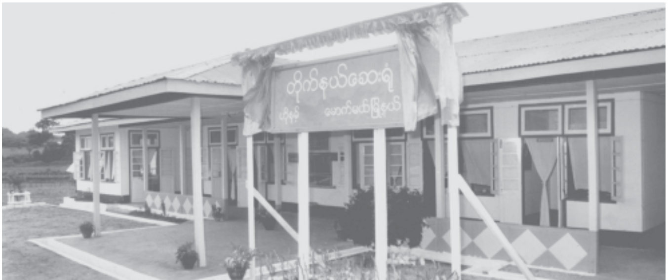
To provide effective health care services to rural people is one of the five rural development tasks. The government is carrying out the tasks in rural areas including border regions. The photo shows station hospital in Honamt Village in Maukmai Township, Loilem District, Shan State (South).