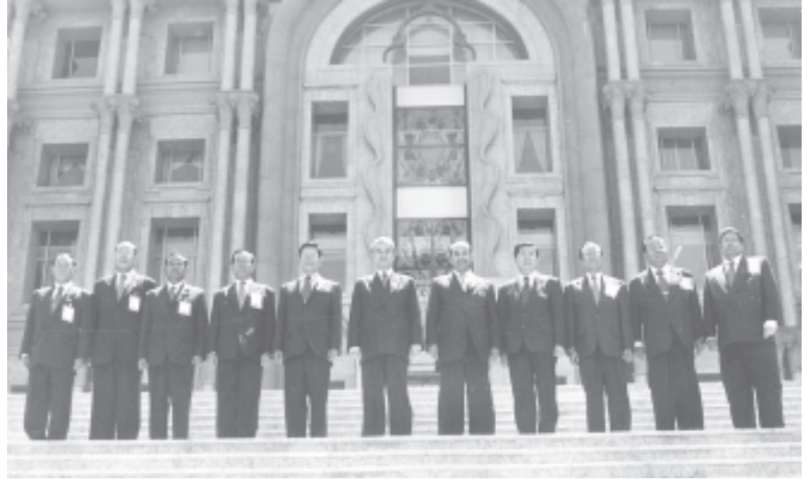
Prime Minister General Khin Nyunt and party pose for a documentary photo together with Malaysian Prime Minister Dato Seri bin Haji Ahmad Badawi.