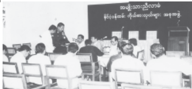
Group discussions of State service personnel delegates in progress.