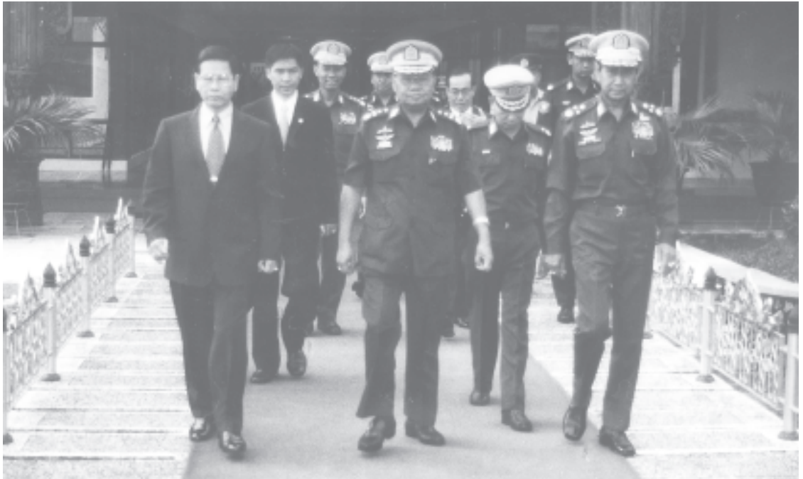
Senior General Than Shwe and party see off Prime Minister General Khin Nyunt at Yangon International Airport.