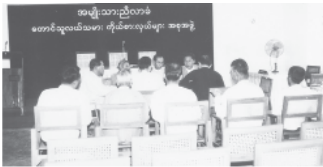
Group discussions of peasant delegates in progress.

YANGON, 1 June—National Convention delegate groups of political parties, intellectuals and intelligentsia, national races, peasants, workers, State service personnel and other invited delegates held discussions at the respective designated halls of Nyaungnapin Camp in Hmawby Township today.