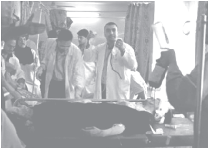
Iraqi doctors and nurses surround a woman inside a Baghdad, Iraq hospital on 31 May, 2004 after she was injured in an explosion in Baghdad. A car bomb exploded Monday near the headquarters of the US-run occupation authority, killing at least two people and injuring more than 20.