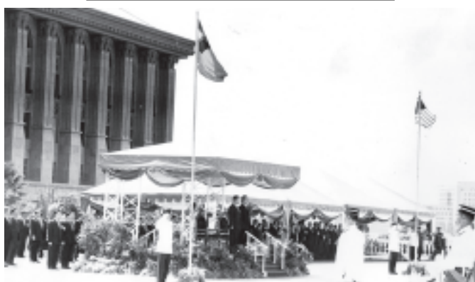
Prime Minister General Khin Nyunt and his Malaysian counterpart Dato Seri bin Haji Ahmad Badawi take the salute of the Guard of Honour.