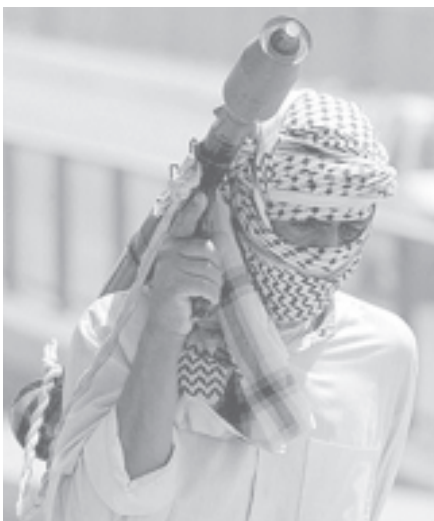
A Shiite Muslim Iraqi fighter of the Mehdi Army militia walks with his rocket propelled grenade launcher on his shoulder, close to the Abbasiyah Bridge, the scene of fighting in the town of Kufa on 29 May, 2004.

"Air routes are just like bus lanes on the ground. Only with air lines, can passengers take flights," said an official with the administration.