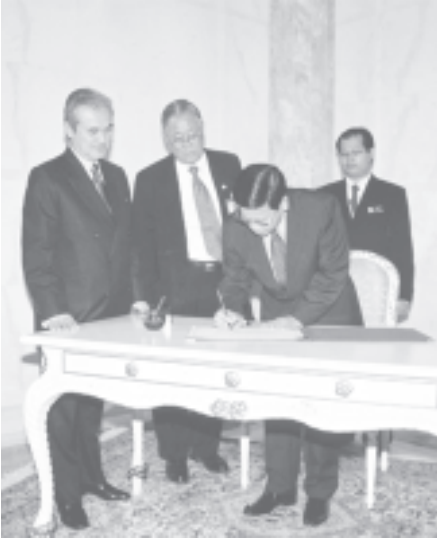
Prime Minister General Khin Nyunt signs in visitors' book at the Malaysian Prime Minister's Office. — MNA