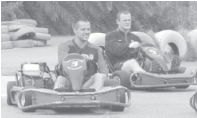
England soccer players Michael Owen, left, and Wayne Rooney compete in go-karts at the Forte Village Hotel in Cagliari, Sardinia, Italy, Tuesday May 25, 2004, where the England soccer squad are preparing for the Euro 2004 European Soccer Championships.