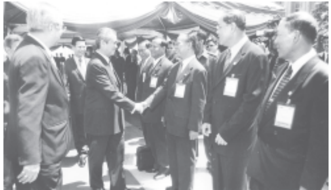
Myanmar delegation members being introduced to the Malaysian Prime Minister.