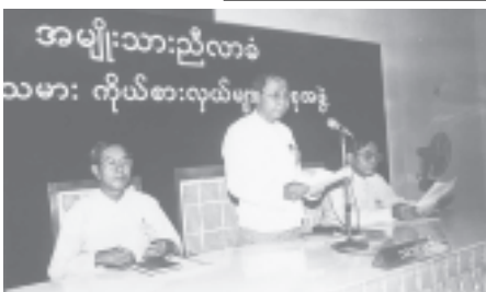
Group discussions of worker delegates in progress.