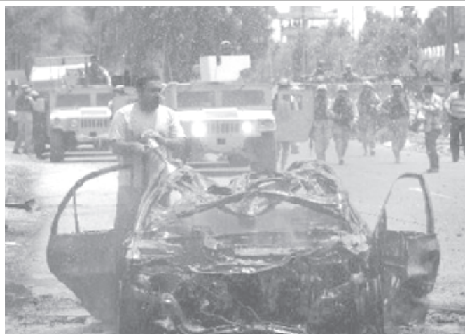
An Iraqi fireman extinguishes a burned out car at the scene of a car bomb explosion in Baghdad, Iraq on 31 May, 2004. A car bomb exploded Monday near the headquarters of the US-run occupation authority, killing at least two people and injuring more than 20.

"I expect America will lose in Iraq. God willing we will defeat them." — Internet