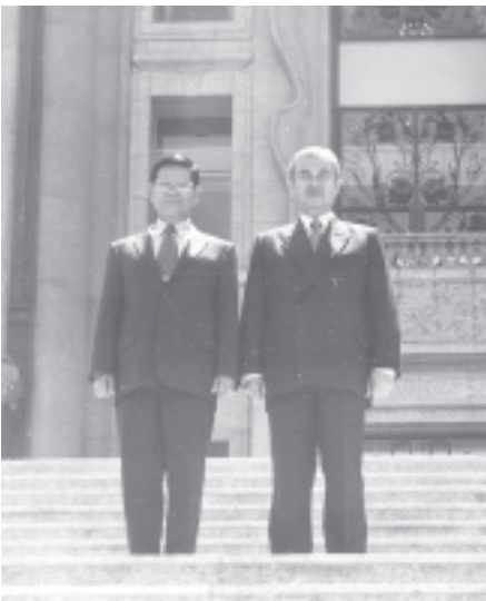
Prime Minister General Khin Nyunt and Malaysian Prime Minister Dato Seri bin Haji Ahmad Badawi pose for a documentary photo.