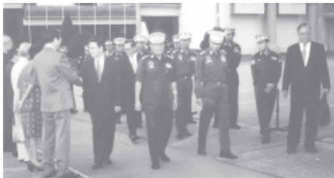
Prime Minister General Khin Nyunt being welcomed back at Yangon International Airport by Dean of Diplomatic Corps Singaporean Ambassador Mr Simon Tensing de Cruz and ambassadors of foreign embassies in Yangon.