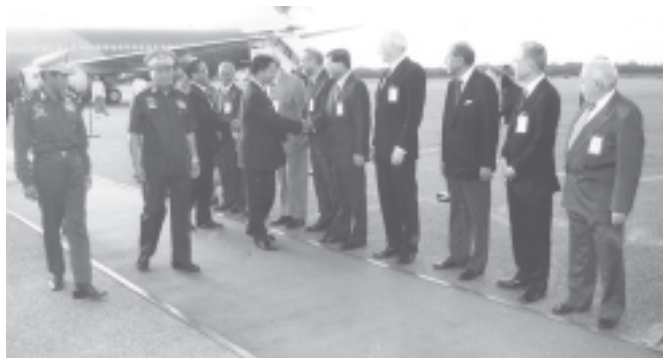
Prime Minister General Khin Nyunt being welcomed back at the airport by Dean of Diplomatic Corps Singaporean Ambassador Mr Simon Tensing de Cruz and ambassadors of foreign embassies in Yangon.