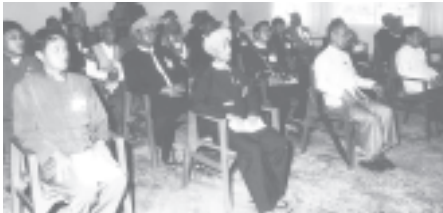
Group discussions of delegates of political parties in progress. — MNA