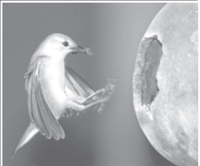
A prothonotary warbler comes in for a landing with food for its offspring that wait in its nest inside the gourd, on 28 May, 2004, in Sopchoppy, Fla.

Silk Air has opened five non-stop flights to China, to Macao, Xiamen in eastern Fujian Province, Fuzhou, capital of Fujian Province, Chengdu and Kunming, capital of southwest Yunnan Province. — MNA/Xinhua