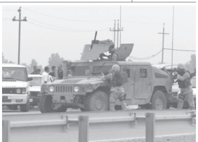
US Army soldiers take up position after coming under attack while escorting a convoy of prisoners released from the Abu Ghraib prison outside Baghdad, Iraq, on 28 May, 2004.

He pointed out to a rapid growth of the world's aviation market, or a rapid recovery from a slump in the September 11 terror attack on the United States in 2001.