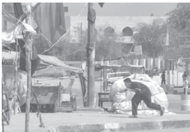
An Iraqi takes cover as fighting continues in the centre of Najaf, Iraq, between US forces and Shiite militiamen in Najaf, on 25 May, 2004.