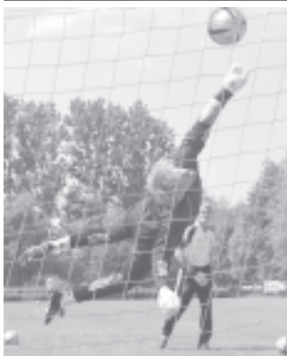
Oliver Kahn stretches for the ball shot by goalkeeper coach Sepp Maier, right, in Winden, southern Germany, on 28 May, 2004, during a public training session of the German national soccer team.

Perez said earlier this week that he would be calling an Extraordinary General Meeting of the club's members on June 11th at which a date for this year's presidential elections would be fixed.