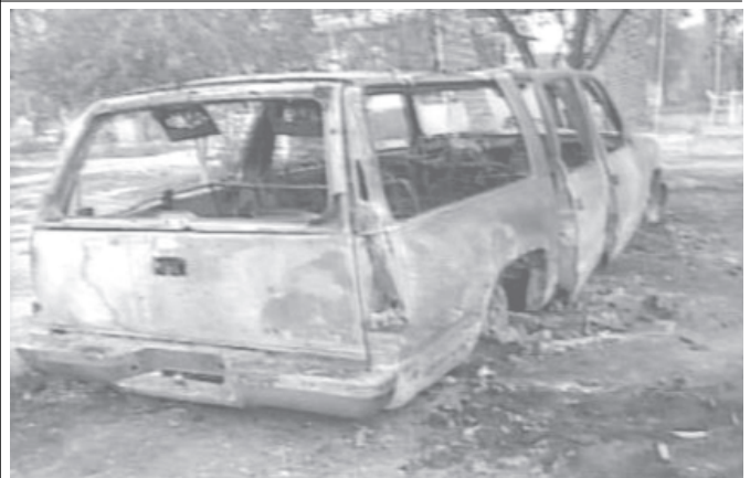
A frame grab taken from video footage on 28 May, 2004, shows the burnt vehicle of two Japanese freelance journalists in Mahmutiya, 30 km south of Baghdad. The journalists were killed in an attack on their car on Thursday at a well-known danger spot south of Baghdad, said doctors who displayed two incinerated bodies.

The report also quoted a White House official as saying on Wednesday that it had been Bush's idea to insert the prison announcement into this speech Monday at the US Army War College in Carlisle, Pennsylvania, where he outlined his strategy for handing over power to a new Iraqi government by June 30.