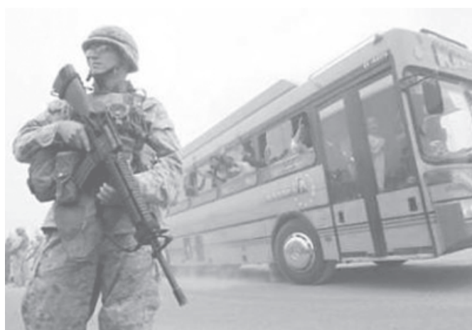
A US Marine stands guard while a busload of former Iraqi prisoners drive out of Abu Ghraib prison, after they were released west of the capital of Baghdad 28 May, 2004.