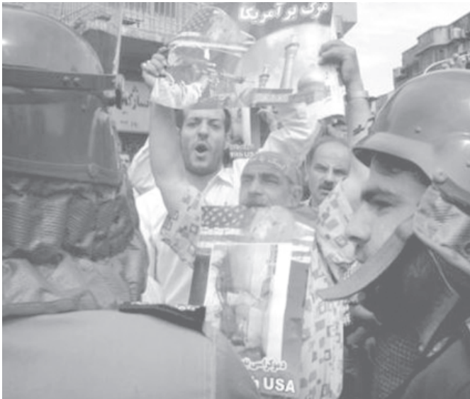
Iranians hold a protest in front of the British Embassy in central Teheran, on 28 May, 2004. About 300 protesters charged police cordons outside the British Embassy in Teheran on Friday, angry about the occupation of Iraq by British and US troops.

Delving more specifically on Iraq, the poll found that 65 percent believed the US-led coalition was bogged down, while 33 per cent thought some progress has been made; 59 per cent thought Bush lacked a clear plan for the future against 38 per cent who said he had one.