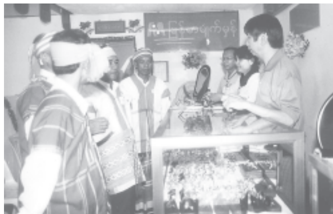
Delegates to National Convention buying goods at Win Thuza Shop and GEC shops at Nyaungnapin Camp in Hmawby Township.