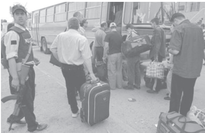
An Iraqi police officer guards a group of Russian workers leaving for Baghdad's Airport, Iraq, on 28 May, 2004. Russian workers evacuated Baghdad after a convoy with seven Russian workers was ambushed last Wednesday near a Baghdad power station, killing two and seriously injuring five.