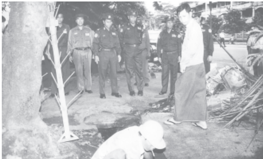
Yangon Division Peace and Development Council Chairman Yangon Command Commander Maj-Gen Myint Swe inspects sanitation tasks being carried out in Yangon City.