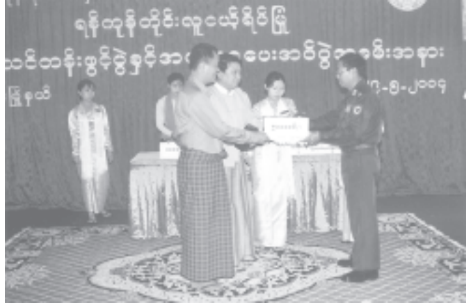
Commander Maj-Gen Myint Swe accepts cash donations from wellwishers.

Later, the commander and wife and party inspected practical works of the trainees.