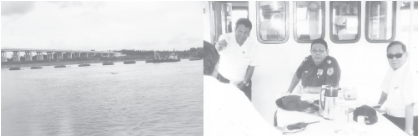
Minister for Transport Maj-Gen Hla Myint Swe inspects waterway along the banks of Nyaungdon Township by boat.

The National Convention is the concern of all our national races.