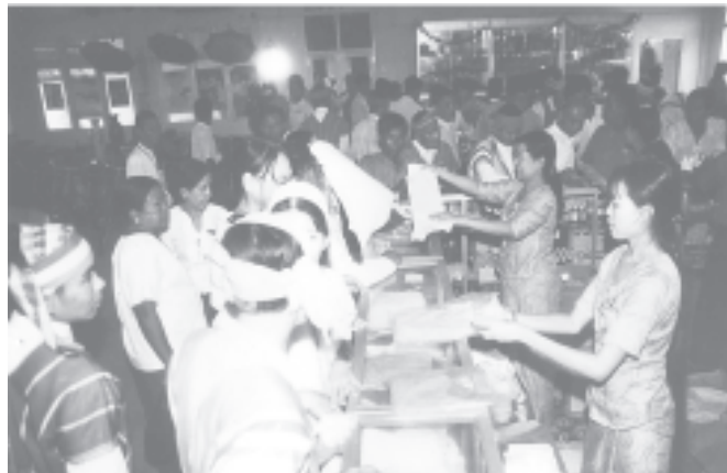
Delegates to National Convention at Win Thuza Shop and GEC shops at Nyaungnapin Camp in Hmawby Township.

With hands linked firm around the National Convention.