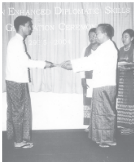
Minister for Foreign Affairs U Win Aung presents a certificate to a trainee of Enhanced Diplomatic Skills Course No 2/2004.— MNA

The subjects on international laws, international trade, bylaws of World Trade Organization and negotiation were conducted. Altogether 90 trainees attended the 8-week course.— MNA