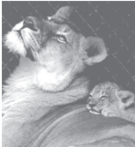
One of two African lion cubs, right, relaxes in the lion yard with its mother, Precious, at the Fort Worth Zoo, on 24 May, 2004, in Fort Worth, Texas. The two 6-week-old cubs weigh about 12 lbs each and are the first pair of lion cubs born at the zoo in almost 20 years. The cubs names will be determined through an online poll.

The excavation at the Zhongong Temple site, which was done by the Shaanxi Archaeological Research Institute and Beijing University, started in February. Since then a large-scale investigation and excavation was made in the region around the Zhongong Temple. — MNA/Xinhua