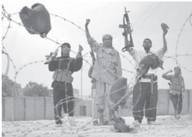
Armed Iraqi gunmen pose in the centre of Najaf, Iraq, on 28 May, 2004. The US-led coalition agreed Thursday to suspend offensive military operations in Najaf after Shiite leaders struck a deal with a radical cleric to end fighting that killed more than 350 Iraqis and 21 coalition troops. — INTERNET

Three Russians and five Ukrainians working for the company were abducted in Iraq on April 12, but they were released unharmed the next day. Enditem.—Internet