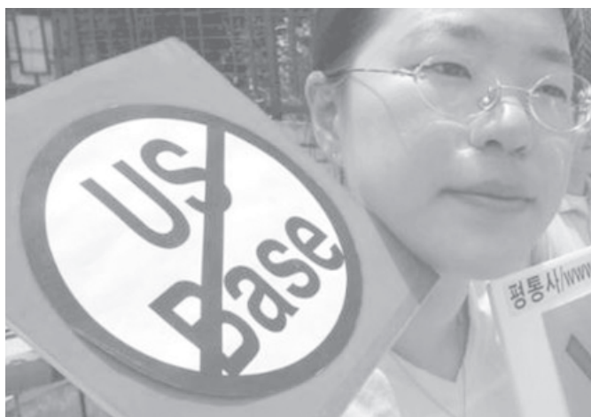
A South Korean protester holds a banner during an anti-US rally in Seoul, on 25 May, 2004.