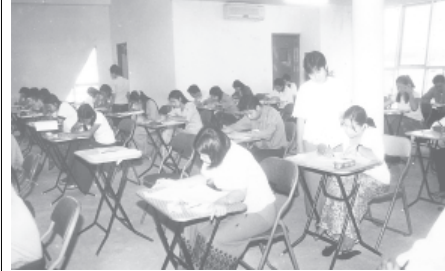
EXAM FOR IT DEVELOPMENT: With a view to developing Information Technology in Myanmar, the Japan-Myanmar Cross Certification (JITEC) examination was held at the MICT Park in Yangon on Saturday under the sponsorship of the Myanmar Computer Federation. Altogether 172 persons sat for the examination. Photo shows the exam in progress.(H)