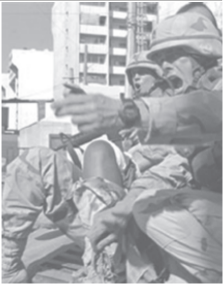
US Army soldiers rush to evacuate an injured comrade in the centre of Baghdad, Iraq, after thunderous explosions at the capital, on 25 May.