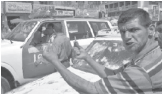
An Iraqi man reacts as he shows empty bullet casings after US Army soldiers fired several shots from their military convoy onto a local taxi as the driver tried to overtake them in the centre of Baghdad, on 18 May, 2004. The taxi driver was brought in critical condition to a nearby hospital.