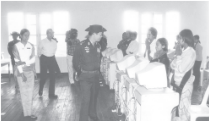
Prime Minister General Khin Nyunt cordially meets students at computer room at GCC in Loilem on 25-5-2004.