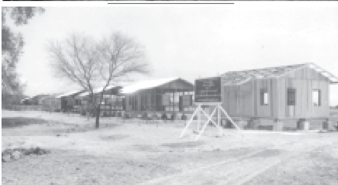
Rural housing being built in Ywagyi village in Thazi Township, Mandalay Division.