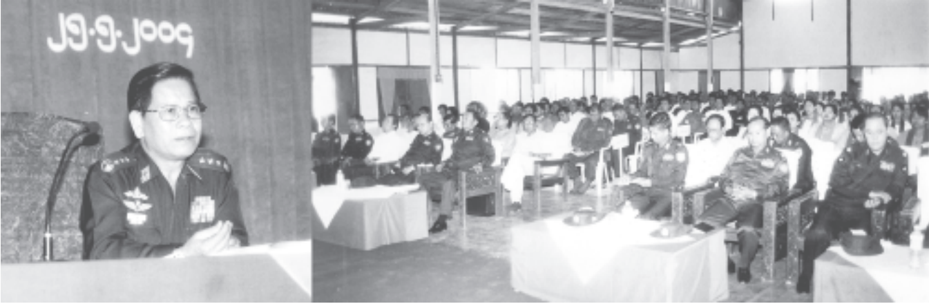
Prime Minister General Khin Nyunt meets township authorities, departmental officials and local people at Thirihantha Hall in Laikha on 25-5-2004.

The National Convention is the concern of all our national races.