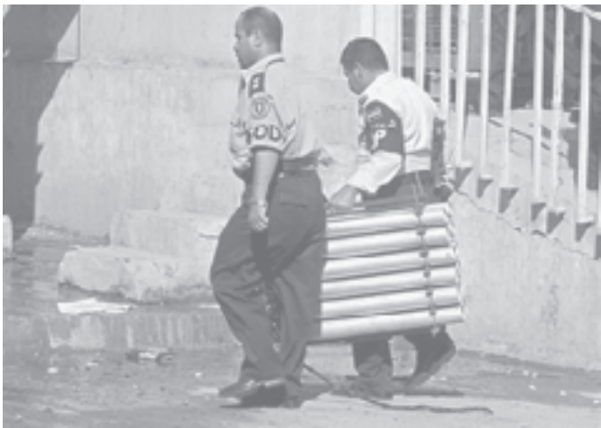
Iraqi police carry away a home-made rocket launcher from an apartment block in Baghdad. The launcher was found in an air conditioning unit, after it was fired toward a police station.