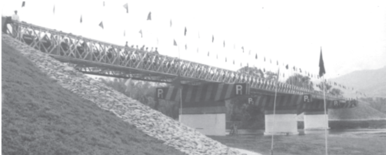
Mole creek-crossing bridge on Bhamo-Myitkyina road in Moemaik Township, Kachin State, is 325 feet long.