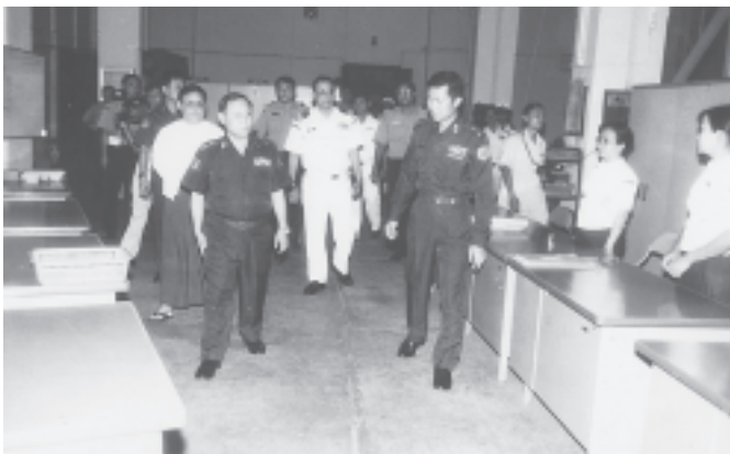
F&R Deputy Minister Col Hla Thein Swe inspects the Customs Department.