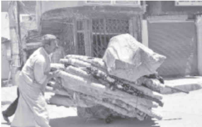
Iraqi merchants flee with their property in the centre of Karbala, 110 km south of Baghdad, Iraq, on 16 May, 2004 as fighting continued between coalition forces and Shiite militiamen.