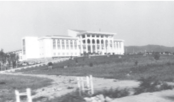
Government Computer College (Panglong) seen in Loilem.