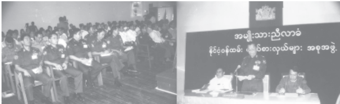
The group meeting of delegates of State service personnel in progress.