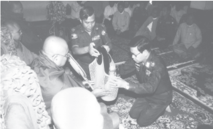
Prime Minister General Khin Nyunt donates provisions to Alodawpyay Sayadaw Agga Maga Pandita Bhaddanta Ariyavamsa.— MNA