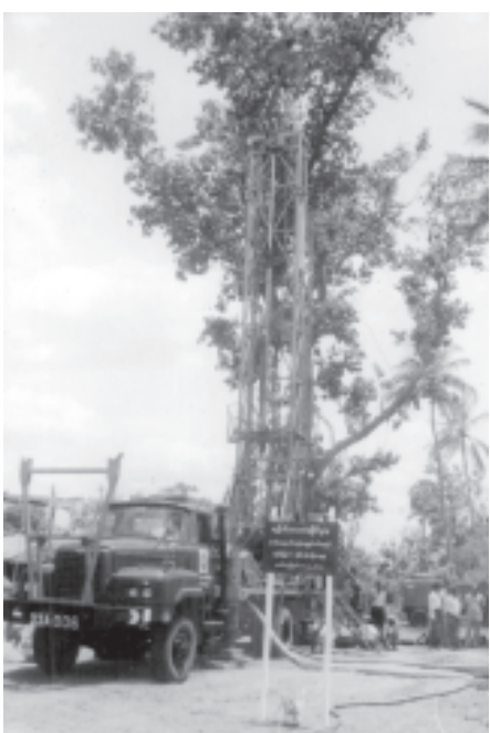
Tubewells are being sunk to supply water to the people living in Myitkyin Model Village in Mahlaing Township, Mandalay Division.