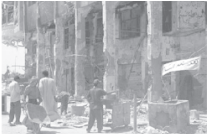
Iraqis clean the rubble from their shops which were shelled by mortars during a fight between militiamen and U.S. troops in Karbala, Iraq, on 23 May, 2004.