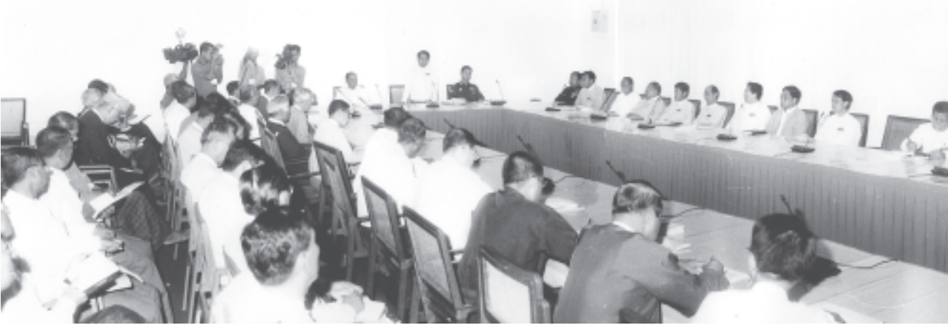
Secretary of National Convention Convening Commission Minister for Information Brig-Gen Kyaw Hsan meets members of panel of chairmen of NCCC and delegate groups.

YANGON, 26 May— A coordination meeting between members of National Convention Convening Commission led by Secretary of NCCC Minister for Information Brig-Gen Kyaw Hsan and members of panel of chairmen of delegate groups was held as the meeting hall of Work Committee, Nyaunghnapin Camp, Hmawby, at 10 am today. Present at the meeting were Secretary of NCCC Minister for Information Brig-Gen Kyaw Hsan, Vice-Chairman of Work Committee Attorney-General U Aye Maung and Chairman of Management Committee Auditor-General Maj-Gen Lun Maung, members of Management Committee members, members of panel of chairmen of delegates to political parties, representatives-elect, national races, peasants, workers, intellectuals and intelligentsia, State service personnel and other invited delegates and members of support groups. During the meeting, Secretary Brig-Gen Kyaw Hsan held discussions on Plenary Meeting of National Convention, group-wise discussions, security and administration and replied to queries raised by those present and the meeting came to a close at 11.30 am. MNA