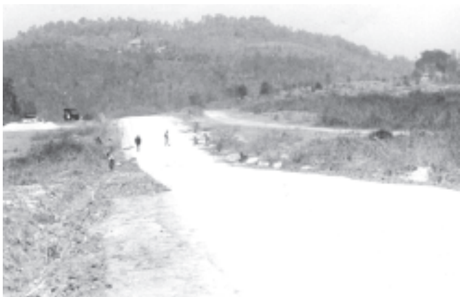
The government is building new roads, renovating the old ones for better transport. The above photo shows Muse ring road in Shan State (North).