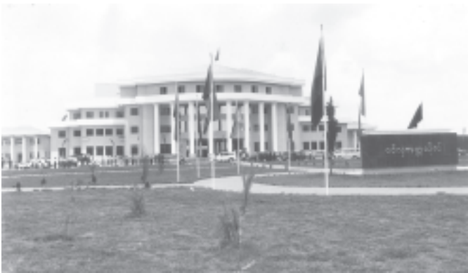
The main building of Panglong University.