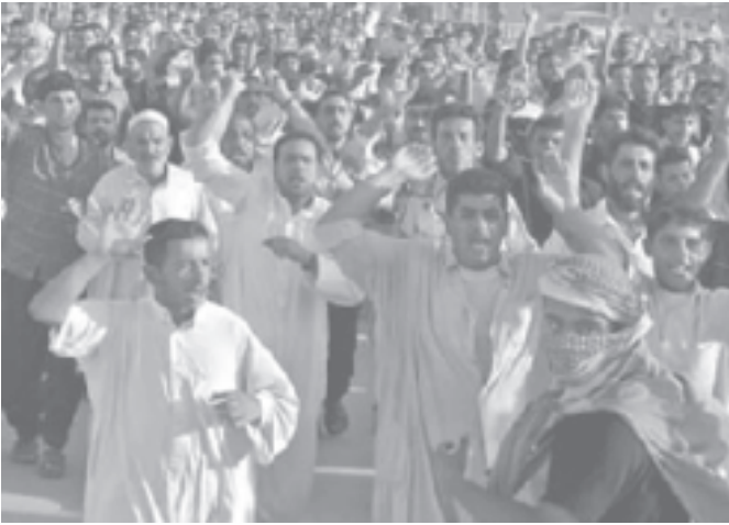
Iraqi Shiites chant anti-US slogans during a protest in the streets of the holy city of Najaf on 25 May, 2004. About 1,000 Iraqi Shiite Muslims took to the streets of Najaf denouncing the US forces accusing them of being responsible of firing rockets or mortars that damaged the Imam Ali shrine in Najaf, the holiest Shiite site in Iraq.

“All the furniture was slashed with knives, tables and chairs were broken and the windows smashed. They didn’t need to break down the front door — I told them I had the key.” — Internet