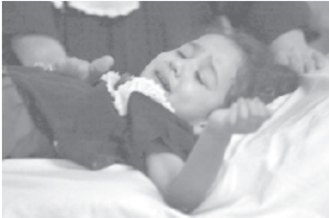
An injured Iraqi girl is comforted by her mother as she is being rushed to the Al Kindi hospital in Baghdad, Iraq on 22 May, 2004 after a car bomb exploded .