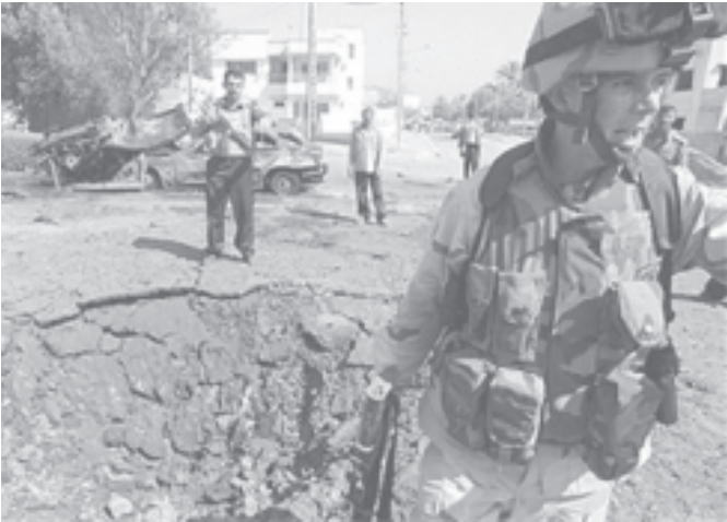
A US soldier stands next to a crater left by a car bomb that exploded, outside a hotel close to Australia's diplomatic mission in Baghdad. — INTERNET

The latest fatalities brought the US military death toll in Iraq to 798 since the start of the US-led invasion in March 2003. This figure includes 581 troops killed in action.—Internet