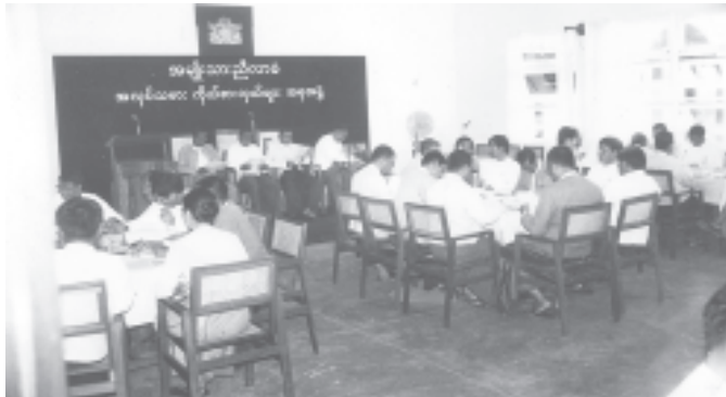
The meeting of delegates of workers' group in progress.

The sub-groups for compiling the finance and planning sector, the social sector and the transport and communication sector presented their proposals concerning detailed basic principles to be laid down for sharing power in legislative, executive and judicial