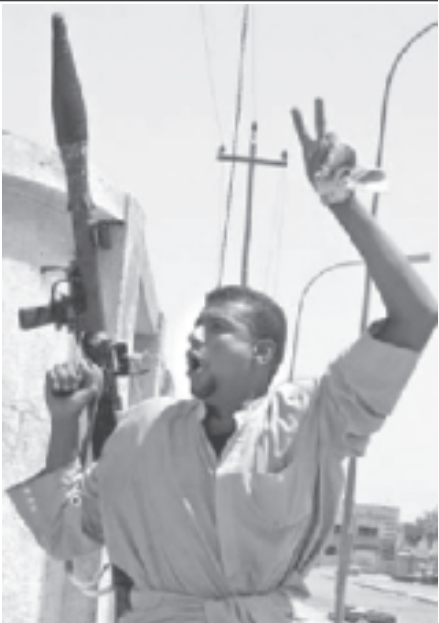
An Iraqi Shi’ite militiaman brandishes his rocket launcher in the streets of the holy city of Najaf, on 25 May 2004. The Imam Ali shrine in Najaf, the holiest Shi’ite site in Iraq, was damaged on Tuesday by rockets or mortars, witnesses said—a development likely to spark outrage among Iraq’s Shi’ite majority.

Musharraf made the comments while narrating the dangers Pakistan faced due to wider perception of the outside world that the country promoted terrorism and that the perception included that Kashmiri “freedom struggle” was terrorism. Musharraf also said that peace was required between India and Pakistan to resolve Kashmir and other issues between the two countries. — MNA/PTI