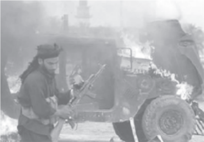
An Iraqi militiaman walks past a burning US Army humvee vehicle, which was captured during a morning gun battle and later set alight, in the town of Kufa on 19 April, 2004.

The remaining 120 members of the first team will return to Japan by the end of the month. — MNA/Xinhua