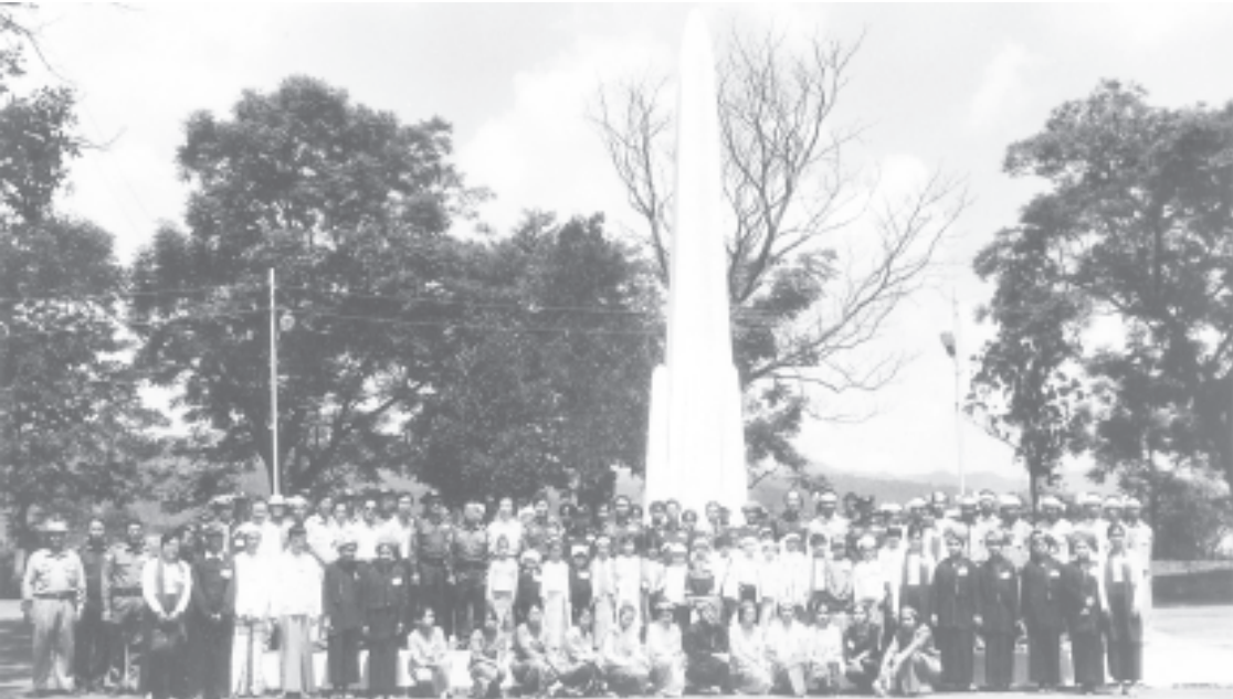
Prime Minister General Khin Nyunt and party pose for documentary photo with local people in front of Panglong Monument in Panglong on 25-5-2004.