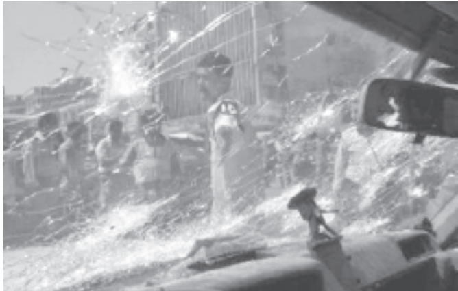
A damaged car which was shot by US soldiers on 18 May, 2004.