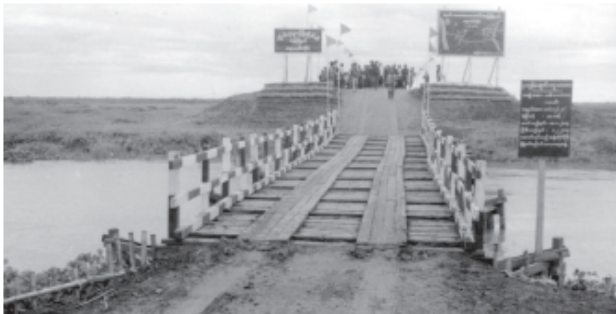
A creek-crossing bridge linking Sankin and Kalawthaw villages in Danubyu Township, Ayeyawady Division.