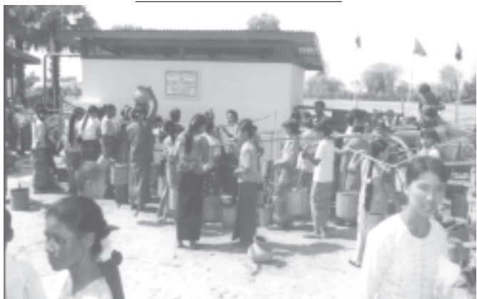
Rural people living in Yone village in Kyaukpadaung Township, are fetching potable water from a tubewell.