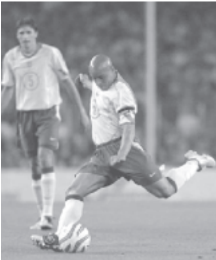
Brazil’s Roberto Carlos prepares to shoot the ball during a friendly soccer match against Catalanian Regional selection in Barcelona, Spain, on Tuesday, 25 May 2004. Brazil won 5-2.

Verbruggen, along with several other IOC coordinators, will also pay an inspection tour of Qingdao, which will host sailing competition of the 2008 Games.