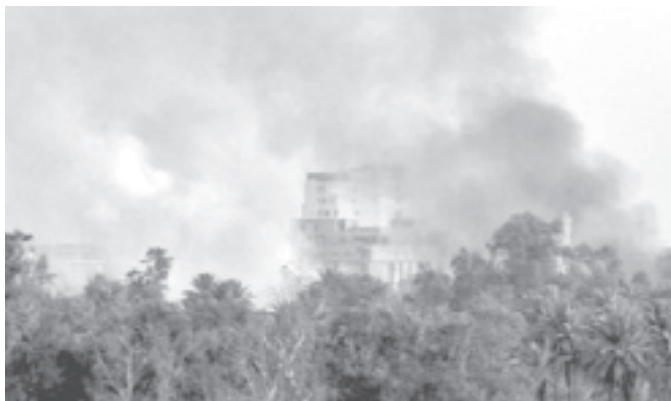
Smoke and flames billow over central Baghdad, Iraq, on 19 May, 2004, after a strong blast was heard near the US-controlled 'Green Zone' headquarters of the US-run occupation.