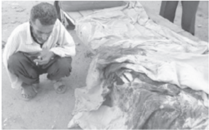
An Iraqi man sits near a blood soaked sheet in the southern city of Basra. Five Iraqis, including two children, were killed by a mortar explosion when a shell hit their house in Al-Iskan on 23 May, 2004.