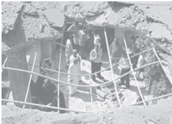
Iraqis check the damage caused by a mortar shell that hit the roof of a house in Baghdad's central Salahiyah neighbourhood on 22 May 2004.