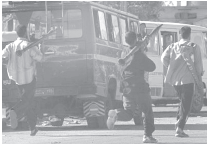
Iraqi militiamen run to take positions along the streets of Sadr City, Baghdad's largest Shiite neighbourhood, Iraq, on 23 May, 2004, after a fight between militiamen and US troops in the city.—INTERNET

The latest casualty brought the US military death toll in Iraq to at least 793 since the start of the US-led invasion in March 2003. Among those about 577 were killed in combat action. — MNA/Xinhua