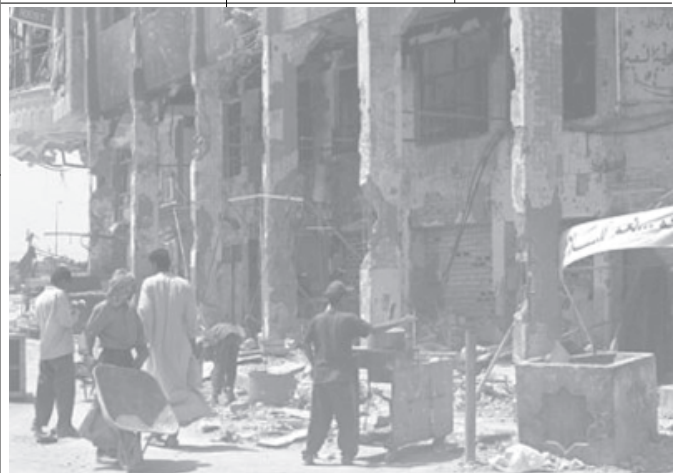
Iraqi Shiites clean the rubble from their shops which were shelled by mortars during a fight between militiamen and US troops in Karbala, Iraq, on 23 May, 2004.

the two leaders attached importance to the forthcoming commencement of a composite dialogue on all outstanding issues. In early January, Pakistani and Indian leaders agreed to start dialogue designed to solve their bilateral disputes. —MNA/Xinhua