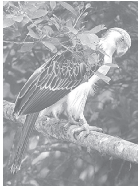
A rare Philippine eagle nicknamed 'Kabayan' (Filipino for compatriot). The Philippine eagle is on the brink of extinction and is the rarest of all large forest eagles.

Georgia is especially important to Turkey because it is a transit country for a multi-billion dollar oil pipeline due to start pumping crude from the Caspian Sea to the Turkish Mediterranean port of Ceyhan next year. Georgia, an impoverished former Soviet republic plagued by corruption and organized crime, says it expects revenues of about 50 million US dollars a year from the pipeline. —MNA/Reuters