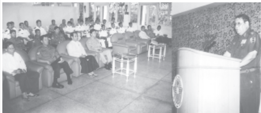
Minister for Transport Maj-Gen Hla Myint Swe delivers a speech at the training course on operating of X-ray machine on 24 May. — MNA

Next, the minister and party went to No 5 Furniture Factory of Myanmar Timber Enterprise. The minister inspected the production process of finished goods at the factory and gave instructions on earning more foreign exchange and minimizing of loss and wastage systematically. — MNA