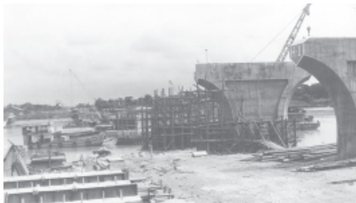
Chairman of Yangon Division Peace and Development Council Commander Maj-Gen Myint Swe inspects Panhlaing river-crossing bridge.

Panhlaing bridge now under construction is 1,940 feet long, with a 500-foot-long main bridge and a 1,440-foot-long approach structure. It also has a 28-foot-wide motor road and a 4-foot-wide pedestrian lane on both sides. It is of iron-reinforced concrete type with a 75-foot-wide clear-