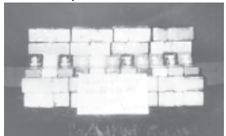
4.95 kilos of seized heroin. — MNA

Action is being taken in connection with the seizure of the drugs under the Narcotic Drugs and Psychotropic Substances Law by the police station concerned. — MNA