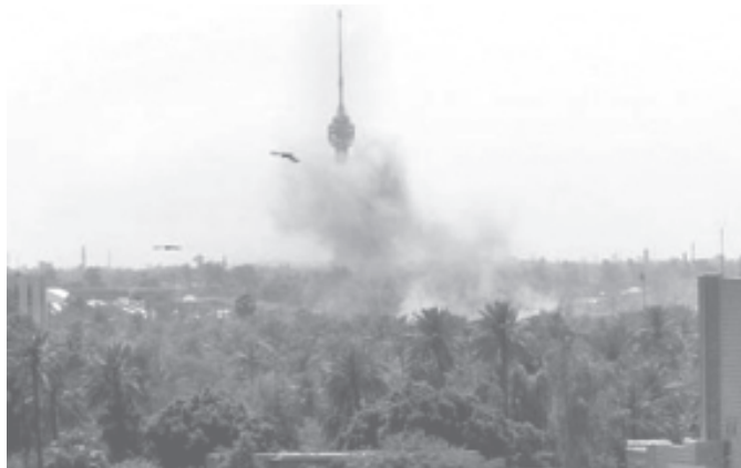
Smoke bellows over central Baghdad, Iraq, on 24 May 2004 after several strong blasts were heard in the center of the city.