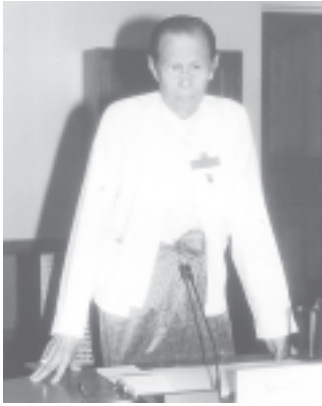
Chairman of National Convention Convening Work Committee Chief Justice U Aung Toe gives clarifications. MNA (News page 1)