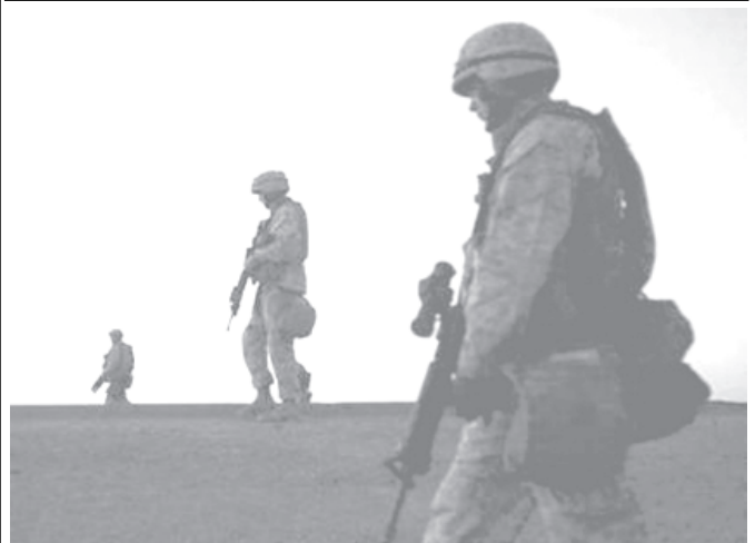
US Marines survey the site where a US military convoy was ambushed near Falluja, Iraq on 23 May, 2004. Two servicemen were reported dead and at least five injured after four vehicles in the convoy were attacked, according to witnesses at the scene.