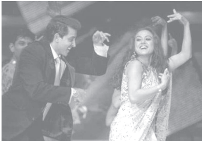
Bollywood stars Hrithik Roshan (L) and Priety Zinta perform at the International Indian Film Academy award ceremony in Singapore on 22 May, 2004. Roshan won the award for Best Actor and Zinta won the award for Best Actress.