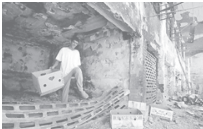
An Iraqi youth surveys damage to his shop in a battered area in the city of Karbala, south of Baghdad on 23 May 2004.