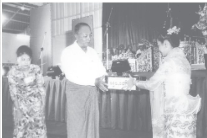
Joint-Secretary 1 of NCCC Maj-Gen Khin Aung Myint presents a cash award to an artist. — MNA

YANGON, 25 May — On the occasion of the anniversary of the National Day of the Republic of Argentina which falls on 25 May 2004, U Win Aung, Minister for Foreign Affairs of the Union of Myanmar, has sent a message of felicitations to His Excellency Dr Rafael Bielsa, Minister of Foreign Affairs of the Republic of Argentina. — MNA