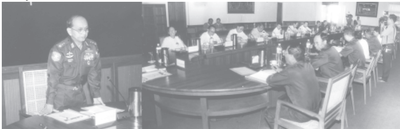
Chairman of National Convention Convening Commission Secretary-2 of the State Peace and Development Council Lt-Gen Thein Sein makes a speech at work coordination meeting of NCCC, Work Committee and Management Committee.