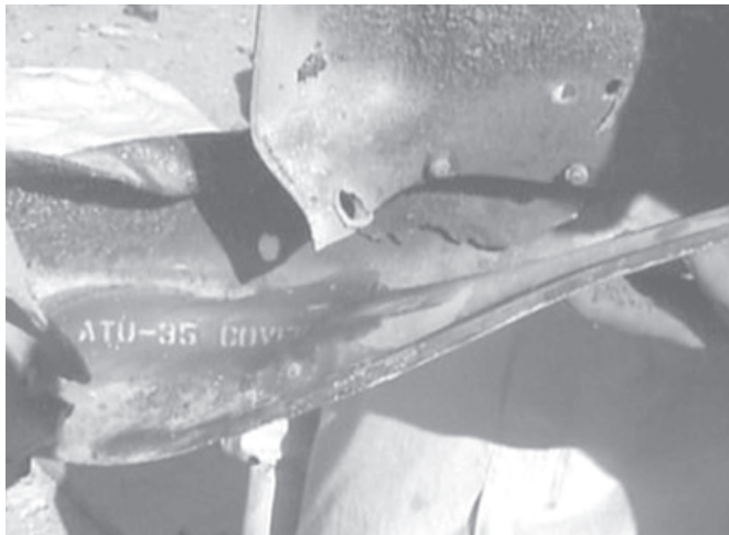
TV Image shows metal parts, allegedly from a US missile, being held up in the remote desert area near Mogr el-Deeb, Iraq, 5 miles (8 km) away from the Syrian border, on 19 May 2004.