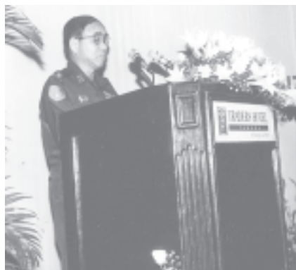
Deputy Minister for Labour Brig-Gen Win Sein makes a speech at opening ceremony of Myanmar, ASEAN, Japan, National Seminar on Globalization and Industrial Relations. — MNA

Next, they inspected progress of rural housing projects being implemented by Development Affairs committee. Aunglan Township Development Affairs built a total of 20 houses during 2003-2004 fiscal year. They also inspected construction of village-to-villager road built by Taungdwingyi Township Development Affairs Committee. — MNA