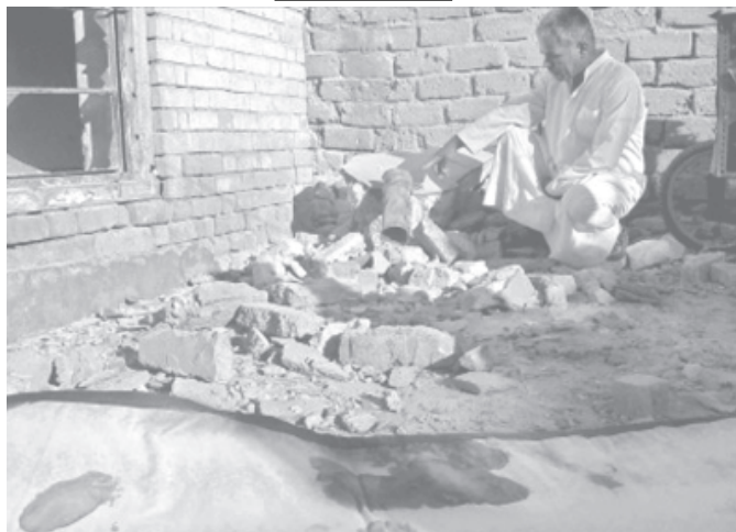
An Iraqi man points a mortar shell struck a house in the southern city of Basra on 23 May 2004. Five Iraqis, including two children, were killed by the explosion.