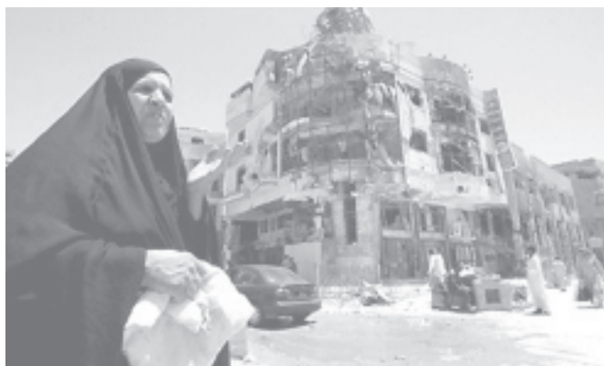
An Iraqi woman walks in front of a damaged hotel in the city of Karbala, south of Baghdad on 23 May 2004.