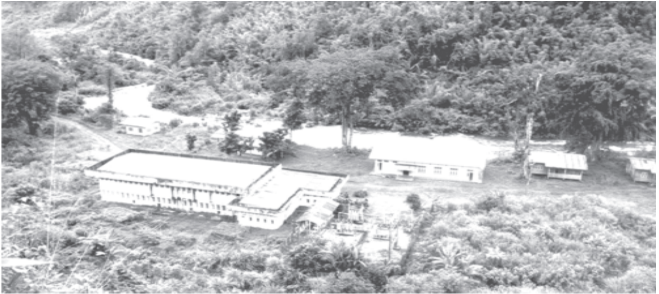
Kyeinkharankha hydro power station built in Myitkyina, Kachin State, is generating 25 kilowatt and supplying electricity to villages in the township.