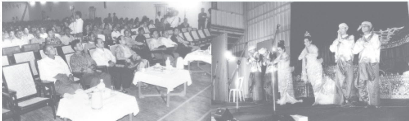
Chairman of National Convention Convening Commission Secretary-2 of the State Peace and Development Council Lt-Gen Thein Sein enjoys entertainment programmes presented to the delegates of National Convention at Nyaungnatpin, Hmawby.