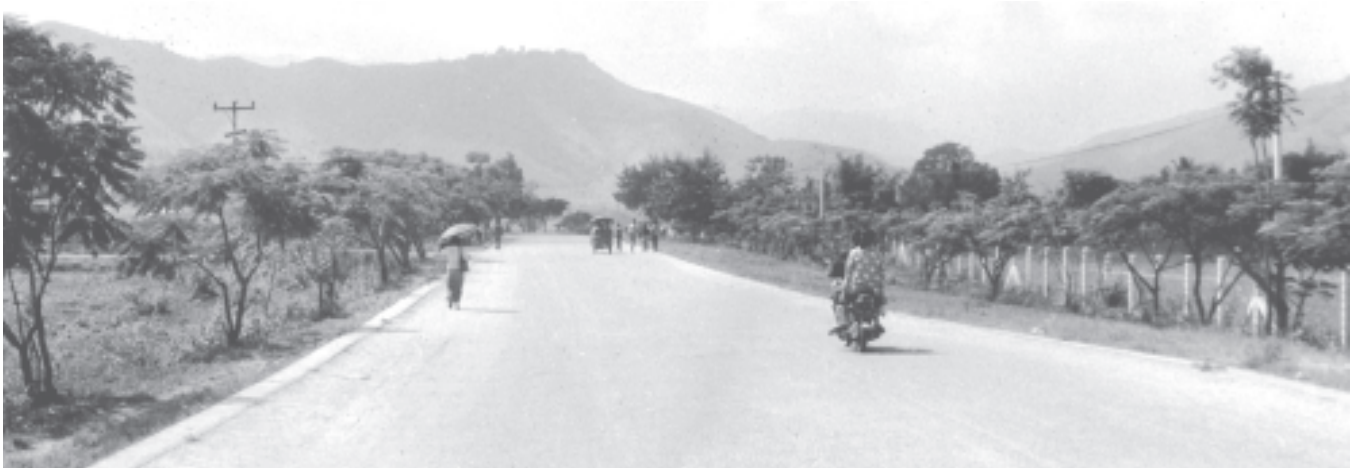
The government is striving day in, day out for better transportation throughout the country and people are now enjoying fruitful results of these endeavours. The photo shows the Union Highway at the entrance to Kengtung, Shan State (East).