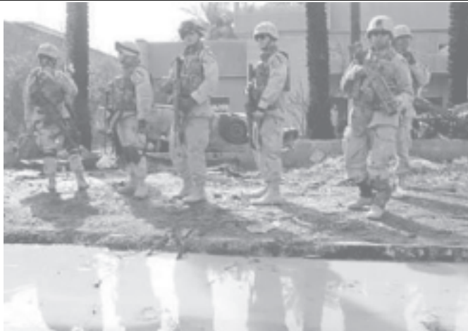
US Army soldiers secure an area after a car bomb blast in Baghdad, on 22 May, 2004. A car bomb in Baghdad killed at least five people and wounded a senior Interior Ministry official, five days after the head of Iraq's Governing Council was assassinated in a similar bombing.

Also Saturday, Lugar blamed the Bush and Clinton administrations for not adequately funding the foreign affairs budget, noting that the military's budget is more than 13 times what the nation spends for diplomacy.