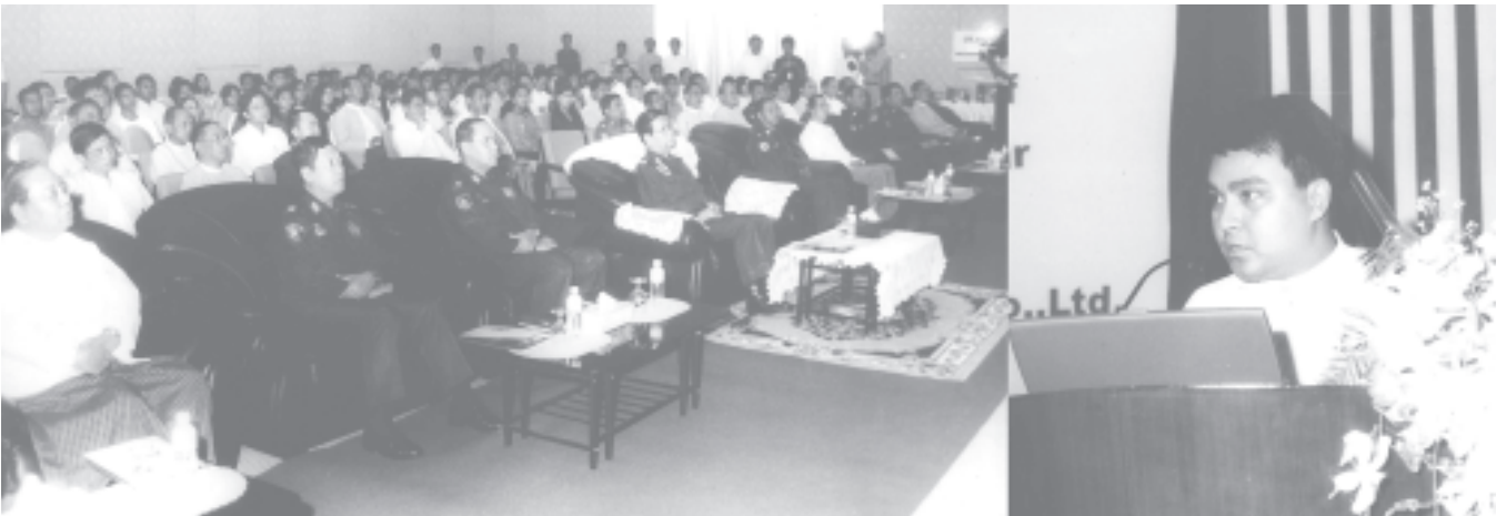
Prime Minister General Khin Nyunt attends ceremony to introduce Fortinet Intivirus Firewall. (News on page 16)—MNA