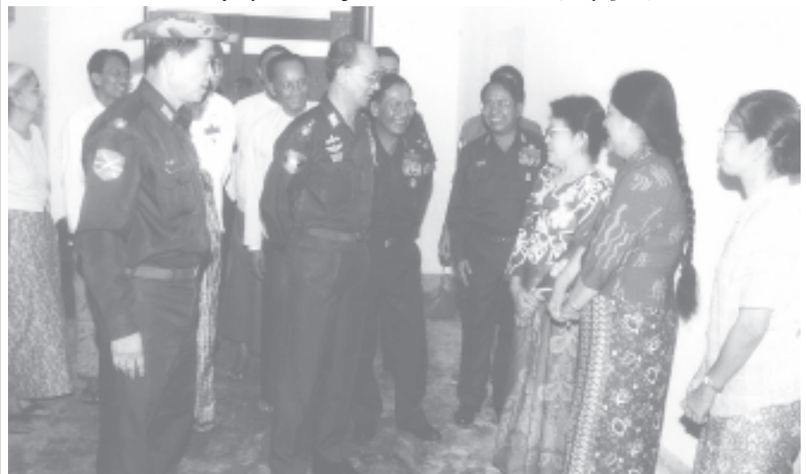
Chairman of the National Convention Convening Commission Lt-Gen Thein Sein cordially meets delegates to National Convention.