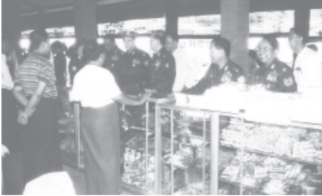
National Convention Convening Commission Chairman Lt-Gen Thein Sein inspects co-operative welfare shop at Nyaungnnapin Camp. — MNA