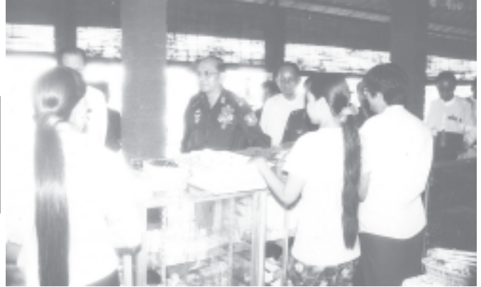
National Convention Convening Commission Chairman Lt-Gen Thein Sein inspects co-operative welfare shop at Nyaungnnapin Camp.