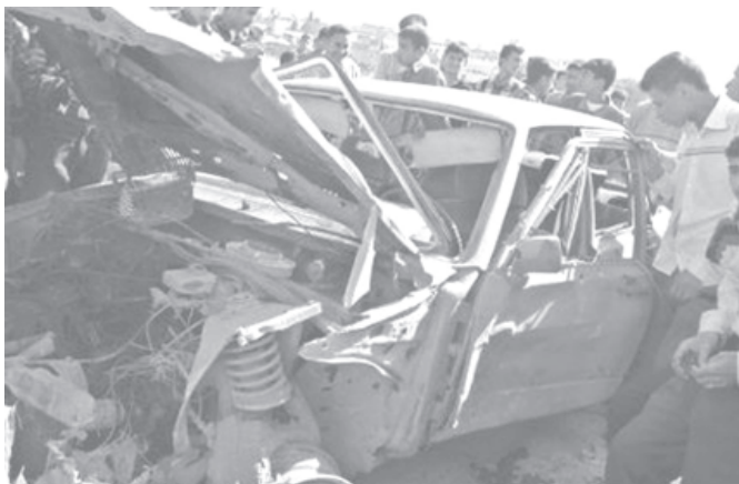
Iraqis survey a destroyed car after an improvised explosive device went off in a suburb of Mosul, on 14 May, 2004.