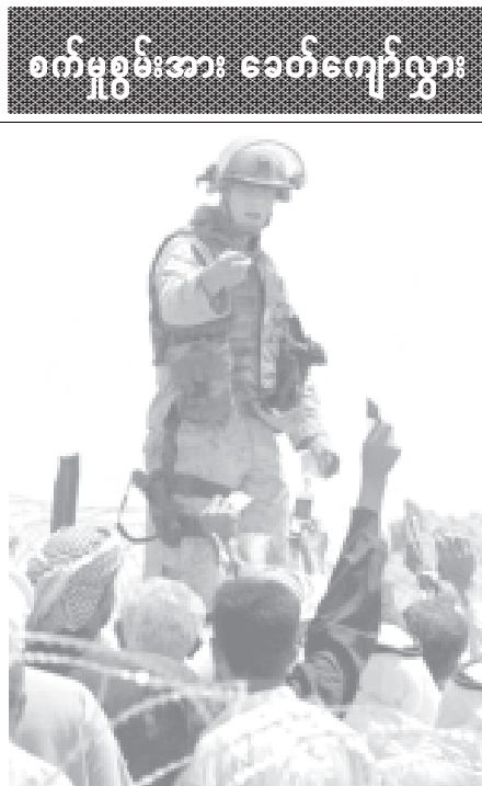
Iraqis raise appointment slips to visit prisoners to a US Marine standing guard outside the prison in Abu Ghraib, on the outskirts of Baghdad, Iraq, on 13 May, 2004.