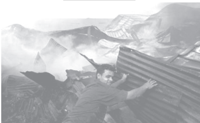
An Iraqi man places a sheet of metal to restrict fire from spreading in a storage depot following a mortar attack in Abu Ghraib in the outskirts of Baghdad, Iraq, on 15, May 2004.