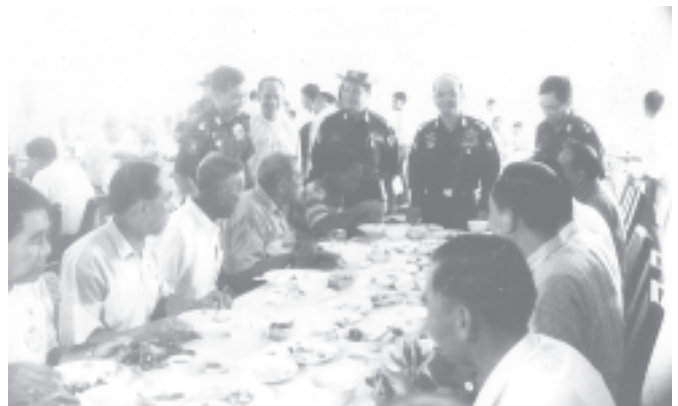
National Convention Convening Commission Chairman Lt-Gen Thein Sein inspects mess arrangements for National Convention delegates at Nyaungnnapin Camp.

Next, Lt-Gen Thein Sein and party greeted delegates of national races from Bago Division, Magway Division, Mandalay Division, Mon State and Rakhine State, other invited delegates from Shan State (South) Special Region-6, delegates of intellectuals and intelligentsia, delegates of State service personnel, delegates of national races from Bago Division and Taninthayi Division, delegates of political parties from Kokang Democracy and Unity Party, Union Pa-O National Organization, Mro (or) Khami National Solidarity Organization, Lahu National De-