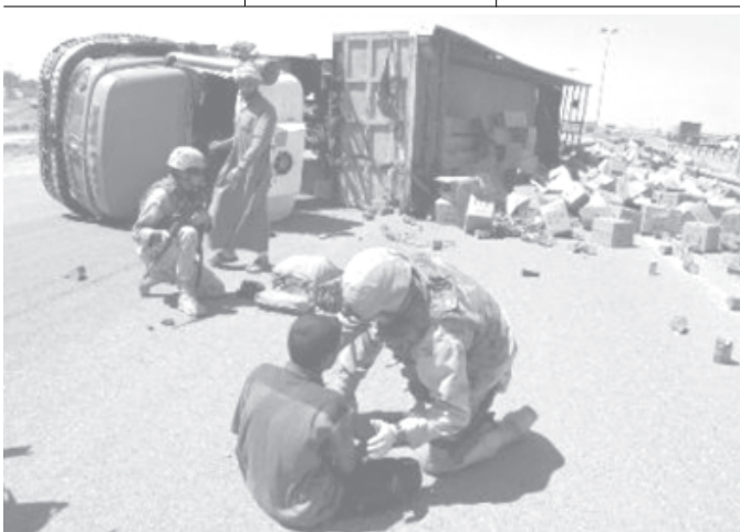
A US Army officer treats an injured Iraqi on the highway leading from Baghdad to Fallujah, Iraq, on 13 May, 2004, after a US Army tank hit their vehicle by accident.