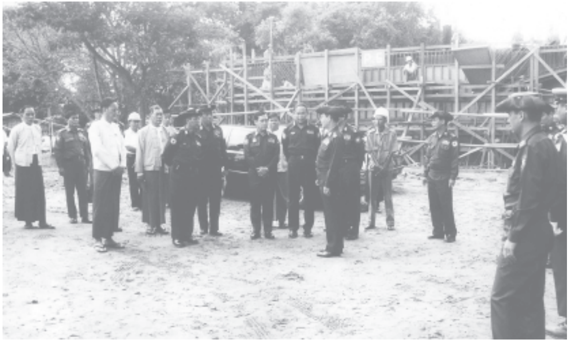
Prime Minister General Khin Nyunt inspects progress of building Parami Overpass.— MNA

ter inspected driving of piles and building of approach roads.