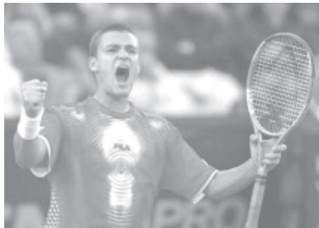
Mikhail Youzhny of Russia celebrates his victory against Florian Mayer from Germany, during the Hamburg Masters Tennis tournament on 13 May, 2004. Youzhny won the match 6-0, 7-6.

Bayern's preferred candidate to succeed Hitzfeld is Felix Magath, who is under contract at VfB Stuttgart for another season but might leave his club earlier. "We're waiting to see what decision Magath will make," said Beckenbauer.—MNA/Reuters