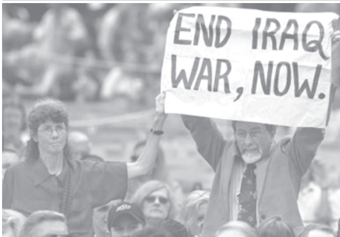
Audience members protest as National Security Advisor Condoleezza Rice speaks at Vanderbilt University, on 13 May, 2004 in Nashville, Tenn.

The statement did not give further details about the incident, saying that the release of more details could place the US soldiers at greater risk. — MNA/Xinhua