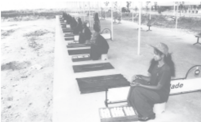
The golf course at the Nyaungnnapin Camp. — MNA

The delegates to the Convention were enjoying the entertainment programmes at Nyaungnnapin Camp, exercising at gymnasium and playing golf or shopping. — MNA