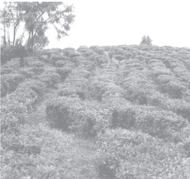
Tea plantation of local national race farmers in Silu region, Shan State (East).