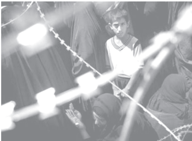
An Iraqi boy stands among women waiting for information about their relatives detained at Abu Ghraib prison outside Baghdad on 14 May, 2004.