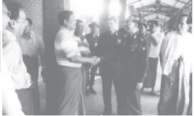
National Convention Convening Commission Chairman Lt-Gen Thein Sein cordially greets delegates to the National Convention at Nyaungnnapin Camp.