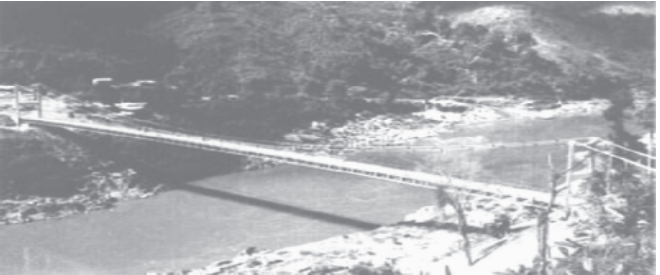
In the past, people living in Takawet region, Shan State (North) had to rely on ferries to cross the Thanlwin river. To overcome the natural barrier, the government has built Thanlwin Bridge (Takawet) and now, people can cross the river easily using the bridge.