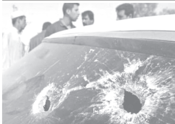
Iraqi men survey bullet holes on a car windscreen following fresh clashes between the US troops and members of the Shi'ite Mehdi army, in Najaf, on 13 May, 2004. —INTERNET

"Energy cooperation is crucial to bilateral ties. It is in the interest of both sides and enjoys promising prospects," Liu said. — MNA/Xinhua