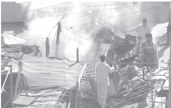
Iraqis try to extinguish a fire in the centre of Najaf, Iraq, on 14 May, 2004, as American tanks charged into the centre of the city and shelled positions held by fighters loyal to a radical cleric who launched an uprising against the US-led coalition last month.