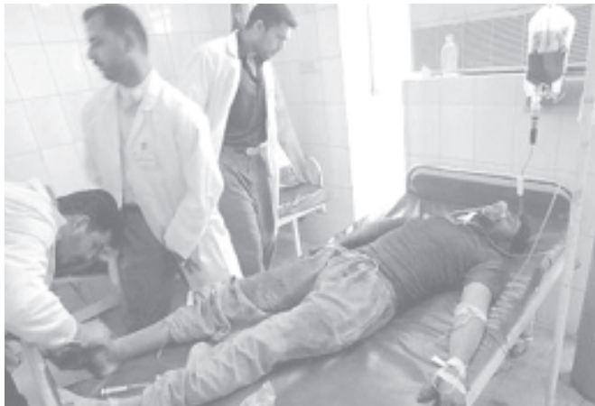
A badly wounded Iraqi man receives medical treatment in Najaf on 14 May 2004.