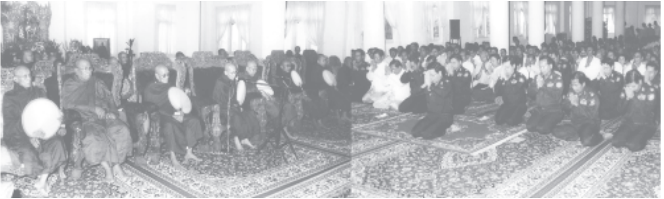
Prime Minister General Khin Nyunt and party receive Five Precepts from Sayadaw Bhaddanta Rajindabhivamsa.