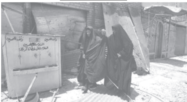
Iraqi women walk past destroyed shops following clashes between Iraqi guerillas and the US army, in Najaf, on 15 May 2004.