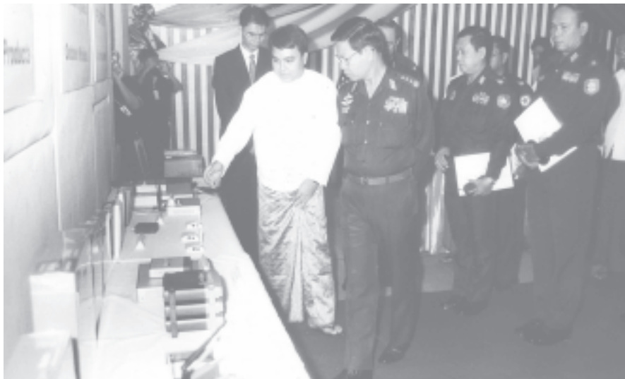
Prime Minister General Khin Nyunt views new products of Fortinet Antivirus Firewall.—MNA