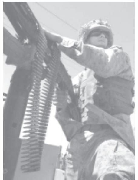
A US Marine from the 1st Battalion, 5th Marine Regiment, patrols in a Humvee in Kandari, Iraq, on 13 May, 2004.