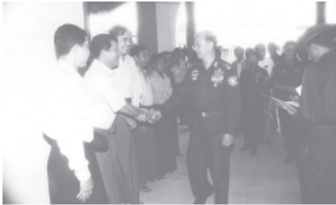
National Convention Convening Commission Chairman Lt-Gen Thein Sein cordially greets delegates to the National Convention at Nyaungnnapin Camp. — MNA