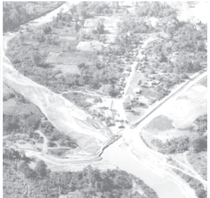
Kandawyan diversion weir built by the State in Waingmaw Township, Kachin State, benefits 12,000 acres of farmland in the region.