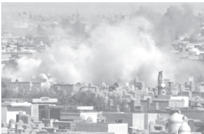
Smoke rises from a cemetery following an explosion during clashes in Najaf, on 14 May, 2004.