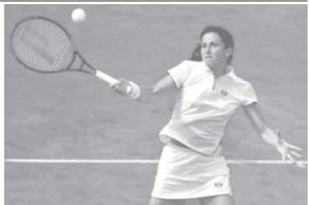
Italy's Silvia Farina Elia hits a forehand return to Russia's Maria Sharapova during their third round match at the Rome Masters WTA tournament on 13 May, 2004. Farina Elia won 7-6, 6-0.