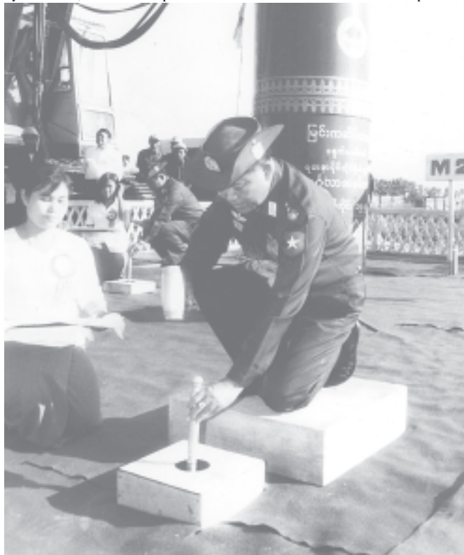
Lt-Gen Khin Maung Than drives stake for building Myinkaseik (Panmawady River) Bridge in Maungmya Township.