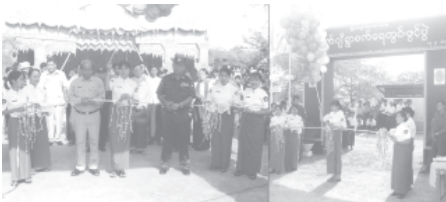
The opening ceremony of a rural tube-well in Zawgyi village, Singaing Township, in progress.

Later, the director-general and party went to Thazi and inspected the rural housing projects in Ywagyi village and Hlaingtet township. Next, they proceeded to Yecho village of Meiktila Township and inspected the rural housing projects. As guided by Head of State Senior General Than Shwe, the Development Affairs Department has built 685 rural low-cost houses in six Divisions during 2003-2004 fiscal year as the first phase. In Mandalay Division, it has built 149 rural houses in 16 townships, it is learnt. — MNA