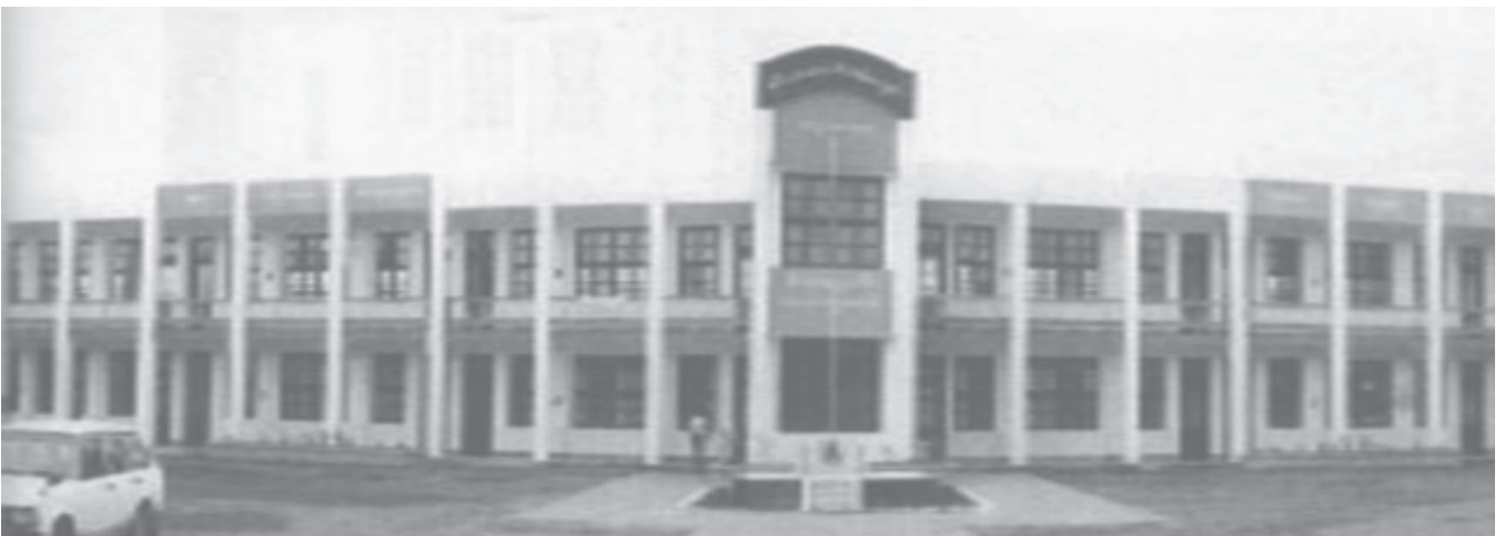
Students in Mongla Region, Shan State (East) are now able to pursue their education in their own region as a Basic Education High School has been built there.