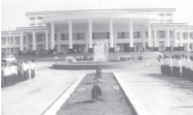
Opening ceremony of Mohnyin GTI being seen in Mohnyin on 10-2-2004.

Myitkyina and Bhamo, the main development regions of Kachin State, are making progress with the opening of universities and colleges. Being convinced that it also needs to establish degree colleges and government technical insti-