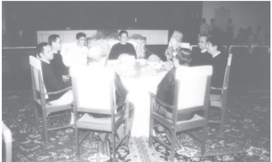
Prime Minister General Khin Nyunt addresses the dinner hosted in honour of outstanding Red Cross members. — MNA