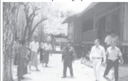
Director-General Col Myo Myint inspects the low-cost housing project in Sansu village, Chauk Township. MNA

The rural low-cost housing projects are being implemented in accordance with the guidance of the Head of State. There are 4 low-cost houses being built in Koesu village and 6 houses in Sansu village. Each house is built at a cost of K 700,000. So far, 52 such houses have been built in seven townships in Magway Division. — MNA