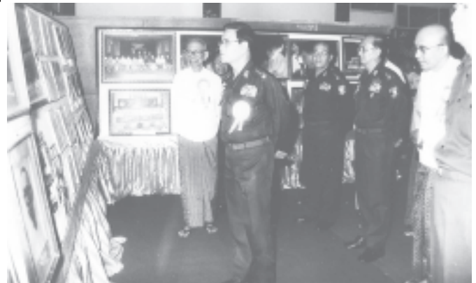
Prime Minister General Khin Nyunt views photos of activities of MWJA.