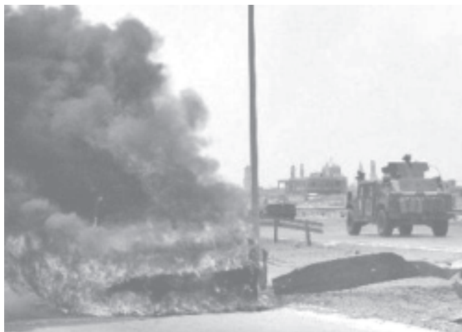
A US Army vehicle drives by a burning car after a two car convoy came under attack in Baghdad, Iraq on 8 May, 2004.

Such bomb attacks, usually aimed at the security forces or foreigners, are not infrequent in Baghdad. On Thursday, a suicide car bomber killed five Iraqis and a US soldier outside the headquarters of the US-run administration.