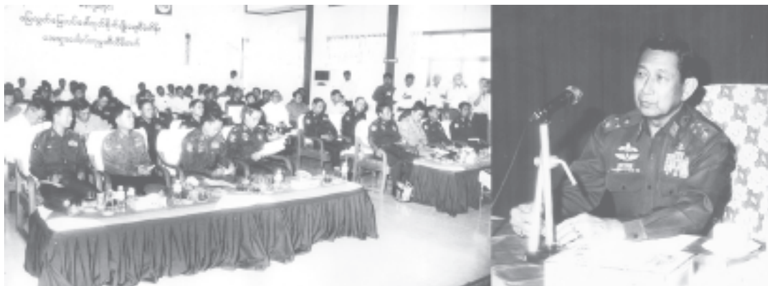
Vice-Senior General Maung Aye meets with officials at the briefing hall of Asia World Co Ltd in Salin Township, Magway Division.

Afterwards, they looked into Pyi Lone Kyaw agricultural project of Htoo Trading Co Ltd in Pwintbyu Township. Officials reported on permission granted by the government for land reclamation for agricultural purpose, cultivation of sesame, pigeon pea, cotton, thitseint (belleric myrobalan), mango, plum and thanakkha (limonia acidissima), and arrangements for irrigation of the plantations. Officials of Dagon International Ltd reported on conditions of land reclaimed in Chaungzon region, Yappokgyi, Pwintbyu