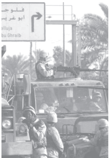
US Army soldiers stand guard on the highway leading from Baghdad to Fallujah, Iraq on 8 May, 2004.