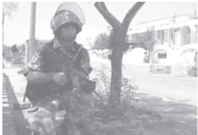
A British soldier waits during clashes with militiamen loyal to Shiite Muslim radical leader Moqtada Sadr who roamed the city of Basra firing shots at troops as their battle with the US-led coalition spread to British-controlled southern Iraq, on 8 May, 2004.

The operation on Kubi, a 422-pound ape, was the first of its kind and took nearly five hours to complete on Friday. A team of surgeons and veterinarians at the University of California San Francisco donated their time to save the animal, which has spent its entire life at the San Francisco Zoo. In recent years, Kubi has suffered a chronic cough and lung infections that did not respond to drugs. Recently his condition escalated to pneumonia and doctors said he would not have lived without the surgery. When they opened the ape, they found his right lung was almost completely non-functional. The operation was considered extremely risky and doctors had cautioned there was a 30-per-cent chance the gorilla would not survive the surgery.