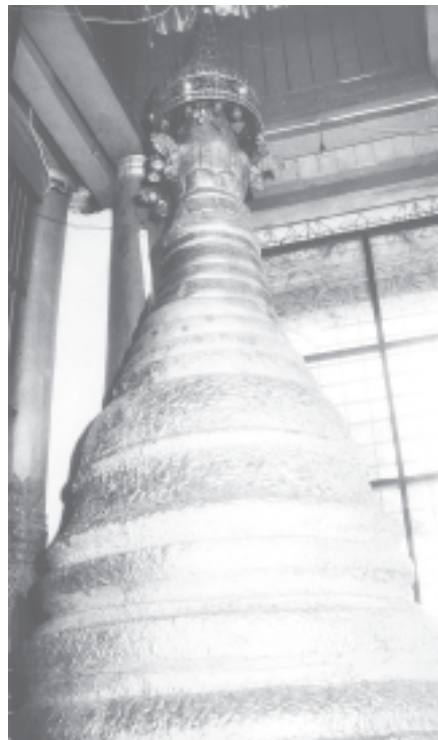
Vice-Senior General Maung Aye and wife Daw Mya Mya San pay homage to the Ahtetsettawya Pagoda in Minbu (Saku) Township, Magway Division.