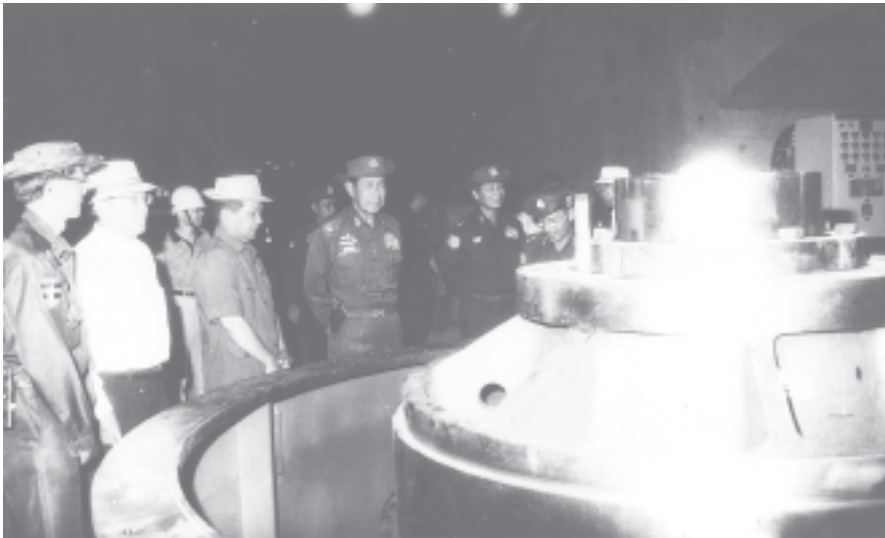
Vice-Senior General Maung Aye inspects the power station of the Paunglaung Hydel-power Project. — MNA