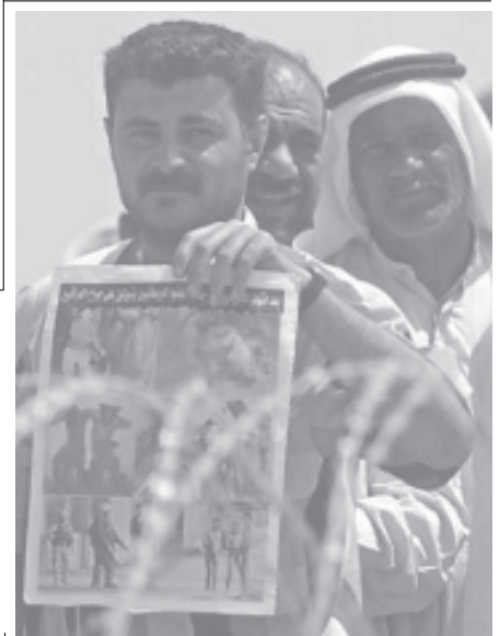
An Iraqi man, outside the Abu Ghraib prison, near the Iraqi capital Baghdad, on 8 May, 2004, displays a newspaper with pictures of abused Iraqi prisoners.