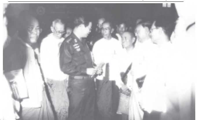
Prime Minister General Khin Nyunt cordially greets doyen literati.

Nowadays, the government, based on the national strength and force, is step by step implementing the seven-point policy programme that will raise the prestige of the nation and enable it to stand tall among the nations of the world as an independent