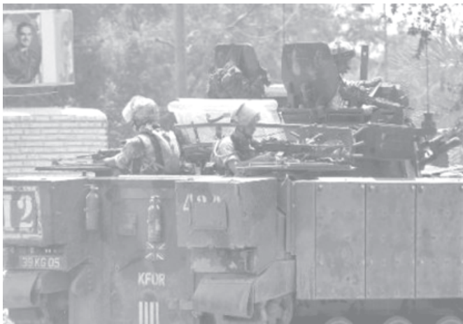
A British Army vehicle patrols the centre of Basra, southern Iraq, after gunmen loyal to radical Shiite cleric Muqtada al-Sadr attacked British patrols and government buildings, on 8 May, 2004.—INTERNET

The court martial could be held in the heavily guarded Conference Centre to give media maximum access, Kimmit said. — MNA/Reuters