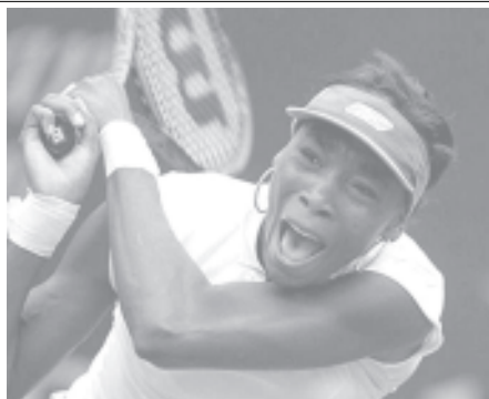
Venus Williams returns a ball to Karoline Sprem from Croatia in the half-final of the German Open WTA tennis tournament in Berlin on 8 May, 2004.