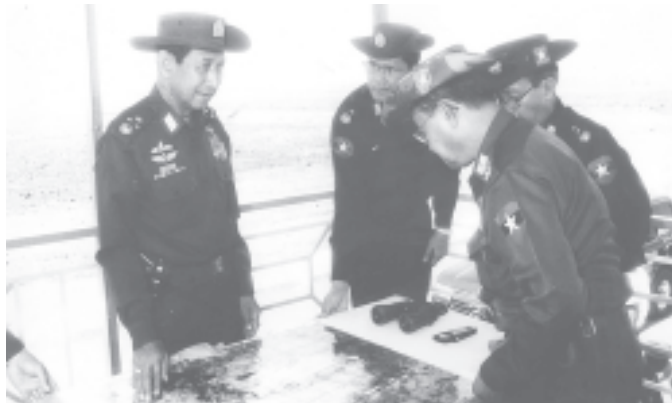
Vice-Senior General Maung Aye inspects Tatmadaw cotton farm (Pwintbyu).

the farm, its aim, and plans to put 10,000 acres of land under cotton.