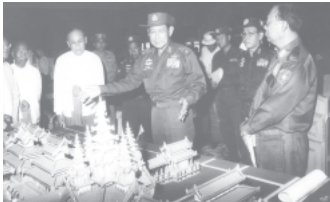
Vice-Senior General Maung Aye inspects the scale model of Arimaddanapura Bagan golden palace.

Vice-Senior General Maung Aye and party proceeded to Paunglaung Multi-purpose Dam Project. On the occasion, Minister Maj-Gen Nyunt Tin reported on progress in constructing the dam and spillway; Deputy Minister U Myo Myint, on