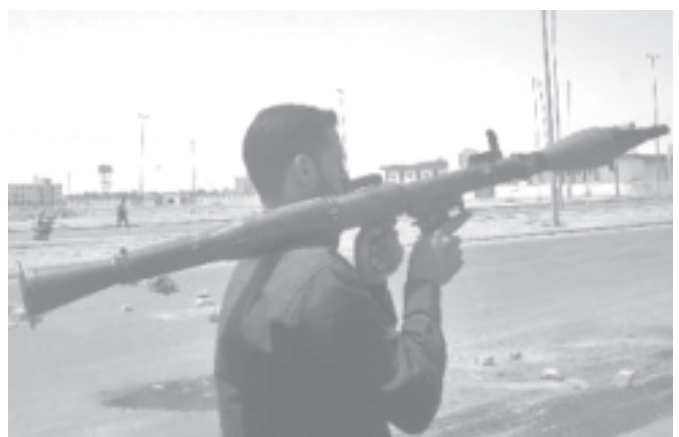
Gunmen loyal to radical Shiite cleric Muqtada al-Sadr take position in the centre of Basra, southern Iraq on 8 May, 2004.