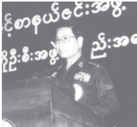
Prime Minister General Khin Nyunt addresses the third meeting of the Central Body of Myanmar Writers and Journalists Association