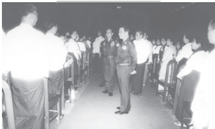
Prime Minister General Khin Nyunt cordially greets teachers at the opening of Seminar on Promotion of National Education (Yangon). — MNA

Learning Centres. Out of the 619 Learning Centres, 548 are established in basic education schools. As the basic education system has been planned and implemented harmoniously