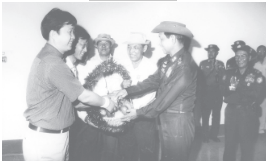
Vice-Senior General Maung Aye presents a gift to Chinese experts at the Mone Creek Hydel-Power Plant.