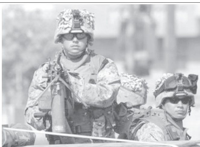
A US Marine convoy passes through Kharma, Iraq, on Sunday, 9 May, 2004. Fifteen detainees were transported in a truck to Kharma by US Marines after being released from the Abu Ghraib Prison.