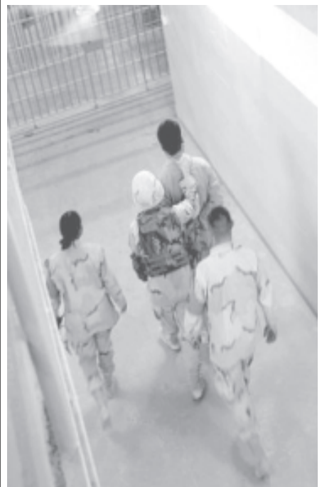
A US military intelligence officer leads an Iraqi detainee to an interrogation room in the Abu Ghraib Prison on the outskirts of Baghdad, Iraq, on 8 May, 2004.