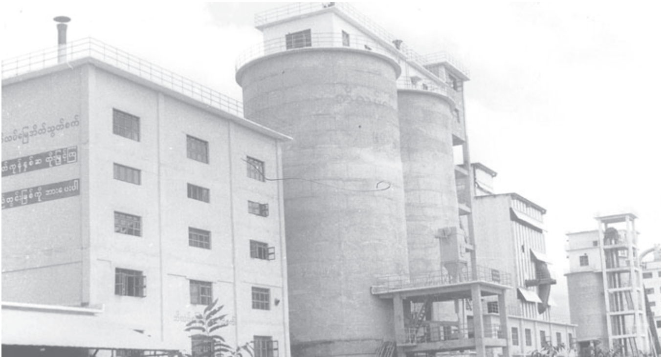
The 500-ton cement plant in Kyaukse Township, Mandalay Division.