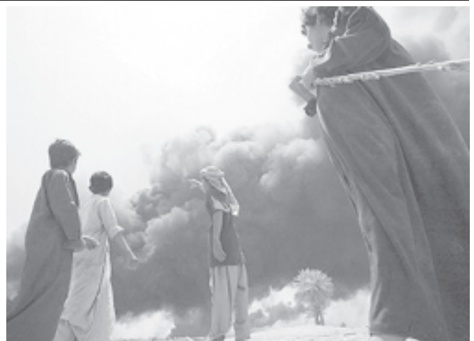
Iraqi children look at a burning pipeline on the road leading from Baghdad to the city of Karbala on 8 May, 2004.