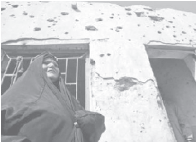
An Iraqi woman stands in front of a damaged house after a gunbattle between US forces and Iraqi guerillas, in the city of Kufa, on 7 May 2004.