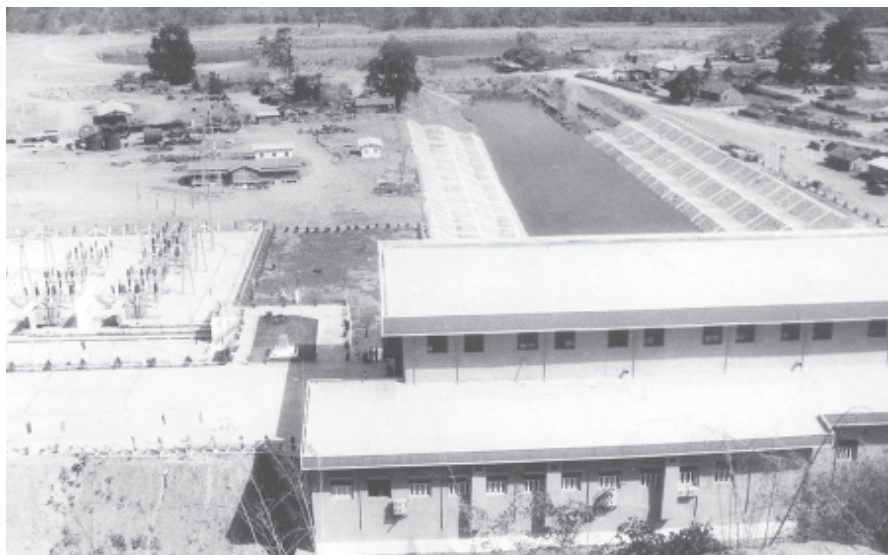
Mone Creek Hydel Power Project in Sedoktara Township, Magway Division.

Other displayed items at the trade fair will be the automobiles produced by the industrial zones.