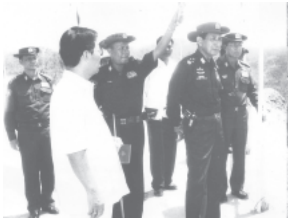
Vice-Senior General Maung Aye inspects Kyeohn Kyeewa Dam Project on Mone Creek in Pwintbyu Township.