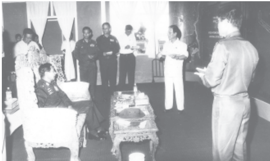
Vice-Senior General Maung Aye meets with officials in his inspection tour of Kyeohn Kyeewa Dam Project in Pwintbyu Township.