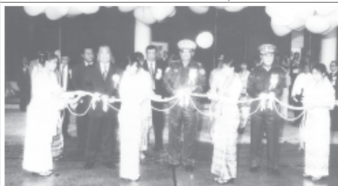
Minister Brig-Gen Thein Zaw, Minister Maj-Gen Hla Myint Swe and Dr Prasert Prasarttong Osoth formally open Bangkok-Yangon-Bangkok air route. — MNA

Brig-Gen Thein Zaw, Maj-Gen Hla Myint Swe and Dr Prasert Prasarttong Osoth formally opened the new Bangkok-Yangon-Bangkok air route. The newly-opened air route will be operated daily with Boeing 717-200 capable of carrying 125 passengers. — MNA