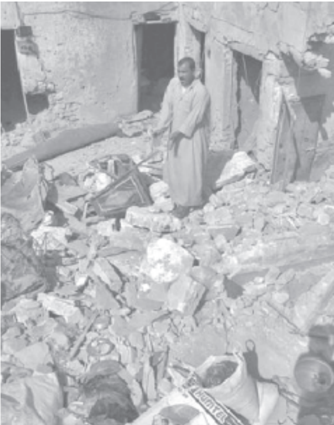
An Iraqi man stands in the rubble of his destroyed house in Kufa, near Najaf, on 7 May 2004. The house was damaged after US soldiers clashed with Iraqi guerillas in the city of Najaf.