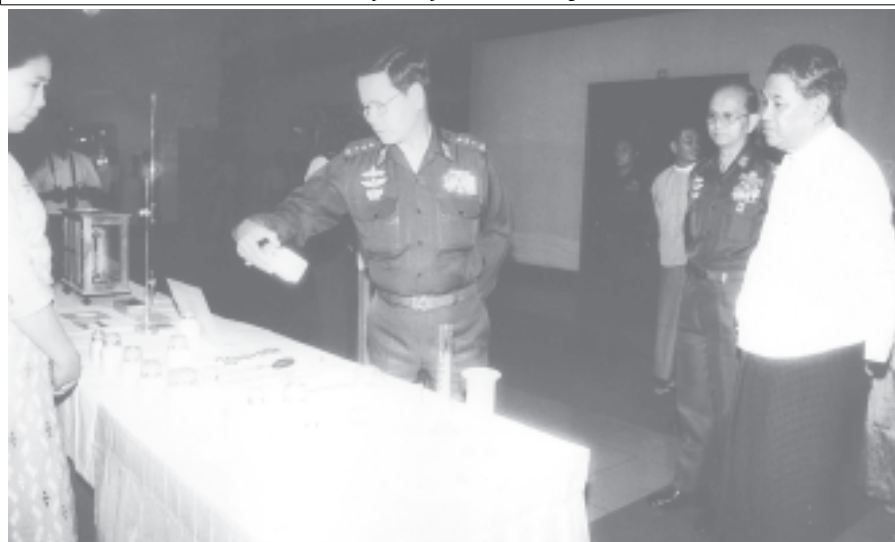
Prime Minister General Khin Nyunt views laboratory equipment.

tor-General of the Government Office U Soe Tint and Director-General of the Protocol Department Thura U Aung Htet.