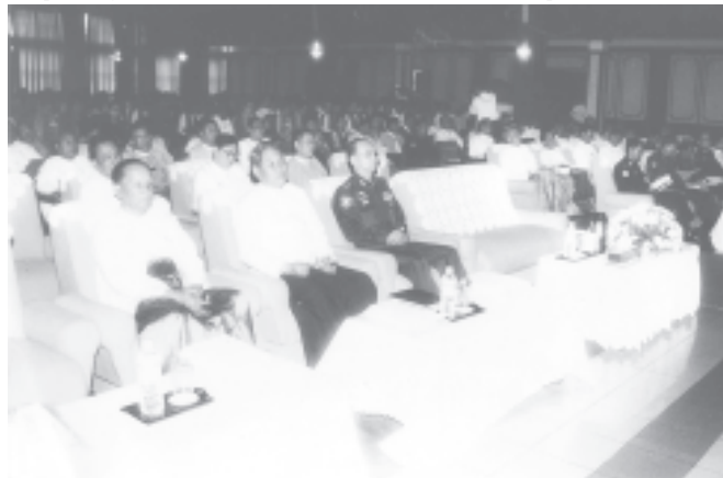
Prime Minister General Khin Nyunt addresses the opening of the Seminar on Promotion of National Education (Yangon).

Make township-wise efforts for sufficient water supply (Page 2)