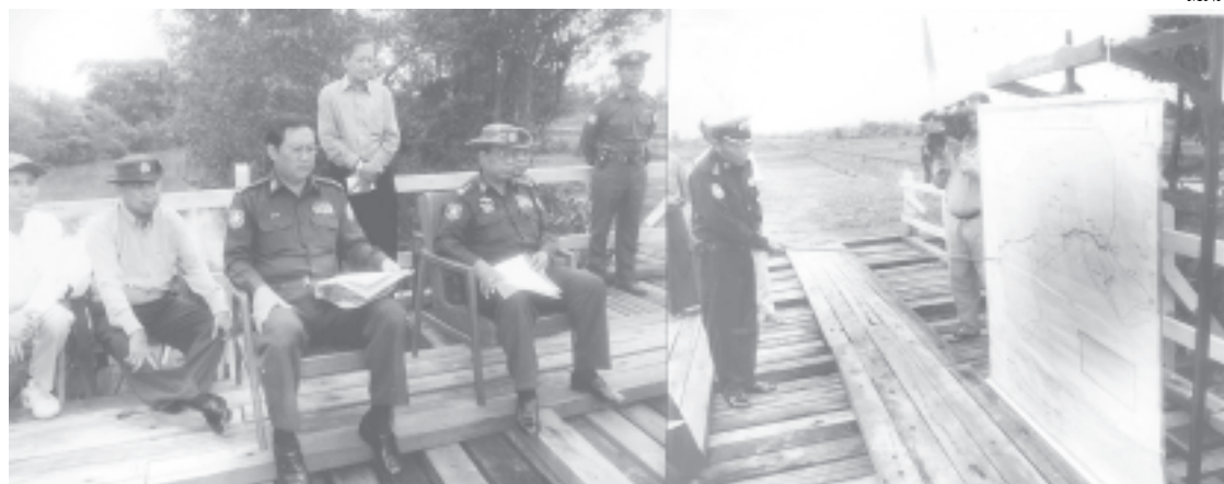
Lt-Gen Maung Bo and party inspect Kyonphe Creek Bridge Construction Project in Hpa-an Township, Kayin State.