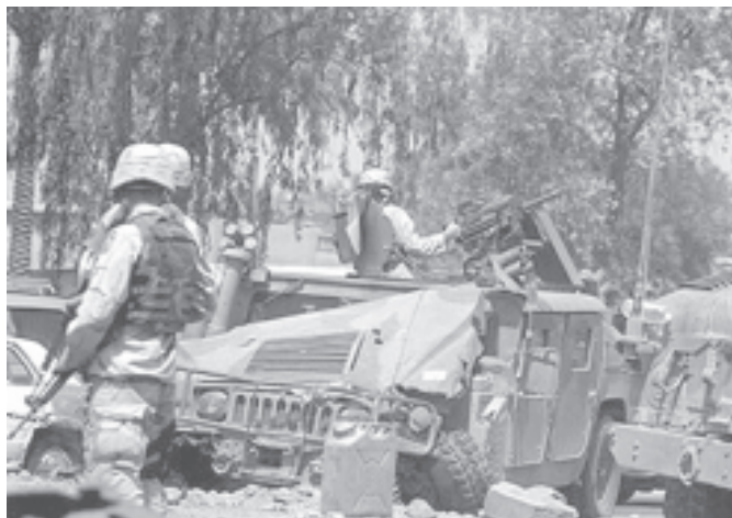
US soldiers secure the area on 8 May, 2004, where a Humvee was attacked by an improvised explosive device (IED) in a road in the southern part of Baghdad.

"It is not about interference, but about International Law," the commissioner added.