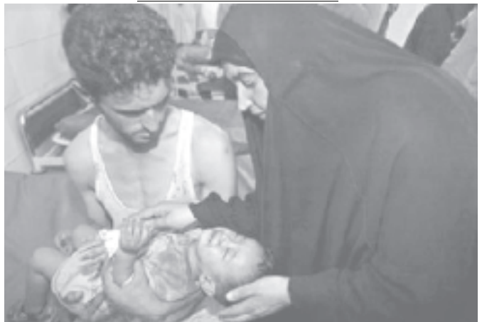
A wounded Iraqi girl is taken by her parents to the hospital in the city of Najaf, on 6 May 2004.