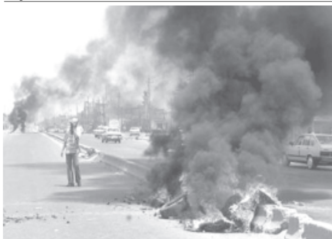
Tires are set on fire as Iraqis block the entrance to the mostly Shiite populated 'Sadr city' district of Baghdad, Iraq, on 9 May, 2004, after US Army forces arrested several Iraqis in this district.