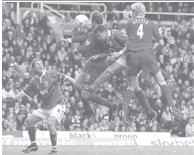
Liverpool's Dietmar Hamann (2nd L) and Sami Hyypia (R) jump for a header against Birmingham City's Matthew Upson (2nd R) as captain Kenny Cunningham looks on during their Premiership football match at St. Andrews in Birmingham on 8 May, 2004.