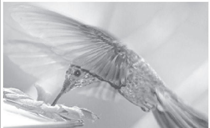
A hummingbird drinks water with honey from a drinking-trough in Mexico City. Fossils of the world's oldest known modern hummingbird were unearthed in Germany, the first discovery of ancient skeletons of the tiny nectar-sucking bird outside the American continent, the journal Science said.

While the new bridge takes shape in the area, the 100-year-old Luohu Bridge has been moved to the Hong Kong side for exhibition as a cultural relic. The century-old bridge has played a key role in connecting Shenzhen and Hong Kong since it was built.