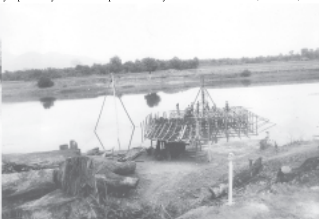
Lt-Gen Maung Bo and party inspect Paingkyon Creek Bridge Construction Project linking Paingkyon lower and upper villages.