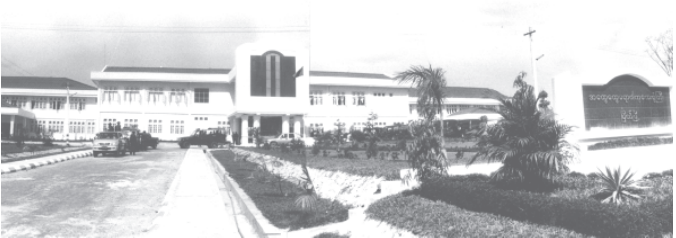
The newly-constructed 200-bed General Hospital (Myeik) in Taninthayi Division.