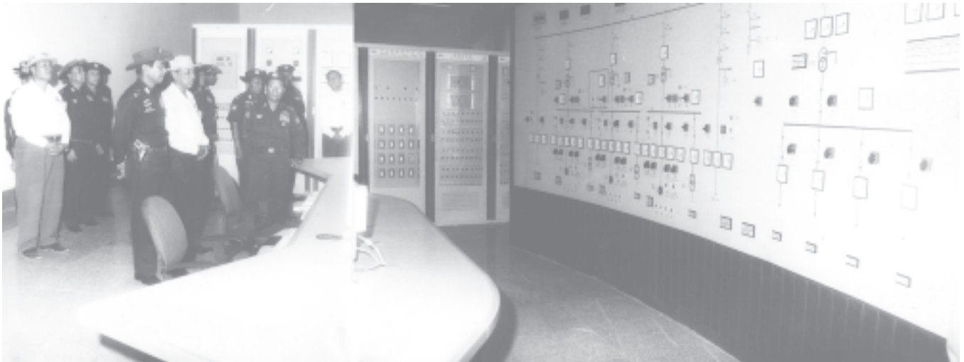
Vice-Senior General Maung Aye inspects the Mone Creek Hydel-power Project.