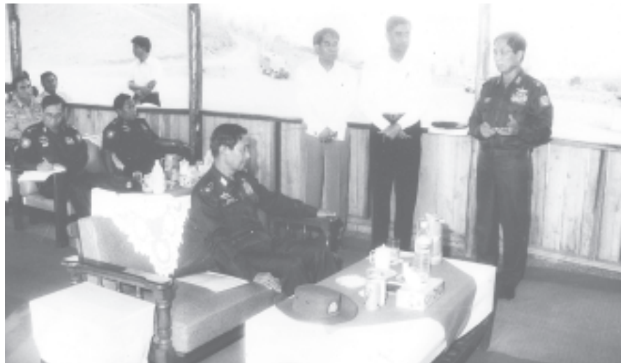
Vice-Senior General Maung Aye hears a report on Bu Village Dam Project presented by Minister for Agriculture and Irrigation Maj-Gen Nyunt Tin. (News on page 1) — MNA