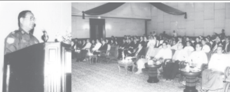
Minister Brig-Gen Pyi Sone speaks at the opening of the 8th Meeting of the Task Force on CEPT-AFTA Rules of Origin.