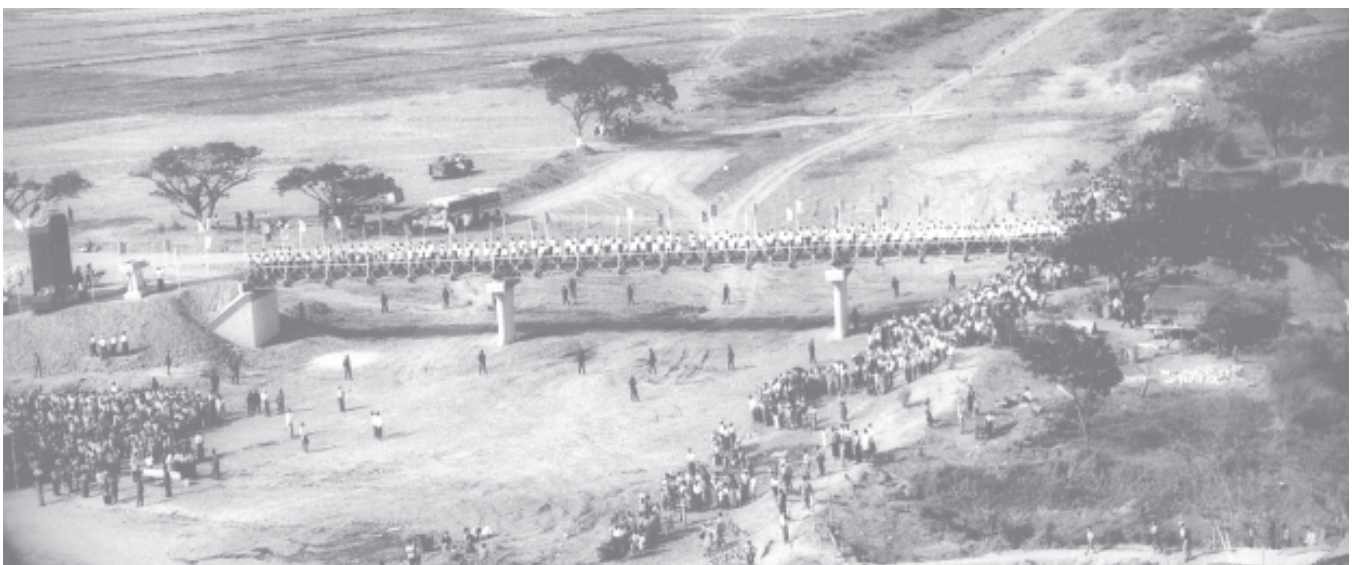
Newly opened Saddan Yadana Bridge in Neikban Village, Kawa Township, Bago Division.