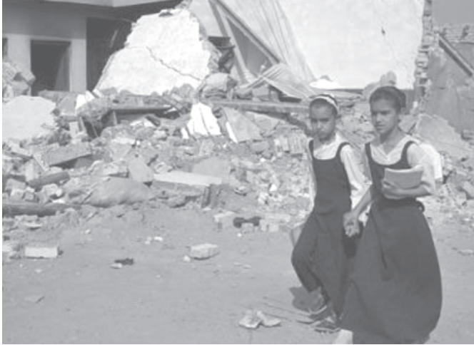
Iraqi schoolgirls pass the damaged building after a US aircraft destroyed it, in Baghdad, Iraq, on 10 May 2004.