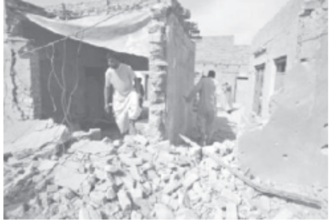
Iraqi men survey destroyed houses, following the clashes between US army and Iraqi guerillas in the southern city of Kufa, on 9 May 2004.