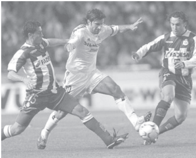
Real Madrid's Portuguese player Luis Figo, center, tries to dribble the ball between Deportivo la Coruna's Joan Capdevila, left, and Sergio Gonzalez during a Spanish league soccer match in A Coruna, Spain, on 1 May, 2004.