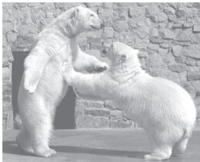
Polar bears Bering and Sedov play in the spring sun at St Petersburg's Zoo, on 19 April, 2004. Over 100 polar bears have been born in the St Petersburg's Zoo in the last 70 years.