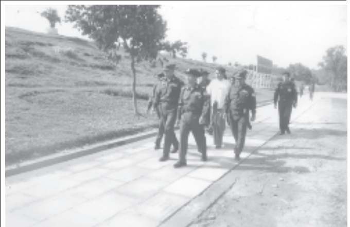
Commander Maj-Gen Myint Swe and Mayor Brig-Gen Aung Thein Lin inspect road upgrading tasks.