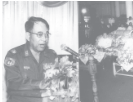
Minister Brig-Gen Maung Maung Thein delivers a speech at the forming of Myanmar Prawn Entrepreneurs Association.