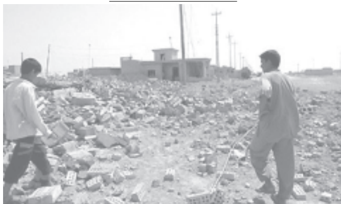
Two Iraqi children walk on the rubble of destroyed houses in a street of Fallujah's al-Shuhada neighborhood on 2 May 2004.