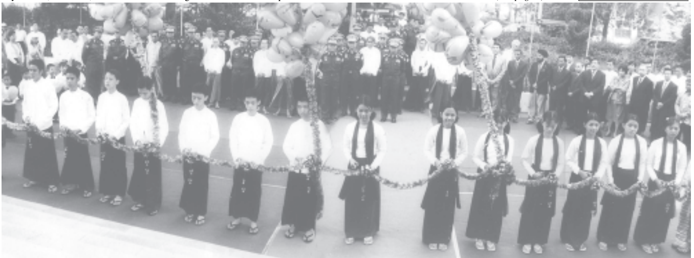
Fourteen students from Dagon Township BEHS No 1 formally open the exhibition on implementation of the Special Four-Year National Education Promotion Plan from 2000-2001 to 2003-2004 fiscal years.