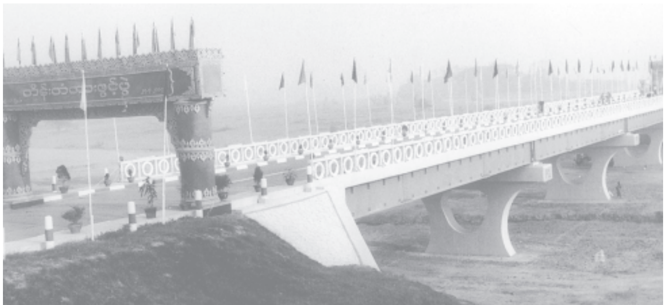
Newly opened Tein Bridge seen on Monywa-Yagyi-Kalaywa Road in Mingin Township.