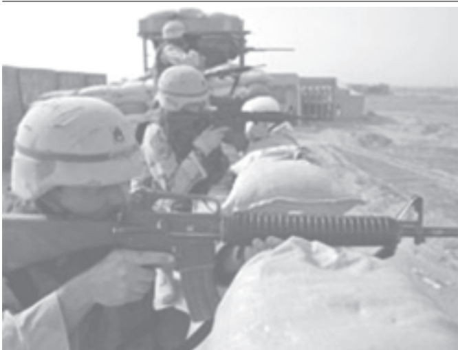
US soldiers ready their weapons aimed at a Mahdi army target in Najaf, Iraq on Monday.

On Tuesday, another group of prisoners will be released from Abu Ghraib. No one doubts lots of people will want to hear their stories.— Internet