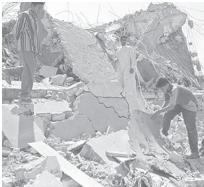
Iraqis sift through the rubble of a destroyed building in Fallujah on 1 May.