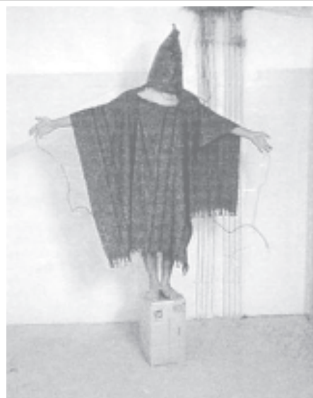
A hooded and wired prisoner is seen at the Abu Ghraib prison near Baghdad, Iraq in this undated photo.

"The unhappy fact is that these will almost certainly not be the last such snapshots of war," it added.