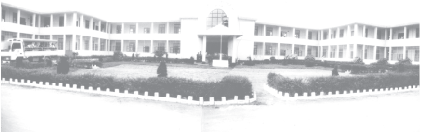
Nursing and Midwifery Training School in Kengtung, Shan State (East).