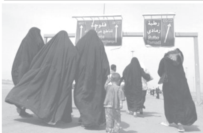
Iraqi women walk towards Fallujah, Iraq, west of Baghdad, Iraq, on 28 April, 2004.