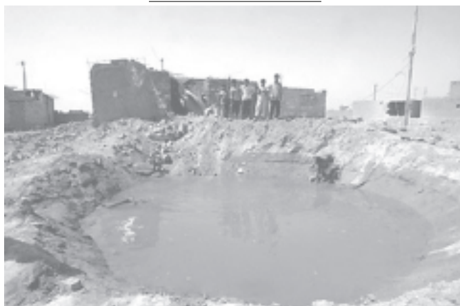
Iraqi children look at a crater left after US forces shelled the Fallujah's al-Shuhada neighbourhood on 2 May 2004.