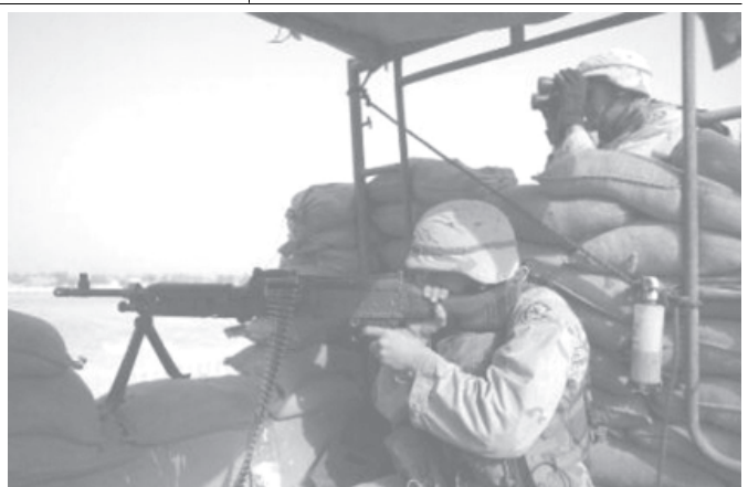
A US soldier from the 2nd Armed Cavalry Regiment readies a machine gun as another looks out for guerillas in Najaf, Iraq, on Monday 3 May, 2004.