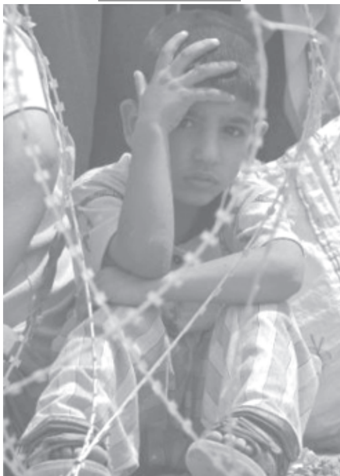
An Iraqi child waits with his family to pass through a US military checkpoint to return to his home in Fallujah, Iraq, west of Baghdad, on 29 April, 2004.