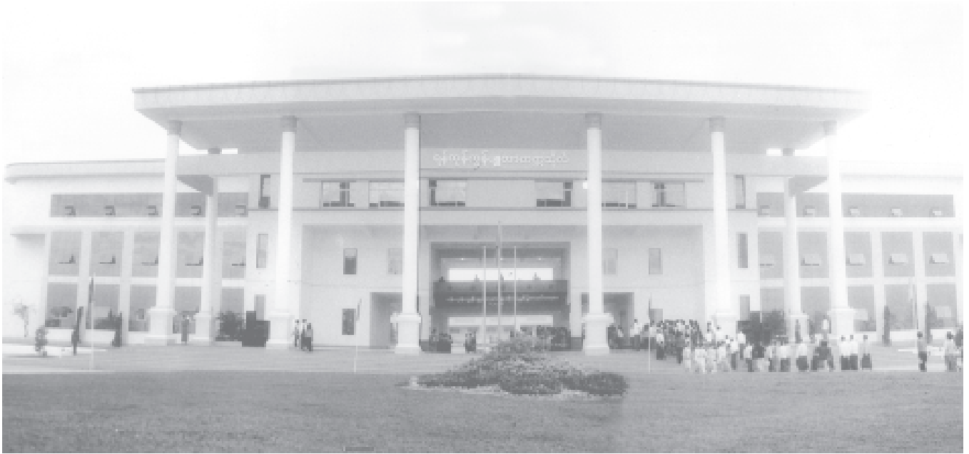
Newly opened main building of University of Computer Studies in Shwepyitha Township, Yangon.