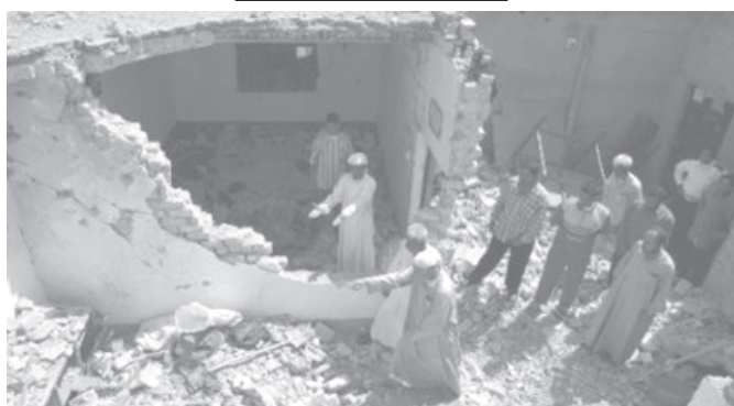
Iraqis react while searching through the rubble of their house, which was shelled by a mortar during a fight between Iraqi guerillas and U.S troops, in Fallujah, Iraq, on 2 May, 2004.