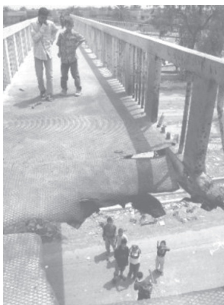
Iraqi children watch a damaged bridge after an attack on US Army forces passing by at the airport road in Baghdad, Iraq, on 3 May, 2004.