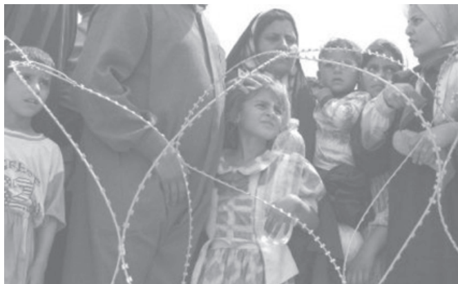
Iraqis wait to pass through a US military checkpoint to return to their homes in Fallujah, Iraq, west of Baghdad, on 28 April, 2004.