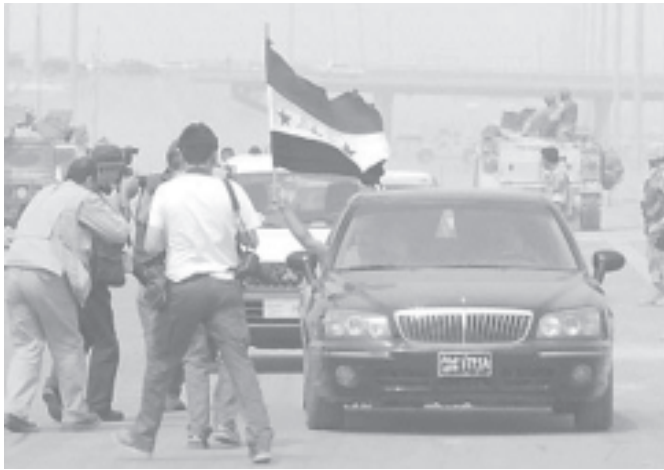
Journalists and photographers rush to get quotes and take pictures in Fallujah. War has made Iraq the most dangerous country for a reporter to work.

Six soldiers were also pulled out after doctors decided they suffered from "combat stress" — a result of heavy fighting in Karbala in the first week of April.