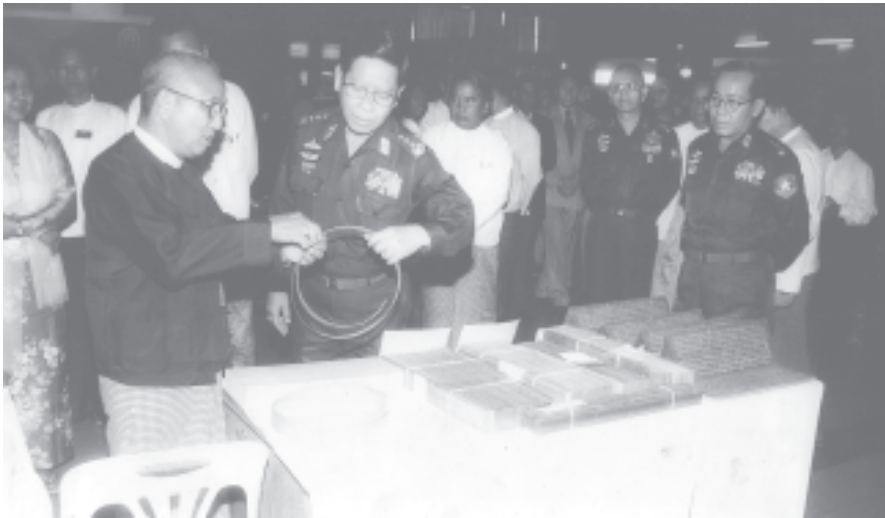
Prime Minister General Khin Nyunt views a booth of the exhibition.