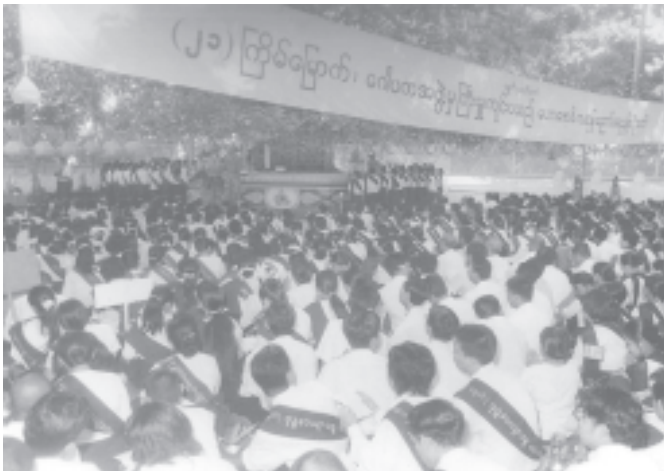
The 21st Ceremony for pouring water at Bo tree on Shwedagon Pagoda held on 3 May.