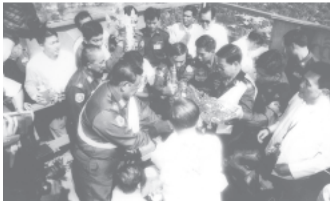
Prime Minister General Khin Nyunt offers Hngetmyatnadaw and Seinbudaw and sprinkles scented water on them atop Thabyinnyu Stupa.