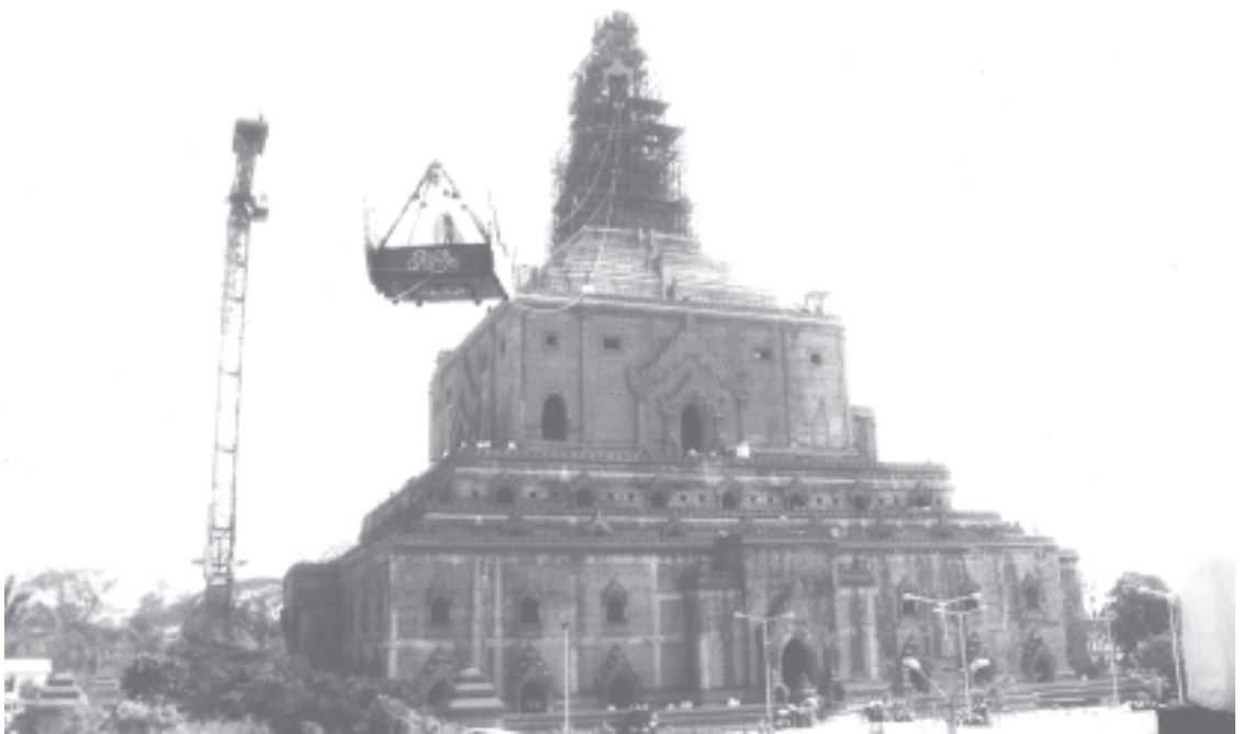
Chairman of the State Peace and Development Council Commander-in-Chief of Defence Services Senior General Than Shwe and party hoist tiers, Hsathwaphudaw, Hngetmyatnadaw and Seinbudaw atop Thabbyinnyu Stupa through a decorated carriage.

The ceremony was graced by the presence of State Ovadacariya Sayadaws, member Sayadaws of State Sangha Maha Nayaka Committee, members of Central Working Committee of the Sangha, Theravada Ovadacariya Sayadaws, Tipitakadhara Tipitakakovida Sayadaws, academic and administrative Sayadaws of State Pariyatti Sasana University (Yangon), Pro-Rector Sayadaw of International Theravada Buddhist Missionary University, Chairman Sayadaw of Yangon Division Sangha Nayaka Committee and