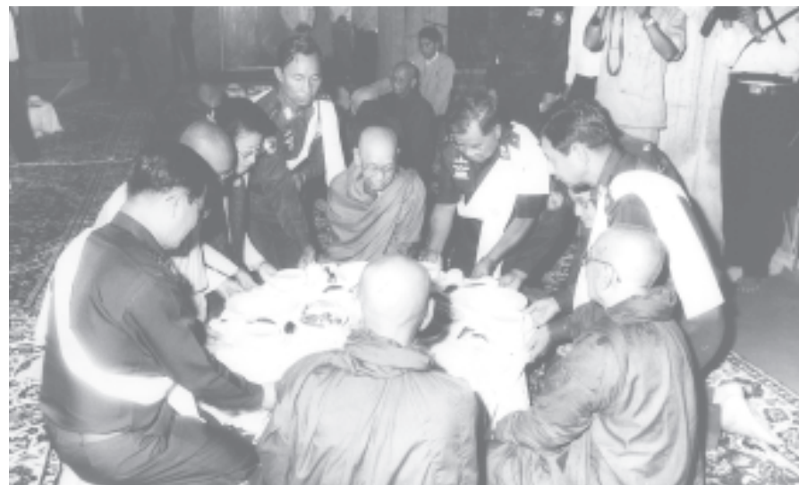
Senior General Than Shwe and party offer 'soon' to Sayadaws.

Shwe Mann and wife, Secretary-1 Lt-Gen Soe Win and wife, Secretary-2 Lt-Gen Thein Sein and wife, members of the State Peace and Development Council and their wives, deputy ministers and wellwishers led by Senior General Than Shwe hoisted 1st tier of Shwehtidaw atop the stupa through a decorated carriage.