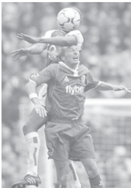
Arsenal's captain Patrick Vieira (top) outjumps Robbie Savage of Birmingham during their football Premier League match at Highbury in north London on 1 May, 2004.

LONDON, 3 May — Leicester City were condemned to relegation after one season in the Premier League on Saturday despite a 2-2 draw at Charlton Athletic following Manchester City's 1-0 home win over Newcastle United.