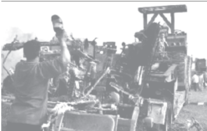
An Iraqi man beats with his shoe a smouldering US Army military truck outside the city of Amarah, southern Iraq, on Sunday, 2 May, 2004. Two American soldiers were killed in the attack when Shiite militiamen blasted their convoy with small arms fire and rocket-propelled grenades near the southern city of Amarah.