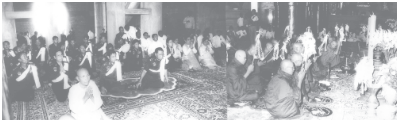
Sayadaws consecrating the Buddha images at the Shwehtidaw hoisting ceremony.