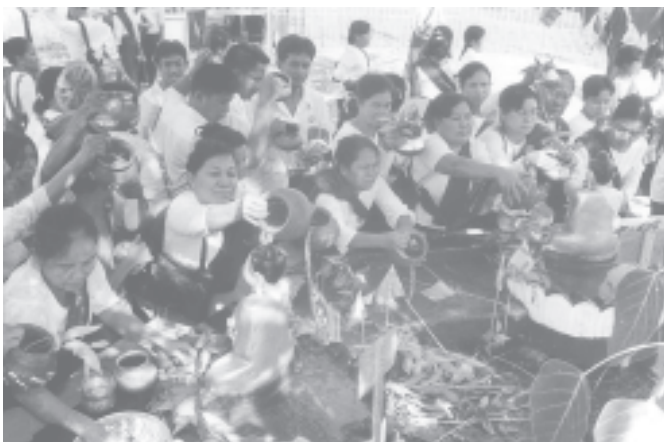
Buddhists pour water at Bo tree on Maha Wizaya Pagoda on 3 May.