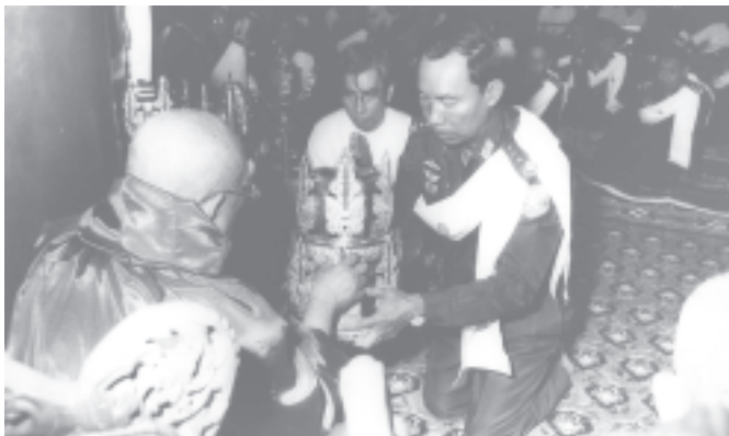
General Thura Shwe Mann presents offertories to a Sayadaw.