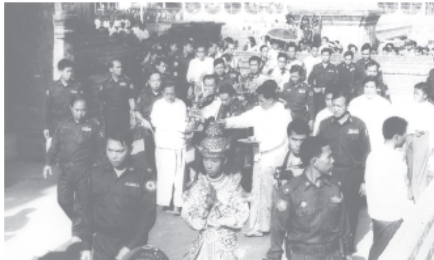
Senior General Than Shwe conveys the Seinbudaw at the Shwehtidaw hoisting ceremony.