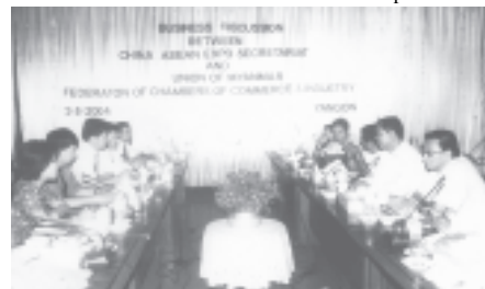
Business discussion between China ASEAN Expo Secretariat and Union of Myanmar Federation of Chambers of Commerce & Industry in progress.

And they discussed matters pertaining to business cooperation, Myanmar entrepreneurs' participation in China-ASEAN Expo to be held in Nanning, Guangxi, the PRC, from 3 to 6 November and other arrangements for the expo.