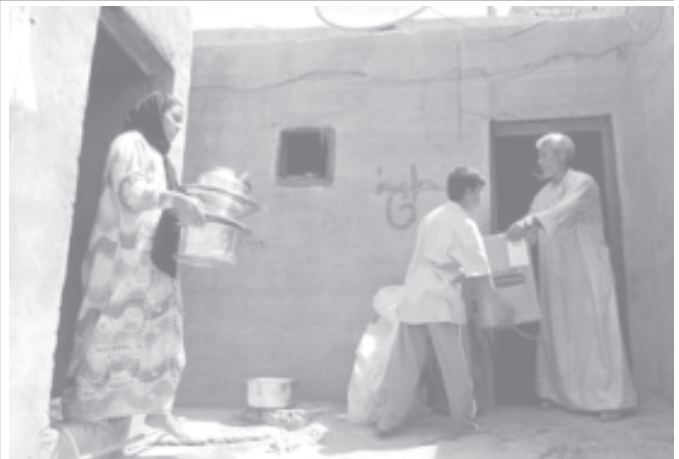
An Iraqi family returns with their belongings to their home in Fallujah, 37 miles, (60 kilometres) west of Baghdad, Iraq, on 2 May, 2004. — INTERNET

He said the transitional government will soon meet all the parties in the country in order to arrive at an agreement on the country's Constitution that will pave the way for elections. Accompanied by his Minister of External Relations and Cooperation and Minister of National Defence, Ndayizeye concluded his one-day working visit to Uganda on Friday. — MNA/Xinhua