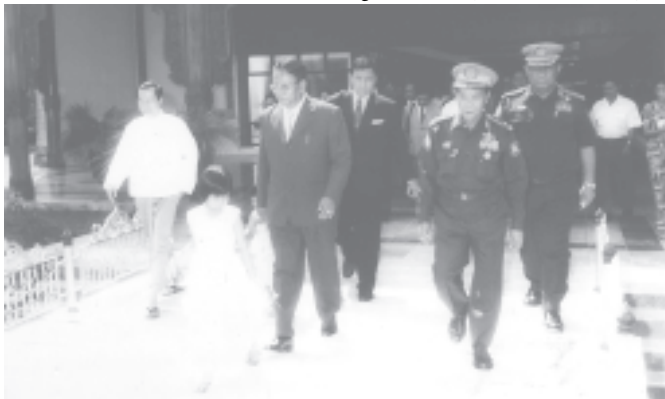
Myanmar delegation led by Minister for Industry-1 U Aung Thaung being seen off at Yangon International Airport.