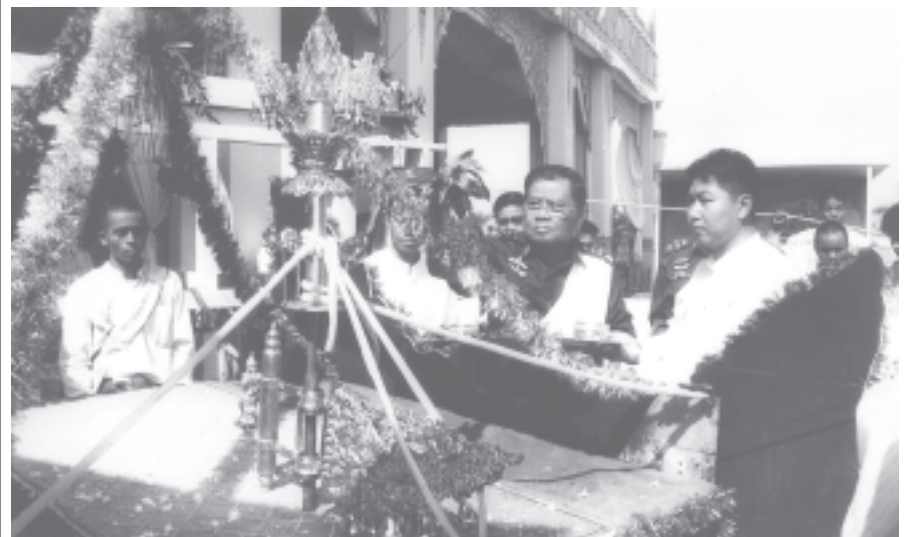
Chairman of the State Peace and Development Council Commander-in-Chief of Defence Services Senior General Than Shwe sprinkles scented water on tiers of Shwehtidaw, Hsathwaphudaw, Hsaemyatnadaw and Seinphudaw. (News page 1)