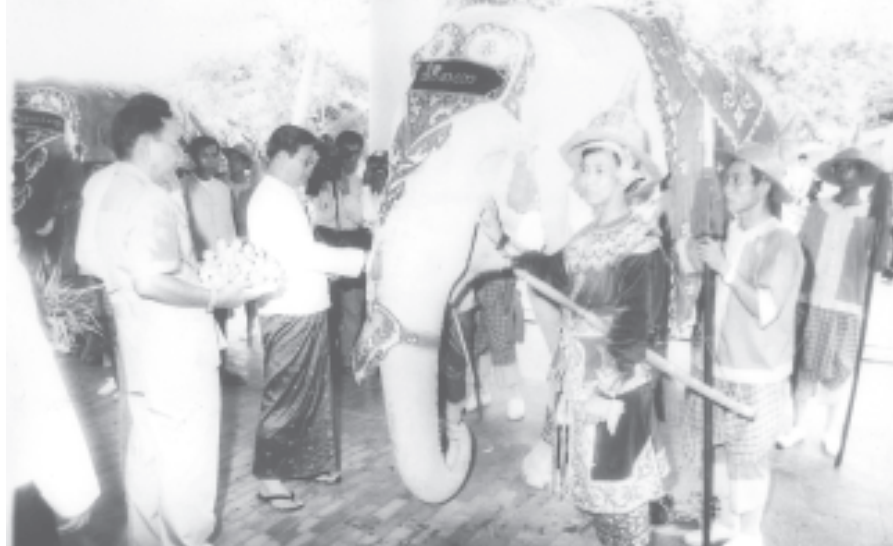
Prime Minister General Khin Nyunt feeds white elephants.