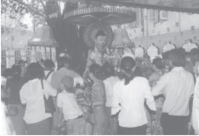
Buddhists pour water at Bo tree on Sule Pagoda on 3 May.