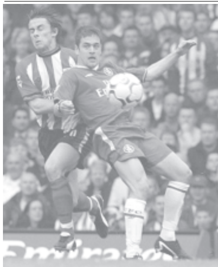
Chelsea's Joe Cole (R) battles Southampton's David Prutton for the ball, at Chelsea's ground Stamford Bridge in London on 1 May, 2004.