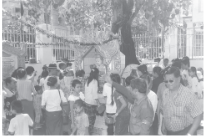
Buddhists pour water at Bo tree on Shwephonepint Pagoda on 3 May.