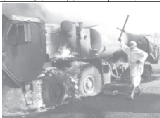
An Iraqi man holds a stick as he approaches a burning US Army military truck outside the city of Amarah, southern Iraq on 2 May, 2004.