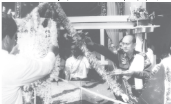
Secretary-2 Lt-Gen Thein Sein of the State Peace and Development Council sprinkles scented water on Htidaw, Hngetmyatnadaw and Seinbudaw atop Thabyinnyu Stupa.