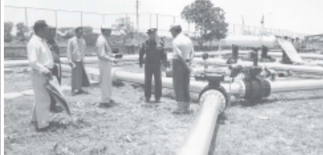
Minister for Energy Brig-Gen Lun Thi inspects new 14-inch natural gas pipeline at natural gas distribution station (Ywama) in Insein Township. — MNA

In the evening, Minister Brig-Gen Pyi Sone hosted a dinner to the guests at the Karaweik Palace. — MNA