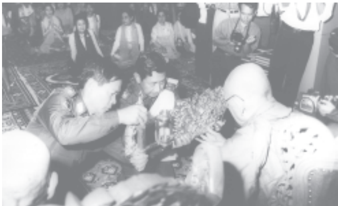
Deputy Commander-in-Chief of Defence Services Commander-in-Chief (Army) Vice-Senior General Maung Aye offers Hngetmyatnadaw and offertories to a Sayadaw.