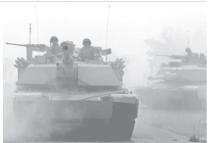
US forces withdraw to the edges of Fallujah at the end of April 2004. — INTERNET