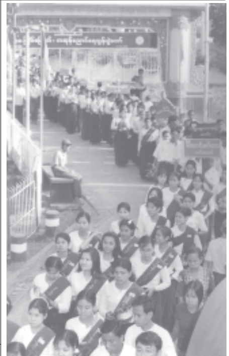
Religious Associations at Maha Wizaya Pagoda to pour water at Bo tree on the pagoda on 3 May.

The best time to plant a tree was 20 years ago.