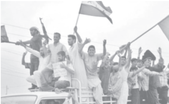
Residents of Fallujah celebrate on top of a truck in the centre of Fallujah, Iraq on 2 May, 2004.