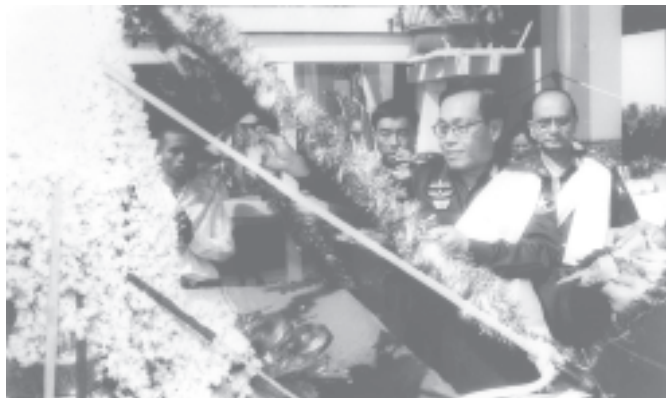
Secretary-1 Lt-Gen Soe Win of the State Peace and Development Council sprinkles scented water on Htidaw, Hngetmyatnadaw and Seinbudaw atop Thabyinnyu Stupa.