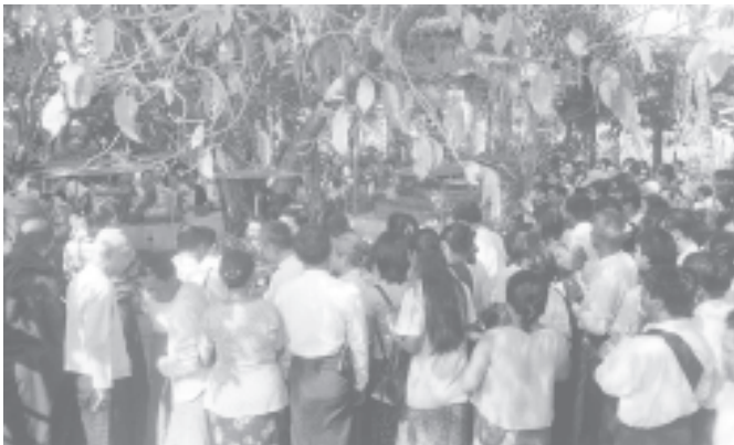
Buddhists pour water at Bo tree on Botahtaung Pagoda on 3 May.