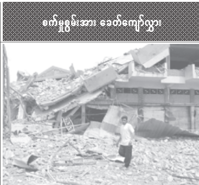
Occupation forces destroyed several homes during the siege on Fallujah in late April 2004.

negotiating an end to the guarding process." A Defence Ministry spokesman said discussions about ending the German Army's policing of US bases had been going on since the start of the year.