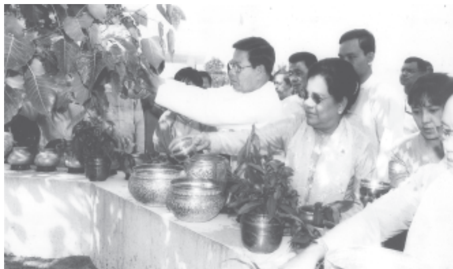
Prime Minister General Khin Nyunt and wife Dr Daw Khin Win Shwe pour water at the Bo tree on Mindhamma Hill on 3 May.