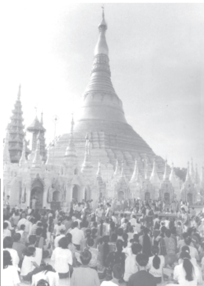
Shwedagon Pagoda thronged with Buddhist pilgrims on 3 May (Fullmoon Day of Kason).

Next, the third ceremony to pour water at Bo Tree followed on Mindhamma Hill (See page 10)