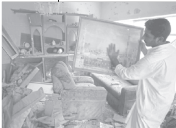
A man recovers his belongings in his damaged home in Fallujah on 2 May, 2004.