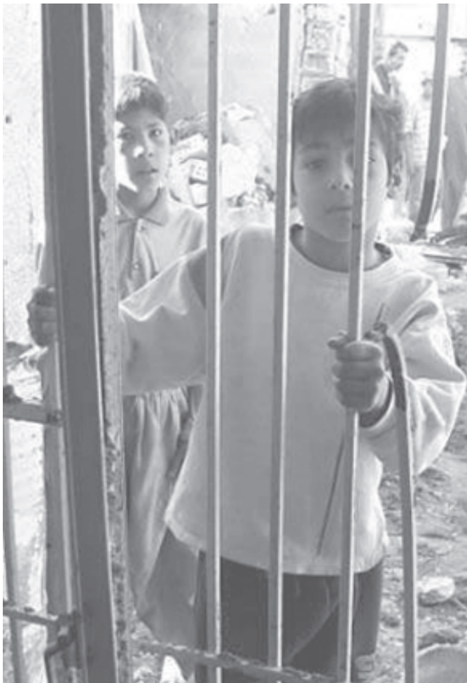
Iraqi youths look at the damage to a house caused by a helicopter gunship strike on the restive town of Fallujah on 6 April, 2004.