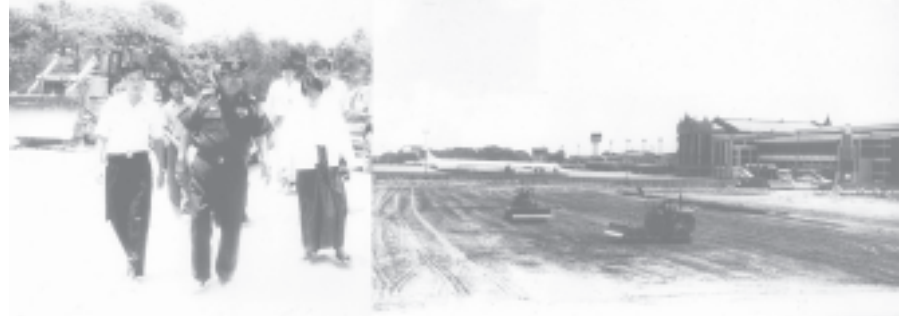
Minister for Transport Maj-Gen Hla Myint Swe inspects the airport extension work. — TRANSPORT

The commander and the mayor gave necessary instructions. Similar tasks were also undertaken in North Okkalapa, Dagon Myothit (East), (South), (Seikkan) and (North), Thakayta, Tamway, Dawbon, Thingangyun, Sangyoung, Dagon, Pabedan, Lanmadaw, Bahan and Ahlon townships. — MNA