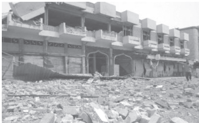
The rubble of a building that was shelled by a mortar during a fight between Iraqi guerillas and US troops in Fallujah, Iraq, seen on 30 April, 2004.