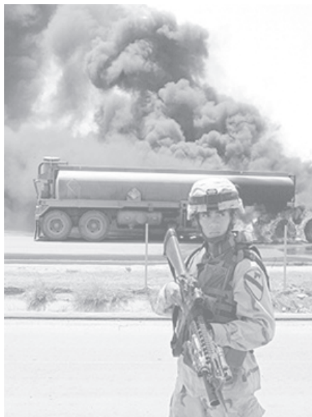
Hostile fire : A US soldier secures the area where a military petrol tanker was attacked by a rocket propelled grenade at the al-Gazalieh area in Baghdad on 1 May.