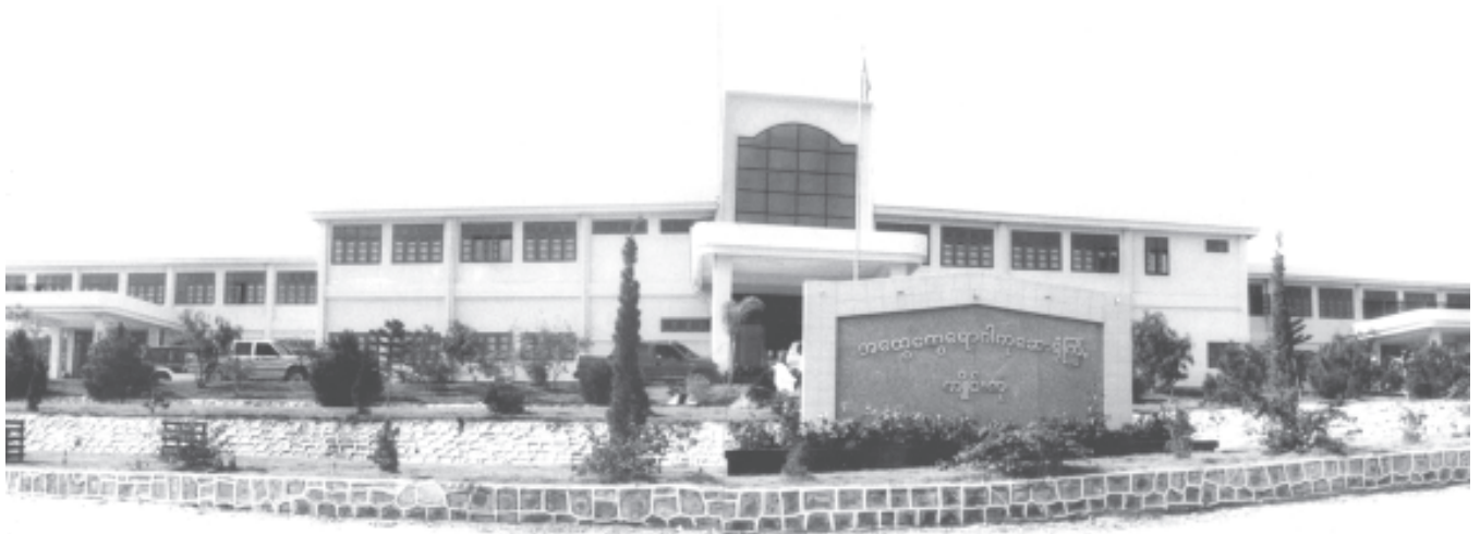
200-bed Kengtung General Hospital in Kengtung, Shan State (East).