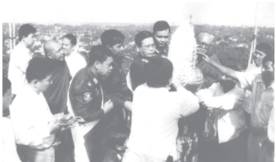
Prime Minister General Khin Nyunt hoists diamond orb atop Naga Cave Aungchantha Pagoda of Kalaywa Tawya Monastery in Mayangon Township on 2-5-2004.

At the auspicious time, the Prime Minister offered