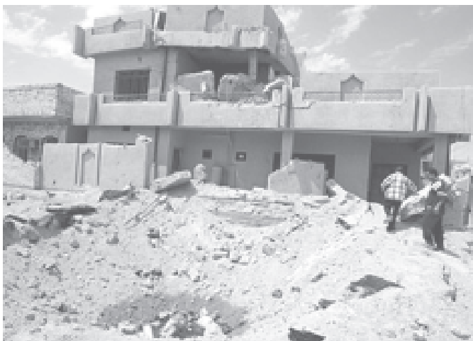
Iraqis return to Fallujah to find their homes damaged on 30 April 2004.