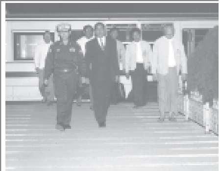
Rail Transportation Minister Maj-Gen Aung Min welcomes back the Myanmar delegation at the Yangon International Airport.