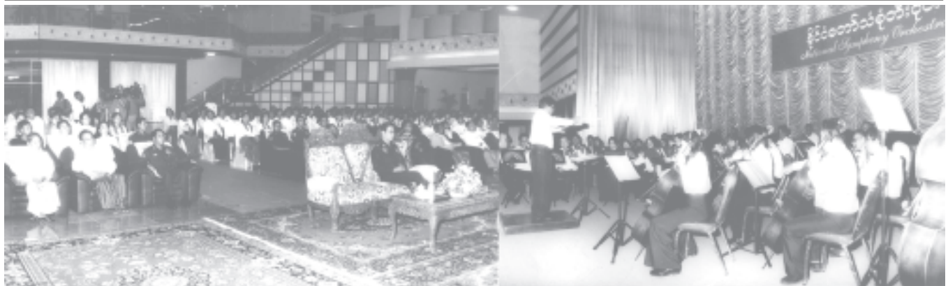
Prime Minister General Khin Nyunt watches the demonstration of the National Symphony Orchestra. — MNA

The Sayadaw, the deputy minister and wellwisher U Maung Maung Kha Swe fixed three tiers of Htidaw atop the pagoda. Later, the deputy minister and the wellwisher performed the rituals of golden and silver showers to mark completion of the ceremony. — MNA