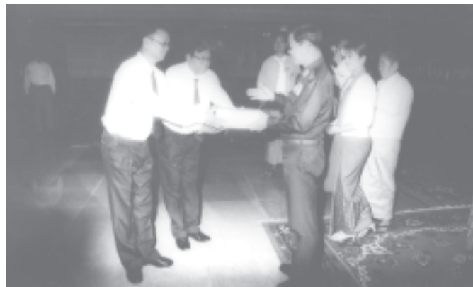
Prime Minister General Khin Nyunt presents cash awards to musicians of the National Symphony Orchestra. — MNA