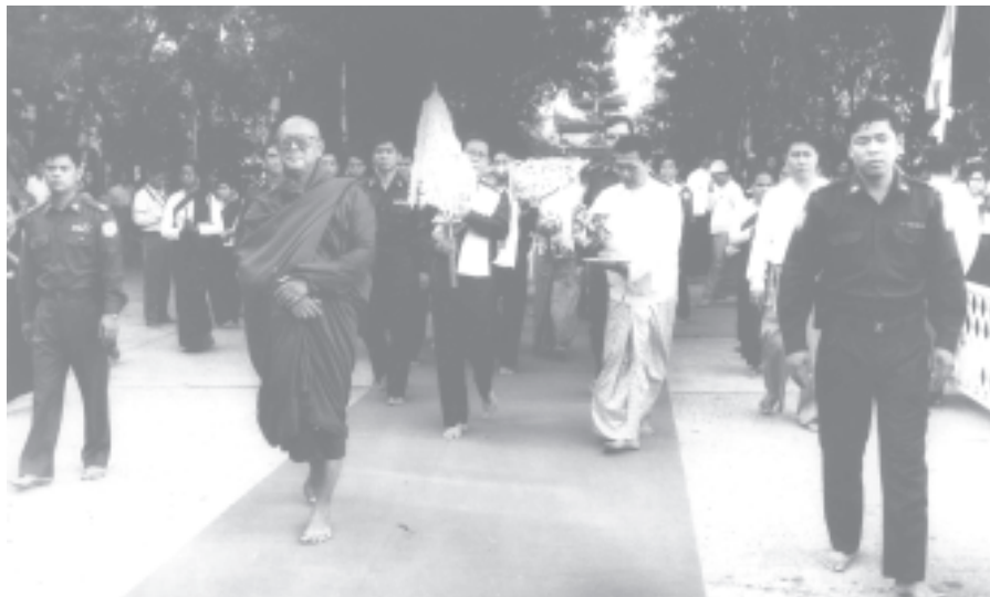
Prime Minister General Khin Nyunt conveys the diamond orb around the Aungmyan Pagoda.