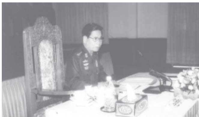
Prime Minister General Khin Nyunt addresses Central Committee for Drugs Abuse Control Special Meeting 1/2004.—MNA

At the outset, Prime Minister General Khin Nyunt made a speech on the occasion.