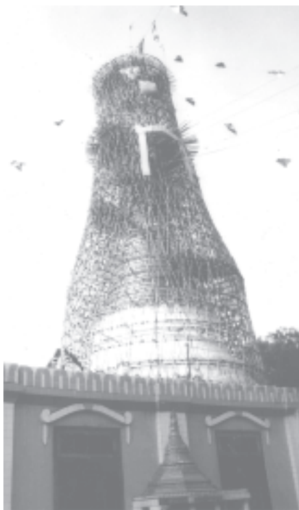
The Naga Cave Aungmyan Pagoda.

He spoke of the need to provide necessary assistance for acceleration of momentum of buckwheat cultivation project in Kongyan and Tarshwehtan regions being carried out in cooperation with Japan.