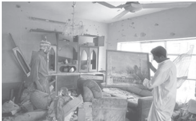
Iraqi men search through the rubble of their house which was shelled by a mortar during a fight between Iraqi guerillas and US troops in Fallujah, Iraq on 30 April 2004.