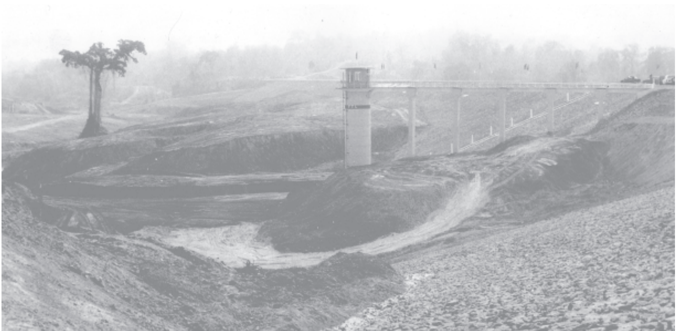
Paunglin Dam in Hlegu Township, Yangon, Division.