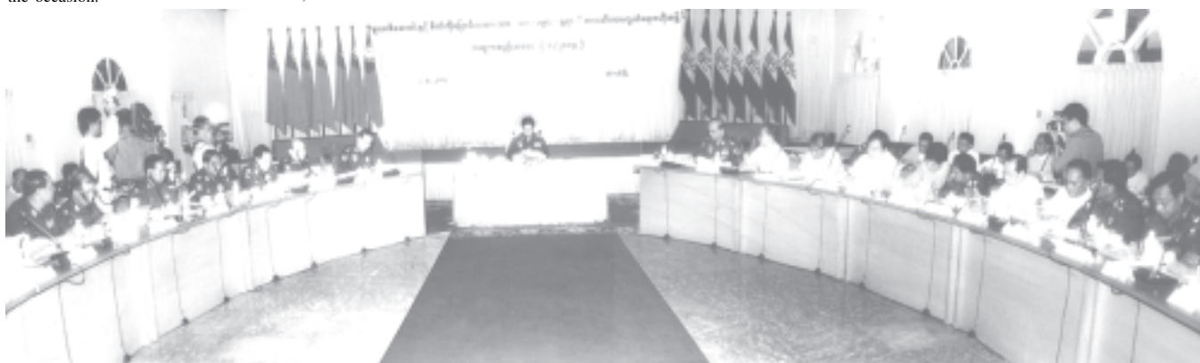
Prime Minister General Khin Nyunt addresses Central Committee for Drugs Abuse Control Special Meeting 1/2004.