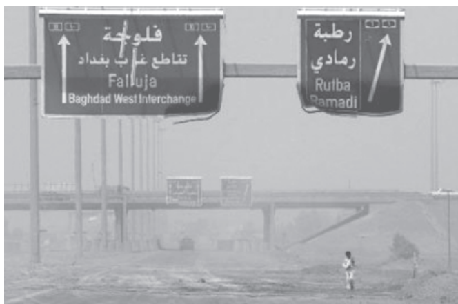
An Iraqi boy leaves the town of Fallujah, on 30 April, 2004.