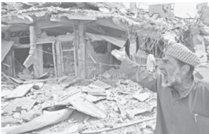
Bursts of gunfire have ripped Fallujah as guerillas and US Marines skirmished intermittently on 1 May 2004 despite a deal to hand security responsibilities back to Iraqis. Here an Iraqi in front of destroyed houses in Fallujah.