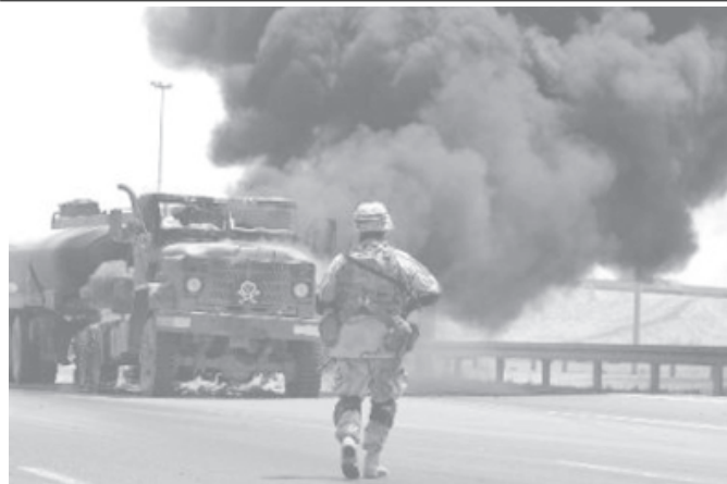
A US Army soldier approaches a burning US Army military truck after a convoy came under attack in the outskirts of Baghdad, Iraq, on the highway leading to Fallujah, on Saturday, 1 May, 2004.

With this, India will join the league of select countries like Sri Lanka that have gone beyond curbing smoking in public places to banning tobacco promotion directly or in any surrogate form. —MNA/Xinhua