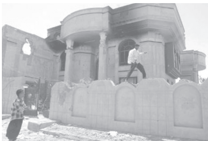
An Iraqi man carries electrical wire past his destroyed house in an attempt to restore electricity, after returning to Fallujah, on 1 May, 2004.