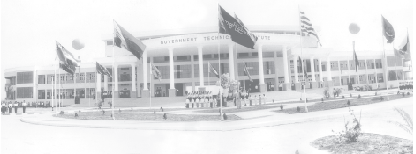
Opening ceremony of Myingyan Government Technical Institute in progress on 11-2-2004.