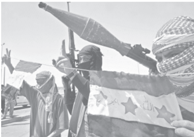
The US occupying force in Iraq has not liberated the country and has failed to bring the promised peace and democracy, Syrian President Bashar al-Assad said.

Last November, the US Congress approved economic and diplomatic sanctions against Syria, accusing it of meddling in Iraq and supporting Palestinian and Lebanese movements considered to be terrorists by Washington and Israel.