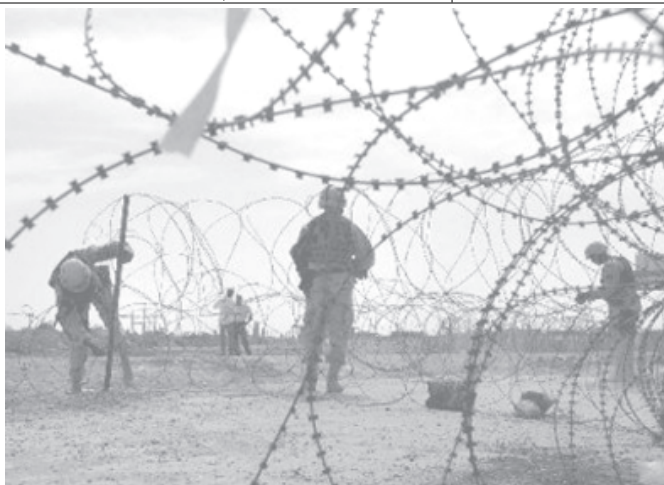
US Army soldiers set up a new checkpoint as they reposition to outside the town of Fallujah, Iraq, on 1 May, 2004.

A spokesman for the airline said on Friday that the 50-year-old pilot, whose name was not released, dozed off while flying on 23 March from Tokyo's Haneda Airport to the western prefecture of Yamaguchi, a trip that takes about an hour.