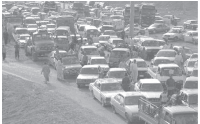
Cars line up in front of a US Army checkpoint at the entrance of Fallujah, Iraq waiting to enter the city, on Saturday, 1 May, 2004.