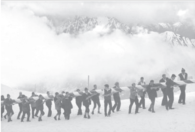
Bavarian highlanders carry their 60-foot-long May Tree through the snow on Germany's highest mountain, the Zugspitze, near Garmisch-Partenkirchen, southern Germany, on 1 May, 2004. Following a century-old tradition, May Trees are set up on the first of May all over Bavaria.