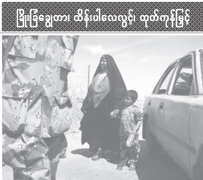
Fallujah residents pass through a checkpoint to return to their homes in Fallujah, Iraq, on 20 April, 2004.

He said a total of 36,642 people were injured in the April 9-18 period covering the Thai New Year holiday, known as Songkran. Thousands of road accidents involving reckless and drunken drivers particularly motorcycle riders without helmets.