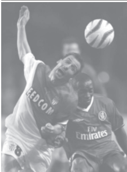
Monaco's team captain Ludovic Giuly (L) heads the ball away from Chelsea's Claude Makelele, during their Champions League semi-final first leg soccer match at the Louis II Stadium, in Monaco, on 20 April, 2004.

United, who trail Chelsea by four points with a game in hand, face Charlton Athletic at Old Trafford on Tuesday and Scholes will miss that match along with the home game against Liverpool on April 24 and the trip to Blackburn Rovers on May 1.—MNA/Reuters