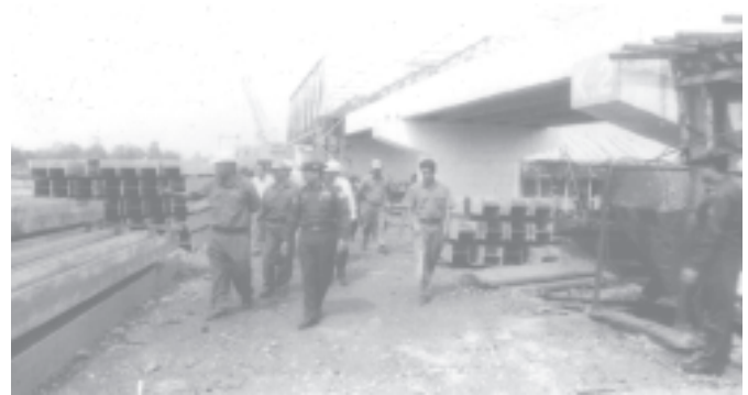
Minister for Construction Maj-Gen Saw Tun inspects progress in building Londawpauk Bridge in Rakhine State.— CONSTRUCTION

The minister and party inspected Hsarpayin Village bypass on Yangon-Sittway Road (Taungup-Maei section), the site for Hsarpayin Bridge and construction of