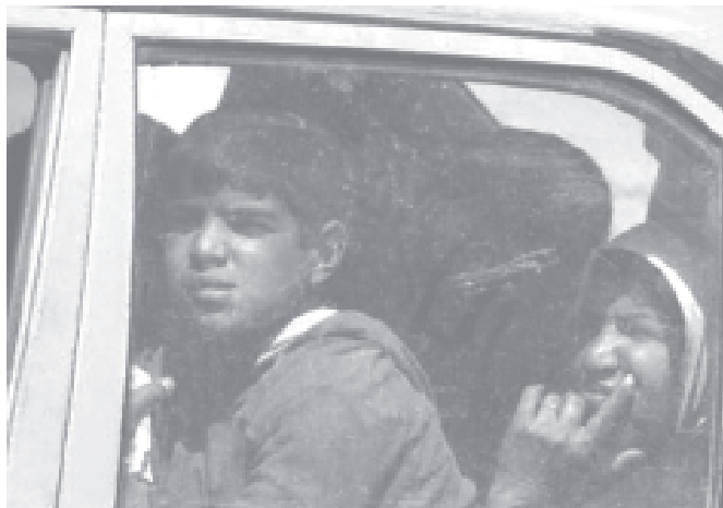
An Iraqi family heads back home to the restive city of Fallujah on 20 April, 2004. Hundreds of civilians began returning to the battle-scarred city, a day after the US army cautiously lifted a two-week siege, as the coalition in Iraq suffered a new blow with the decision of Honduras to pull out its troops. — INTERNET

He said truck movement had mostly stopped on the western roads to Jordan and Syria, and that a bridge on the only road left open to Baghdad from the south was now too weak to cross because of war damage and recent sabotage. The western route leading to Jordan, Syria and Lebanon accounts for an estimated 70 per cent of Iraqi shipments. — MNA/Reuters