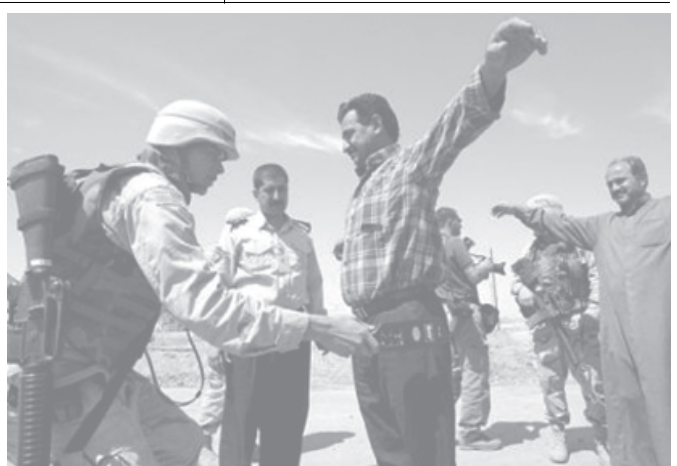
US Army soldiers check Iraqis for weapons as residents return to their homes in Fallujah, Iraq, on 20 April, 2004. With a ceasefire between US Marines and Iraqi guerrillas holding, Fallujah began filtering back into town on Tuesday through checkpoints run by US and Iraqi security forces.

Hospital sources estimated that more than 600 Iraqis, half of them women, children and elderly people, died in Fallujah in the bloodiest fighting since the US-led invasion of their country in March last year. The US military says it is impossible to verify the figure.