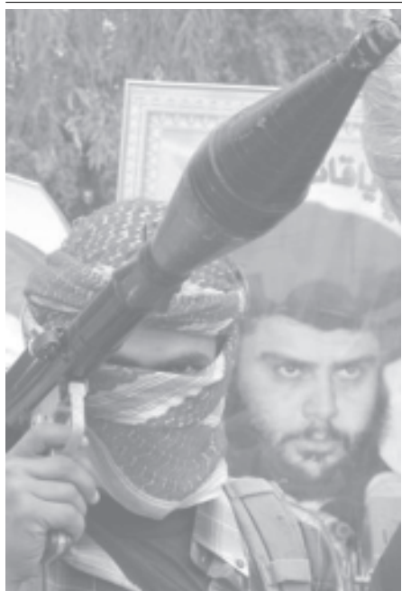
An Iraqi Shi'ite militiaman, aligned with radical cleric Moqtada al-Sadr, joins other militia members brandishing their weapons in the southern city of Diwaniya on 19 April, 2004. — INTERNET

China has sent 700,000 students to study in more than 100 countries. In recent years, 120,000 students a year left China for further study abroad. Meanwhile, some 300 universities in various parts of China enrolled 400,000 students from 170 countries. —MNA/Xinhua