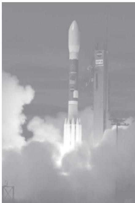
A Boeing Delta II rocket lifts off the launch pad on 20 April, 2004 from Vandenberg Air Force Base, in California. The rocket successfully deployed NASA's Gravity Probe B satellite, to test two predictions of Albert Einstein's General Theory of Relativity of 1916.

Last year, the company reported an operating revenue of 7.5 billion US dollars in China.