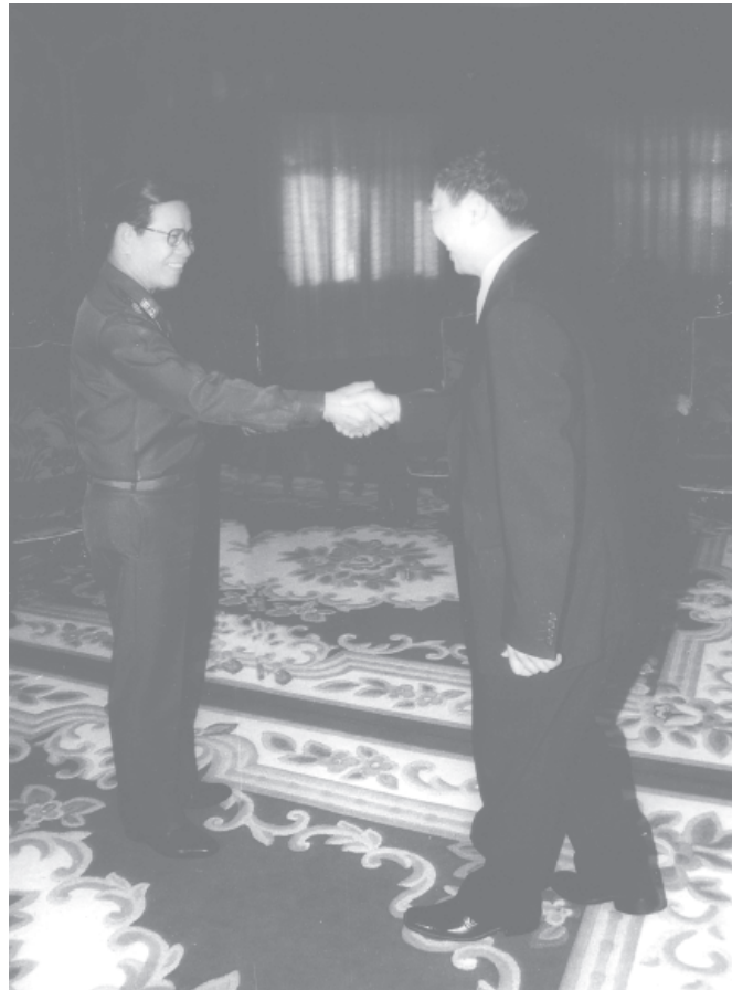
Prime Minister General Khin Nyunt greets PRC Ambassador Mr Li Jinjun at Zeyathiri Beikman. (News on page 1)