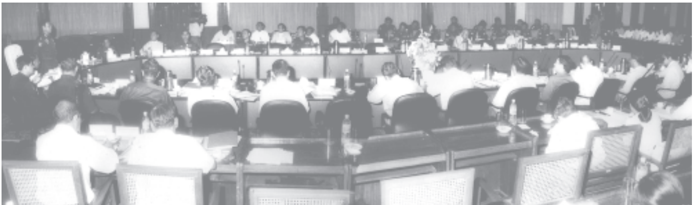
Secretary-1 Lt-Gen Soe Win meets members of Industrial Zone Supervisory Committees and industrial entrepreneurs.

Emergence of the State Constitution is the duty of all citizens of Myanmar Naing-Ngan.