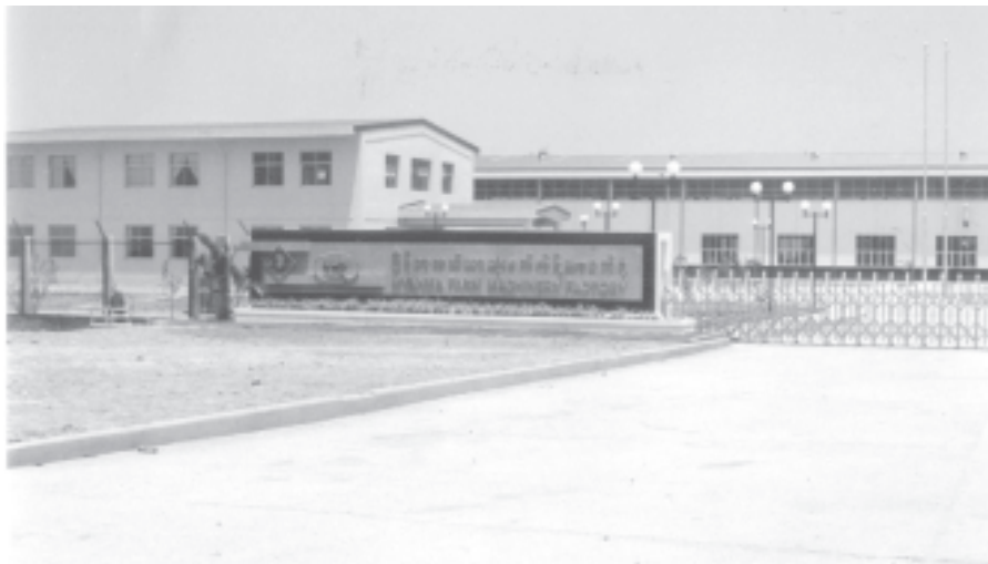
Myanmar Farm Machinery Factory in Inngon Village, Kyaukse.