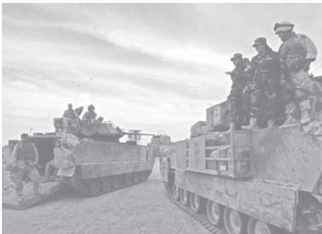
Honduran soldiers with US troops on a Bradley fighting vehicle, at a Honduran base in Najaf, Iraq, on 20 April, 2004. Honduras has decided to pull its troops out of Iraq.

Defence Secretary Donald Rumsfeld has expressed surprise at the recent level of US military deaths in Iraq.