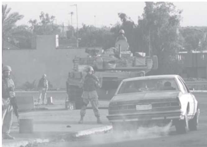
US Army soldiers check an Iraqi car driving into the embattled Baghdad suburb of Abu Ghraib, Iraq, on 20 April, 2004.