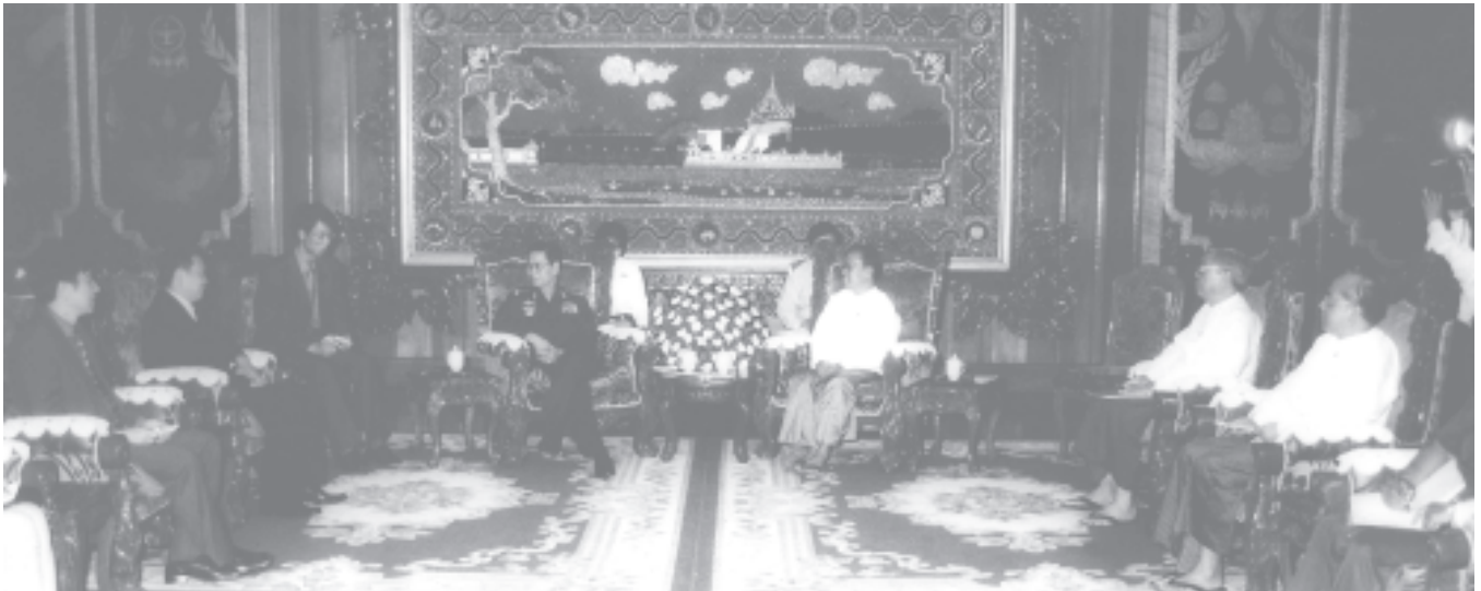
Prime Minister General Khin Nyunt receives Chinese Ambassador Mr Li Jinjun at Zeyathiri Beikman.