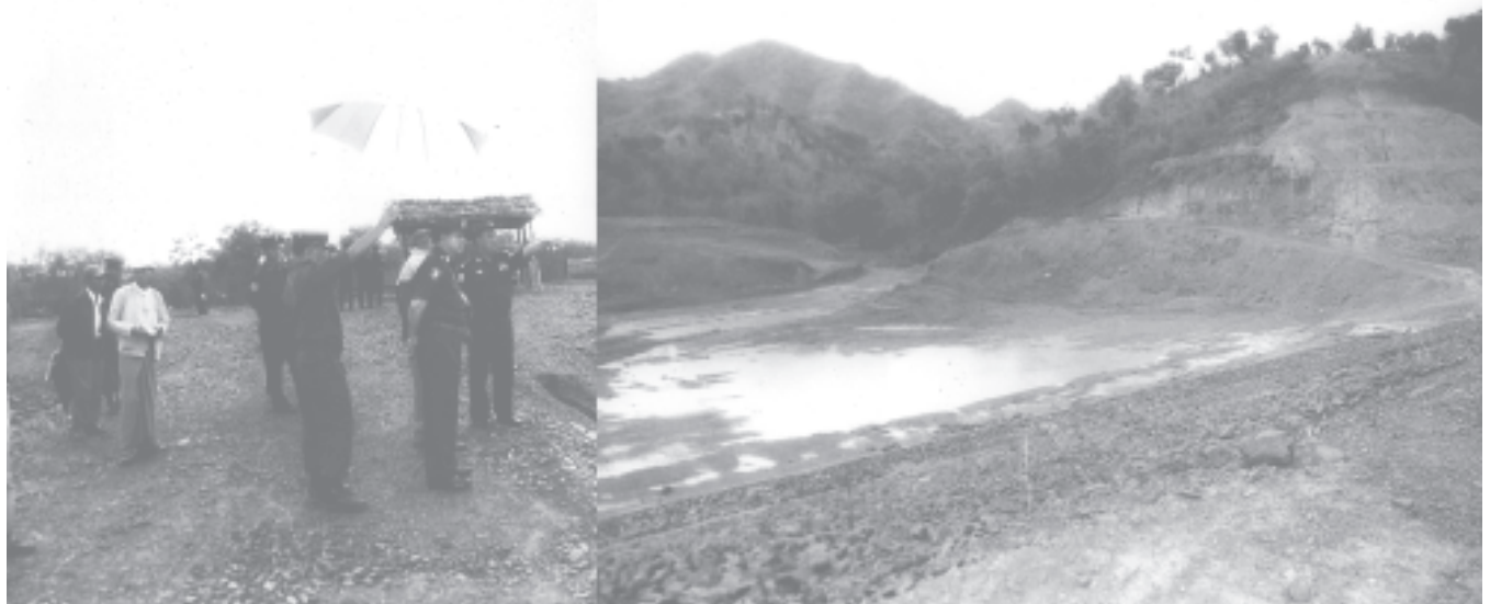
Lt-Gen Khin Maung Than sees over implementation of Kyettetchaung Dam Project near Kanni Village, Minbya Township.