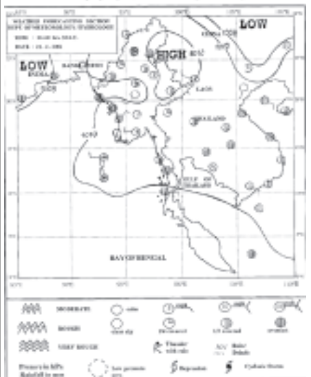
Weather Map of Myanmar and Neighbouring Areas