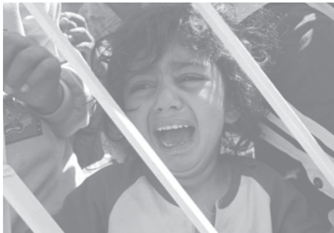
As residents try to return to their homes in Fallujah, Iraq, a girl cries during a melee at a checkpoint on the outskirts of Fallujah on 20 April, 2004.