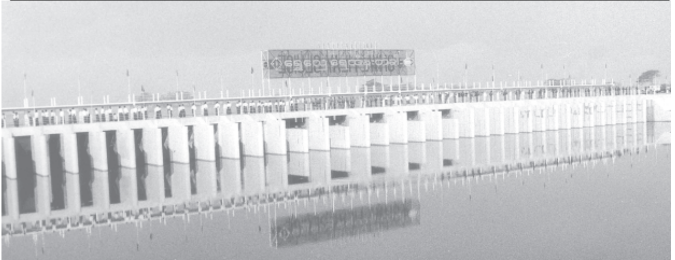
SHWE HLAY SLUICE GATE IN KAWA TOWNSHIP: Shwe Hlay sluice gate will benefit 20,000 acres of farmland in Kawa Township and 15,000 acres of farmland in Kayan Township totalling 35,000 in the two townships in Bago Division.— MNA