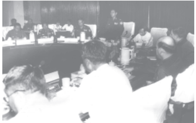
Commander Maj-Gen Myint Swe delivers an address at the meeting. — PUPR

The citation said, "despite their poverty and poor health due to toxic gas exposure, Bee and Shukla have emerged as leaders in the global fight to hold Dow Chemicals accountable for the infamous 1984 Union Carbide gas leak". It said "together, they have made the struggle for justice for survivors of Bhopal a powerful validation of women's role on the frontlines of India's civil society". —MNA/PTI