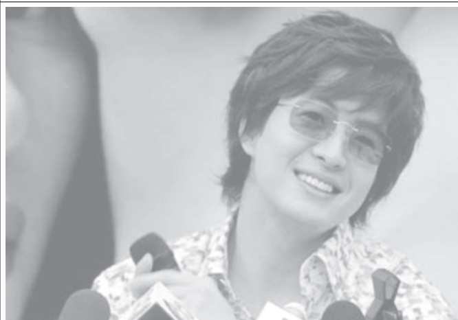
The Korean actor Bae Yong Jun's said his character is closer to that of Joon Sang in Winter Sonata, but slyly adds that he does resemble Jo Won, his character in Untold Scandal, in certain ways.

The widespread use of the Internet in China has caused many new social problems unheard of before. Many children have become addicted to online games and chatting, and neglected their study. In a recent tragedy in the same city two junior middle school students were crushed to death by a train, when they fell asleep on the track after they played online games non-stop for 48 hours in a local unlicensed Internet bar. — MNA/Xinhua