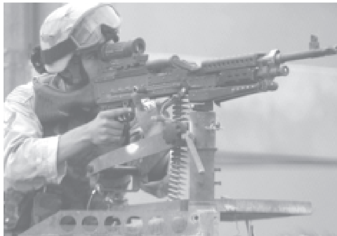
A US soldier stands guard in front of the Swedish embassy in Baghdad after it was attacked by a mortar round, causing no casualties. The Sunni and Shiite Muslim rebellions.