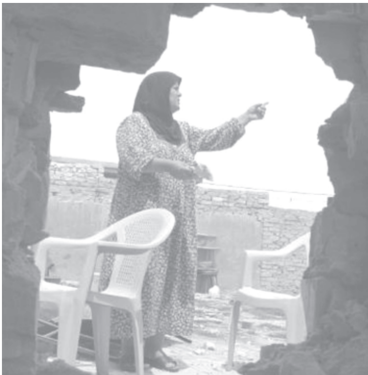
An Iraqi woman, viewed through a shattered wall, stands outside her house which was destroyed after an overnight air strike in the Baghdad's suburb of Al-Doura on 18 April, 2004.