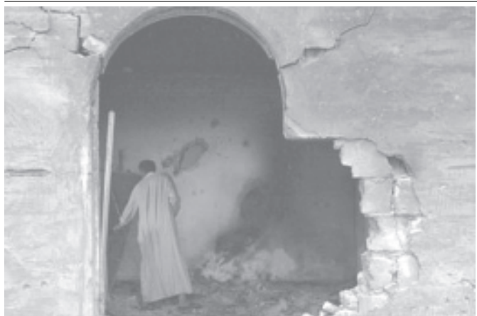
An Iraqi man searches through the rubble of his bombed out house in Fallujah, Iraq, on Monday, 19, April 2004.