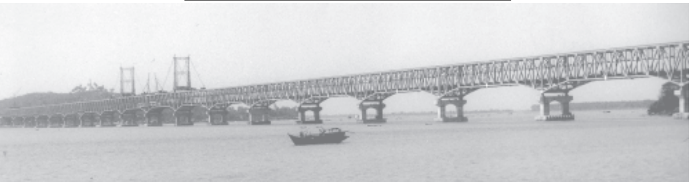
Lying on the 842-mile Union Highway linking Yangon and Kawthoung in the southern tip of the nation via Myeik, Dawei and Mawlamyine, the Thanlwin Bridge (Mawlamyine) will be 11,575 feet or over two miles long. The rail-cum-road bridge can bear up to 60-ton loads.