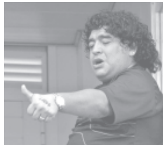
Argentine former soccer star Diego Maradona gestures during the match between Boca Juniors and Nueva Chicago in Buenos Aires, Argentina, Sunday, April 18, 2004. According to media reports Maradona was hospitalized Sunday afternoon.