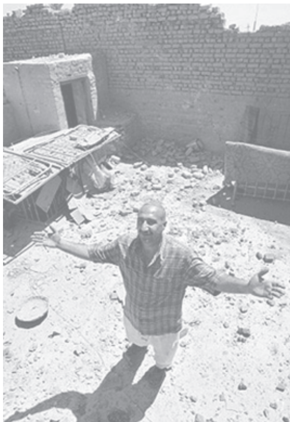
An Iraqi man gestures at the ruins of home after it was hit by a US missile overnight, in the central Iraqi city of Kut recently.