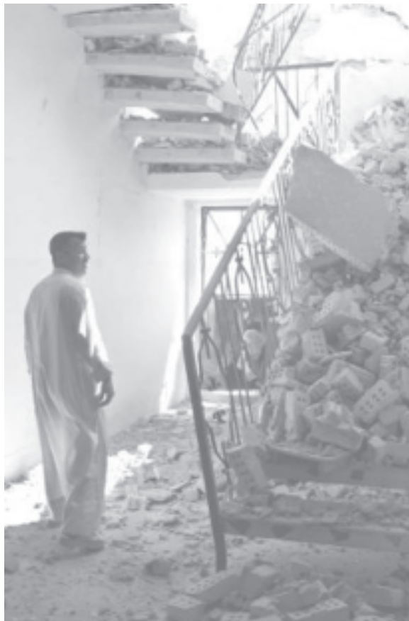
An Iraqi man stands inside a house destroyed by an air attack in Fallujah, on 13 April, 2004. A US military offensive in Fallujah has raised concerns about excessive use of force.