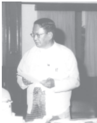
Minister U Aung Thaung speaks at Work Coordination Meeting No 1/2004 on Myanmar Industrial Development. — MNA

Afterwards, Secretary of Myanmar Industrial Development Committee Deputy Minister for Industry-1 Brig-