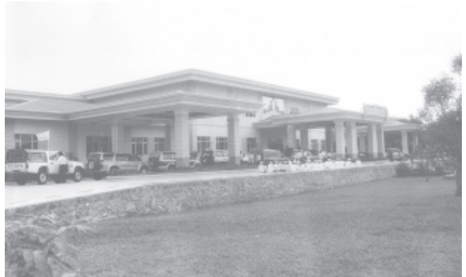
The new Specialist Hospital in Kyaukse.