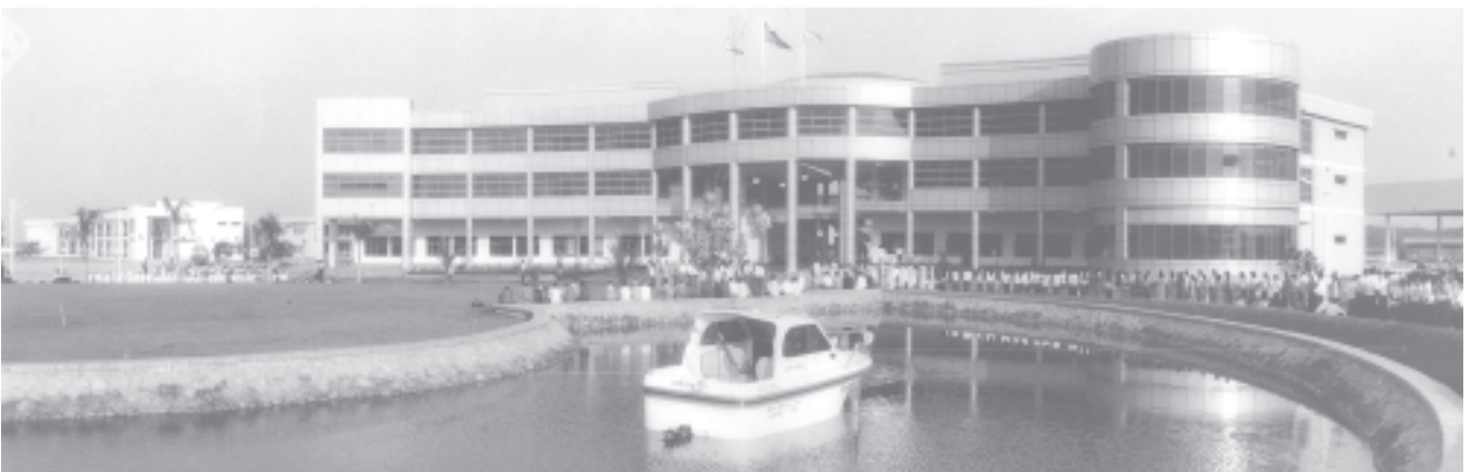
The Myanmar Maritime University in Thilawa, Thanlyin township, Yangon South District.