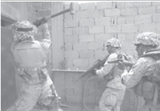
A US Marine hits a door with a hammer during a raid searching for weapons in an industrial area of Fallujah as two other Marines provide cover.