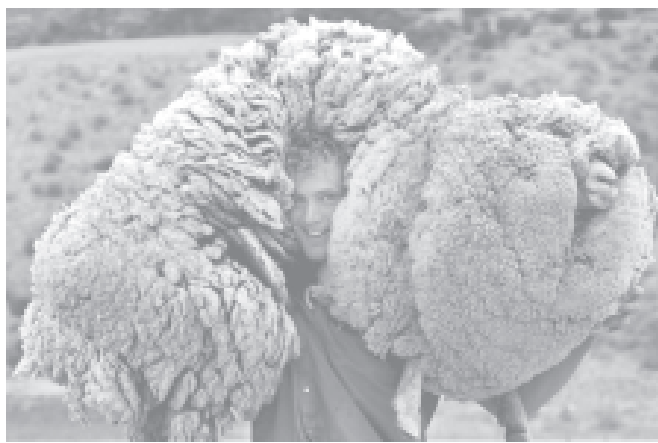
This is Shriek, a 10-year-old sheep with six years' worth of wool on it. Found in Central Otago, New Zealand, on Friday. Shriek is believed to have escaped the annual shearing by hiding in rock caves 5,000 ft above its usual habitat. It was shorn at a charity function on Friday.