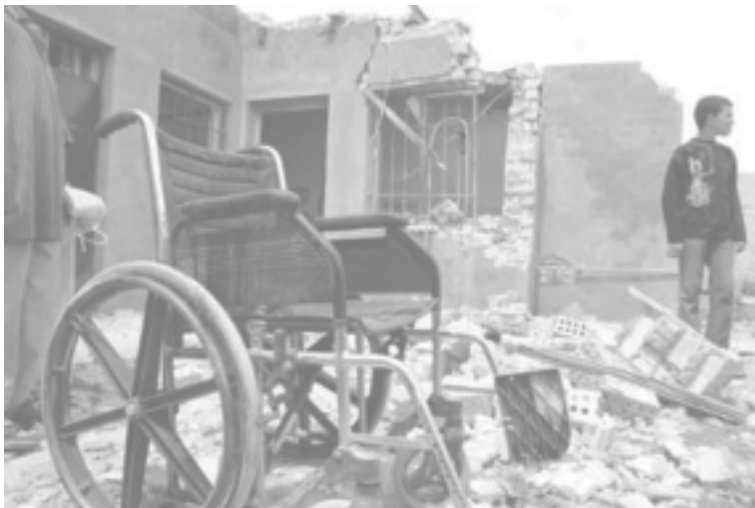
A blood stained wheelchair, brought out to show reporters, lies in the ruins of a destroyed house after an air strike in the Baghdad's suburb of Al-Doura on 18 April, 2004.