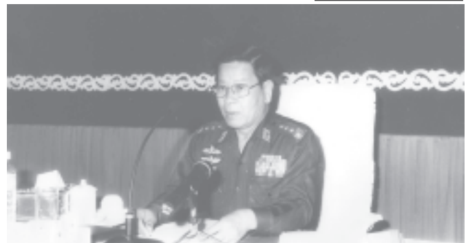
Prime Minister General Khin Nyunt addresses the meeting No 1/2004 of the Myanmar National Olympic Council.