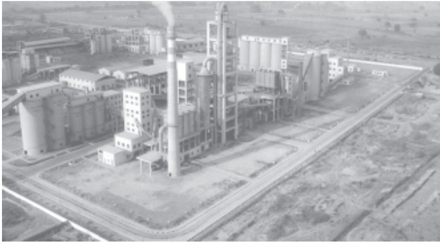
Aerial view of Hsinmin-2 Cement Plant in Kyaukse.

It is obvious that the tour of Kyaukse region by Chairman of the State Peace and Development Council Commander-in-Chief of Defence Services Senior General Than Shwe reflects his goodwill towards the growth of mills and factories in Ahnyar region (upper Myanmar) and boosting production. Myanmar is rich in natural resources. Myanma land and water resources seem inexhaustible. If there is appropriate innovation and initiative the resources can be tapped. All need to act. Hence, it can be said that nature serves the interest of Myanmar.