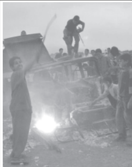
Iraqi children set a captured US Army Humvee vehicle on fire in Kufa, 160 kilometres (100 miles) south of Baghdad, Iraq, on Monday, 19 April 2004.

“This shows there are reasons to be optimistic,” Chavez said. — MNA/Reuters