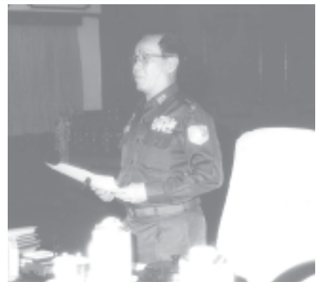
Secretary-1 Lt-Gen Soe Win delivers a speech at the Work Coordination Meeting No 1/2004 on Myanmar Industrial Development.