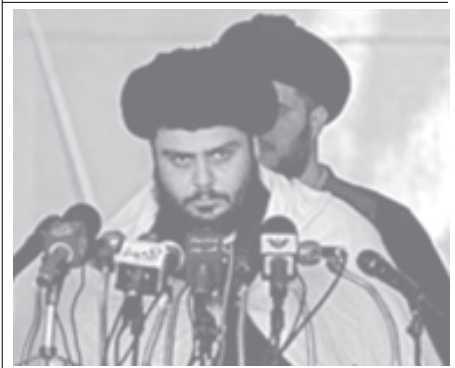
Al-Sadr urges his followers to stop attacking Spanish troops after Madrid announced their upcoming withdrawal from Iraq.