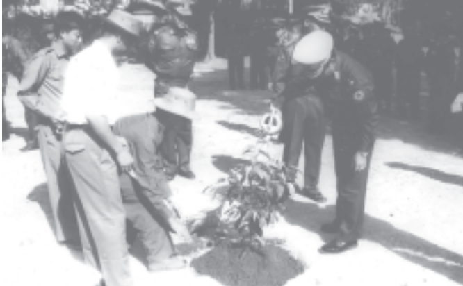
Commander Maj-Gen Myint Swe plants a sapling.

At the ceremony, 60405 saplings such as neem, tamarrind, toddy palm, Thitseint, teak, Pyingadode, star flower tree, Mau and Kokko will be planted in Mingladon Township. —MNA