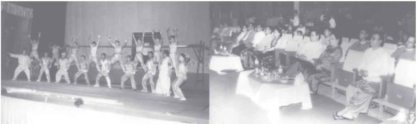
Prime Minister General Khin Nyunt and wife Dr Daw Khin Win Shwe watch performances of Arzarni San San Circus.