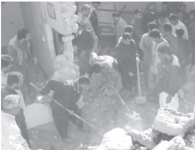
Residents of Kut, Iraq, 180 kms south of Baghdad, inspect a charred house following clashes between militiamen of radical Shiite cleric Moqtada Al-Sadr and Ukranian coalition soldiers on 7 April, 2004.