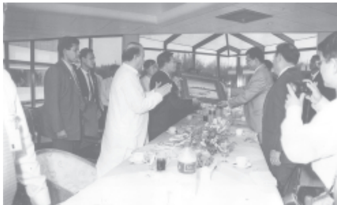
Bangladeshi State Minister for Communications Mr Salah Uddin Ahmed presents souvenir to Prime Minister General Khin Nyunt at the dinner in Cox's Bazar.