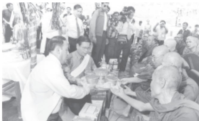
Prime Minister General Khin Nyunt offers Maha Bo tree to Sayadaws at the ceremony to plant Maha Bo tree in Tadagyi Village, Ywadow.