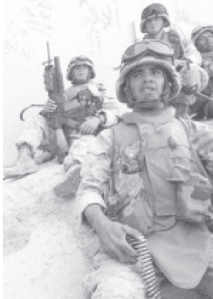
US Marines with the 2nd Battalion 1st Marine Regiment pause after a gunbattle with the Iraqi insurgents on the outskirts of Fallujah, Iraq, on Tuesday, 6, April 2004.