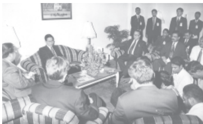
Prime Minister General Khin Nyunt meets with reporters from news agencies and newspapers in Chittagong.