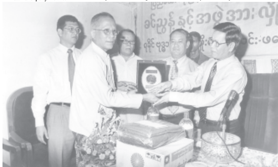
Prime Minister General Khin Nyunt cordially converses with local Myanmar people at the monastery in Chittagong.—MNA