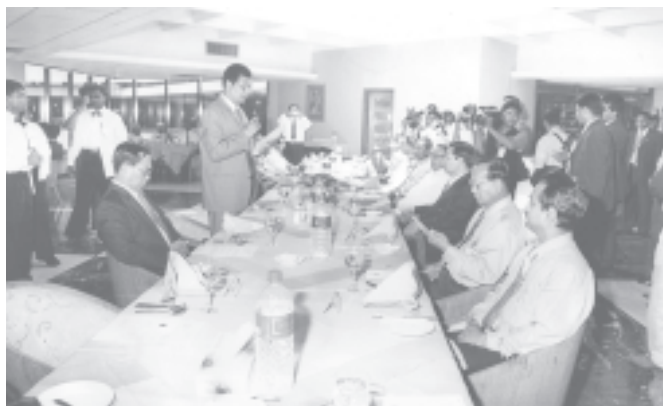
State Minister for Communications Mr Salah Uddin Ahmed addresses the luncheon in Cox's Bazar.