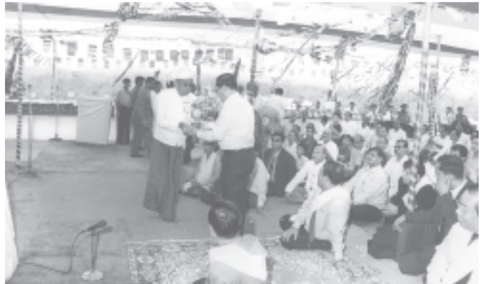
A townelder presents picture of Hsutaungpyay Pagoda to Secretary-1 Lt-Gen Soe Win.