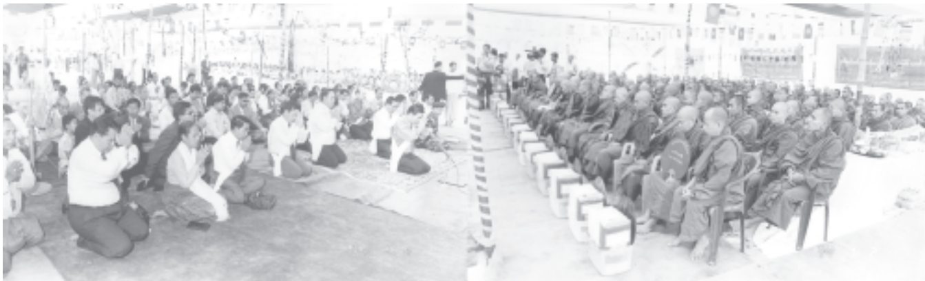
Prime Minister General Khin Nyunt and party receiving Five Precepts from Khamaukchaung Sayadaw Bhaddanta Vanna at cornerstone laying ceremony of a monastery in Bandarban.