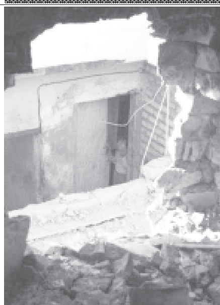
An Iraqi child looks at the damage on 6 April, 2004, following an explosion in the Shiite district of Sadr City, north Baghdad, Iraq, late Monday.