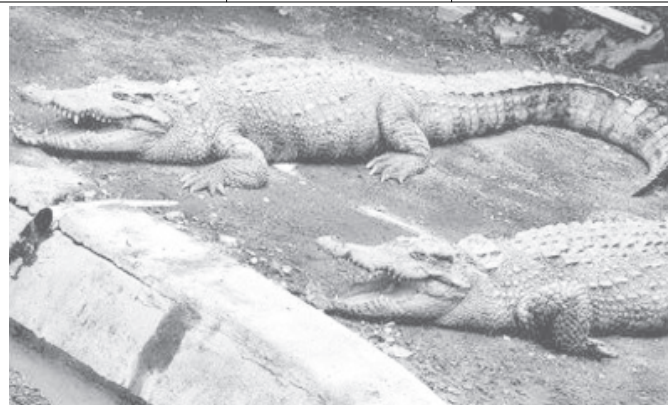
Two crocodiles lie by their feeding pond. Footprints found on a mud bank in a suburban Hong Kong town may belong to wild dogs and not a runaway crocodile, the government said after the discovery caused panic among villagers.