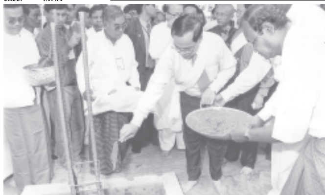
Secretary-1 Lt-Gen Soe Win laying cornerstone of Nat Nagamin Lake Monastery in Bandarban. —MNA

Kitchen crops, fruits and saplings of herbal plants are being shown at the festival. Poultry farming and fish breeding are also exhibited there. Booklets and pamphlets on utilization of fertilizers are also available there. MNA