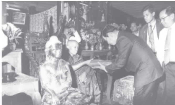
Prime Minister General Khin Nyunt offers provisions to Aggameda Monastery Sayadaw Bhaddanta Pandita in Cox's Bazar.