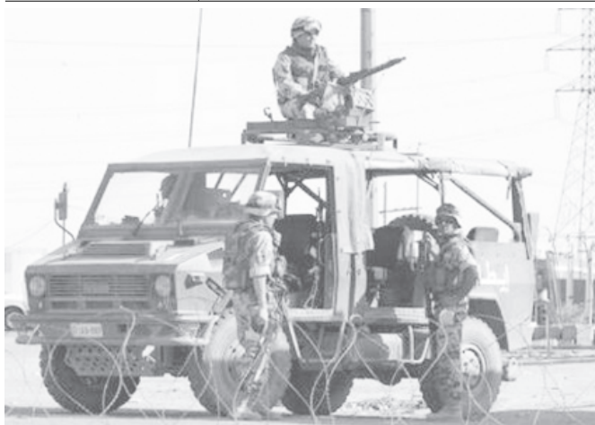
Italian troops block a highway bridge at the entrance to the southern Iraqi city of Nassiriya after clashes erupted on 6 April, 2004.