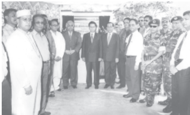
Prime Minister General Khin Nyunt seen at opening ceremony of Bangladesh-Myanmar Friendship Road in Ramu (Panwa).