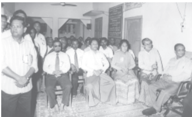
Prime Minister General Khin Nyunt cordially converses with local Myanmar people at Aggamedha Myanmar Monastery in Cox's Bazar.