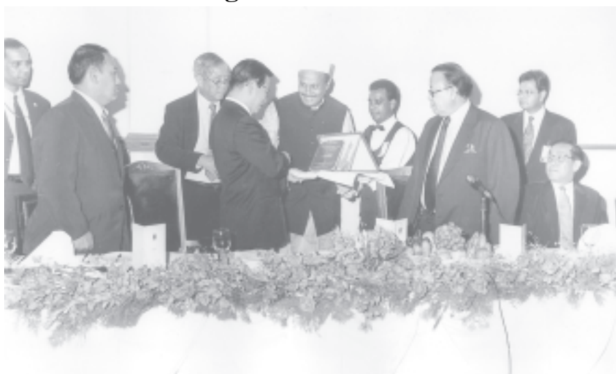
Prime Minister General Khin Nyunt and Bangladeshi Minister for Foreign Affairs Mr M Morshed Khan exchange souvenirs at the dinner.

The congregation opened the ceremony with three-time recitation Namo Tassa. Next, Hill Region Sangha Council Chairman K h a m a u n g - c h a u n g Sayadaw Bhaddanta Vanna administered the Five Precepts. The General and party offered provisions to the Sayadaws. Similarly, the General presented do-