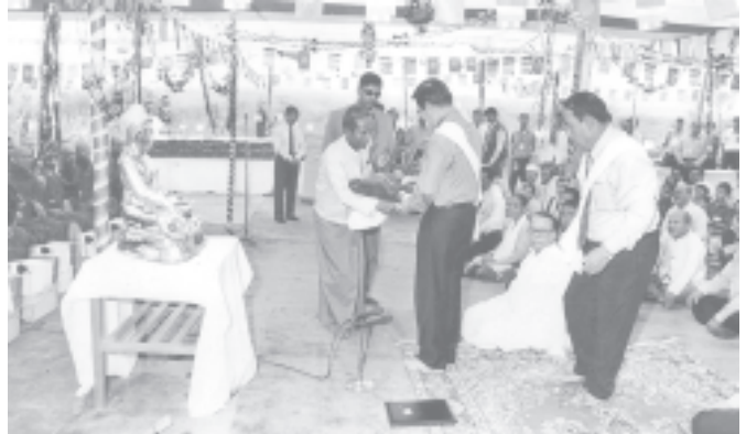
U Saw Pru of Ywadow presents horns of deer to Prime Minister General Khin Nyunt.