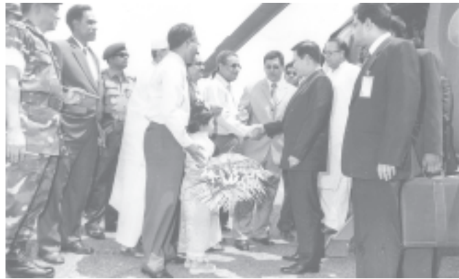
Prime Minister General Khin Nyunt being welcomed by officials in Cox's Bazar, Bangladesh.