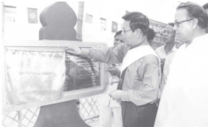
Prime Minister General Khin Nyunt unveils the plaque to mark cornerstone laying ceremony of Nat Nagamin Monastery in Bandarban. — MNA