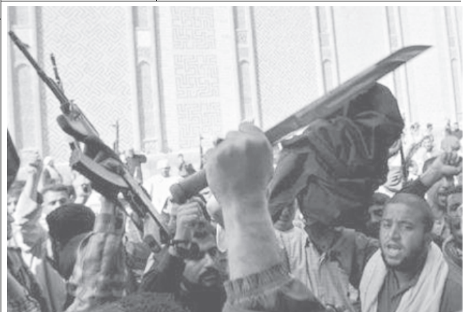
Iraqis chant anti US slogans in Najaf, 170 kilometres, 105 miles south of Baghdad, Iraq, on Tuesday, 6 April, 2004.