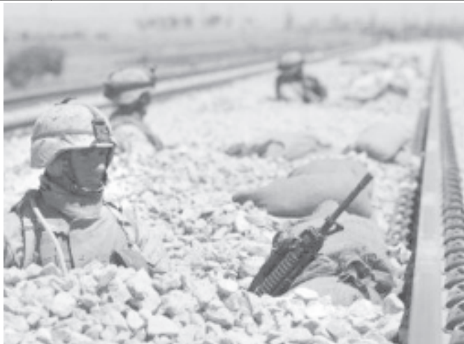
US Marines with the 2nd Battalion 1st Marine Regiment stand guard at a railway on the outskirts of Fallujah, Iraq, on Tuesday, 6 April, 2004.