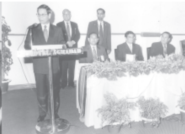
Prime Minister General Khin Nyunt addresses the dinner hosted in Chittagong by Minister for Foreign Affairs Mr M Morshed Khan of Bangladesh.—MNA