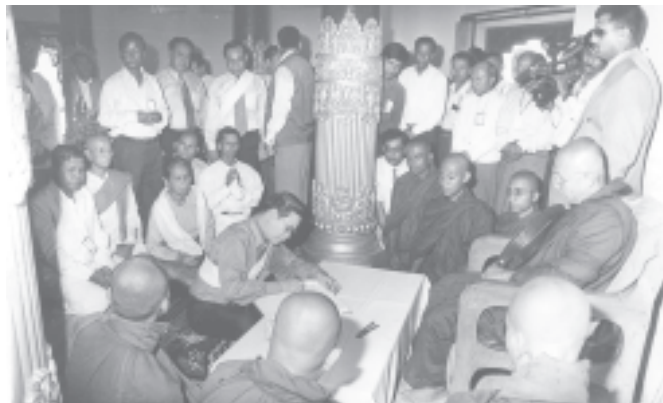
Prime Minister General Khin Nyunt signs in the visitors' book at Maha Sukha Hsutaungpyay Pagoda. — MNA