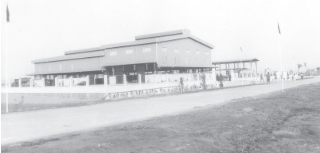
Silver Sea Fisheries Industrial Zone seen in Hlinethaya Township.

The one-stop service zone is the first of its kind in Myanmar. It includes fishmeal plant, diesel pump, water pump, workshop, cold storage, food processing zone and value-added processing zone and banking services. Ships can berth and dock at the zone and marine products can be sold.—MNA