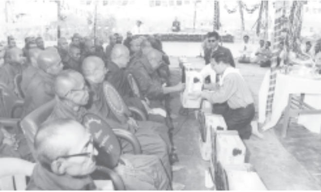
Prime Minister General Khin Nyunt offers provisions to a Sayadaw at cornerstone laying ceremony of the monastery in Bandarban.