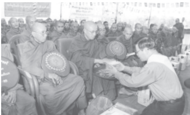
Prime Minister General Khin Nyunt donates cash for use in propagation of Theravada Buddhism in Tadagyi Village, Ywadow.