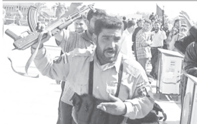
A police officer joins supporters of Iraqi Shi'ite cleric Moqtada al-Sadr celebrating on the roof while occupying the governor's residence in the southern city of Basra, on 5 April, 2004. The costs of the war in Iraq, which contributed to a destabilization of the Middle East, have outweighed the benefits of removing Saddam Hussein, former UN weapons inspector Hans Blix told a Danish newspaper on 6 April.

Instead, Canberra was pursuing bilateral deals with more advanced nations in ASEAN. Last year Australia, a leading agricultural exporter, sealed a free trade agreement with Singapore and a recently concluded deal with Thailand was expected to come into force in early 2005. Australia struck a free trade deal in February with the United States, its second-largest trading partner after Japan, which is set to go before the US Congress mid-year. It is also conducting a study into possible free trade talks with China. —MNA/Reuters