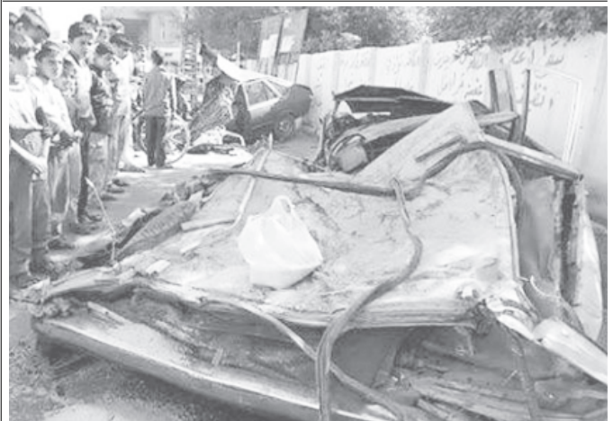
Iraqis look over a pair of flattened cars crushed by armoured vehicles after fighting between guerillas and US forces erupted in the north Baghdad suburb of Adhamiya on 6 April, 2004. —INTERNET

"Moscow is extremely worried over the continuing deterioration of the situation in Iraq, whose character is changing. Massive unrest, attacks on the coalition troops and the reciprocal use of force, not in proportion to the scope of the attacks, are further spreading and involving numerous casualties. Iraq is turning into a base of the activities of international terrorism," he said. — Internet