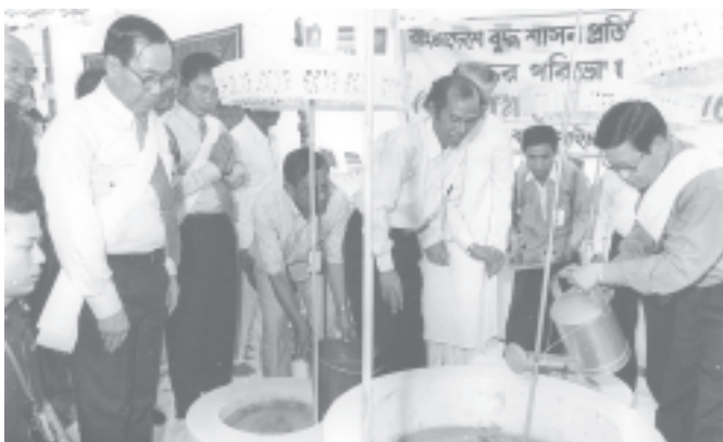
Prime Minister General Khin Nyunt plants Maha Bo tree at ceremony to lay cornerstone for building the monastery in Tadagyi Village, Ywadow.— MNA