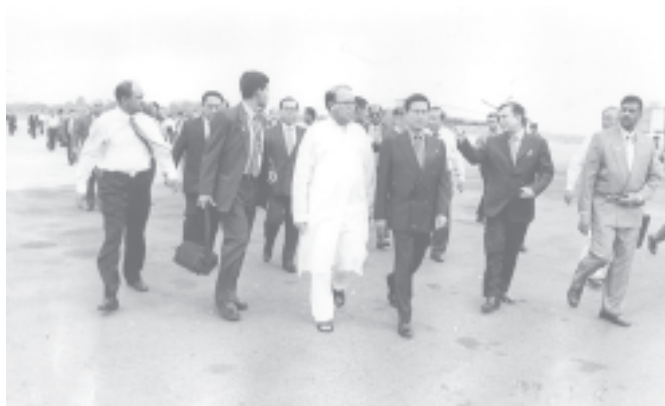
Prime Minister General Khin Nyunt and party being welcomed in Chittagong by Adviser to Foreign Affairs Mr Reaz Rahman and party.— MNA