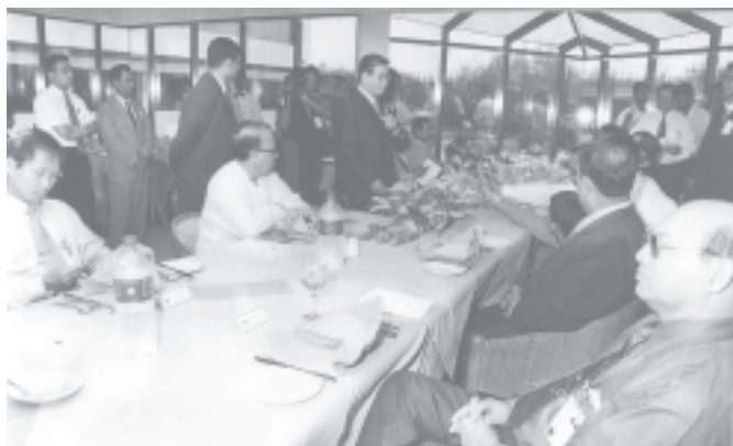
Prime Minister General Khin Nyunt addresses the luncheon hosted by State Minister for Communications Mr Salah Uddin Ahmed in Cox's Bazar.