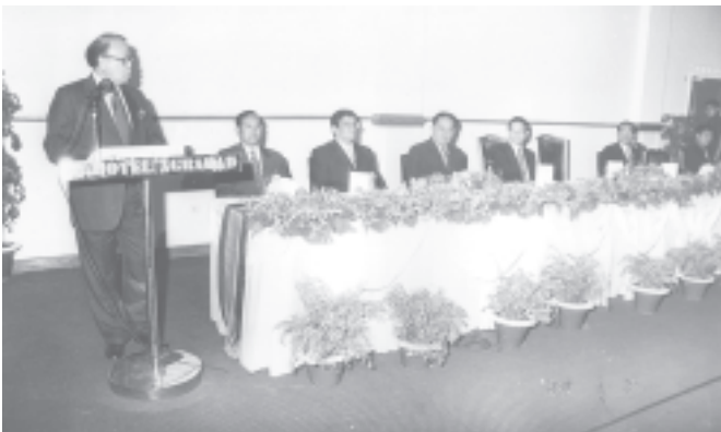
Bangladeshi Minister for Foreign Affairs Mr M Morshed Khan delivers an address at the dinner in Chittagong.