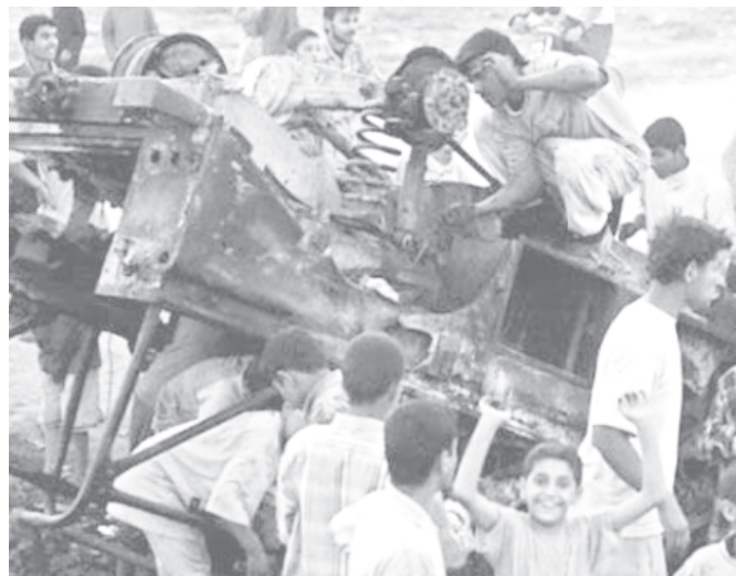
A British Army Land Rover lies burned while surrounded by children near the southern Iraq city of Amara on 6 April, 2004.

The end of Singapore's troop presence in Iraq comes during controversy about Spain's decision to withdraw its troops, and a political uproar in Australia after the opposition party said it would do the same if it won power in elections expected later this year.— MNA/Reuters