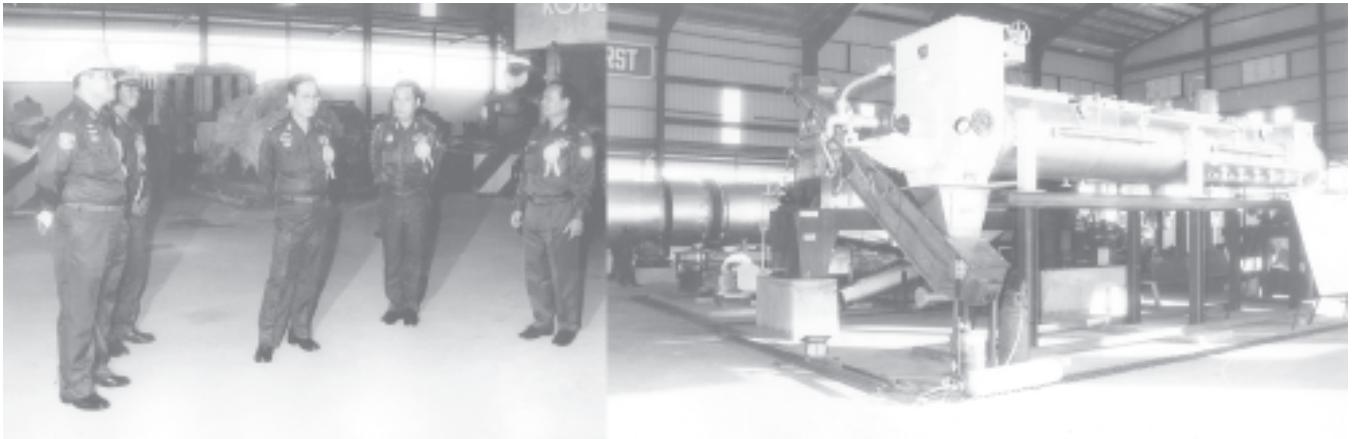
Prime Minister General Khin Nyunt inspects Silver Sea Fishmeal Plant in Silver Sea Fisheries Industrial Zone in Hlinethaya Township.