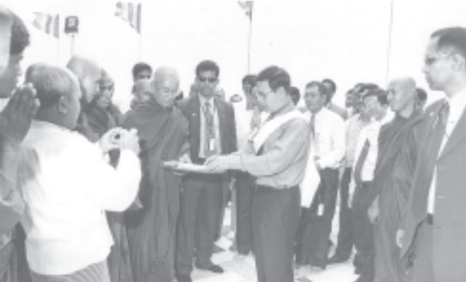
Prime Minister General Khin Nyunt presents cash donations towards Maha Sukha Hsutaungpyay Pagoda.