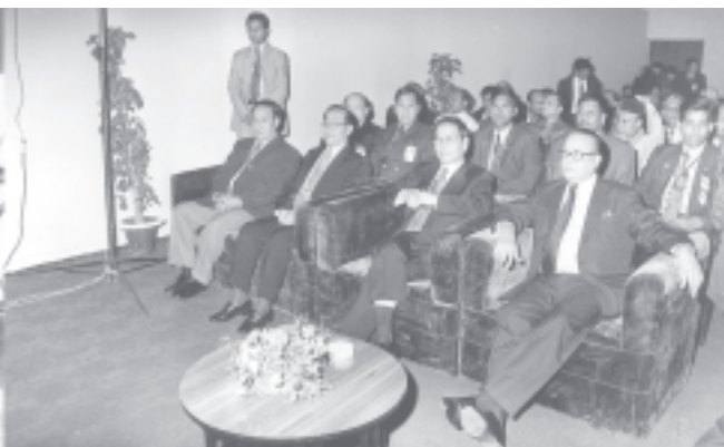
Traditional dances being presented to Prime Minister General Khin Nyunt and party at the dinner in Chittagong.—MNA