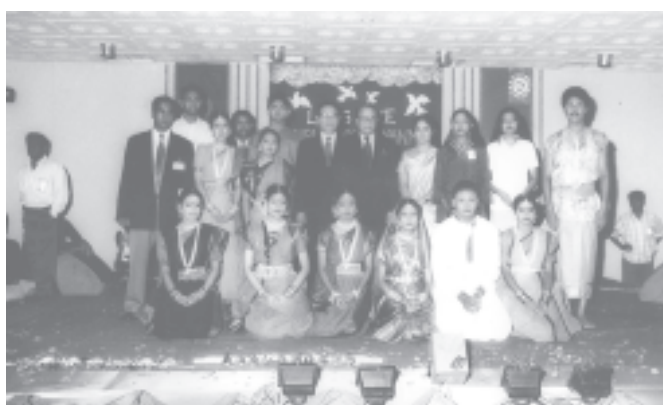
Prime Minister General Khin Nyunt poses for documentary photo at the dinner in Chittagong.