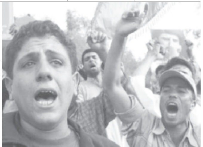
Iraqis holding a poster of cleric Moqtada Al-Sak at rear, demonstrate near the US Green Zone in Baghdad, on 30 March, 2004, in response to the closure of the Al Hawza newspaper.