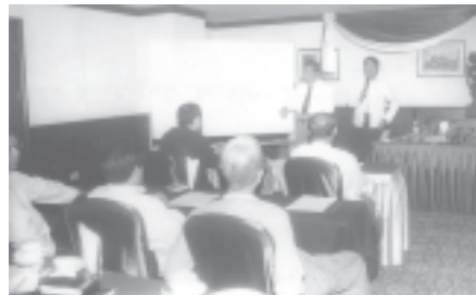
The seminar on developing production of wood furniture in progress.