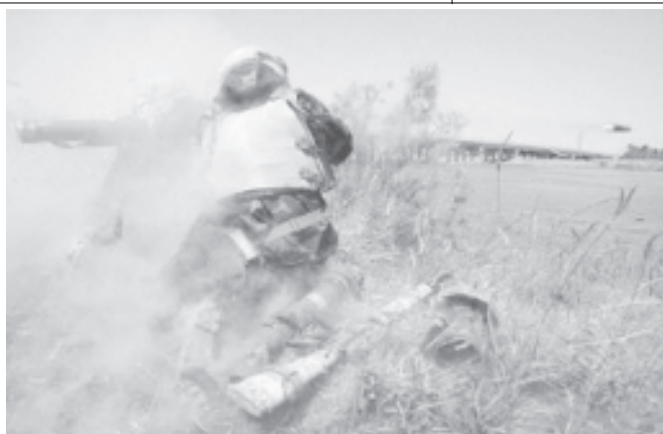
A US Marine fires a rocket at a target on the opposite bank of the Euphrates River south of Nasiriyah during last year's fighting. A military investigation has blamed a forward air controller for a US air attack that mistakenly struck US Marines in Nasiriyah a year ago in the worst friendly fire incident in the US-led invasion of Iraq.