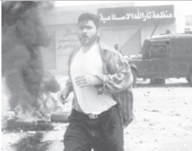
A wounded Iraqi man runs during a fight with British troops in the southern Iraqi city of Basra on 29 March, 2004. The clashes followed the eviction of anti-coalition activists from a government building they were occupying.