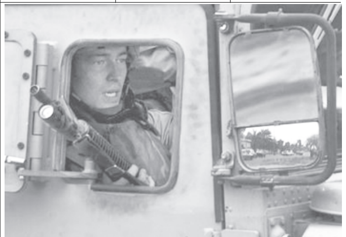
An American soldier drives past the scene of an attack on US transport trucks in Baghdad on Monday, 29 March, 2004. No one was injured in the attack.

joint ventures or fully foreign-invested enterprises are already allowed to be established. We might also consider completely removing the cap in non-strategic areas such as tree plantation and confectionery production," Dung said. — MNA/Xinhua