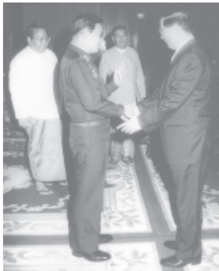
Prime Minister General Khin Nyunt greets Vietnamese Minister for Foreign Affairs Mr Nguyen Dy Nien. MNA

Afterwards, the Prime Minister signed in the visitors' book and left the factory later in the morning. On completion, the factory will manufacture optical apparatuses, camera, digital camera, laser range finder, various kinds of rifle-scope, lens and prisms. — MNA