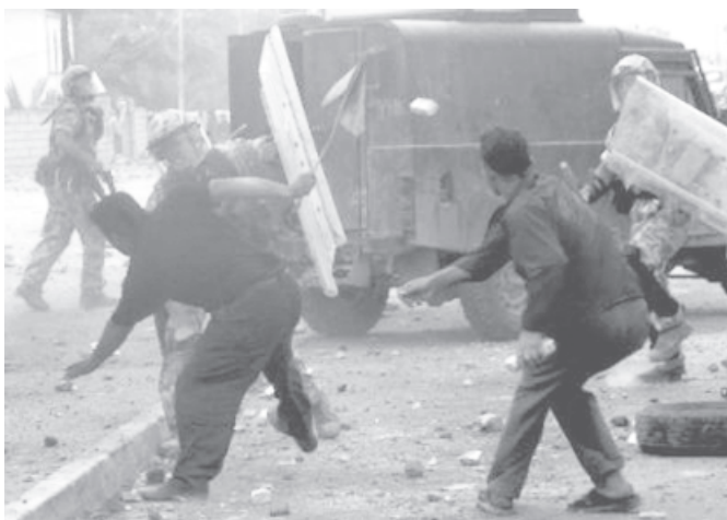
Iraqi men fight with British troops in the southern Iraqi city of Basra on 29 March, 2004. The clashes followed the eviction of anti-coalition activists from a government building they were occupying.