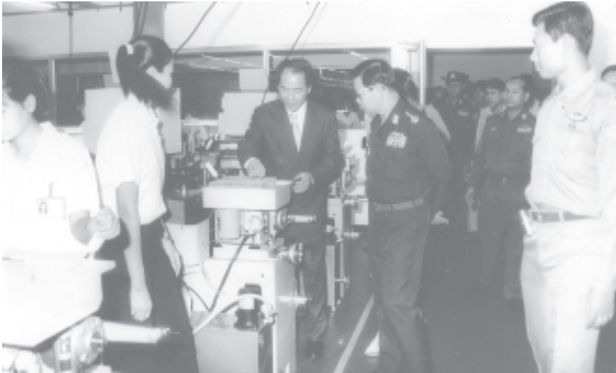
Prime Minister General Khin Nyunt views the production line of the factory of Myanmar Asia Optical International Co Ltd in Mingaladon Industrial Zone.