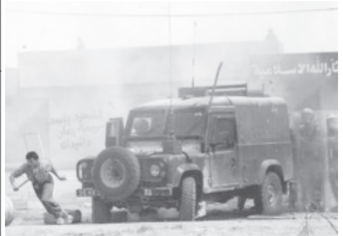
An Iraqi youth, armed with a truncheon, runs from British Army soldiers during a violent protest in the southern Iraq city of Basra on 29 March, 2004.