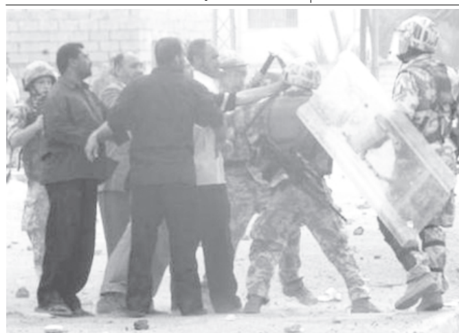
British Army soldiers, part of a "snatch squad", move in to detain an Iraqi man during a violent protest in the southern Iraq city of Basra on 29 March, 2004.