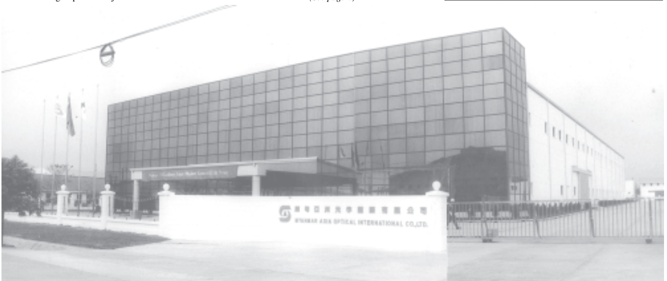
The factory of Myanmar Asia Optical International Co Ltd seen in Mingaladon Industrial Zone.