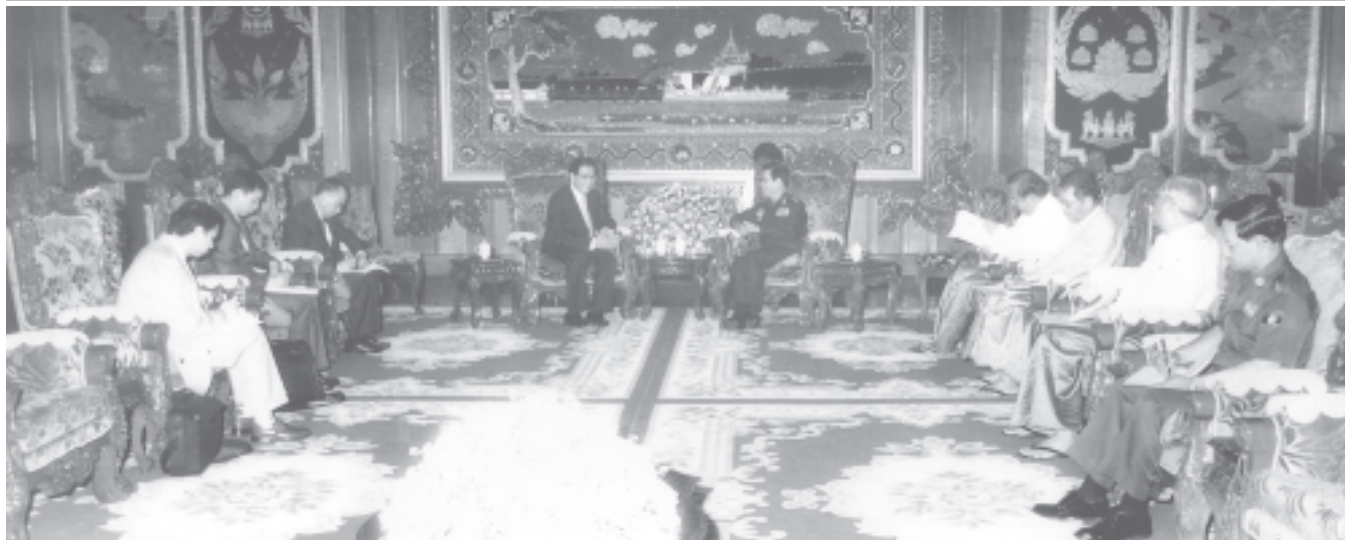
Prime Minister General Khin Nyunt receives Vietnamese Minister of Foreign Affairs Mr. Nguyen Dy Nien at Zeyathiri Beikman.— MNA