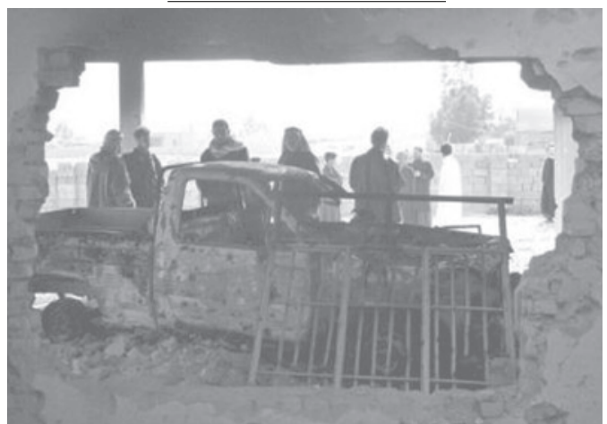
Iraqi men survey the damaged house in the village of Aamriya, near the anti-American hotbed of Falluja, 30 miles west from Baghdad, on 16 February, 2004.