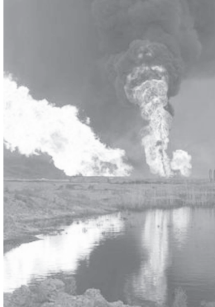
Flames and smoke rise from a burning oil pipeline near the Iraqi town of Samarra, Iraq, on 26 Feb 2004.