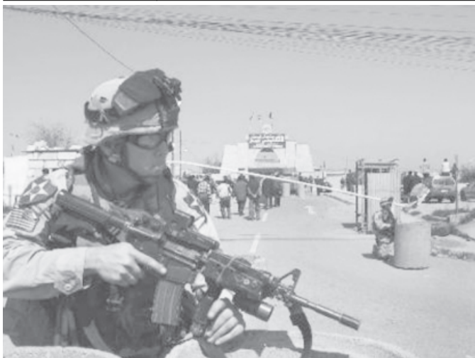
US troops secure the downtown area of Mosul in northern Iraq recently.