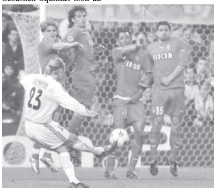
Real Madrid's David Beckham plays a free kick while Monaco's player try to stop the ball with a wall during their Champions League quarterfinals first leg soccer match in Madrid, Spain, Wednesday, March 24, 2004.

After squandering several good chances, Real finally took the lead on 70 minutes when Zidane drilled in at the near post after snapping up the rebound from a Luis Figo shot and seven minutes later Figo himself got on the scoresheet to make it 3-1.