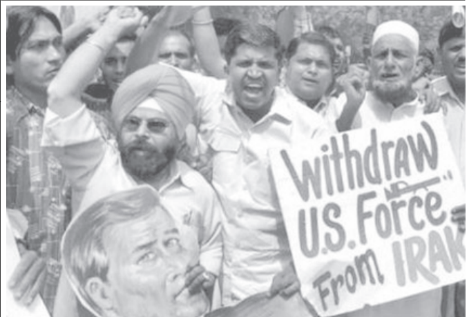
Indian activists shout anti-US slogans to demand the withdrawal of US troops from Iraq during a protest in New Delhi, on 25 March.

"However, copyright work owners and users need more time to consider the appropriate scope of end-user criminal liability. To allow more time for continued discussions in this regard, all provisions relating to end-user criminal liability have been deleted from the Bill," said the spokesman.—MNA/Xinhua