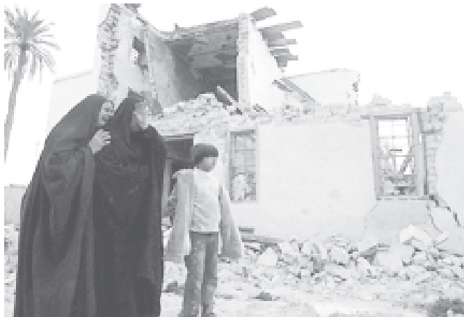
Iraqi women weep as they stand in front of their house destroyed in a car bomb attack in the city of Hilla, 100 kms south of Baghdad on 19 February, 2004.