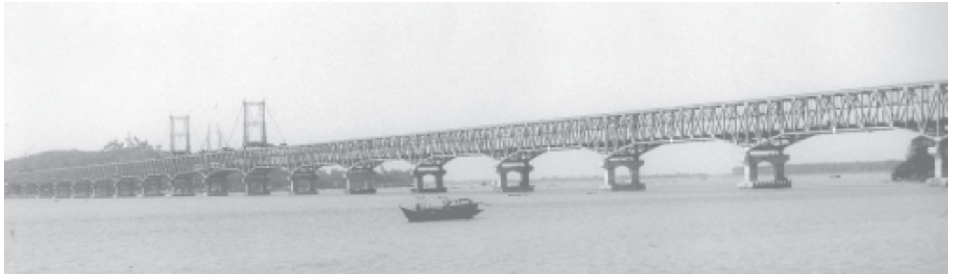
The construction of the Thanlwin Bridge (Mawlamyine) near completion.