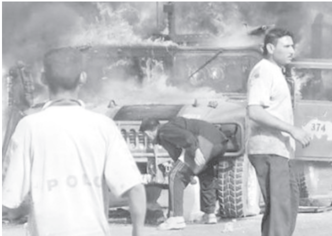
An Iraqi prepares to pour more fuel on a blazing US Army Humvee vehicle following a shootout between American forces and guerillas in the restive town of Falluja on 25 March, 2004. Two US soldiers were killed and four wounded in two separate attacks on convoys in Iraq, the US military said.

Zapatero's Socialist Party won an unexpected general election victory on March 14 having campaigned on a pledge to pull Spanish troops out of Iraq unless the United Nations took over from the US-led coalition.