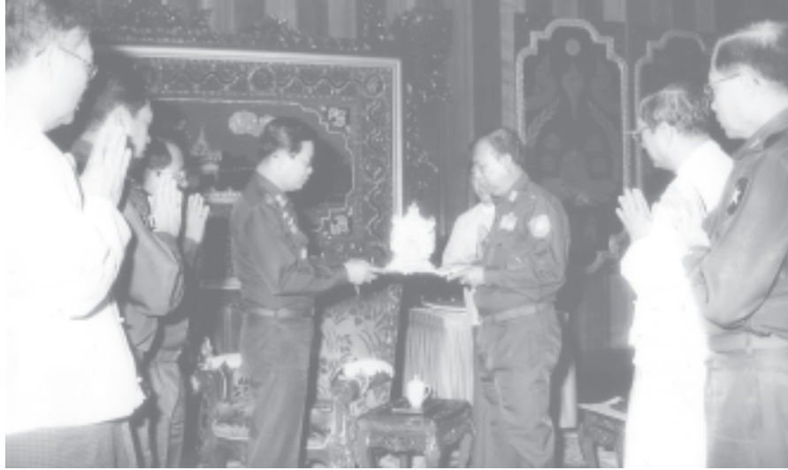
Prime Minister General Khin Nyunt hands over ancient Buddha Image presented by Sayadaw Bhaddanta Sujatasara to Minister for Culture Maj-Gen Kyi Aung.— MNA