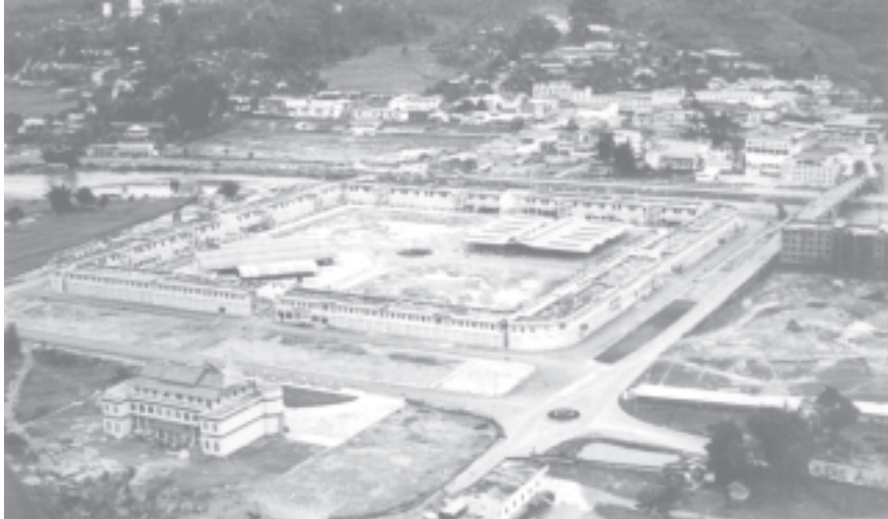
Scene of Mongla, a border town in the process of development.

There were 32 universities, degree colleges and