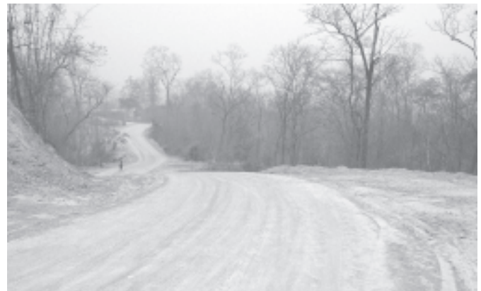
Monywa-Kalewa Road, which reflects combined efforts of the people and the Tatmadaw.