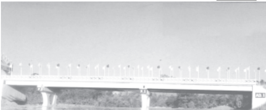
Lapin Bridge has emerged thanks to the collective endeavours of the people and the Tatmadaw.