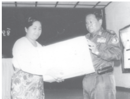
Lt-Gen Ye Myint presents sewing machine for battalions and units of Mawlaik Station. — MNA

Lt-Gen Ye Myint and party arrived back here on 26 March. — MNA