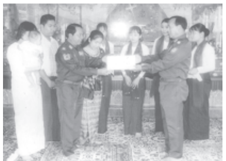
Minister for Information Brig-Gen Kyaw Hsan, wife Daw Kyi Kyi Win and family hand over cash donation for the pagoda to Minister for Commerce Brig-Gen Pyi Sone.