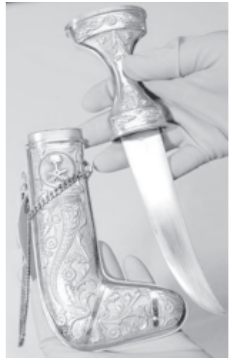
Several members of the media and a US serviceman have been caught attempting to ship Iraqi paintings, weapons and other war souvenirs to America. The photo shows a gold dagger from Iraqi museum that was seized in Atlanta, America.