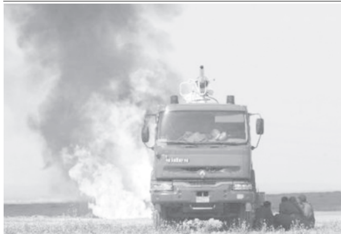
Iraqi firemen sit next to their fire truck near the burning pipe station of an oil well in Kubazah oil field in Kirkuk, northern Iraq, on 26 March.