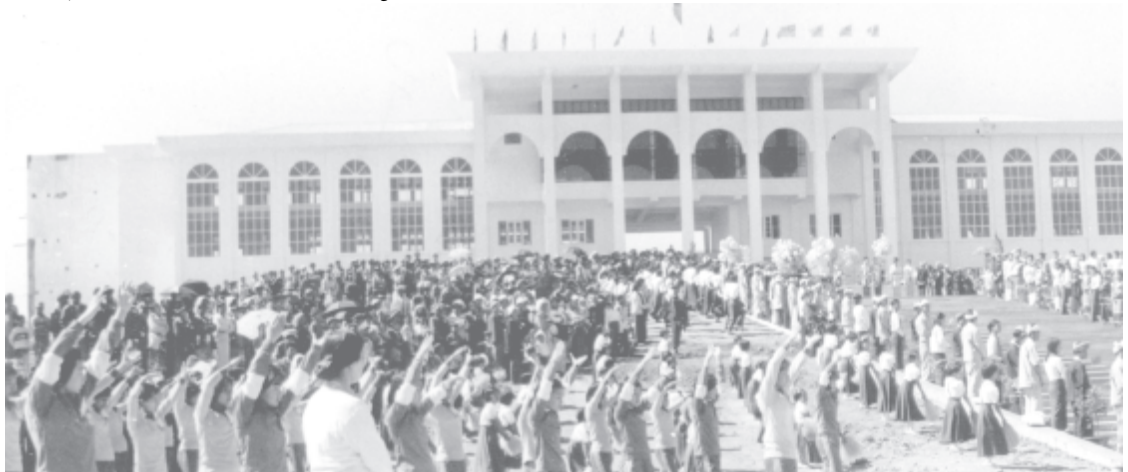
Government Computer College in Panglong, Loilem District, Shan State (South).