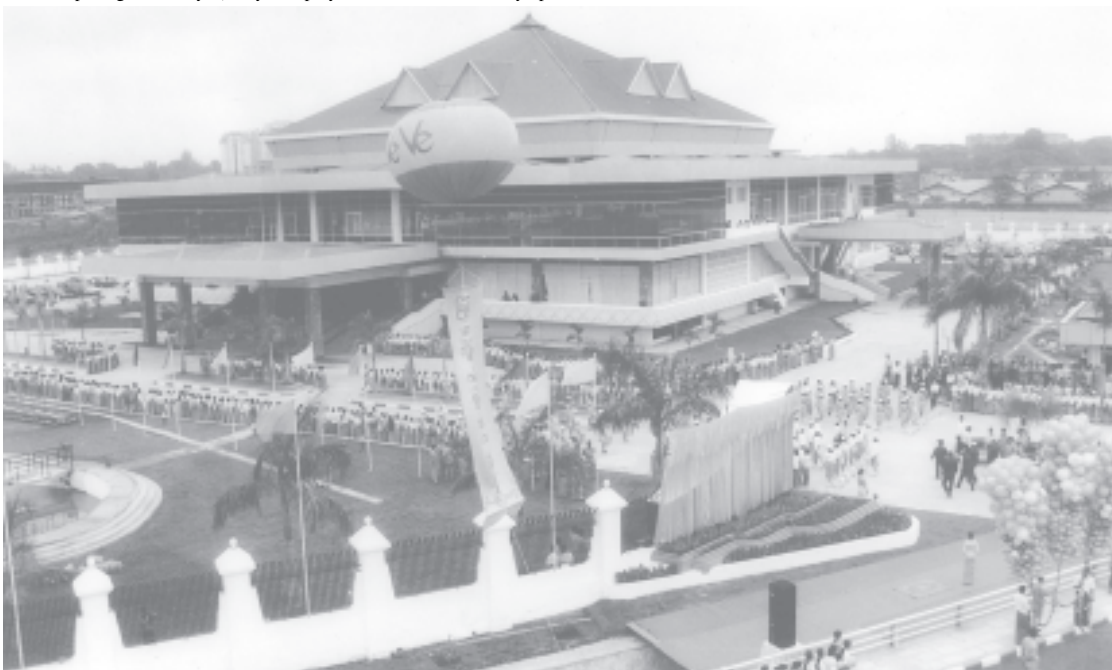
Newly opened Myanmar Convention Centre on Mindhamma Road in Mayangon Township.

59 th Anniversary Armed Forces Day commemorative special features on pages 7, 8 and 9.