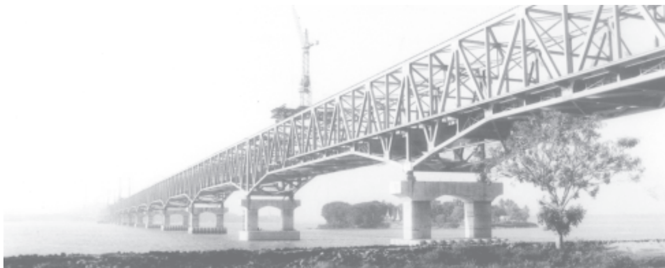
Thanlwin Bridge (Mawlamyine), the greatest and longest of its kind in Myanmar, to be opened soon.