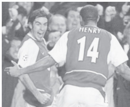
Arsenal's French forward Robert Pires (L) of France celebrates his goal against Chelsea with Thierry Henry during their Champions League quarter-final, first leg soccer match at Stamford Bridge in London March 24, 2004.

Following its identical 1-0 win over China and Iran, South Korea, who converted the winner from the spot in the first half, has accumulated nine points for a comfortable lead in the group. Iran ranked second on one win against one loss for three points. China scored one point from two games while Malaysia trailed in the group on one point from three games. Only the group winner will qualify for the men's soccer tournament in the Olympic Games.