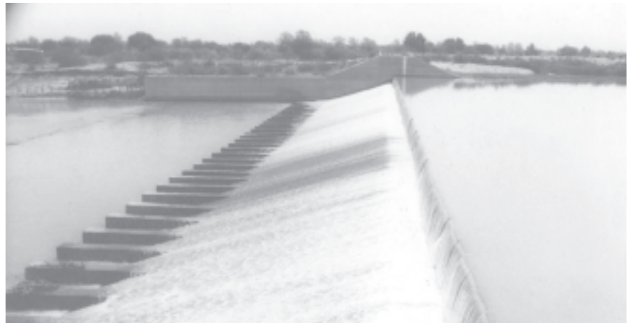
Thedaw Dam has emerged in Letpandan Township, Bago Division, thanks to collective endeavours of the people and the Tatmadaw.