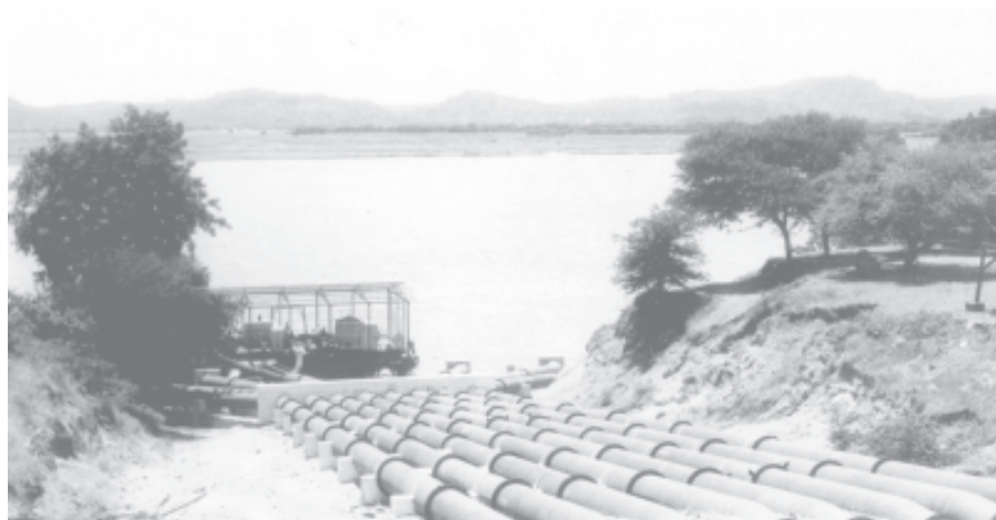
Lawka Nanda river water pumping station in Nyaung U District, Mandalay Division.

89 dated 25 May 1989 with a view to taking measures for improvement of socio-economic life of people in border areas that lagged behind in development in successive eras because of poor