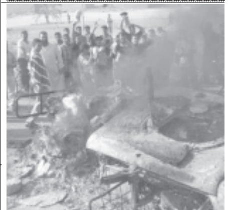
Iraqi men cheer by an American humvee that burns after it came under attack during a shootout in the Iraqi town of Fallujah, on 25 March.