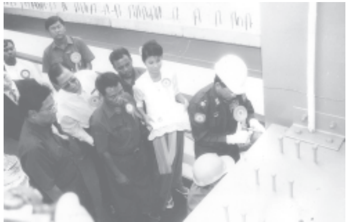
Minister for Construction Maj-Gen Saw Tun fixes golden bolt at the frame of Thanlwin Bridge (Mawlamyine).

The Government has been upholding Our Three Main National Causes and implementing the 12 State's Objectives. In addition to other ministries, the Ministry for Progress of Border