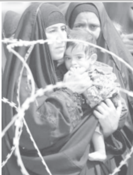
Homeless women protest outside an administration building in the southern Iraq city of Basra on 24 March, 2004 after they and their families were evicted from government owned premises.