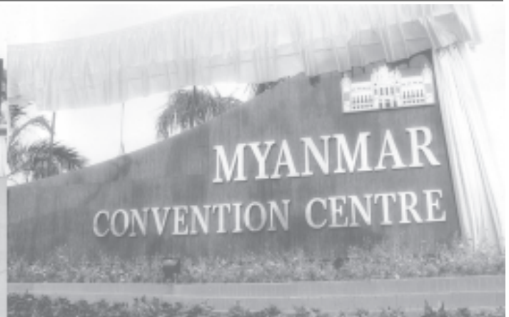
Prime Minister General Khin Nyunt unveils signboard of Myanmar Convention Centre.— H