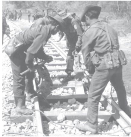
Tatmadawmen in action at Htiri-Htihtehto section for timely completion of Hsaikkhaung-Namhsan Railroad.