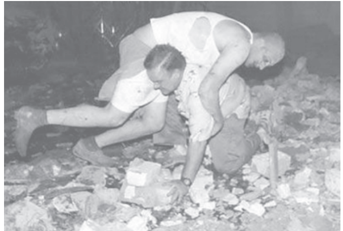
A man is rescued from the rubble after a bomb explosion at Mount Lebanon Hotel in central Baghdad on 17 March, 2004.