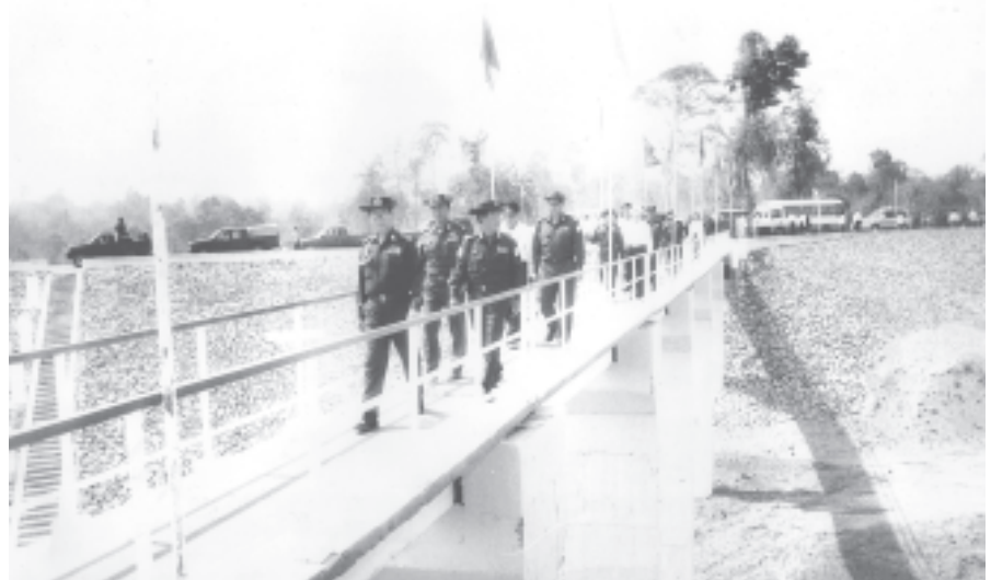
Prime Minister General Khin Nyunt inspects Paunglin Dam (Support dam to Ngamoyeik Reservoir).