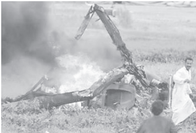
Iraqi men run towards the wreckage of US helicopter which crashed near Fallujah on 9-12-2003.

After making accusations, US and allies troops invaded Iraq using excessive force. Since the end of major combat in Iraq was declared on 1 May, at least 18 military helicopters have crashed or been shot down in Iraq, killing a total of 64 US soldiers.