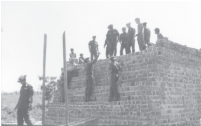
Tatmadaw members from No 33 Light Infantry Division contributing towards the Bagan-Kyaukpadaung Railroad Project in co-operation with the people.