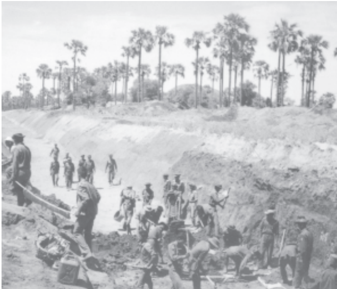
Tatmadaw members from No 33 LID carry out land preparations for the Bagan-Kyaukpadaung Railroad Project.