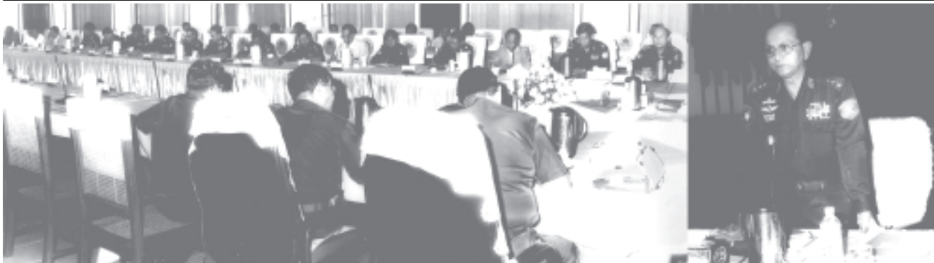
Secretary-2 of the State Peace and Development Council Lt-Gen Thein Sein addresses coordination meeting on collection of road and bridge tolls.