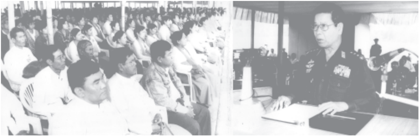
Prime Minister General Khin Nyunt addresses opening of Paunglin Reservoir in Hlegu Township, Yangon Division. (News page 1)