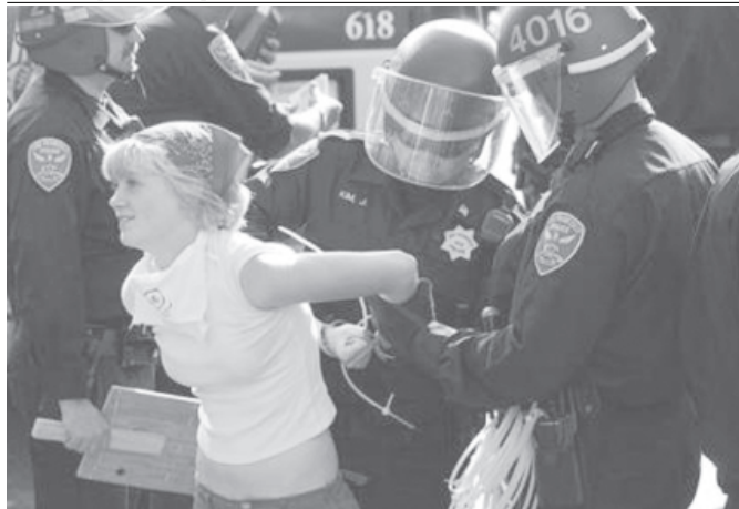
A demonstrator is restrained as police make a mass arrest during an anti-war protest in San Francisco, on 20 March, 2004. Hundreds of thousands of people around the world rallied against the US presence in Iraq on the first anniversary of the war.