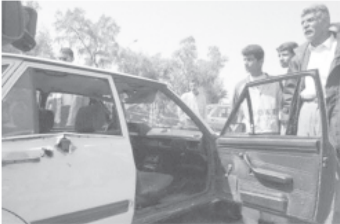
Iraqi onlookers gather around a damaged car in central Baghdad where a projectile exploded. Up to two people were killed and several wounded as the US coalition headquarters in Baghdad came under rocket attack, pushing Iraq into its second year of occupation amid a rising wave of violence.