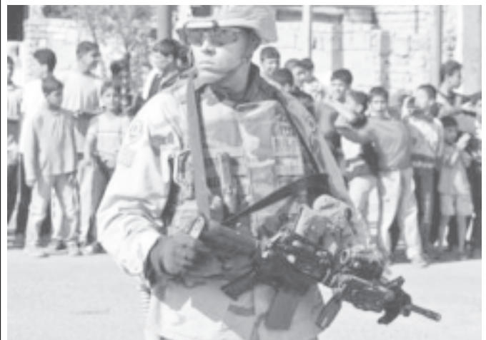
A US Army soldier escorts as other forces defuse a roadside bomb in the Baghdad suburb of Al Mashtal on 20 March, 2004.—INTERNET

The inspection committees also caught a number of bank employees involved in receiving millions of dinars under the name of branches in the south of Iraq and according to certificates entitling them to do so.— MNA/Xinhua