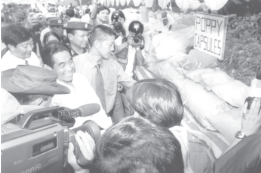
The Tatmadaw and people collectively eradicate the danger of narcotic drugs. A ceremony to destroy narcotic drugs in progress.

ures will further delay the process of democracy in Myanmar and to sink the people deeper into poverty. The friendly quarters are asking whether the sanctions and punishments are meant for the flourishing of democracy in Myanmar or for a minion to gain power. Help and co-operation should be rendered for the flourishing of democracy in Myanmar, they also said in expressing their attitude.