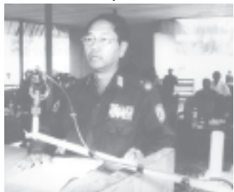
Commander Maj-Gen Myint Swe. — MNA

pleted Mahuya reservoir will help supply water to Ngamoyeik Reservoir, ensuring an adequate supply of irrigation water to Hlegu Township and Thanlyin Township.