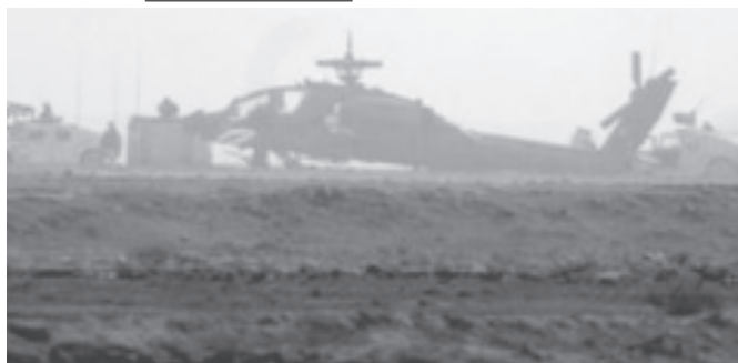
A US Army Apache sits in a field without its rotors near Fallujah on 13 January, 2004. A US Apache helicopter that crashed west of Baghdad may have been shot down by Iraqi guerillas, a US military spokesman said.