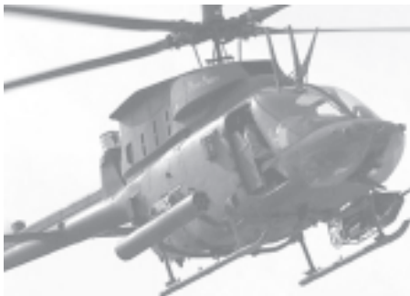
A US army OH-58 Kiowa Warrior helicopter hovers above southern Baghdad. Two American soldiers died as a US helicopter crashed into a river on 25-2-2004.