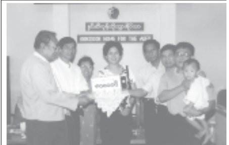
Officer of NeptuneLine (Singapore) and family present K 800,000 for construction of a three-storey hospital at Hninzigon Home for the Aged recently.