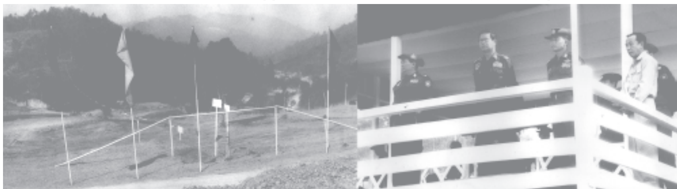
Prime Minister General Khin Nyunt inspects Kaukkwe Creek Dam Project in Lashio Township, northern Shan State. —MNA