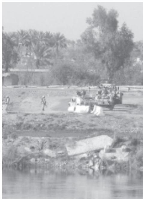
US soldiers patrol along the Euphrates River near the Iraqi town of Haditha during a search operation for a downed US military helicopter which crashed into the river on 25 Feb, 2004, killing two crew members. With the latest crash, the US military has lost 18 helicopters since the occupation began, most to hostile fire, with a total of 64 Americans killed in the crashes.