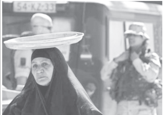
Dutch troops patrolling the southern Iraq city of Samawa on 20 March, 2004.