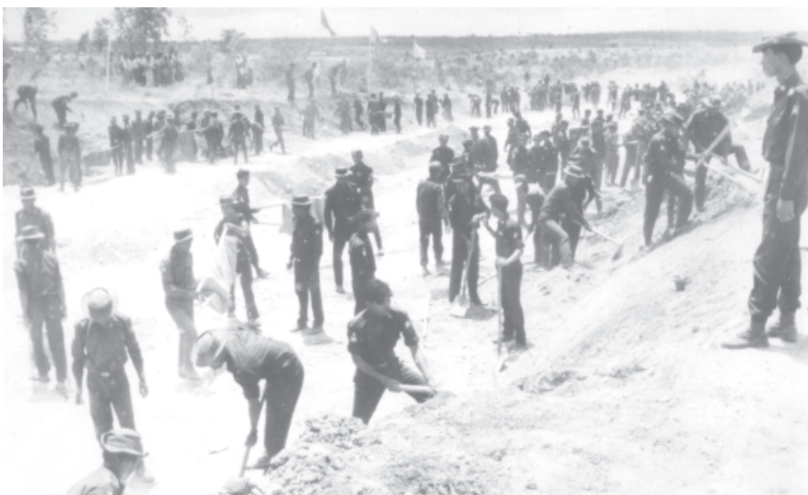
Tatmadaw members making endeavours with might and main in implementing the Bagan-Kyaukpadaung Railroad Project.

Bagan-Kyaukpadaung Railroad Project jointly implemented by the Tatmadaw and the people