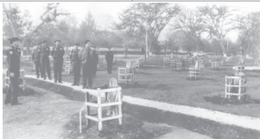
Prime Minister General Khin Nyunt at a plantation of North-East Command.