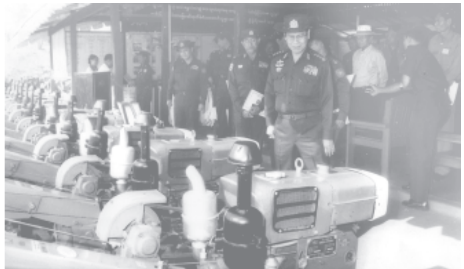
Prime Minister General Khin Nyunt inspects power-tillers for highland cultivation farmers in Lashio, Northern Shan State.