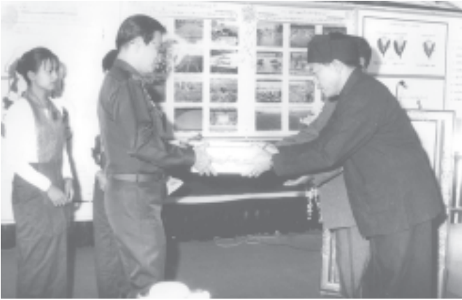
Prime Minister General Khin Nyunt presents power-tillers and K 13.1 million to highland cultivation farmers.