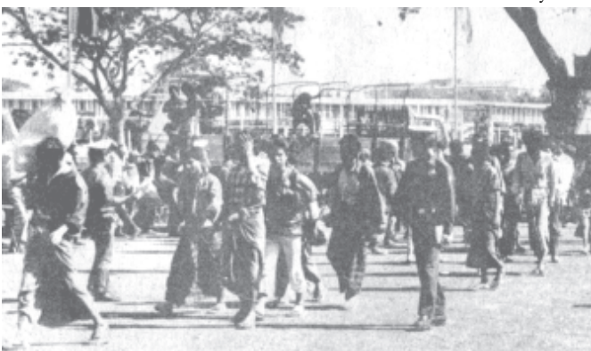
Realizing the truth, the people, who were misled by the fabrication of some foreign radio stations to run away from the nation, come back into the embrace of the mother land. They are warmly welcomed by the people.