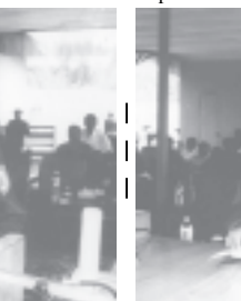
Minister Maj-Gen Nyunt Tin. — MNA

pleted Mahuya reservoir will help supply water to Ngamoyeik Reservoir, ensuring an adequate supply of irrigation water to Hlegu Township and Thanlyin Township.