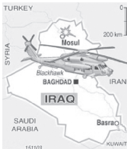
A map of Iraq showing the site of the US helicopter crash in which 17 American troops were killed.

US soldiers speak from their hospital beds about the downing of their Chinook helicopter on 2-11-2003.