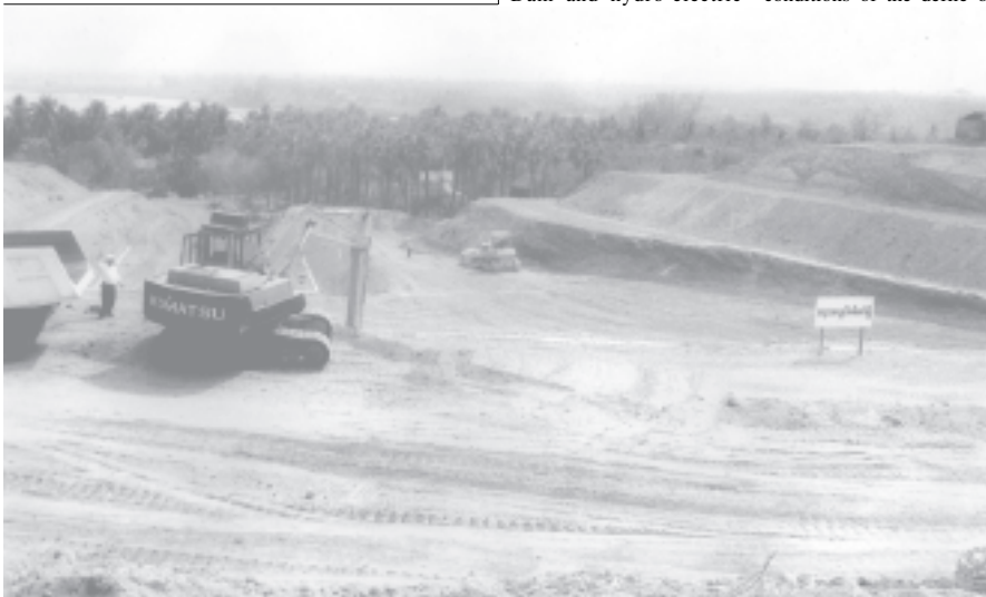
*Secretary-1 Lt-Gen Soe Win inspects Shwesayay Dam and hydro-electric power project. — MNA