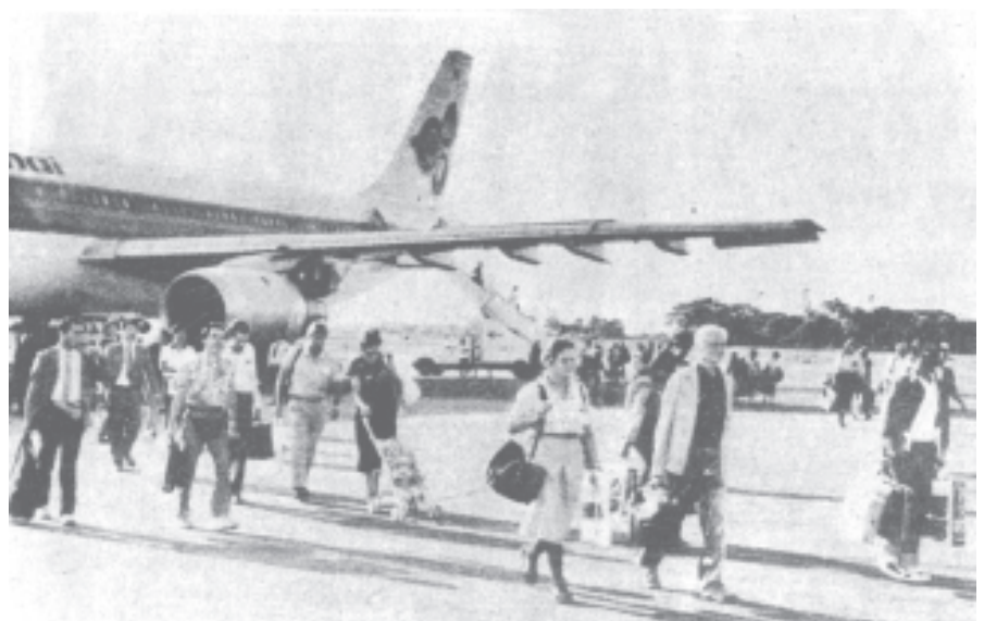
Tourists knowing the objective conditions of Myanmar are visiting the country again and again.