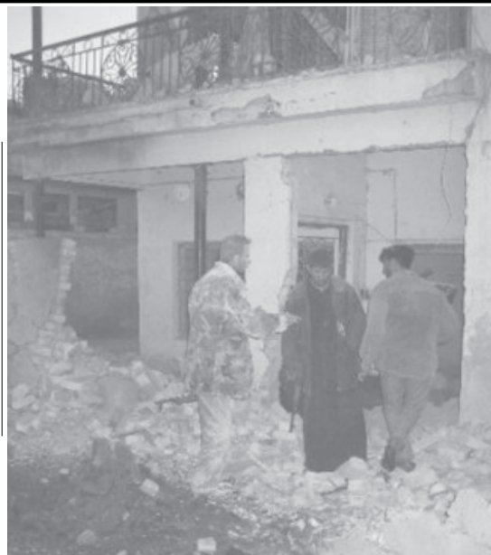
One person was injured in an explosion in Baqouba, 34 miles northwest of Baghdad, Iraq on 10 March 2004. The attack also knocked the wall down.