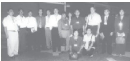
The delegation seen before departure at the airport. (H)

We would like to call upon township-level authorities and departmental personnel to actively and unitedly carry out the development tasks in their respective townships as they play a very fundamental role in the implementation of regional and national development endeavours.