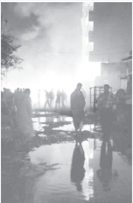
Iraqis stand near the scene of a powerful bomb blast at a hotel in central Baghdad on 17 March, 2004.