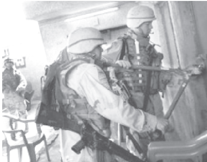
US soldiers cut open a locked door in Baghdad, on 17 March, 2004.