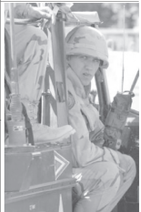
Hungarian troops patrol the Iraqi Kerbala on 17 March, 2004.