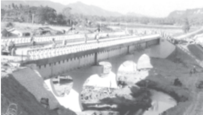
The view of Tein Bridge being constructed by the Tatmadaw in Mingin Township.