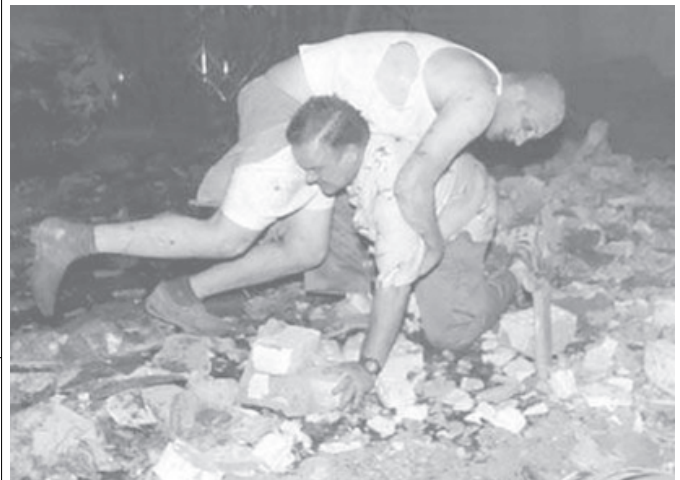
A man is rescued from the rubble after a bomb explosion at Mount Lebanon Hotel in central Baghdad on 17 March, 2004.