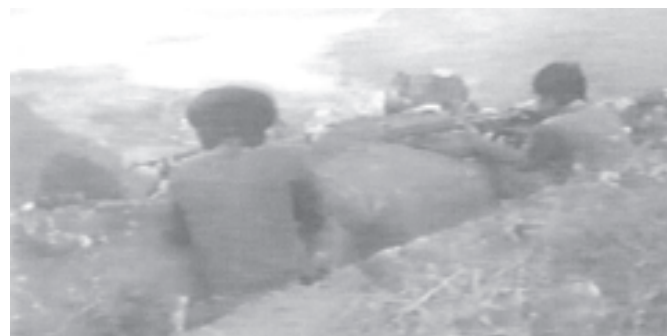
Myanmar soldiers being engaged in Sisiwan-Tarpang battle.

ship to provide food for the Tatmadaw members. Members of Red Cross Society and Auxiliary Fire Brigade also gave moral encouragement to the Tatmadawmen. The people helped the Tatmadawmen to be equipped more with nationalistic spirit by sending to the Tatmadawmen high-spirited poems and words of encouragement written on the packs of foodstuff and