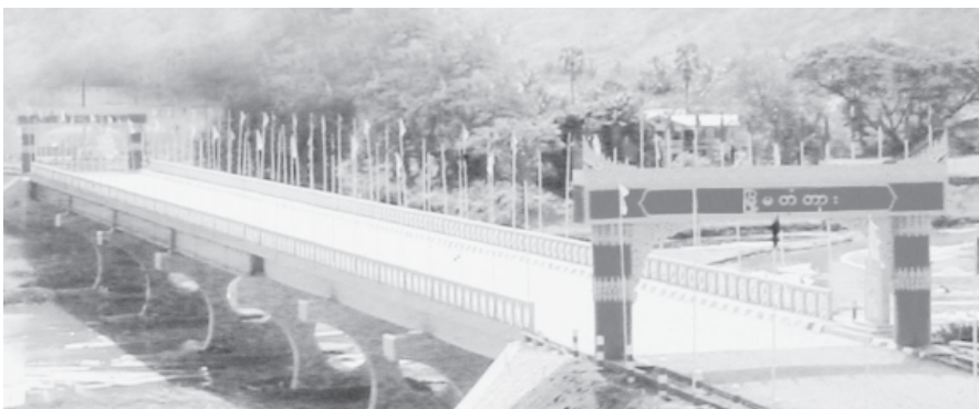
The Myoma Bridge in Kani. It will be inaugurated soon.