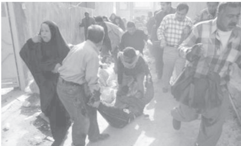
Iraqis, carrying the wounded, run from the explosions in Kerbala, Iraq, on 2 March, 2004.

The only superpower should recognize that, far from disturbing, it should contribute to the creation of a peaceful world entitled to both justice and development for all. But, those with the most ability to prevent and remove the threats to peace are the ones causing the war today and as a result innocent civilians like many Iraqi people are becoming the victim of war.