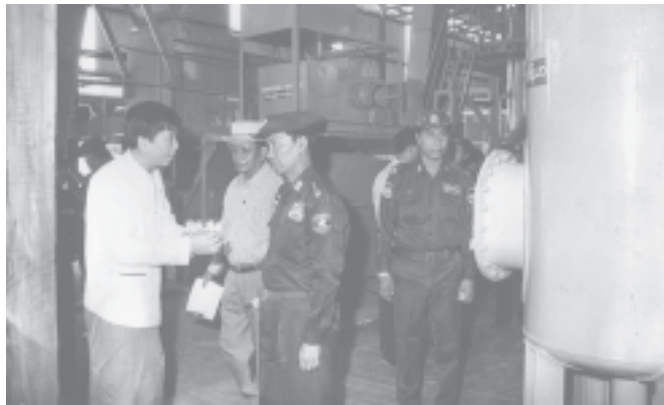
General Thura Shwe Mann inspects new oil palm oil mill of Shwe Oil Palm Co Ltd in Kawthoung Township.—MNA