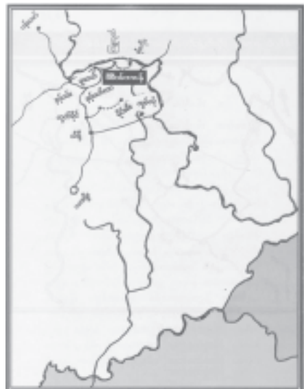
Map showing Sisiwan-Tarpang battle.