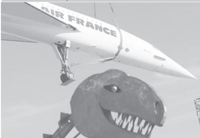
The Air France Concorde F-BVFB is lifted above a sculpture of a Tyrannosaurus Rex, to its final position on top of the roof of the "Technics Museum" in Sinsheim, southern Germany, on 17 March, 2004