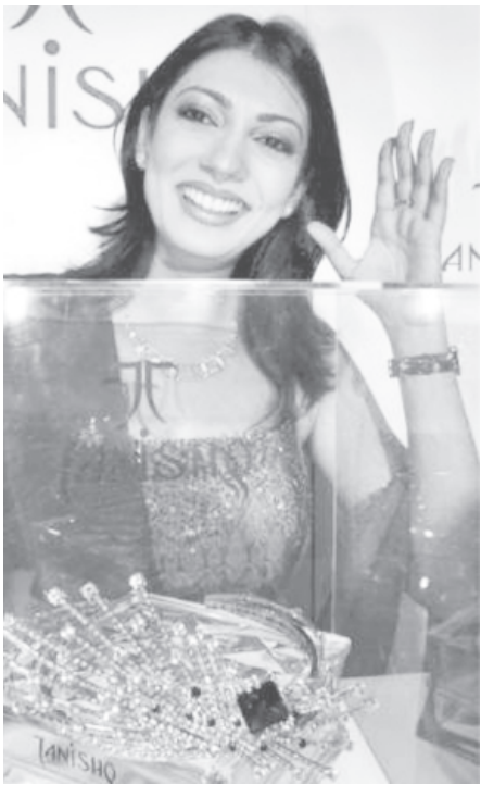
Bollywood actress and former Miss World Yukta Mookhey poses as she unveils the crown designed for the Miss India contest in New Delhi on 17 March, 2004. Twenty-nine finalists from all over India will vie for Miss India crown during the main event on 27 March.