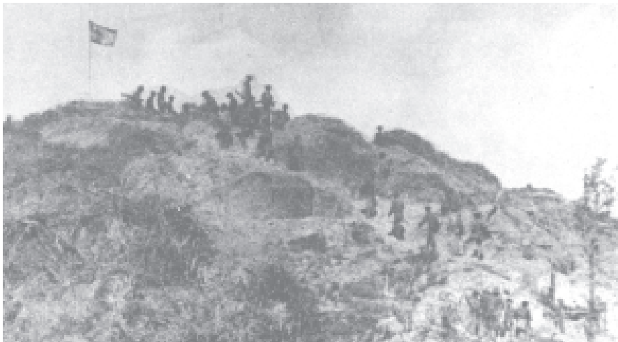
Tatmadaw members celebrate their victory over the insurgents at Tarpang camp after reoccupying Sisiwan-Tarpang on 9 December 1986.

Tatmadawmen felt reluctant to sacrifice their lives for that purpose. It is man that shall die one day. We, Tatmadawmen, have deemed it noble to die in action for the country and