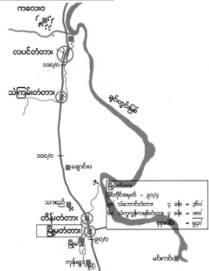
The map showing the location of Myoma Bridge.