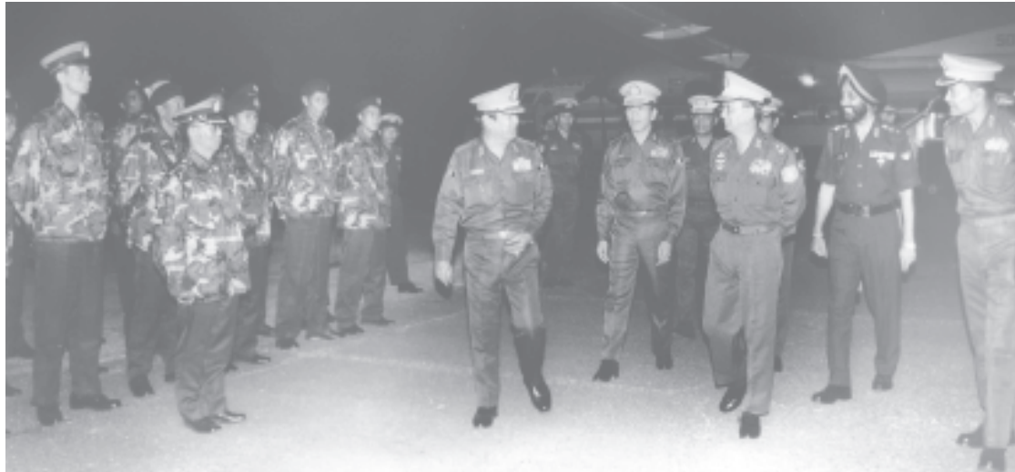
Adjutant-General Lt-Gen Thein Sein welcomes back Myanmar Tatmadaw football and volleyball teams at the airport.