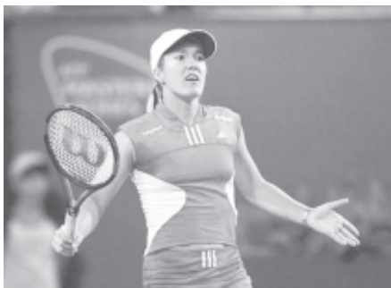
Justine Henin-Hardenne of Belgium reacts to an out call during her fourth round match against Czech Republic's Barbora Strycova in the Pacific Life Open tennis tournament on 16 March, 2004, in Indian Wells, Calif.