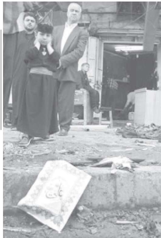
Blood and debris are scattered on the road in the Khadimiya district of Baghdad following a powerful explosions recently, in Iraq.