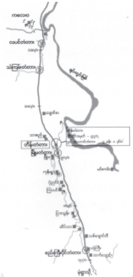
The map showing the location of Tein Bridge.