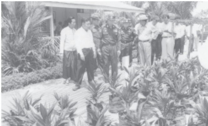
General Thura Shwe Mann views oil palm nursery of Yuzana Co Ltd in Khamaukyi.