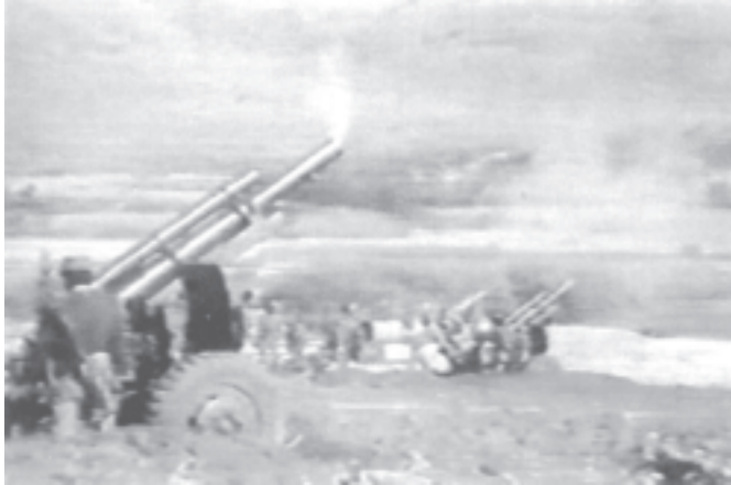
The artillery unit giving supporting fire for Tatmadaw members in Sisiwan-Tarpang battle.

The Tatmadaw's victory over Sisiwan-Tarpang battle had been due to the cooperation of national people. Indivisible are the Tatmadaw and the people just as a saying goes, 'No line can be drawn in water'.