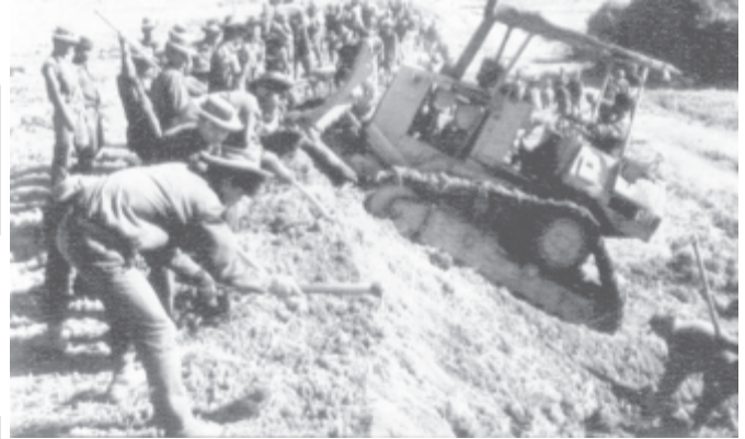
Tatmadaw members in action at a bridge project site on Monywa-Kalewa Road.