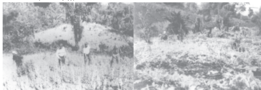
The 5.5 acres of poppy plantation being destroyed by the combined team.

YANGON, 18 March — Members of local intelligence unit and Myanmar Police Force on 21 and 22 February destroyed 5.5 acres of poppy plantation in Kyauklongyi Village in Momeik Township, Shan State (North). A total of 7,181.73 acres of poppy plantation have been destroyed in this poppy cultivation season. MNA