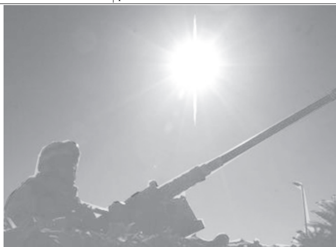
US Army troops seal off a highway in the Iraqi capital of Baghdad after a roadside bomb attack mortally wounded an American soldier on 14 March, 2004.