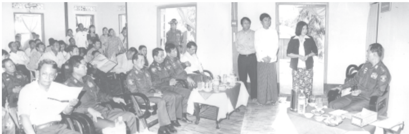
General Thura Shwe Mann hears tasks of State-owned Nyaungbinkwin rubber and oil palm farm by an official.