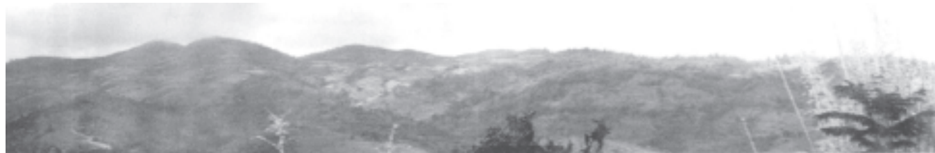
Sisiwan-Tarpang mountain range.

The Tatmadaw has been discharging national-defence duties. The Tatmadaw has crushed every destructive force violating security and sovereignty of the State. It had to launch the 40-day Kunlong battle, Hopang, Chushwe, Pankok and Panlon battles with the Burma Communist Party (BCP) in the northeast of Myanmar. The Sisiwan-Tarpang battle launched against the BCP in 1986 was a significant one in the military history of Myanmar. The battle reflected the great courage of Tatmadaw members as they engaged in the battle at risk to their lives.