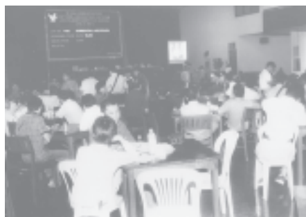
Jade lots being sold through competitive bidding at the 41st Myanmar Gems Emporium. (News on page 2) — MNA

YANGON, 18 March — With the permission of the Ministry of Commerce, Quartz Int'l Co Ltd will organize Myanmar Trade Fair 2004 at Yangon Trade Centre from 2 to 5 April. On display at the fair will be local and foreign cosmetics and consumer's goods, textiles, plastics, foodstuff, electric and electronic appliances, construction materials, household utensils, paper, stationery, packing machines, small machinery and traditional and western medicines. — MNA