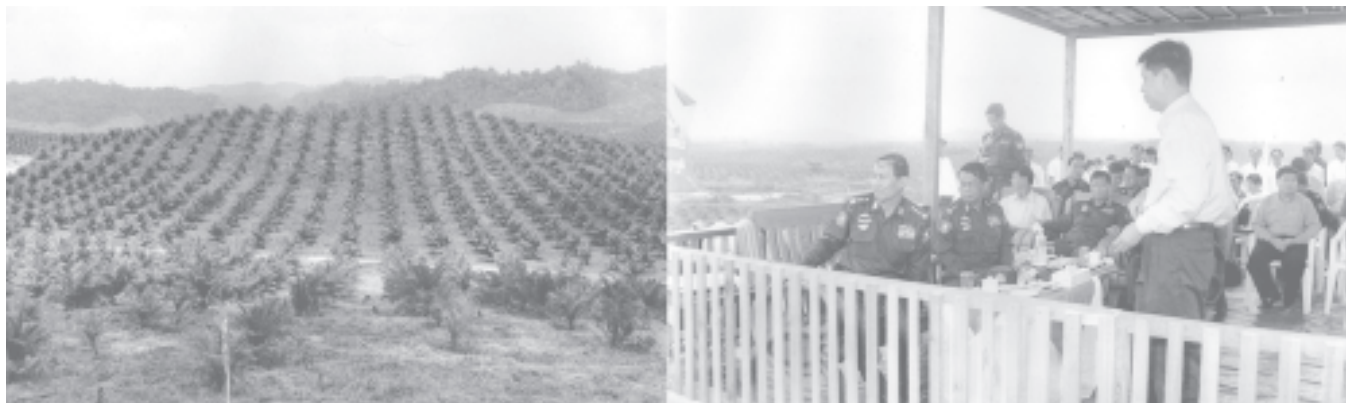
General Thura Shwe Mann inspects oil palm plantations of Po Kaung Co Ltd in Bokpyin Township.— MNA