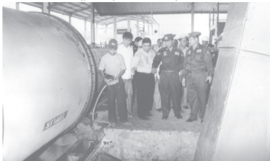
General Thura Shwe Mann sees over production of crude palm oil mill of South Dagon Oil Palm Co which can produce 7.5 tons per a day in Mahe Camp, Bokpyin Township.—MNA

target of planting oil palm on 7,000 acres in the township, progress in growing oil palm on over 5,000 acres and preparations for building crude palm oil mill. Commander Brig-Gen Ohn Myint gave a supplementary report.