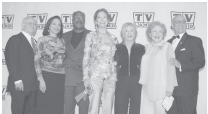
Actress Mary Tyler Moore (C) poses with cast members Ed Asner, Valerie Harper, John Amos, Moore, Cloris Leachman, Betty White and Gavin MacLeod (L-R) after accepting the Ground Breaking Show award for her series 'The Mary Tyler Moore Show' during a taping of the second annual TV Land Awards in Hollywood on 7 March, 2004.

Chinese goods like rice, fruit and stationery were in demand in Tajikistan, but the lack of a direct trading port in the past meant goods had to be transported via a third country, which doubled or tripled costs.