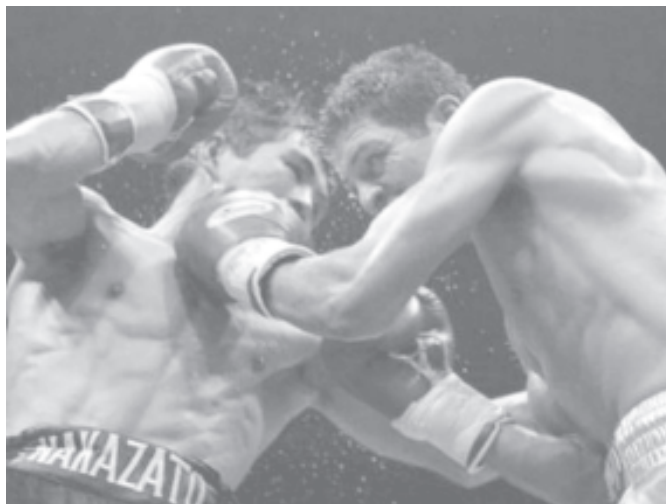
World Boxing Council (WBC) super bantamweight champion Mexico's Oscar Larios (R) lands a punch onto the face of Shigeru Nakazato of Japan during their 12-round title bout in Saitama, north of Tokyo, on 6 March, 2004. Larios defeated Nakazato by unanimous decision.