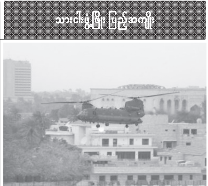
A US Special Forces Chinook helicopter hovers low above the Tigris River near the former Presidential Palace (background right) of Iraqi President Saddam Hussein located at the 'Green Zone' in Baghdad, Iraq late afternoon on 7 March, 2004.

Such heavy investments, which have steadily grown over the past 15 years, have sharply expanded the manufacturing sector to become the second largest component of the country's