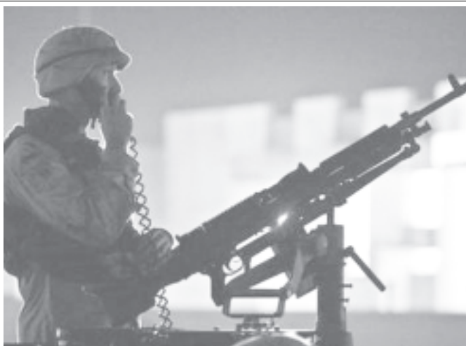
A US soldier stands guard at the scene of a rocket attack in the Iraqi capital Baghdad on 7 March, 2004. Guerillas fired 10 rockets at the headquarters of the US-led administration in Baghdad on Sunday.