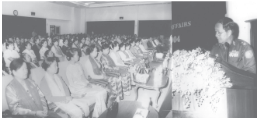
Minister for Social Welfare, Relief and Resettlement Maj-Gen Sein Htwa delivering an address.