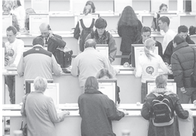
People try computers at an IT fair. UN member nations should promote longer-lasting computers and recycling of old hardware, to avoid high-tech environmental hazards, said a study.