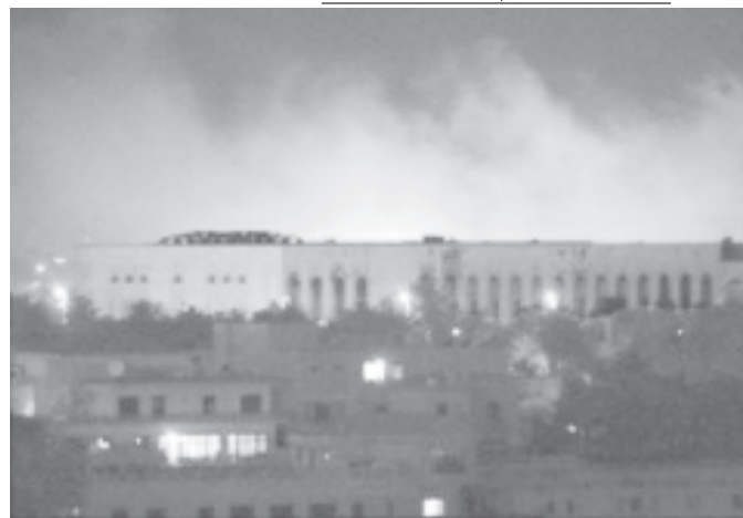
Huge smoke billows at the heavily-fortified area known as the 'Green Zone,' a base for Coalition forces and civilian personnel, after another explosion Sunday evening on 7 March, 2004 in Baghdad, Iraq.