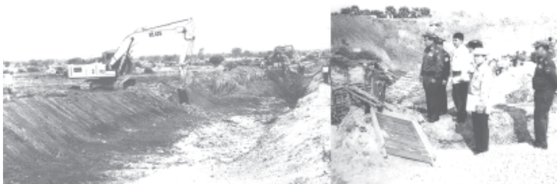
Lt-Gen Ye Myint inspects digging of a feeder canal from Thittetgon Diversion Weir to extend sown acres in the area.

The deputy minister proceeded to Mandalay Division Customs Department and Internal Revenue Department and met government's employees under the ministry and gave necessary instructions. Later, the deputy minister also inspected Myanma Economic Bank in Sagaing Division. MNA