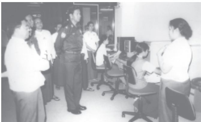
Minister Maj-Gen Hla Tun inspects the computerized banking services at Myanmar Foreign Trade Bank.