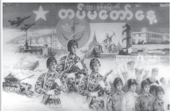
The 59th Anniversary Armed Forces Day commemorative postcard.