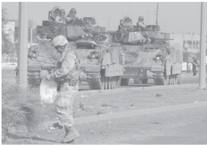
US military vehicles block a highway as a US soldier collects evidence at the scene of a roadside bombing in Baghdad recently.