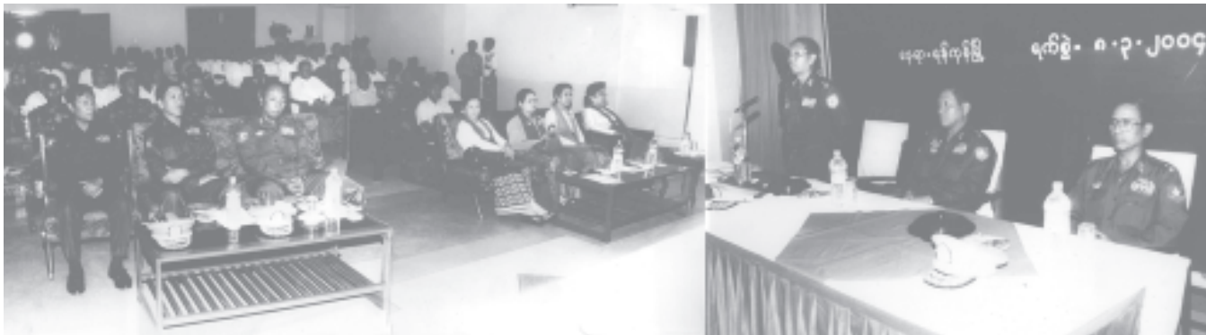
Lt-Gen Tin Aye attends ceremony to donate cash for the 59th Anniversary Armed Forces Day Parade while Maj-Gen Myint Swe delivers an address.