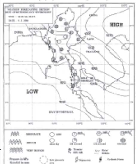
Weather Map of Myanmar and Neighbouring Areas

05:55 (Keng Tong) Ah- Hla-Kabya-Pan- Pawah 06:00 National News 06:05 Expedition of Rare Crocodile Species In- habiting in Fresh And Seawaters (I) 06:10 Song "Feel like an Earthquake" 06:15 National News 06:20 Myanmar Rattan Fu- niture for the Connois- seurs 06:25 Song "Moonlight" 06:30 National News 06:35 Excursion in Yangon River 06:40 Early Silver Jubilee Era of Myanmar Mo- tion Picture 06:45 National News 06:40 Early Silver Jubilee Era of Myanmar Mo- tion Picture 06:45 National News 06:50 Folk Art of Pottery 06:55 Khame Traditional Cultural Dance 07:00 National News 07:05 Conservation of Forest Resources in Myanmar 07:10 Songs On Screen "Flourishing" 07:15 National News 07:20 Discussion Points on Lacquerware College 07:25 Song of Myanmar Beauty & Scenic Sights "Come and See Myanmar"