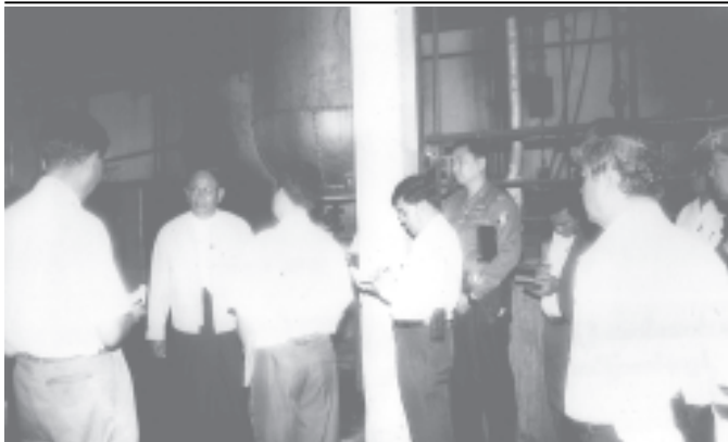
Minister U Aung Thaung inspects the soap factory of Myanmar Pharmaceuticals Industries in Mayangon Township. — MNA

Today's donations included K 37,207,000 and materials worth K 25,517,050 by 92 wellwishers. — MNA