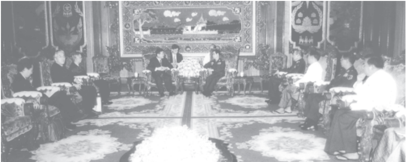
Prime Minister General Khin Nyunt receives Mr Koichi Kato, Member of the House of Representatives of Japan, and party. — MNA