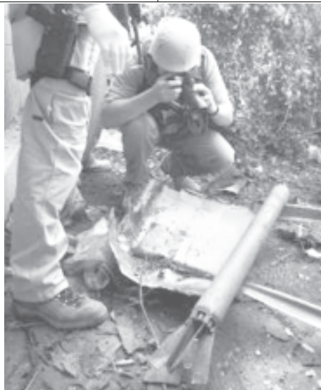
US military inspectors examine and photograph the remains of failed rockets, which were left behind after several were fired the night before into the heavily-fortified area known as the 'Green Zone,' a base for Coalition forces and civilian personnel located a few hundred metres away, on Monday, 8 March, 2004, in Baghdad, Iraq.