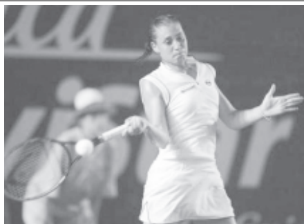
Italian Flavia Pennetta makes a forehand return to Maria Sanchez Lorenzo of Spain during their semifinal match of the Mexican Open tennis championships, in Acapulco, Mexico, on 6 March, 2004. Pennetta won, 6-2, 6-3.