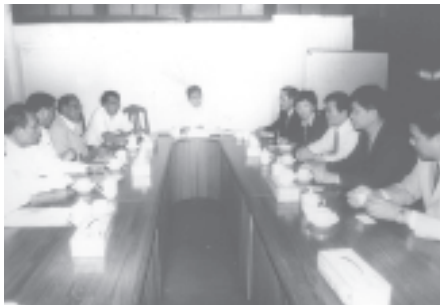
UMFCCI officials meet with officials of CCPIT Guangdong Sub Council.