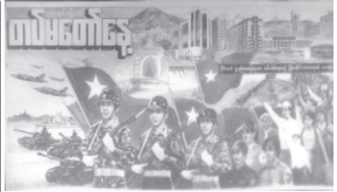
The 59th Anniversary Armed Forces Day commemorative postcard.