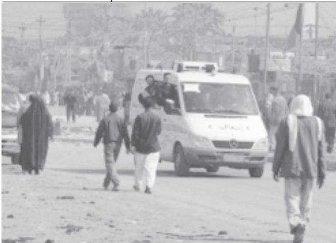
Smoke billows in the distance as an ambulance evacuates people wounded in an explosion in Baghdad's Shiite neighbourhood of Kazimiyah. — INTERNET

Altogether 24,456 visitors from different parts of the world came to Nepal by air in February this year, against the arrival of 16,960 tourists into this country in February 2003, according to a Press release issued by the government bureau. The number of Indian tourists arriving in Nepal grew by 35 per cent to 6,777 visitors, while tourists from other countries recorded an overall increase of 48 per cent to 17,679 visitors. Tourist arrivals from Nepali tourist industry's traditional markets, namely the United States, Britain, Japan and Germany recorded increases of 72 per cent, 49 per cent, 15 per cent and 19 per cent, respectively. While the number of visitors from China decreased by 3 per cent to 355 visitors in this month. Tourist operators here said the unavailability of enough flights has hindered the increase of the number of Chinese tourists. — MNA/Xinhua