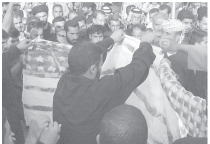
Iraqis burn a US flag during a rally on 3 March, 2004 in Karbala, 110 kilometres south of Baghdad, Iraq, blaming the US for the latest suicide attacks both in Karbala and Baghdad that killed at least 271 people and injured hundreds more.