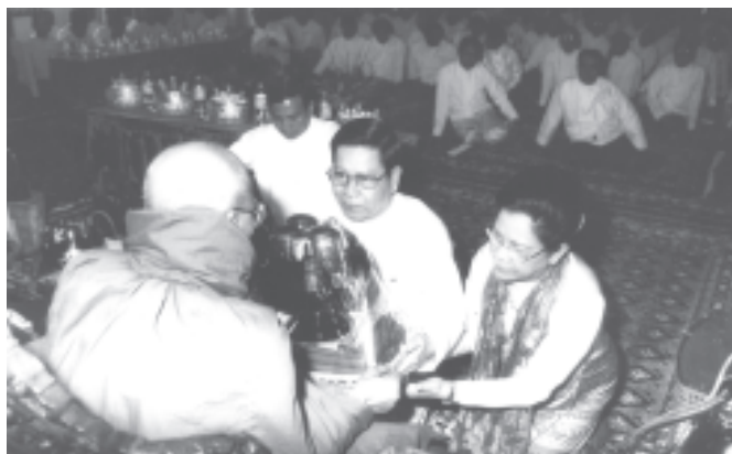
Prime Minister General Khin Nyunt and wife Dr Daw Khin Win Shwe present offertories to a Sayadaw.