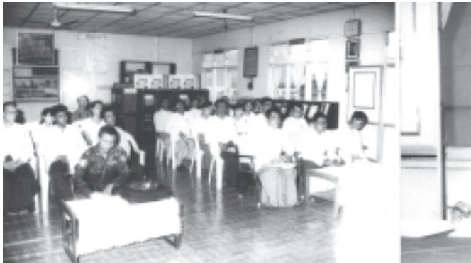
Minister for Information Brig-Gen Kyaw Hsan meets staff of Dawei District IPRD Office.