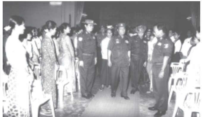
Senior General Than Shwe cordially greets faculty members at convocation hall of Mawlamyine University. (News on page 16)