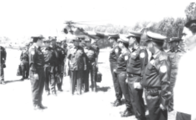
Head of State Senior General Than Shwe being welcomed by officials in Ye, Mon State. (News on page 16)