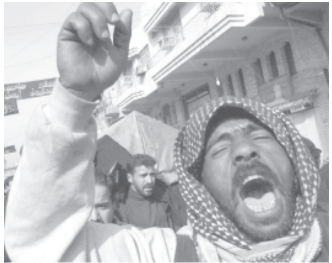
An Iraqi shouts slogans as a funeral of Tuesday's suicide attacks turns into an anti-American protest, on Wednesday, 3 March, 2004