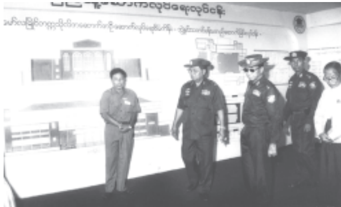
Senior General Than Shwe inspects lay-out plan of convocation hall of Mawlamyine University. (News on page 16)