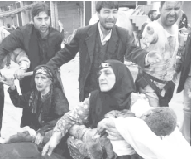
A wave of suicide bombings and mortar attacks has killed at least 271 people in Baghdad and Karbala, Iraq's bloodiest day since Saddam Hussein's fall. Picture shows Iraqis rushing injured away from a blast after explosions rocked Karbala. INTERNET