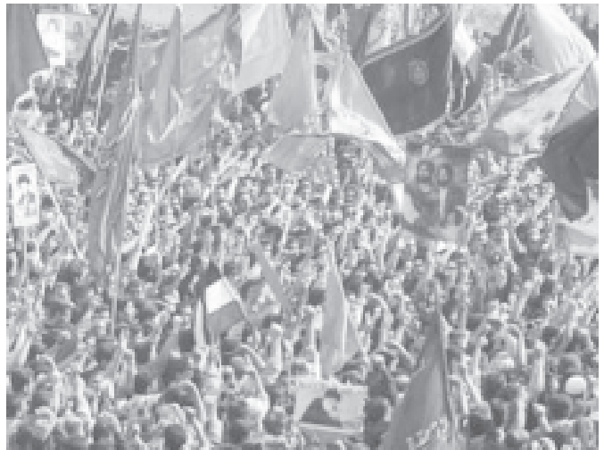
Hundreds of Iraqis march in Baghdad's Shiite neighbourhood of Kazimiyah to protest against the US-led coalition and against the violence that hit the Shiite community on 2 March.