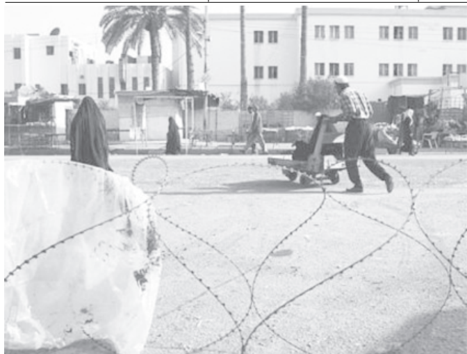
An Iraqi man pushes his wife on a cart as they pass by a blood-stained plastic bag outside a hospital in the Kazimiya neighbourhood in Baghdad, Iraq, on 3 March, 2004.

The jets crashed into a mountainside, sparking a fire in the wooded area, the agency said. The pilots were on a training flight.— MNA/Reuters