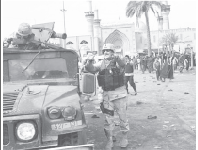
An officer from the US Army 1st Armoured Cavalry Division orders his men to pull back to their base from the site of several explosions in Baghdad on Tuesday, 2 March, 2004.