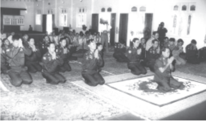
Senior General Than Shwe pays homage to Sayadaws at Thantithukha Dhammayon of South-East Command Headquarters in Mawlamyine. (News on page 16)