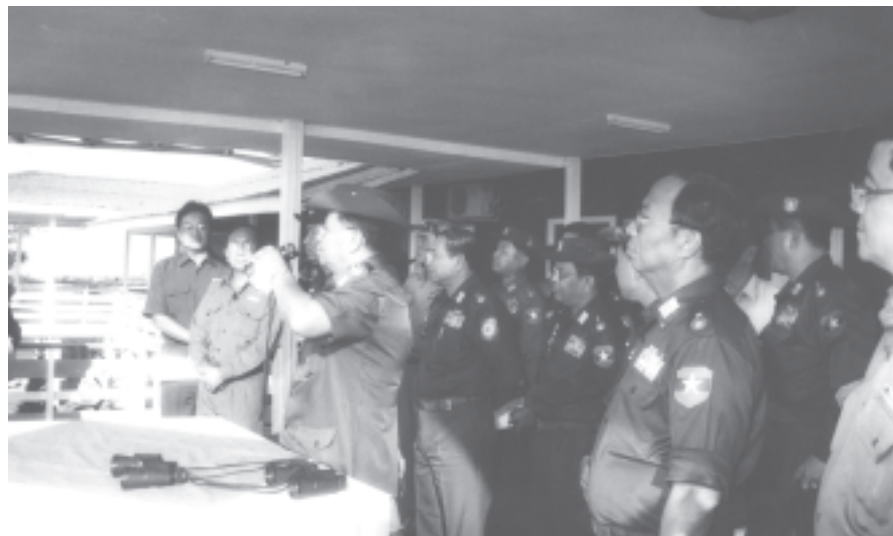
Senior General Than Shwe views completion of Thanlwin Bridge (Mawlamyine).

Accompanied by Commander of South-East Command Maj-Gen Thura