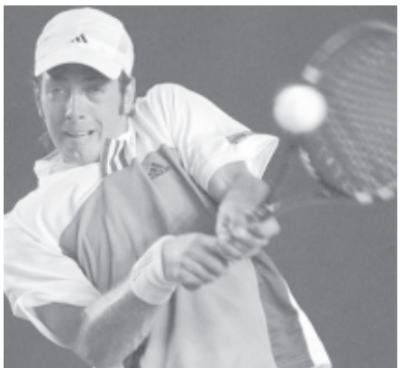
Chile's Nicolas Massu returns a forehand to Jeff Salzenstein of the United States during their Mexican Open tennis championships match in Acapulco on 3 March, 2004. Massu won 6-1, 6-3.

But Bates had stretched his business financially and, with an enormous wage bill and the bottom falling out of the European television rights market, Chelsea were in trouble again.