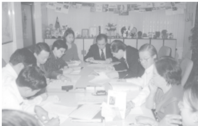
The meeting on holding the 6th Asian Wushu Championship in progress.