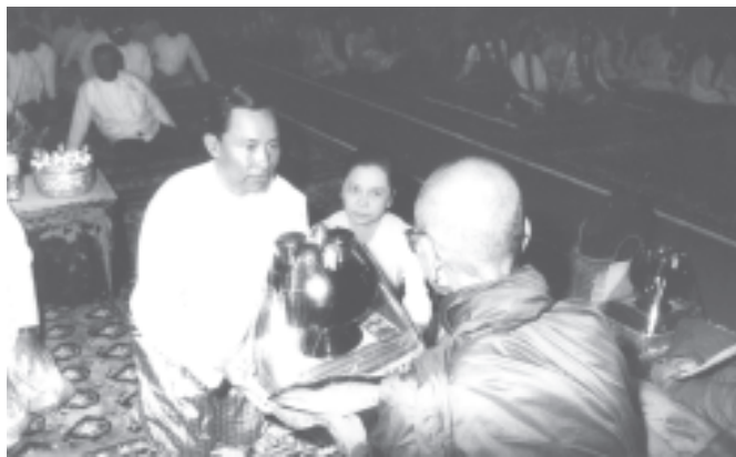
General Thura Shwe Mann and wife Daw Khin Lay Thet present offertories to a Sayadaw.