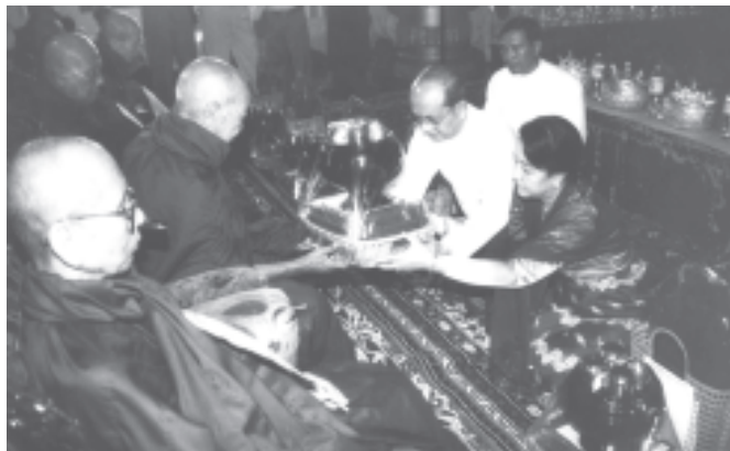
Secretary-2 Lt-Gen Thein Sein and wife present offertories to a Sayadaw.