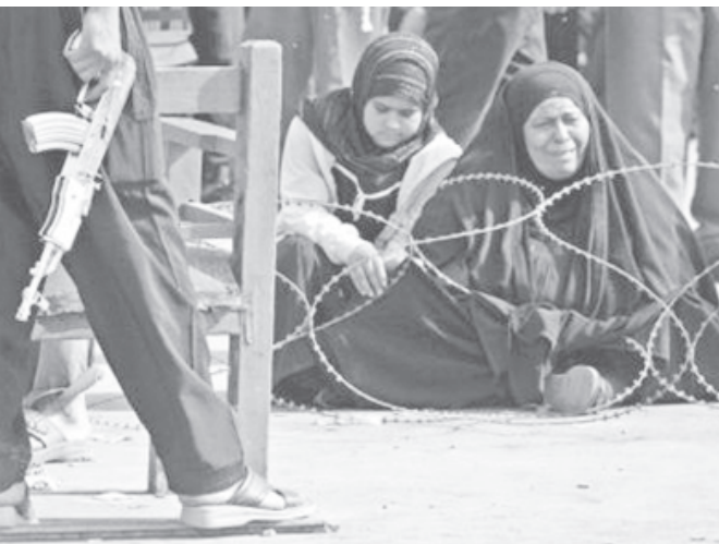
Iraqi women mourn the victims of the bomb attack in Baghdad, on 3 March, 2004.