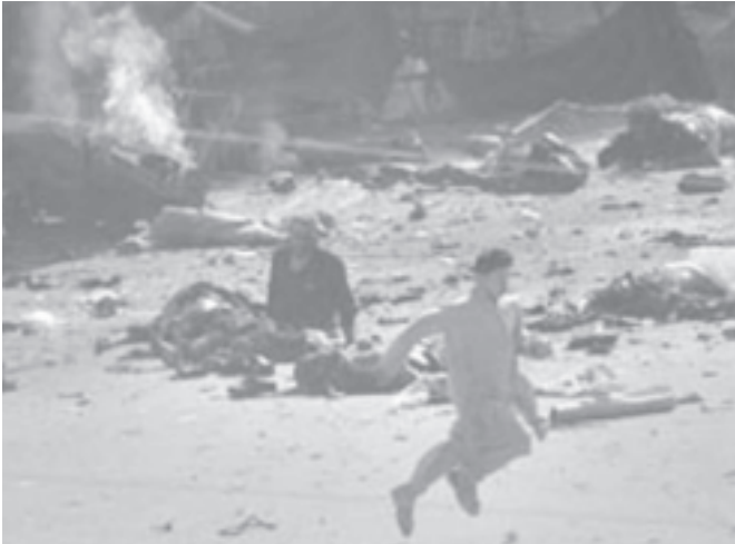
Moments after the attacks, a youth runs past the victims and burning debris at the site of several bomb blasts in Karbala, Iraq, on 2 March.