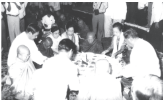
Senior General Than Shwe and wife Daw Kyaing Kyaing and party offer 'soon' to Sayadaws.