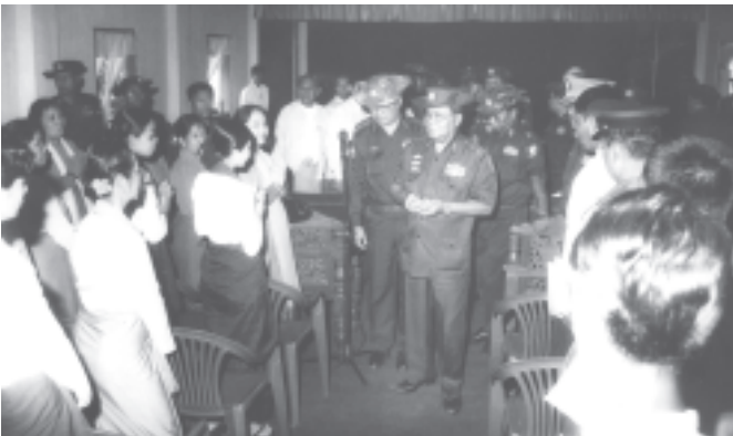
Senior General Than Shwe cordially converses with departmental personnel and Tatmadawmen in the local battalion in Ye. (News on page 16)