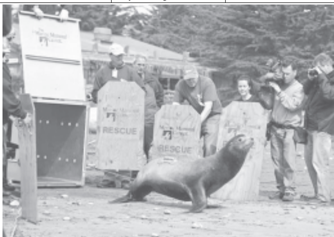
Chippy, an adult California sea lion, makes its way down Drake's Beach toward the ocean after being released at the Point Reyes National Seashore on 3 March, 2004. Chippy, who made headlines when he was found atop a California Highway Patrol car near Los Banos, Calif, on 9 Feb, has been recuperating since then at the Marine Mammal Centre in Sausalito, Calif.

မြို့ခြံရွှေတာ၊ ဆိပ်ပါးလေ့ရှိ၊ ထုတ်ကုန်မြင့်