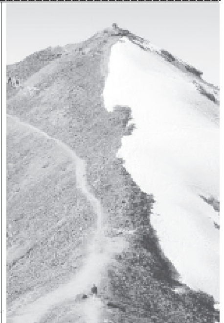
The world's second-largest reinsurer Swiss Re warned on 3 March, 2004, that the economic costs of global warming are threatening to spiral out of control and could double to $150 billion (81 billion pounds) a year in 10 years. This file photo shows the world's highest ski slope, located in the Bolivian Andes, where scientists say the ice cap that attracts hundreds of tourists each year will disappear in less than five years, likely due to global warming.

The study, which has been submitted for publication in the South African Medical Journal , follows earlier MRC research which estimated that in 2000, AIDS accounted for about 40 per cent of the deaths of South Africans aged between 15-49.—MNA/Reuters