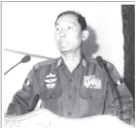
General Thura Shwe Mann gives instructions to departmental personnel and Tatmadawmen in the local battalion in Ye. (News on page 16)—MNA

Col Maung Pa and officials submitted reports on cultivation, water supply and extension of cultivation in coming season. —MNA