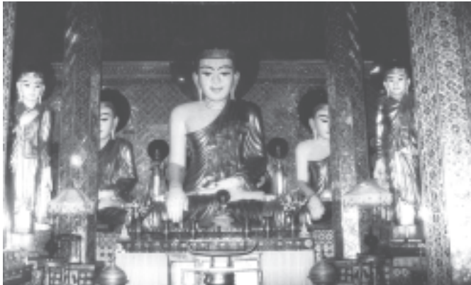
Senior General Than Shwe pays homage to Buddha images at Kyaikthanlan Pagoda in Mawlamyine.