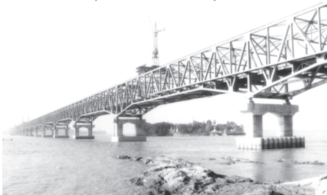
Progress in construction of Thanlwin Bridge (Mawlamyine) seen on 2-3-2004.