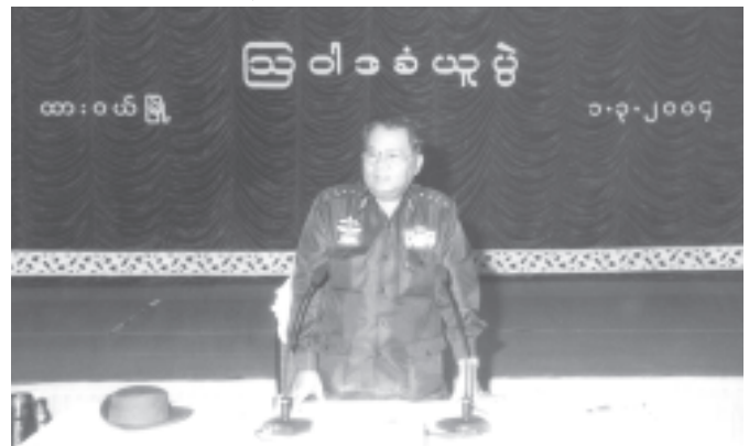
Senior General Than Shwe meets departmental personnel and local people at Town Hall in Dawei.