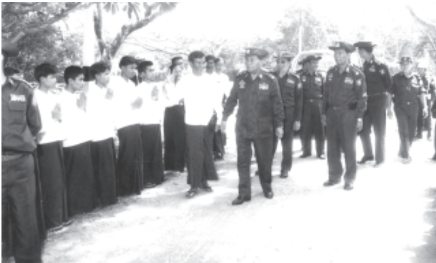
Senior General Than Shwe being welcomed by faculty members and officials at Dawei University.