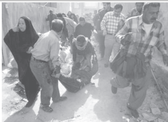
Iraqis, carrying the wounded, run from the second of the series of explosions in Karbala on 2 March, 2004