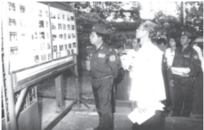
Minister for Information Brig-Gen Kyaw Hsan inspects wall magazine at Myeik District Information and Public Relations Department. (News on page 1)