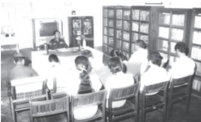
Minister for Information Brig-Gen Kyaw Hsan meets staff of Kawthoung District IPRD. (News on page 1) —MNA

UNODC, on its part, is carrying out drugs elimination tasks in Myanmar with the assistance being provided by the US, Germany, Japan and Italy. It is estimated that out of US$ 26 million which will be spent on drugs elimination in Kokang and Wa regions, UNODC has already fetched about US $ 6 million. Later, the resident representative answered the queries raised by journalists. —MNA