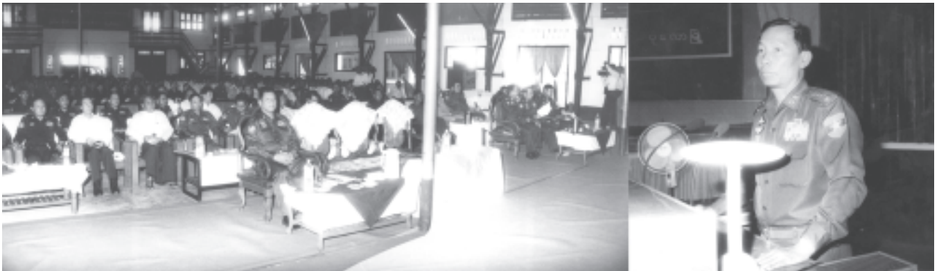
General Thura Shwe Mann gives instructions to local authorities, departmental officials, local people and Tatmadawmen at Kanyoedan Yadana Hall in Palaw.

The cases were: 30 cases with 56.2 kilos of opium, 73 cases with 25.1 kilos of heroin, 1 case with 0.97 kilo of morphine, 6 cases with 2.76 kilos of opium oil, 4 cases with 11.27 kilos of low-grade opium, 17 cases with 0.84 kilo of marijuana, 1 case with 3.75 litres of phensedyl, 46 cases with 343,696 stimulant tablets, 0.1 kilo of ephedrine, 59 kilos of stimulant powder, 6 cases with 5.281 kilos of opium dust, 1.5 kilos of chemical powder, 8 cases for failure to register, and 11 other cases. Action was taken against 314 persons — 271 men and 43 women. — MNA