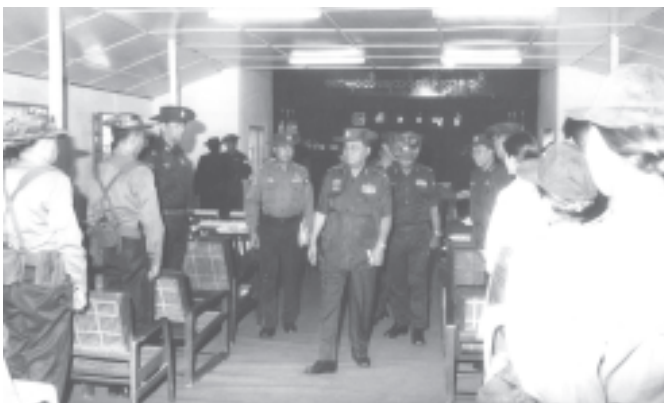
Senior General Than Shwe meets Tatmadawmen and family members at Heinze Station Hall in Yebyu Township.