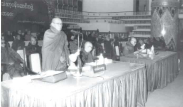
Prime Minister General Khin Nyunt pays homage to Sayadaws at Fourth Meeting of Fifth State Central Working Committee of the Sangha at Maha Pasana Cave.—MNA