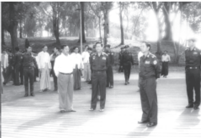
Prime Minister General Khin Nyunt inspects upgrading tasks at environs of Kandawgyi Garden.