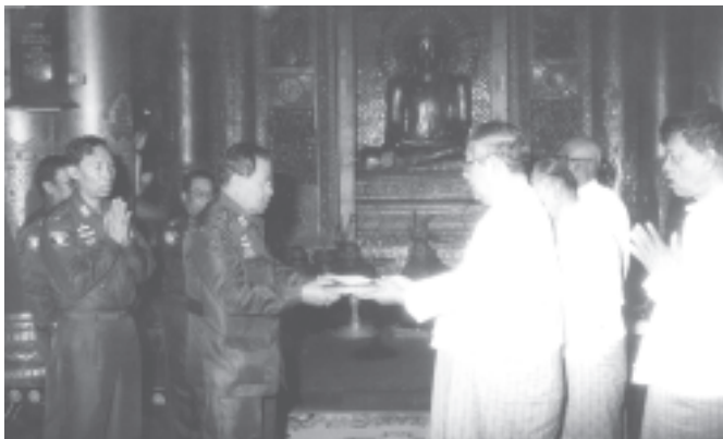
Senior General Than Shwe presents cash donations to offer gold foils for Shwetaungsa Pagoda in Dawei to officials.