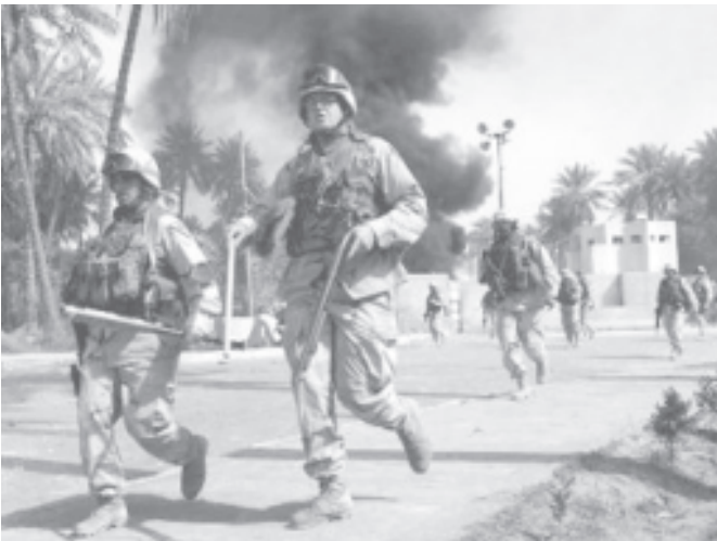
US Army soldiers from the 1st Armoured Cavalry Division run to reinforce the gate of Camp Bonzai after a stone-throwing mob attacked US forces in Baghdad, Iraq, on Tuesday, 2 March, 2004.