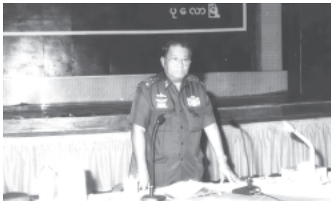
Senior General Than Shwe gives guidance to departmental personnel, local people, Tatmadawmen and families at Kanyoedan Yadana Hall in Palaw.