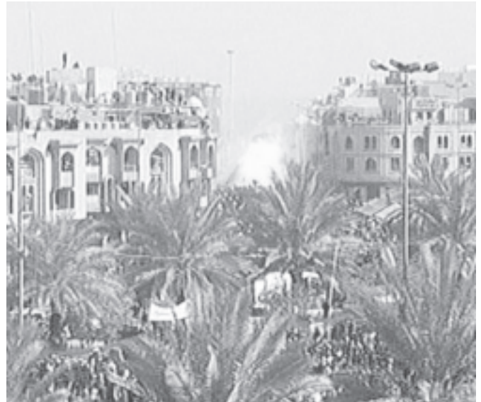
The flash from an explosion is seen between two buildings in Karbala, Iraq, on Tuesday, 2 March, 2004.