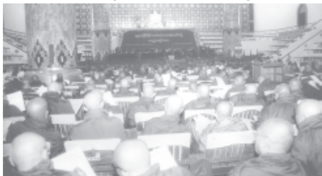
The third day session of the Fourth Meeting of the Fifth State Central Working Committee of the Sangha in progress.