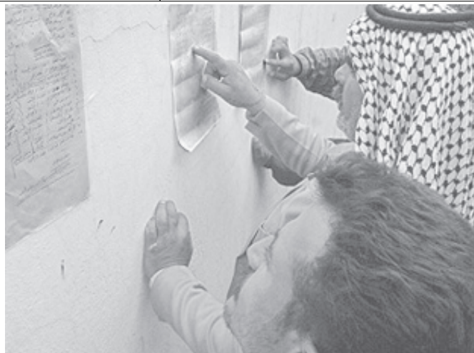
Iraqi men check the list of casualties from the explosion at al-Karkh hospital in Baghdad, on 2 March, 2004.