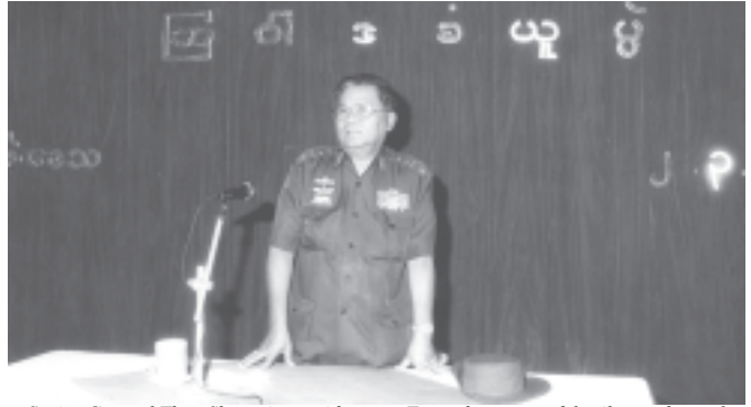
Senior General Than Shwe gives guidance to Tatmadawmen and family members of Heinze Station at the station hall in Yebyu Township.

the punctual broadcasting of television programmes. The minister also looked into the IPRD in Bokpyin Township on 26 February and the construction of the subprinting house in Myeik on 27 February. After hearing the reports presented by officials concerned and inspecting the printing house, the storehouse, the generator, the water tank and progress of the construction of staff quarters, the minister gave instructions. He also inspected the IPRD and the television relay station in Myeik.