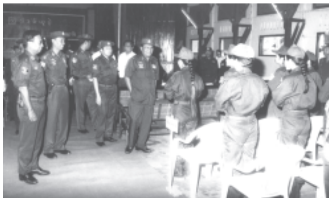
Senior General Than Shwe cordially converses with departmental personnel, local people and Tatmadawmen of Palaw Station at Kanyoedan Yadana Hall in Palaw.—MNA