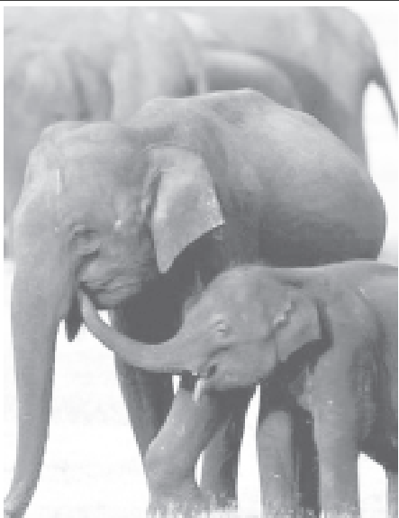
A wild Asian elephant feeds her calf at the Minneriya National Park near Polonnaruwa, 170 km (106 miles) northeast of Colombo, Sri Lanka. Sri Lanka's domesticated elephants are in desperate need of a new job as machines take over their traditional role in the logging trade.