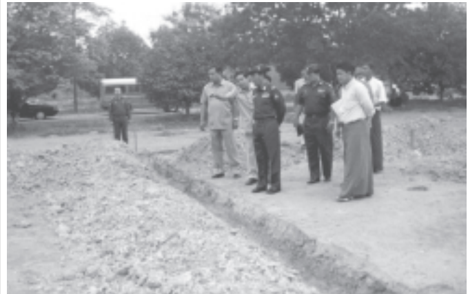
Minister for Sports Brig-Gen Thura Aye Myint inspects construction of football ground in the compound of Kyaikkasan Ground in Tamway Township.—SPED

Then, the minister inspected the hostels and mess of the athletes of Myanmar Archery Federation.—MNA