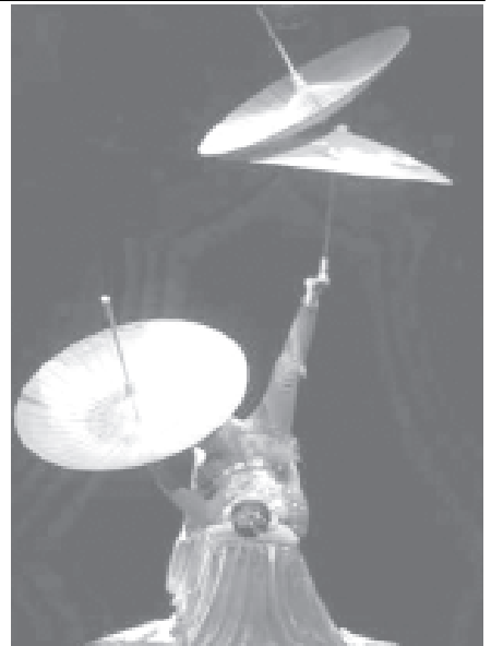
An acrobat from the Beijing Acrobatics School performs in China's capital on 25 Feb, 2004. The school is the largest art school in China and teaches circus arts, martial arts, dances and arts from other categories. Chinese acrobatics has a long historical tradition, dating back more than 2,500 years. — INTERNET

The Centre is a joint organization with equal participation between the two countries which takes up research projects involving the two sides in various areas of science.—MNA/PTI