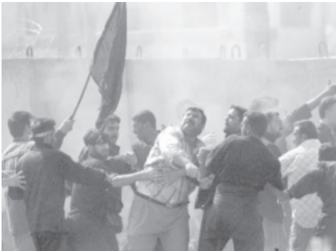
An angry mob of Iraqis throw rocks at US troops after retreating back to their camp following a series of explosions in Khadimiya at Baghdad, Iraq, on 2 March, 2004.