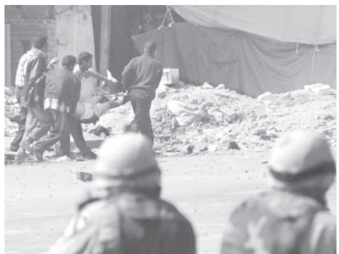
Iraqis carry a victim to a hospital as US soldiers rush to the scene moments after a series of explosions in Khadimiya, Baghdad, Iraq, on Tuesday, 2 March, 2004.