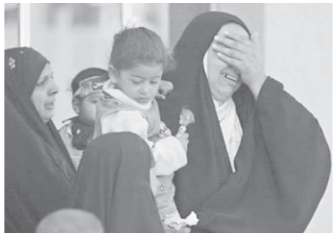
An Iraqi woman cries as she waits for news of her relative, a victim of the explosion in Baghdad, at the Medinat hospital on 2 March, 2004.