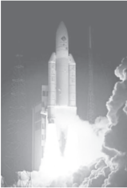
A European Space Agency (ESA) Ariane V rocket blasts off from Kourou, French Guiana, on 2 March, 2004. Europe's Rosetta space mission, which aims to chase and then land on a comet in search of secrets of the history of the solar system, has begun its ten year voyage after the spacecraft separated from the Ariane rocket early on Tuesday, space officials said.