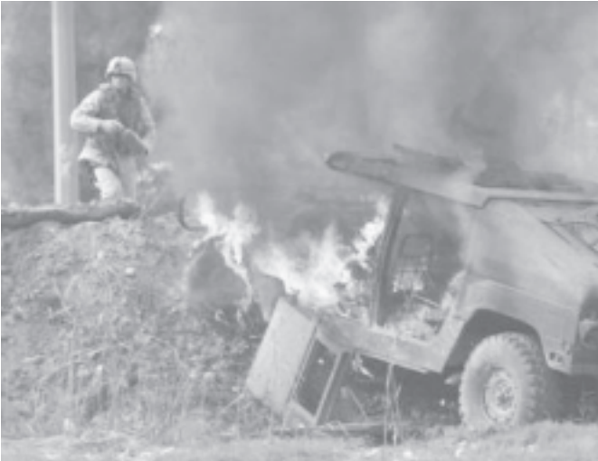
A US soldier prepares to extinguish a fire that engulfed a Hummer military vehicle following an attack in Baghdad, Iraq, on Tuesday morning, 2 March, 2004 killing a US soldier.