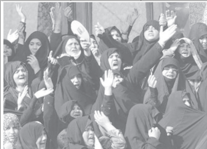
Women react near the scene of several bomb blasts which exploded in densely-occupied areas, in the holy city of Karbala, Iraq, on 2 March, 2004.—INTERNET

Even as exports climbed 8.74 per cent, trade deficit nearly doubled during April-January 2003-04.—MNA/PTI