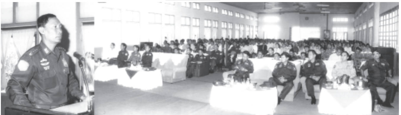
General Thura Shwe Mann meets departmental officials and local people at Town Hall in Dawei.