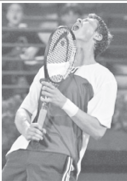
Russia's Marat Safin shouts as he misses a point against Switzerland's Roger Federer during the Dubai Tennis Championship on 2 March, 2004, in Dubai. Federer won 7-6, 7-6.

Weekly magazine Shukan Gendai is set to publish an article of the incident on Monday, reporting that the seven players, including World Cup midfielder Mitsuo Ogasawara, acted improperly during their curfew-breaking visit to a local bar.