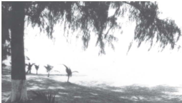
Senior General Than Shwe inspects Maungmagan Beach.