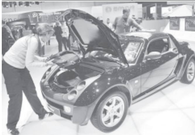
An employee of Smart loads bags into the trunk of the new Smart Roadster during its presentation at the 74th Geneva International Motor Show on 2 March, 2004 in Geneva, Switzerland.