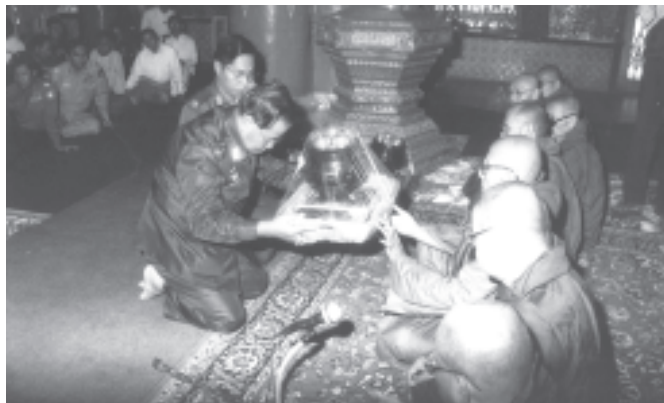
Senior General Than Shwe donates provisions to a Sayadaw at Lawka Marazein Pagoda in Dawei.