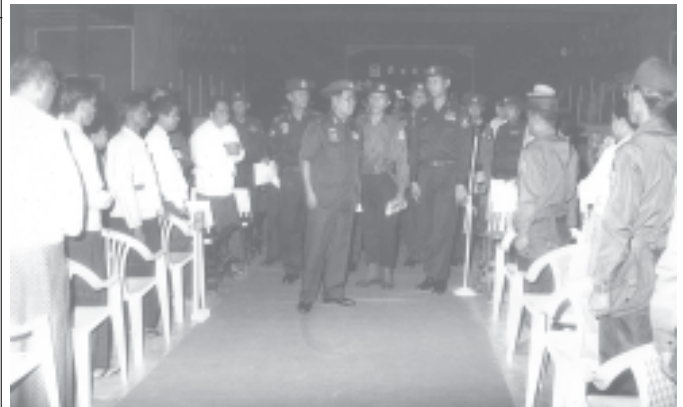
Senior General Than Shwe meets with departmental personnel, USDA members and officials of social organizations in Kyunzu Township.

The Chairman of the NHC headed for the site of An Township Hospital (100-bed) Project. Officials reported on facts about the project, progress in construction of the main building, operation theatre, obstetric and gynaecological ward, paediatric ward, and outpatient ward, construction of a surgical ward, and arrangements