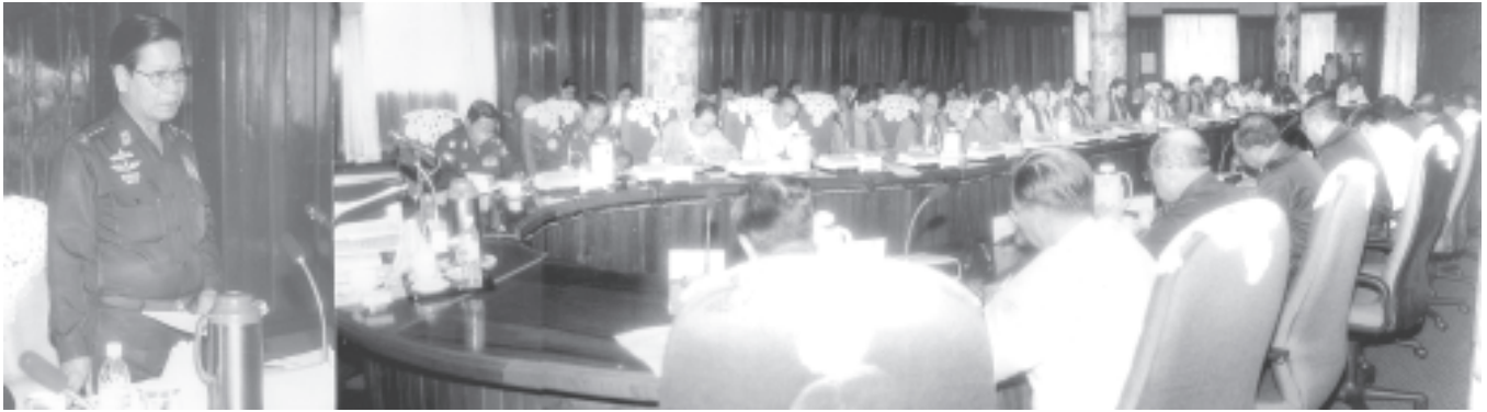
Prime Minister General Khin Nyunt delivers an address at the meeting to coordinate measures for holding plenary meeting of State and Division Organizations for Women's Affairs.