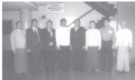
The delegation being seen off at the airport.