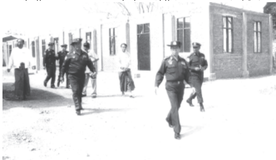
Prime Minister General Khin Nyunt inspects construction of Ann Township Hospital (100-bed) in Rakhine State on 1-3-2004.

crops, beans and pulses, edible oil crops and kitchen crops, education and health (See page 9)