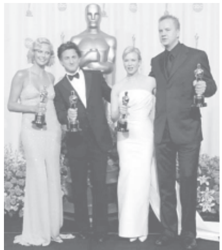
Charlize Theron, Sean Penn, Renee Zellweger and Tim Robbins (L-R) hold their Oscar statues backstage at the Kodak Theatre after winning Oscars at the 76th annual Academy Awards in Hollywood, on 29 February, 2004. Zellweger won best supporting actress for her role in the film 'Cold Mountain,' Penn won best actor for his role in the film 'Mystic River,' Robbins won best supporting actor for his role in the film 'Mystic River,' and Theron won best actress for her role in the film 'Monster.'

"The Lord of the Rings: The Return of the King," (New Line); Fran Walsh, Philippa Boyens and Peter Jackson