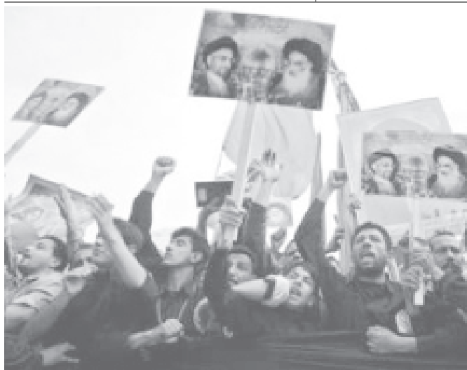
Iraqi men shout in support of Abdel Aziz al-Hakim, who represents the Supreme Council for the Islamic Revolution in Iraq (SCIRI), during a rally in the Iraqi capital Baghdad, on 1 March, 2004.—INTERNET

Thailand plans to send a second contingent of more than 400 troops to Iraq by March 17 to replace the first contingent, which has worked there for six months.— MNA/Xinhua