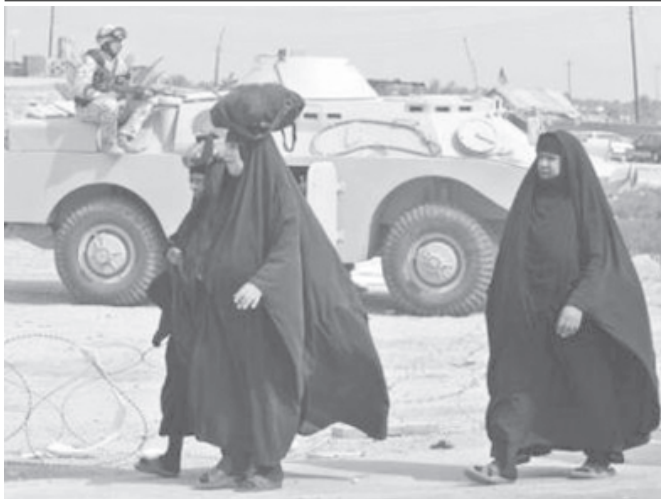
Iraqi women walk past a Polish soldier at a mobile checkpoint some 15 km north of the southern Iraqi town of Kerbala on 1 March, 2004.