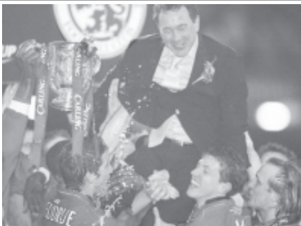
Middlesbrough's Chairman Steve Gibson is held up by Franck Queudrue (L), Juninho (C) and Bolo Zenden as Middlesbrough celebrates winning the Carling Cup Final football match, on 29 February, 2004 in Cardiff, Wales. Middlesbrough defeated Bolton 2-1.