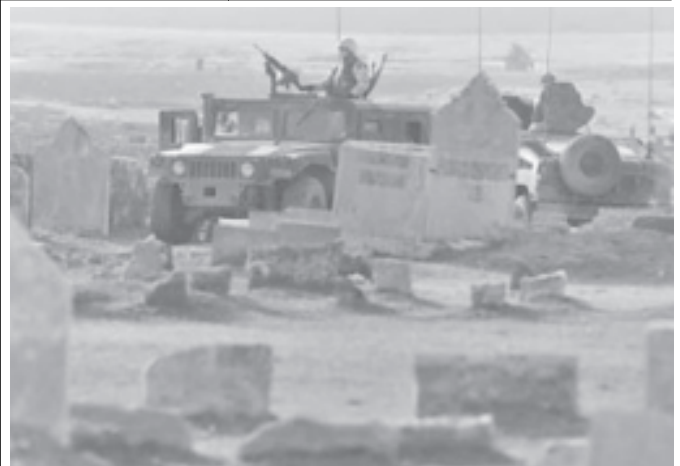
US forces said on 28 February, 2004 they had shot dead two men suspected of anti-coalition activities, but Iraqi officials in the northern city of Mosul said the victims were innocent bystanders. US soldiers are shown in the town of Mosul on 26 February, 2004 file photo.