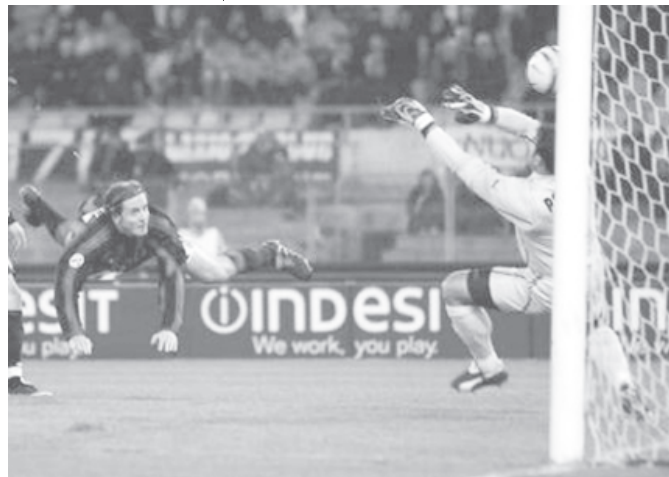
Massimo Ambrosini (L) of AC Milan is airborne as he scores a diving header against Lazio's goalkeeper Angelo Peruzzi during their Serie A clash at the Olympic Stadium in Rome, on 29 February, 2004.