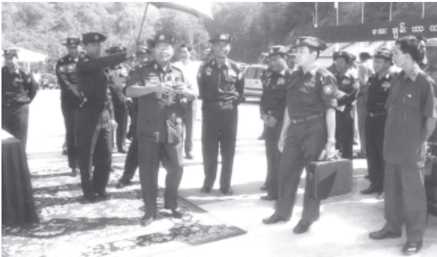
Senior General Than Shwe inspects Kyweku-Kyaukphyu Bridge.

YANGON, 3 March — Senior General Than Shwe, Chairman of the State Peace and Development Council of the Union of Myanmar, has sent a message of felicitations to His Excellency Mr Georgi Parvanov, President of the Republic of Bulgaria, on the occasion of the Anniversary of the National Day of the Republic of Bulgaria which falls on 3 March 2004.