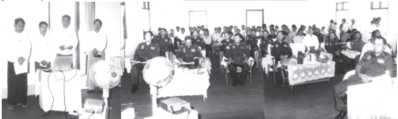
Senior General Than Shwe hears a report presented by officials at Myeik Government Computer College.