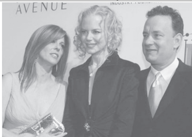
Rita Wilson, left, Nicole Kidman, centre, and Tom Hanks pose for photographers as Kidman is honoured by EIF's Women's Cancer Research Fund an Honorary Chairs in Los Angeles, on 1 March, 2004.