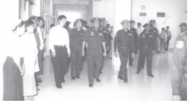
Senior General Than Shwe inspects the General Hospital in Myeik.