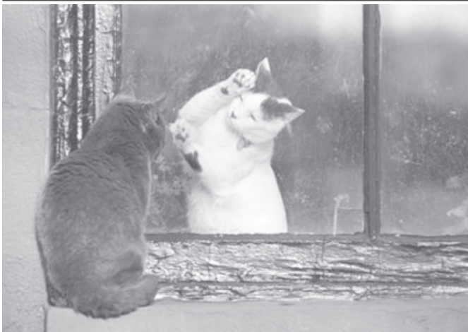
Separated by a pane of glass, a white cat on the inside of a Brooklyn brownstone tries to play with a black cat sitting on the exterior window sill on Monday, 1 March, 2004, in New York.