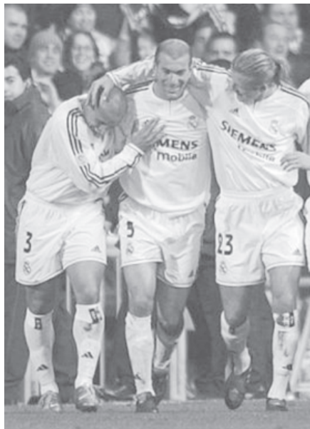
Real Madrid's Zinedine Zidane, centre, is congratulated by his teammates Roberto Carlos, left, and David Beckham after he scored a goal against Celta Vigo during their Spanish League soccer match in Madrid, Spain, on Sunday, 29 February, 2004.