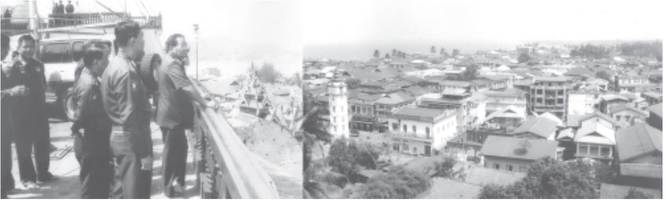
Senior General Than Shwe views panoramic scene of Myeik from a viewpoint near Buddha Sasana Beikman.