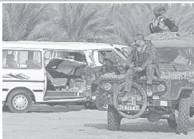
Polish soldiers guard a checkpoint near the holy southern Iraqi city of Karbala. Coalition soldiers shot and killed a bus driver and wounded several other people. — INTERNET

The Philippine Government has intensified anti-illegal drugs operations as drug lords ravaged across the country, where there were about 3.4 million drug abusers among the total population of over 80 million, and 70 per cent of the jailed were drug-related, according to the official statistics released last year. — MNA/Xinhua