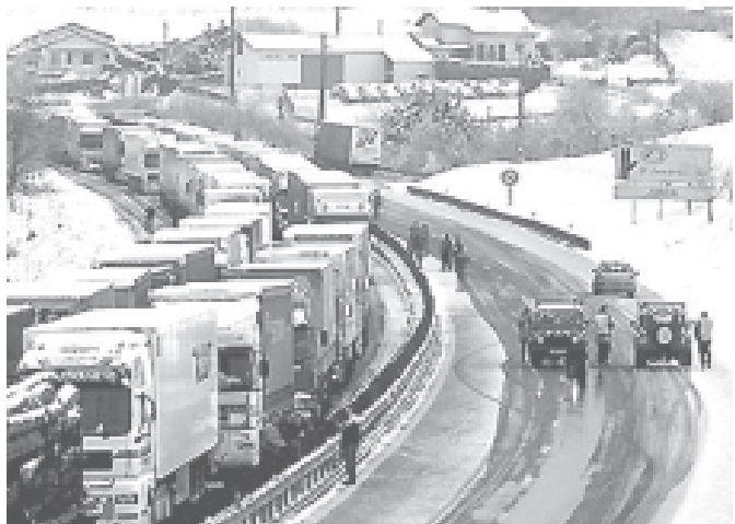
Truck drivers waiting for the authorization to get back to the road, nearby the crossing-point to Spain in Biriatiou, as the Spanish border had been closed by authorities due to the recent heavy snowfalls.

မြို့ခြံချွေတာ၊ ထိန်းပါးလေလွင့်၊ ထုတ်ကုန်မြင့်