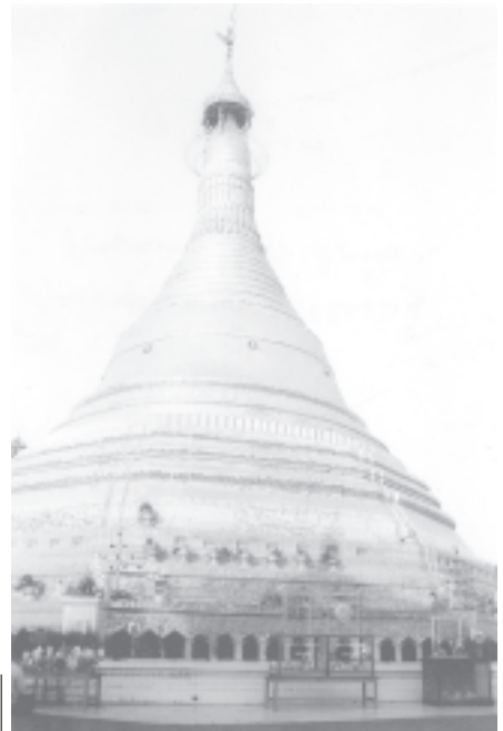
The Myat Mawtin Pagoda in Ngapudaw Township.

On arrival at Pyithaya village, Lt-Gen Khin Maung Than and party paid homage to Kalat Pagoda and viewed natural stallactites. Next, Lt-Gen Khin Maung Than presented K 30,000 for the Pyithaya primary school and inspected the regional development conditions. Later, Lt-Gen Khin Maung Than also oversaw the bridge linking Deedugon village with Thayachaung village and gave instructions on maintenance of the bridge. He also inspected the 30-acre prawn breeding pond of U Zaw Min. There are 406.82 acres of prawn breeding ponds in Deedugon village-tract. Later they went to the basic education high school at Ahsinchaing village of Pyinkhayaing station. Lt-Gen Khin Maung Than cordially met with locals, members of social organizations, and donated K 100,000 for the school through the schoolhead.