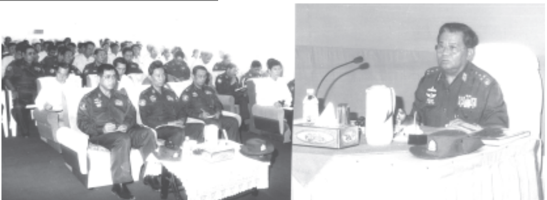
Senior General Than Shwe gives guidance to the officials in Myeik General Hospital.