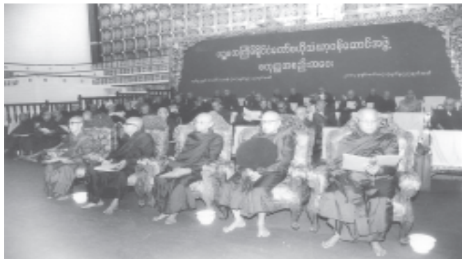
The Fifth State Central Sangha Committee holds meeting in Maha Pathana Cave.

Present at the meeting were State Ovadacariya Sayadaws, Presiding Sayadaws of the SSMNC and the SCWCS, Minister for Religious Affairs Brig-Gen Thura Myint Maung, Deputy Minister Brig-Gen Thura Aung Ko, Adviser