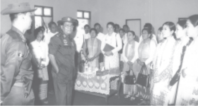
Senior General Than Shwe meets with faculty members at Government Computer College in Myeik.