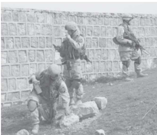
US soldiers from 2nd Infantry Division's Striker Brigade based in Alaska, prepare to remove an unexploded ordnance following its discovery in the center of Mosul, 400 kilometres north of Baghdad, Iraq, on Saturday 28 Feb, 2004.