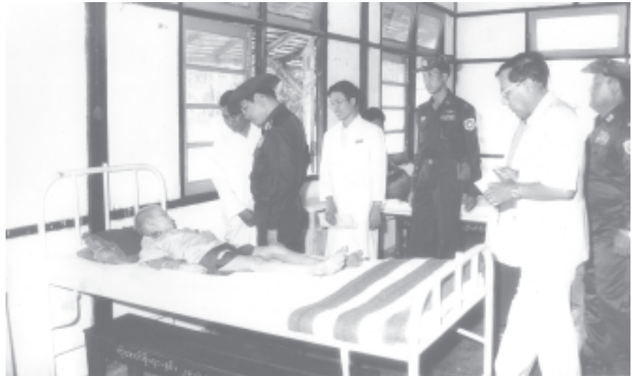
Prime Minister General Khin Nyunt at Taungup Township People's Hospital.

There are hundreds of medium and small bridges in Rakhine State, he added.