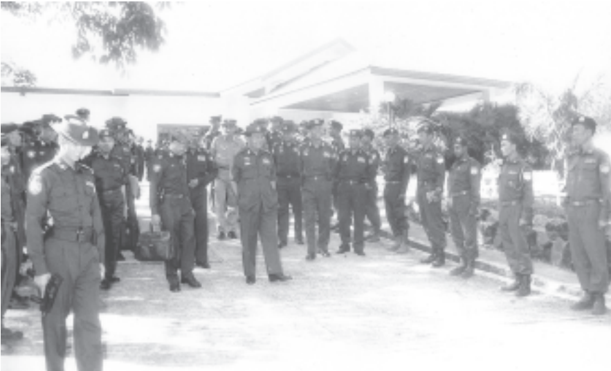
Senior General Than Shwe cordially meets with Tatmadaw members and families of Bokpyin Station. (News page 1).