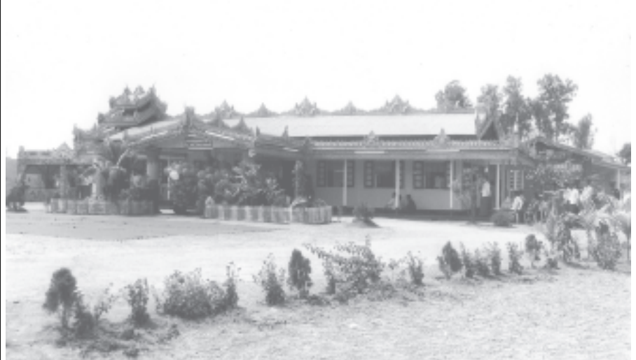
The newly opened Shwe Metta Home for the aged in Taungup. (News page 16) — MNA

"We hope to sign the contract with Israel, latest by April," a senior official of Irkut Aerospace Corporation told PTI in Irkutsk, Siberia. Irkut also produces Sukhoi Su-30MKI war planes for India. —MNA/PTI