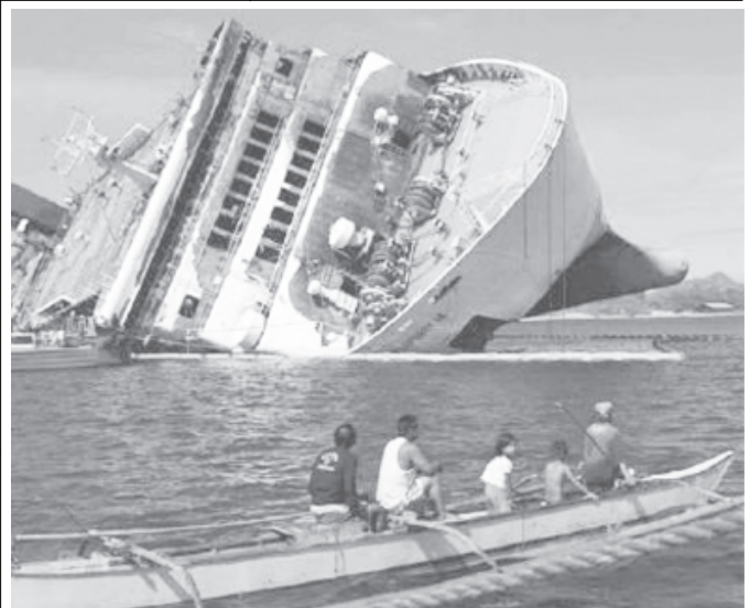
A fishing boat passes by as coast guard rescuers continue their search and rescue operations on the wreckage of a Superferry ship at Mariveles bay, Bataan, north of Manila, on 29 February, 2004. Hopes of finding alive any of about 100 people missing after fire gutted a Philippine ferry faded on Monday as rescuers scoured the sea near the capital Manila and divers searched the partly submerged ship.