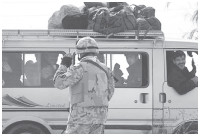
A Polish army soldier serving with Coalition Forces in Iraq waves at Iraqis inside a passing minibus, at a checkpoint just north of Karbala, Iraq, on Sunday, 29 Feb, 2004.