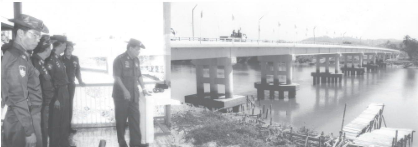
Senior General Than Shwe inspects Lenya-Mandaing Bridge.