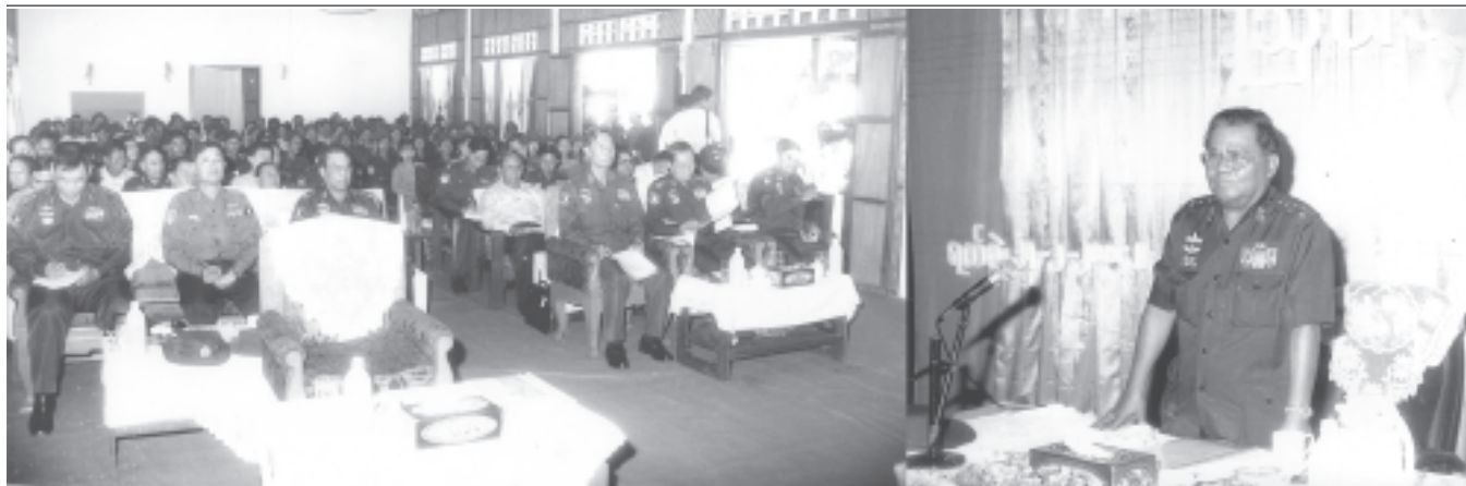
Senior General Than Shwe meets with departmental personnel, members of USDA and social organizations and Tatmadaw members and families in Pyigyimandaing town.