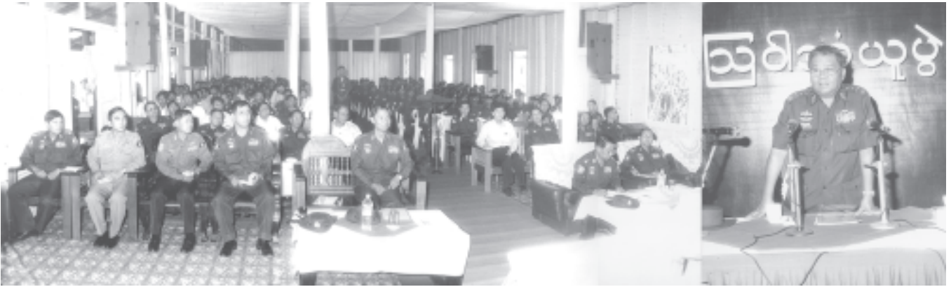
Senior General Than Shwe meets with departmental personnel, members of USDA and social organizations and Tatmadaw members and families. (News page 1)