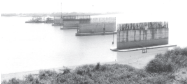
Secretary-1 Lt-Gen Soe Win inspects Thanlyin Bridge No 2 Project in Dagon Myothit (Seikkan) Township.