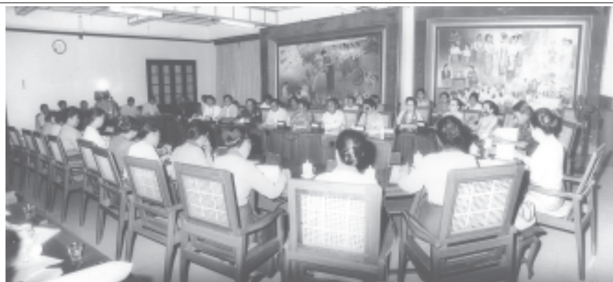
The work coordination meeting for organizing the International Women's Day in progress.