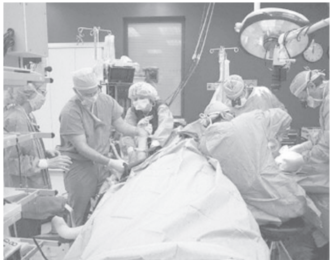
A hand transplant operation in the US. In another operation, surgeons in Australia have reattached a young man's hand that was severed in a brawl and found by police after he arrived at a hospital without it, doctors said.