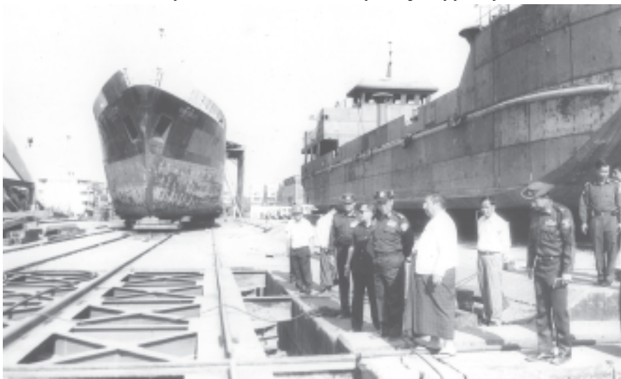
Secretary-1 Lt-Gen Soe Win inspects a dockyard of Myanma Shipyards.