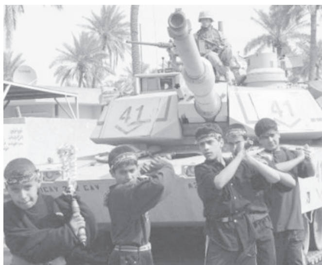
Iraqi boys walk past a US tank on 29 Feb, 2004 in Khadimiya north of Baghdad, Iraq.