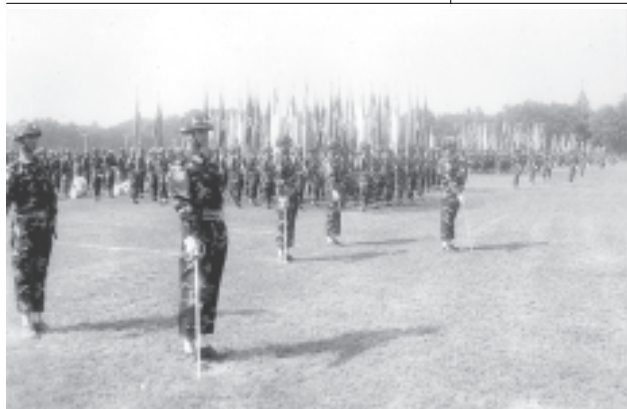
Commander of Yangon Command Maj-Gen Myint Swe and officials inspect drills of military parade columns.