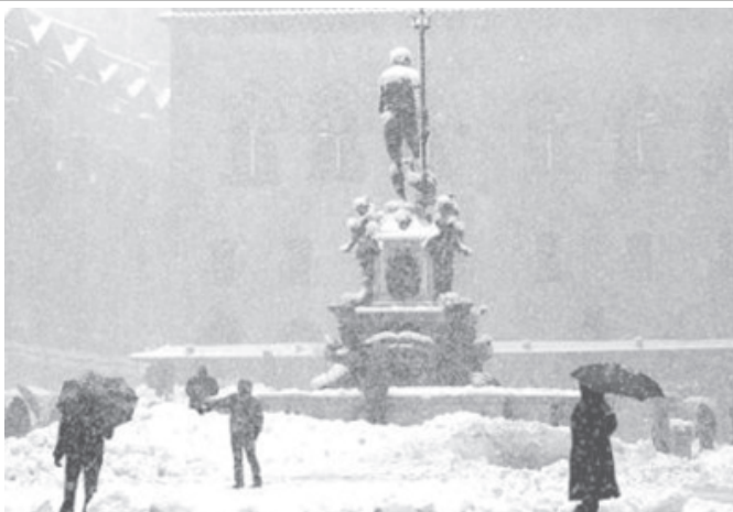
Pedestrians in Bologna, northern Italy, are seen during a snowfall on 28 Feb, 2004. In background is the statue of Neptune, mythological God of the seas, symbol of Bologna.