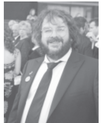
'Lord of the Rings' director Peter Jackson arrives at the 76th Annual Academy Awards. The last episode of 'Lord of the Rings' movie trilogy took a resounding lead at the Oscars.