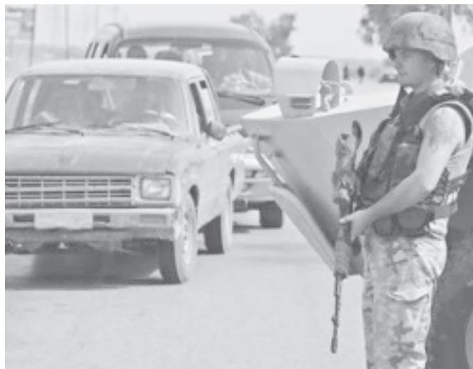
In this photo, a soldier (R) watches the traffic at a mobile checkpoint in a suburb of Kerbala on 29 February, 2004.