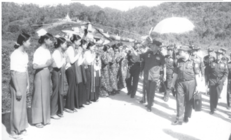
Senior General Than Shwe and party being welcomed by officials and local people on arrival at Kayathuri town.

In response to the report, Senior General Than Shwe