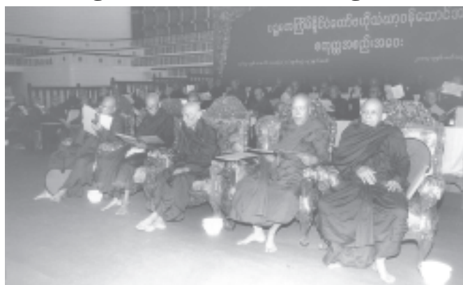
The fifth State Central Sangha Committee holds its fourth meeting in the Maha Pathana Cave, Kaba Aye.

On the occasion, the minister supplicated on religious matters to Sayadaws.