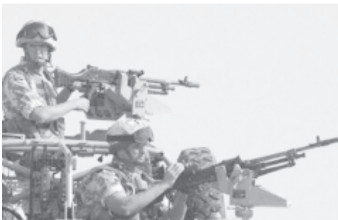
British soldiers patrol a road in the southern port city of Basra, Iraq. Thousands of British soldiers have complained that they suffered equipment shortages during the war in Iraq last year because of poor planning by senior officers, a newspaper said.