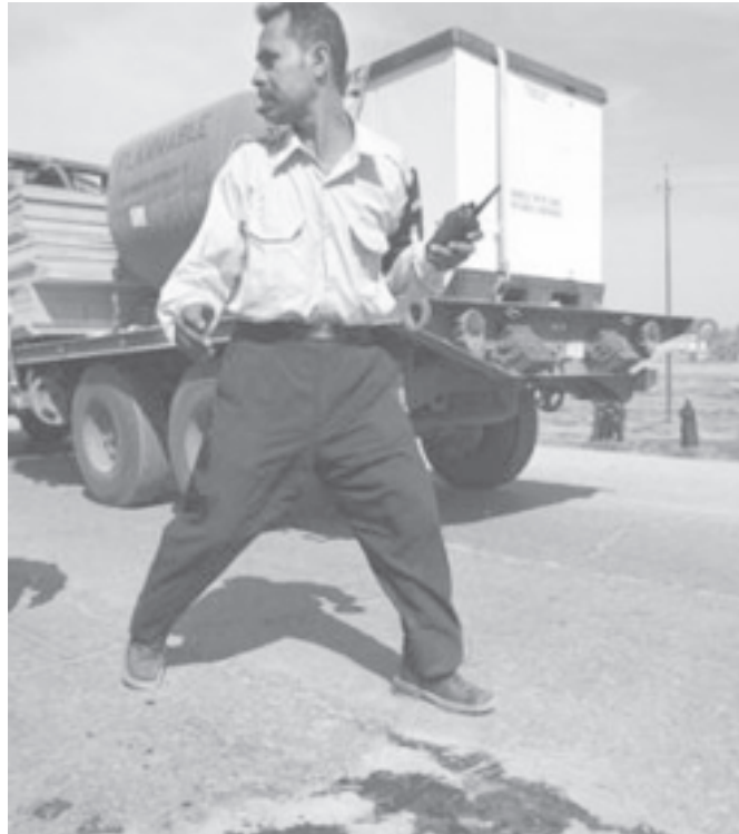
An Iraqi police runs in front of the site where some witnesses said a man was shot dead by US military convoy with his two sons injured, in Rumyth city, 15 kilometres (9 miles) from Samawa, southeast of Baghdad, Iraq, on Sunday, 29 Feb, 2004.