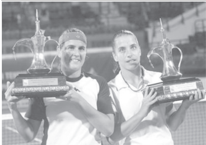
Conchita Martinez, left, of Spain, and Janette Husarova, of Slovakia, lift Dubai womens doubles trophies after they defeated Svetlana Kuznetsova and Elena Likhovtseva, of Russia, in the womens doubles final at the Dubai Tennis Championship, UAE, on 28 Feb, 2004. Martinez and Husarova won, 6-0, 1-6, 6-3.