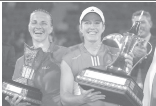
World No. one, Justine Henin-Hardenne, right, from Belgium, holds the trophy next to Russia's Svetlana Kuznetsova after she defeated her, 7-6, 6-3, during the final of the Dubai Tennis Championship, UAE, on 28 Feb, 2004.