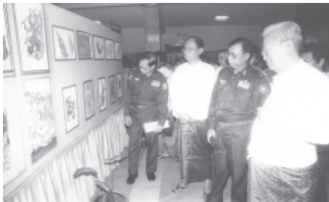
Minister for Culture Maj-Gen Kyi Aung views works of trainees.