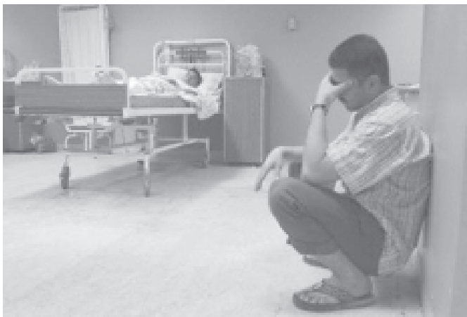
An Iraqi civilian cries after learning of the death of a family member injured during the US bombardment of Baghdad recently.