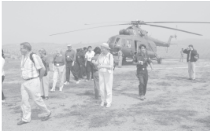
Members of Tuesday Club tour northern Shan State.

Australia and invited guests from the United States, Japan, China, Switzerland and