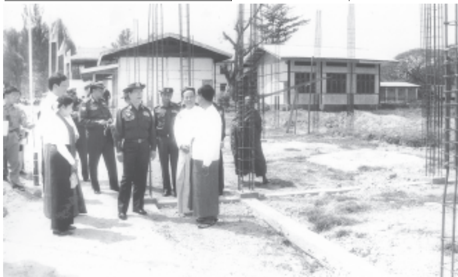
Prime Minister General Khin Nyunt inspects three-storey school building project in Taungup Township, Rakhine State.—MNA