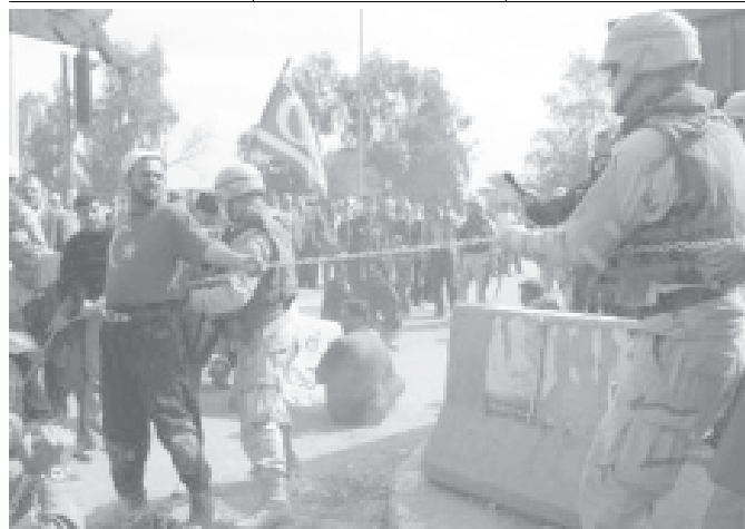
US soldiers pull to remove protesters who chained themselves to barricades outside the Iraqi Governing Council office on the third day of their protest on 28 Feb, 2004 in Baghdad, Iraq. —INTERNET