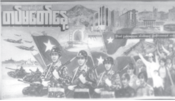
The 59th Anniversary Armed Forces Day commemorative postcard.