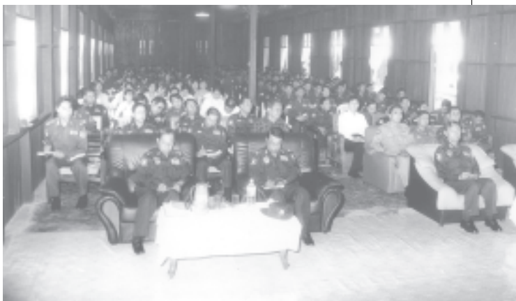
Senior General Than Shwe meets Tatmadawmen and family members of regiments and units of Khamaukgyi Station.— MNA