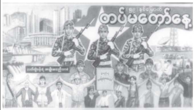
The 59th Anniversary Armed Forces Day commemorative postcard.