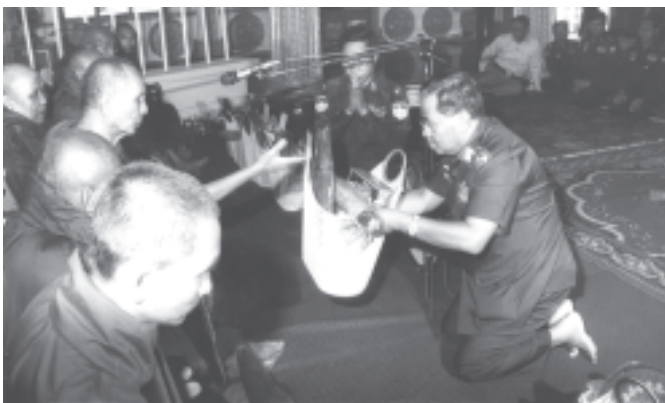
Senior General Than Shwe donates provisions to a Sayadaw of monastery in Kawthoung.