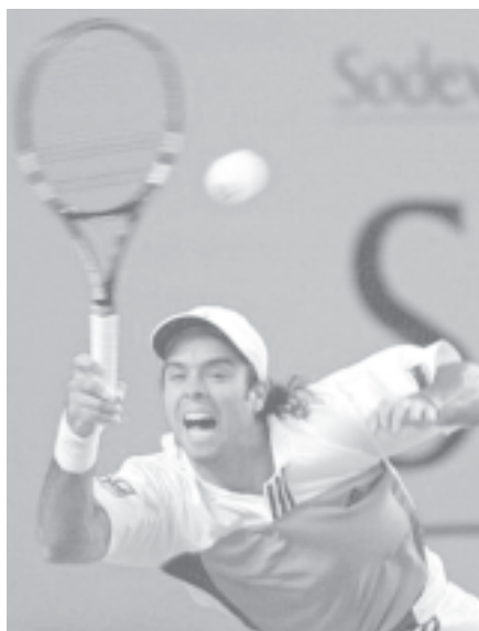
Fernando Gonzalez of Chile returns a forehand to Robin Soderling of Sweden during their quarterfinal match at the Open 13 tennis tournament in Marseille, southern France, on 27 Feb, 2004. Soderling defeated Gonzalez 6-3, 7-6.