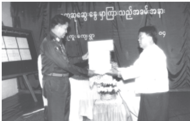
Lt-Gen Khin Maung Than presents cash for construction of school building of Kyonku Village BEHS to an official.