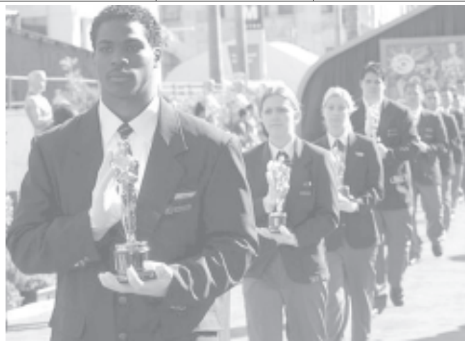
Security officers parade the Oscar statuettes over the red carpet into the Kodak Theatre for the 76 th Annual Academy Awards in Los Angeles, on 28 Feb, 2004. The awards take place Sunday

GAVI was launched in 2000 to combat declining immunisation rates and to improve access to vaccinations in poor countries. It is a public-private alliance between donor countries, vaccine manufacturers, developing countries, the World Health Organization, UNICEF, the World Bank, non-governmental organizations and the Bill & Melinda Gates Foundation. —MNA/Reuters