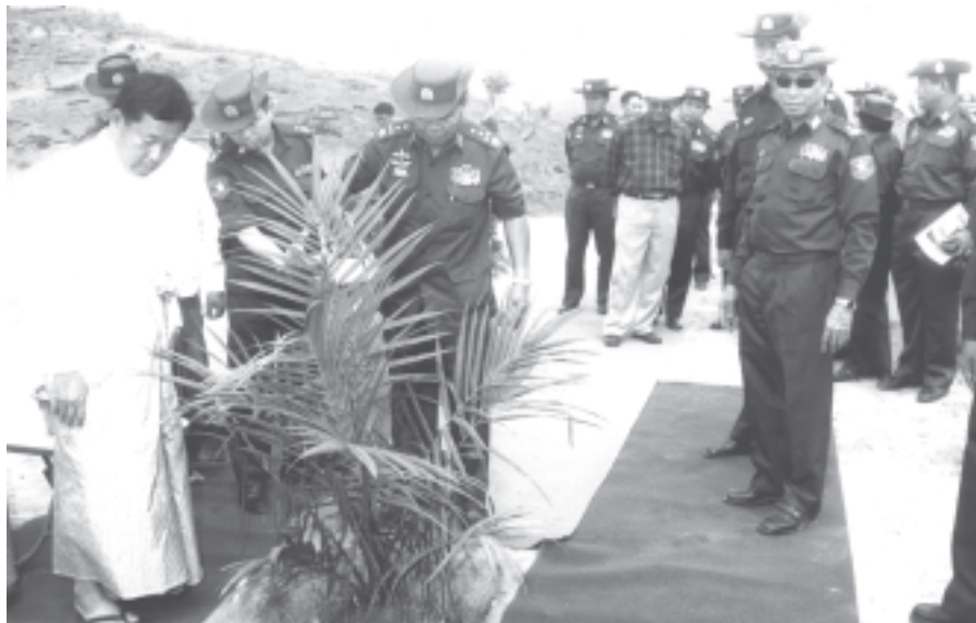
Senior General Than Shwe plants an oil palm near Oil Palm Cultivation Project Office of Yuzana Co Ltd.