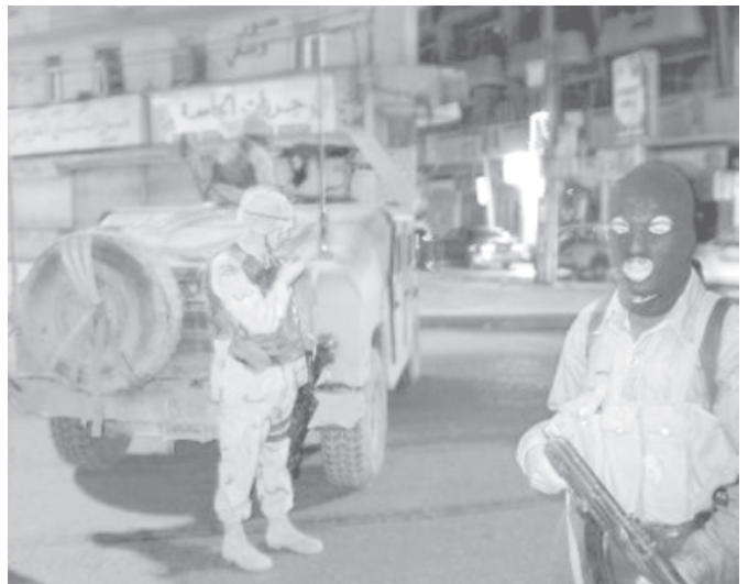
US soldiers and Iraqi police comb the Mosul commercial area, 400 kilometres late on Friday 27 Feb, 2004. Insurgents have been stepping up their attacks around the country lately and are now targeting Iraqis mostly working for the US coalition forces.