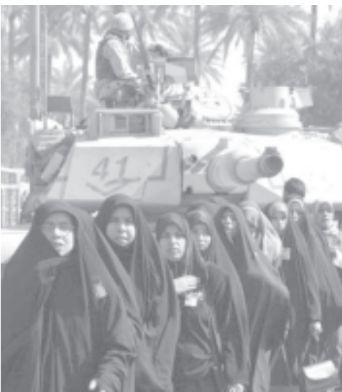
Iraqi women walk past a guarding US M1-A1 tank in Khadimiya north of Baghdad, Iraq on Saturday 28 Feb, 2004.