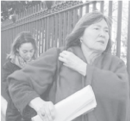
Former International Development Secretary Clare Short, foreground, who has claimed that Britain spied on United Nations Secretary General Kofi Annan in the run-up to war in Iraq, is seen in London, on 26 Feb, 2004. Short told the BBC Radio 4 Today programme that British intelligence had bugged Kofi Annan and that she had read transcripts of his conversations while she was a member of the government.

Boutros Boutros-Ghali, Mr Annan's predecessor as secretary general, said: “This is a violation of the United Nations charter. It complicates the work of the secretary general, of the diplomats, because they need a minimum of secrecy to reach a solution.” Mr Butler, who led the UN disarmament team in Iraq in the 1990s, Unscam, said he was “well aware” that he was being bugged. But he said spying on the UN was illegal and harmed the peace-making process. “What if Kofi Annan had been bringing people together last February in a genuine attempt to prevent the invasion of Iraq, and the people bugging him did not want that to happen, what do you think they would do with that information?” he said. —Internet