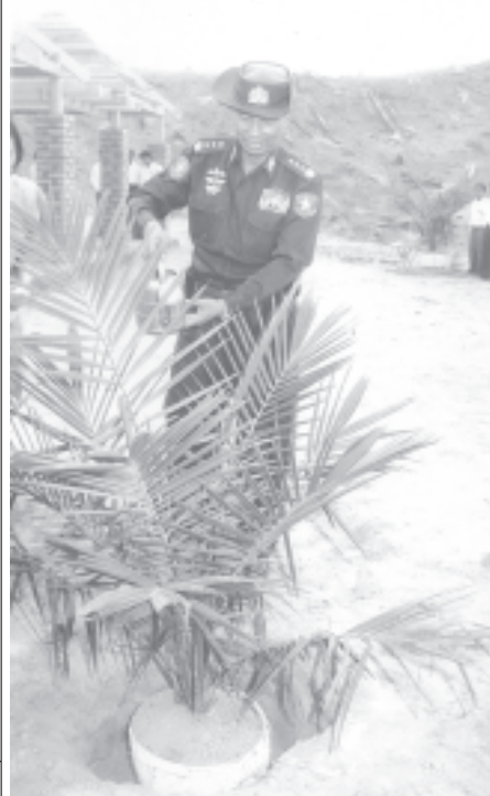
General Thura Shwe Mann plants an oil palm at the hall of Yuzana Co Ltd Oil Palm Project.