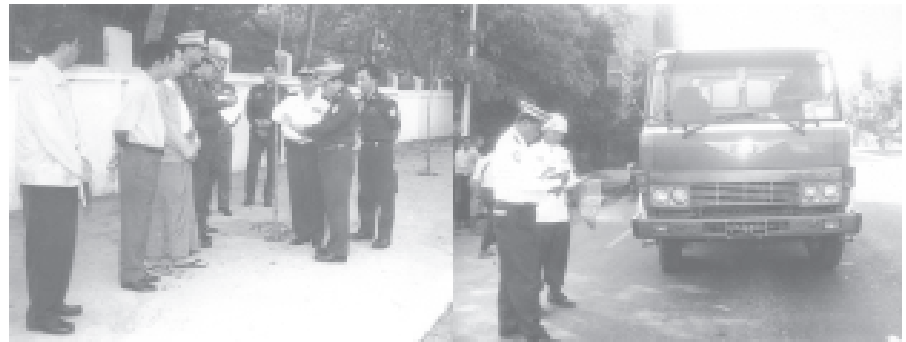
Deputy Minister for Home Affairs Brig-Gen Phone Swe and party inspect a departmental car on the Dry Day.