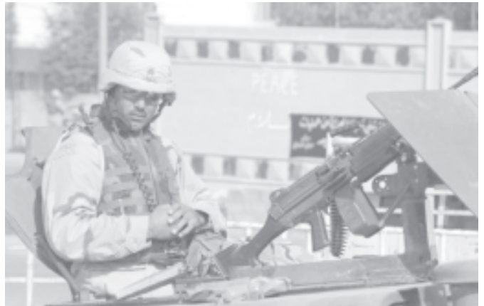
A US soldier sits on an armoured vehicle in front of a graffiti calling for peace while patrolling Baghdad's Yarmuk neighbourhood.