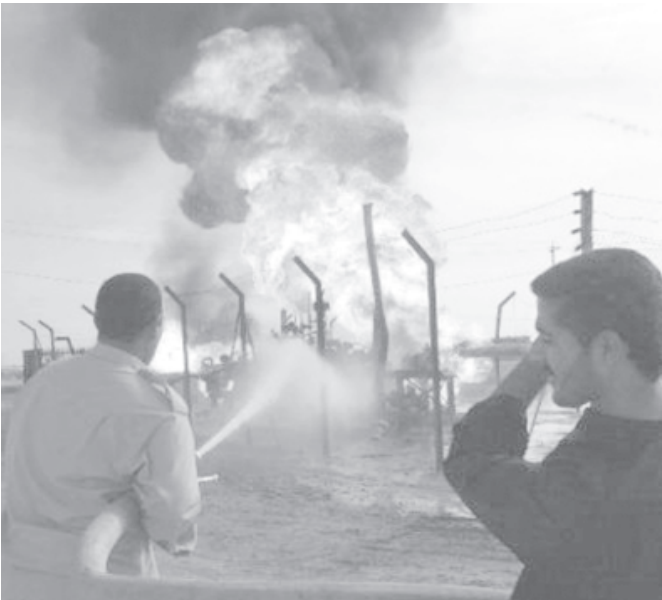
An Iraqi fireman trains his hose at the burning oil pipeline in Samarra, 100 kilometres (62 miles) north of Baghdad, Iraq, following an explosion on 28 Feb, 2004, the second time an oil facility near Samarra was damaged. Since the US ouster of Saddam Hussein, attackers have fired mortars, sprayed bullets and planted explosives that have damaged pipelines and other oil facilities in Iraq. —INTERNET

Iraqis shout during a rally in front of the Coalition Provisional Authority building in the port town of Basra, some 550 km (330 miles) south of the Iraqi capital Baghdad, on 24 Feb, 2004. Several hundred Iraqis staged a demonstration to demand jobs and protest against foreign contractors, such as US oil giant Halliburton.