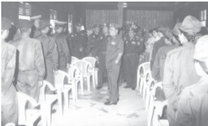
Senior General Than Shwe cordially meets Tatmadawmen of regiments and units of Khamaukgyi Station.