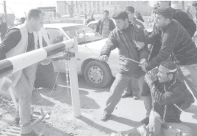
Turkomen protesters, who chained themselves to the barricade outside the Iraqi Governing Council office in Baghdad, react as a US soldier in civilian clothes tries to remove it during their protest on Saturday 28 Feb, 2004.