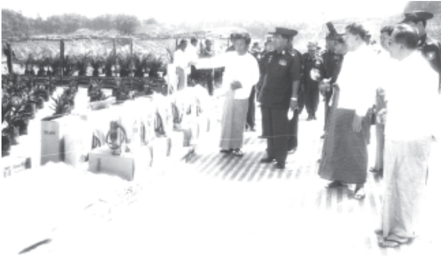
Senior General Than Shwe inspects oil palm nursery of Yuzana Co Ltd.