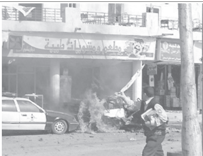
An Iraqi gestures as he walks past a burning car just after a bomb exploded in front of a restaurant in Baquba, 60 kms northeast of Baghdad on 26 Feb, 2004.