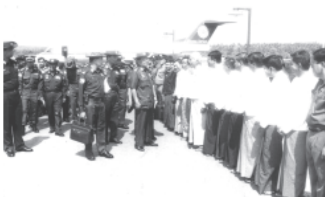
Senior General Than Shwe and party being welcomed at Kawthoung Airport by departmental officials.