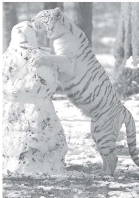
Chandi, a White Tiger, plays with a snowman built by her keepers in her enclosure at Longleat Safari Park, England, on 27 Feb, 2004, where up to four inches of snow fell overnight.