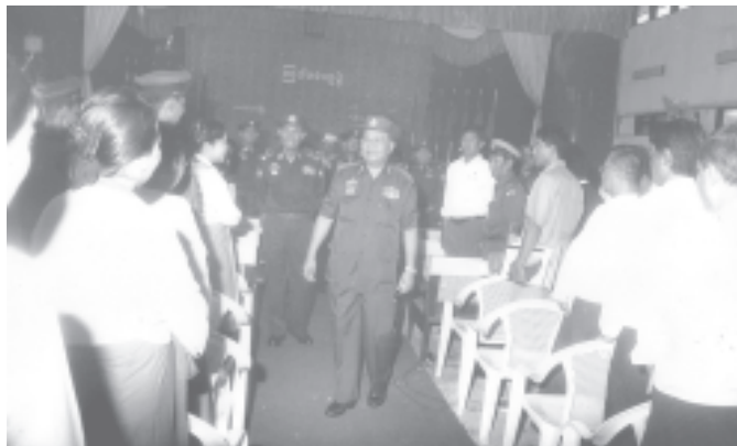
Senior General Than Shwe cordially meets departmental personnel and local people at Myinzuthaka Hall in Kawthoung.