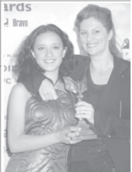
Actress Keisha Castle-Hughes (L) and director Niki Caro of New Zealand pose backstage with their Best Foreign Film Spirit Award at the IFP Independent Spirit Awards in Santa Monica, California, on 28 Feb, 2004. They won the award for their work on the film 'Whale Rider.'