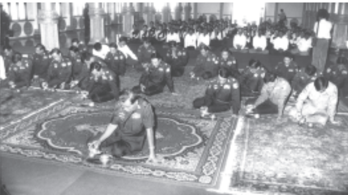
Senior General Than Shwe and party shares merits at the ceremony to donate provisions to Sayadaws of monasteries in Kawthoung.