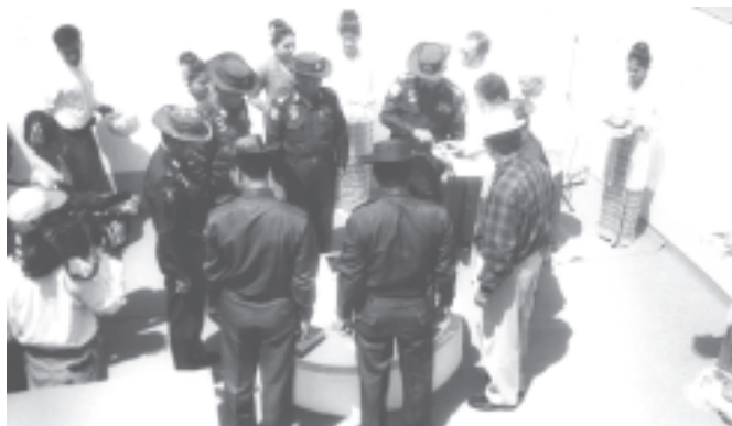
General Thura Shwe Mann sprinkles scented water on stone inscription laid for construction of Raw Oil Palm Mill in Khamaukgyi.