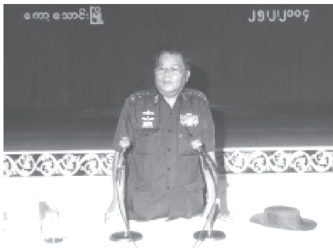
Senior General Than Shwe meets Tatmadawmen and family members of regiments and units of Kawthoung Station at Bayintnaung Hall in Kawthoung on 25-2-2004.