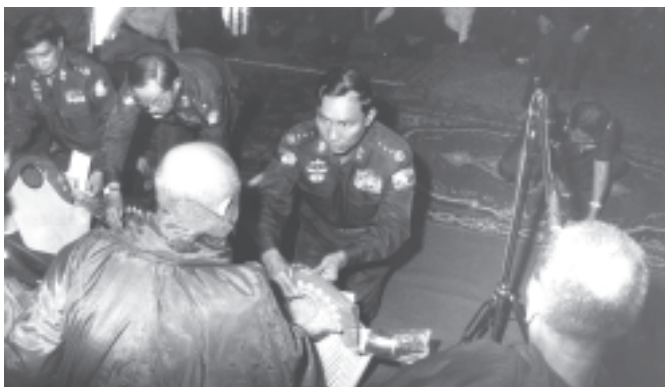
General Thura Shwe Mann presents offertories to a Sayadaw.