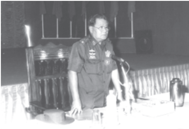
Senior General Than Shwe gives guidance to district and township authorities, social organization members, townselders and entrepreneurs in Kawthoung.