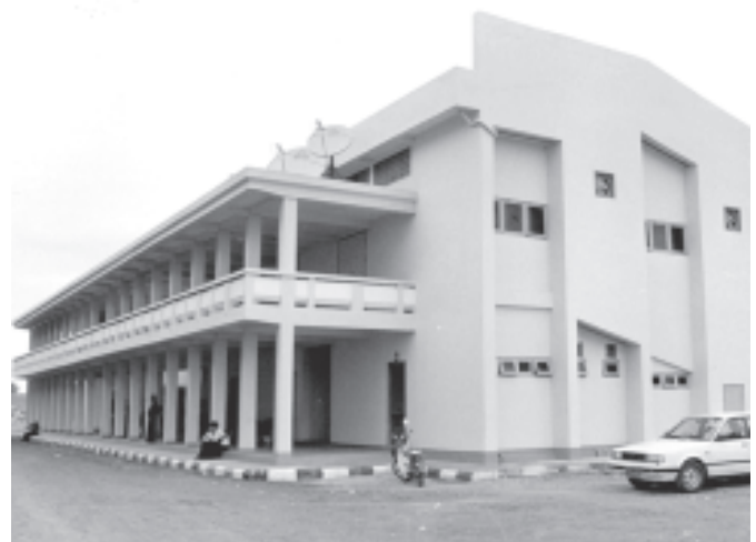
Magway Institute of Medicine.