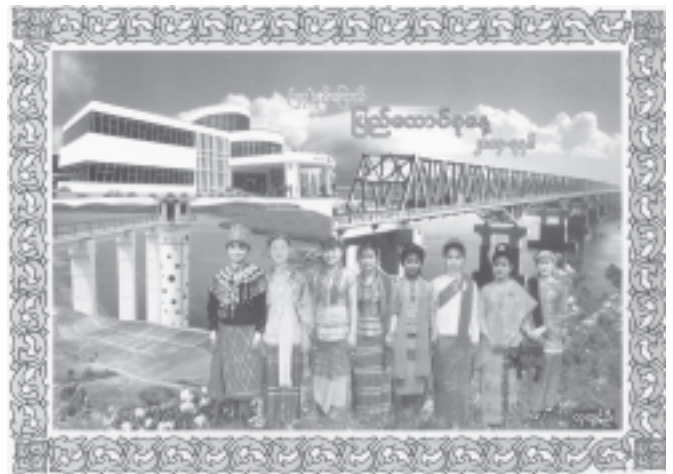
The 57th Anniversary Union Day commemorative postcard.