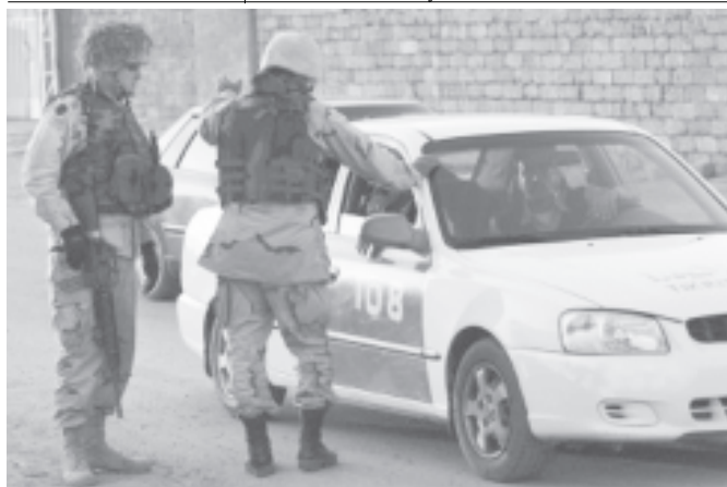
A US soldier (L) and an interpreter (R) check a car during a patrol in Tikrit, northern Iraq recently.