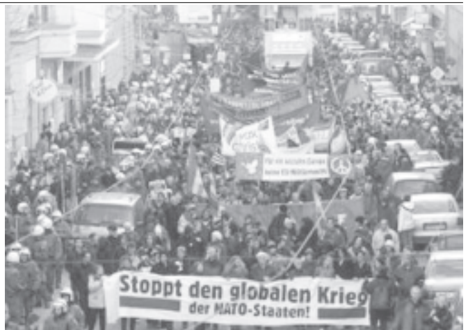
Protesters march through Munich on 7 Feb, 2004 to demonstrate against the 40th annual European Conference on Security Policy.