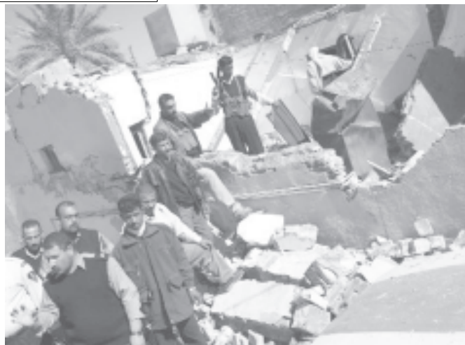
Iraqi police survey the damage at their police station on Sunday, 8 Feb, 2004 where a bomb exploded the day before, killing three policemen and injuring 11 others, in Suwayrah town, 30 miles (50 kilometres) south of Baghdad.

Two suicide bombers blew themselves up at PUK and KDP offices in Irbil, killing at least 109 people and injuring some 200 on February 1.