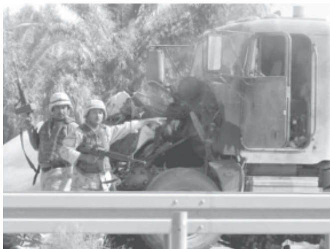
US Army soldiers secure the area near a destroyed transport truck after an attack west of Baghdad on 16-7-2003. One US soldier was killed and two were wounded.