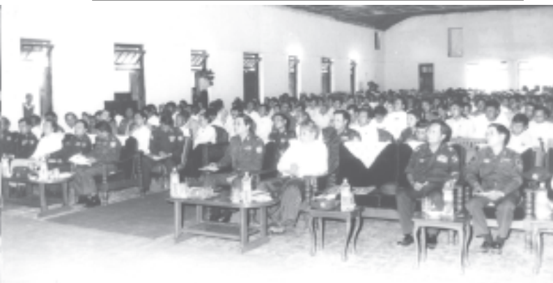
Prime Minister General Khin Nyunt meets with local authorities, service personnel, social organizations and local residents in Hlaingbwe.