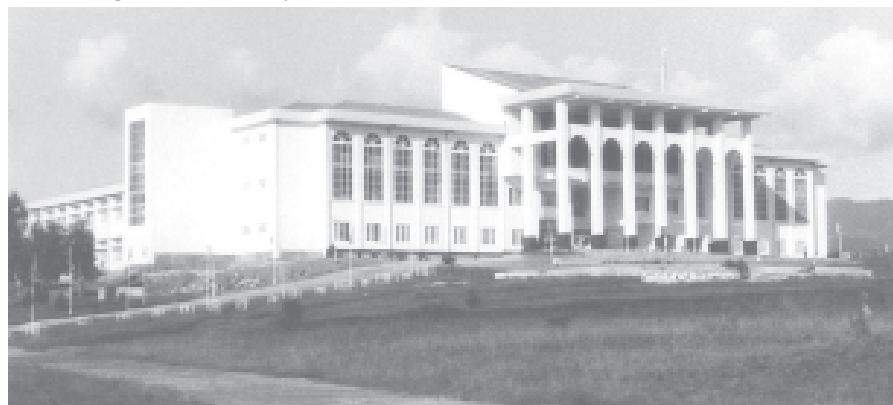
Panglong Government Computer College.