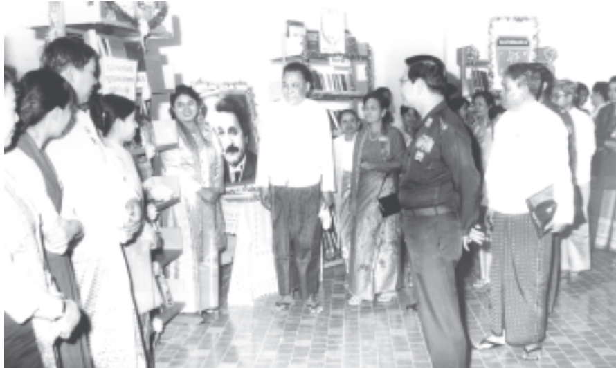
Prime Minister General Khin Nyunt visits a book fair at Hpa-an University.