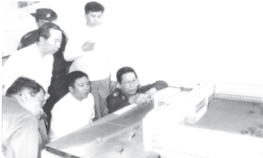
Prime Minister General Khin Nyunt inspects the scale-model of the Government Computer College (Hpa-an).