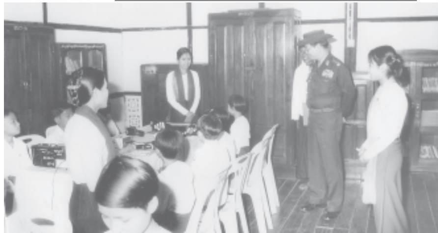
Prime Minister General Khin Nyunt inspects the multi-media classroom of Hlaingbwe BEHS (News page 11). — MNA

He said Hpa-an University has emerged possessing the characteristics of international