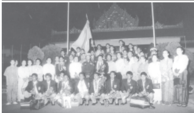
Minister Brig-Gen Thura Aye Myint, Maj-Gen Kyaw Win, officials and victorious U-18 footballers pose for a photo. (News page 16) — MNA

The Prime Minister and the guests, teachers and students posed for photos in front of the main building. — MNA