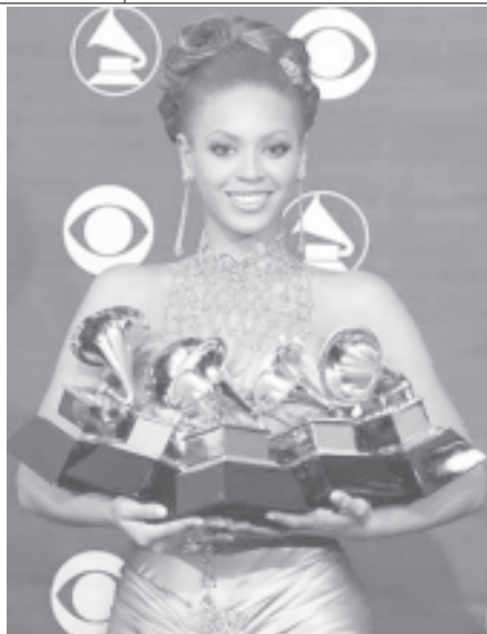
Singer Beyonce holds the five Grammy awards she won at the 46th annual Grammy Awards in Los Angeles on 8 Feb, 2004. Among the awards she won were Best Contemporary R&B Album 'Dangerously In Love' and Best Female R&B Vocal Performance for 'Dangerously In Love 2'.