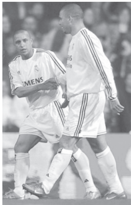
Real Madrid's Roberto Carlos, left, is congratulated by his teammate Ronaldo after his goal against Malaga during a Spanish league soccer match in Madrid, Spain on 7, Feb, 2004.