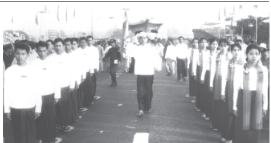
Union Flag relaying ceremony in progress in Dagon Myothit (South) in Yangon Division.