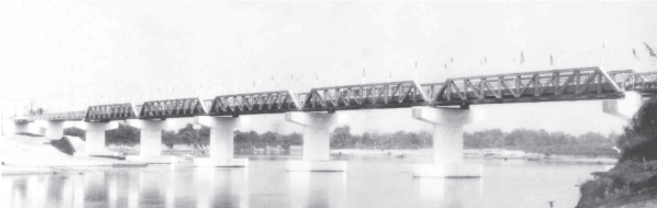
Tanai Bridge spanning the Tanai River on Tanai-Nanyun Road in Kachin State is 942 feet long and 12 feet wide and can withstand 30-ton loads.