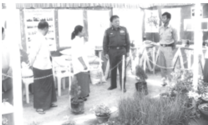
Deputy Minister Brig-Gen Aung Thein inspects Union Day Exhibition.

For the development of transport infrastructure, five major bridges in Kayin State and two major bridges in Mon State were built. Moreover, it was now easy to travel from Hpa-an to Mawlamyine and Myawady to Mawlamyine through Kawkaireik and Hpa-an. Improvement of transport (see page 15)