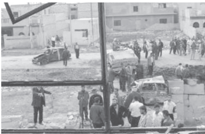
General view of the site of a suicide car bomb attack outside a police station on the outskirts of Baghdad, on 15 December, 2003.

Bulgarian soldiers stand guard in front of their bombed out base in Karbala, Iraq, on 28 Dec, 2003. Suicide bombers blasted military bases killing six coalition soldiers.