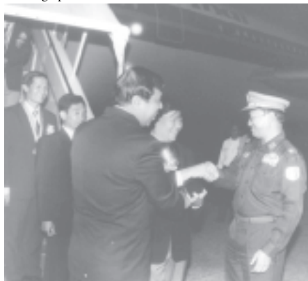
Minister Brig-Gen Thura Aye Myint welcomes back BIMSTEC Cup winners at Yangon International Airport. — MNA

Brig-Gen Thura Aye Myint, Maj-Gen Kyaw Win, U Aung Ko Win and officials later posed for a group photo together with the winning Myanmar youth team. — MNA