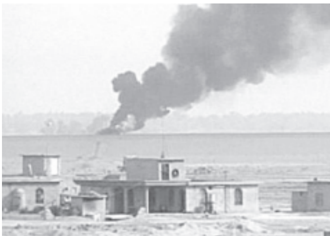
A US military vehicle burns following an explosion in Fallujah on 8 November, 2003. Guerillas killed two US paratroopers and wounded another when a homemade bomb exploded beside their vehicle in Fallujah, 40 miles west of Baghdad.