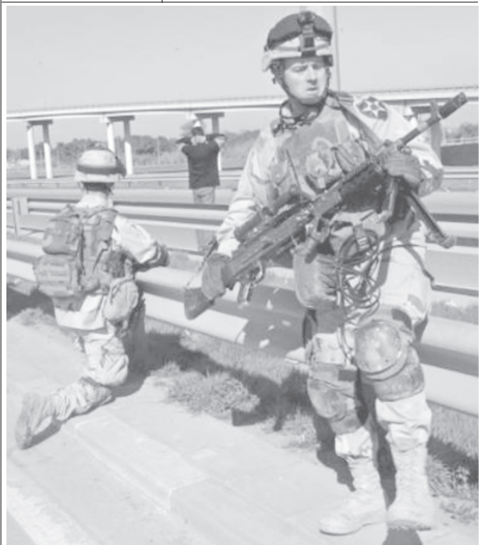
US soldiers from the Multi-National Brigade North detain an Iraqi during a patrol in the town of Mosul, some 390 km north of the capital Baghdad on 6 February, 2004.