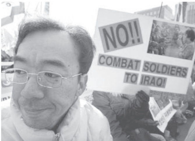
A South Korean man attends an anti-war and anti-US protest near the parliament in Seoul on 9 February, 2004. Thousands of protesters are expected to gather near the parliament to oppose plans to ratify the bills on the dispatch of troops to Iraq.