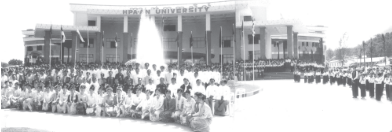
Prime Minister General Khin Nyunt and party and faculties and students pose for photo in front of the Hpa-an University. — MNA

Prime Minister General Khin Nyunt plants a tree to mark the success of the opening ceremony of Hpa-an University main building. — MNA