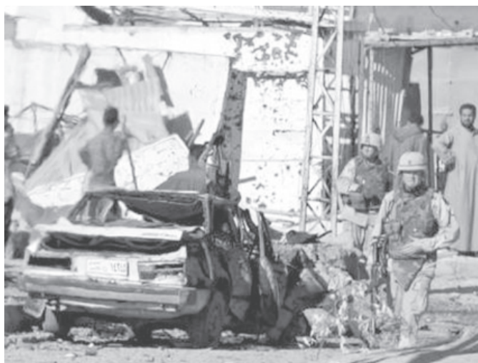
US soldiers pass a vehicle that was destroyed in a car bomb blast outside a police station in village of Khalidiyah, some 35 miles west of Baghdad, on 14 December, 2003. A car bomb ripped through a police station in western Iraq.