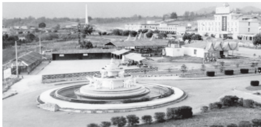
Developing Laukkai in Border area.