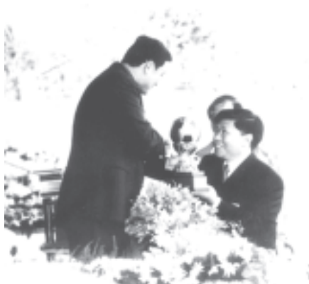
Prime Minister of Thailand Dr Thaksin Shinawatra presents the trophy to Myanmar Team (news on page 16).