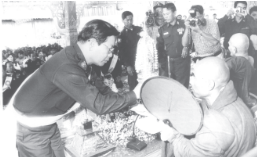
Prime Minister General Khin Nyunt presents the Seinbudaw to Sayadaw Bhaddanta Sujana.