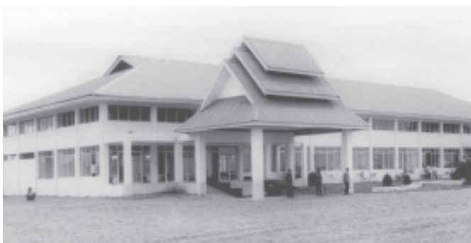
Magway Airport building.