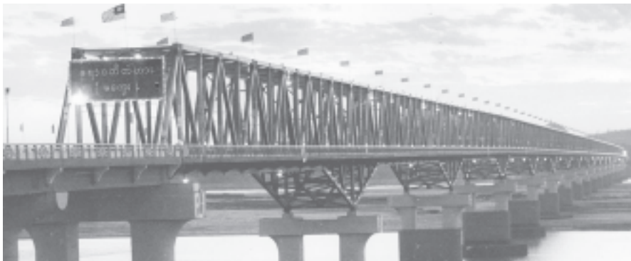
The 8989 feet long Ayeyawady Bridge (Magway) links Magway and Minbu.