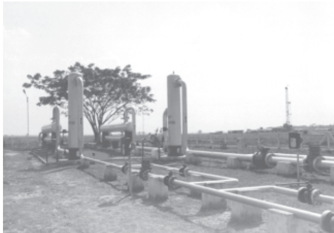
Nyaungdon oil and gas field in Nyaungdon region, Ayeyawady Division — ENERGY