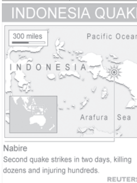
An earthquake measuring up to 7.1 on the Richter scale struck eastern Indonesia on 7 Feb, 2004, a day after one of similar magnitude killed 27 people and injured hundreds.—INTERNET