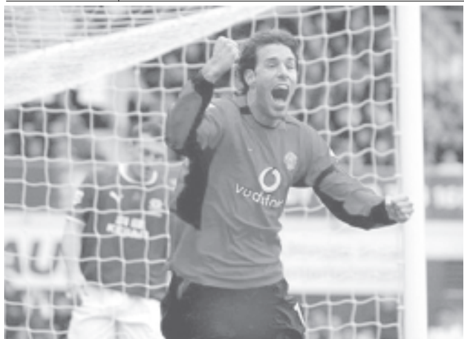
Manchester United's Ruud van Nistelrooy celebrates scoring his 100th goal for United during a Premiership clash against Everton at Goodison Park, Liverpool on 7 Feb, 2004.