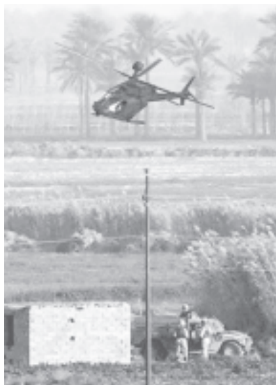
A US Army Kiowa scout helicopter searches the farm fields near the crash site after a Blackhawk helicopter crashed near the restive central Iraq town of Falluja, on 8 Jan, 2004. All nine US soldiers aboard were killed.