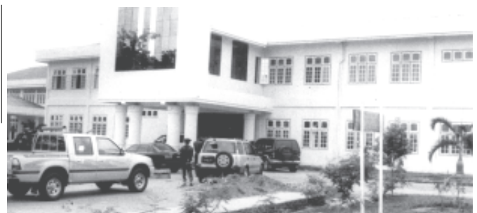
The 200-bed General Hospital in Myeik.