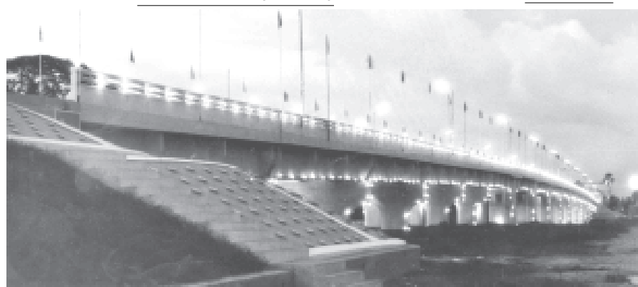
The 1400 feet long Darka River Bridge on Yangon-Pathein Highway in Kangyidaunt Township, Ayeyawady Division.