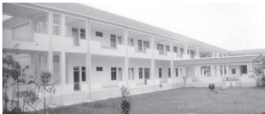
Maubin General Hospital in Maubin, Ayeyawady Division.