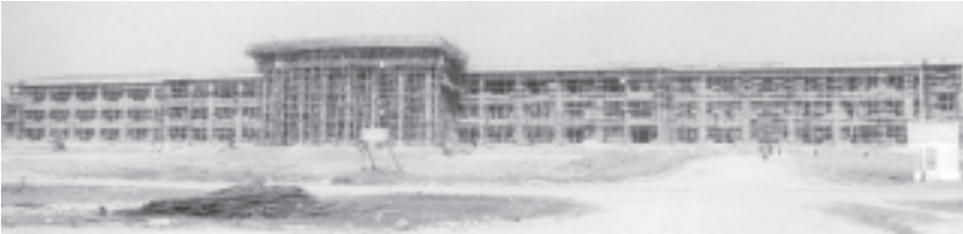
Government Technological College which is under construction in Kengtung.