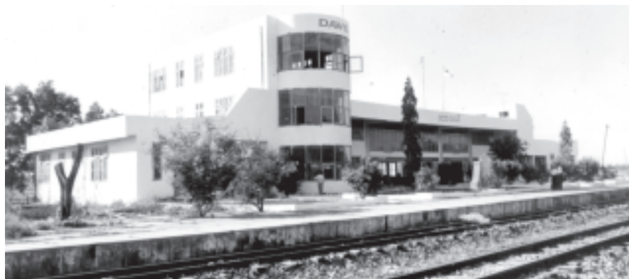
Dawei station in Dawei, Taninthayi Division.