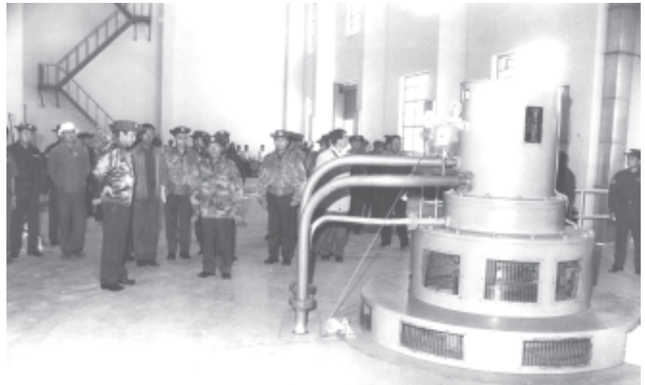
Vice-Senior General Maung Aye and party inspect control rooms at Thaphanseik Hydel Power Plant.

He said paddy, wheat, beans and pulses and sesamum were mainly cultivated with the use of water from the dam. Over 500,000 acres of monsoon and summer paddy were grown as soon as the dam was completed.