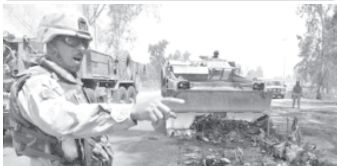
A US soldier directs clean-up operations of the wreckage of US army Humvees in Baghdad, Iraq, on 21 July, 2003. A US soldier was killed and three soldiers were injured when a roadside bomb was detonated as their convoy passed.