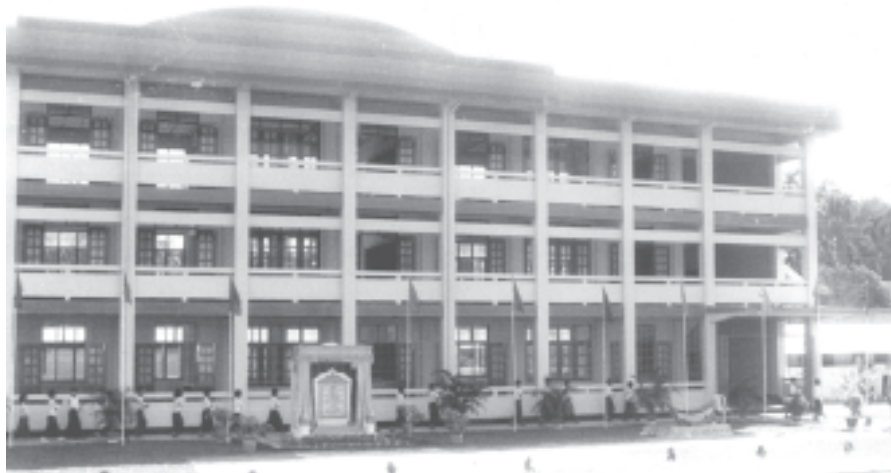
Newly-opened three-storey school building at No 2 BEHS in Kungyangon.