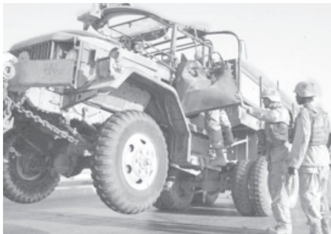
US soldiers inspect a military truck moments after an early morning rocket-propelled grenade attack in al-Khadra'a west of Baghdad, Iraq, on 14 July, 2003. Guerillas have been attacking US vehicle convoys and launching mortar attacks on US bases in central Iraq. The soldier driving the truck was killed after the RPG hit the side door and six others were wounded in the attack.