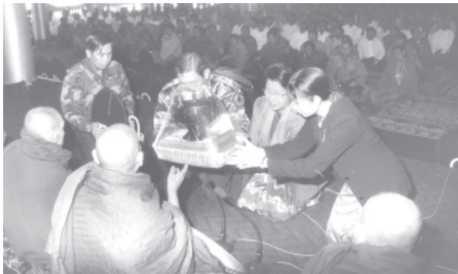
Vice-Senior General Maung Aye and wife Daw Mya Mya San offer provisions to a Sayadaw at the fourth Maha Shwesigyi Pagoda Buddha Pujaniya ceremony.