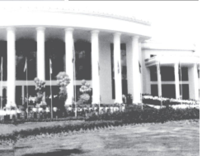
Maubin University in Ayeyawady Division.