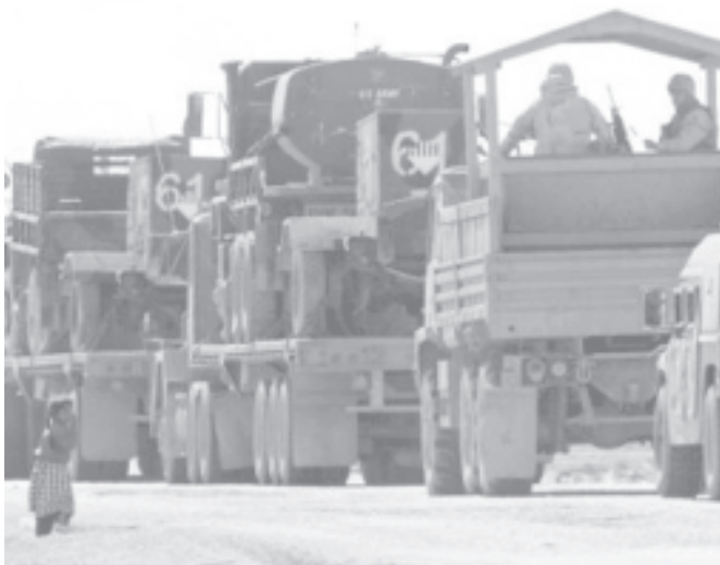
An Iraqi girl looks a passing US military convoy as it enters Kuwait from the southern Iraqi city of Basra, on 7 Feb, 2004.