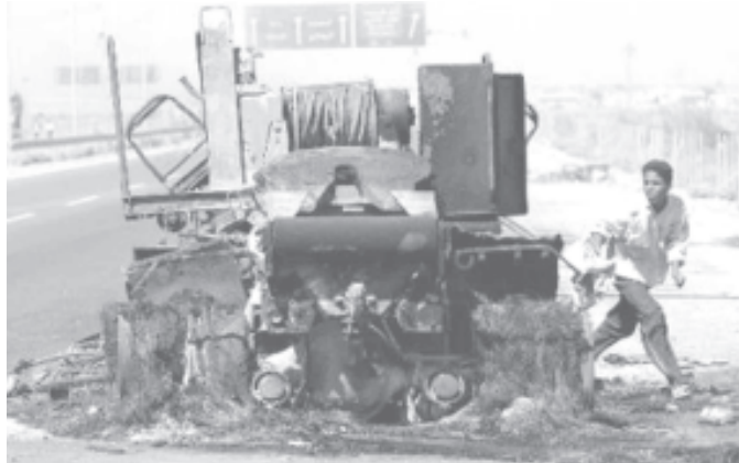
A young Iraqi man tries to salvage some wiring on 27 June, 2003 from a destroyed US military vehicle after it was ambushed along a highway in Abu Ghraib northwest of Baghdad. Two soldiers died in the attack.