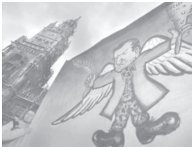
Demonstrators protest against the 40th Conference on Security Policy in front of Munich's Townhall, on 7 Feb, 2004.