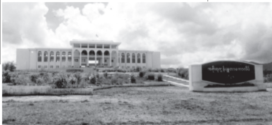
Government Computer College (Panglong) in Loilem, Shan State.

marching towards a modern industrial nation, the Government has enhanced the production capacity of the State-owned factories and promoted