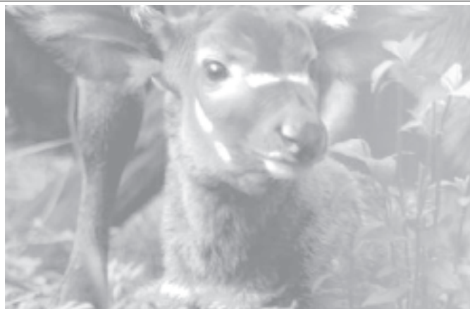
'Kenya', the first Kenyan new-born bongo antelope baby from an American-raised bongo, rests near its mother 'Mum' at the Mount Kenya Game ranch, on 5 Feb, 2004.