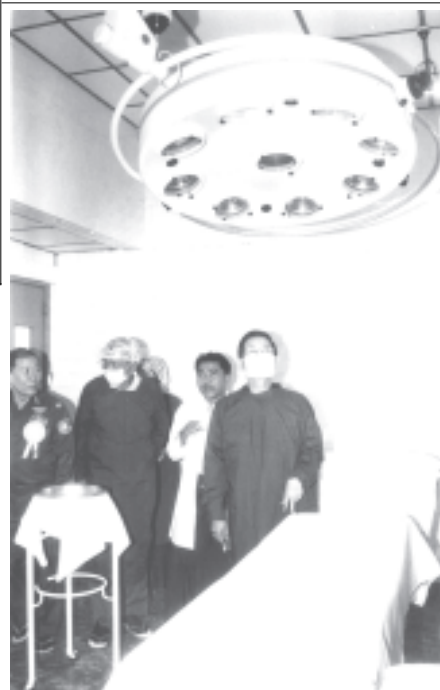
Prime Minister General Khin Nyunt inspects the People's Hospital in Kungyangon.