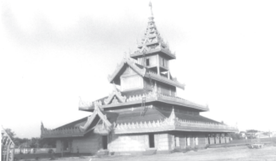
Shwebon Yadana Mingala Palace in Shwebo.