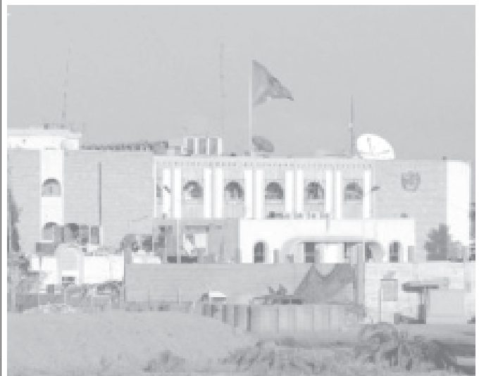
A US military vehicle guards the front of the United Nations building in Baghdad, Iraq on 7 Feb, 2004.