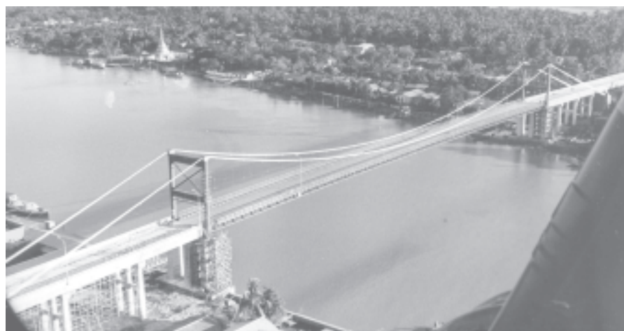
The 3,000 feet long bailey suspension Wakema Bridge on Pantanaw-Shwelaung Wakema Kyonmange Road.