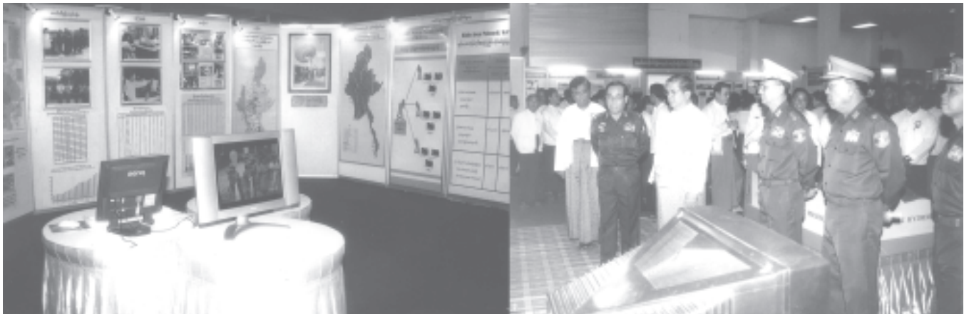
Secretary-1 Lt-Gen Soe Win and Secretary-2 Lt-Gen Thein Sein view round the booths at the 57th Anniversary Union Day Exhibition.