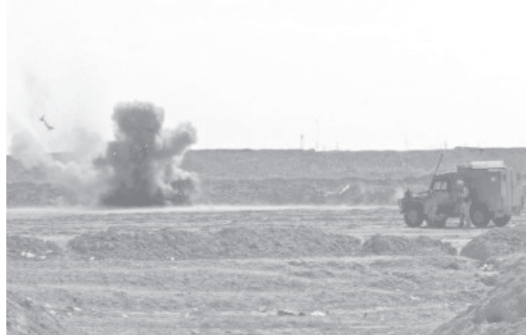
British soldiers from the Joint Force Explosive Ordnance Disposal, 49 Field Squadron, take cover beside their armoured vehicle as they detonate an unexploded bomb found south of Basra, near the Kuwaiti border, on 7 Feb, 2004.