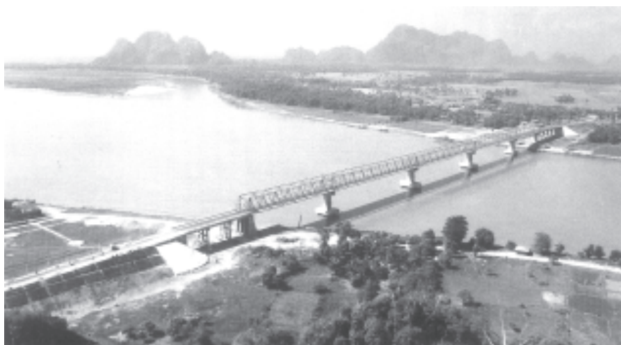
Thanlwin River crossing bridge (Hpa-an) linking Myaingalay and Hpa-an in Kayin State.

The Government has also set up 24 development zones in the whole nation for harmonious progress of all regions in building a modern nation. The 24 zones are designated in Myitkyina, Bhamo, Loikaw, Hpa-an, Kalay, Monywa, Dawei, Myeik, Bago, Pyaw, Magway, Pakokku, Mandalay, Meiktila, Mawlamyine, Sittway, Yangon, Taunggyi,