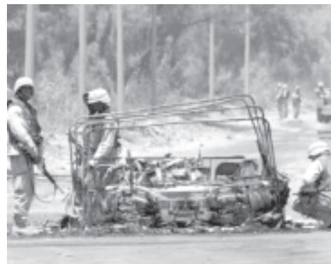
US Army soldiers look over one of two destroyed military vehicles after an explosion on a Baghdad road on 21 July, 2003. A US military vehicle was blown up apparently by a rocket-propelled grenade, and at least two soldiers riding in it were killed.