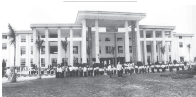
Government Technological College (Maubin) in Maubin, Ayeyawady Division