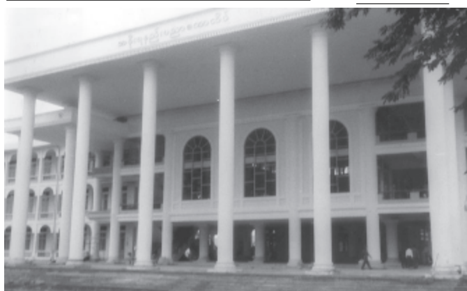
Pathein Government Technological College in Pathein.