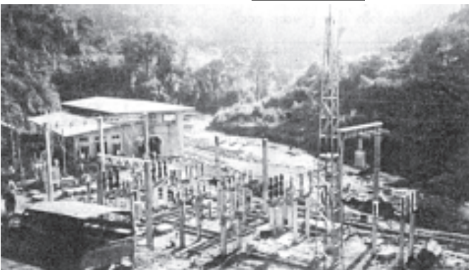
Nam Khamkha hydel power plant that generates 16 million kilowatt hours a year to supply electricity.