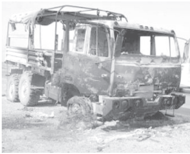
The remains of a US army truck is seen near Balad 40 kilometres, (25 miles) north of Baghdad, Iraq, on 16 June, 2003. The truck was attacked in an ambush on 15 June with a number of soldiers injured.