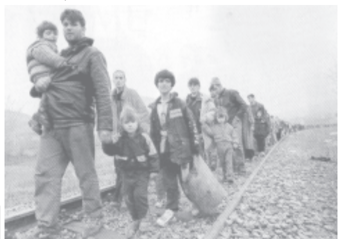
Innocent civilians run for their lives as wars follow the dismemberment of Yugoslavia in 1990.

(Hailing the 57th Anniversary Union Day)