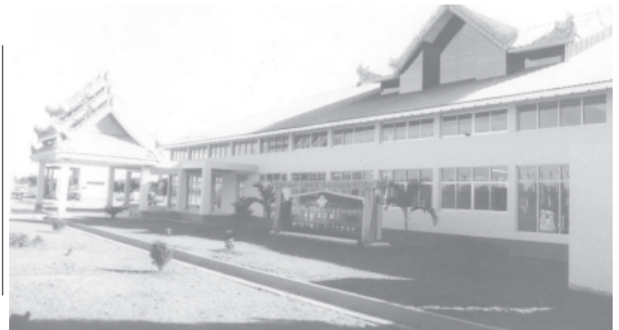
Newly opened Monywa airport in Monywa, Sagaing Division.