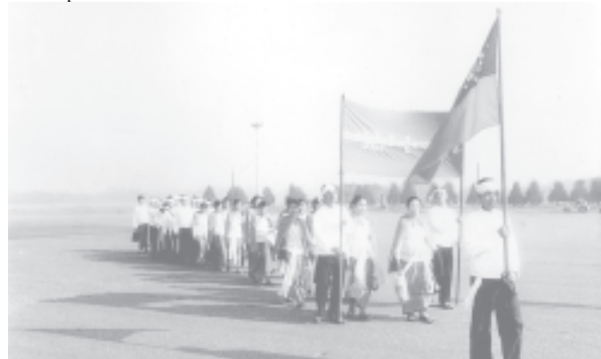
Cultural troupes and delegates of Kayah State to the Union Day arrive Yangon.