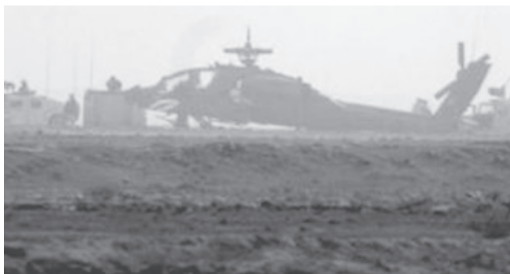
A US Army Apache sits in a field without its rotors and surrounded by US vehicles near the restive central Iraq town of Fallujah on 13 January, 2004. The helicopter that crashed west of Baghdad was shot down by Iraqi guerillas.