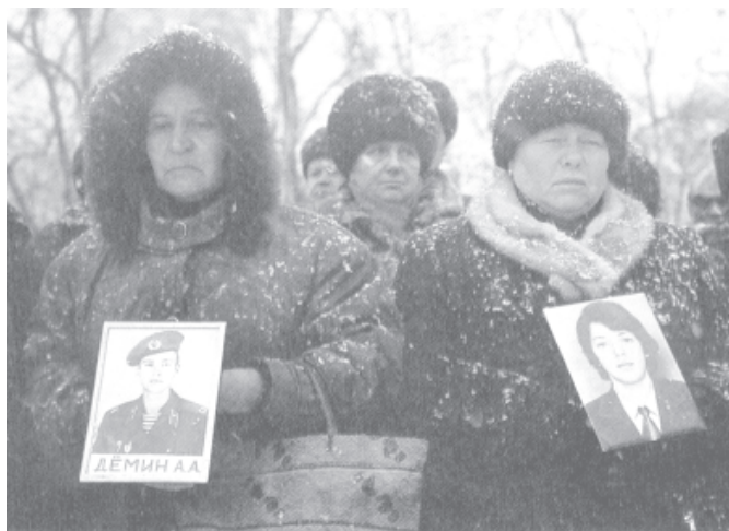
People with grief over the loss of their family members killed in the civil war after the collapse of the USSR.

fine tradition to our posterity. In the process, we can take lessons from the international affairs and problems of some union nations by observing disintegration of these nations and their national solidarity. It is quite obvious that the collapse of these nations was due to the instigations and racial dissension imposed by big powers trying to get the world nations under