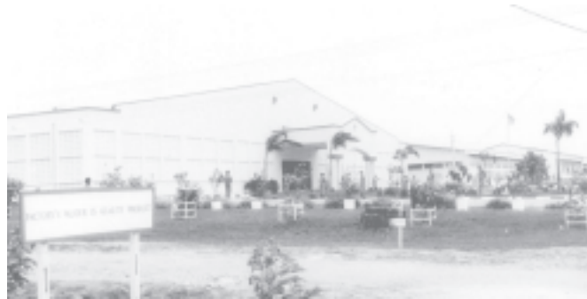
The Micro-Organism Blue Green Algae (Spirulina) Pharmaceutical Factory (Yekha) located in the place, one mile west of Sagaing-Mingun Road in Sagaing Division. The factory produces various types of medicine that are derived from blue green algae that can be seen only with the aid of a microscope.