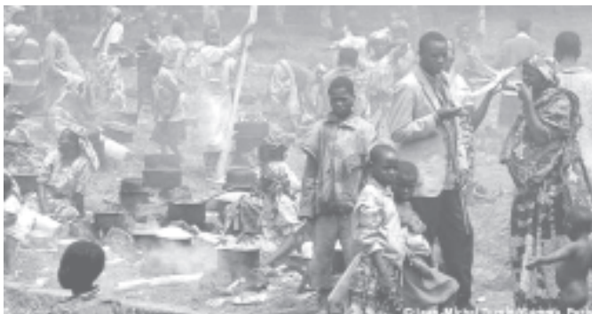
Innocent civilians drown in the sea of troubles as a result of racial conflicts in Rwanda in the middle Africa.

Likewise, the Federal Republic of Yugoslavia also encountered ill consequences far worse than the Soviet Union did. The death of Yugoslav leader Marshall Tito entailed the disintegration of national solidarity in Yugoslav. Later, there surfaced racial issues. In