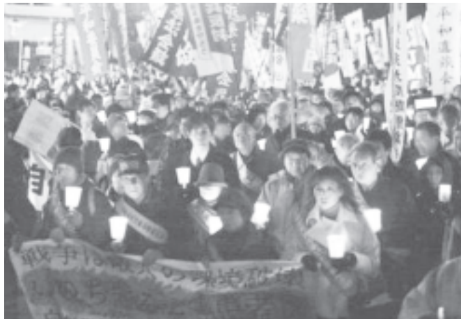
Nearly 10,000 Japanese protesters, holding candles and anti-war banner, shout their opposition against the dispatch of Japanese Self Defence Force to Iraq, during their rally near Defence Agency in Tokyo on 5 Feb, 2004.—INTERNET