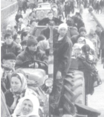
The people of Kosovo become war refugees as a result of Union disintegration owing to the colonialist interferences.

bombs. The cluster bombs claimed a large number of civilian lives of Serbia, wounding many others. The attacks US armies and the NATO group launched destroyed schools, hospitals, bridges, factories and civilian quarters in addition to military bases of Yugoslavia, causing a loss of property worth over 100 billion dollars. The external and internal elements making the good use of the disintegration of national solidarity in Union States which had stood in stability and peace for many years and interfering the internal affairs only brought ill consequences to the country and the