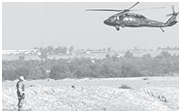
US helicopters have been searching the area of the helicopter crash near Tikrit on 7 November, 2003.