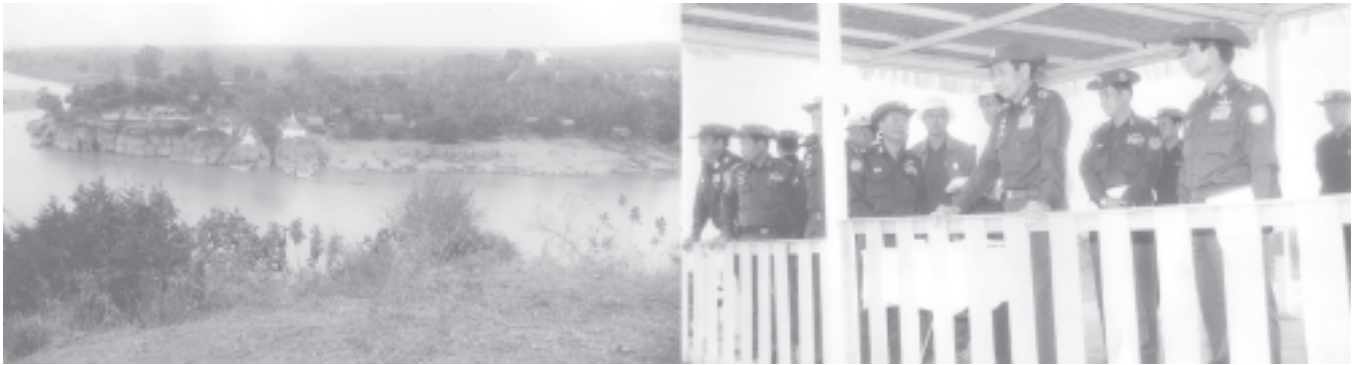
Vice-Senior General Maung Aye inspects Shwesayay hydro-power project on Chindwin River near Shwesayay Village in Budalin Township, Sagaing Division.