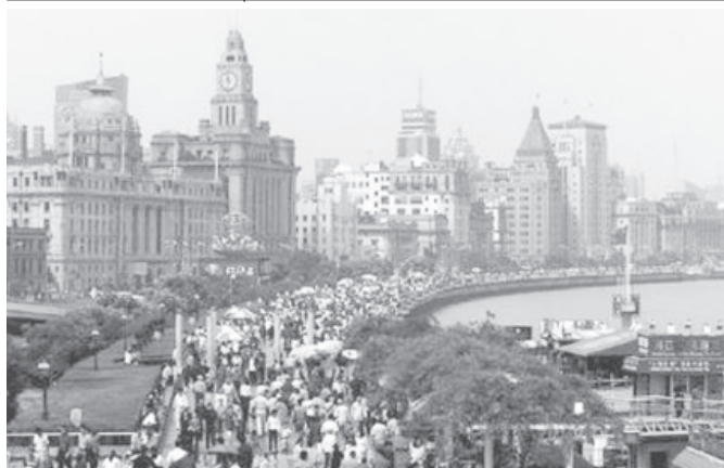
File photo of tourists along the riverside Bund in Shanghai. Rising sea levels due to global warming mean the gleaming skyscrapers of China's financial hub Shanghai could be entirely submerged in 600 years, a state newspaper said on 6 Feb, 2004.