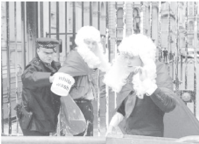
A police officer restrains one of several protesters dressed as Lord Hutton who threw white paint at the gates of Downing Street on 4 Feb, 2004.

"The tally for 2003 is not brilliant," he said, blaming "an exceptionally difficult international context", poor economic growth, a heatwave last summer and a strike by festival performers.