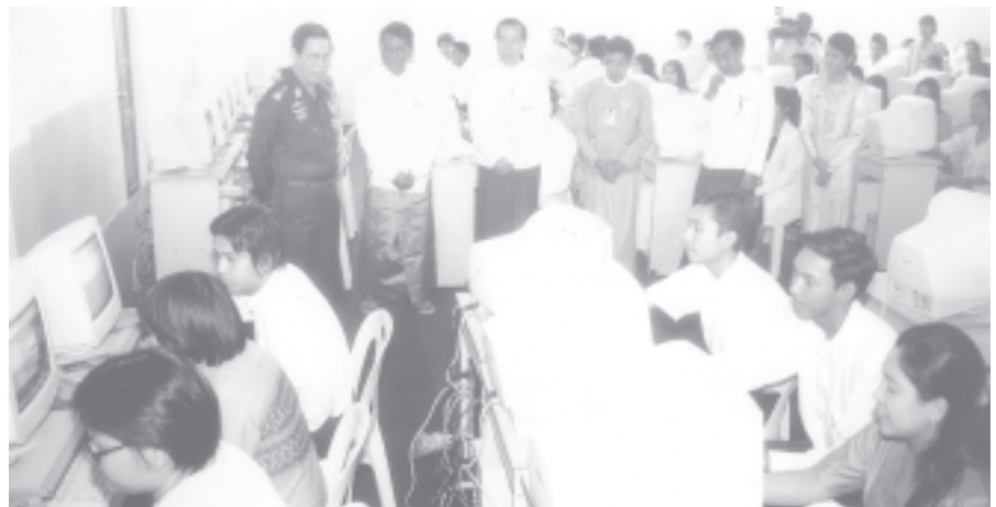
Prime Minister General Khin Nyunt visits a classroom at University of Computer Studies. — MNA

Newly opened main building of University of Computer Studies in Shwepyitha Township, Yangon. — MNA