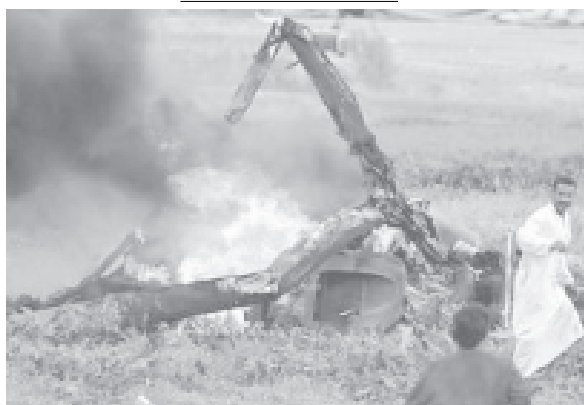
Iraqi men run towards the wreckage of US helicopter which crashed near Fallujah on 9 Dec, 2003.