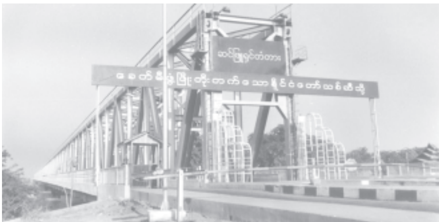
Chindwin River-crossing Hsinbyushin Bridge that links Sagaing and Magway Divisions.