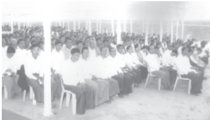
Vice-Senior General Maung Aye speaking at the ceremony to meet with Kale District and Mingin Township authorities and local people in Mingin Township.