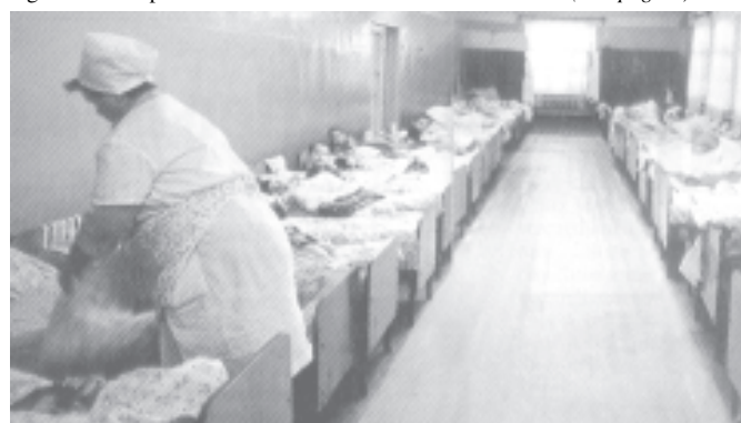
Innocent children become orphans owing to the civil war following the disintegration of the Soviet Union in 1991.