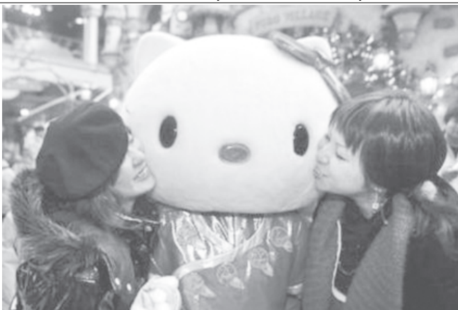
Japanese teenagers kiss Hello Kitty wearing a China dress at Sanrio Puroland on the outskirts of Tokyo on 24 Jan, 2004.