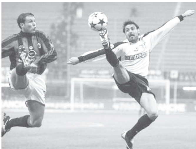
Lazio's Stefano Fiore, right, jumps for the ball with AC Milan's Fernando Redondo, of Argentina, during the Italy Cup, first leg, semifinal soccer match at San Siro Stadium in Milan, Italy, on 5 Feb, 2004.

MILAN, 6 Feb— Inter Milan have a history of expensive errors in the transfer market but with four goals in two games Brazilian striker Adriano already looks like a signing who could make a huge difference to the troubled club.