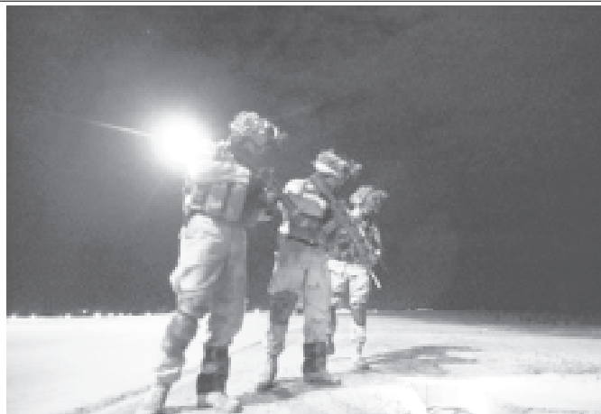
US soldiers of the 1st Battalion, 22nd Infantry Regiment of the 4th Infantry Division, on patrol in Tikrit on 5 Feb, 2004.