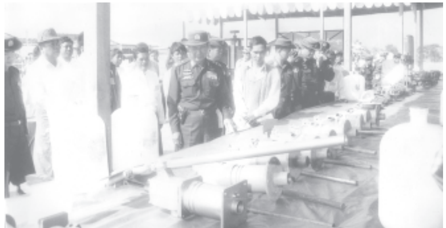
Vice-Senior General Maung Aye inspects products of Kale Industrial Zone.