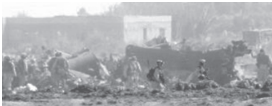
US Army troops search a crash site where a Chinook helicopter crashed into a field near Falluja on 2 November, 2003. Guerillas shot down an American helicopter in Iraq, killing at least 15 US personnel and wounding 21 in the bloodiest single strike on US-led forces since they invaded Iraq.

Since the end of major combat in Iraq was declared on 1 May, at least 12 military helicopters have crashed or been shot down, killing a total of 56 soldiers. The deadliest such incident occurred in November, in the northern city of Mosul, when two Black Hawks collided, killing 17.