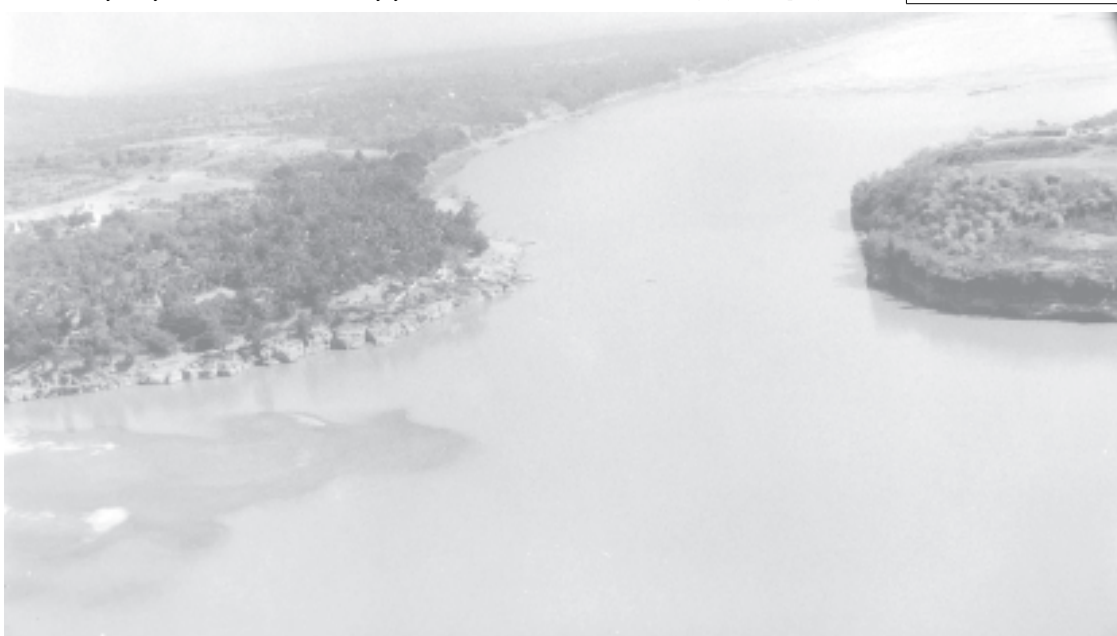
Aerial view of Shwesayay hydro-electric power project site on Chindwin River near Shwesayay Village, Budalin Township.—MNA

The member of the delegation was Director U Tint Thwin of Directorate of Trade.—MNA