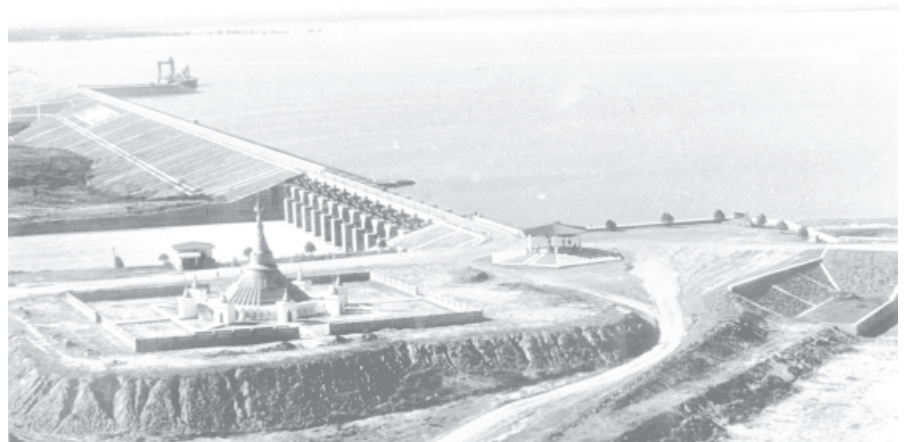
Thaphanseik Dam in Kyunhla Township, Sagaing Division can irrigate 500,000 acres of farmland and generate 117.2 million kilowatt hours of electricity a year. It is the largest in Myanmar and included in the longest dams in Southeast Asia.