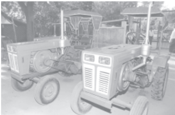
Tractors produced by Monywa Industrial Zone, Sagaing Division.