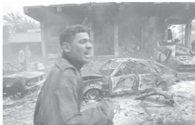
In Afghanistan, a large number of houses were devastated completely due to the attacks of the US and its allies.