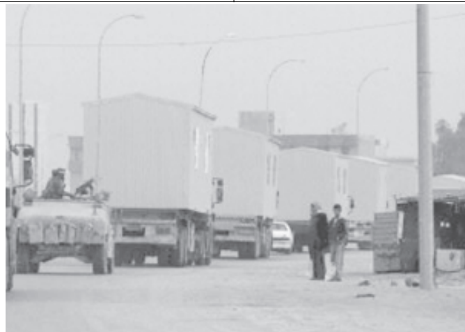
A US military vehicle (L) escorts a convoy of trucks carrying prefabs on their way to Baghdad through the southern Iraqi city of Samawa recently.