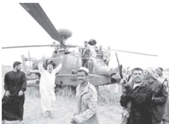
Iraqi tribesmen celebrate in front of a downed US Apache helicopter in the southern Iraqi city of Karbala.