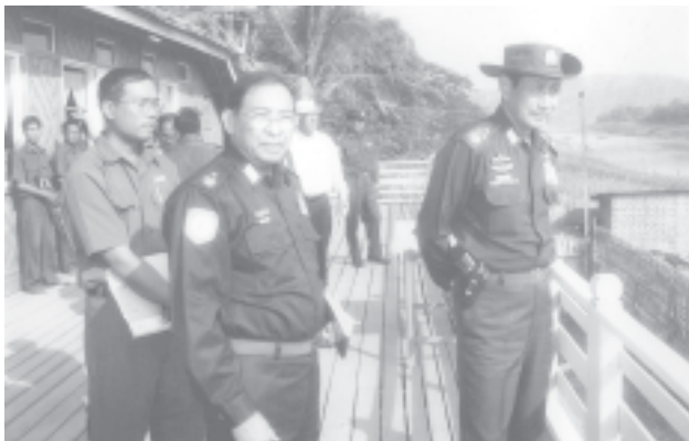
Vice-Senior General Maung Aye inspects Myiththa Bridge (Kalewa) Project in Sagaing Division.