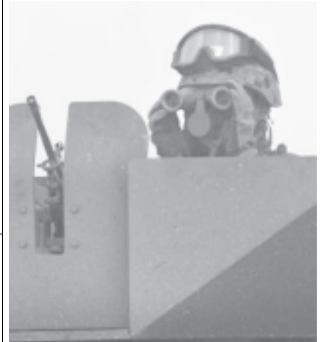
A foreign soldier looks through binoculars from an armoured vehicle as he stands guard at the construction site in Samawa, southern Iraq on 5 Feb, 2004.