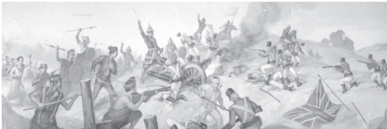
National brethren residing in Myanmar bravely fought against colonialists who encroached upon the sovereignty of Myanmar.

The colonialists waged three aggressive wars on Myanmar — in 1824, 1852 and 1885 — and then occupied the nation. Holding whatever arms they could get, the national races launched attacks against the intruders for 10 years.