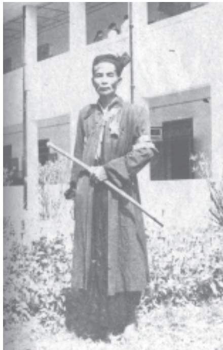
The photo taken at the 21st Anniversary Union Day shows Daipha Duwa, the leader of Kachin national race who fought against the colonialists.

It is the characteristic of old and new colonialists in separation of the regions according