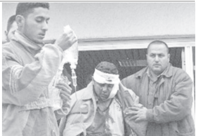
An injured Iraqi man is wheeled from a ward in a Baghdad hospital after an explosion at a hotel in central Baghdad on Wednesday, 28 Jan, 2004.