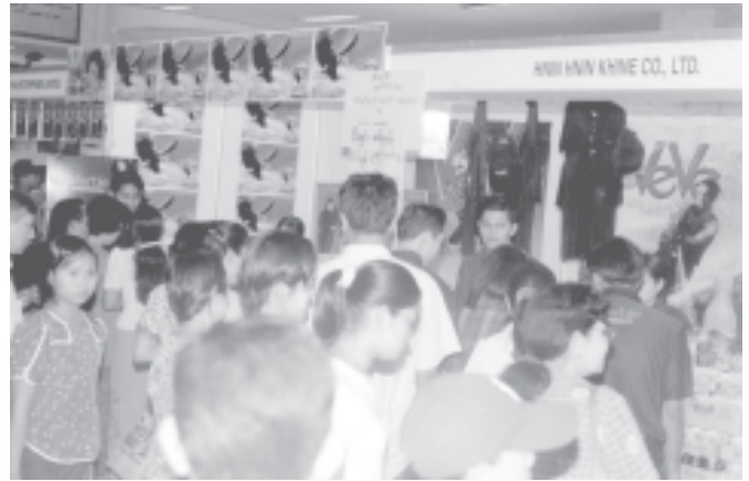
VeVe booth of Hnin Hnin Khine Co Ltd.

"Mainly, the trade fair will concentrate on exhibiting various kinds of import-substitute goods and new products. Old ways of distributing goods will not work