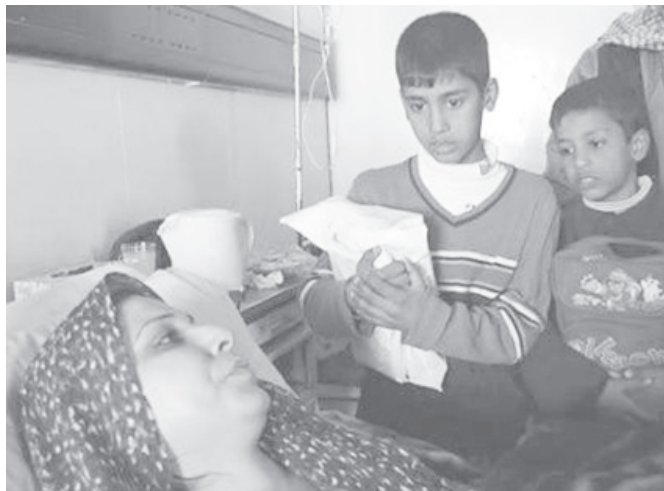
Iraqi children visit a wounded woman, who was shot while walking to work in the city of Najaf on 21 December, 2003.

The unipolar world dominated by a super power nation is leading the world to economic chaos, political anarchy, uncertainty and fear. The people of the world are not going to recover, and have peace for as long as threats are used for political and economic reforms that most of the world is not ready for and not willing to accept.