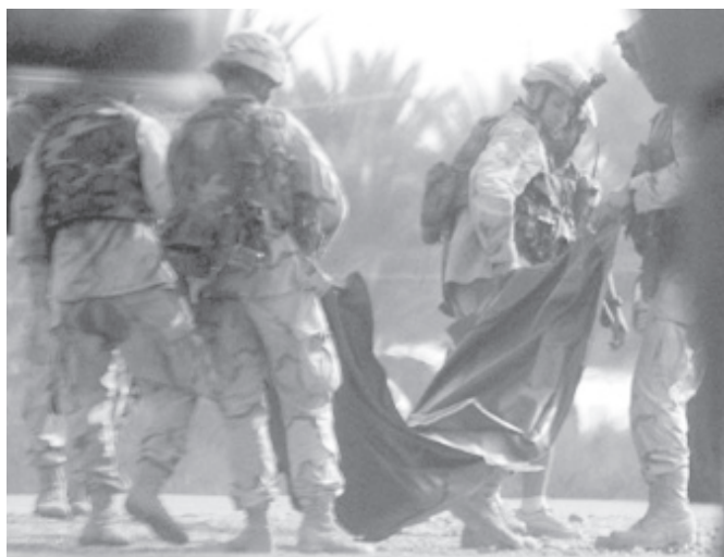
US soldiers remove the body of an Iraqi man killed during clashes in Latifiyah, south of Baghdad.