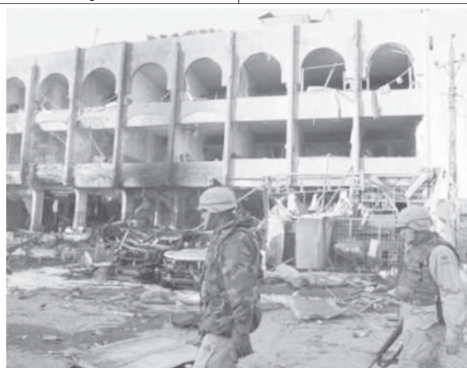
US Army troops survey the scene of a bomb attack at a Baghdad hotel, on 28 Jan, 2004. A suicide bomber blew up a car packed with explosives outside the hotel on Wednesday.