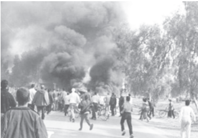
A minibus burns after a man, getting off the public minibus, stepped on a roadside bomb killing him in a Baghdad suburb on Monday, 26 Jan, 2004.