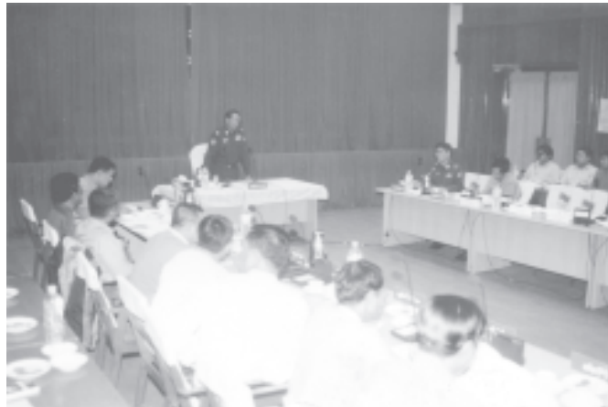
Minister Brig-Gen Thura Aye Myint delivers an address at the meeting.