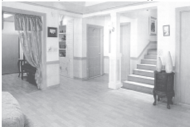
Korea-made laminated flooring tiles.