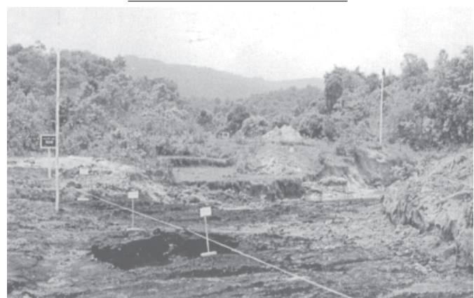
Coal deposits found in Manpanponmar region in Tangyan Township, Shan State (North). Coal produced in the coal mines in Shan State (North) is of high quality.