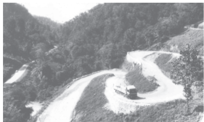
Thanks to the emergence of the network of roads and bridges, local people can travel wherever they want in Shan State. In the breathtaking scenery, a heavy truck seen rolling on the mountain road section of the Mandalay-Lashio-Muse Road, an important facility helping promote Myanmar's border trade with the People's Republic of China, and develop a large region covering the northern Shan State especially the border areas with Muse, a border town, at the centre.