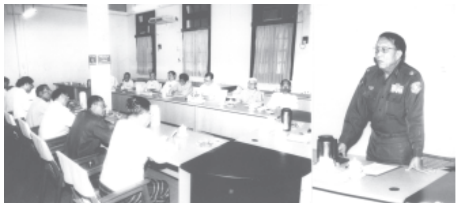
Deputy Minister Brig-Gen Aung Thein gives a speech at the meeting of Pakokku U Ohn Pe Literary Awards Trust Fund Supervisory Committee.