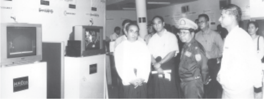
Minister Brig-Gen Kyaw Hsan views a booth at the Third Myanmar ICT Week-2004.