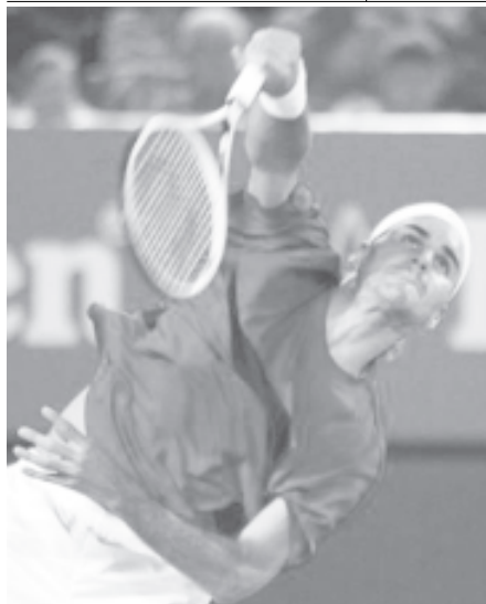
Second seed Roger Federer of Switzerland serves to eighth seed David Nalbandian of Argentina during their quarter-final match at the Australian Open tennis championship in Melbourne, on 28 Jan, 2004. Federer won the match 7-5, 6-4, 5-7, 6-3 and will play Spain's Juan Carlos Ferrero in the semi-finals.