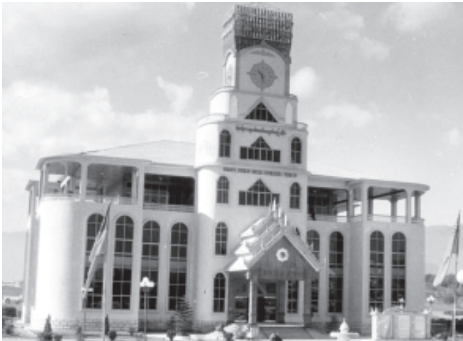
The main aim of the border area development programme is development of national races in border areas, and is to enable them to earn a proper living after eradicating poppy cultivation. The photo shows Laukkai Drug Elimination Museum, a symbol of efforts to fight against narcotic drugs.