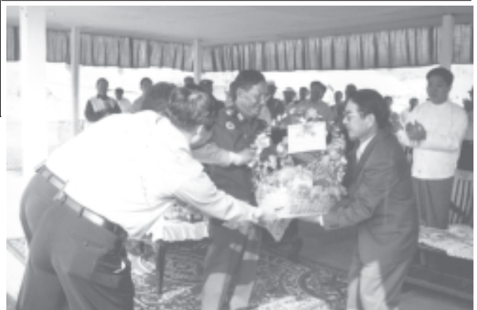
Minister Maj-Gen Tin Htut presents a fruit basket to a foreign expert. — ELECTRIC POWER

The officials formally opened the ceremony. The minister pressed the button to launch the project. The minister presented fruits baskets to foreign experts who will participate in the project. Afterwards, the minister and party inspected the project site. — MNA