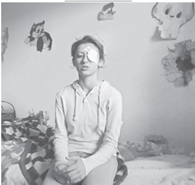
A wounded Iraqi girl sits in her bedroom in front of a hole caused when a rocket tore into her family's apartment in central Baghdad.