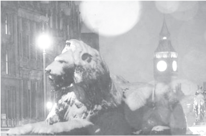
A dusting of snow covers one of the lions in Trafalgar Square, London, on late 28 Jan, 2004. Britain was braced for another night of snow, ice and freezing temperatures as the cold snap continued and London received another dusting of snow leading to travel chaos.