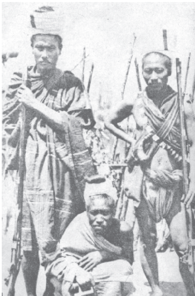
leaders of Chin national race who fought against the colonialists.