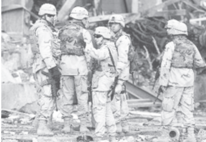
US troops secure the area after a car bomb exploded in front of a hotel in central Baghdad on 28 Jan, 2004. —INTERNET

The blast hurled remains of one car across the street. Several other cars caught fire and were reduced to mounds of twisted metal.—Internet