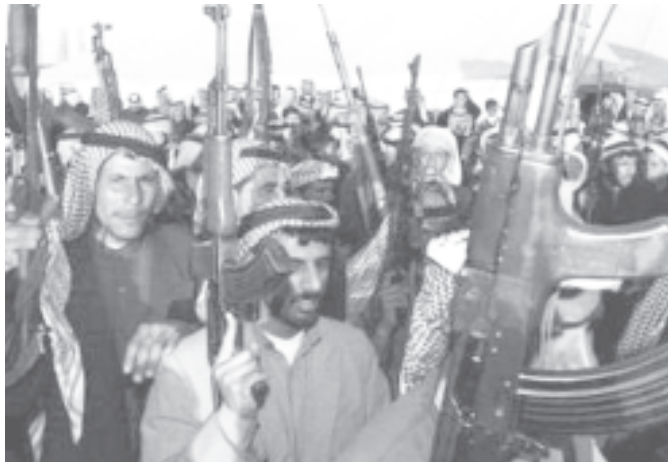
Iraqi tribal members raise their weapons into the air at a memorial service for a tribal leader in Samawa, southern Iraq, on 28 Jan, 2004.

Last November, US civil administrator for Iraq Paul Bremer and the Iraqi Governing Council (IGC) signed an accord providing for handing over power to Iraqis by July.