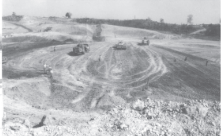
Minister Maj-Gen Nyunt Tin inspects earth work for Thebyu Dam Project. AGRICULTURE & IRRIGATION