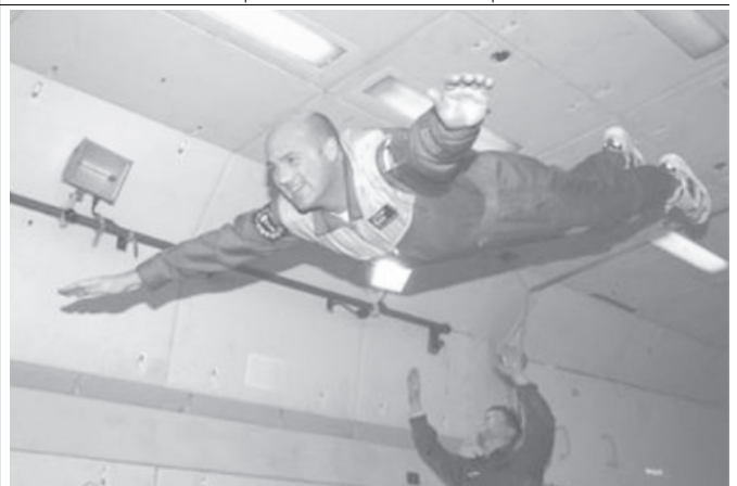
European Space Agency astronaut Andre Kuipers from Holland trains for zero gravity conditions during a parabolic flight on a training plane near Star City outside Moscow, on 28 Jan, 2004. Kuipers will go to the International Space Station with the Expedition 9 crew in April 2004 for eight days and will return to Earth with Expedition 8 Commander Mike Foale and Alexander Kaleri.

The water level at Sungai Sarawak has receded by two metres and normal high tide occurred in the evening. However, there was only small amount of spill-over at the river bank which did not flow into the Kuching City Centre.