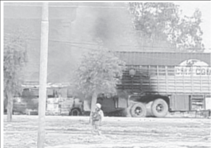
A truck and trailer burn after a roadside bomb blast in Khaldiya, Iraq, on 27 Jan, 2004. Three American soldiers were killed and one was wounded in a large explosion 50 miles west of Baghdad.