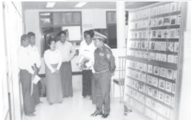
Minister Brig-Gen Kyaw Hsan inspects e-Library in Kyauktan, Yangon South District.

Public Relations Department where he gave necessary instructions to the officials.—MNA