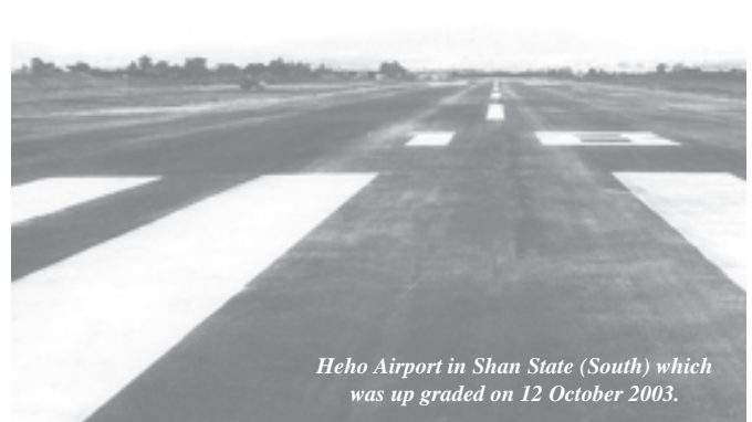
Heho Airport in Shan State (South) which was up graded on 12 October 2003.