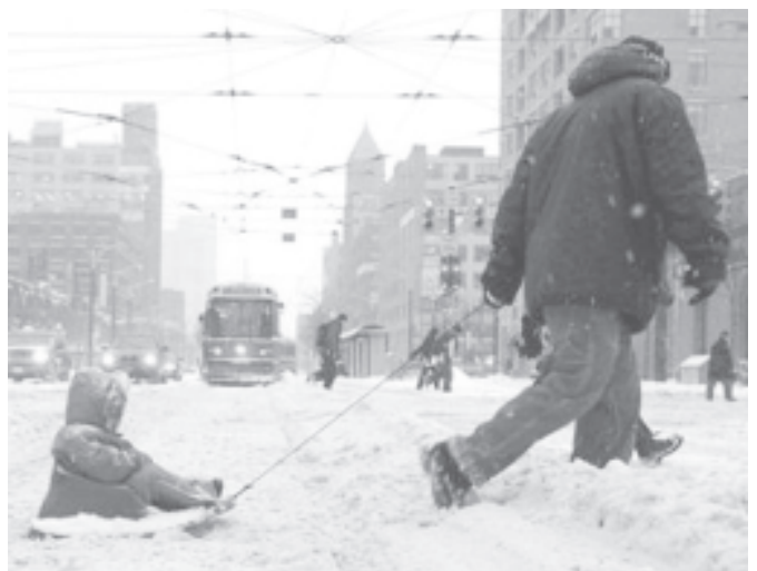
A child is pulled in a sled across a downtown intersection in Toronto on 27 Jan, 2004. Environment Canada says a winter storm over southwestern Ontario Tuesday afternoon will bring more snow, freezing rain and ice pellets to the region.