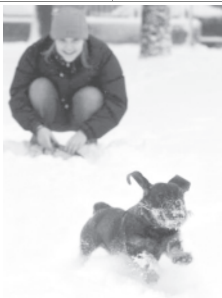
A Belgrade girl enjoys playing in the snow with her puppy in the centre of the Yugoslav capital, on 27 Jan, 2004. A heavy snowfall hit Belgrade for the second time this week, causing serious traffic jams.