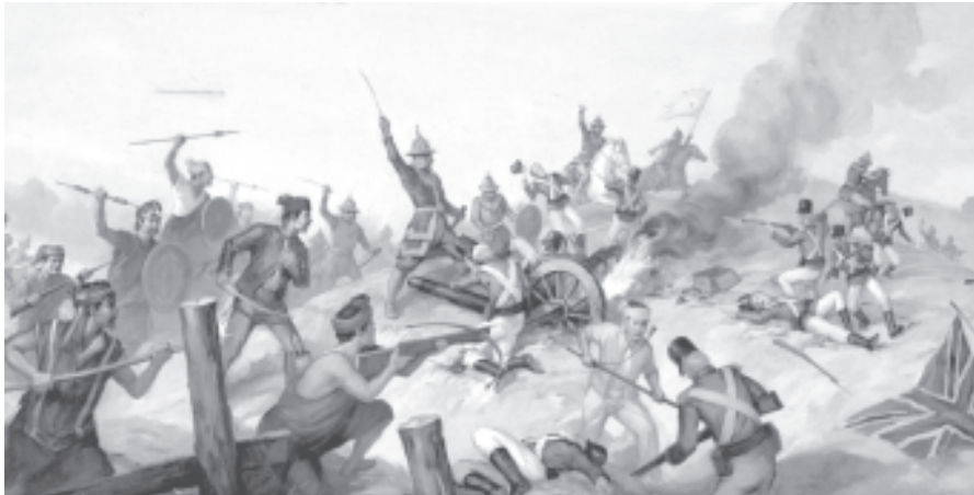
A united force of Myanmar national races gallantly fought against the British imperialists.

trade freely in upper Myanmar. They had strong desire to trade with China by land through Myanmar.