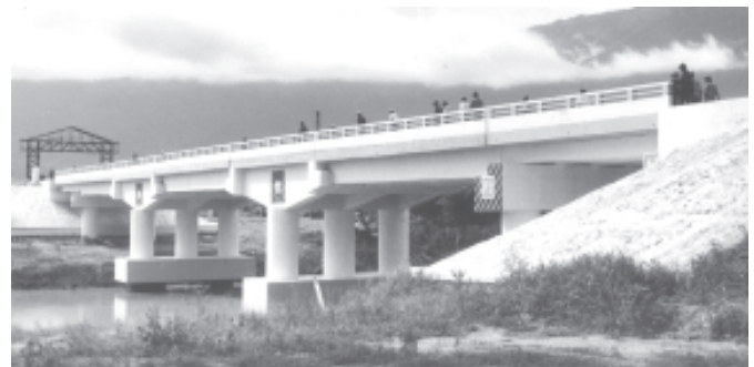
Langkho Bridge, 290 feet long and 24 feet wide, in Daseik, Langkho Township, Shan State (South).