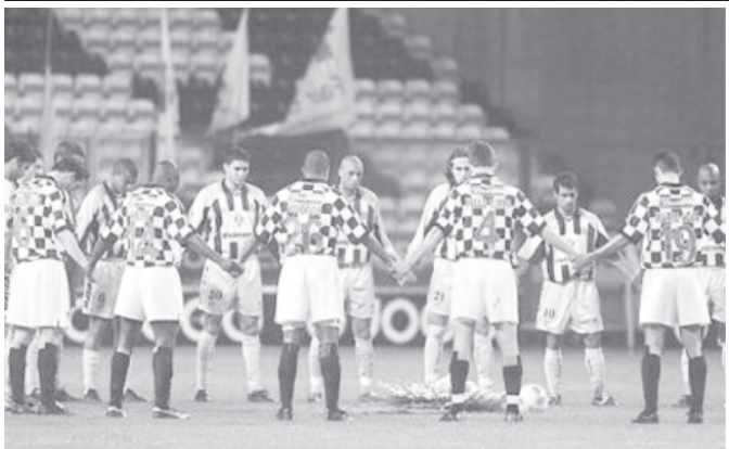
Boavista and Beira-Mar players hold hands during a minute of silence paying tribute to Benfica's player Miklos Feher at the start of a Portuguese league match on 26 Jan 2004 in Oporto. The 24-year-old Hungarian soccer player Feher died Sunday night after apparently suffering a heart attack and collapsing on the pitch during a Portuguese league match in Guimaraes, northern Portugal.

Forlan sealed victory for the 10-times Cup winners in the 68th minute, turning the ball in from close range after Ronaldo's header across the area.—MNA/Reuters