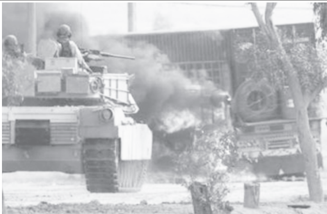
US Army soldiers seal off an area as a truck, and two Humvee vehicles obscured behind it, are afire following an attack on a convoy in the central Iraq town of Khaldiya, on 27 January, 2004.