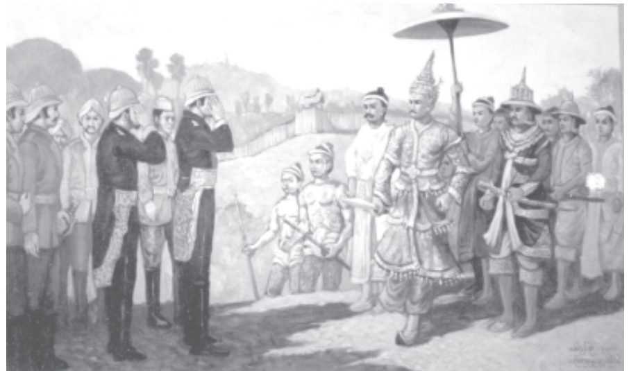
A British military officer salutes Alaungmintayagyi, King of Myanmar, on 23 July 1775 at Hinthada port.

Lord Dalhousie flatly turned down the request of Myanmar diplomatic