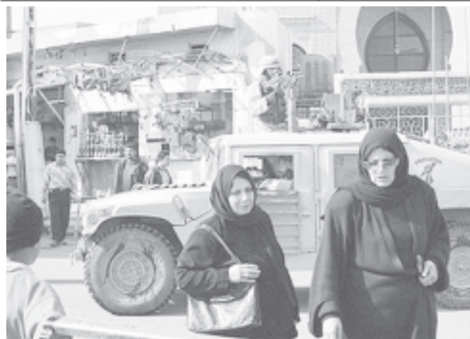
US soldiers ride past Iraqi women during a patrol on Baghdad's Shuad square on 27 January. Two CNN employees were killed when their two-car convoy was attacked.

Zimtrade chief executive Freddy Chawasarira said that a national thrust and appeal was required if Zimbabwe was to strongly compete with other players and make a mark in the export market. "The South African manufactures, for example, work together to make sure that a distribution channel is established in a market," he said. —MNA/Xinhua