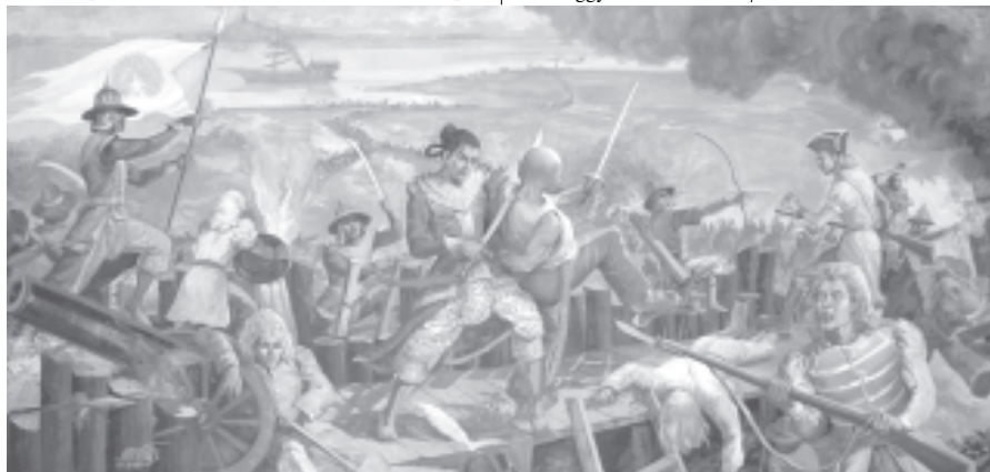
Myanmar heroes bravely attacked the fortress of Ngazinka, the Portuguese, who encroached upon the sovereignty of Myanmar.

King Mindon sent a diplomatic mission including Myanmar ministers accompanying Dor Gormi to France.