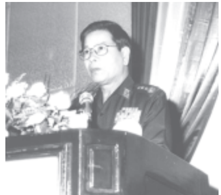
Prime Minister General Khin Nyunt delivers a speech at the opening of 24th Conference of Myanmar Dental Association and joint educational meeting of World Dental Federation (FDI) and MDA.