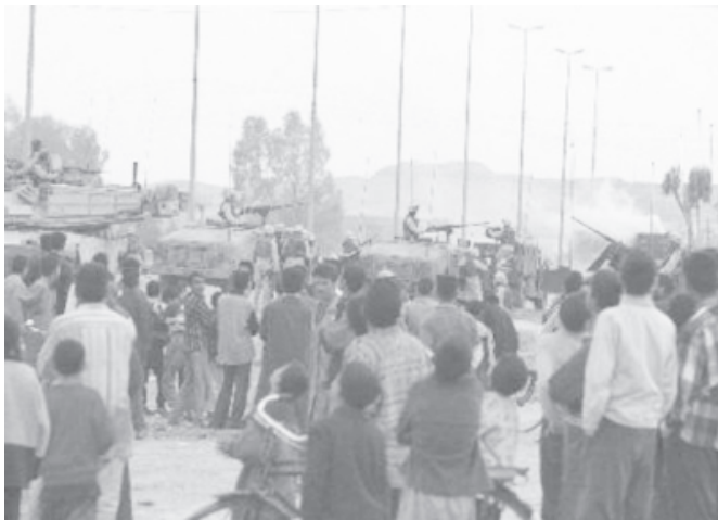
A crowd of Iraqis gather to watch US troops secure the scene of an explosion near Khaldiyyah, Iraq, on Tuesday 27 Jan, 2004

Poland heads a multinational force in south-central Iraq to which it has contributed 2,400 troops based in Karbala, 75 miles south of Baghdad. So far, two Polish soldiers have been killed in Iraq. —Internet