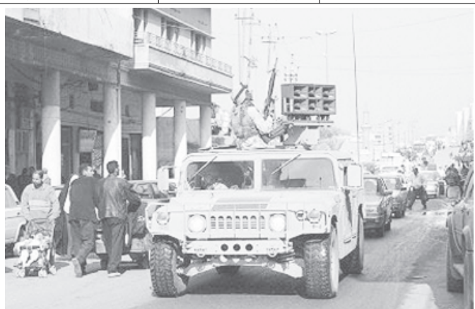
US soldiers drive over Baghdad's Shuhada bridge during a routine patrol of the Iraqi capital on 27 January.