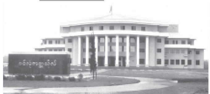
Panglong University which was opened on 11 February 2003.