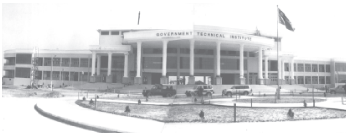
The Government Technical Institute (Myingyan) under construction in Myingyan, Mandalay Division seen on 27 January. (News reported)