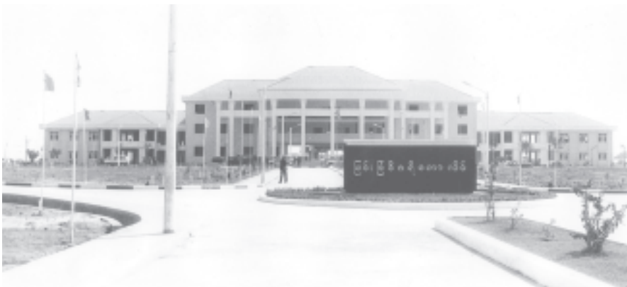
Myingyan Degree College in Myingyan, Mandalay Division. (News reported)