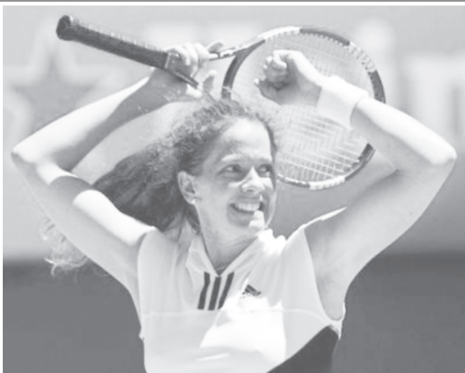
Patty Schnyder of Switzerland raises her arms in celebration after defeating Lisa Raymond of the United States in their quarterfinal match at the Australian Open in Melbourne, Australia, on 28 Jan, 2004. Schnyder won in straight sets 7-6, 6-3.

The federation also opened the doors for the return of Iraq, who was suspended in the late 1980s for not fulfilling the organization of a tournament and for a debt with the Asian Confederation (AVC).—MNA/Xinhua