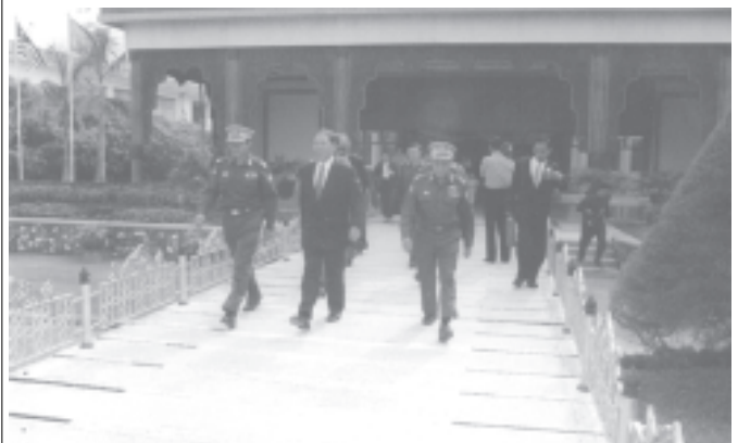
Minister Brig-Gen Lun Thi and party being seen off at the airport. — ENERGY