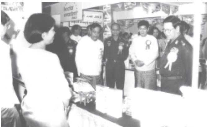
Prime Minister General Khin Nyunt views dental medicines and equipment at the opening ceremony. — MNA

The Prime Minister inspected showrooms of dental medicines and equipment companies. — MNA