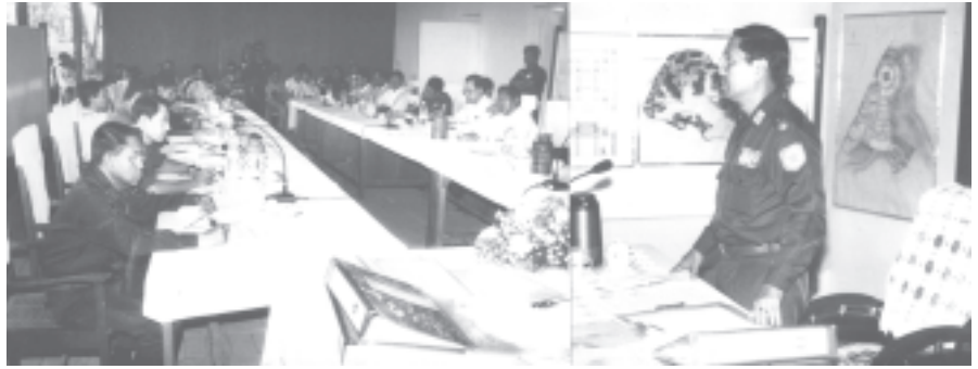
Commander Maj-Gen Myint Swe delivers an address at the meeting.

Vice-Mayor Col Maung Pa later presented reports on progress of earth work, construction of island-crossing bridges and car parking lots at Relaxation Zone. Deputy Minister for Hotels and Tourism Brig-Gen Aye Myint Kyu also reported on construction of modern restaurants in the park, Deputy Minister for Energy Brig-Gen Than Htay on assistance to be rendered by the ministry to the modern-