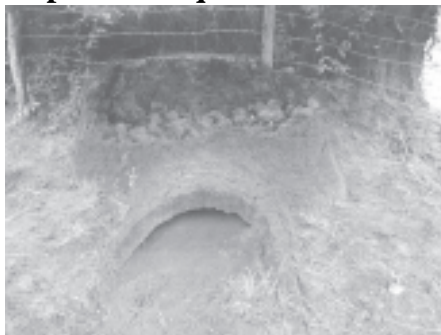
The ancient iron smelting furnace.

On 25 January, he attended the ground-breaking ceremony for renovating the Yazamuni Pagoda at Wayongon village. In the afternoon, he went to Hanlin ancient city of BC 11th century and inspected the city gate and buildings at Nos 9 and 10 mounds. He also inspected the Hanlin stone inscription shed and gave instructions on preserving Pyu stone slabs and inscriptions. On 26 January, he went to Nyaungkan village of Budalin Township and inspected bones, pots and utensils of Bronze Age. He paid respects to Thaphanywa Sayadaw U