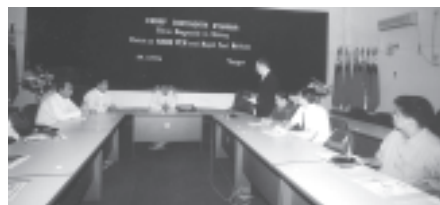
Presentation of virus diagnostic in shrimp in progress. — MNA

Saw Mon Nyin presented tasks on "Preserve traditional culture by wearing modest costumes". Next, the vice-president and members viewed variety of dances, and demonstration of painting skills. — MNA