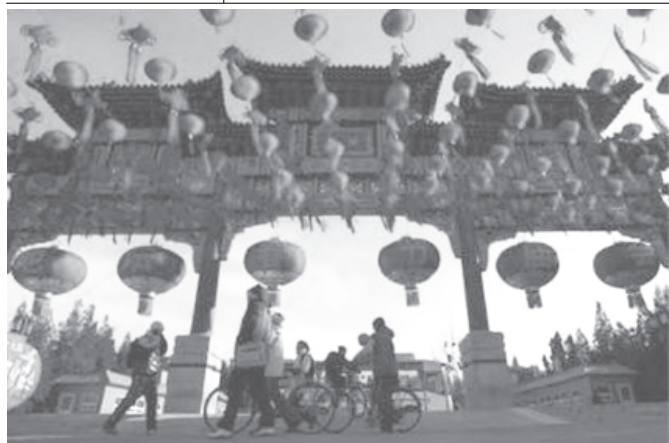
Chinese students pass a traditional gateway decorated with lanterns to celebrate the upcoming Lunar New Year in Beijing, on 20 January, 2004. Residents in China's capital flock to temple fairs during the New Year of the Monkey which starts on 22 January to enjoy performances of martial arts, acrobatics, folk dances and fashion shows.

The best time to plant a tree was 20 years ago. Second best time is now.