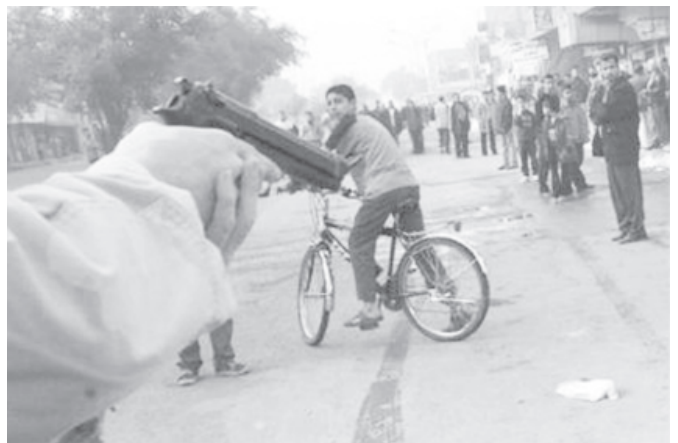
A US Army soldier holds his pistol ready while checking vehicles after a blast outside the headquarters of the US led administration in Baghdad on January 18, 2004. Iraq's precarious security situation was highlighted by the suicide bomb blast on Sunday at the gates of the US-led administration which killed at least 20 people. Picture taken on 18 January.