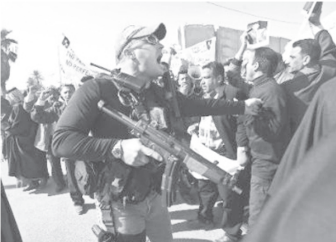
An armed American security officer shouts and pushes back a crowd of Iraqi men who marched near the Iraqi Governing Council headquarters in Baghdad on Monday 19 Jan, 2004 calling for security in Baghdad. Several dozen marched calling for security.