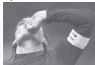
AS Roma's captain Francesco Totti celebrates after scoring the second goal for his team against Sampdoria Genoa, during their Italian Serie A soccer match at the Olympic Stadium in Rome. Roma won 3-1.

In the second half Sampdoria piled on the pressure but it was the home side that took the lead in the 61st minute when Totti headed a Mancini cross past keeper Francesco Antonioli after a perfectly-timed run to the far post.