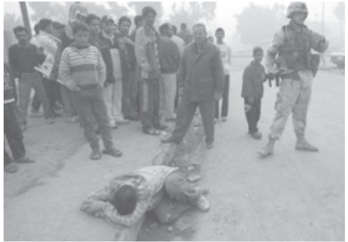
An Iraqi survivor lies crying on the curbside at the scene of a car bomb which exploded in Baghdad, Iraq outside the main gate to the headquarters of the US-led coalition on Sunday, 18 Jan, 2004.