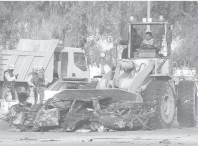
Iraqis use a bulldozer to remove destroyed cars from the scene of a car bomb which exploded outside the main gate to the headquarters of the US-led coalition in Baghdad, on Sunday, 18 Jan, 2004 killing nearly 20 and injuring more than 60.