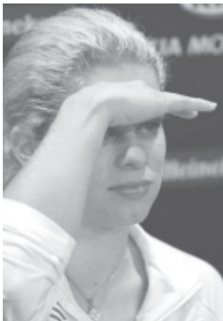
Belgium's Kim Clijsters looks up into the light during a news conference in Melbourne, Australia, on Sunday, 18 Jan, 2004, for the Australian Open tennis championships starting on Monday, 19 Jan.