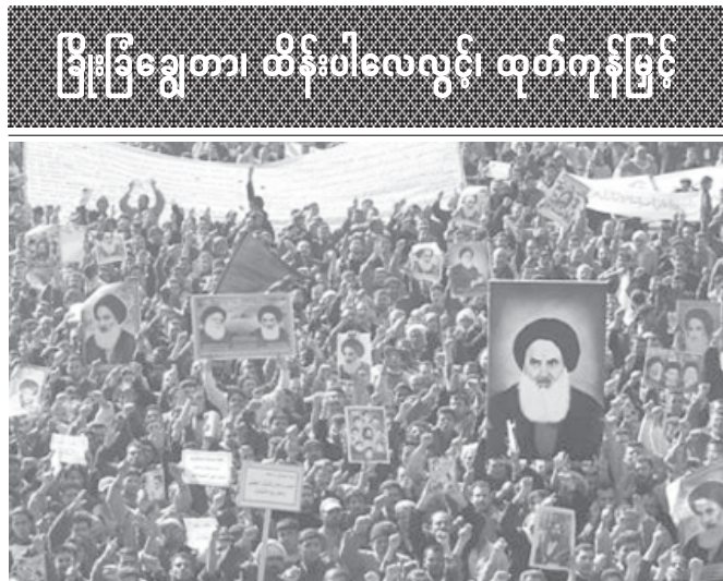
Tens of thousands of Shiite Muslims march in Baghdad carrying portraits of Grand Ayatollah Ali al-Husseini al-Sistani and other Shiite clerics on Monday, 19 Jan, 2004. The crowd marched peacefully to demand an elected government, as US and Iraqi officials prepared to seek the UN secretary-general's endorsement of American plans for transferring power in Iraq.

The private Bul Ins holds the biggest share in the Balkan country's car insurance market.