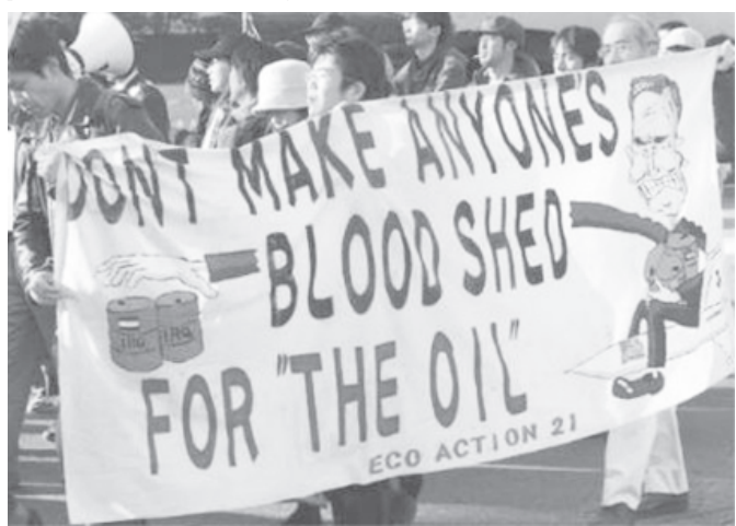
Japanese protesters hold a banner during an anti-war protest in front of Japan's Self-Defence Forces' drill site in Asaka, northwest of Tokyo, on 18 January, 2004.