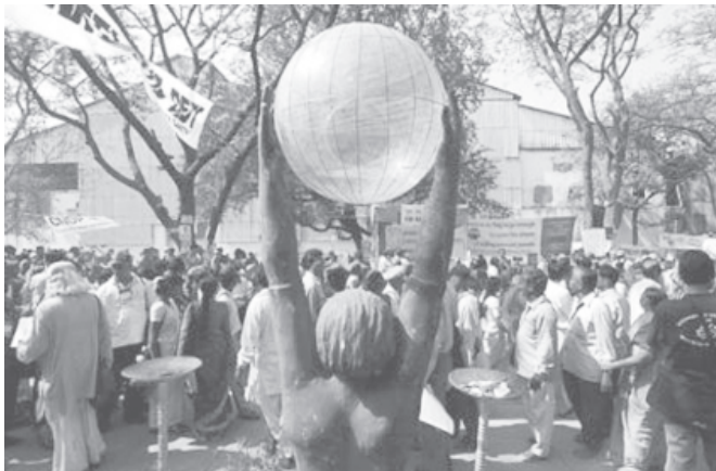
A statue of a child holding the world stands as delegates move around at the World Social Forum in Mumbai, India, on 18 Jan, 2004. After protests against unfair global trade, big business and foreign debt, the third day of the annual anti-globalization and anti-war protest was packed with seminars and conferences seeking to link peace movements across the world.