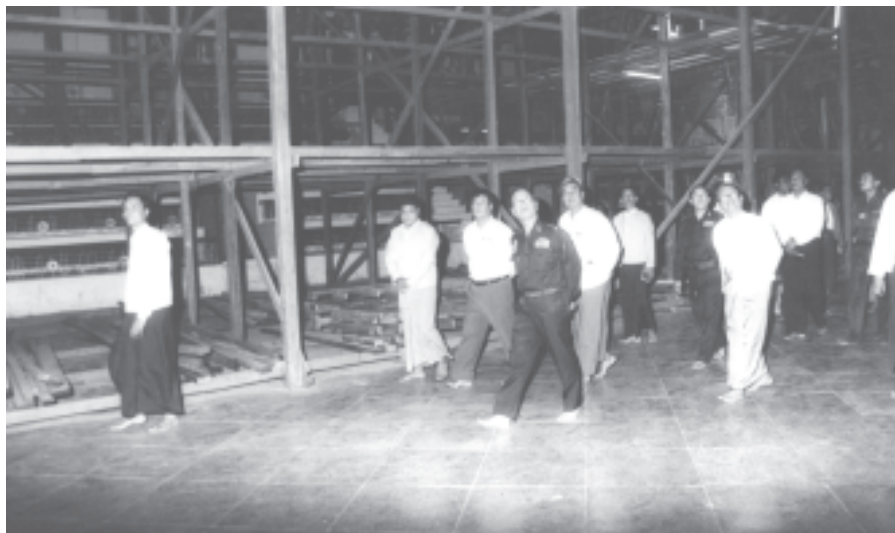
Prime Minister General Khin Nyunt inspects the major renovation works at the Maha Pasana Cave on Kaba Aye Hill in Yangon on 18-1-2004. (News reported).