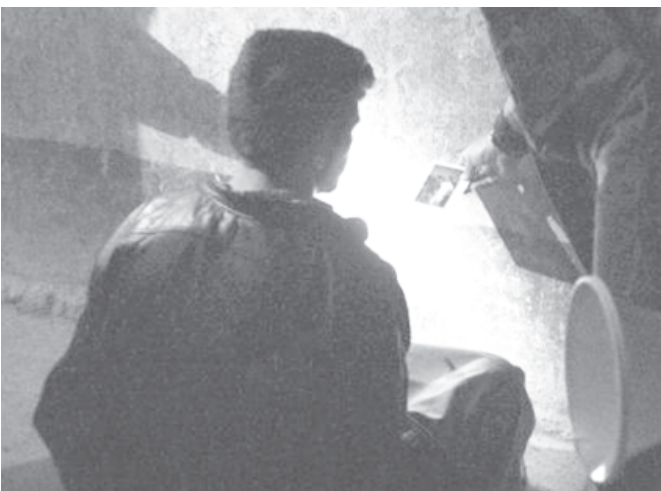
While being questioned about the whereabouts of his brother who is suspected of attacks on coalition forces, an Iraqi man is asked to identify subjects in a photograph during a raid on his house by the 82nd Airborne Division on Sunday, 18 Jan, 2004 near Fallujah, Iraq.

US Army paratroopers of the 101st Airborne division's 3rd Brigade 'Rakkasans' drive south to the Kuwaiti border point of Safwan on 19 January, 2004 after their deployment to northern Iraq ended.