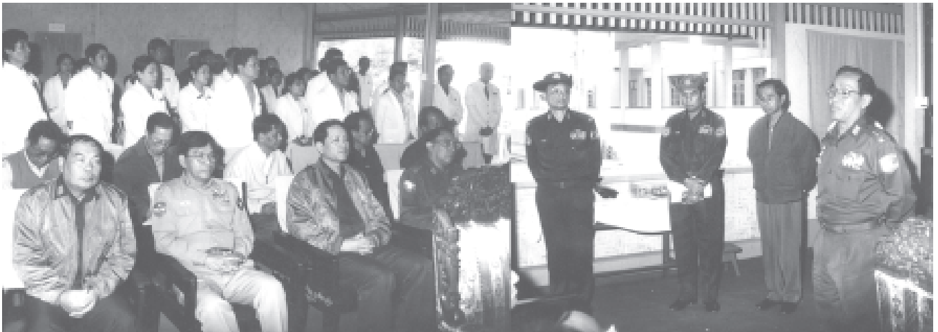
Secretary-1 Lt-Gen Soe Win holds a meeting with the officials at Kale District General Hospital on 17-1-2004.