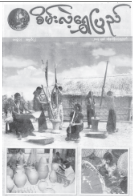
The volume 1 No 2 of Seinle Shwepyí Journal.

(Sea Gypsy Festival) Ma Kyone Galet Village, Myeik Archipelago Union of Myanmar 14 to 17 February 2004