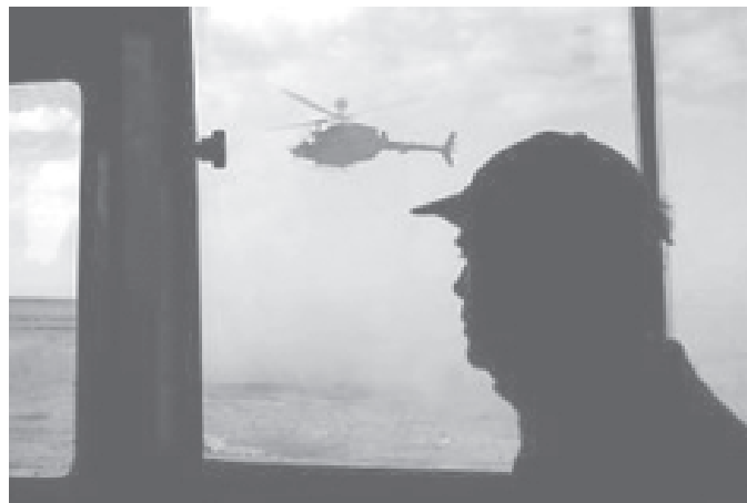
A foreign journalist looks at a US helicopter hovering at a low altitude on the way to the Iraqi-Saudi border point of Arar, some 350 kms southwest of Baghdad.