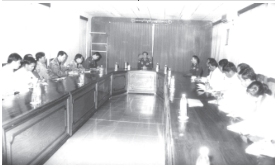
State Peace and Development Council Secretary-1 Lt-Gen Soe Win meets USDA members of Kalay and Kalaywa townships on 18-1-2004. (News reported)