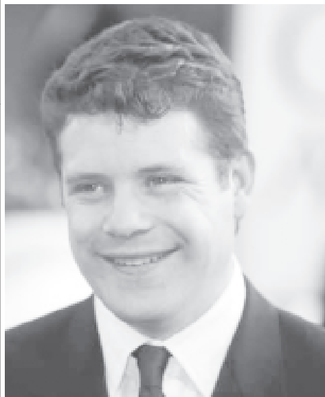
Sean Astin has become an in-demand actor and the subject of Oscar talk for his work in 'The Lord of the Rings: The Return of the King.' Astin says he doesn't want to be seen as 'shilling for awards' but realizes his career is at 'kind of a make-it-or-break-it moment.' Astin is seen arriving for the 60th annual Golden Globe Awards in Beverly Hills, Calif., on 19 Jan., 2004.

In other PGA awards, "Six Feet Under" was named best TV dramatic series, "Sex and the City" the best comedy series, "My House in Umbria" best TV movie or mini-series and "Queer Eye for the Straight Guy" best reality or game show series. — MNA/Reuters