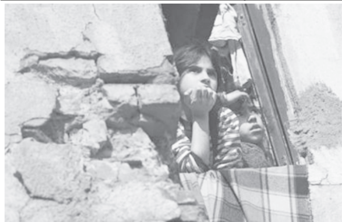
Two Iraqi children look out from a bomb shattered window and apartment wall down to the scene below on Monday, 19 Jan, 2004, where a car bomb exploded the day before outside the main gate to the headquarters of the US-led coalition in Baghdad killing at least 20 and injuring more than 60. US troops restricted access to the area on Monday as they re fortified the entrance and checkpoints around the headquarters. —INTERNET

Wen asked the State Bureau of Foreign Experts Affairs to be a conduit to higher offices in order to relay complaints and advice from those veteran experts. —MNA/Xinhua