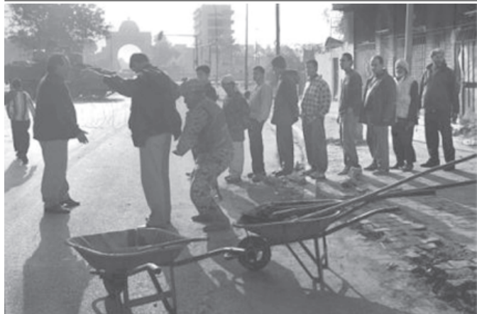
Iraqi workers are checked by an Iraqi soldier on Monday 19 Jan, 2004 before entering the area where a car bomb exploded Sunday outside the headquarters of the US-led coalition in Baghdad, killing 24 and injuring more than 60. US troops restricted access to the area, moving back the checkpoints several hundred metres, as they re fortified the entrance around the headquarters.