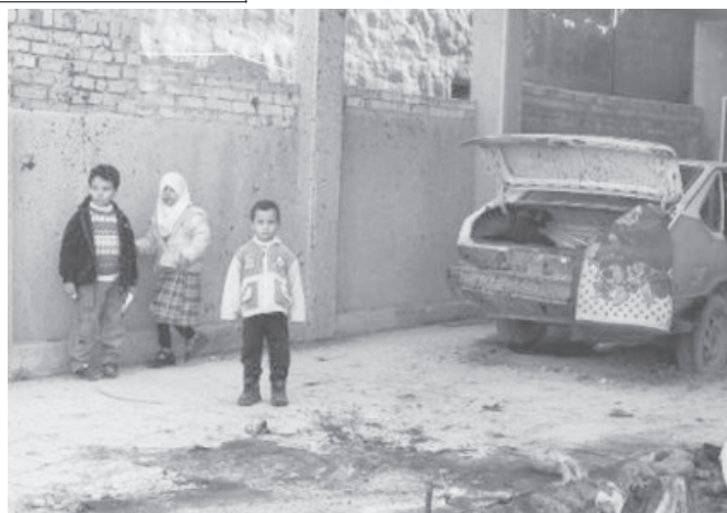
Children of three Arab fighters stand in the yard of the house where the fighters were killed by US troops in Al-Moaleem district near Baghdad, Iraq, on 19 Jan, 2004.