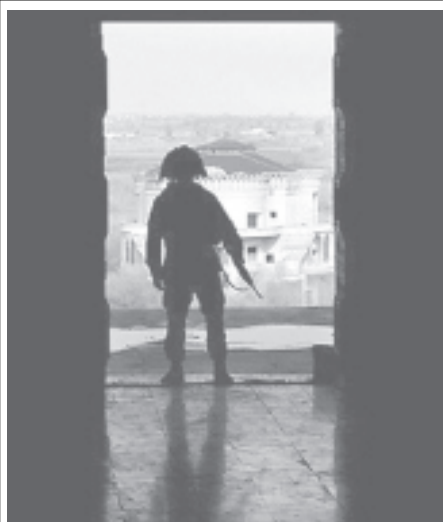
A US soldier from the 4th Infantry Division's 1st Battalion, 22nd Regiment leaves his base in former Iraqi President Saddam Hussein's hometown of Tikrit, some 180 kilometres north of the Iraqi capital Baghdad.