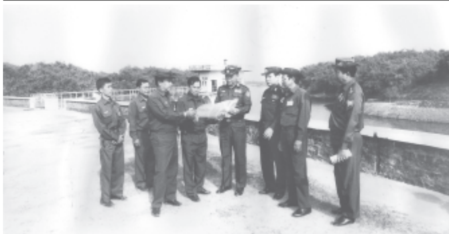
Mayor Brig-Gen Aung Thein Lin hears a report presented by officials on the Ngamoeyeik Water Supply Project in Hlegu Township. — YCDC

Divers were trying to find more bodies in the canal, they said. Three people with minor injuries were treated at a local hospital, said Mukhtar Hassan, medical superintendent of the hospital in Bhakkar that lies 200 miles southwest of the capital Islamabad. — MNA/Reuters