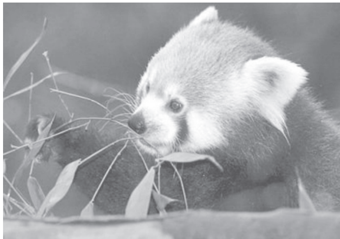
Red Panda 'Xia-Tschung-Mao' feeds on bamboo in its new enclosure in the zoo in Duisburg, western Germany, on 9 Jan, 2004. The red panda is a smaller relative of the Giant Panda. Xia Tschung Mao was born in Rotterdam. The extremely endangered species is a smaller relative of the Giant Panda.