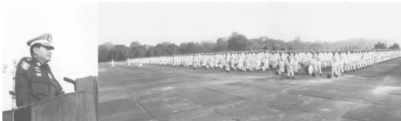
Lt-Gen Kyaw Win addresses the opening of 59th Anniversary Armed Forces Day Commemorative Military Bands Competition. — MNA

Altogether 51 bands from the Commander-in-Chief (Navy)'s Office, the Commander-in-Chief (Air)'s Office, military commands, Light Infantry Divisions and military training schools are taking part in the contest. — MNA