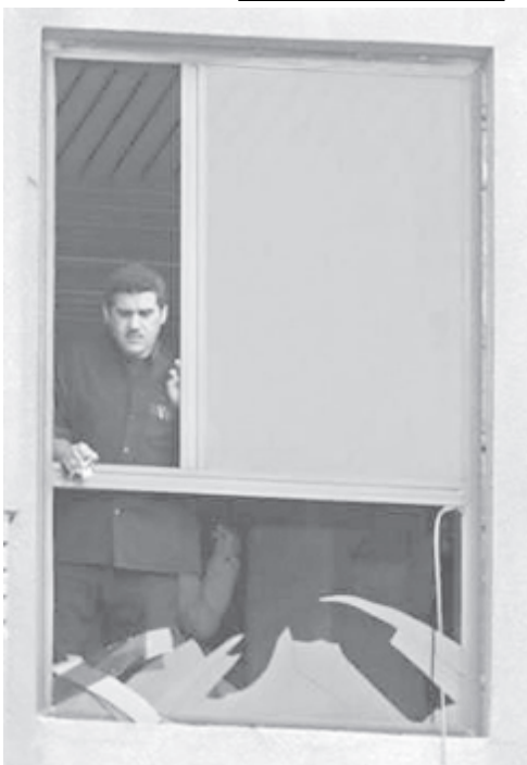
A man looks out a window at Baghdad's Burj al-Hayat hotel following a rocket propelled grenade attack on 9 January, 2004. Guerillas fired grenades on early Friday at the central Baghdad hotel used mainly by foreign businessmen, but there were no casualties, witnesses said.