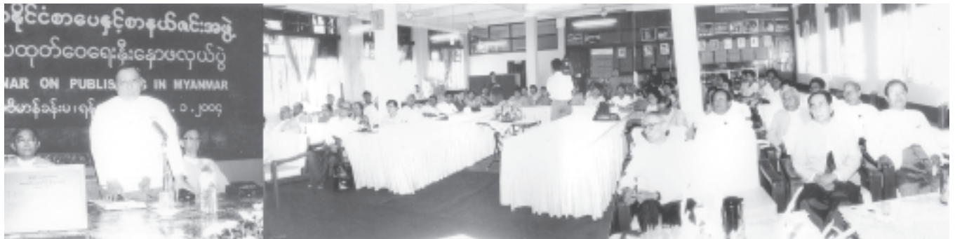
MWJA Vice-Chairman U Tin Kha (Tekkatho Tin Kha) makes a speech at the second day session of Seminar on Publishing in Myanmar. — MNA

At the dam, officials reported on progress of work and future plans. YCDC member Col Tin Soe gave an account on supply of additional 90 million gallons of water to Yangon City and its outskirts and new towns on completion of the project. The mayor dealt with earlier completion of the project and inspected the project site. — MNA