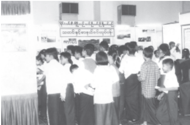
Students visiting the 56th Anniversary Independence Day Commemorative Exhibition.