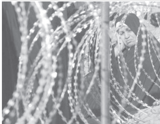
The mother of an Iraqi prisoner waits for news of him outside the US run penitentiary at the Baghdad suburb of Abu Ghraib on 9 Jan, 2004.

June 30 - An explosion beside a mosque in Falluja kills nine Iraqis, including an imam.