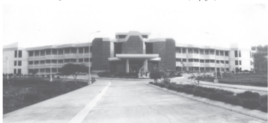
Kengtung Degree College in Shan State (East).