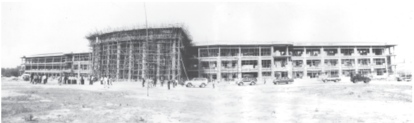
Kengtung Government Technological College Project being implemented in Shan State (East) (News on page 16). — MNA

(Translation: TMT + MS) (Kyemon: 9-1-2004)