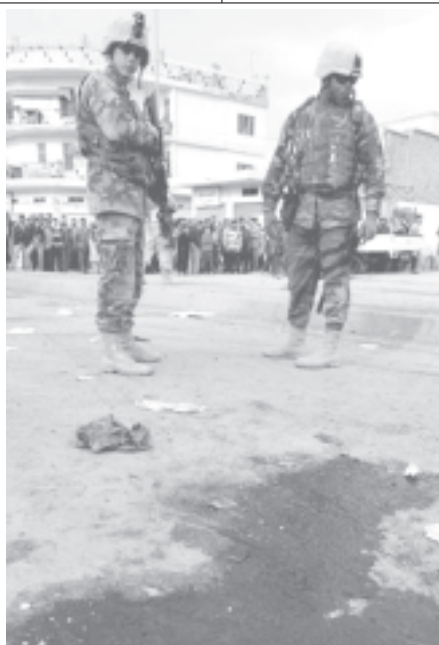
US Army troops secure the area outside a building near a blood stain in Baquba after a blast on 9 Jan, 2004.