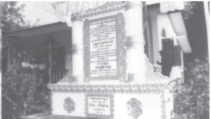
Prime Minister General Khin Nyunt presses the button to unveil the stone inscription of Ziwapala Clinic in Kwanmoe Dain Model Village, Kayan Township. (News on page 1)