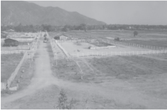
Minister Maj-Gen Hla Myint Swe inspects land allotment in Kale Industrial Zone. — TRANSPORT

Later, the minister arrived at Bagan-Nyaung U Airport and attended the ceremony to pave the 4-inch thick tarred runway. After the ceremony, the minister inspected the machinery to be used in upgrading the airport. — MNA