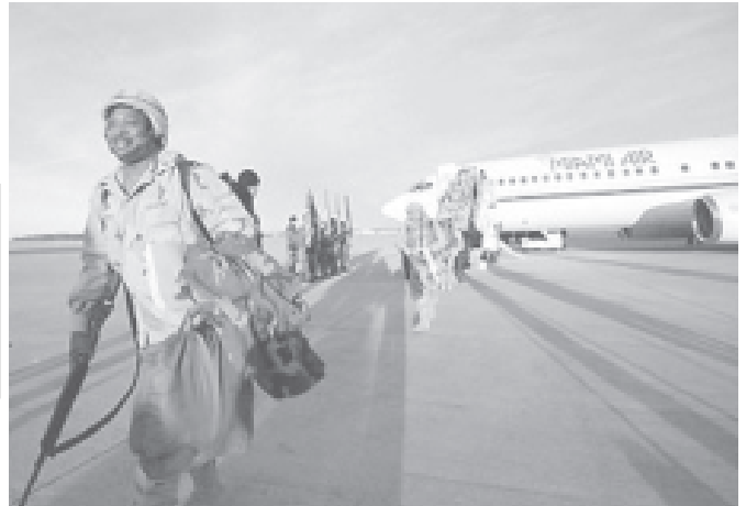
Soldiers of the 101st Airborne Division arrive home at Ft Campbell, Kentucky Ft Campbell has suffered more casualties than any other Army post to date, having lost 59 soldiers in Iraq.