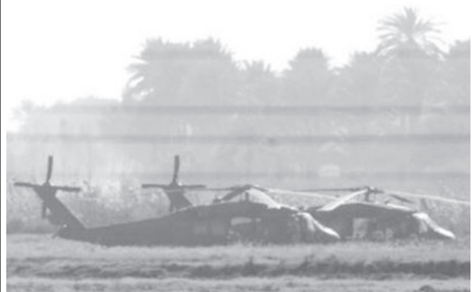
Two US Army Black Hawk helicopters are pictured near the crash site on 9 January, 2004 of the Black Hawk which crashed on 8 January. The helicopter came down during a routine mission near Fallujah, killing nine US soldiers.