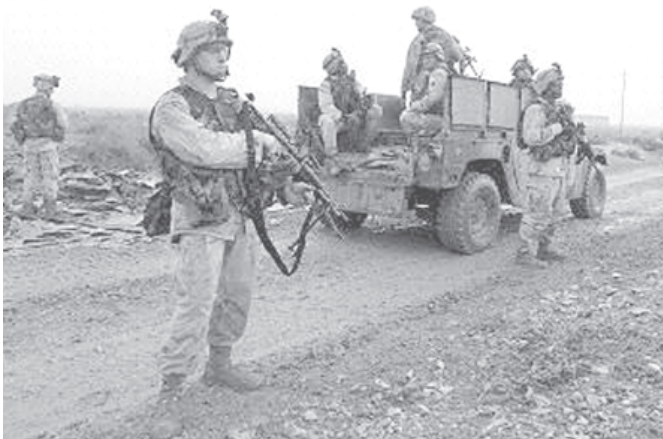
US troops carry out a weapons search. A 400-strong US military team that has been searching for illicit weapons in Iraq has been withdrawn after finding nothing of substance, although a separate group looking for weapons of mass destruction still remains in the country. — INTERNET

Later, a US military cargo plane was forced to return to Baghdad shortly after takeoff after one of its engines was hit by fire. None of the 63 passengers aboard the C-5 aircraft was hurt. — Internet