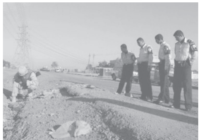
Iraqi police officers watch a US soldier inspect a spot where an explosive device went off in Baghdad on Friday 9 Jan 2004. Two Iraqi civilians were injured in the blast.