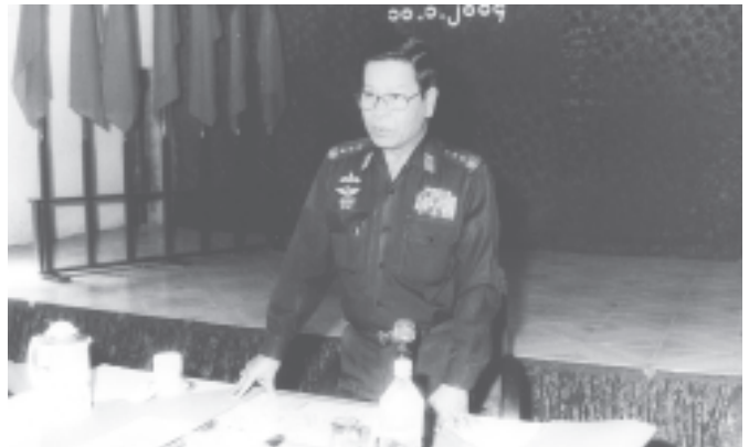
Prime Minister General Khin Nyunt holds a meeting with local authorities, departmental personnel and members of social organizations at Byamaso Hall in Kayan Township.