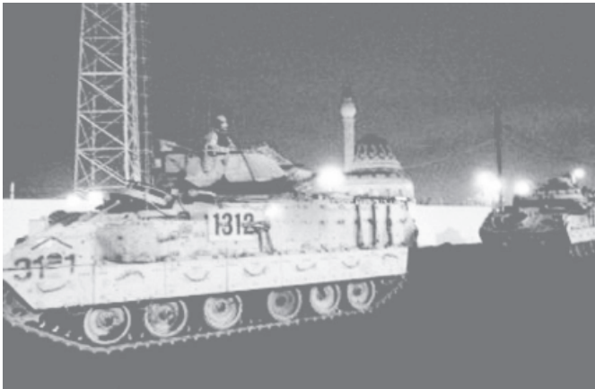
A US Army tank secures a street during a series of night raids, in Tikrit, Iraq on early Friday, 9 Jan, 2004. US forces in Tikrit detained 30 Iraqis, including a dozen suspected insurgents, in one of the biggest raids since the end of the American-led war to oust Saddam Hussein.