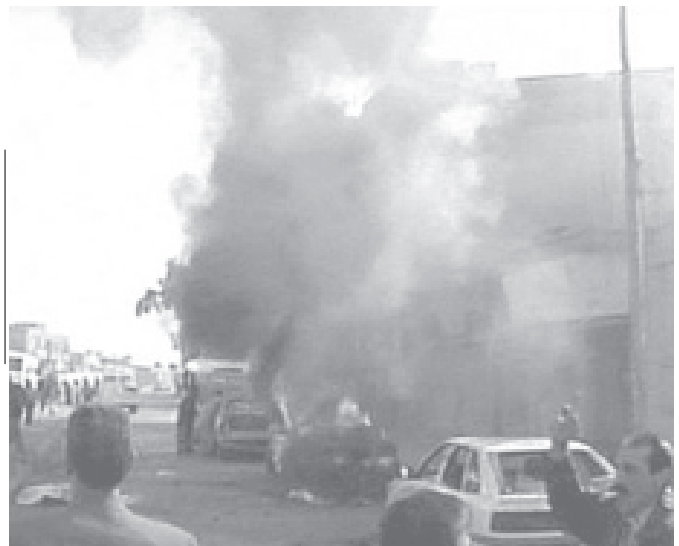
Smoke rises from a burning car after an explosion in Baqouba, Iraq, on 9 Jan, 2004.