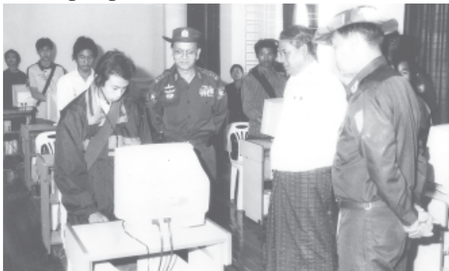
Secretary-2 Lt-Gen Thein Sein and party view the study of the students at Kengtung Degree College in Shan State (East).

Engineer-in-charge U Win Tin of Naungton Construction Co Ltd reported on progress of work of the main lecture hall of the college and tasks to be undertaken.