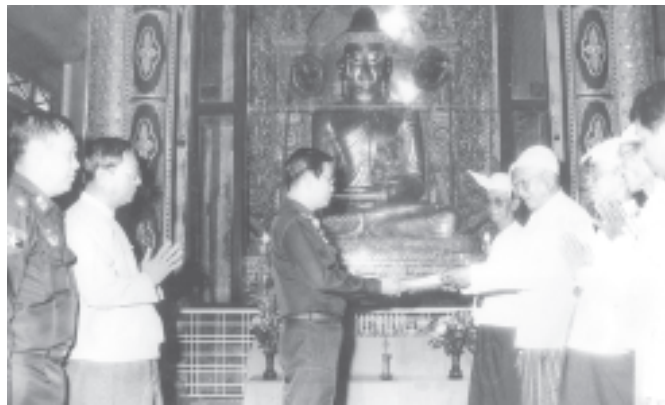
Prime Minister General Khin Nyunt donates cash to the fund of Sakkja Marazin Bronze Buddha Image through the pagoda board of trustees.