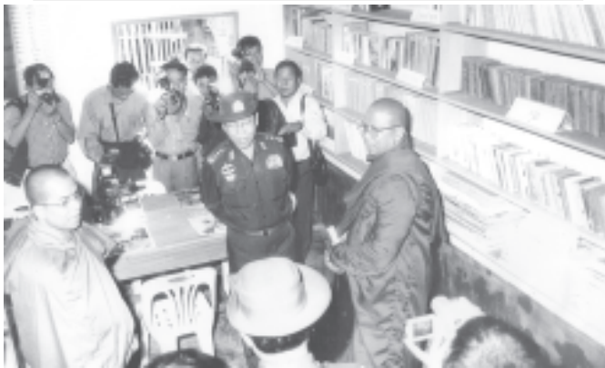
Prime Minister General Khin Nyunt visits Dhammapala Library in Kwanmoe Dain Model Village, Kayan Township.