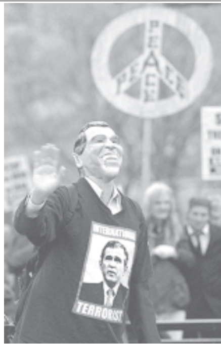
A protester wearing a US President George W. Bush vampire mask waves to traffic during a 2003 protest against the war in Iraq.

A total of 35 soldiers were wounded in Wednesday's attack at Logistical Base Seitz, located west of Baghdad.