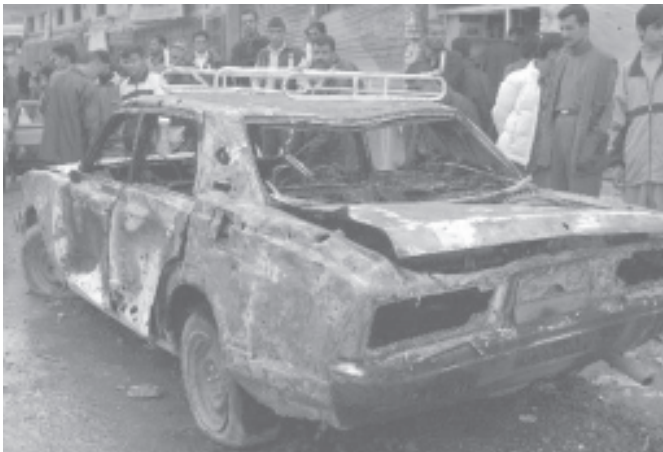
People stand around a car destroyed in an explosion on a busy street on Friday 9 Jan, 2004, in Baqouba, Iraq.