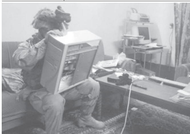
A US Army soldier removes the hard disk of a computer inside an Iraqi house following a series of night raids, in Tikrit, Iraq, on early Friday, on 9 Jan, 2004.