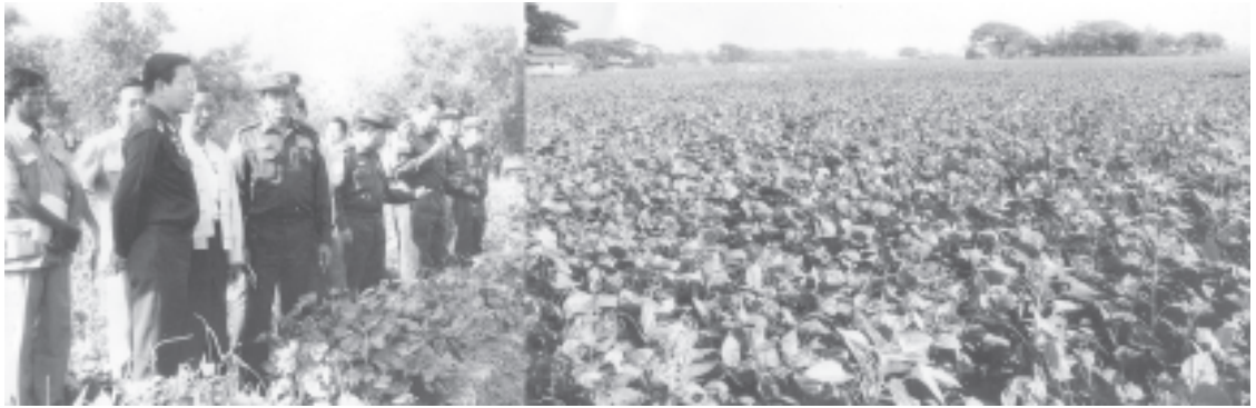
Prime Minister General Khin Nyunt and party inspect green gram plantations along Thanlyin-Kayan Road.(News on page 1)