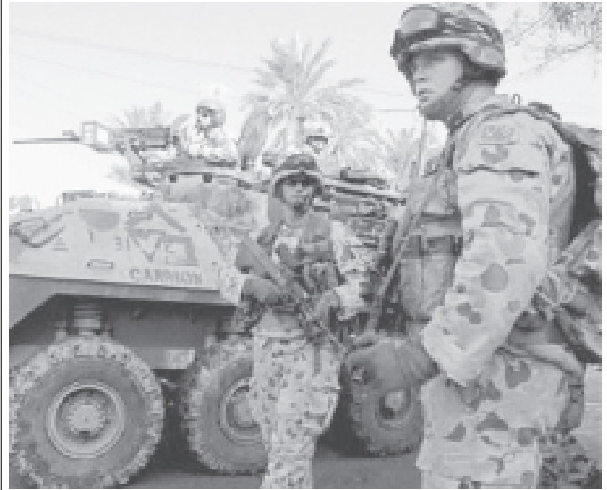
Australian troops guard their country's embassy in Baghdad recently.