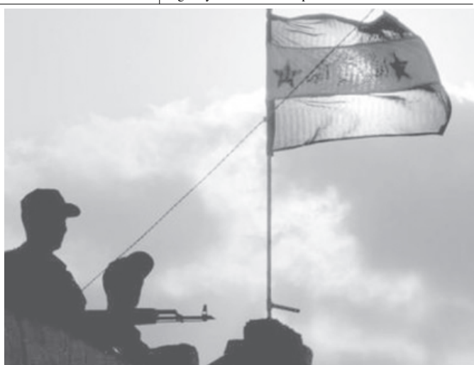
Iraqi Civil Defence Corps soldiers stand guard at a checkpoint next to an Iraqi flag in the northern Iraq city of Mosul, some 400 km northwest of Baghdad, on 7 January, 2004. — INTERNET

The downturn comes despite increased traffic along the desert road. —Internet