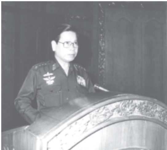
Prime Minister General Khin Nyunt delivers a speech at the ceremony to honour academics who got doctorate degrees from the universities under Ministry of Education, Ministry of Health, and Ministry of Science and Technology.