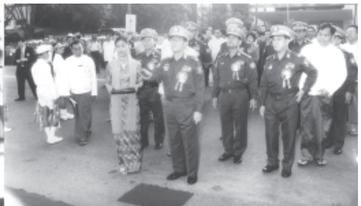
Secretary-1 Lt-Gen Soe Win formally unveils the signboard of Myanmar Rice Milling Industry Fair-2004.