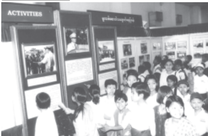
Students at the booth of the Central Committee for Drugs Abuse Control. — MNA

In the same year, the Chinese Government wrote its online game software development plan into its "863 High-Tech Programme". —MNA/Xinhua