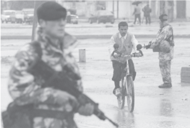
An Iraqi passes on his bicycle between two British soldiers from the 1st Battalion of the Light Infantry Division as they patrol the outskirts of Iraq's second-largest city of Basra, 550kms south of the capital Baghdad, on 7 Jan, 2004.