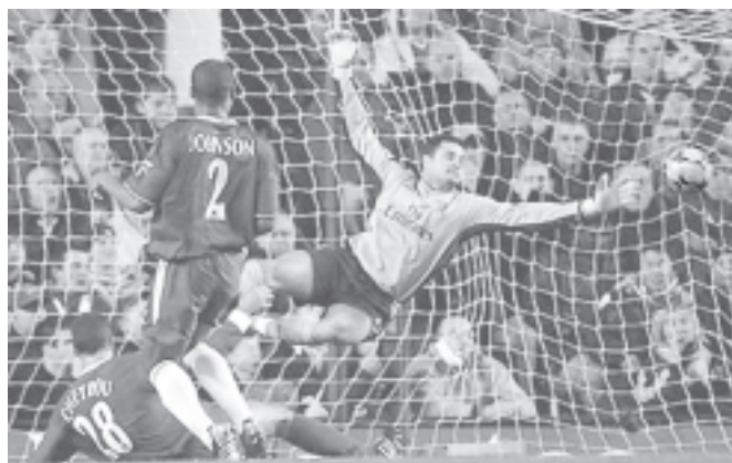
Chelsea's Glen Johnson (C) watches as Liverpool's Bruno Cheyrou scores against Chelsea's keeper Carlo Cudicini (R) during their premiership match at Stamford Bridge.

LONDON, 8 Jan—Manchester United beat Bolton Wanderers 2-1 to go three points clear in the Premier League on Wednesday as Arsenal were held 1-1 at Everton and Chelsea slumped to a surprise 1-0 home defeat by Liverpool.