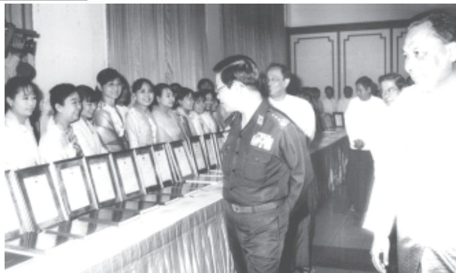
Prime Minister General Khin Nyunt views doctoral theses of the doctorate degree holders. — MNA