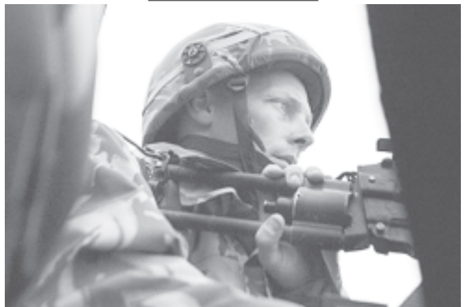
A British soldier from 1st Battalion of the Light Infantry Division takes position inside a military vehicle during a patrol in the outskirts of Iraq's second-largest city of Basra recently.