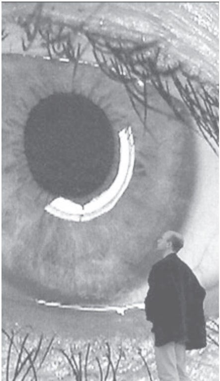
A man studies a large video image of an eye. A blind 15-month-old Pakistani baby boy got the gift of vision from a deceased Indian woman whose eye was transplanted after a complicated surgery at a hospital in Madras city, doctors said.