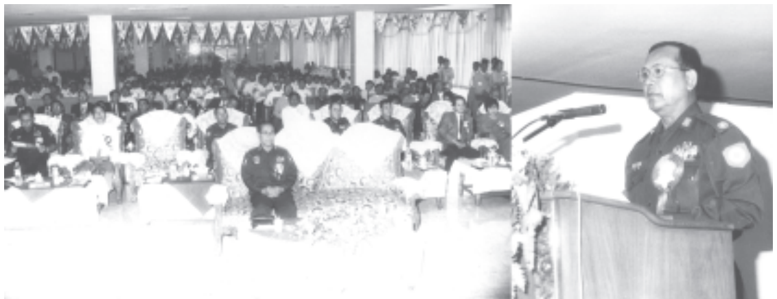
Secretary-1 Lt-Gen Soe Win attends the opening of Myanmar Rice Milling Industry Fair-2004 and Minister Brig-Gen Pyi Sone delivers a speech.

Next, the minister and party went to Taungdwingyi Main Power Substation that will distribute the electricity sent by Paunglaung Hydel Power Station. At the substation, the minister