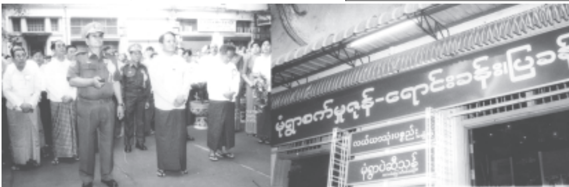
Minister Maj-Gen Hla Myint Swe presses the button to unveil the signboard of Monywa Industrial Zone (Yangon) showroom. — MNA

Available at the showroom are automobiles assembled at Monywa Industrial Zone, various kinds of farm implements and machinery, groundnut oil, bean vermicelli, noodle, blankets, textiles, Aye Nyein Thida traditional medicines, finished wooden furniture and battery lead-acid accumulators. — MNA