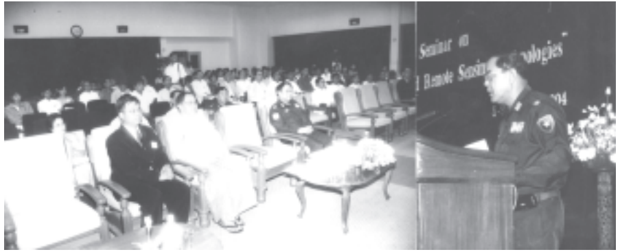
Minister Brig-Gen Thein Zaw addresses the opening of paper reading session on GIS and Remote Sensing Technologies Seminar.