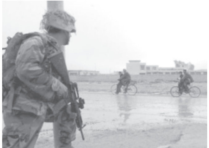
A US Army soldier, of the 1st Battalion, 22nd Infantry Regiment of the 4th Infantry Division looks at Iraqi people, during a foot patrol in Tikrit, Iraq, in this Saturday, 3 Jan, 2004 file photo.