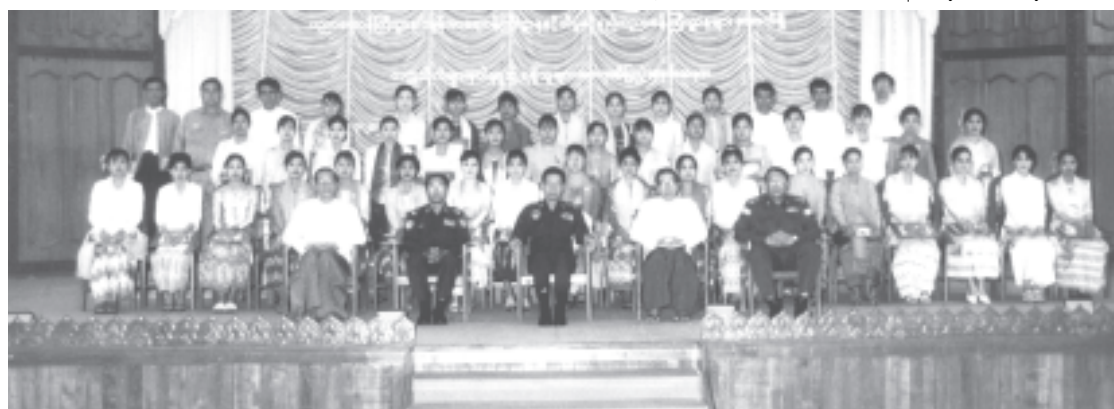
Prime Minister General Khin Nyunt poses for documentary photo together with academics who got doctorate degrees from universities under Ministry of Science & Technology.