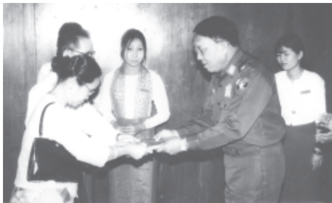
Deputy Minister Brig-Gen Aung Thein accepts donations of books from wellwishers. MNA

Altogether 21 teachers and 41 ninth and eighth graders took part in the contests. — MNA