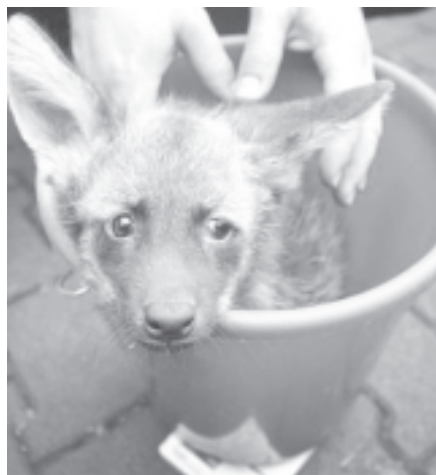
Jefa, a Maned Wolf ( Chrysocyon brachyurus) cub sits in a bucket while being weighed at the zoo in Frankfurt, Germany, on 7 Jan, 2004. Quadruplets of the species originally living in South America were born in Frankfurt on 20 Nov, 2003.