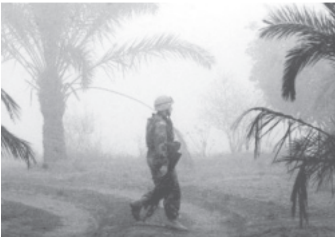
A US Army soldier of the task force Iron Horse walks on a foggy morning in Tikrit, Iraq, on 7 Jan, 2004. Sniper attacks and driveby shootings are the new hit-and-run tactics confronting the US occupiers of Saddam Hussein's birthplace, punctuating an eerie calm that has settled on this tense town since the former Iraqi's President's capture.