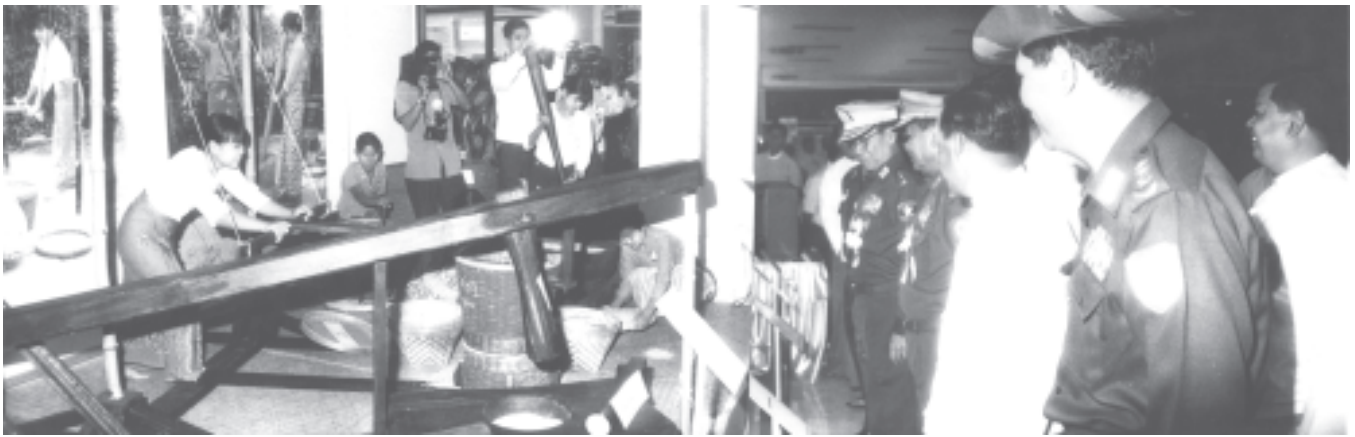
Secretary-1 Lt-Gen Soe Win views a booth at the Myanmar Rice Milling Industry Fair-2004.