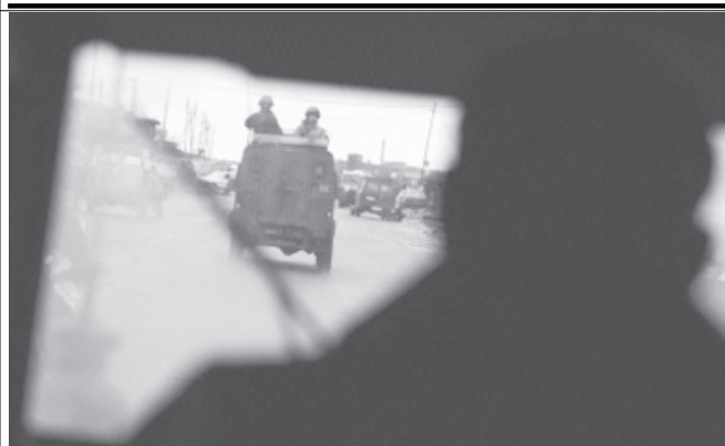
British soldiers from the 1st Battalion of the Light Infantry Division patrol in the outskirts of Iraq's second-largest city of Basra, 550kms south of the capital Baghdad recently.