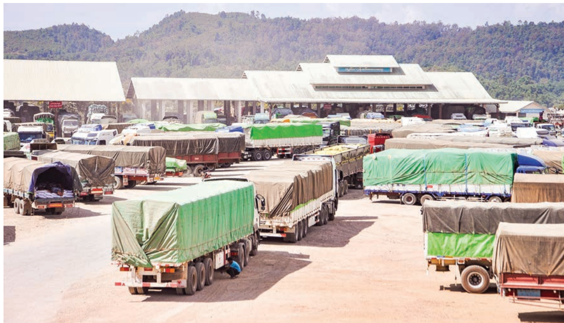
Trucks seen at 105-mile trade zone Muse, northern Shan State.

Myanmar exports rice, sugar, pulses, sesame seeds, corn, dried tea leaves, fishery products, minerals, and animal products to China, while it imports agricultural machinery, electrical appliances, iron and steel-related materials, raw industrial goods, and consumer goods from the neighboring country. — GNLM (Translated by EMM)