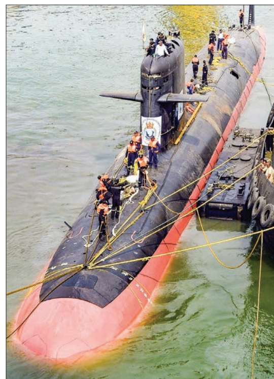
FILE PHOTO: The Scorpene submarine 'Kalvari' is escorted by tugboats as it cruises into the Naval Dockyard in Mumbai on October 29, 2015.

"Eighteen (Conventional) plus six SSN (nuclear-powered attack) submarines are planned but the existing strength is 15 and 1 SSN is available on lease," the Standing Committee on Defence said in its report tabled in the winter session of Parliament. The Indian Navy had planned to build six nuclear attack submarines along with the Arihant Class SSBNs which are nuclear-powered submarines equipped with nuclear missiles. The nuclear attack submarines are also planned to be built indigenously in partnership with private sector industries. At present, the Navy is operating Russian-origin Kilo Class, German-origin HDW class and the latest French Scorpene-class submarines in the conventional domain while in the nuclear section, it has leased one INS Chakra (Akula class) from Russia. The Navy also informed the committee that in the last 15 years, only two new conventional submarines have been inducted including the Scorpene-class vessels INS Kalvari and the INS Khanderi. "It was further informed that the existing 13 conventional submarines are between 17 to 31 years old," the standing committee report said. The Navy is also working on a plan to build six new submarines under its Project 75 India in which six more conventional submarines would be built by the Navy in partnership with Indian companies and foreign origin equipment manufacturers. The project would be undertaken under the strategic partnership policy.—ANI ■