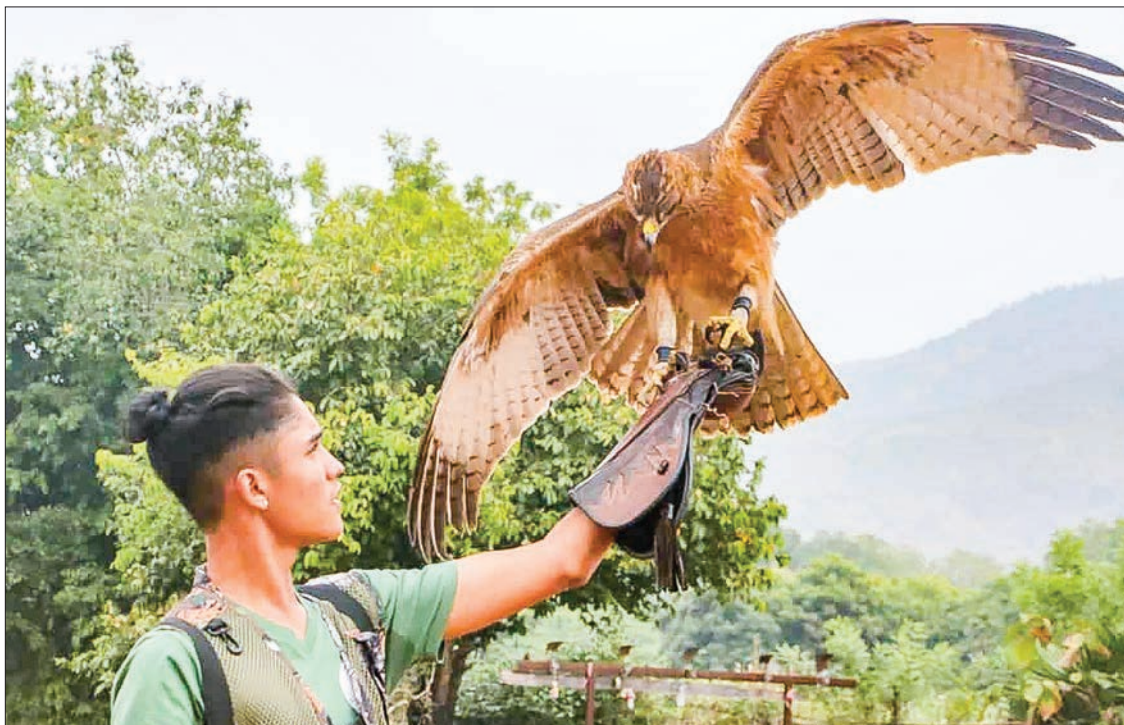
A falconer with his well-trained bird seen at the Myanmar Falconry Championship 2019 on 28 December at the Nature's Life Equestrian Club in Mandalay.

THE Myanmar Falconry Championship 2019 was held on Saturday at the Nature's Life Equestrian Club in Patheingyi Township of Mandalay Region. Professional falconers and