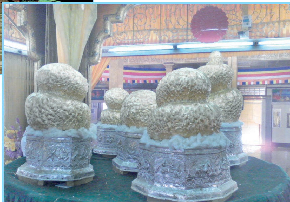
Five gold-covered Buddha Images of Hpaung Daw U pagoda.