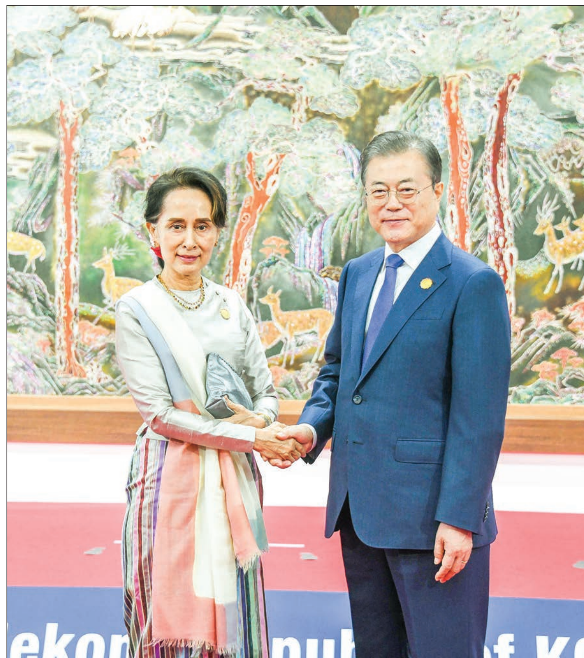
State Counsellor Daw Aung San Suu Kyi is welcomed by South Korean President Mr Moon Jae-in at the First Mekong-ROK Summit in Busan, South Korea on 27 November.

The ROK economic development and its ties with ASEAN including Myanmar are very important. Myanmar has been practicing an investment policy which supports the national economic policy and economic development of the country. So, it is an opportunity for both Korea and Myanmar to cooperate together in economic development. Along with this economic cooperation, we, Myanmar can also learn from the economic model of Korea. During his visit, President Moon demonstrated his commitment of New Southern Policy (NSP) by taking part in the powerful leap of Myanmar's economy. His NSP seeks to prosper with Myanmar, sharing much of the same philosophy and goals as of what is contained in Myanmar's Sustainable Development Plan (MSDP). As MSDP and Korea's NSP have similar concept, Myanmar