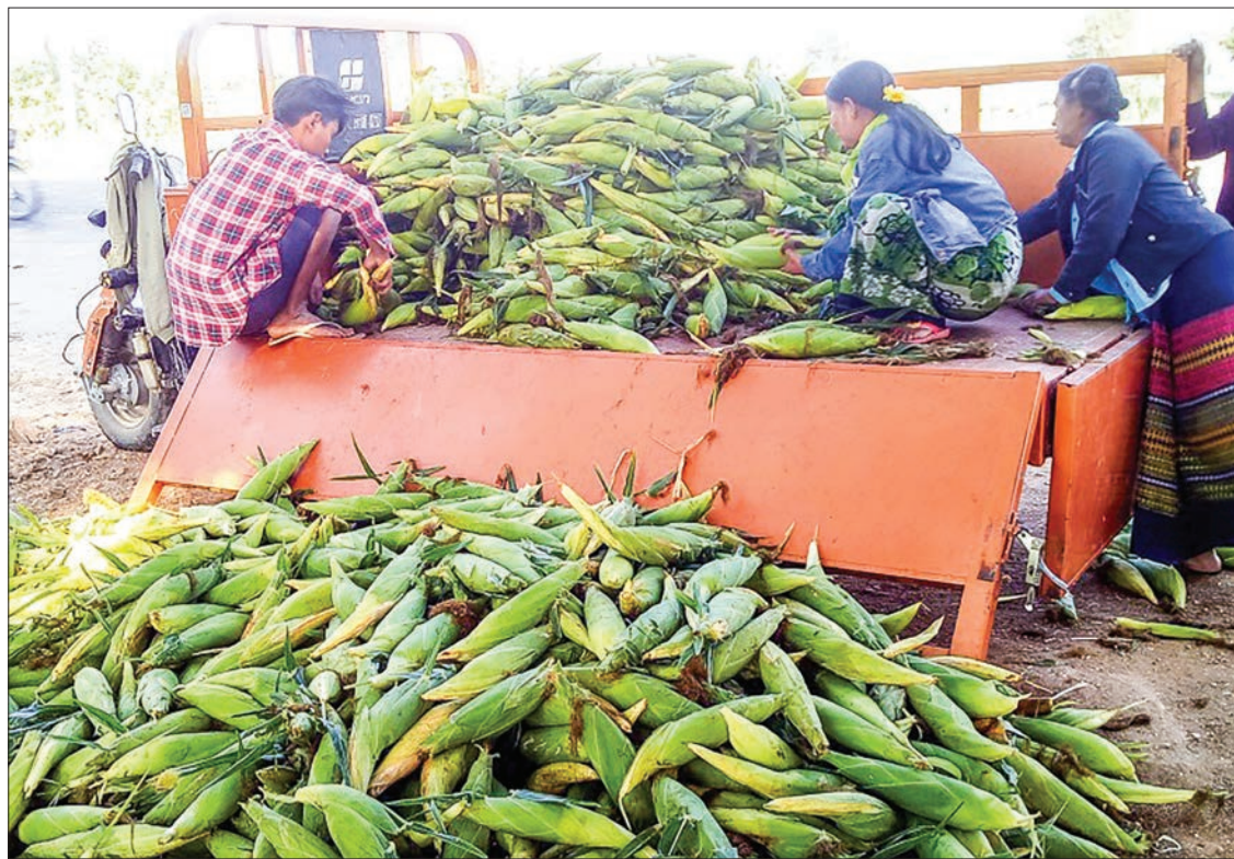
Farmers unloading the corns in their farm.

istry of Commerce, Myanmar exported 1.5 million tons of corn, worth US$270 million, in the 2018-2019FY; 1.4 million