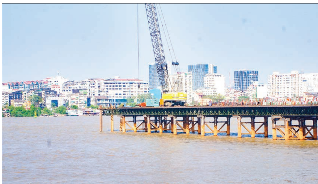
The view of the Yangon-Dala bridge or Korea-Myanmar Friendship Bridge which is under construction.

While construction is on, vessels are required to travel between two red and green buoys placed along the site. There are two red and yellow