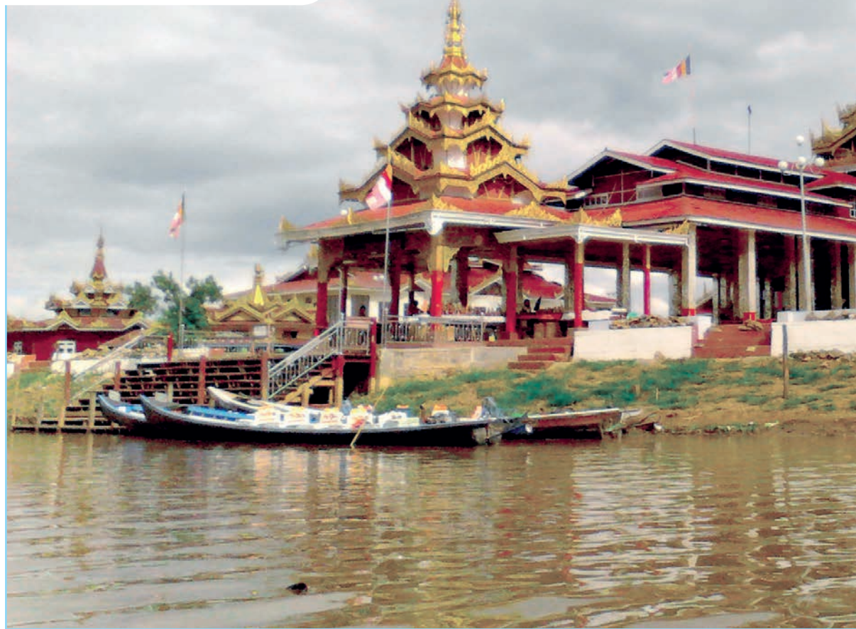
Hpaung Daw U Pagoda.

Environmental challenges or problems of global warming, climate change, rising sea level, air and water pollution are threatening the