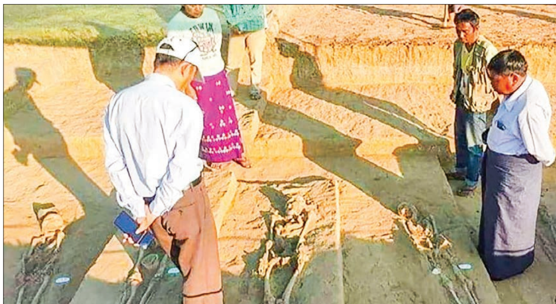
Officials check the human fossils on the site near the Yangon-Mandalay Highway.

The place where the human fossils were found has been marked as an Iron Age site with