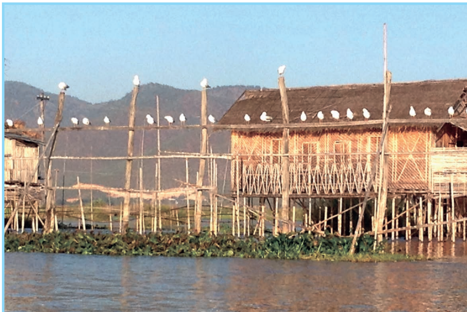
Seagulls sitting on a fence, enjoying the warmth of the evening rays of the sun on Inle Lake.

natural environment and ecosystem of humans as well as living creatures and plants. Because of this, countries of the world were using various means to reduce the damage to the ecosystem and to conserve the natural environment. Bio diverse wetlands with habitat for waterfowls and migratory birds became natural environment that need to be protected and preserved.