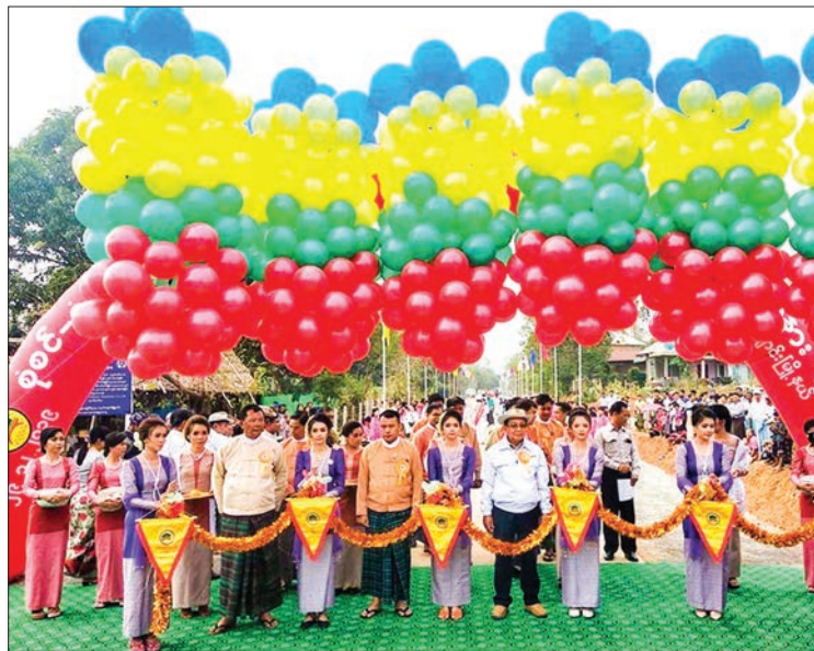
Union Minister U Han Zaw and officials open the inter-village road and new bridge in Taninthayi Region yesterday.