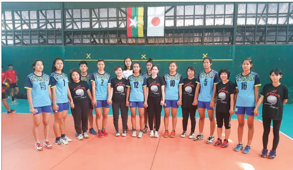
Players from the Myanmar women's (youth) volleyball team and Japan's Hyogo High School team pose for a photo after their friendly match.