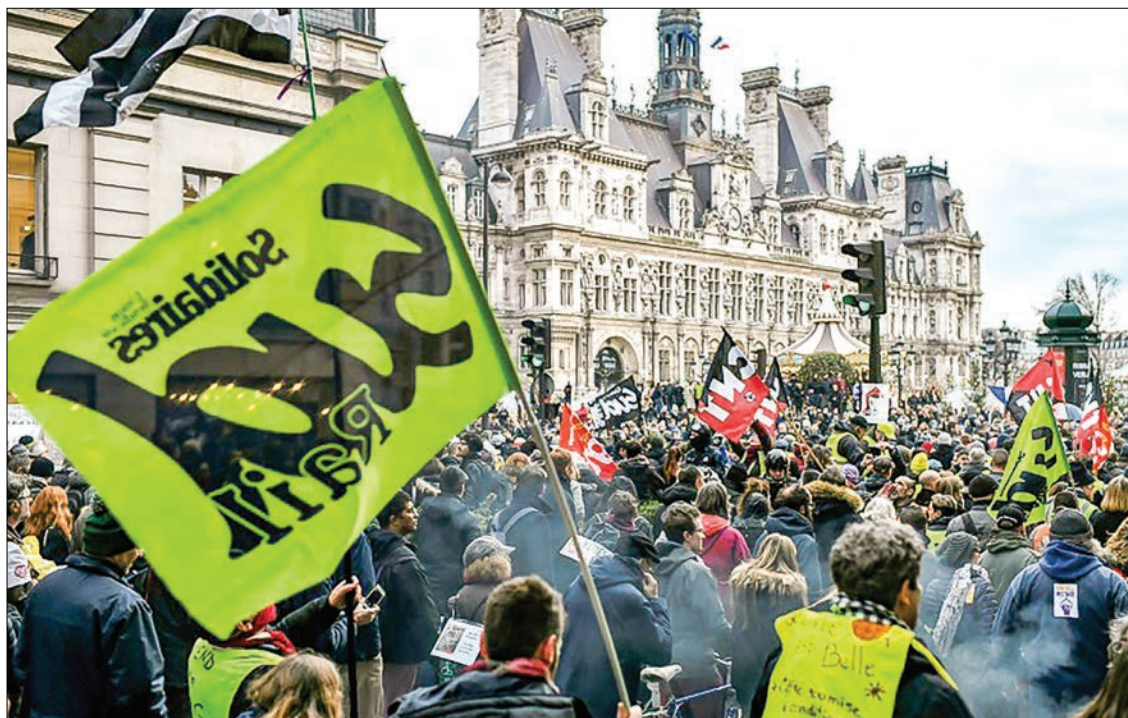
The strike against government pensions reform is on course to surpass the longest transport stoppage in France which lasted for 28 days in 1986 and early 1987. PHOTO: AFP

The government and unions are only due to hold their next talks on January 7, two days ahead of a new day of mass demonstrations against the reform which is championed by President Emmanuel Macron. In an interview with the Journal de Dimanche newspaper, Djebbari angrily accused the CGT of "attitudes of intimidation, harassment and even aggression" against railway workers who had opted not to down tools.—AFP ■