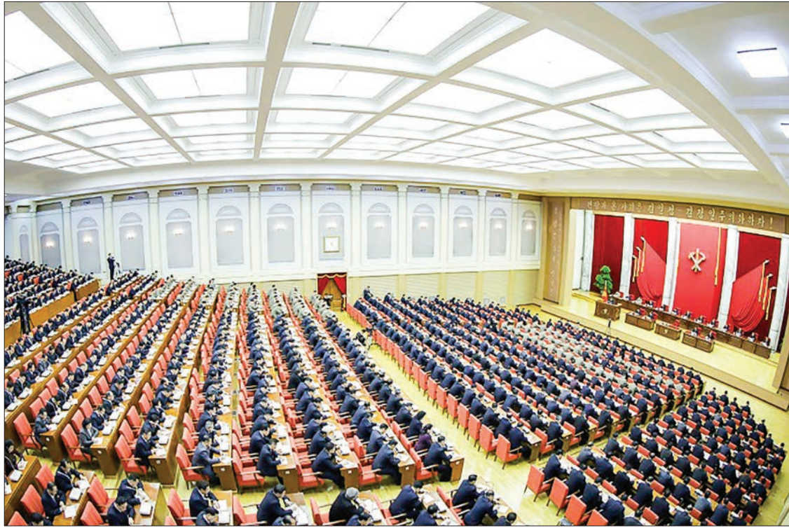
The plenary of the Workers' Party of Korea is being held amid widespread speculation that Pyongyang is preparing to test a ballistic missile.

SEOUL—North Korean leader Kim Jong Un has convened a key meeting of top ruling party officials, state media said Sunday, ahead of a year-end deadline for Washington to shift its stance on stalled nuclear talks.