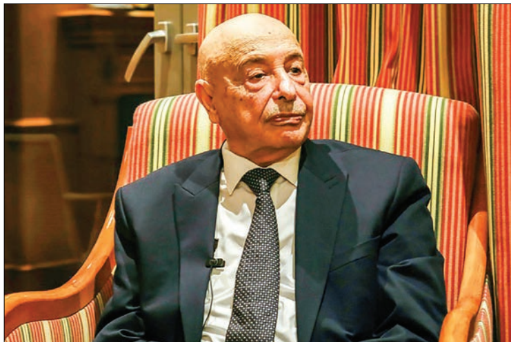
Libya's parliament speaker Aguilah Saleh visited Cyprus at a time of rising tensions in the Mediterranean.

"In the coming days, the Libyan parliament will take ac-