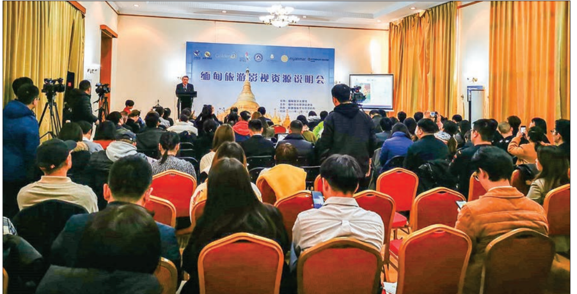
The ceremony to introduce Myanmar Travel Film Investment programme being held at the Myanmar Embassy in Beijing, China, on December 27.

The ceremony came to an end after the documentary film shot by Ministry of Hotels and Tourism of Myanmar was screened. — Kyaw Swar (FDC) (Translate by Bahtoo)