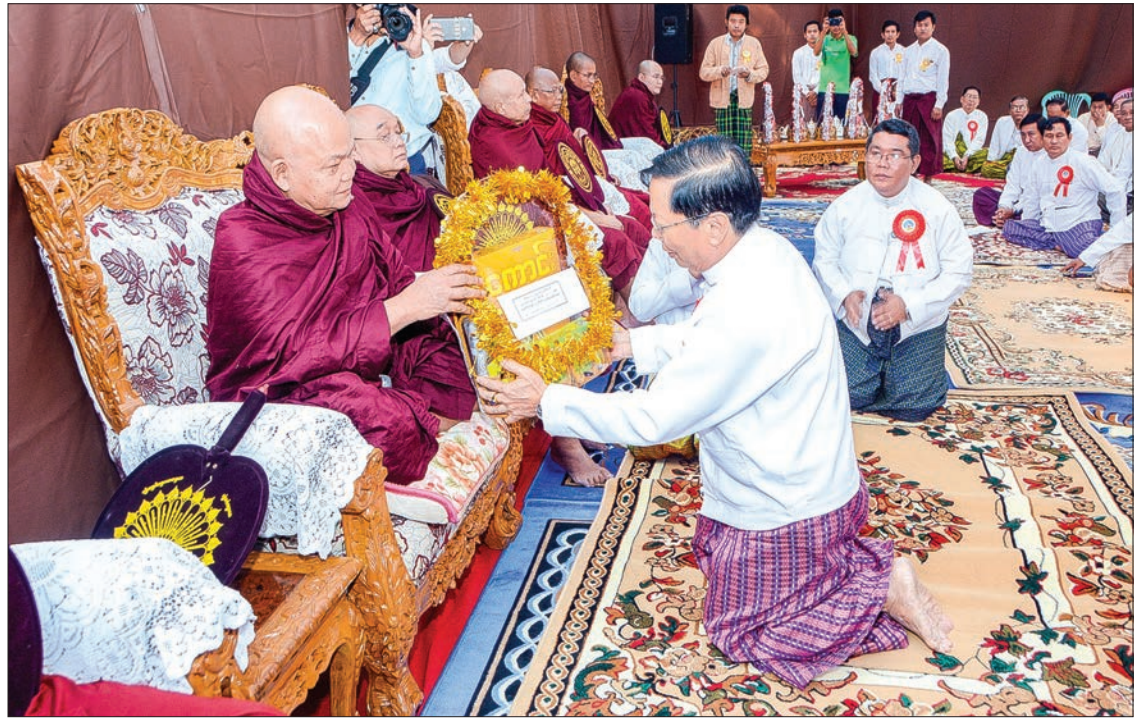
Union Minister Thura U Aung Ko donates the offertories to the Sangha at the inauguration ceremony for renovation of Thiri Minigalar Kaba Aye Pagoda in Yangon yesterday.