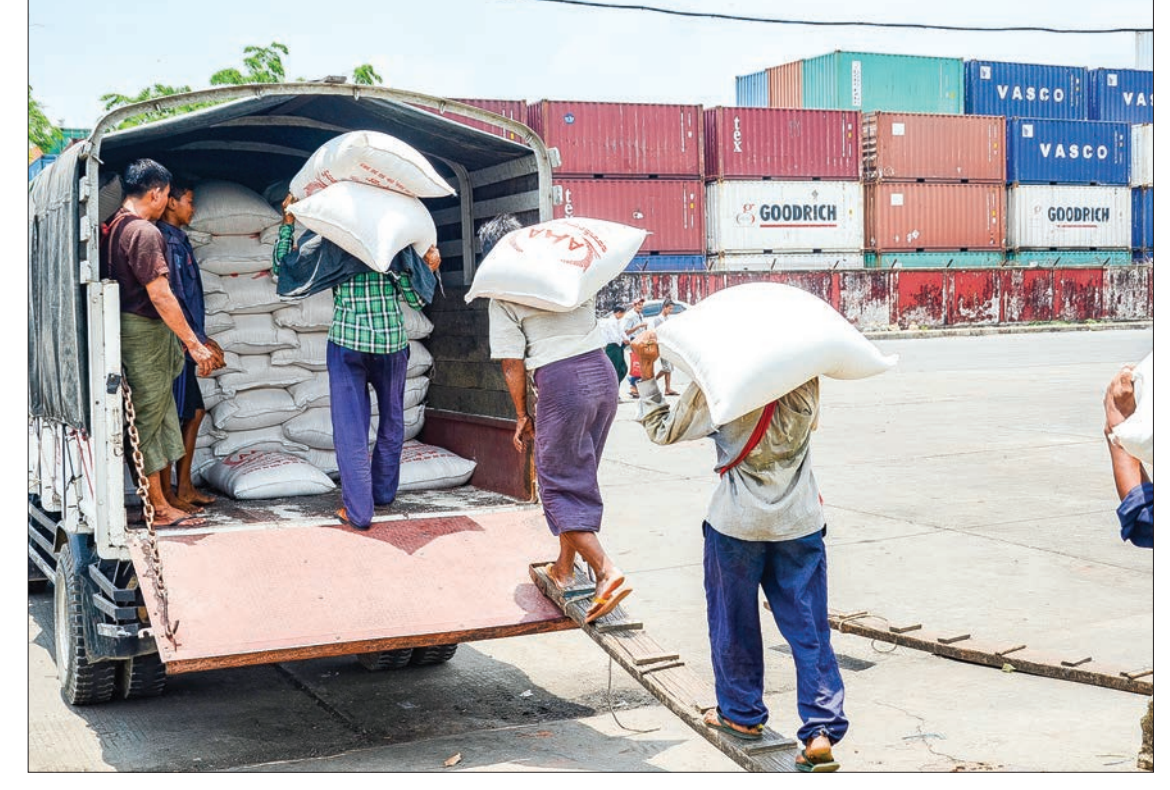
Workers loading the truck with sacks of rice at Botataung Jetty in Yangon.

At present, rice is being exported to China through a government-to-government (G2G) agreement and a barter system, in exchange for Chinese goods.