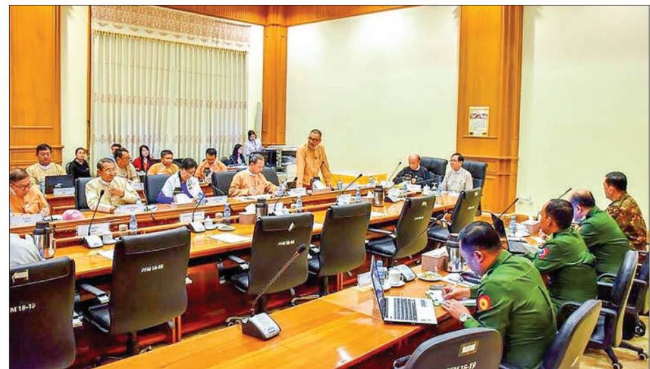
The meeting of Joint Committee on Amending the 2008 Constitution being held in Nay Pyi Taw yesterday.