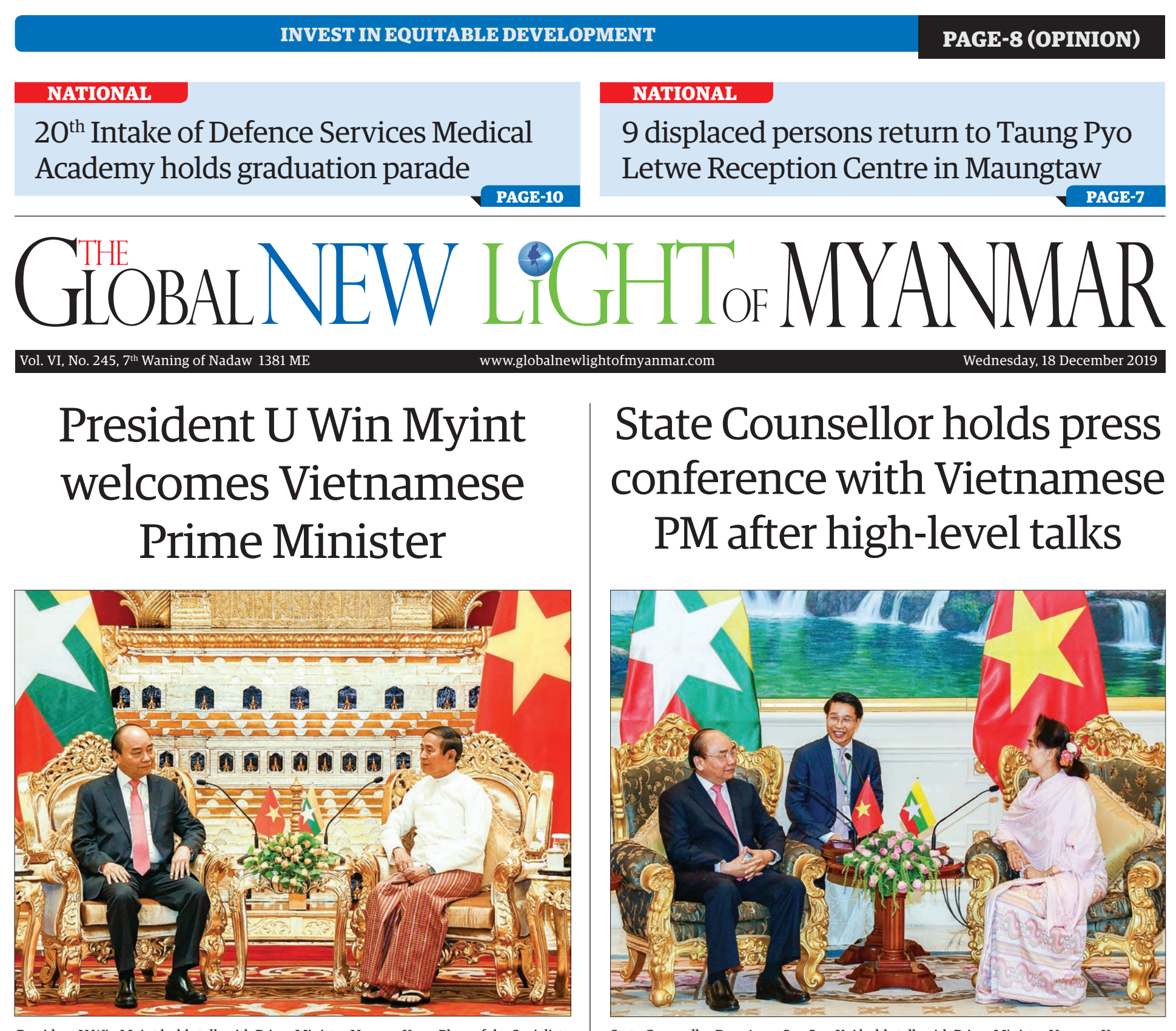
President U Win Myint holds talk with Prime Minister Nguyen Xuan Phuc of the Socialist Republic of Viet Nam at the Presidential Palace in Nay Pyi Taw yesterday.

PRESIDENT U Win Myint welcomed Prime Minister Nguyen Xuan Phuc of the Socialist Republic of Viet Nam, who is making an official visit in Myanmar at the invitation of Myanmar President and First Lady, at the Presidential Palace in Nay Pyi Taw yesterday morning.