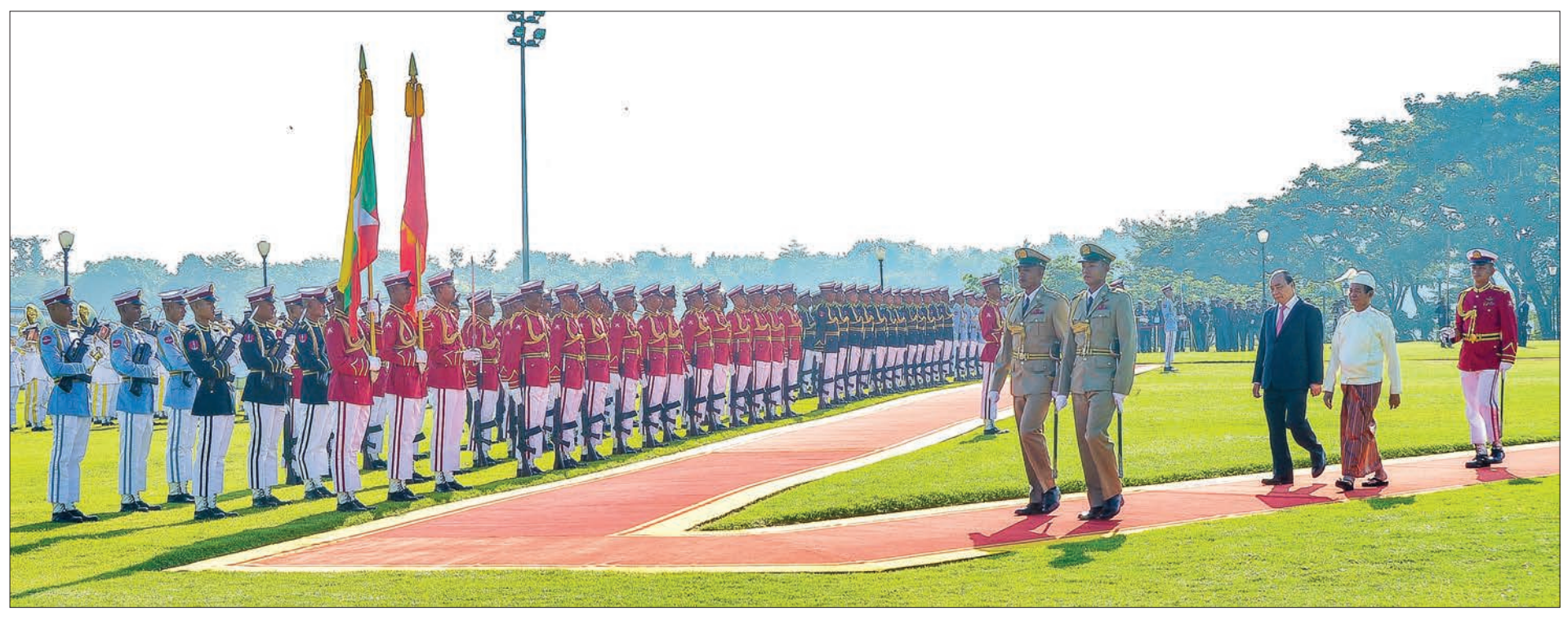
President U Win Myint and Prime Minister Mr Nguyen Xuan Phuc of the Socialist Republic of Viet Nam inspect the Guard of Honour in Nay Pyi Taw yesterday.