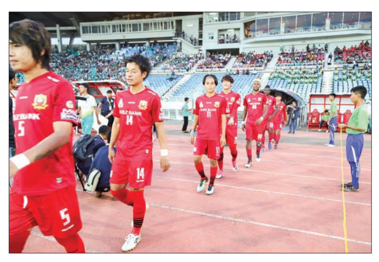
Shan United players (red jersey) seen at the match against Yangon United in the previous season of Myanmar National League.

2018-2019 season of the Myanmar National League with a no-loss result and Ayeyawady United had finished the season as the first runner-up, trailing Shan United by two points.