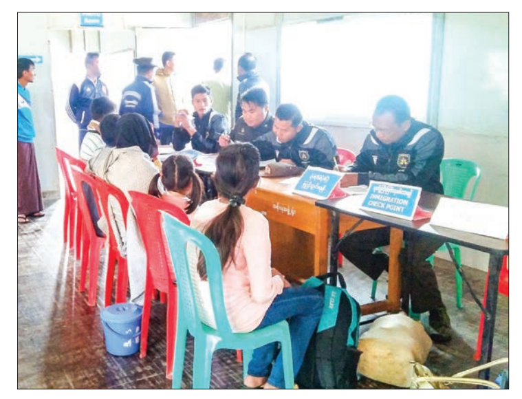
Four men and five women return on their own volition to Taung Pyo Letwe Reception Centre in Maungtaw on 17 December.

A total of 9 persons, four men and five women, comprising two families returned on their own volition to Taung Pyo Letwe Reception Centre in Maungtaw Township, Rakhine State at 8: 15 am on 17 December morning.