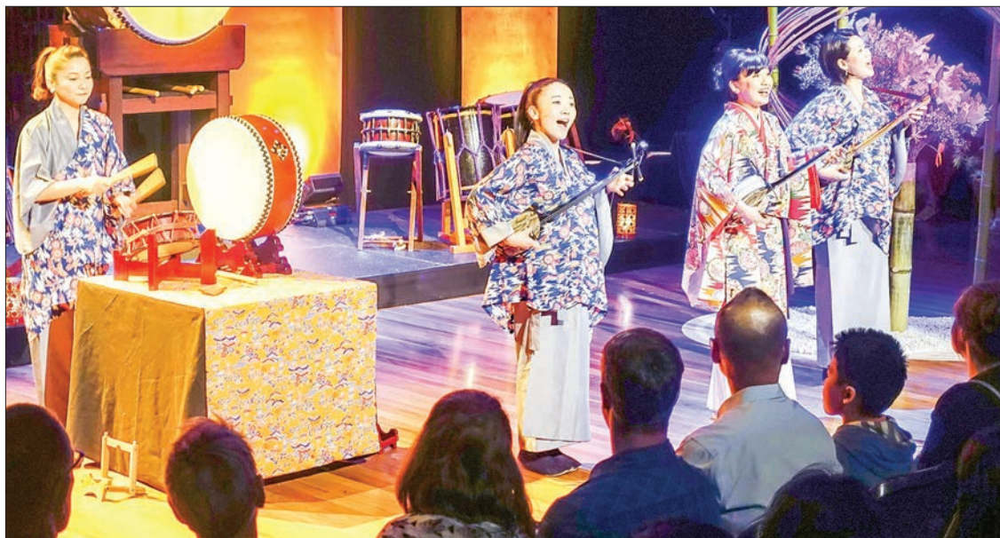
Musicians play "sanshin" three-stringed instruments from the southern island prefecture of Okinawa during a Japanese traditional arts show at the Sydney Opera House on 16 December 2019.

"The respect the performers show to nature is lovely," said Owen, commenting on the show's "Day in the life of Japan" theme, which began with a sunrise and sounds of the ocean. The new Japanese era started 1 May when Emperor Naruhito ascended the Chrysanthemum Throne after former Emperor Akihito abdicated the previous day. —Kyodo News ■