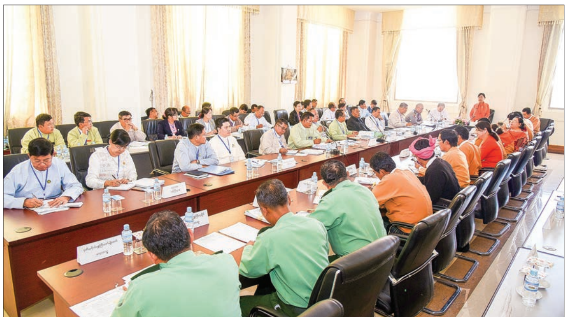
The first day of the meeting of the Government's Guarantees, Pledges and Undertakings Vetting Committee of the Pyithu Hluttaw in progress on 16 December.

THE Government's Guarantees, Pledges and Undertakings Vetting Committee of the Pyithu Hluttaw is checking implementations of government ministries at both Union and State/Region levels on their answers to the questions raised from the