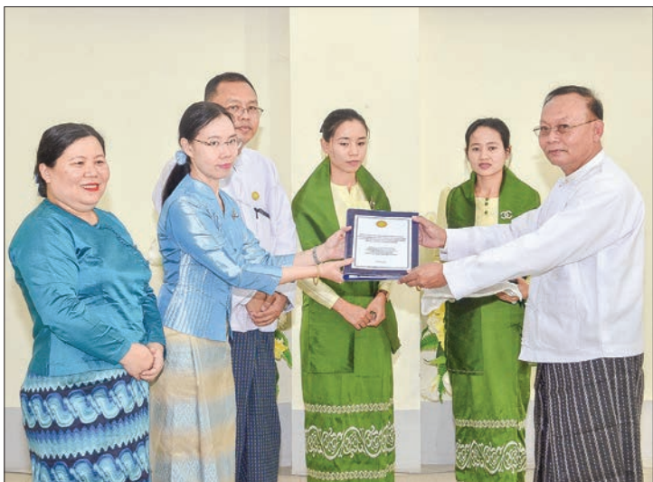
Dr Lee Jong-wook memorial Prize for Public Health (2019) handed over to the National Archive Department.