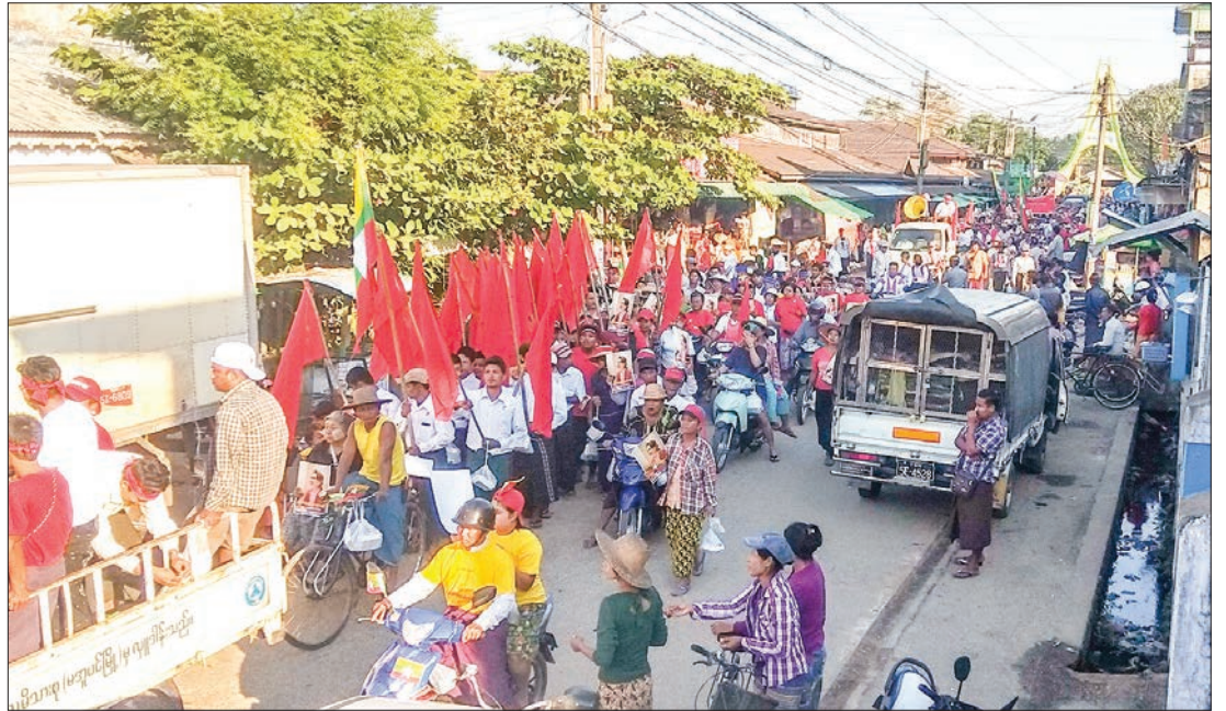
People in Maubin take part in the rally supporting State Counsellor Daw Aung San Suu Kyi.

RESIDENTS of Maubin in Maubin District, Ayeyawady Region, held a mass rally yesterday to show support of State Counsellor and Union Minister for Foreign Affairs, Daw Aung San Suu Kyi, who contested the case filed by The Gambia against Myanmar at the International Court of Justice.