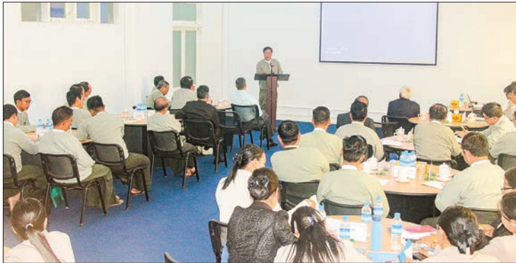
The opening ceremony of the training course on voting, vote counting and announcing the results is in progress at the UEC Office in Nay Pyi Taw yesterday.