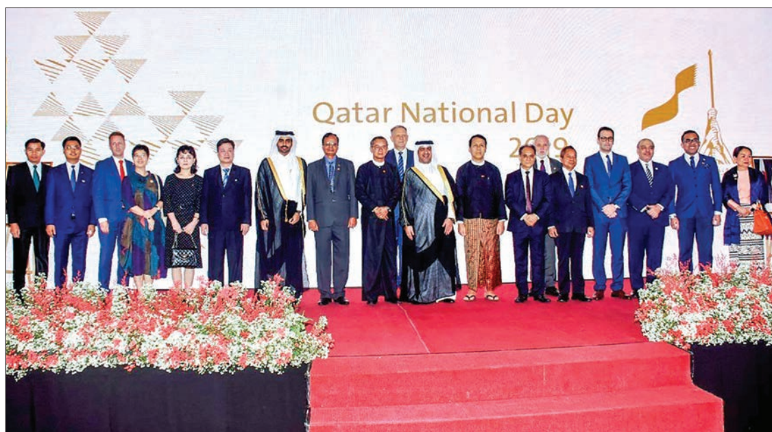
Union Minister U Ohn Maung, Qatar Charge d'affaires Mr Mansoor Mubarak Al-Khayarin and guests pose for a documentary photo at the National Day of Qatar celebration at Novotel Max Hotel in Yangon.