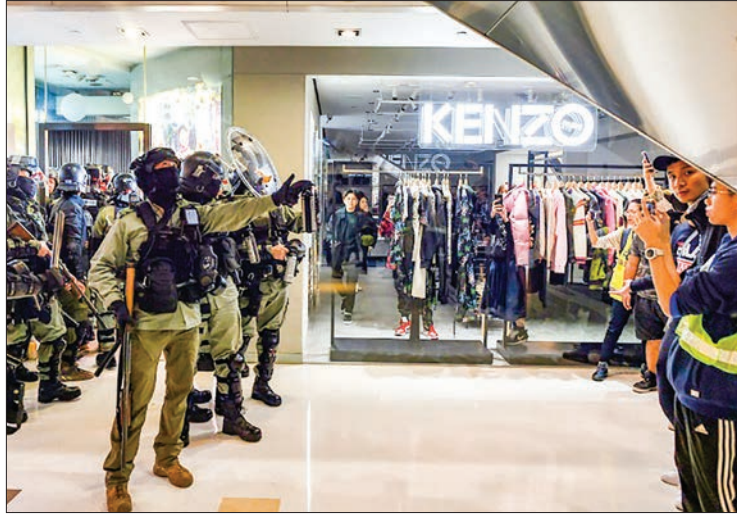
This weekend the relative calm in Hong Kong was broken by clashes between black-clad pro-democracy protesters and police in some of the city's shopping malls.

Lam met earlier with Chinese Premier Li Keqiang, who said her government had "tried its best to maintain social stability" amid "an unprecedentedly severe and complicated situation". But he also called for the Hong Kong government to "step up studies of the deep-seated