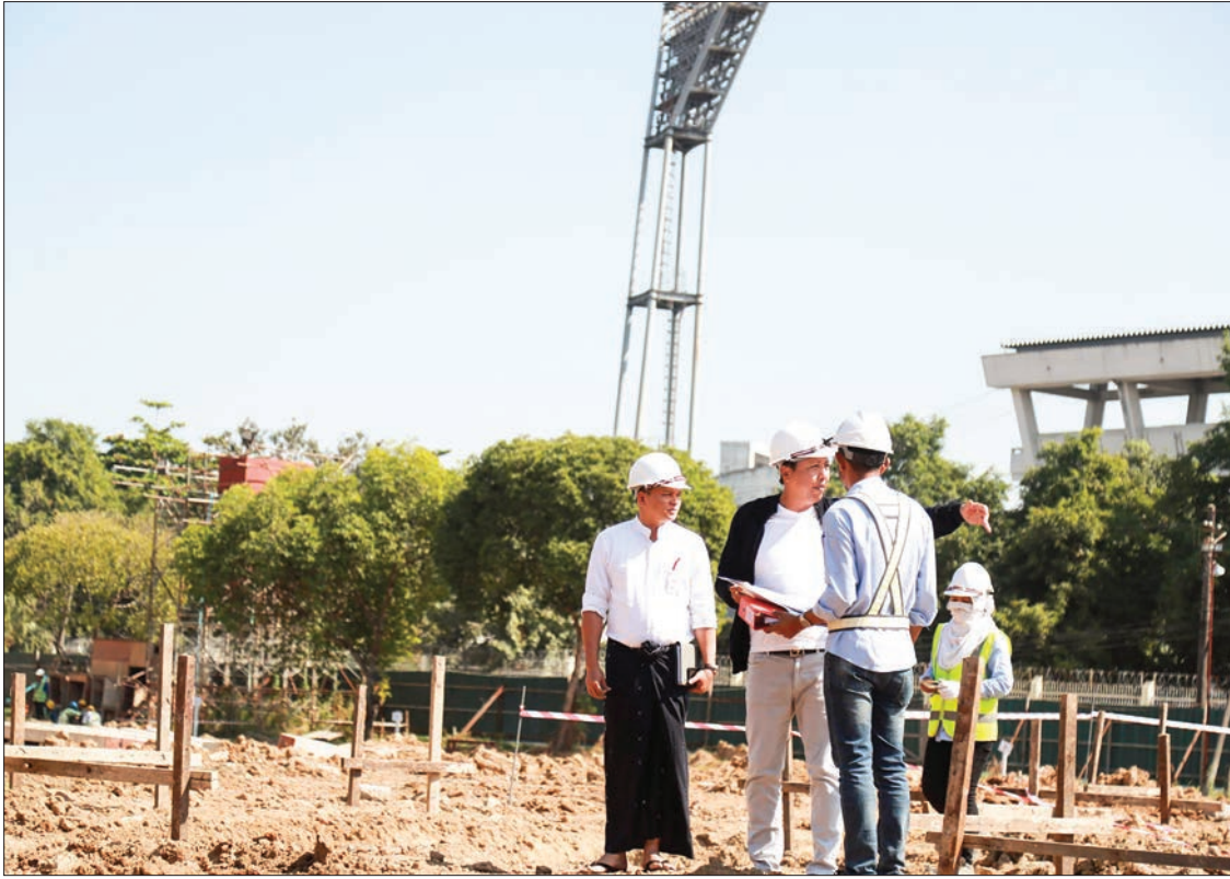
MFF President U Zaw Zaw inspects the construction of futsal stadium at the Thuwunna Stadium in Yangon on 16 December.