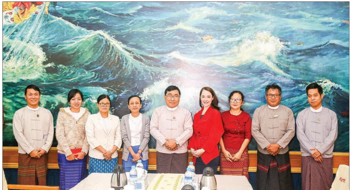
Union Minister for Social Welfare, Relief and Resettlement Dr Win Myat Aye poses for a documentary photo with a delegation from Nordic International Support Foundation at his office in Nay Pyi Taw.