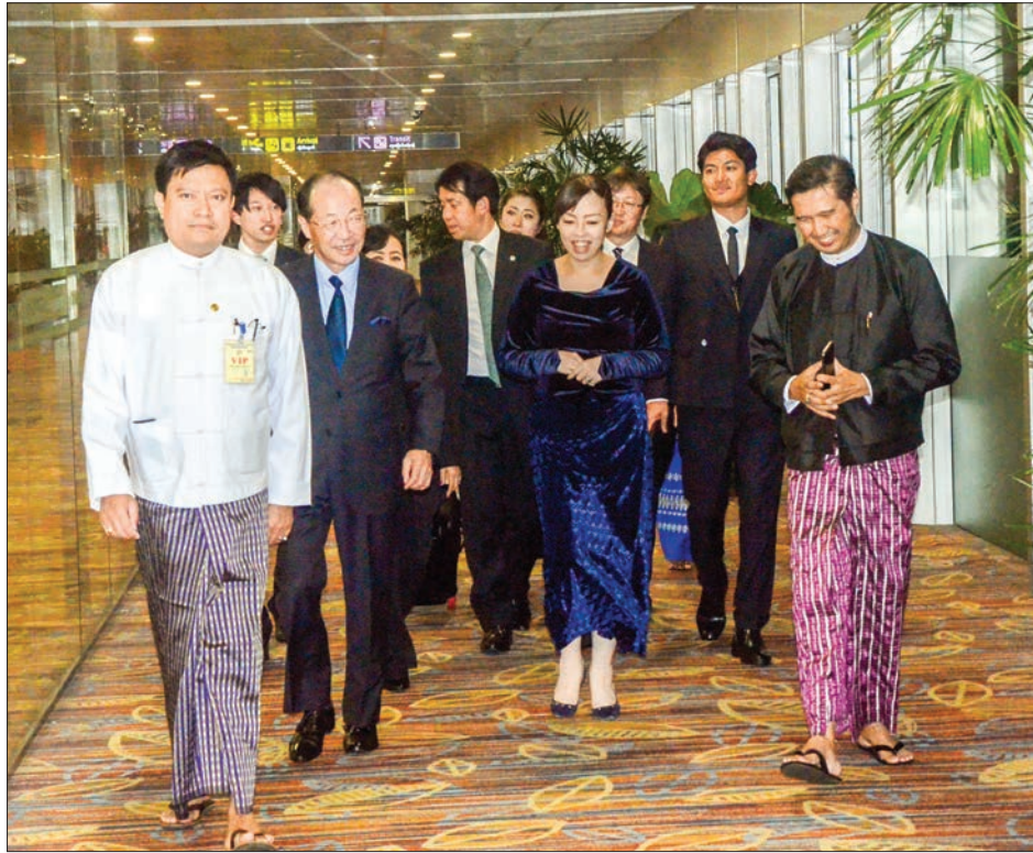
Japanese Princess Yoko of Mikasa seen off by officials at the Yangon International Airport on 16 December.

JAPAN'S Princess Yoko of Mikasa and her delegation departed from Yangon at 10 pm yesterday night and