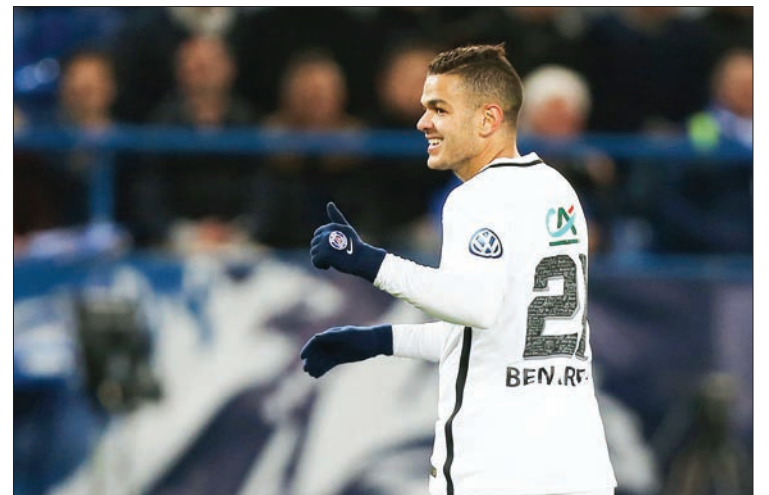
Hatem Ben Arfa claimed PSG had sidelined him for non-footballing reasons.