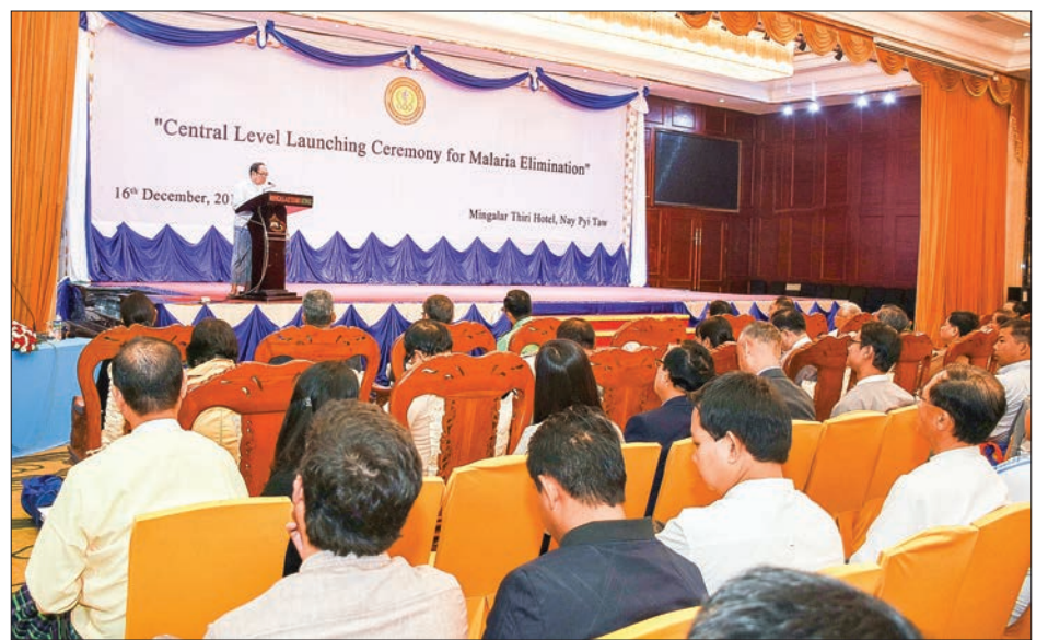
Union Minister Dr Myint Htwe delivers a speech at the "Central Level Launching Ceremony for Malaria Elimination" at the Mingalar Thiri Hotel, Nay Pyi Taw, yesterday.