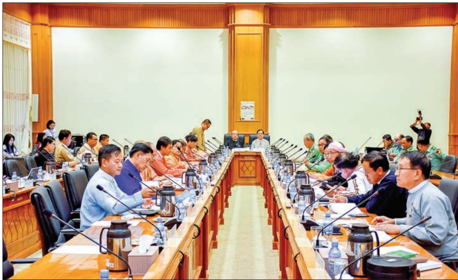
The meeting 69/2019 of the Joint Committee on Amending the 2008 Constitution is in progress at Pyidaungsu Hluttaw Building D in Nay Pyi Taw on 16 December.