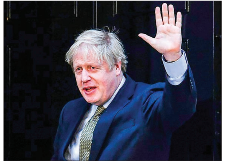
Five more years, but Boris Johnson's first task is to pull Britain out of the European Union.

London has the option to extend the transition but Johnson has insisted this will not happen,