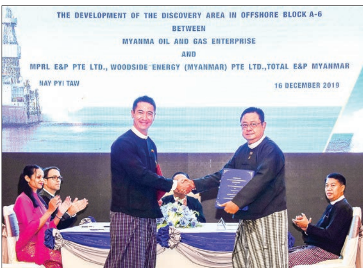
Myanmar Oil and Gas Enterprise and MPRL E&P Pte Ltd. sign an agreement on development of offshore block A-6.