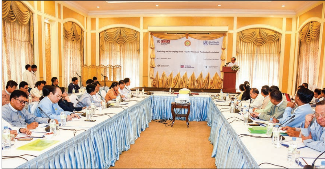
Union Minister Dr Myint Htwe addresses the Workshop on Developing Road Map for Standard Packaging Legislation at Grand Amara Hotel, Nay Pyi Taw.

The Union Minister said statistics show an average of 64,000 Myanmar citizens die as a consequence of cigarettes and tobacco consumption every year. He said the WHO STEPS survey conducted in Myanmar in 2014 reveal that 94 per cent have one same reason to develop noncommunicable diseases while 19.6 per cent have 3-5 reasons for the