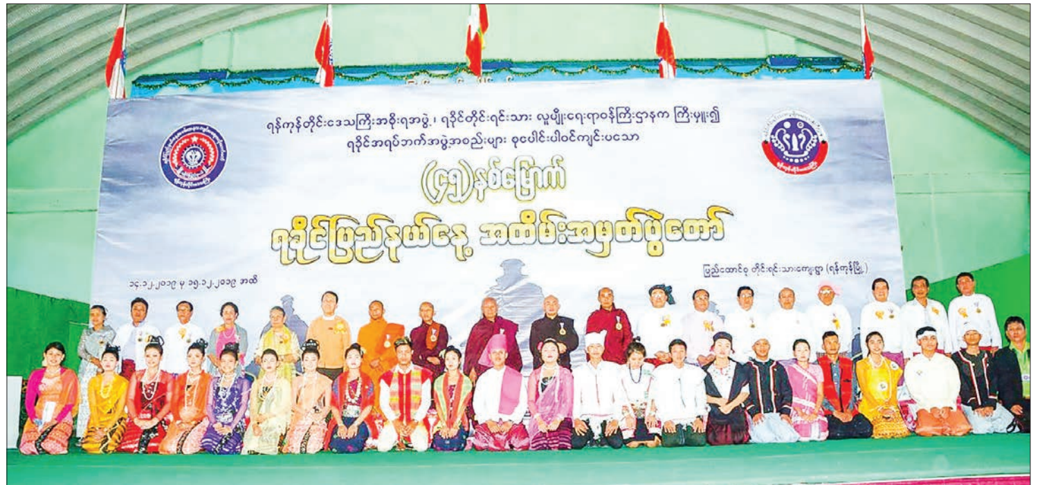
Yangon Region Chief Minister U Phyo Min Thein (6th from left of the back row) poses for a group photo together with attendees of the Rakhine State Day event at the National Races Village in Thakayta, Yangon on Sunday.

THE Yangon Region government led the commemoration of the 45th anniversary of Rakhine State Day at the National Races Village in Thakayta Township, Yangon Region, at 11 am on Sunday.