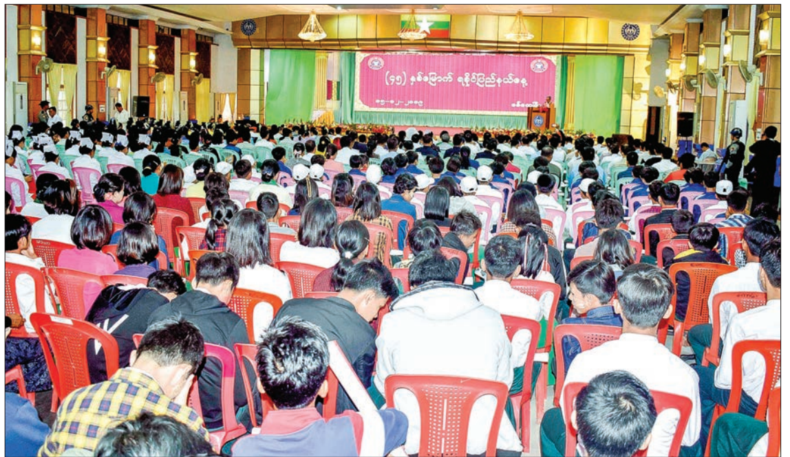
Rakhine State Chief Minister U Nyi Pu delivers a speech at the 45 th Anniversary of Rakhine State Day event at U Ottama Hall in Sittway, Rakhine State on 15 December.

THE 45 th Anniversary of Rakhine State Day was observed at U Ottama Hall in Sittway, Rakhine State, at 9 am on 15 December.