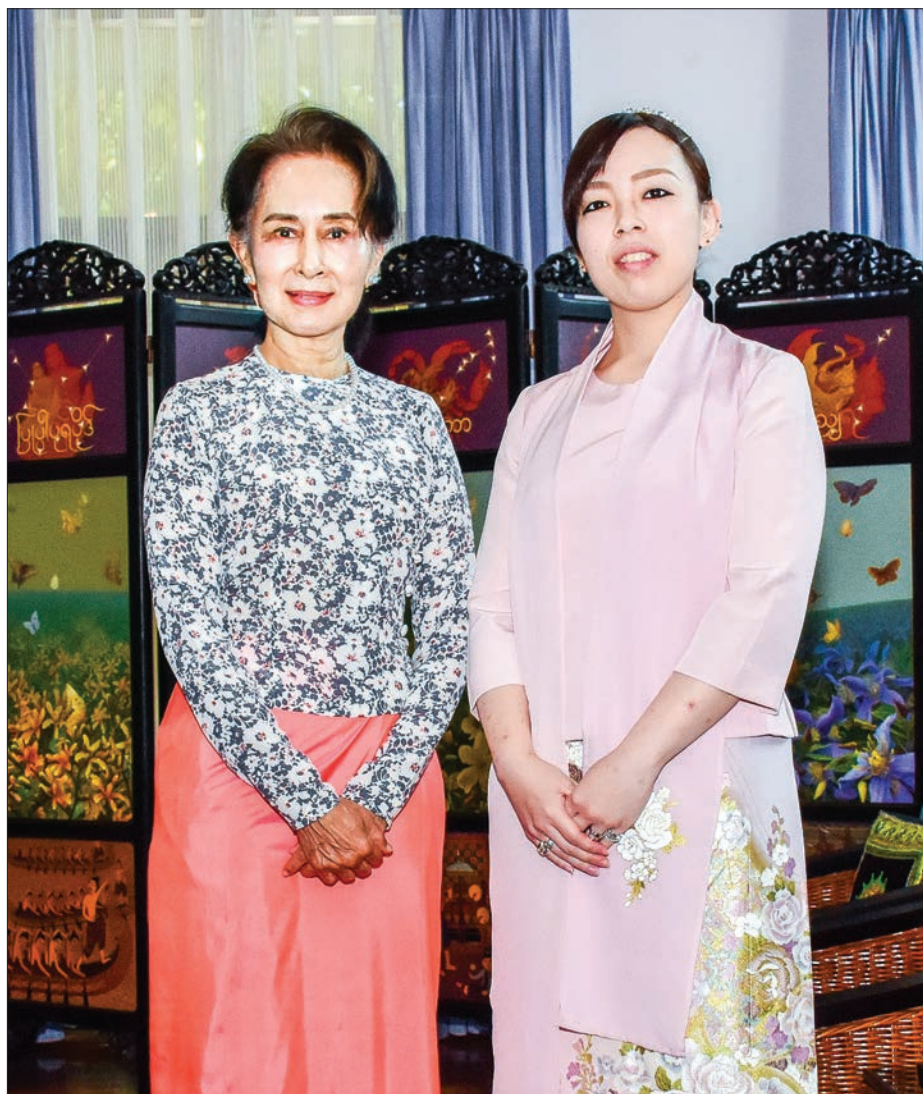
State Counsellor Daw Aung San Suu Kyi meets with Her Imperial Highness Princess Yoko of Mikasa in Nay Pyi Taw yesterday.

D AW Aung San Suu Kyi, State Counsellor of the Republic of the Union of Myanmar, received Her Imperial Highness Princess Yoko of Mikasa, at 10:00 am on 16 December 2019 at her residence in Nay Pyi Taw.