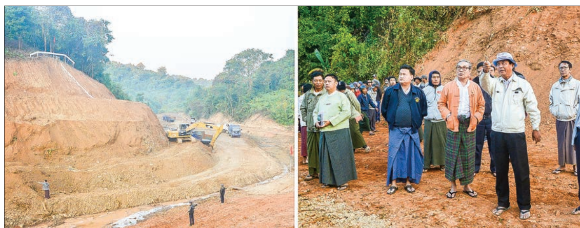
Rakhine State Chief Minister U Nyi Pu inspects the construction site of Kwinlyarshay reservoir in Gwa Township yesterday.