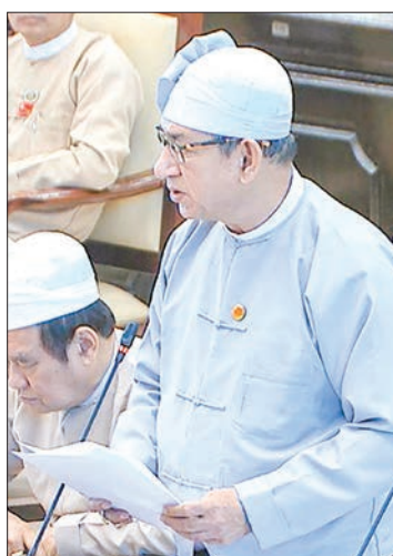
Deputy Minister Dr Ye Myint Swe.

of doctors to Ministry of Health and Sports, U Win Myint of Magway Region constituency 8 on arrangements made on distrib-