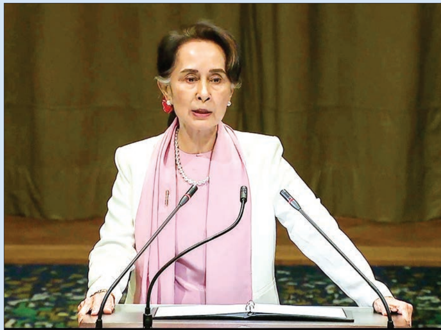
State Counsellor Daw Aung San Suu Kyi delivers statement at the International Court of Justice at The Hague, the Netherlands.

MR. President and Members of the Court, It is not disputed that Myanmar – like the United Kingdom or the United States – has a military justice system. The Constitution of Myanmar cannot and should not be ignored if we are serious about establishing constitutional democracy and rule-of-law in Myanmar. International criminal tribunals take four to eight years to undertake investigations of core international crimes, sometimes longer. Just over two years have passed since the serious internal armed conflict against the ARSA, and the second court-martial is now underway. The Gambia has not challenged the quality of the military justice in the Inn Din case, only the pardon, which many of us regret. The ongoing Gutar Pyin court-martial in Buthidaung Township should be allowed to run its course. I am confident that there will be further