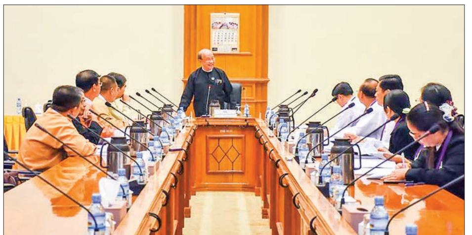
Pyidaungsu Hluttaw Deputy Speaker U Tun Tun Hein addresses the Pyidaungsu Hluttaw Joint Bill Committee meeting in Nay Pyi Taw yesterday.