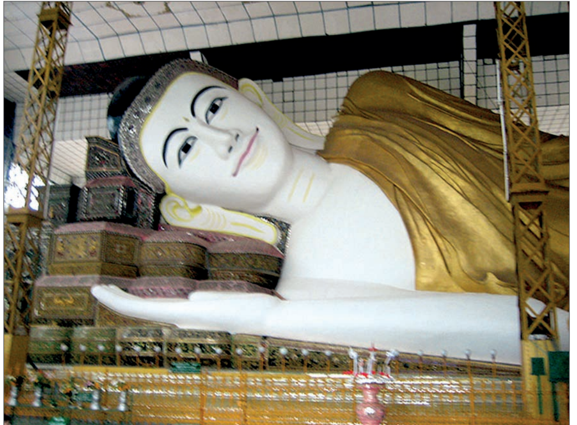
ShweThaLyaung reclining Buddha image.

Ketumati King Tabinshwehti conquered Bago in 1538 AD and