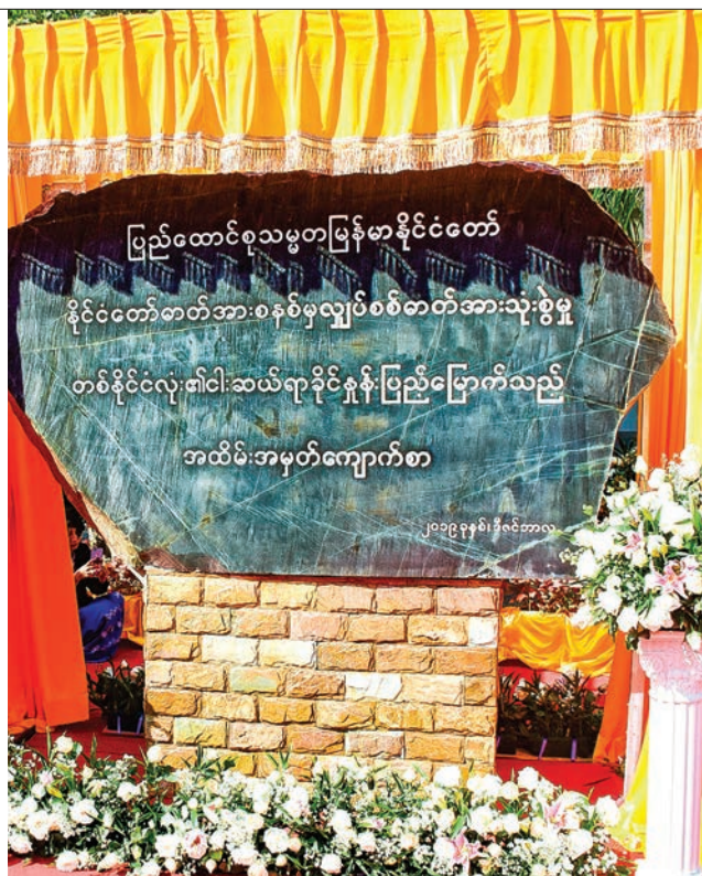
President U Win Myint, Pyithu Hluttaw Speaker U T Khun Myat, Amyotha Hluttaw Speaker Mahn Win Khaing Than and Union Minister U Win Khaing unveil the commemorative inscription tablet for the achievement of 50% nationwide electrification at the ceremony in Nay Pyi Taw.