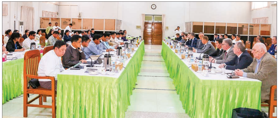
Deputy Minister for Investment and Foreign Economic Relations U Bharat Singh and Deputy Minister for Economic Development of the Russian Federation Mr Timur Maksimov hold a meeting in Nay Pyi Taw yesterday.