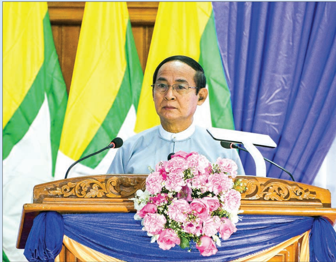
President U Win Myint addresses the ceremony commemorating the achievement of 50% nationwide electrification in Nay Pyi Taw yesterday.

In order to implement the short-term and long-term plans for the development of our country, aiming at the goals of developing the all-inclusive, sustainable economy, as outlined in the Global Sustainable Development Goals (SDGs), providing full labour employment, offering productive, decent jobs, building strong infrastructure, establishing all-inclusive, sustainable industrialization, and giving support to innovations, balancing these goals with others, we have already drawn the Myanmar Sustainable Development Plan (MSDP) 2018-2030. This MSDP had laid down the strategic plan, which covers sustainable development and the construction of the prioritized infrastructures supporting various forms of economic enterprises.