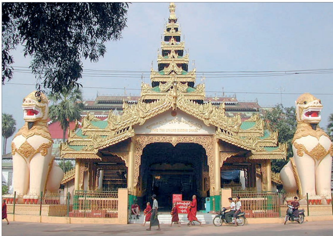
ShweThaLyaun Pagoda in Bago.

moved his throne from Toungoo to Bago. Bayintnaung succeeded to him in Bago in 1551 AD and built Kanbawzathadi Palace in 1553 AD. King Bayintnaung then established the Second Myanmar Empire based on Bago.