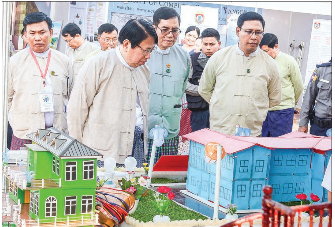
Union Minister Dr Pe Myint inspects the preparations and the layout of the exhibition halls for the All-Round Youth Development Festival (Magway) yesterday.

The All-Round Youth Development Festival (Magway) will be held from today to 16 December with over a hundred exhibition booths focusing on literature, sports, art and information technology movements. There will also be 60 bookstalls and famous artists performing at the festival. Earlier on the same day, Magway Region Chief Minister Dr Aung Moe Nyo, Deputy Minister for Information U Aung Hla Tun, regional cabinet ministers and other officials also inspect-