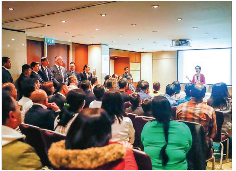
State Counsellor Daw Aung San Suu Kyi meets Myanmar citizens who came to support her at The Hague, the Netherlands.

ON THURSDAY evening and yesterday morning, State Counsellor Daw Aung San Suu Kyi met with Myanmar citizens who came to support her at The Hague, the Netherlands, with some already residing in