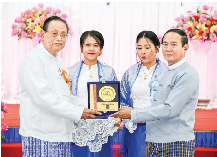
President U Win Myint accepts a gift commemorating the event for the achievement of 50% nationwide electrification from Union Minister U Win Khaing in Nay Pyi Taw.

A CEREMONY to celebrate the achievement of 50% nationwide electrification was held at the Ministry of Electricity and Energy, in Nay Pyi Taw, yesterday.