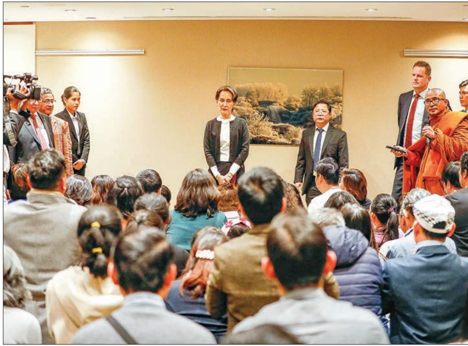
State Counsellor the Daw Aung San Suu Kyi meets Myanmar citizens who came to support her at The Hague, the Netherlands.