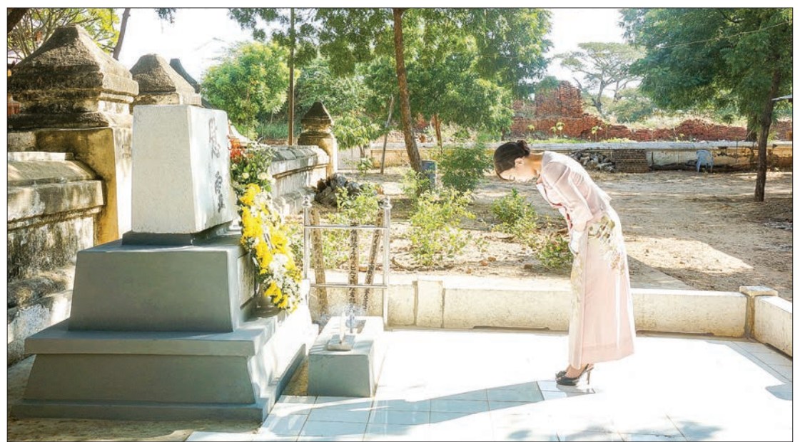
Japanese Princess Yoko Mikasa pays tribute to Japanese soldiers fallen during the WWII near Thatbyinnyu Temple.

DURING her visit to Myanmar, Japanese Princess Yoko Mikasa traveled to Bagan's Heritage Site and visited the Thatbyinnyu Temple, Ananda Temple and Lawkananda Pagoda yesterday.