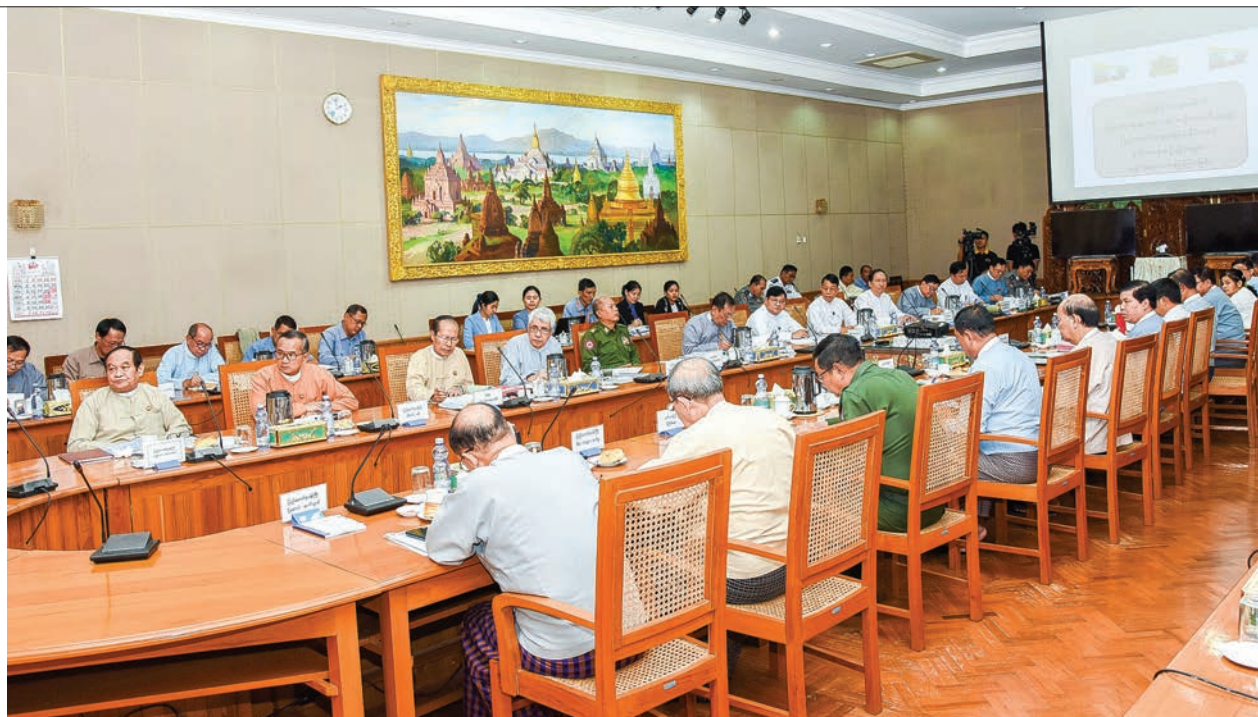
Vice President U Myint Swe addresses the coordination meeting for holding 73 rd Union Day in 2020 at the meeting hall of President's Office in Nay Pyi Taw yesterday.

T HE Central Committee for Convening the 73 rd Union Day in 2020 held a coordination meeting at the meeting hall of the Office of the President in Nay Pyi Taw yesterday, where Central Committee Chairman Vice President U Myint Swe delivered a speech.