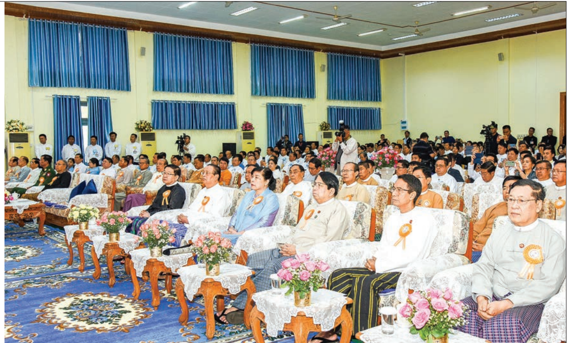
President U Win Myint delivers the opening speech at the ceremony to commemorate the achievement of 50% nationwide electrification in Nay Pyi Taw, yesterday.