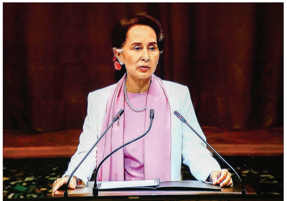
State Counsellor Daw Aung San Suu Kyi delivers the statement at the International Court of Justice (ICJ) at The Hague, the Netherlands.

T HE International Court of Justice (ICJ) held the third day of oral hearings on the application submitted by The Gambia. State Counsellor Daw Aung San Suu Kyi, in her capacity as the Union Minister for Foreign Affairs appeared as Agent for Myanmar and delivered the closing oral presentation in the afternoon on 12 December 2019 at The Hague, the Netherlands. The Gambia presented its second round of oral presentations earlier in the day.