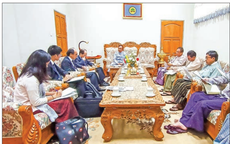
Union Minister U Han Zaw meets with Japanese Ambassador Mr Ichiro Maruyama in Nay Pyi Taw yesterday.

UNION Minister for Construction U Han Zaw received Ambassador of Japan Mr Ichiro Maruyama at the guest hall of the ministry in Nay Pyi Taw yes-