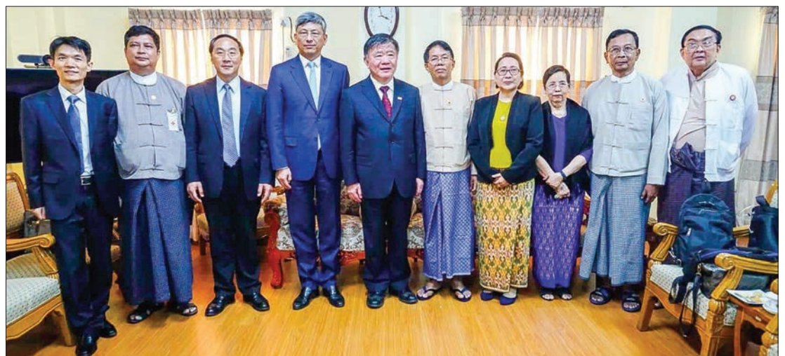
After the meeting, the delegation visited the Kyaikkhauk

At the meeting, they discussed philanthropic activities in Rakhine State by the MRCS.