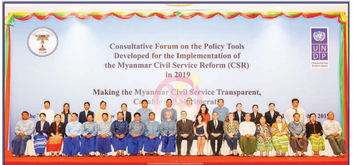
Participants pose for a photo at the “Consultative Forum on the Policy Tools Developed for the Implementation of the Myanmar Civil Service Reform (CSR) in 2019” in Nay Pyi Taw on 13 December.