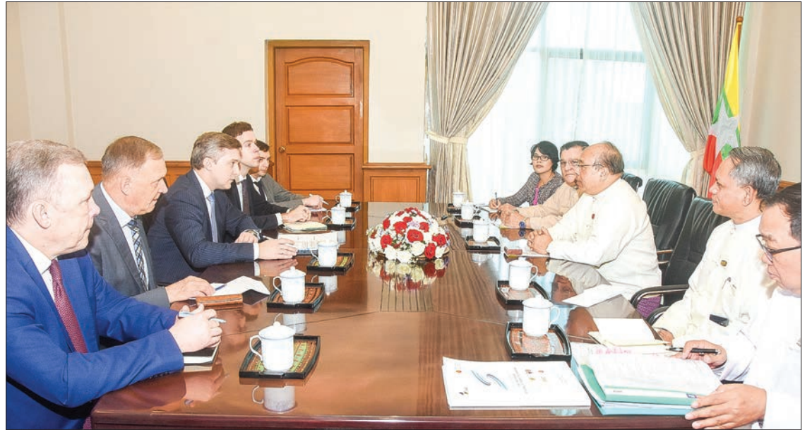
Union Minister U Thaung Tun meets with a business delegation led by Deputy Minister for Economic Development of the Russian Federation Mr. Timur Maksimov in Nay Pyi Taw yesterday.

The Russian business delegation will meet to discuss with the responsible persons from National Economic Coordination Committee, Ministry of Transport and Communications and also Ministry of Natural Resources and Environmental Conservation with the aims to promote investment in Myanmar.—MNA