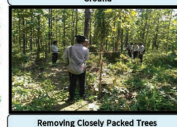
Removing Closely Packed Trees