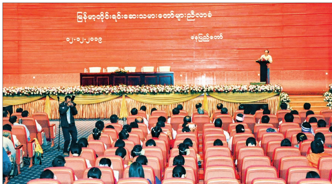
Union Minister Dr Myint Htwe addresses the 20th Myanmar Traditional Medicine Practitioners' Conference at the Myanmar International Convention Centre-2 in Nay Pyi Taw yesterday.

THE 20 th Myanmar Traditional Medicine Practitioners' Conference was held at the Myanmar International Convention Centre-II in Nay Pyi Taw yesterday.