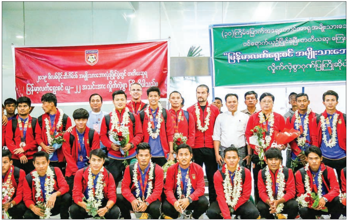
The Myanmar U-22 men's football team, coaches, and officials pose for a group photo at the Yangon International Airport yesterday.

In the SEA Games men's football history, Myanmar has won 14 medals: five gold medals, four silver medals, and five bronze medals, and stands in the third in the medal-winners ranking for the SEA Games men's football event, while Thailand is in the first place with 16 golds, 4 silvers and 5 bronzes, and Malaysia is in the second with 6 gold, 6 silver, and 7 bronze medals.—Lynn Thit (Tgi)