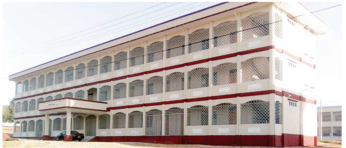
Photo shows a newly constructed education college in Katha, Sagaing Region.

"The education college was built on 32.45 acres of land near the entrance gate of Katha town on Lanmadaw road. The project was implemented with an allocation of K100 million from the Union budget for the 2015-2016 financial year. In the 2017-2018FY, the government allocated another K2.4 billion. So, they have constructed classrooms and staff housing. Now, the whole project is complete.