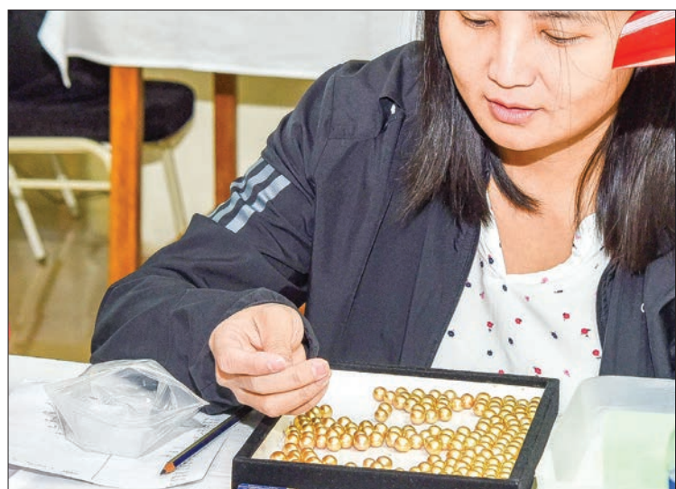
A merchant evaluates pearls on the second day of the Myanmar Pearl Auction in Nay Pyi Taw.