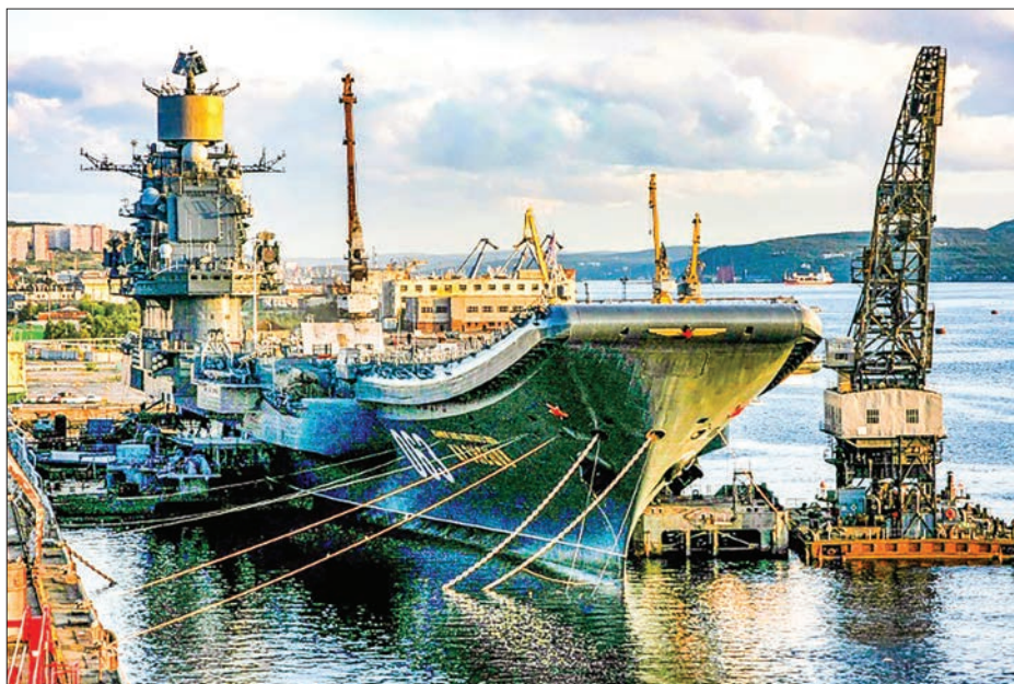
The Admiral Kuznetsov has been undergoing repairs for more than two years.

News agency Interfax reported that the fire had spread over an area of about 600 square metres (6,500 square feet).