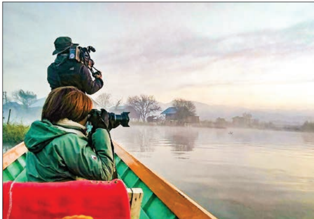
NHK Japanese film crew shooting scenic view of Inle Lake in Nyaungshwe, Shan State.