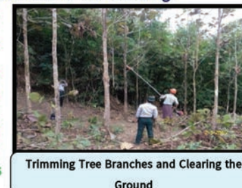
Trimming Tree Branches and Clearing the Ground