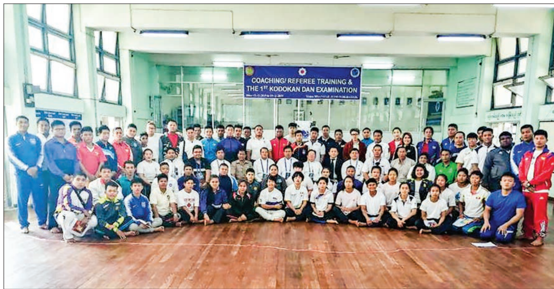
A coach, referee training session and the 1st Kodokan Dan Examination were held in Yangon yesterday, prior to the announcement of the 'Judo in Schools' program.

A program named 'Judo in Schools' will be launched in basic education schools in Yangon in the near future, according to the Myanmar Judo Federation (MJF). Well-trained Judo trainers will conduct the program for schoolchildren in the 5 to 12 age group. For upgrading the skills of Myanmar Judo athletes and coaches, a ceremony for Coaching and Referee Training and the 1st Kodokan Dan Examination were held yesterday at the training center of the Myanmar Judo Federation in Yangon.