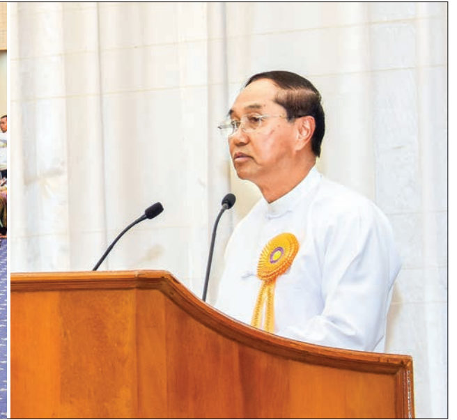
Vice President U Myint Swe gives the opening address at the 20 th Myanmar Traditional Medicine Practitioners' Conference in Nay Pyi Taw yesterday.