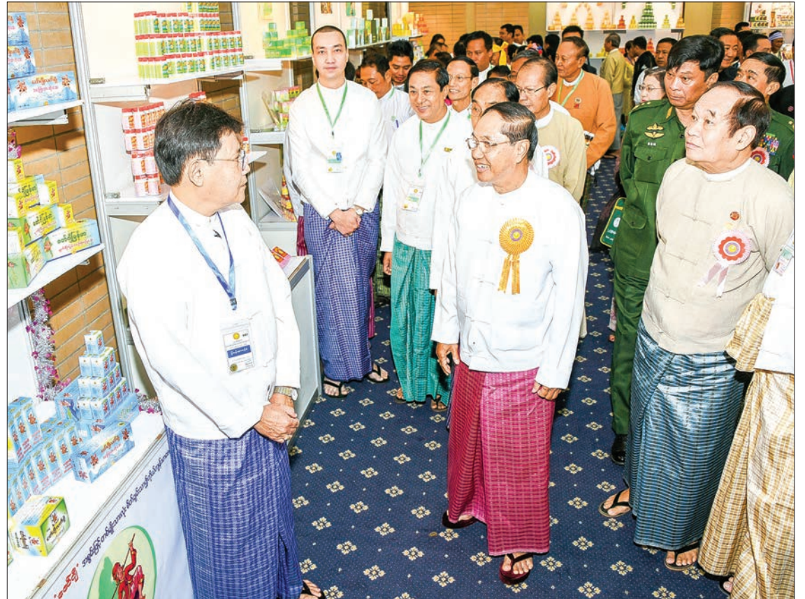
Vice President U Myint Swe observes the booth displayed at the event to mark the 20 th Traditional Medicine Practitioners Conference in Nay Pyi Taw yesterday.