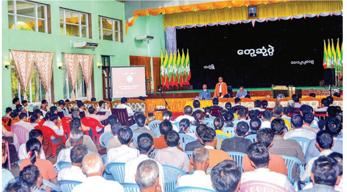
Rakhine State Chief Minister U Nyi Pu delivers the speech during the meeting with locals at Dwarawati Hall in Thandwe Township, Rakhine State, yesterday.