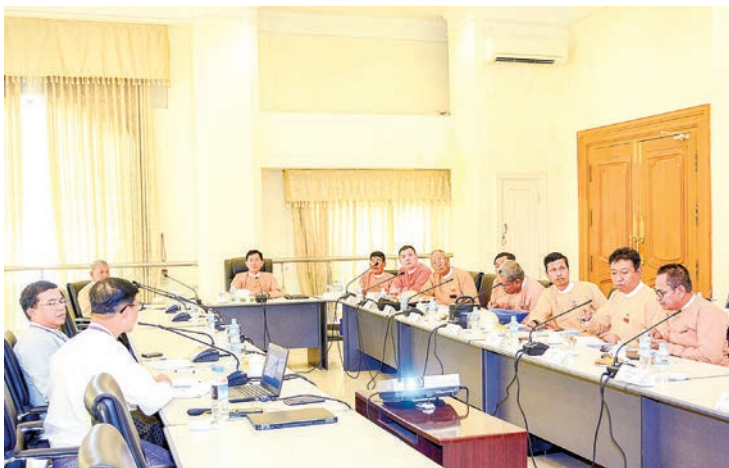
Pyithu Hluttaw's Electricity and Energy Development Committee Chairman U Kyi Moe Naing meets with Total E&P Myanmar delegation in Nay Pyi Taw yesterday.