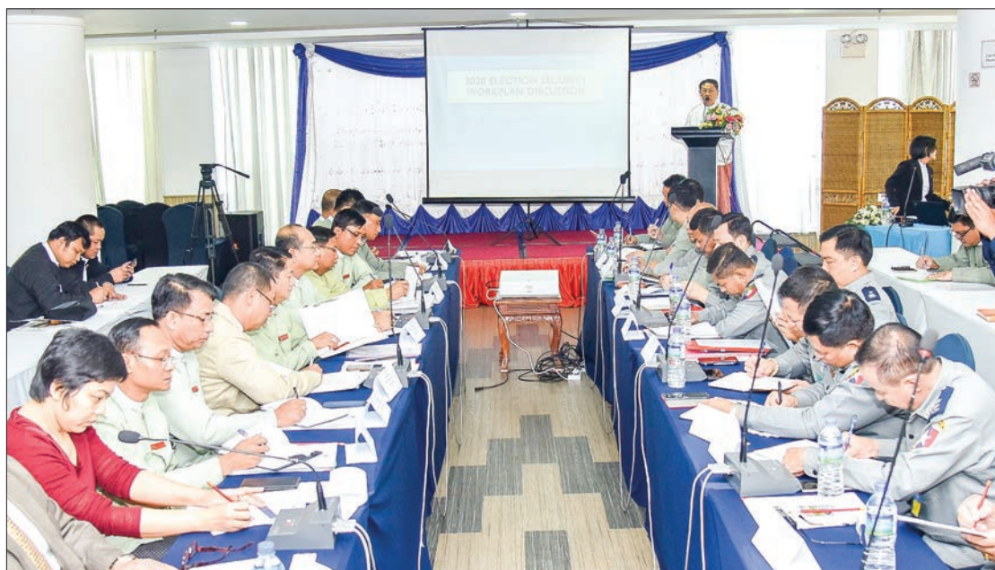
Union Election Commission Chairman U Hla Thein delivers the speech at the 2020 General Election Security Work plan Discussion in Nay Pyi Taw yesterday.

THE Union Election Commission co-organized a meeting with the United States Institute of Peace (USIP) yesterday morning to discuss preparations of security measures for the 2020 General Election.