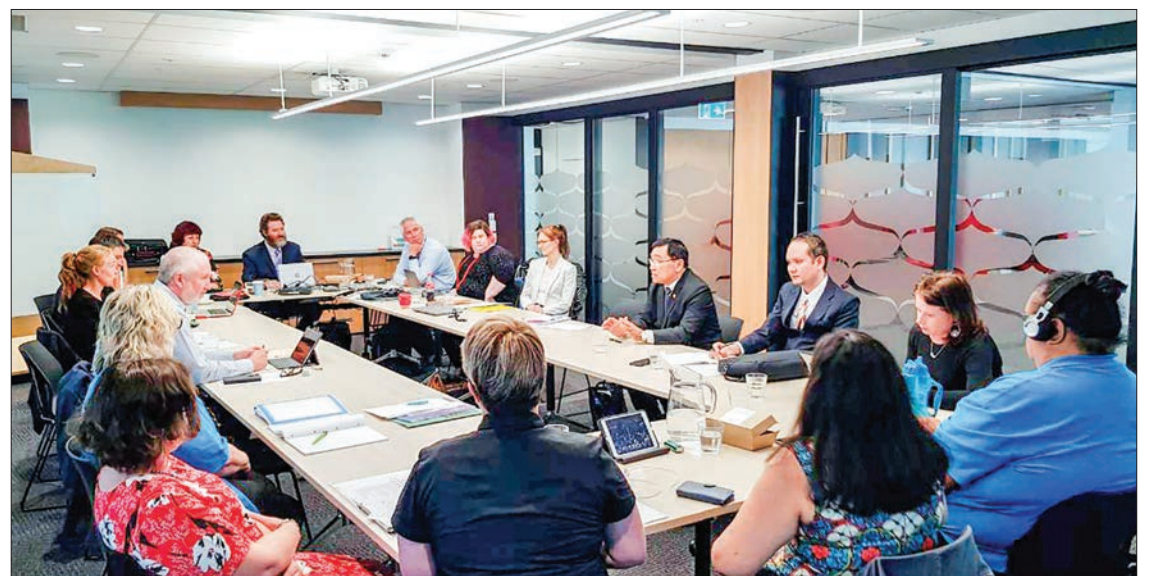
Union Minister Dr Win Myat Aye holds talks with members from disabled supporting networks of New Zealand in Wellington, New Zealand, yesterday.