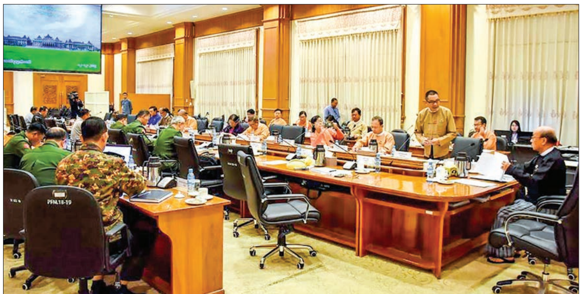
Pyidaungsu Hluttaw Deputy Speaker U Tun Tun Hein attends the Joint Committee on Amending the 2008 Constitution meeting 68/2019 in Nay Pyi Taw yesterday.