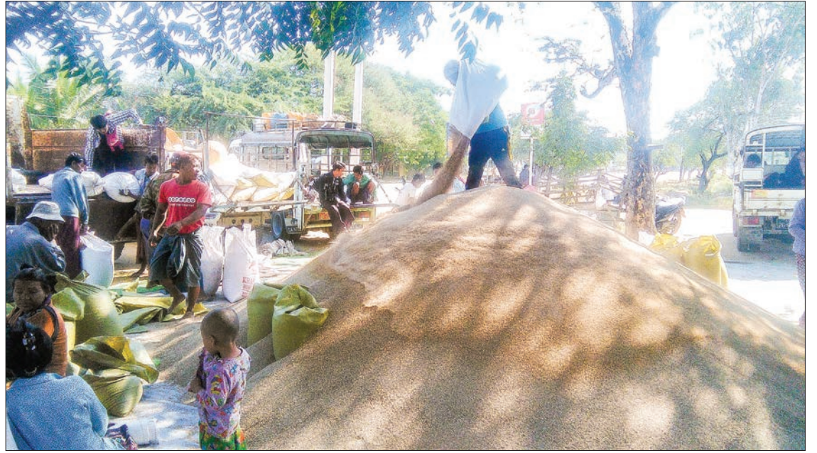
Farmers are selling their sesame seeds at a sesame trading centre in Myinmu Township, Sagaing Region.