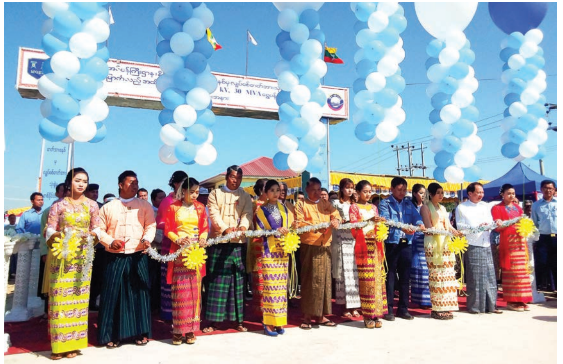
Sagaing Region Chief Minister Dr Myint Naing and officials open 66/33KV 30MVA Shwe Pan Gon power substation in Wetlet.

The new Shwe Pan Gon power substation was con-