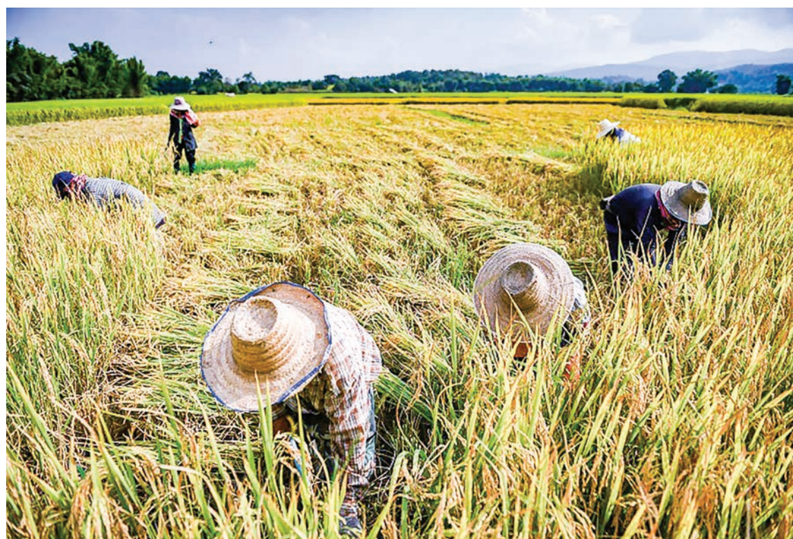
Farmers harvesting rice in the village of Mae Rim in the northern Thai province of Chiang Mai.

nan plant trees around his crops to reinforce the water table.