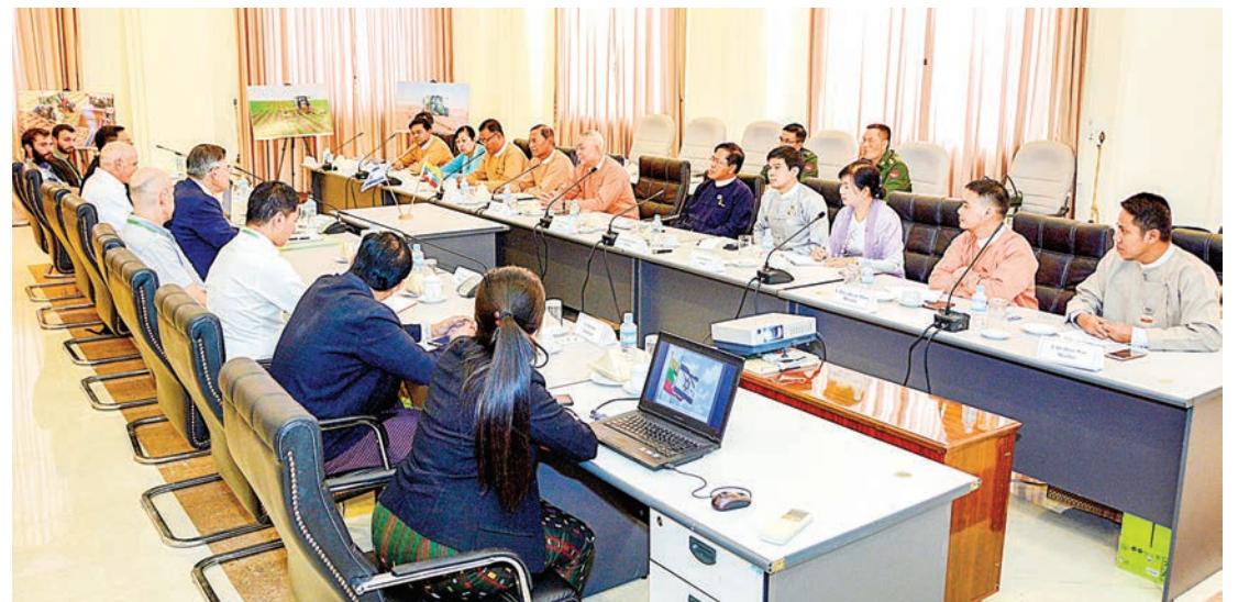
Pyithu Hluttaw's International Relations Committee U Zaw Thein holds talks with Ambassador of Israel Mr Ronen Gilor in Nay Pyi Taw yesterday.

Pyithu Hluttaw's International Relations Committee U Zaw Thein received Ambassador of Israel Mr Ronen Gilor at meeting hall of I-5 Hluttaw Building in Nay Pyi Taw yesterday.