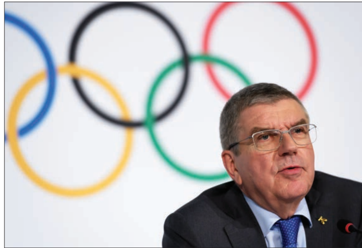
International Olympic Committee (IOC) president Thomas Bach.

LAUSANNE (Switzerland) — The World Anti-Doping Agency on Monday banned Russia for four years from major global sporting events including the 2020 Tokyo Olympics and the 2022 World Cup in Qatar, over manipulated doping data.