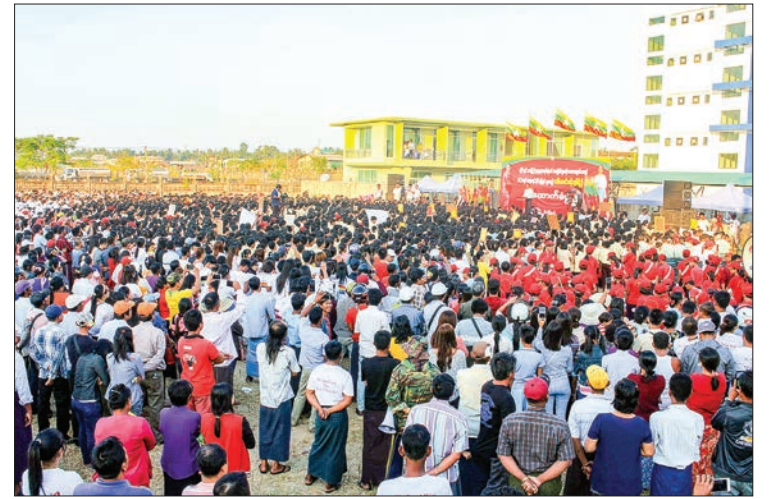
People rally in Myeik to support State Counsellor Daw Aung San Suu Kyi who will contest the case filed by the Gambia at the International Court of Justice (ICJ).

Similarly, in Bago, over 15,000 people from eight town-