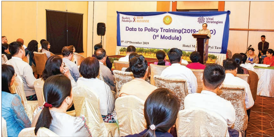
Union Minister Dr Myint Htwe delivers the opening speech at the opening ceremony of five-day course for the first module of Data to Policy Training (2019-2020) in Nay Pyi Taw yesterday.

THE MINISTRY of Health and Sports co-organizes a training course for data collection with the help of Data for Health Initiative supported by the Bloomberg Philanthropies.