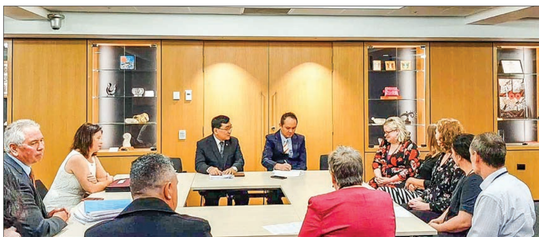
Union Minister Dr Win Myat Aye meets with officials from the Office for Disability Issues under the Ministry of Social Development in Wellington, New Zealand yesterday.

UNION MINISTER for Social Welfare, Relief and Resettlement Dr Win Myat Aye is paying a visit to New Zealand at the invitation of the Ministry of Foreign Affairs and Trade in Wellington.