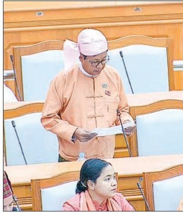
MP Dr Than Aung Soe.