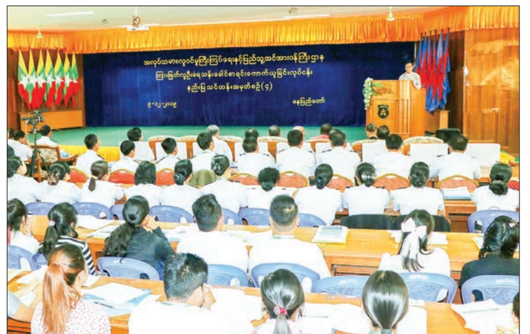
Union Minister U Thein Swe delivers the speech at the ceremony in Nay Pyi Taw yesterday.