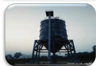
The construction of a 350-ton capacity silo for the long-term dry storage of rice was 100% completed on 16 February 2019.