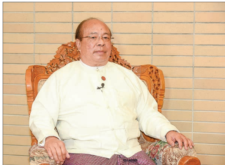
Union Minister U Thaug Tun.

The following interview is with U Thaug Tun, the Union Minister who heads the Ministry of Investment and Foreign Economic Relations and their efforts to develop the investment and economic sector in the one year since their formation.