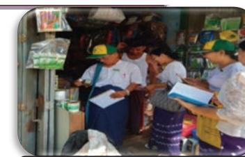
Inspection of Fertilizer, Pesticide and Seed Outlets