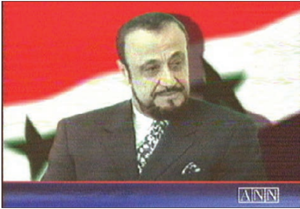
Rifaat al-Assad, uncle of Syrian President Bashar al-Assad, goes on trial in Paris for organised money laundering.

But the dock will be empty: the 82-year-old accused — younger brother of Syrian ex-president Hafez al-Assad — will miss the trial "for medi-