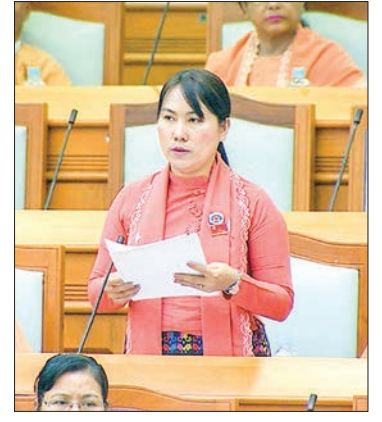
MP Daw Myat Thida Tun.

THE 13 th day meeting of the Second Pyidaungsu Hluttaw's 14 th regular session was held at the Pyidaungsu Hluttaw meeting hall yesterday morning.