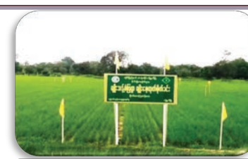
Groundnut Seed Farm in Kyauktaw Township