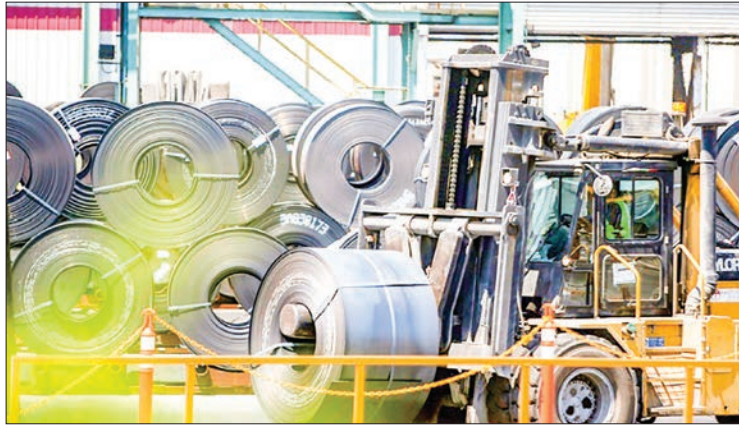
Mexico's Foreign Minister Marcelo Ebrard has said it will not accept a US proposal that 70 per cent of steel for automobile production come from the North American region.

Ebrard said the Mexican delegation will ask at the next