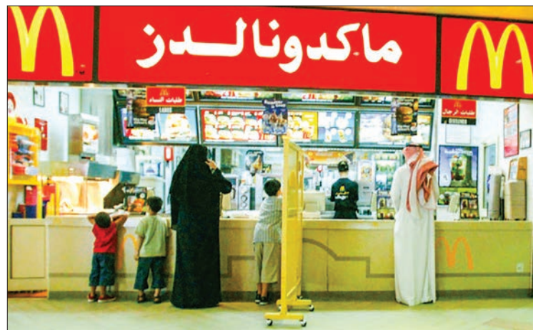
Saudi restaurants have long been segregated into a family section for customers accompanied by women and a singles area for men.

Until three years ago, the religious police elicited widespread fear in the kingdom, chasing men and women out of malls to pray and berating anyone seen mingling with the opposite sex. — AFP ■