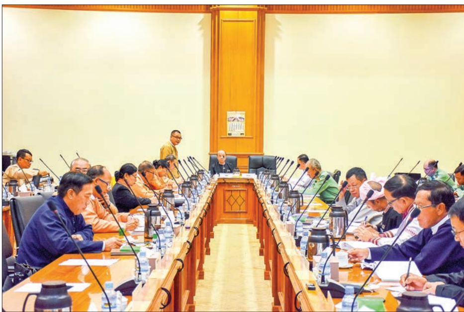
Meeting 66/2019 of Joint Committee on Amending the 2008 Constitution held in Nay Pyi Taw yesterday.

THE Joint Committee on Amending the 2008 Constitution held meeting 66/2019 at the meeting hall of Pyidaungsu Hluttaw Building D in Nay Pyi Taw yesterday.