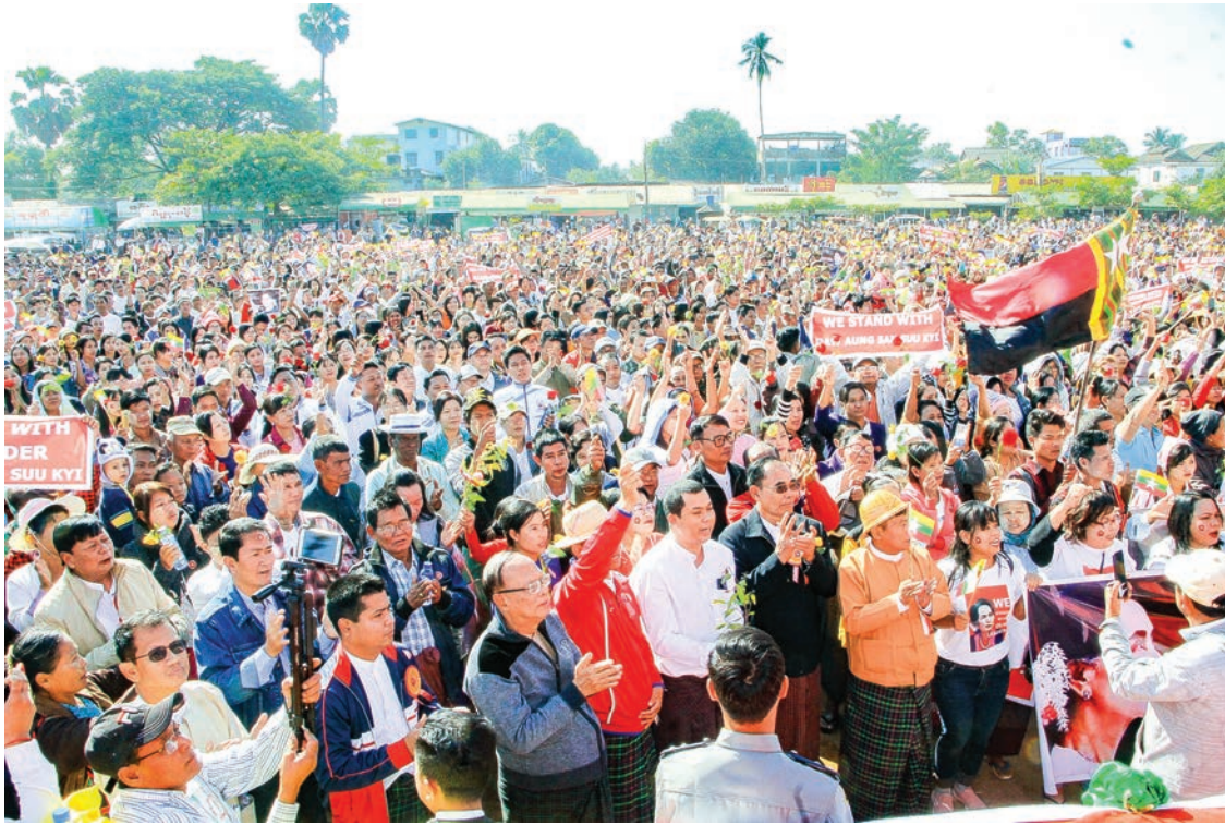
People hold the mass rally in Bago to support State Counsellor Daw Aung San Suu Kyi who will contest the case filed by the Gambia at the International Court of Justice (ICJ).

NATIONWIDE mass rallies were held yesterday in support of State Counsellor Daw Aung San Suu Kyi who will contest the case filed by the Gambia at the International Court of Justice (ICJ).