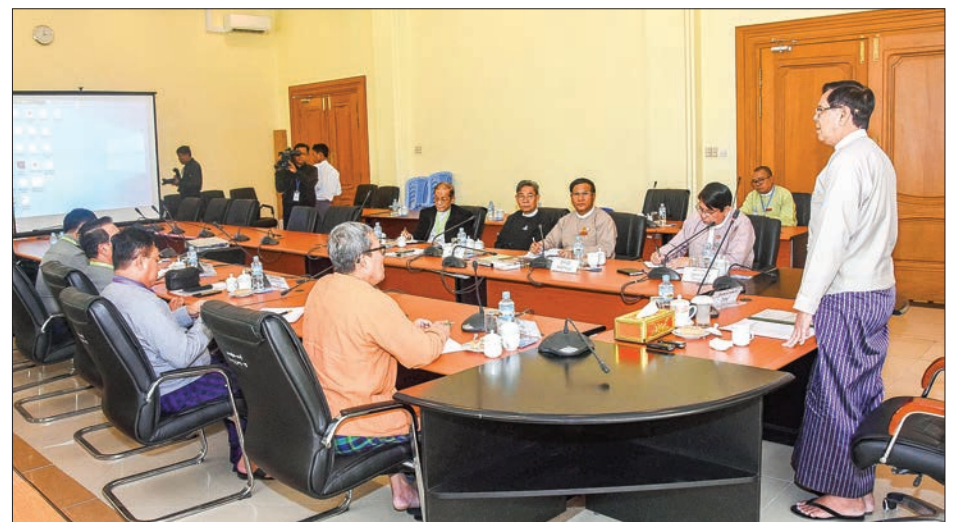
Chairman U Aye Tha Aung delivers the opening speech at the Rakhine State Stability Supporting Committee meeting at the Hluttaw's building in Nay Pyi Taw.