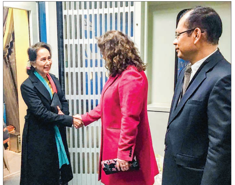
State Counsellor Daw Aung San Suu Kyi is welcomed by Ms Pascale Grotenhuis, the Director of Protocol Department of the Ministry of Foreign Affairs, at the Schiphol Airport.

THE Myanmar delegation led by the State Counsellor and Union Minister for Foreign Affairs Daw Aung San Suu Kyi left Nay Pyi Taw on 8 December morning for oral proceedings before contesting the case filed by Gambia to the International Court of Justice (ICJ) at The Hague, Netherlands.