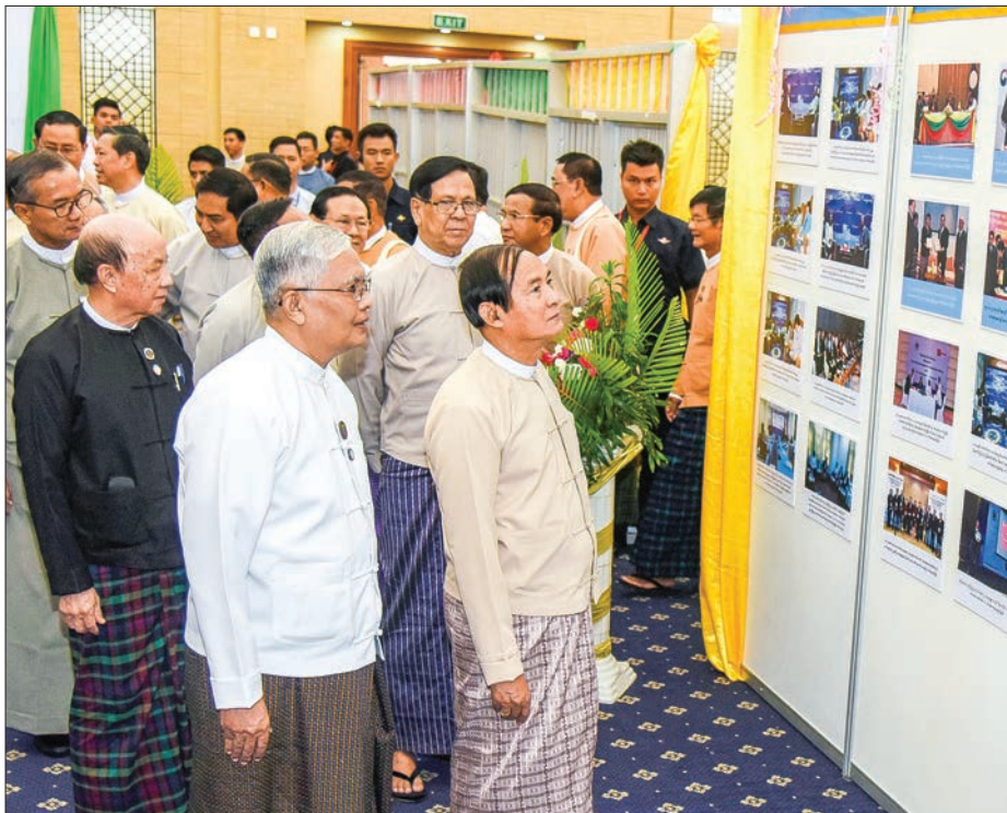
President U Win Myint looks at documentary photos displayed at the event to mark International Anti-Corruption Day in Nay Pyi Taw yesterday.

NAY Pyi Taw celebrated International Anti-Corruption Day at the Myanmar International Convention Centre-II yesterday morning and President U Win Myint delivered a keynote speech.