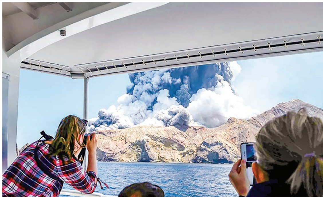
A photo courtesy of Michael Schade shows the volcano on New Zealand's White Island spewing steam and ash moments after it erupted. PHOTO: AFP