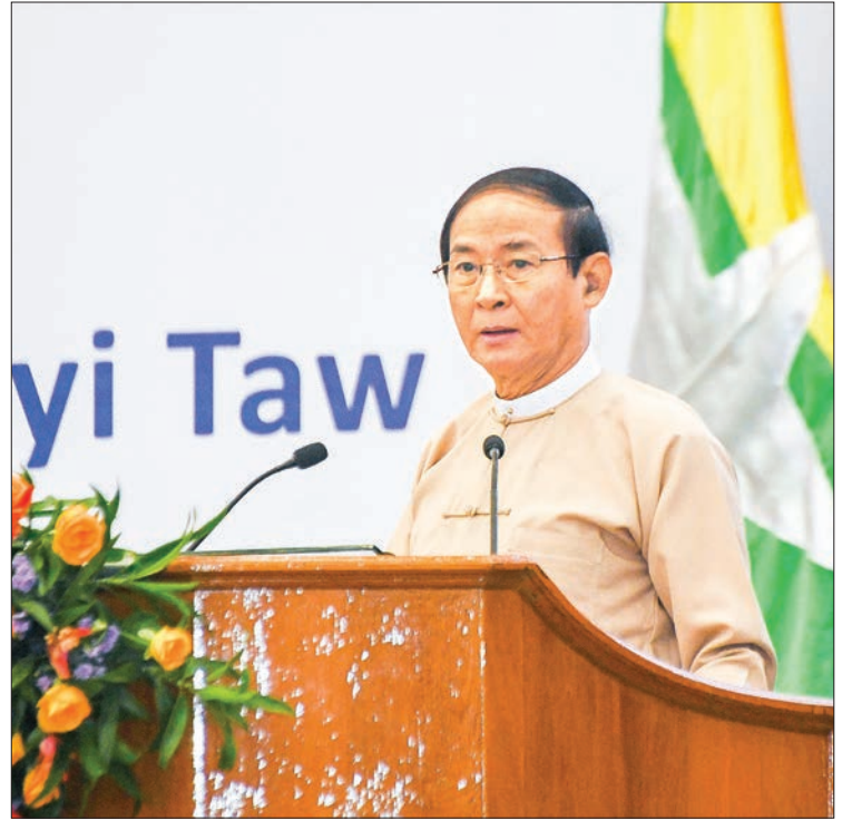
President U Win Myint addresses the event to mark the International Anti-Corruption Day at Myanmar International Convention Centre-II in Nay Pyi Taw yesterday.