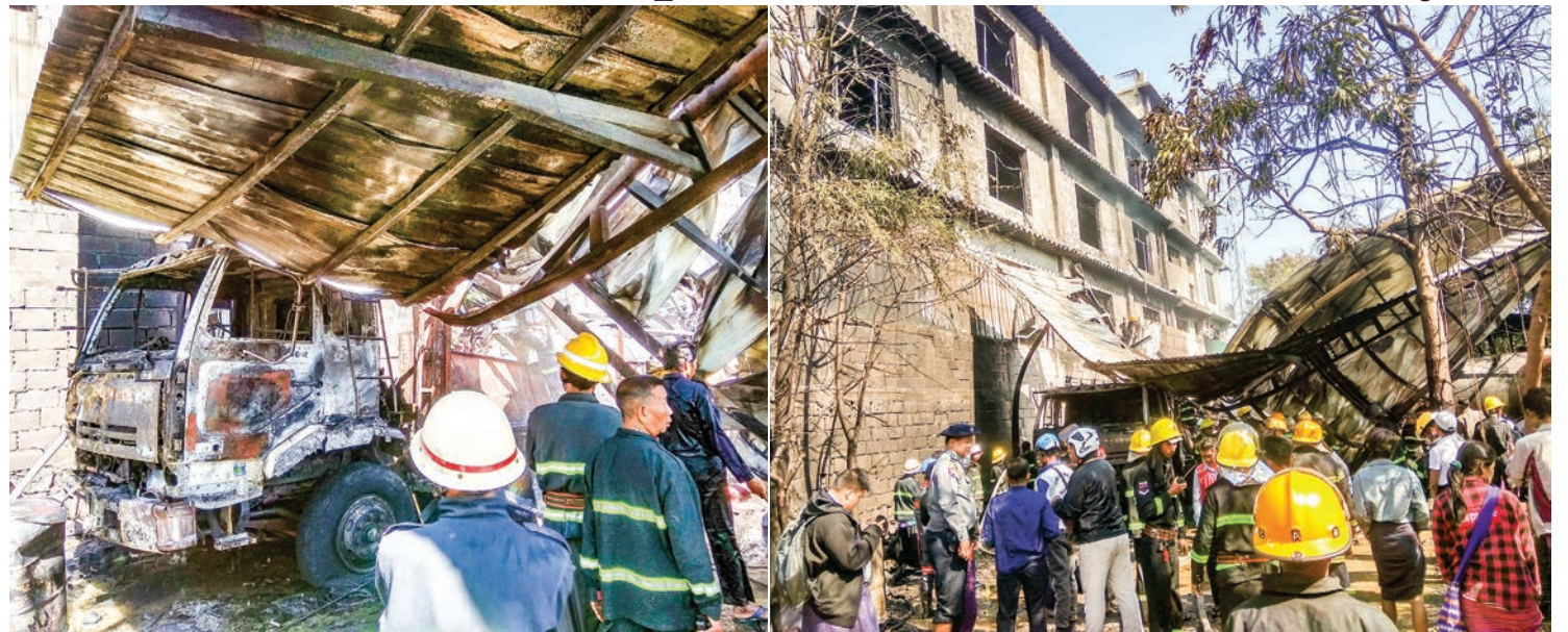
A 12-wheel truck carrying drums with octane fuel exploded while unloading octane fuel at a petrol station on Mandalay-Pyin Oo Lwin Road near Patheingyi Township.

A 12-wheeled truck caught fire while unloading octane fuel yesterday at a petrol station on the Mandalay-Pyin Oo Lwin Road in Thanmataw village-tract of Patheingyi Township. Two persons were injured in the mishap.