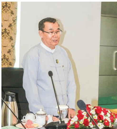
Union Minister for Natural Resources and Environmental Conservation U Ohn Win delivers the speech at the meeting to organize a gems emporium next month in Nay Pyi Taw.

Union Minister for Natural Resources and Environmental Conservation U Ohn Win, in his capacity as the chairman of central committee, presided over the meeting, with advices on successful