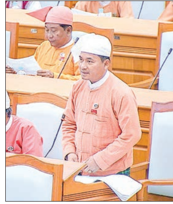
MP U Kyaw Soe Lin.