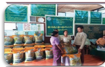
Provision of Monsoon Paddy Seeds in Thandwe Township