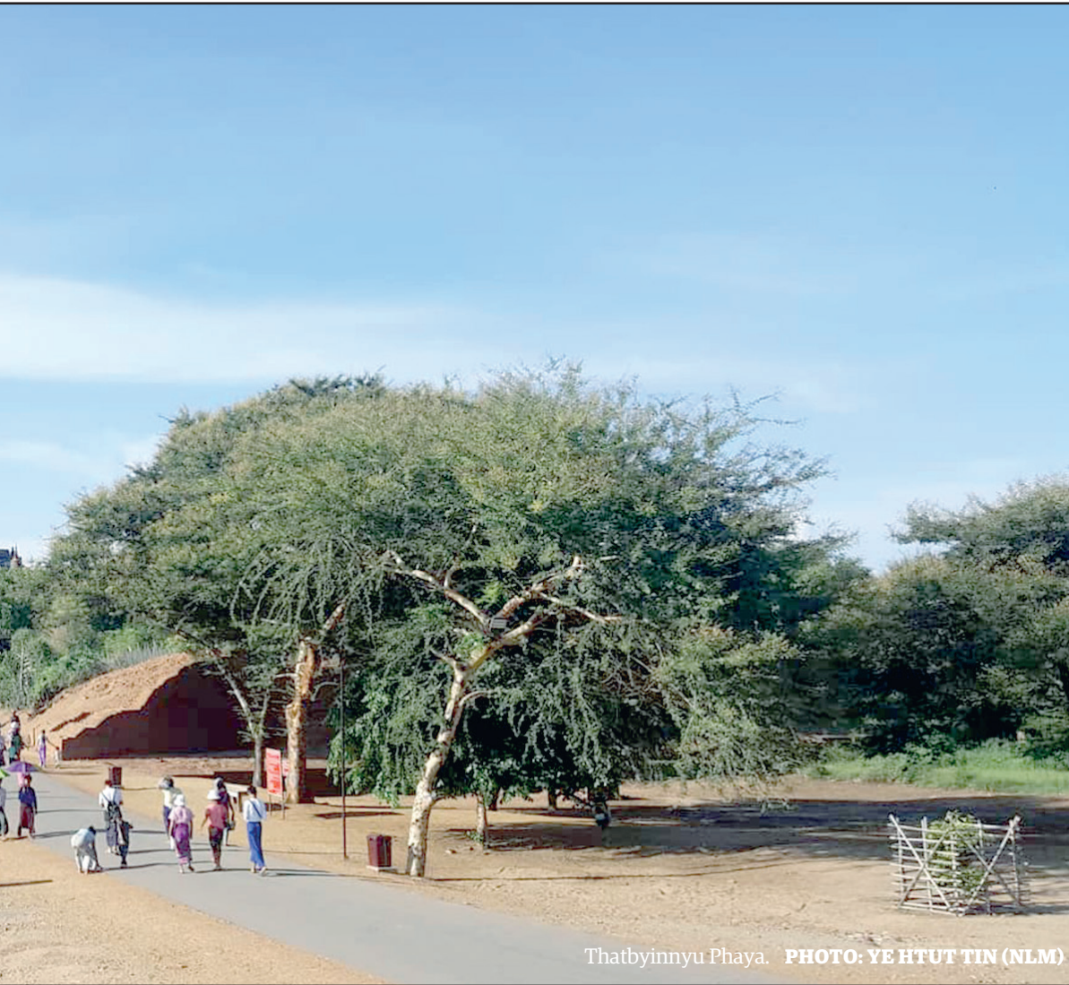
Thatbyinnyu Phaya.