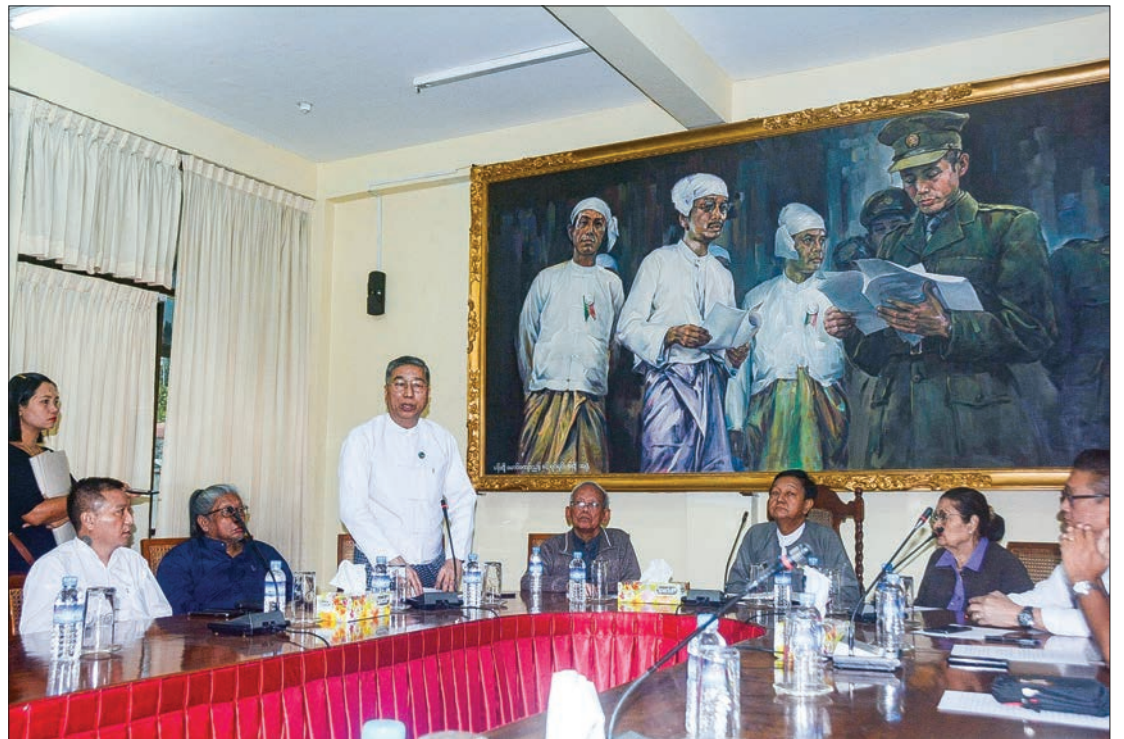
Officials hold the meeting to launch calendar with movie stars showing off fashion trends from four different eras.

The 20" x 30" calendar includes four pages and one cover page. It will be distributed at a cheap price to Myanmar movie lovers. The Myanmar Motion Picture Organization will mark its 100th anniversary on 13 October, 2020. The calendars are