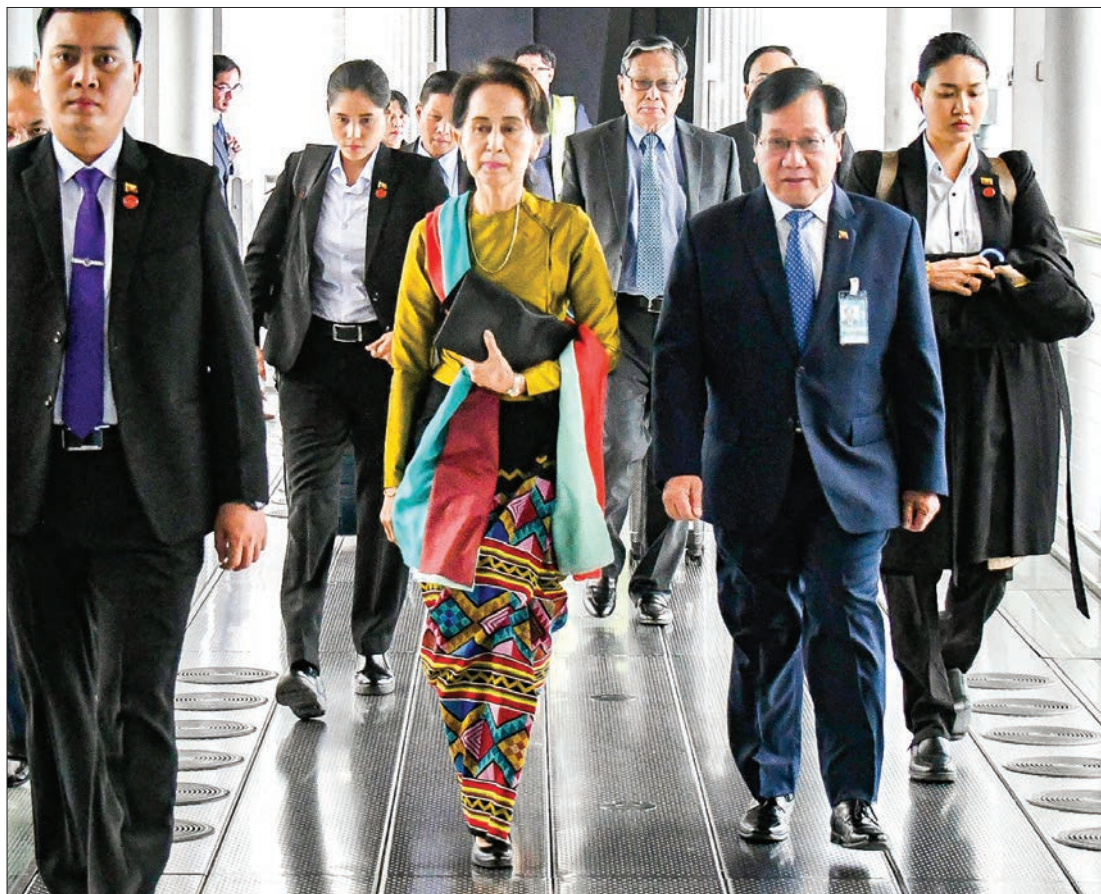
State Counsellor Daw Aung San Suu Kyi welcomed by Myanmar Ambassador to Thailand U Myo Myint Than, and officials at the Suvarnabhumi International Airport in Bangkok yesterday.