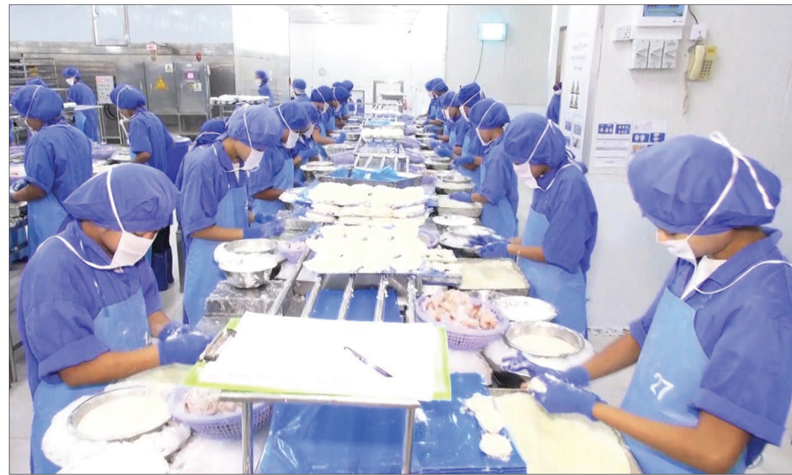
Female workers sorting fish at a cold storage factory.

Browsing the internet for further statistics on investments in Myanmar in the Agriculture, Livestock Breeding & Fishery Sectors, it was surprising to learn that up to now the total number of investments in the sectors were 17 establishments only while that in the Industry