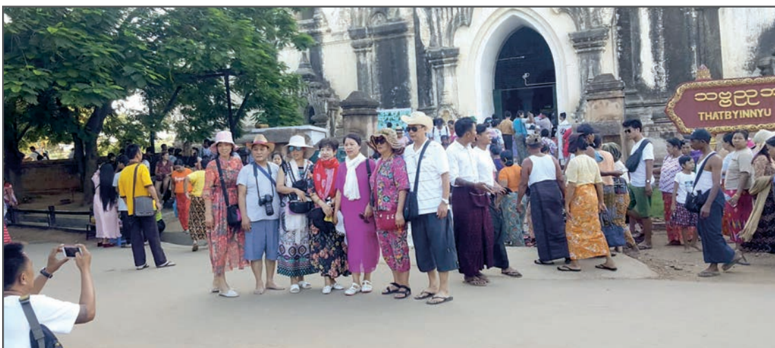
Chinese tourists pose for photo at Thatbyinnyu Pagoda.

“Arrival of Chinese visitors and travellers from some countries that Myanmar has given visa free entry saw a boost significantly,” he said. Arrival of Chinese tourists to Myanmar is up by nearly 70 per cent than previous year thanks to Myanmar’s visa-on-arrival allowance to visitors from six more countries commencing 1 October last year. Due to the sharp inflow of Chinese visitors to Myanmar this year, Myanmar authorities are exerting efforts to further expand travel routes and promote the tourism industry by attracting global airlines to the country.