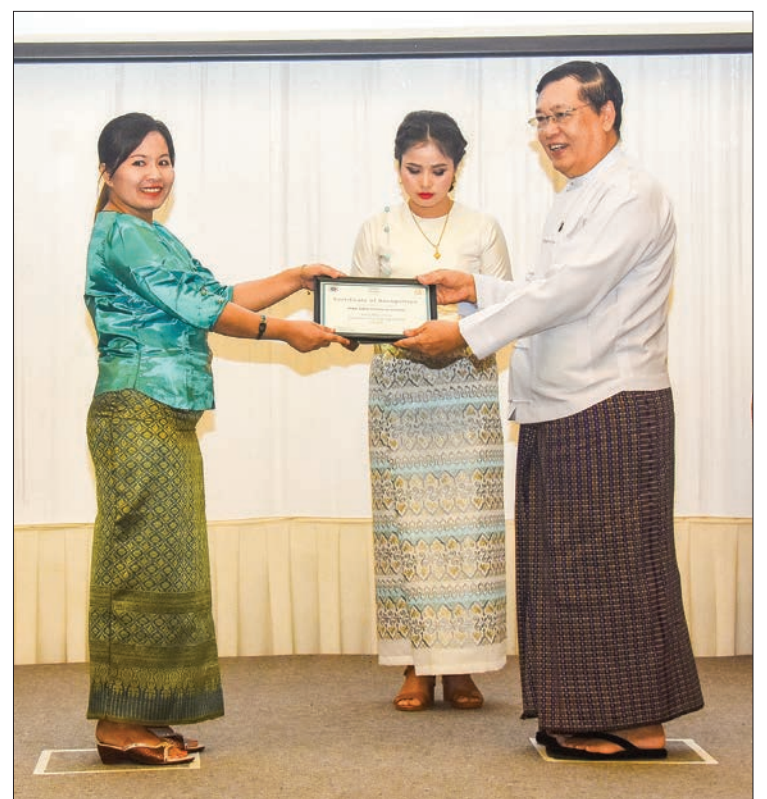
Union Minister U Thein Swe presents the Certificate of Recognition to the official from Shwe Sagar Company Limited.