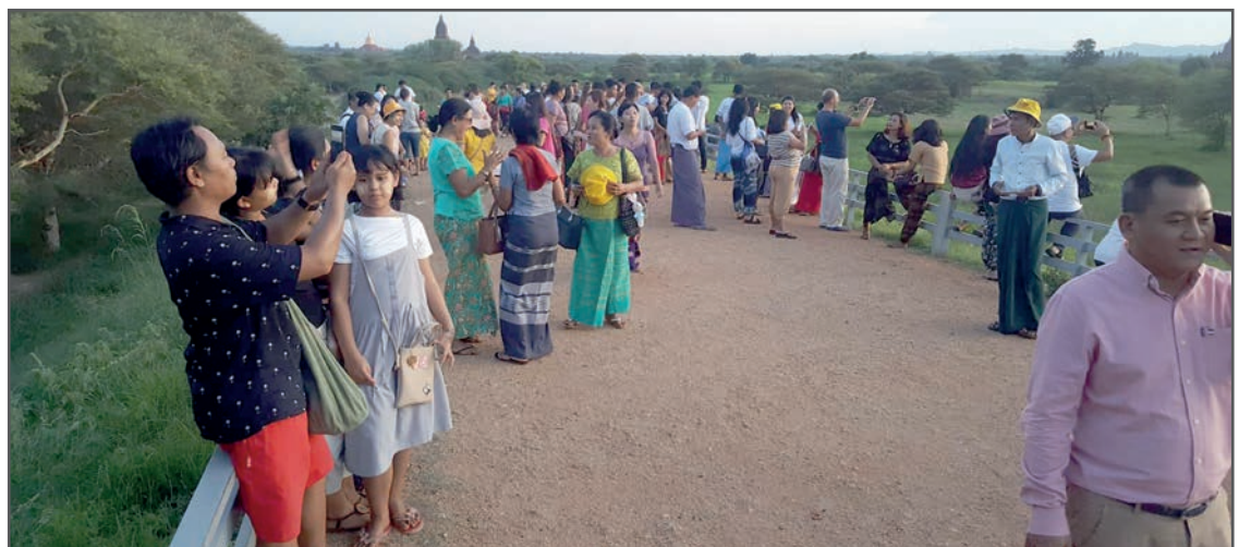
Tourists enjoy in sunset at the Bagan.