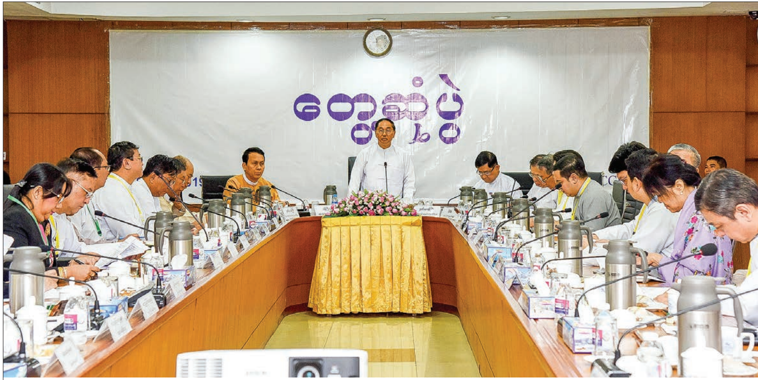
Vice President U Myint Swe addresses the 31 st meeting with Myanmar entrepreneurs at the Union of Myanmar Federation of Chambers of Commerce and Industry office in Yangon yesterday.

T HE Private Sector Development Committee held the 31 st meeting with Myanmar entrepreneurs at the Union of Myanmar Federation of Chambers of Commerce and Industry (UMFCCI) office in Yangon yesterday morning.