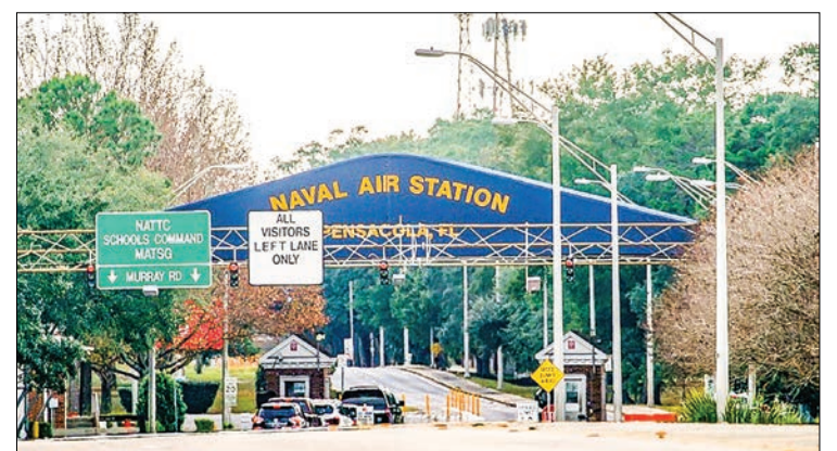
No terror group immediately claimed the deadly attack carried out by a Saudi military trainee at Naval Air Station Pensacola in Florida.

The Twitter account that posted the manifesto – which also condemned US support for Israel and included a quote from Al-Qaeda’s deceased leader Osama bin Laden – has been suspended.—AFP ■