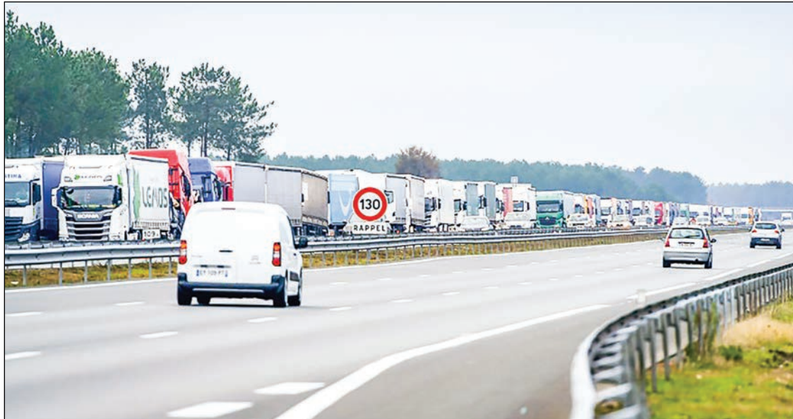
Commuters will struggle to get to work on Monday and more giant nationwide protests are planned for Tuesday.

PARIS—French President Emmanuel Macron will on Sunday meet ministers involved in his radical pension reform which has prompted a nationwide strike and brought key transport services to a standstill.