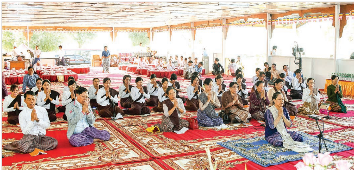
The congregation led by First Lady Daw Cho Cho hold the religious ritual at the Eternal Peace Pagoda.