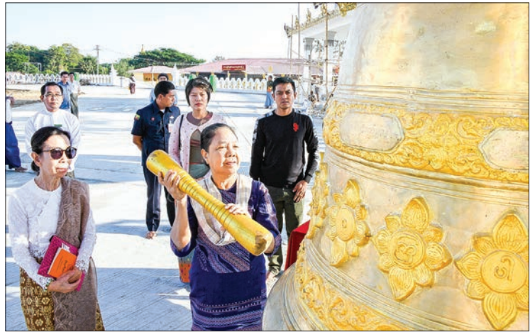
First Lady Daw Cho Cho strikes the Great Bell at the Eternal Peace Pagoda in Nay Pyi Taw yesterday.