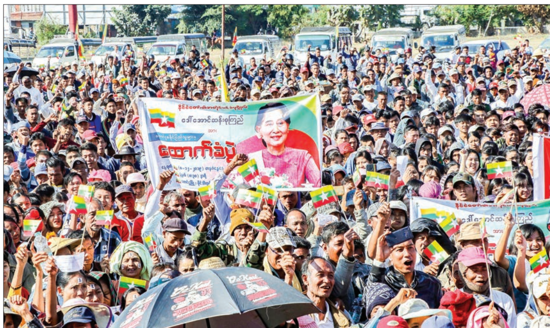
The mass rally in Toungoo supports State Counsellor Daw Aung San Suu Kyi who will contest the case filed by Gambia at the International Court of Justice.

A mass rally was held in Toungoo, Bago Region, yesterday to support State Counsellor Daw Aung San Suu Kyi who will contest the case filed by Gambia at the International Court of Justice-ICJ.