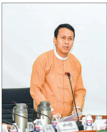
Yangon Region Chief Minister U Phyo Min Thein.