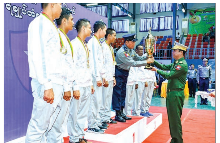
Winners are awarded with trophy at the awarding ceremony.