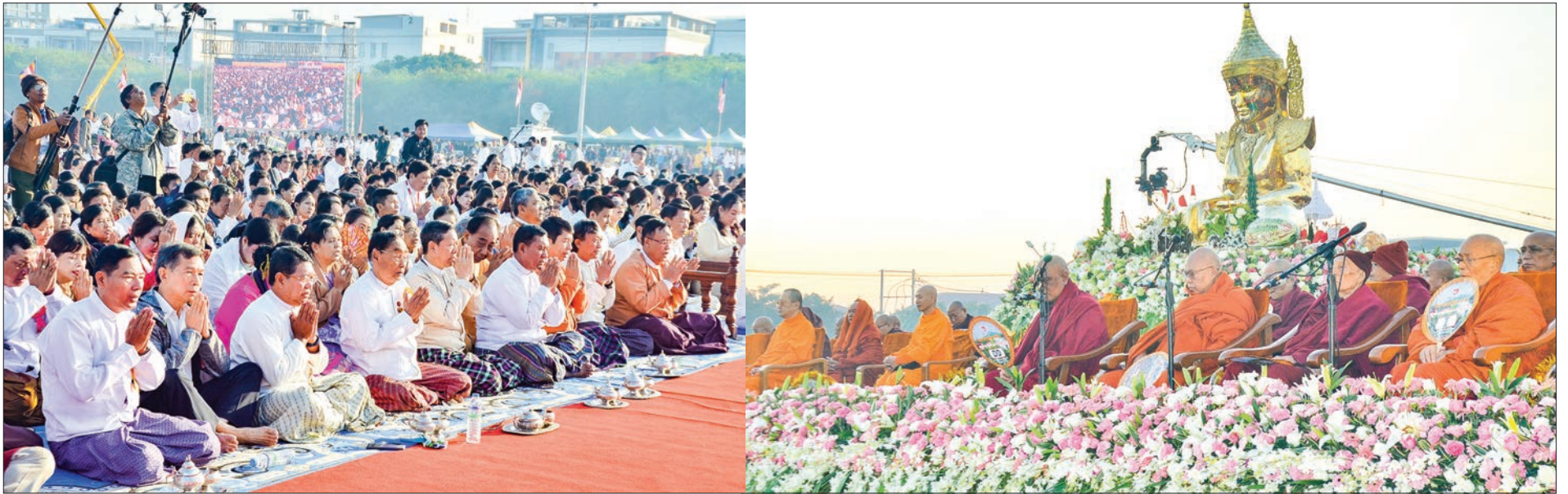
Officials, donors and well-wishers led by Union Ministers Dr Myo Thein Gyi and Nai Thet Lwin attend the third mass alms-giving ceremony for 30,000 monks at the Chanmyathazi Airport in Mandalay yesterday.

SUPERVISED by Mandalay Region Government, Myanmar well-wishers and Thailand's Dhammakaya Foundation jointly organized third mass alms-giving for 30,000 monks at the Chanmyathazi Airport in Mandalay yesterday.