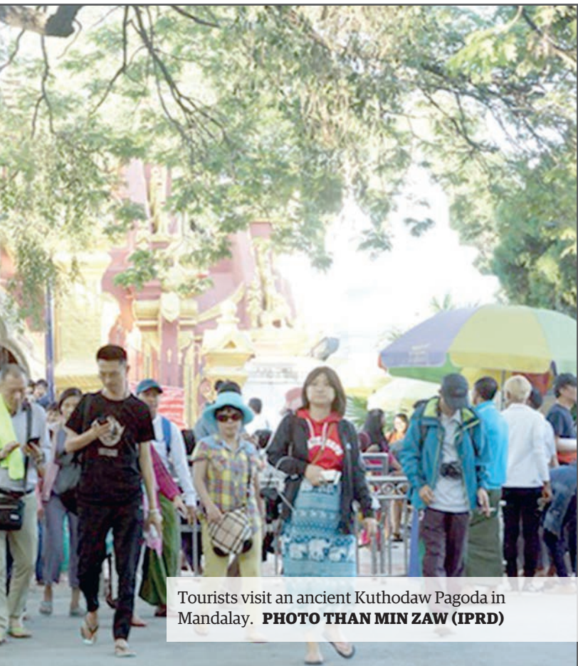
Tourists visit an ancient Kuthodaw Pagoda in Mandalay.