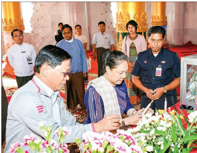
First Lady Daw Cho Cho lights candles in front of Buddha Image at the Eternal Peace Pagoda.