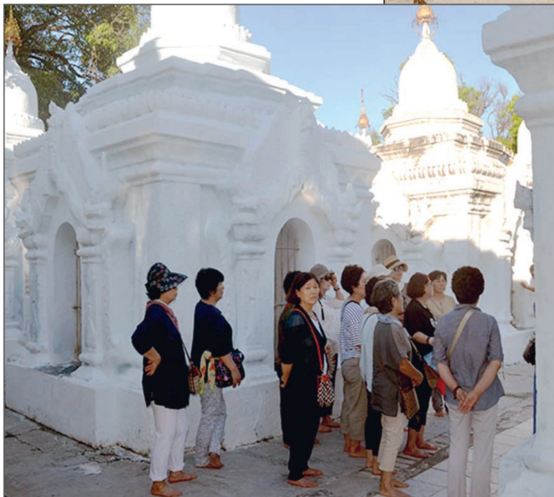
Chinese tourists seen at a pagoda in Mandalay.

ing the biggest source of visitors, according to the statistics from Directorate of Hotels and Tourism (DOHT), under the Ministry of Hotels and Tourism. The total number of international travelers rose around 50,000 when compared to the same period last year. Mandalay Region welcomed 490,000 foreigners in the same period of the previous year.