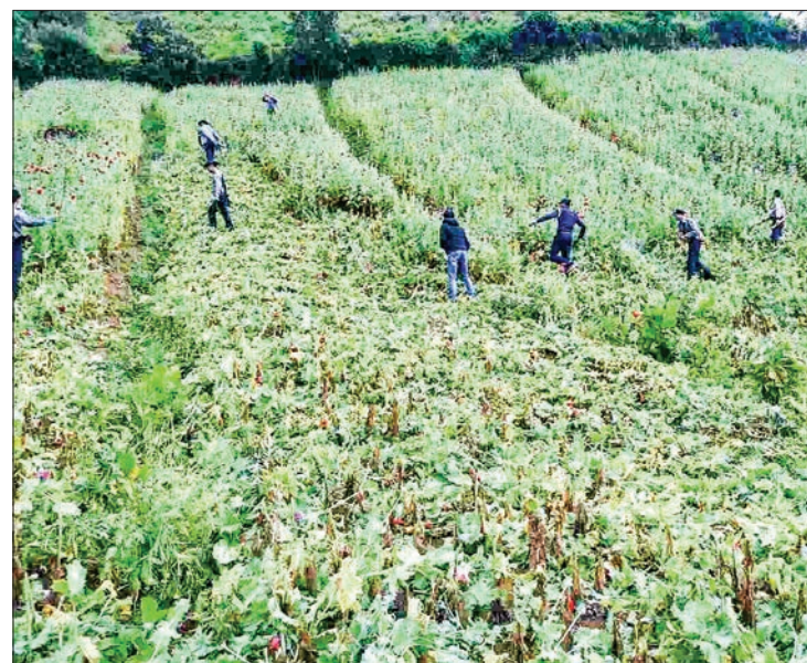
Police destroying the opium plantations in Shan State.