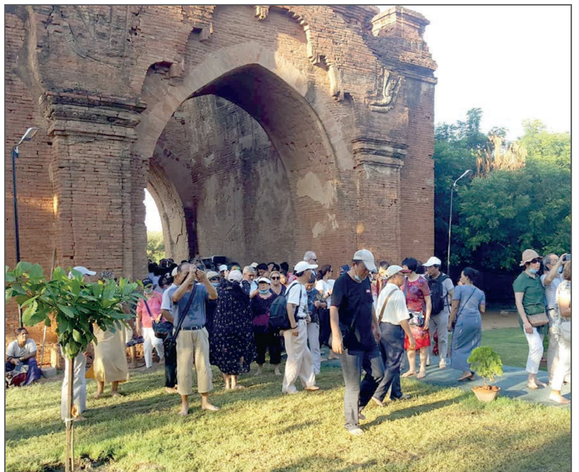
Tourists visit an ancient pagoda in Bagan.