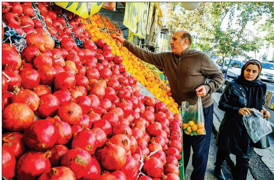
The Islamic republic has suffered a sharp economic downturn this year, with a plummeting currency sending inflation skyrocketing.

TEHRAN—Iran's President Hassan Rouhani announced Sunday a "budget of resistance" against US sanctions targeting the country's vital oil sector, backed by a $5 billion Russian investment. Rouhani said the aim was to reduce "hardships" in the Islamic republic where a sharp fuel price hike last month triggered nationwide demonstrations that turned deadly. The US sanctions imposed last year in a bitter dispute centred on Iran's nuclear programme include an embargo on the oil sector whose sales Washington aims to reduce to zero in a campaign of "maximum pressure". Iran has suffered a sharp economic downturn, with a plum-