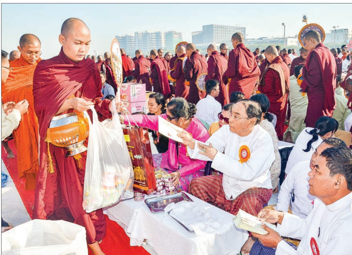
Union Minister Nai Thet Lwin and officials donate offertories to the Members of Sangha at the alms-giving ceremony.

Requisites and donated offertories to the monks.