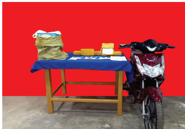
Photo shows seized stimulant tablets and a vehicle and a motorcycle in Nawngkhio.