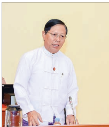
Union Minister Thura U Aung Ko.

dia in November and during the call, Mr Hun Sen expressed his willingness to operate a direct air-link between the two famous ancient cities of Bagan and Siem Reap. The new air link is not aimed at just development of tourism but also for strengthening the friendly relations between Myanmar and Cambodia, said the vice president.—MNA (Translated by Kyaw Zin Lin)