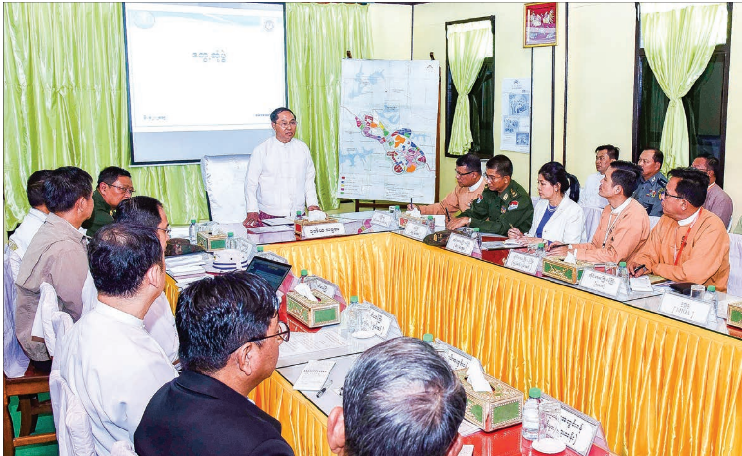
Vice President U Myint Swe delivers the speech during the meeting with the officials at the Mawtaung border trade centre in Taninthayi Township, Myeik District, yesterday.

V ICE President U Myint Swe, in his capacity as Chairman of the Illegal Trade Eradication Steering Committee, visited Htikhee border trade centre in Dawei Township, Dawei District, and Mawtaung border trade centre in Taninthayi Township, Myeik District yesterday.