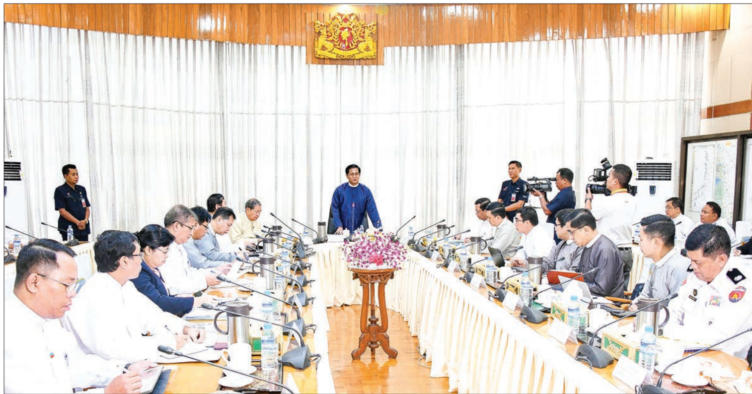
Vice President U Henry Van Thio delivers the speech at the third meeting of Digital Economy Development Committee in Nay Pyi Taw yesterday.

Developing a digital economy is more than just establishing new tech companies or producing software and hardware for sale. It involves adapting or employing digital technology to existing sectors such as agriculture, livestock, manufacturing and SMEs. It also encompasses promoting digital literacy among the public in order to facilitate better use of information and technology, said the Vice President.