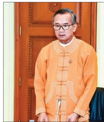
Union Minister U Ohn Maung.