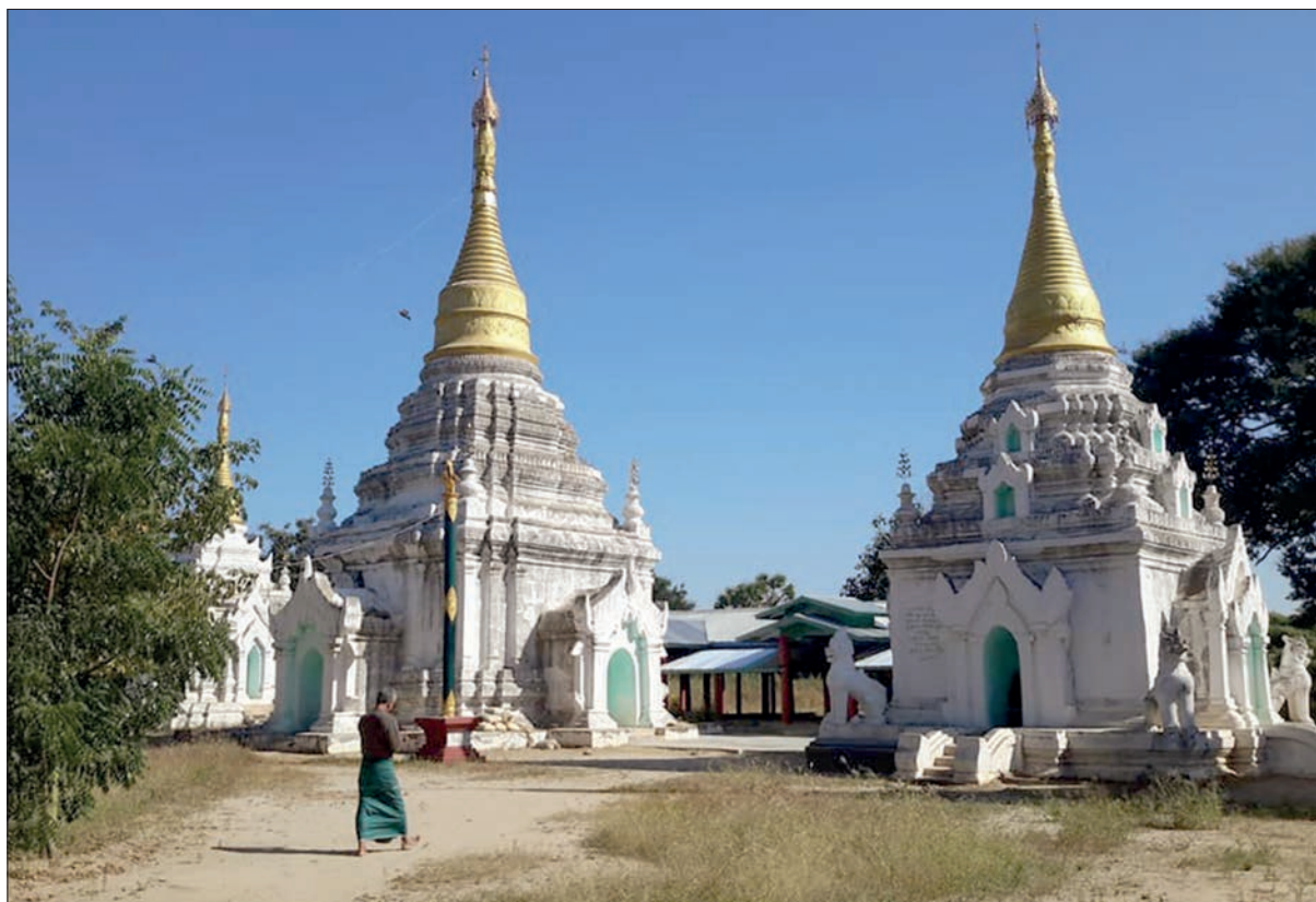
The Four-Sister Pagoda.