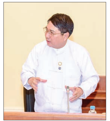
Deputy Minister U Khin Maung Win.