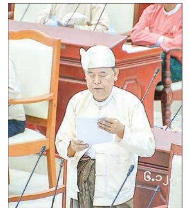
Deputy Minister for Education U Win Maw Tun.