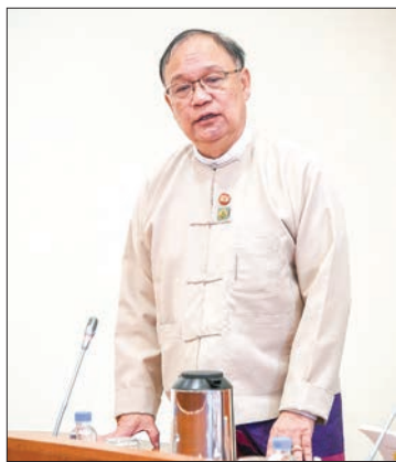
Union Minister U Thant Sin Maung.