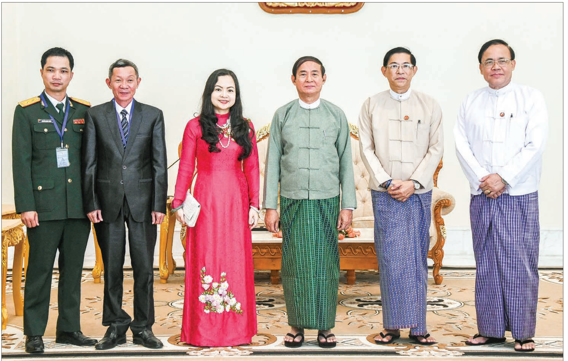
President U Win Myint and a delegation led by Vietnamese Ambassador Dr Luan Thuy Duong pose for a photograph at the Presidential Palace in Nay Pyi Taw yesterday.

P RESIDENT U Win Myint received Ambassador of Viet Nam Dr Luan Thuy Duong who has completed her tour of duty at the Presidential Palace in Nay Pyi Taw yesterday.