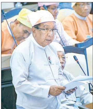
Union Minister for Construction U Han Zaw.

The meeting starts with question and answer session