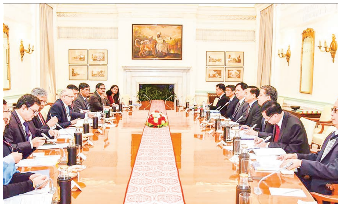
Permanent Secretary of the Ministry of Foreign Affairs U Soe Han and Foreign Secretary of the Ministry of External Affairs of India Mr Vijay Gokhale attend the 18 th round of Myanmar-India Foreign Office Consultations (FOC) at the Hyderabad House in New Delhi on 6 December 2019.

At the Foreign Office Consultations, both sides cordially discussed a wide range of matters pertaining to the promotion of bilateral relations and cooperation, exchange of high level visits, boundary matters and border cooperation, security and defence cooperation, development of ongoing projects in Myanmar, trade and commerce matters, implementation of agreements and Memoranda of Understanding signed between