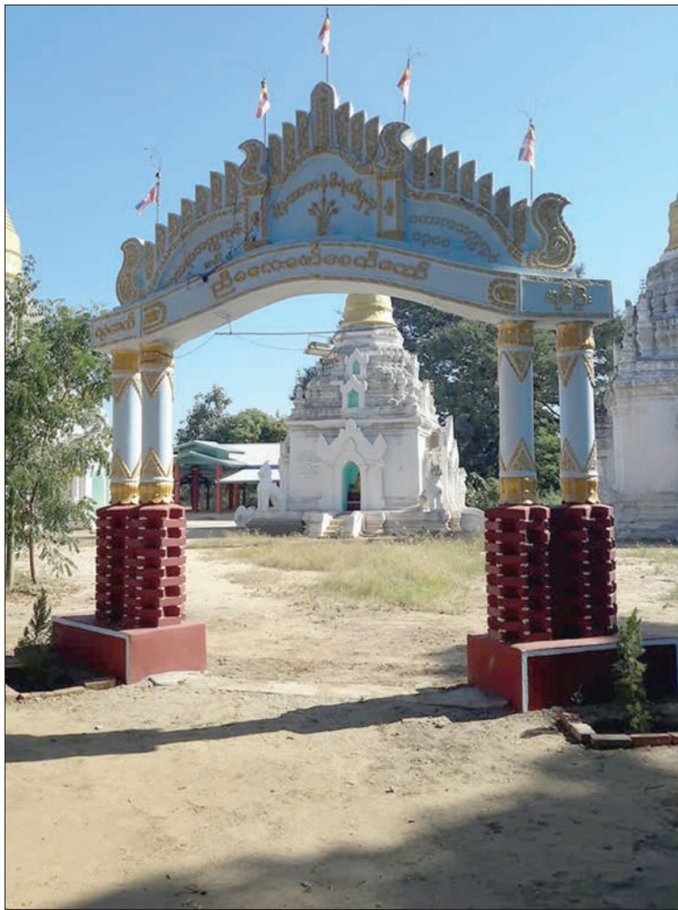
The entrance to the Four-Sister Pagoda.

King Swa Saw Ke who came onto the throne in Inwa in 1368 AD ordered his brother Pyay governor Saw Yan Naung to build seven monasteries made of magnolia, one of which was located in Myitchay. It was built in 1394 AD, and the land for religious purpose was set four square miles. Some assumed the monastery made of magnolia donated by King Swa Saw Ke was the currently damaged Tawshwe Monastery, two