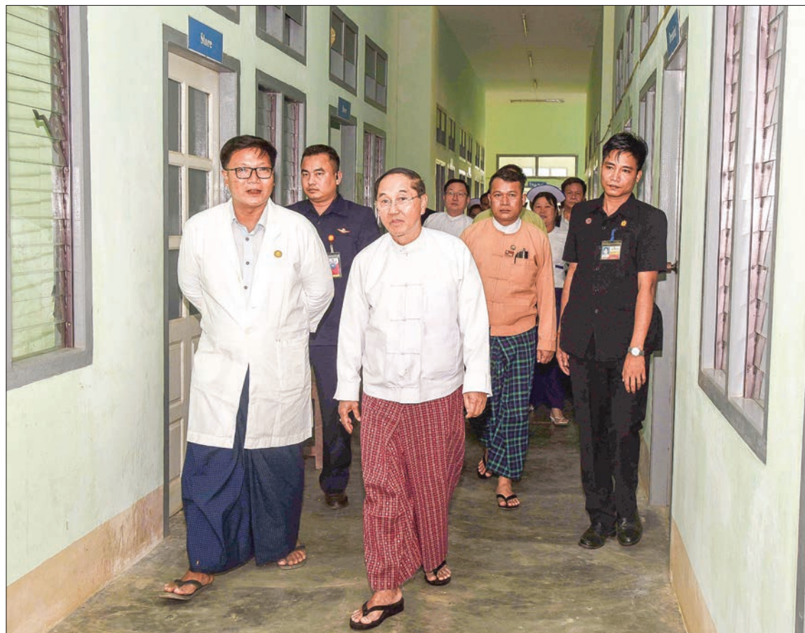
Vice President U Myint Swe visits the 16-bed Mawtaung cottage hospital in Taninthayi Township, Myeik District yesterday.