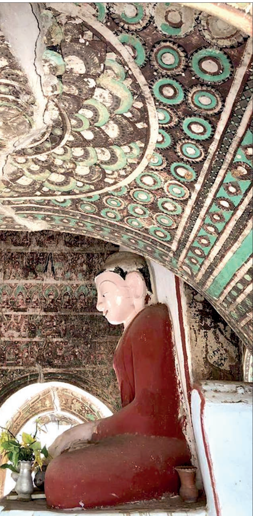
Nyaungyan era mural paintings.

Vesantara, Nemi and Temiya Jatakas. Moreover, mural paintings showed the hells related to Temiya and Nemi Jatakas.