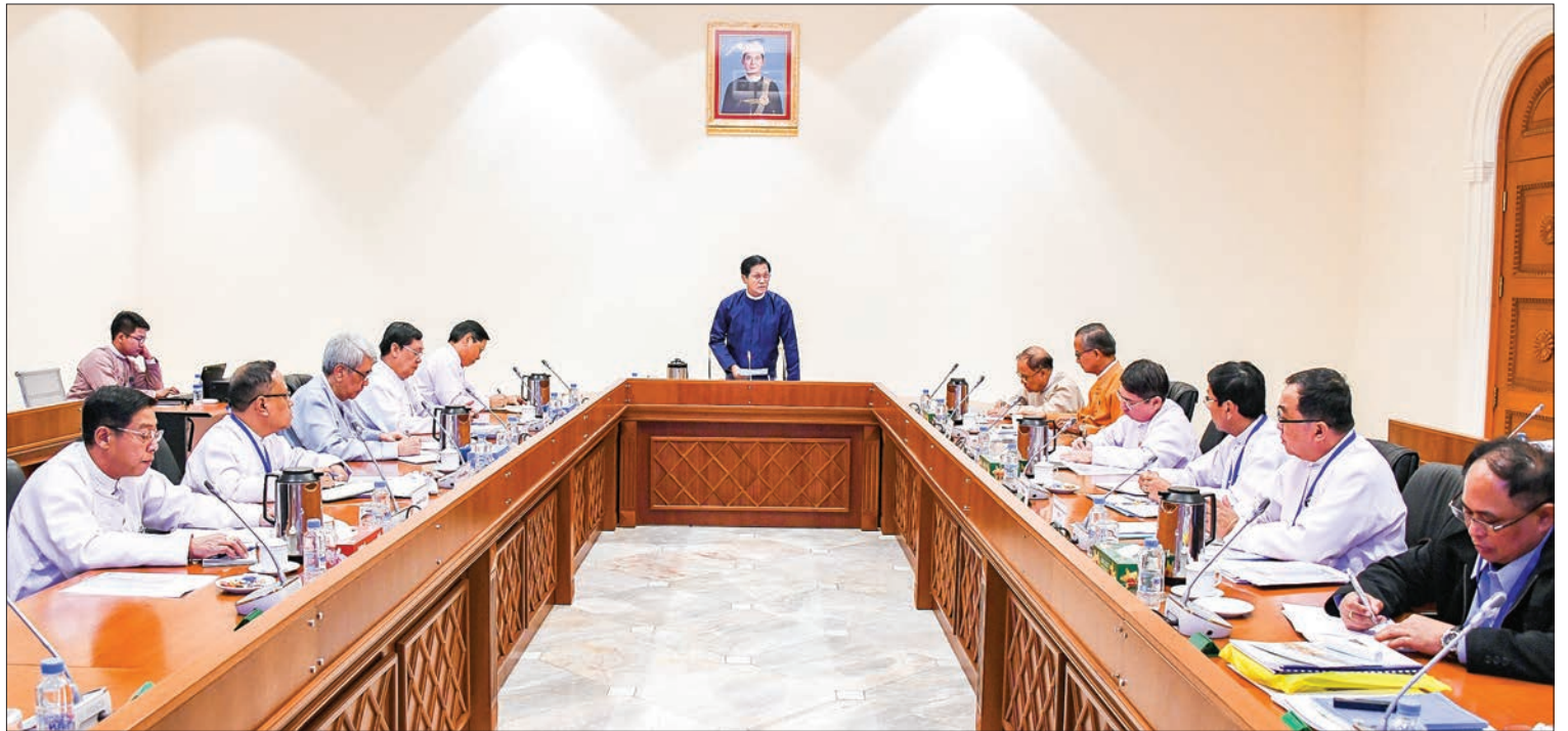
Vice President U Henry Van Thio delivers the speech during the National Tourism Development Central Committee meeting in Nay Pyi Taw yesterday.

When the Cambodian deputy prime minister visited Myanmar