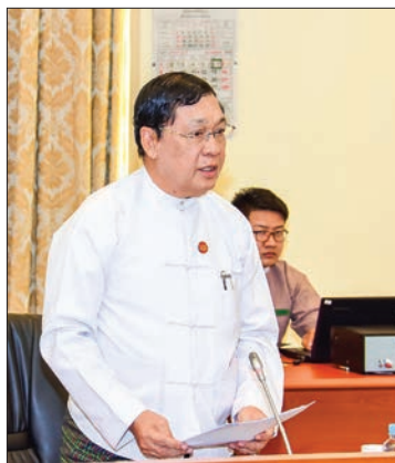
Union Minister U Thein Swe.