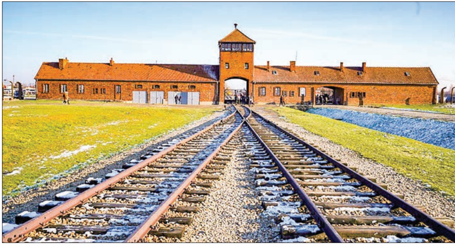
Merkel will become only the third German chancellor ever to visit Auschwitz.

She also hailed a new 60-million-euro ($66-million) donation for the