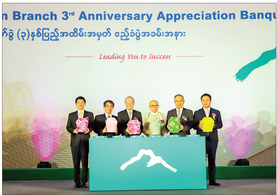
An event to mark the 3 rd anniversary of E.SUN Bank (Yangon branch) held in Yangon yesterday.

Currently, E.SUN Bank operates 28 overseas branches in nine countries or areas.