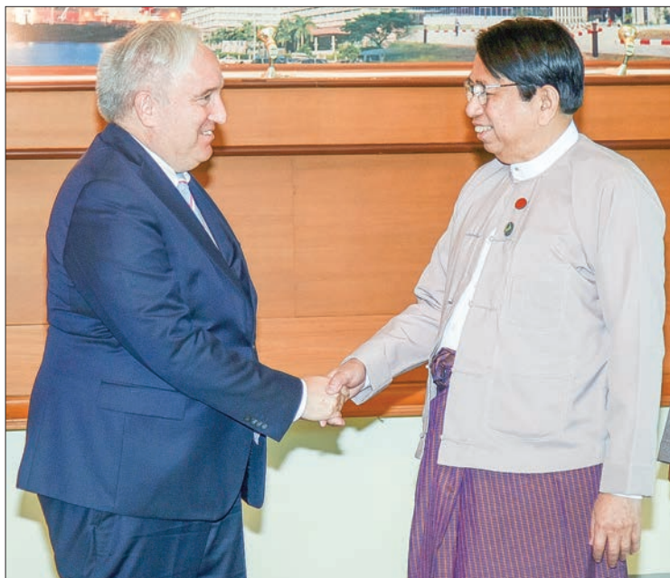
Union Minister Dr Pe Myint shakes hands with Ambassador of Turkey Mr Kerem Divanlioglu in Nay Pyi Taw yesterday.