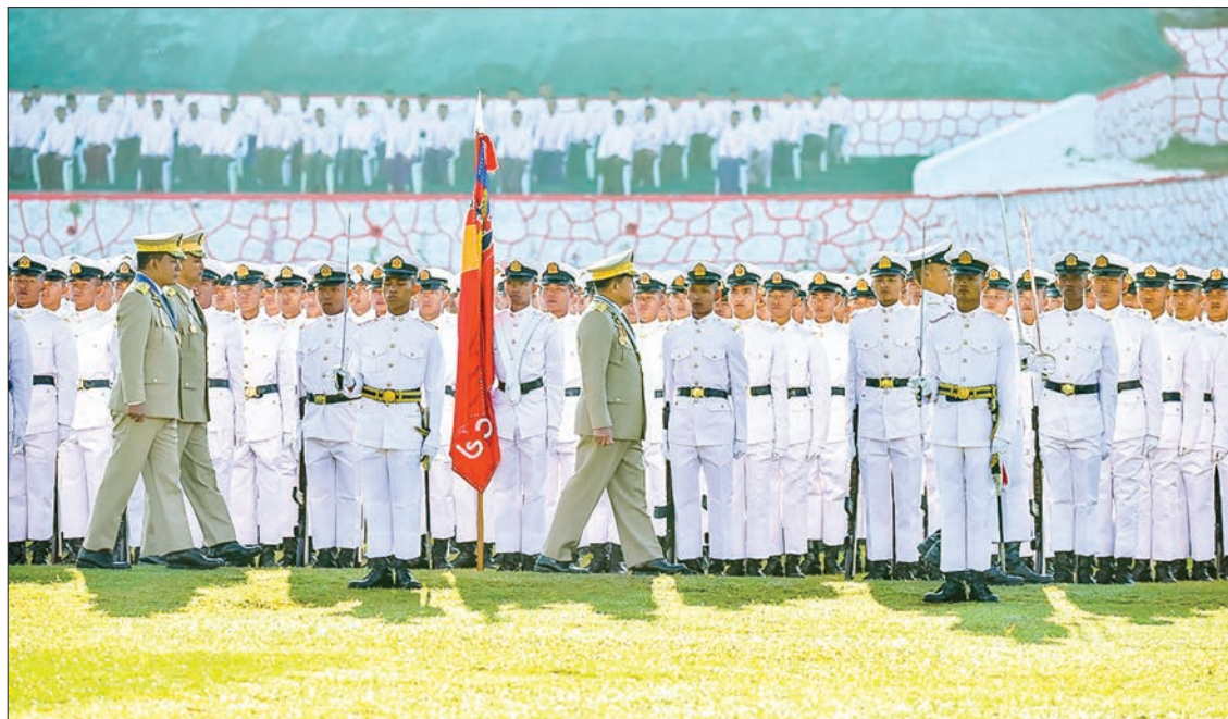
Senior General Min Aung Hlaing inspects graduation parade of the cadets of 61 st Intake of the DSA in Pyin Oo Lwin.

The Senior General said that while the nation has all the natural resources essential for a country, it still needs resources to ensure peace and the long armed conflicts in the country have to be quelled completely to establish a modern, developed and united country. He said the Tatmadaw is working not just for immediate peace, but for everlasting peace and stability. He said the peace