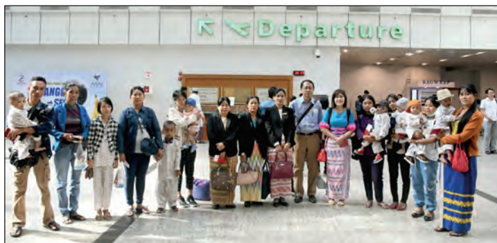
Children diagnosed with congenital heart defects and their families seen at the Yangon International Airport before departing for China.