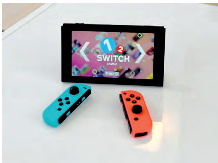
The Nintendo Switch is a hugely popular console around the world, helped by family-friendly games.

China in 2014 began easing a more than decade-long ban on consoles imposed out of concern over the negative impact gaming may have on children.—AFP ■