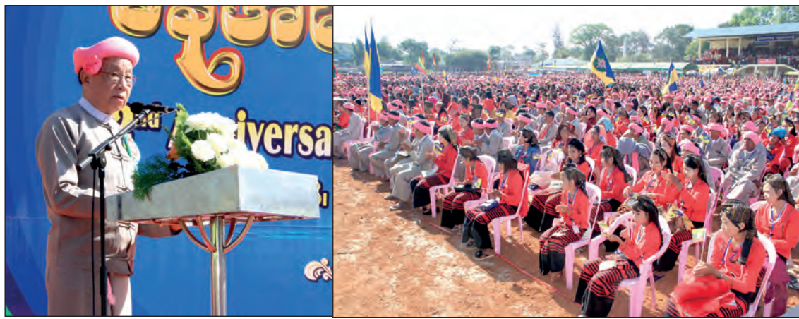
Union Minister Nai Thet Lwin delivers the speech at the celebration for 2 nd Anniversary of Danu National Day in Nawngkhio, Shan State yesterday.

THE 2 nd Danu National Day was commemorated in Shan State's Nawngkhio Town yesterday morning.