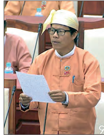
MP U Kyaw Aung Lwin.