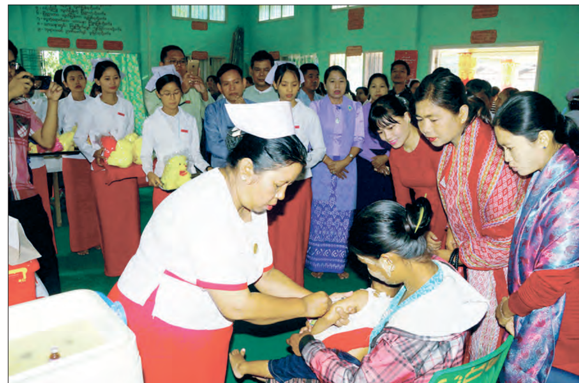
The vaccination program has been a major factor in the improvement of health standards.

The ministry administered extra dose of inactivated polio vaccine (IPV) against measles and -German measles to about 570,000 children between nine months and five and a half years from 26 to 28 November. In this way Myanmar can control the occurrence of measles and inborn