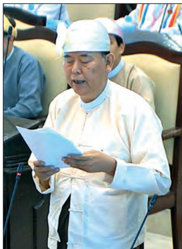
Deputy Minister U Win Maw Tun.

The meeting starts with a question and answer session where Deputy Minister for Education U Win Maw Tun responded to a question by U Khin Maung Latt of Rakhine State constituency 3 on a plan to construct a new two-storey building for Yathedaung Township Pyuchaung Village basic education sub-high school. Questions raised by Dr Zaw Lin Htut of Mon State constituency 9 on