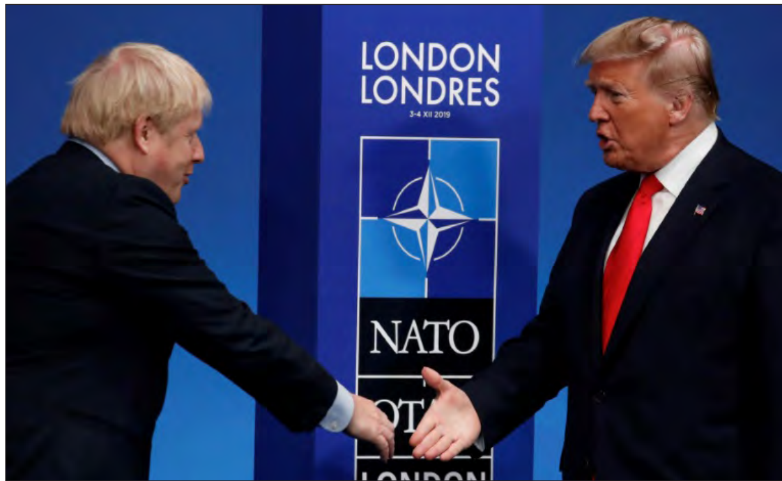
Arriving for the formal NATO talks on Wednesday, Boris Johnson denied he was trying to avoid being seen with Donald Trump.

In a press conference on Tuesday, the president promised to "stay out" of the election cam-