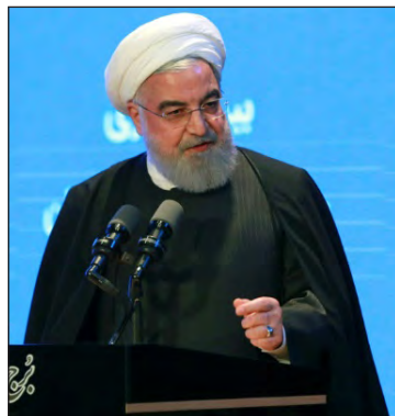
President Hassan Rouhani has long demanded the lifting of US sanctions in exchange for Iran's return to talks on its nuclear programme.

It is a rise many Iranians can ill afford in a country whose sanctions-hit economy is expected to contract by 9.5 per cent this year.