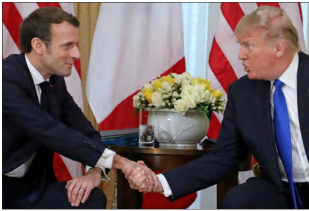
US President Donald Trump and France's Emmanuel Macron held a meeting ahead of a NATO summit in London.

"I'm confident that we will be able to find a solution to the issue related to the updating the revised defence plans," he said as he arrived for the summit at a luxury golf hotel in Watford, on the outskirts of London.—AFP ■