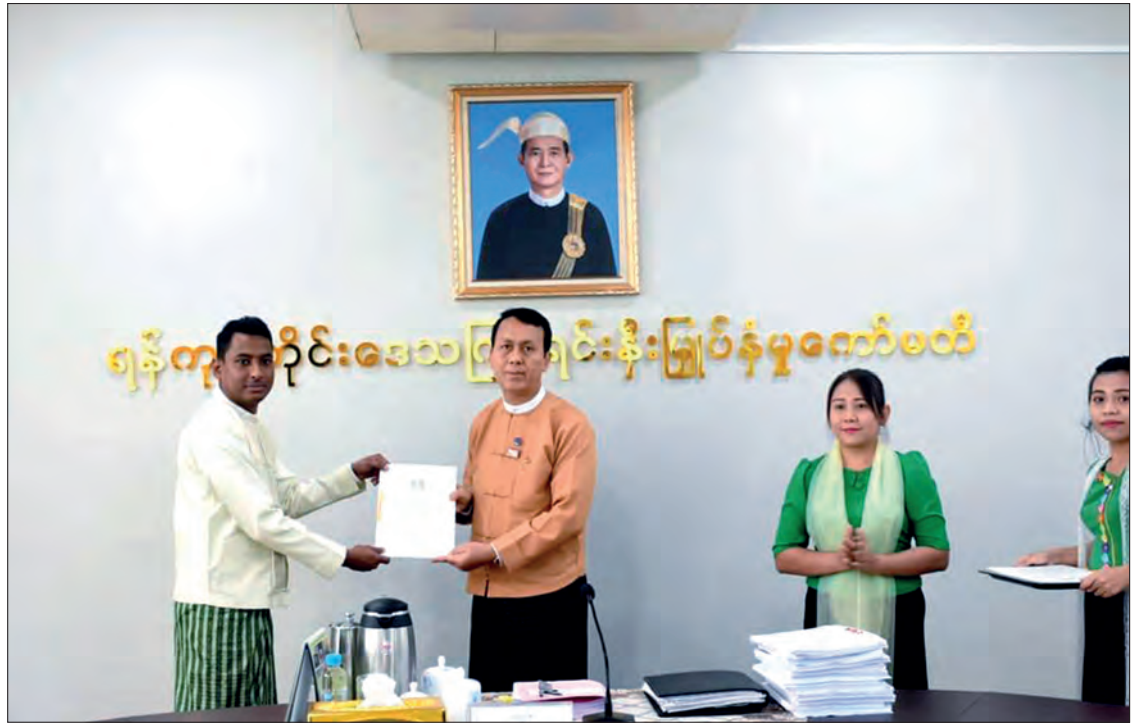
Yangon Region Chief Minister U Phyo Min Thein presents the permission to a responsible person of the FDI projects.