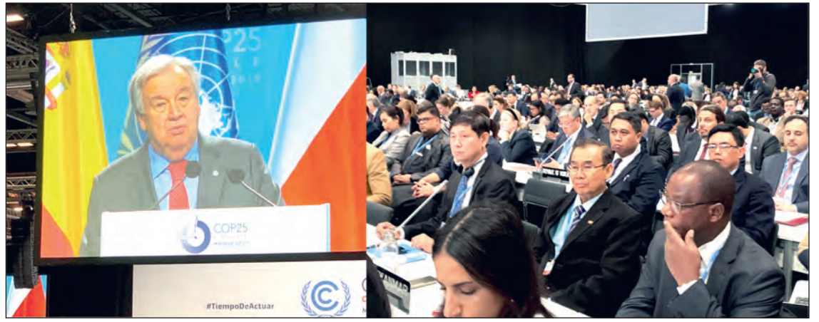
Union Minister for Natural Resources and Environmental Conservation U Ohn Win attends the 25 th UN Climate Change Conference (COP25) in Madrid, Spain, on 2 December.

On yesterday morning, the Union Minister took part in the Earth Information day organized