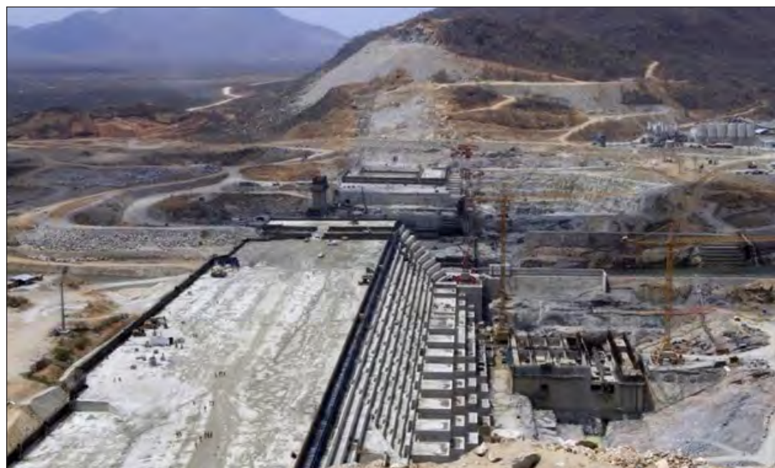
A general view of Ethiopia's Grand Renaissance Dam is seen during a media tour along the river Nile in Benishangul Gumuz Region, Guba Woreda, in Ethiopia 31 March, 2015 - AFP.

Ethiopia started building the GERD in 2011, but Egypt, a downstream country that relies heavily on the Nile for water, is concerned that the dam might affect its share of the water resources.—Xinhua ■