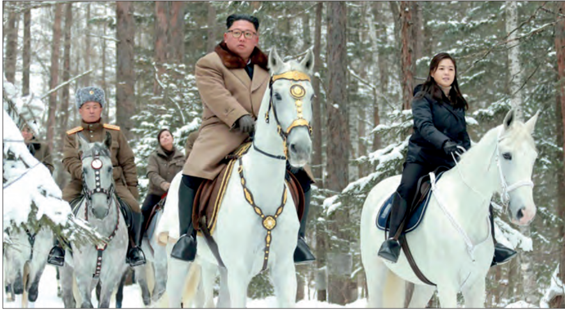
Mt Paektu has great symbolic significance in the North as both the spiritual birthplace of the Korean nation and, according to Pyongyang's orthodoxy, the birthplace of Kim's father Kim Jong Il.