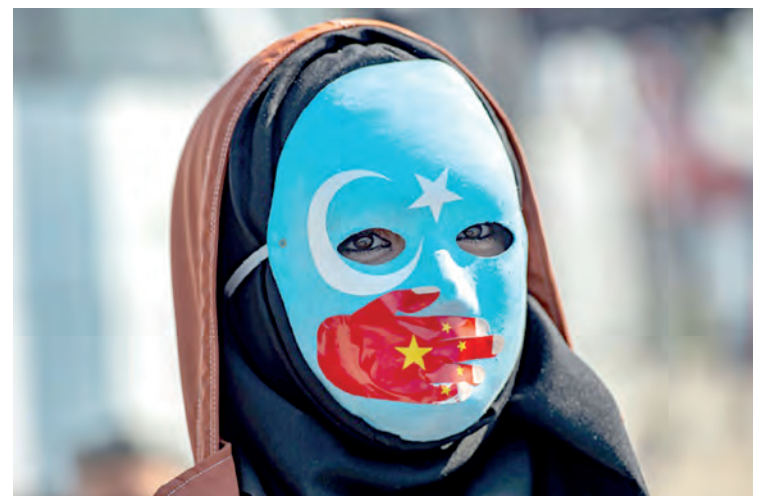
The legislation condemns Beijing's 'gross human rights violations' linked to the crackdown on mainly Muslim Uighurs in Xinjiang.

"If you look beneath that, at the Democrat view and the fact that this was bi-partisan, it seems the only thing the people in politics in Washington can agree on is that China is, somehow, an evil empire," he added.—ANI ■