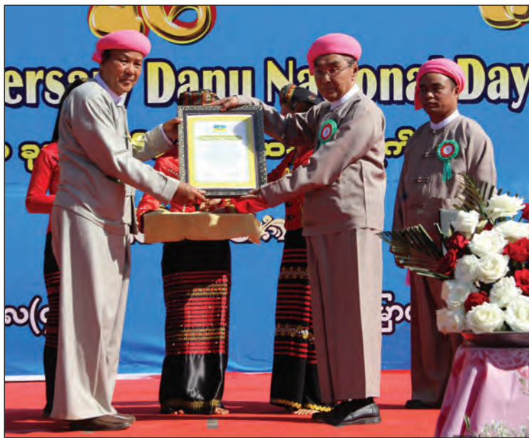
Union Minister Nai Thet Lwin presents certificate of honour to Organizing Committee member at the 2 nd Anniversary of Danu National Day ceremony.

Kalaw and Aungban of Southern Shan State. They also moderately populate Pyinmana, Yamethin, Tharsi and hilly regions linking to them. Danu National Day came about when Danu representatives from ten townships mostly populated by Danu people in Shan State and from all across the nation held a Danu National Conference in Pindaya on the 8 th Waxing of Nadaw in 1380 ME and became the first conference where five decisions were reached unanimously, thereby chosen to be commemorated as a special day.—MNA (Translated by Zaw Htet Oo)