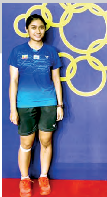
Myanmar badminton star Thet Htar Thuzar.

Meanwhile, Thet Htar Thuzar has been recognized as one of the most improved players in the world. From a world ranking of only 181 on 12 February, she moved up to 84 on 9 July, and is currently seeded 61. The women's singles event will be held till 9 December, and the final matches will be played on that day.—Lynn Thit (Tgi) ■