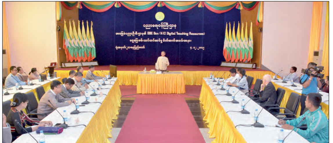
Union Minister Dr Myo Thein Gyi delivers the speech at the launching ceremony of the pilot phase of installation of DBE Boxes (K-12 Digital Teaching Resources) in Nay Pyi Taw yesterday.

“The installation of DBE Boxes is among the reforms based on technology being introduced by the Ministry of Education, and it can be said that the plan will develop educational