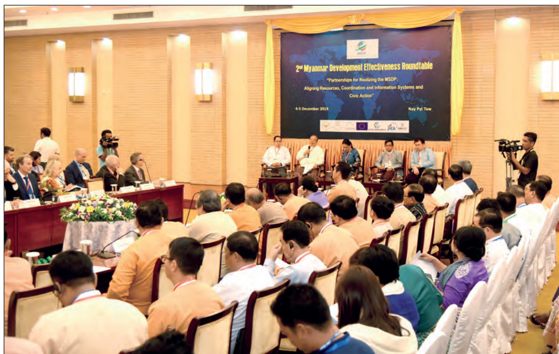
Union Minister U Thaug Tun participates in the 2 nd Myanmar Development Effectiveness Roundtable discussion in Nay Pyi Taw on 4 December 2019.

Tun, in his capacity as the vice chairman of Development Assistance Coordination Unit (DACU), reaffirmed that Myanmar government will con-