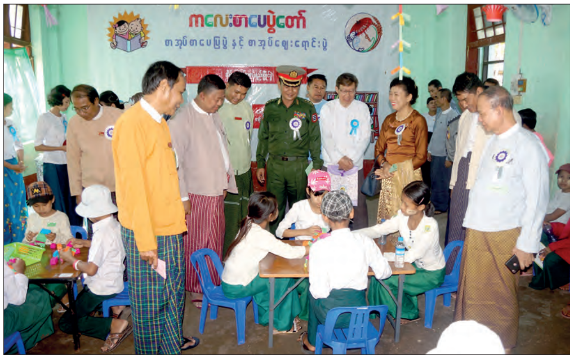
Ayeyawady Region Government officials observe children participating in the competitions during children literary festival in Myaungmya yesterday.

ORGANIZED by the Ayeyawady Region Government, the ninth Children Literary Festival of the Region was opened at the Basic Education High School No.1 (Myaungmya) in Myaungmya