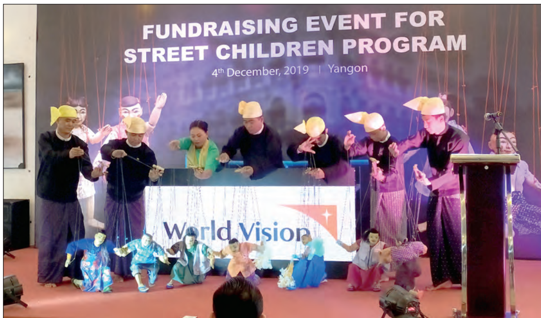
Traditional puppet show at a Fundraising Event for street children programme held in Yangon on 4 December.