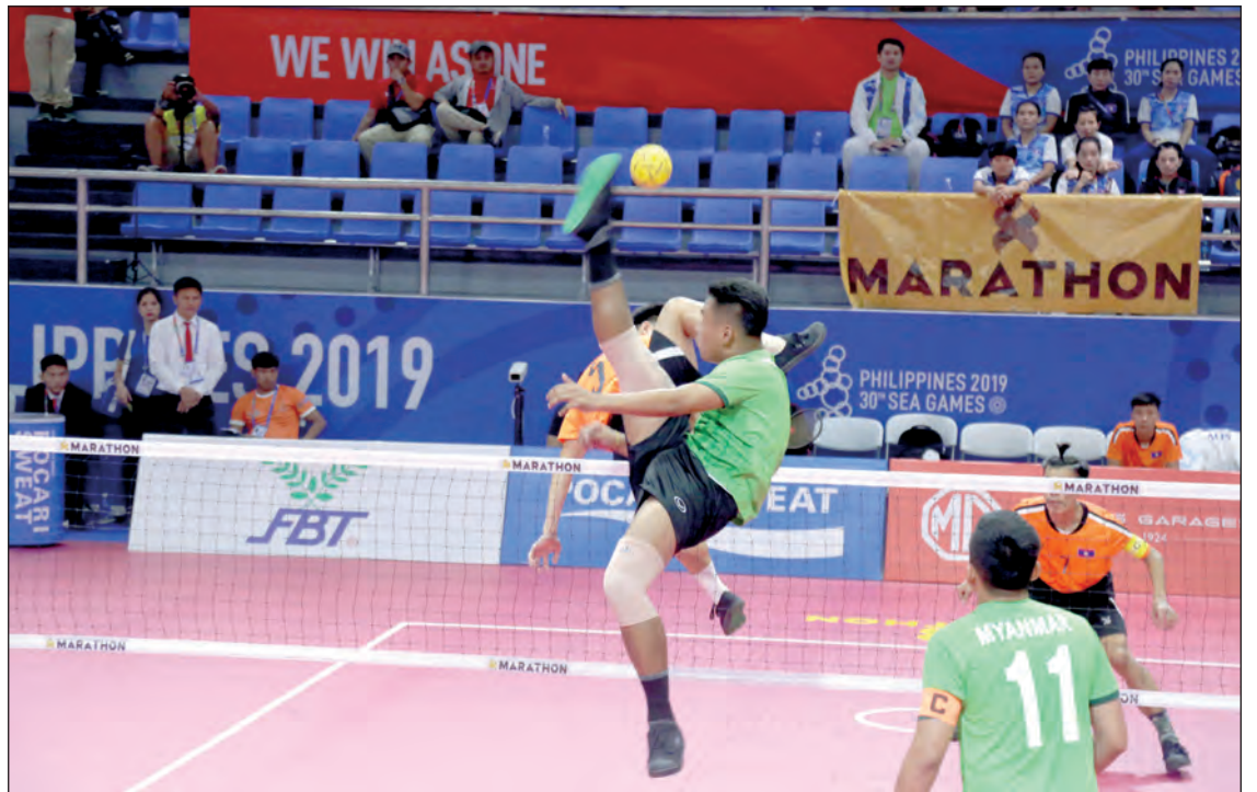
Myanmar and Laos players compete in the men's doubles Sepak takraw competition at the 30 th SEA Games yesterday at the Subic Bay Gymnasium in the Philippines.