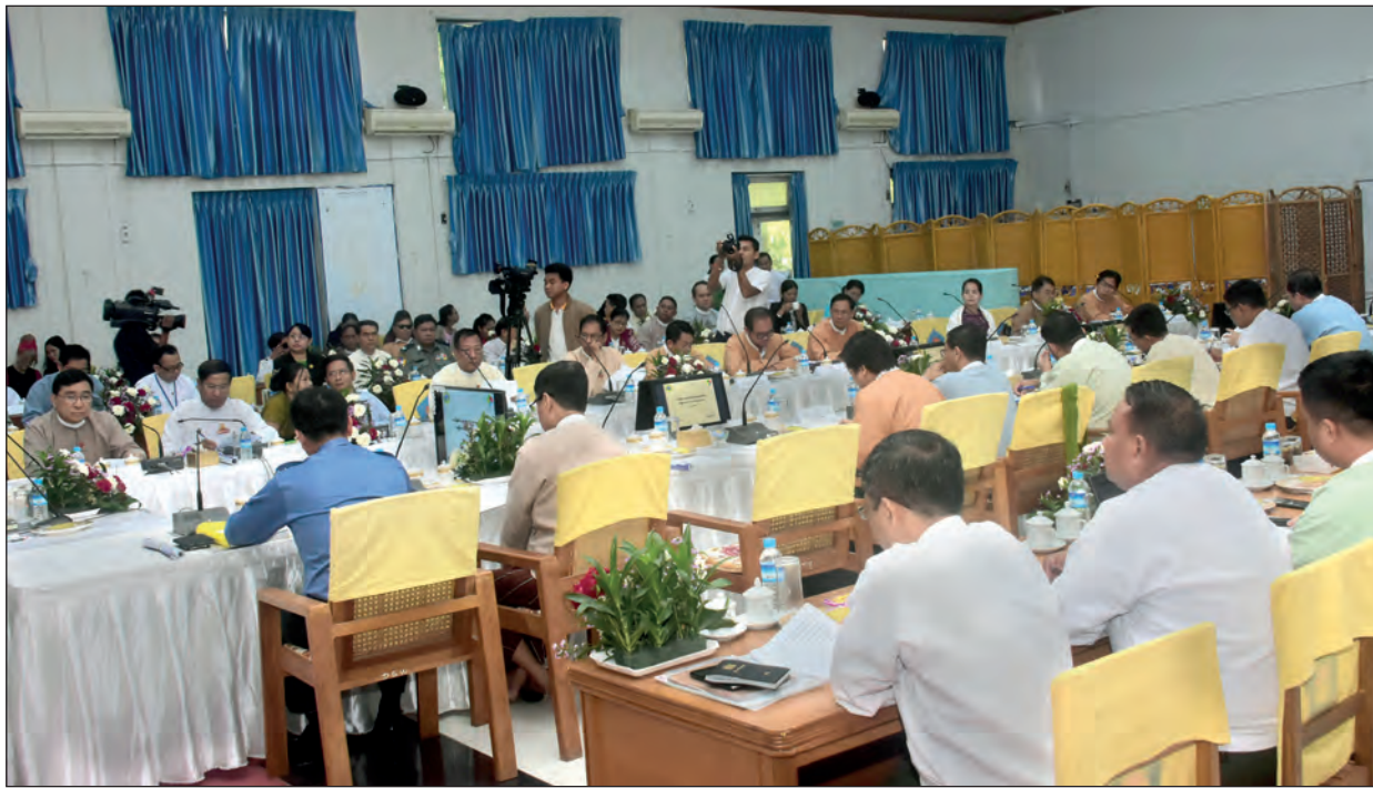
Vice President U Henry Van Thio addresses the fifth meeting of the National Committee on the Rights of Persons with Disabilities in Nay Pyi Taw yesterday.

THE fifth meeting of the National Committee on the Rights of Persons with Disabilities was held at the Ministry of Social Welfare, Relief and Resettlement in Nay Pyi Taw yesterday and National Committee Chairman Vice President U Henry Van Thio delivered a speech.