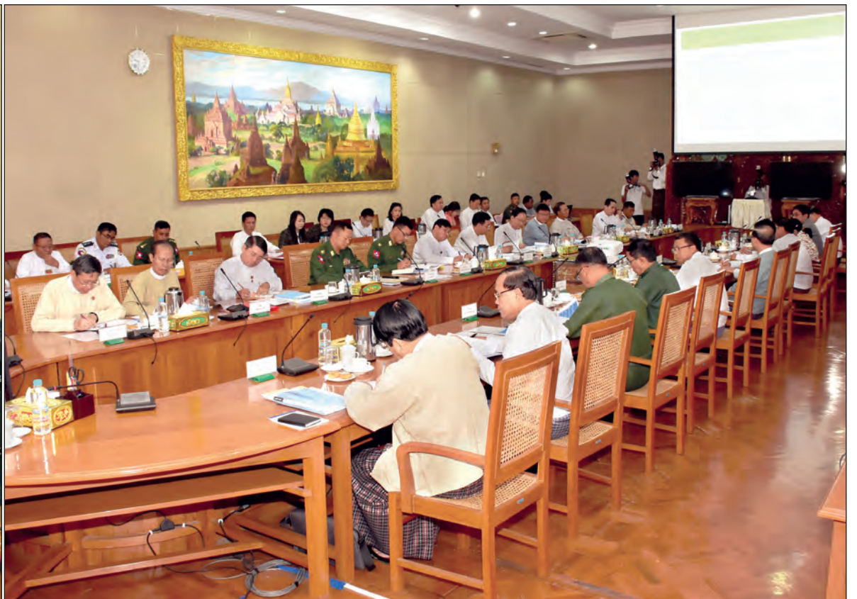
Vice President U Myint Swe delivers the address at the 3 rd coordination meeting for holding the 72 nd Independence Day ceremony to be held on 4 January 2020 in Nay Pyi Taw.