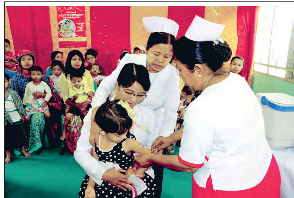
Nurses vaccinate children against measles at a township public healthcare centre in Yangon on 28 November.

The Ministry of Health and Sports has been conducted its extended vaccination program as a priority. It is giving 11 types of vaccinations to children under