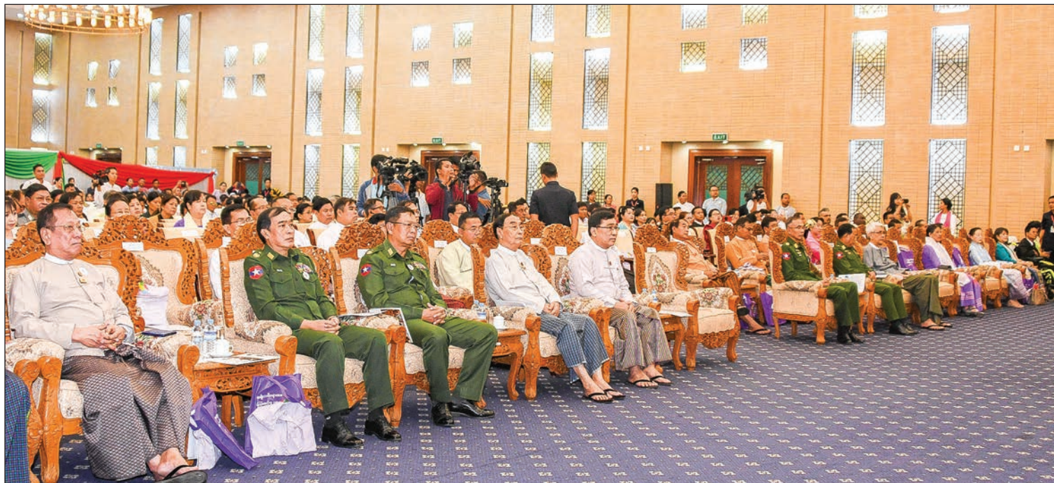
Union ministers and dignitaries attend the ceremony to mark the 2019 International Day of Persons with Disabilities (IDPD).

message for 2019 IDPD sent by the UN Secretary General.