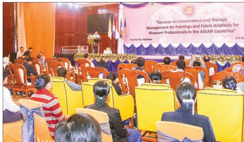
Union Minister Thura U Aung Ko delivers the address at the Seminar on Conservation and Storage Management for Paintings and Fabric Artefacts.