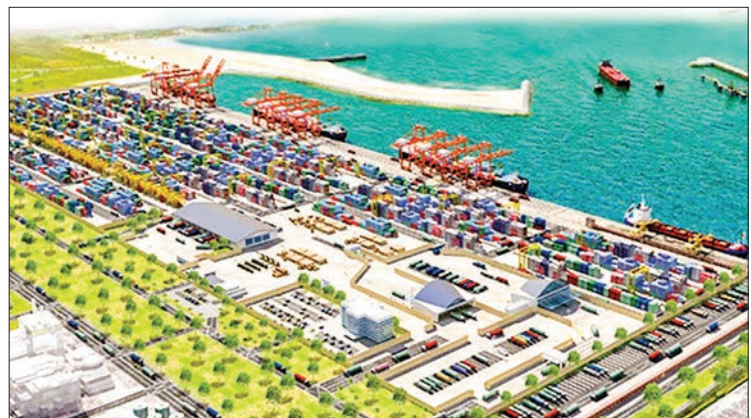
CNTIC Vpower Company will invest $140.47 million in the generation of 150 MW of electricity from LNG in Kyaukpyu.