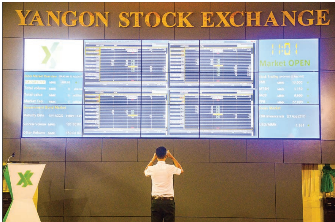
The Yangon Stock Exchange in downtown Yangon.

The YSX was launched three years ago to improve the private business sector. It disseminates rules and regulations regarding the stock exchange and knowledge of share trading through stock investment seminars. The YSX has doubled its stock trade matching time from two to four per day. In addition to this, it held a promotional event to attract new investors and encourage existing inves-