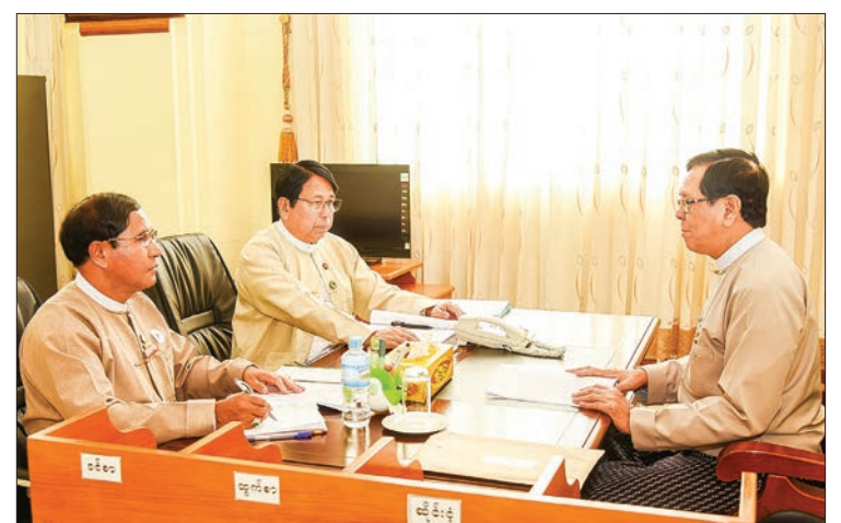
Rakhine State Stability Supporting Committee holds the meeting at Amyotha Hluttaw Affairs Hall in Nay Pyi Taw yesterday.

THE Rakhine State Stability Supporting Committee held a coordination meeting to finalize its report at the Amyotha Hluttaw Affairs Hall (I-20) in Nay Pyi Taw yesterday.