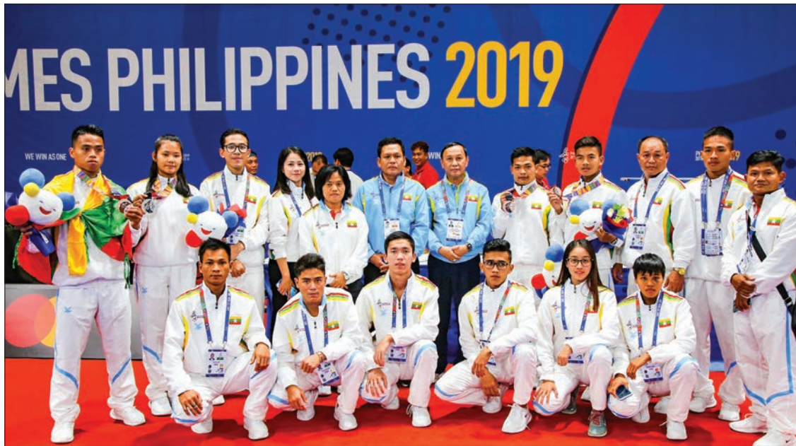
Myanmar officials and athletes pose for a group photo at the 30th SEA Games in the Philippines on 3 December.

MYANMAR athletes took eight more medals on 3 December at the 30 th SEA Games, according to the official website of the SEA Games.