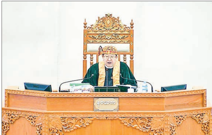
Pyidaungsu Hluttaw Speaker U T Khun Myat.

The meeting started with Hluttaw representatives discussing a report of Joint Committee on Scrutinizing the a bill amending the Constitution for the second time signed and submitted by 144 Tatmadaw Hluttaw representatives including Amyotha Hluttaw Tatmadaw representative Brig-Gen Aung San Chit.