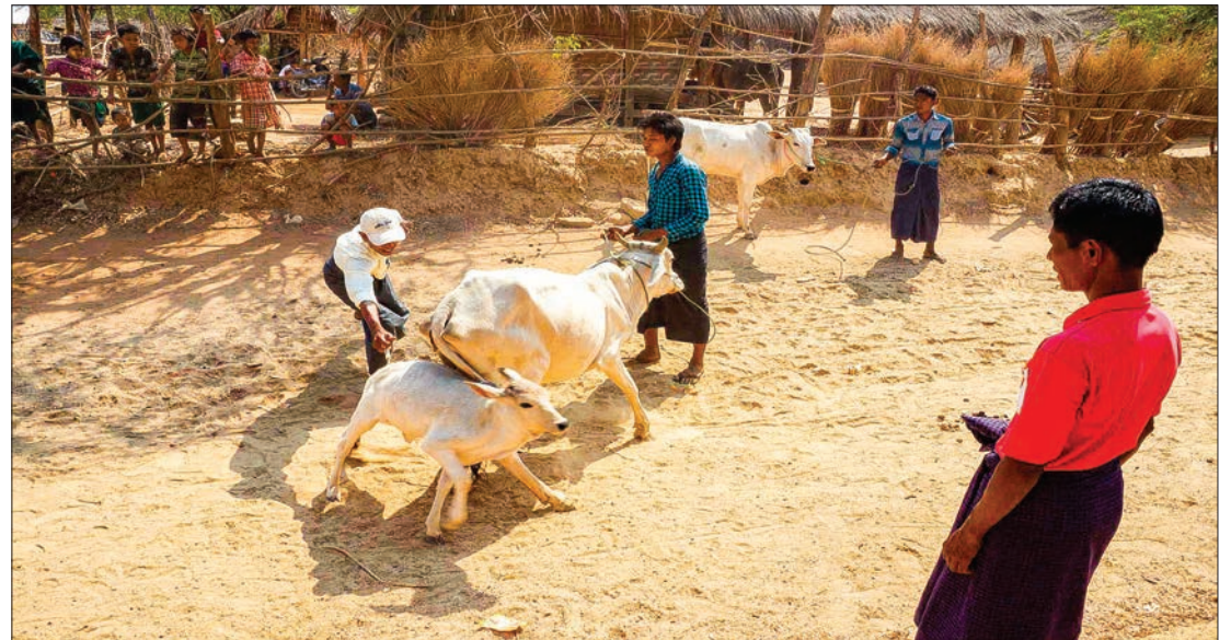
Veterinary officials vaccinate cattle in Meiktila Township.

"We will form trained staff into six groups for the free vaccination campaign. Each team will have five staff members. Each team will be led by a deputy head of the Livestock Breeding and Veterinary Department. So, there will be six members in each team. We have already administered free vaccinations to 4,123 cattle