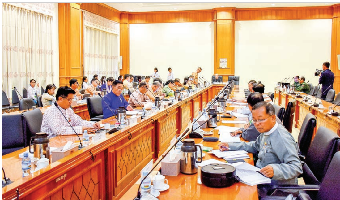
Joint Committee on Amending the 2008 Constitution holds the meeting.

THE Joint Committee on Amending the 2008 Constitution held its meeting 64/2019 at the Pyidaungsu Hluttaw Building D in Nay Pyi Taw yesterday.