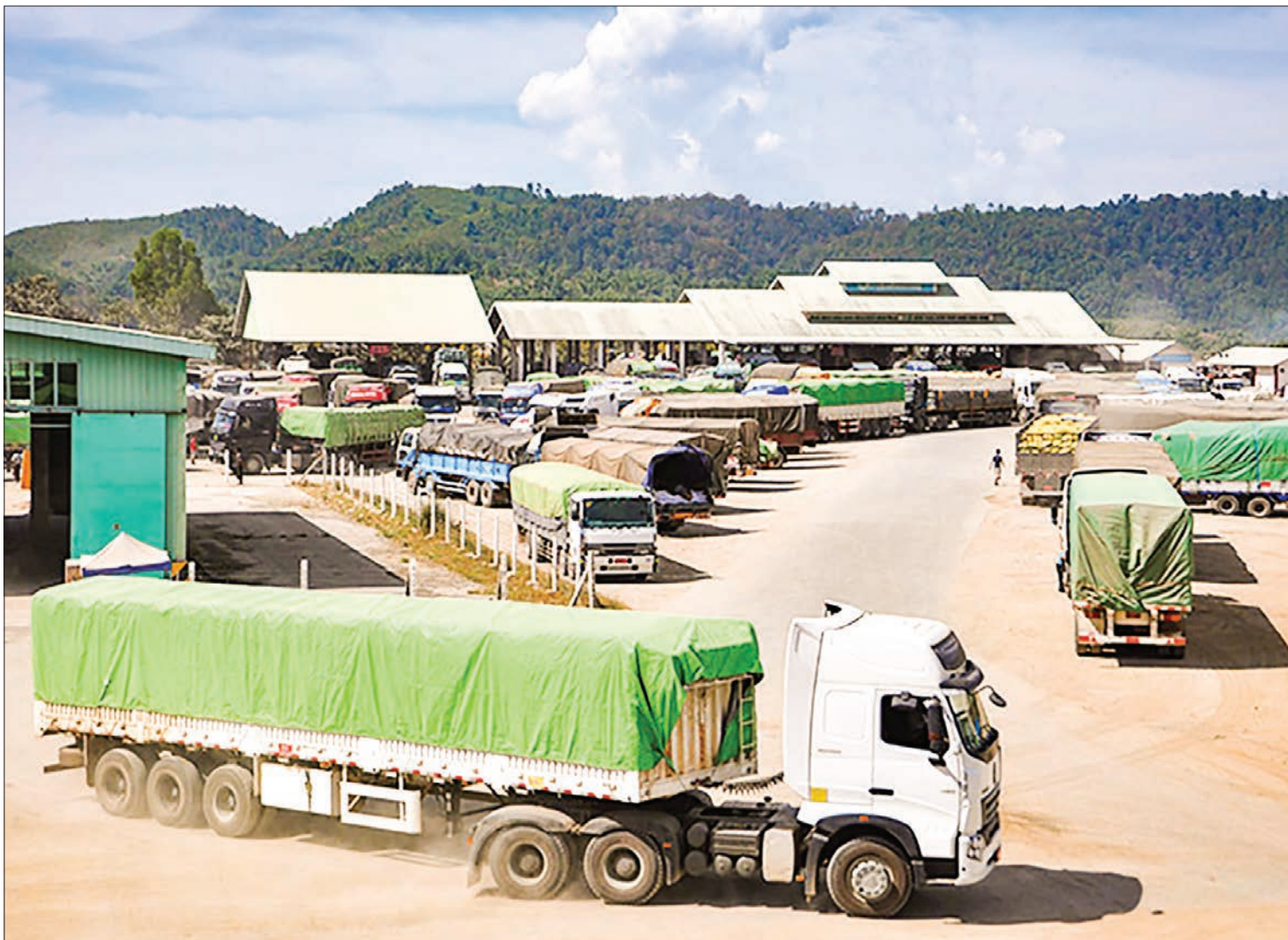
Trucks seen at 105-mile trade zone Muse, northern Shan State.