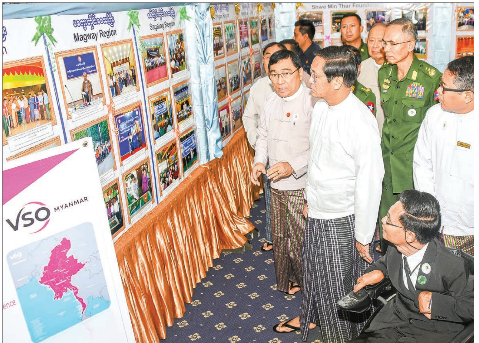
Vice President U Henry Van Thio visits the booth displaying documentary photos of activities of persons with disabilities at the 2019 International Day of Persons with Disabilities (IDPD) in Nay Pyi Taw yesterday.