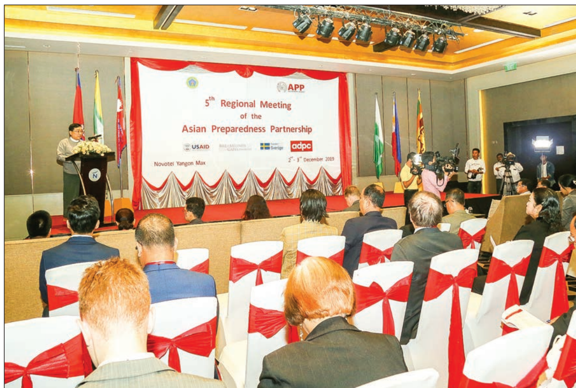
Union Minister Dr Win Myat Aye delivers the address at the 5 th Regional Meeting on the Asian Preparedness Partnership.