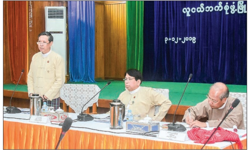
Union Minister Dr Myo Thein Gyi delivers the address at meeting of the steering committee for holding All-Round Youth Development Festival (Magway).

THE Steering Committee for Organizing All-Round Youth Development Festival (Magway) held a coordination meeting for the upcoming festival at the Ministry of Information's meeting hall in Nay Pyi Taw at 2 pm yesterday. The festival is scheduled to be held from 14 to 16 December.