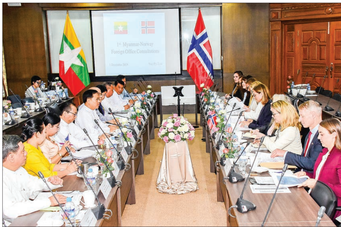
The 1 st Myanmar-Norway Foreign Office Consultations in progress at the Ministry of Foreign Affairs in Nay Pyi Taw yesterday.

The 1 st Myanmar-Norway Foreign Office Consultations was held on 3 December 2019 at the Ministry of Foreign Affairs in Nay Pyi Taw.