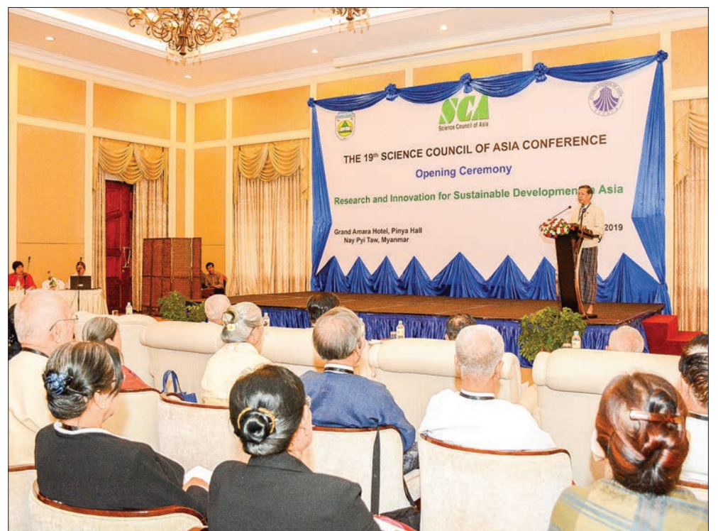
Union Minister Dr Myo Thein Gyi addresses the 19 th Science Council Asia (SCA).

SCA was formed in 2000 and Myanmar Arts and Science Group become a member of SCA in 2012. –MNA (Translated by Zaw Htet Oo)