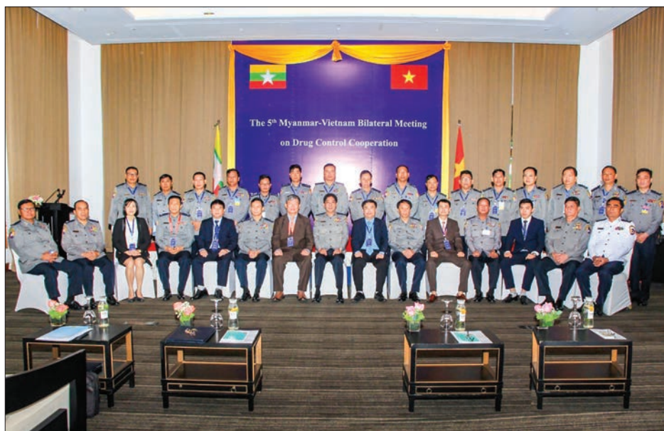
Attendees of the 5 th Myanmar-Viet Nam bilateral drug control meeting pose for a group photo.