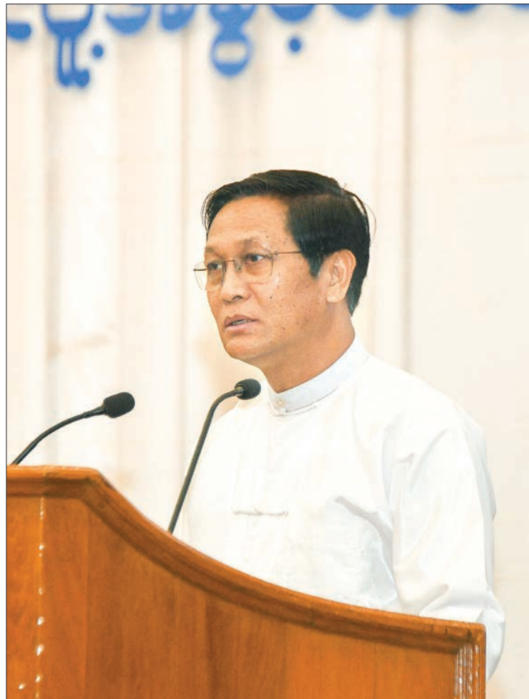
Vice President U Henry Van Thio delivers the address.