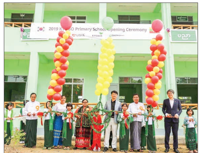
Officials and representatives of KYOBO Life Insurance and Good Neighbours International formally open the two-storey building.

Officials of Yangon Region Social Welfare Office and local authorities also attended the ceremony.— GNLM ■