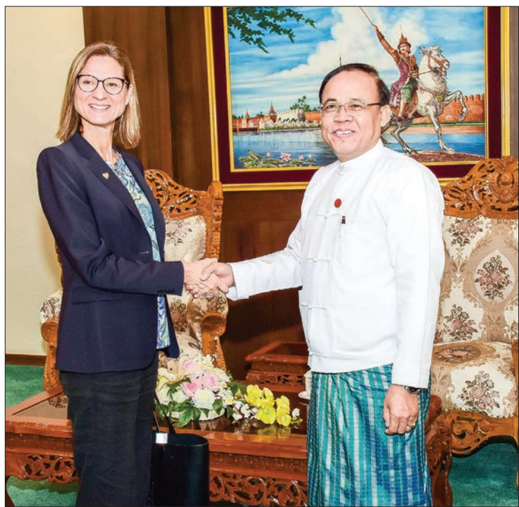
Union Minister U Kyaw Tin welcomes Ms Marianne Hagen, State Secretary of the Foreign Affairs of Norway.

U Kyaw Tin, Union Minister for International Cooperation received Ms Marianne Hagen, State Secretary of the Foreign Affairs of Norway at 8:30 am on 3 December 2019 at the Ministry of Foreign Affairs in Nay Pyi Taw.