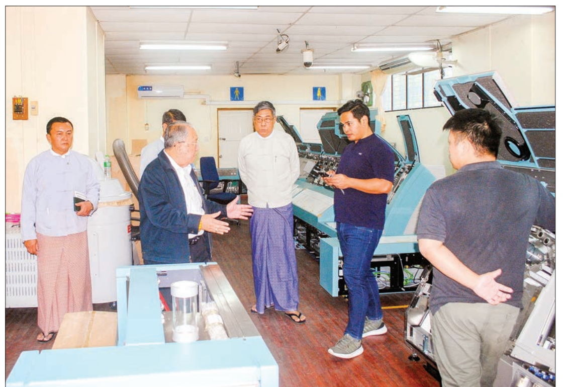
CBM Governor U Kyaw Kyaw Maung inspects bank note processing machines in Yangon.

GOVERNOR of the Central Bank of Myanmar U Kyaw Kyaw Maung inspected the installation of German made bank note processing machines at the Central Bank of Myanmar (Yangon branch) in Yangon in yesterday.