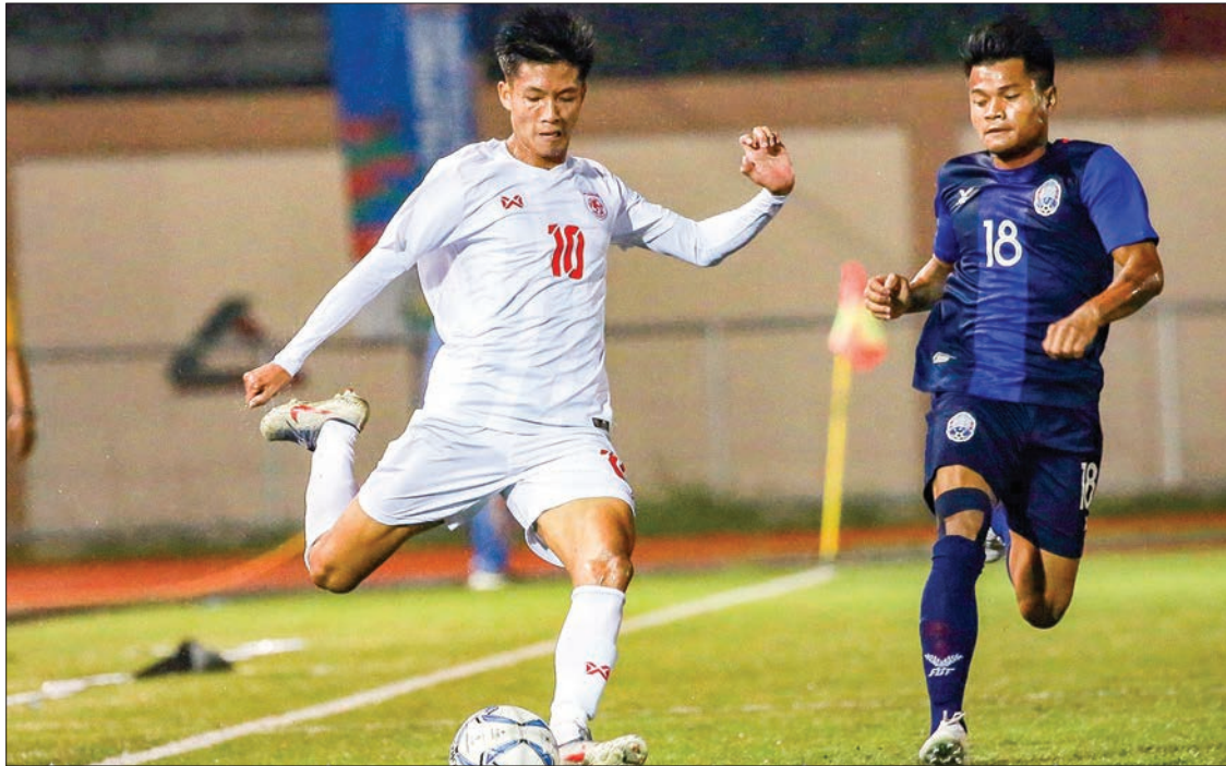
Myanmar player (white) and Cambodian player (blue) vie for the ball in the 30 th South East Asian Games in the Philippines yesterday.

Myanmar was the winner of Group A and Cambodia runner-up, while Viet Nam is winner of Group B and Thailand runner-up.