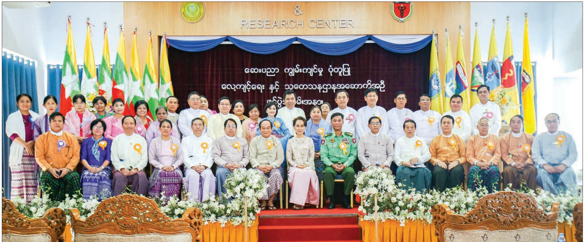
State Counsellor Daw Aung San Suu Kyi poses for photo together with dignitaries at the ceremony to open the Medical Skill, Simulation and Research Center in Yangon.