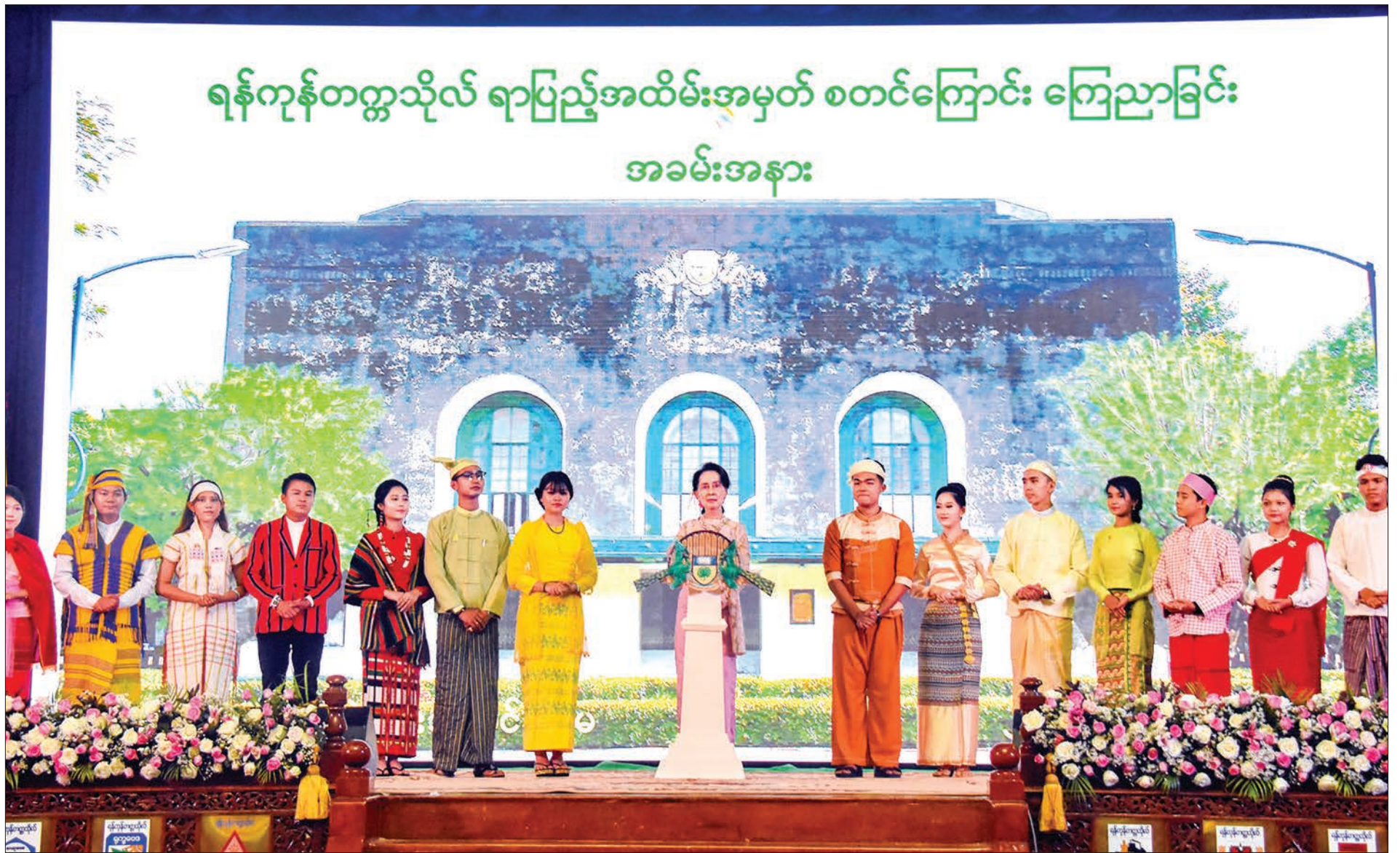
State Counsellor Daw Aung San Suu Kyi opens the University of Yangon's centennial celebration at the convocation hall of the university yesterday.

STATE Counsellor Daw Aung San Suu Kyi attended the grand opening ceremony of University of Yangon's centennial celebrated in its convocation hall in the campus yesterday morning, and she delivered a speech at the event.