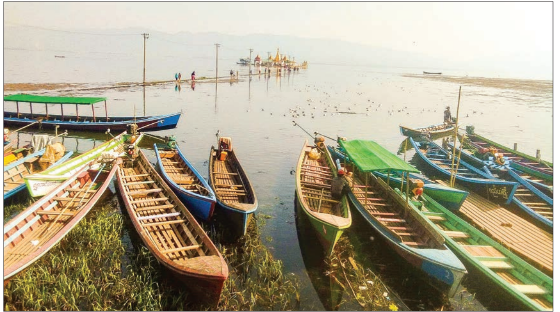
Indawgyi lake is one of the tourist attractions in upper Myanmar.

Two towns and 33 villages are located within Indawgyi area.