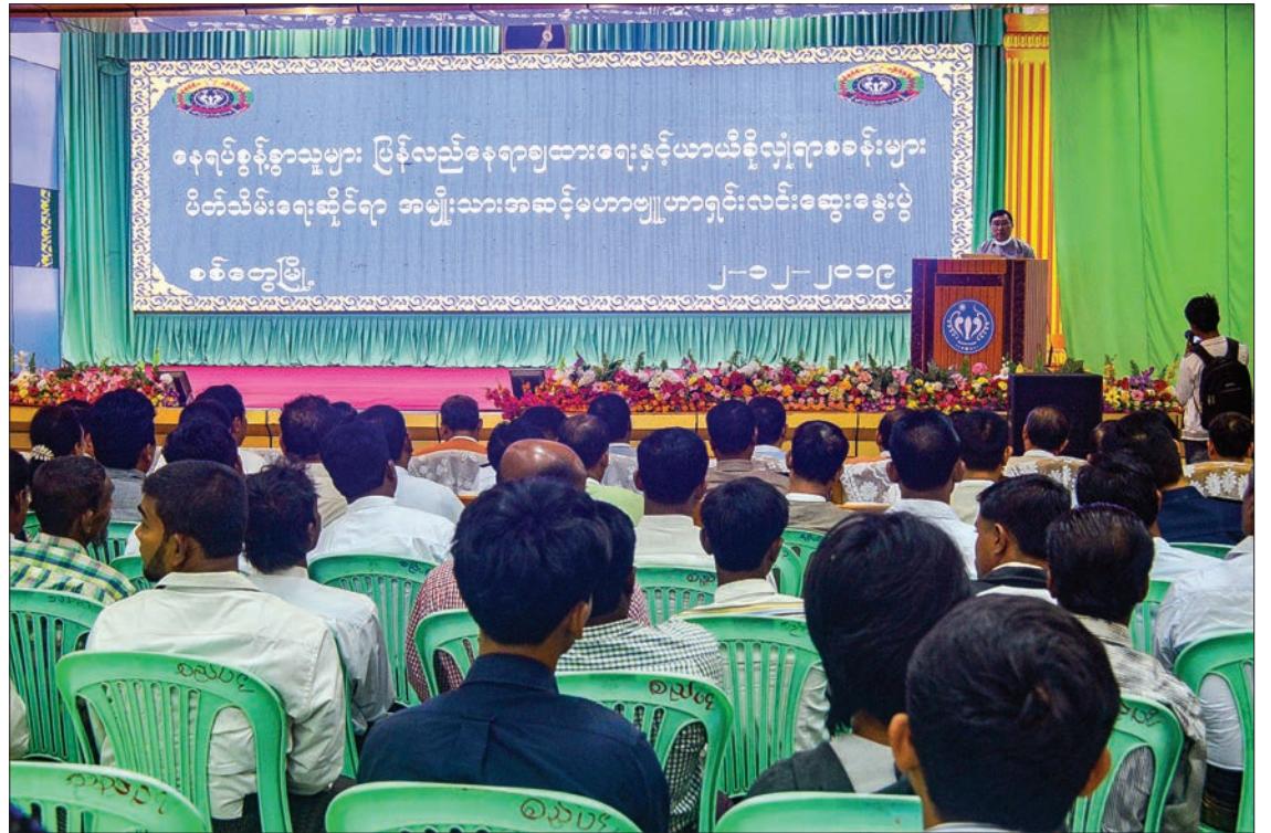
Union Minister Dr Win Myat Aye explains strategy for resettlement of IDPs and closing IDP Camps at a ceremony in Sittway, Rakhine State.

The Ministry of Social Welfare, Relief and Resettlement is taking up resettlement and socioeconomic development committee out of the four work committees for peace and development in Rakhine State.