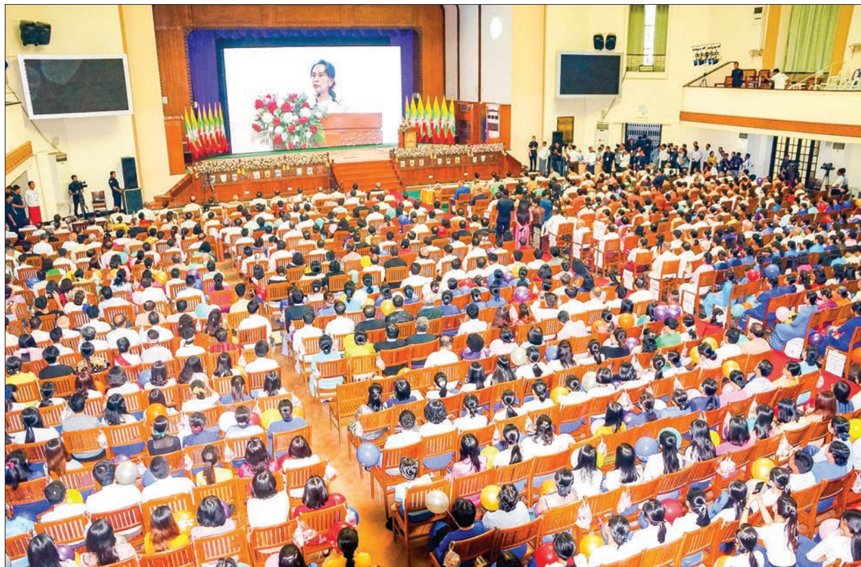
State Counsellor Daw Aung San Suu Kyi delivers the address at the grand opening ceremony of University of Yangon's centennial celebration at the university's convocation hall yesterday.

State Counsellor, a documentary video of University of Yangon's history was screened, and she greeted the attendees at the event.