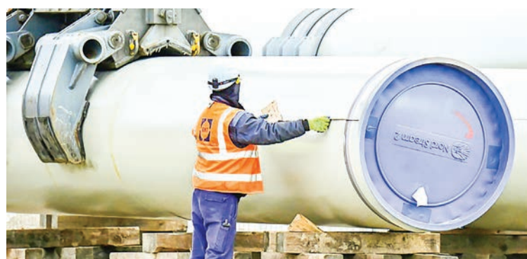
The Nord Stream 2 gas pipeline is likely to make western Europe more dependent on Russian natural gas, critics say.

"This is important for our country, this is important for China," he said ahead of the launch, stressing that the project would create jobs and infrastructure in Russia's Far East. — AFP ■