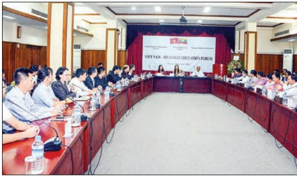
The Viet Nam-Myanmar Education Forum is in progress at the Diamond Jubilee Hall of the Yangon University in Yangon on 2 December.