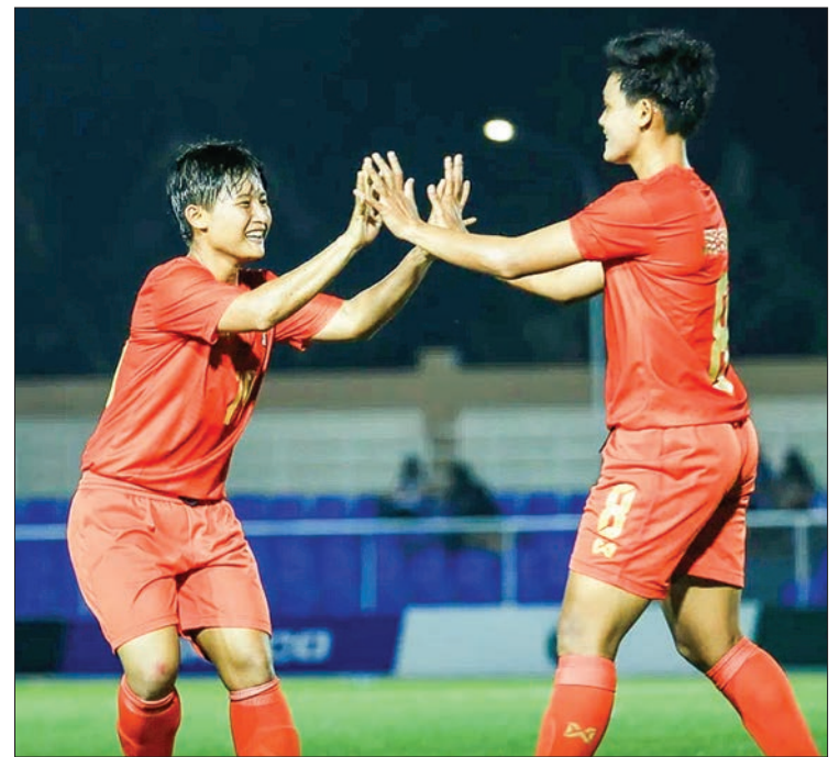
Myanmar women's football players celebrate after they scored a goal against Malaysian team in the 30 th South East Asian Games yesterday.

The match between Myanmar and Thailand will be held at 6:30pm (Myanmar Standard Time) on 5 December. — Kyaw Khin