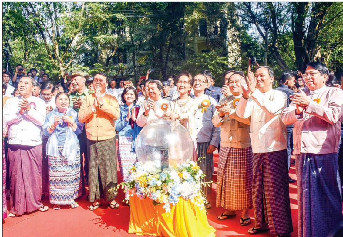
State Counsellor Daw Aung San Suu Kyi formally opens the Medical Skill, Simulation and Research Centre at the University of Medicine-1 in Yangon.

STATE Counsellor Daw Aung San Suu Kyi attended and addressed an opening ceremony of the Medical Skill, Simulation and Research Center held in the compound of University of Medicine 1, Yangon yesterday afternoon.