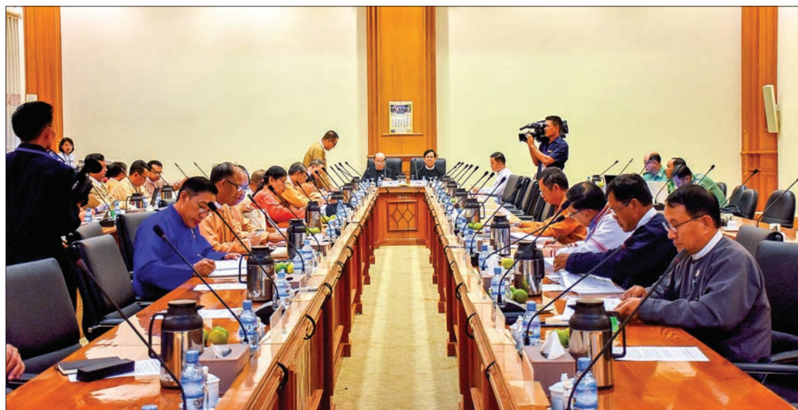
Joint Committee on Amending the 2008 Constitution holds its meeting 63/2019 at the Pyidaungsu Hluttaw Building D in Nay Pyi Taw yesterday.