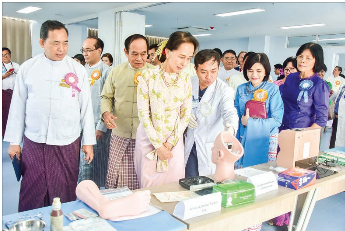
State Counsellor Daw Aung San Suu Kyi observes equipment used for medical skill and simulation.

In research works, medical universities as well as other universities in our country are to use modern and developed lab and equipment. Much need to be done toward development in research. The State was providing more and more funds for development in research works. Starting from fiscal year 2017-2018, the Ministry of Health and Sports was specially provided with more funds. At the moment, an increasing numbers of health care personnel were reading papers and making presentations at international research conferences. Post graduate, master and doctorate students need to make more efforts toward producing more international level research papers. They need to be more involved in international medical area.