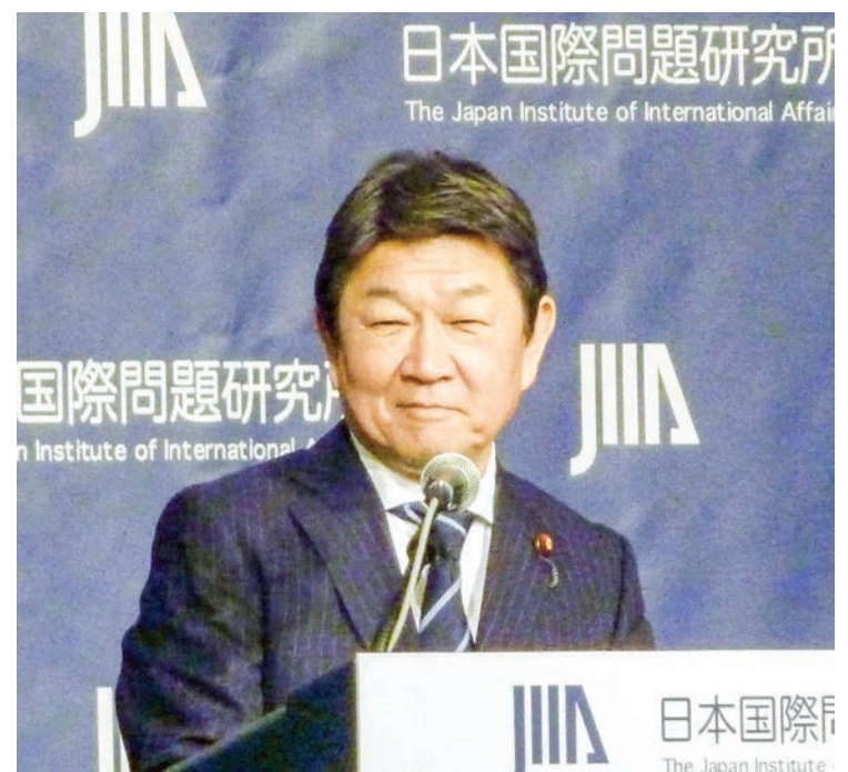
Foreign Minister Toshimitsu Motegi.

China will take further necessary actions in accordance with the development of the situation to firmly defend the stability and prosperity of Hong Kong and safeguard national sovereignty, security and development interests, she said. — Xinhua ■