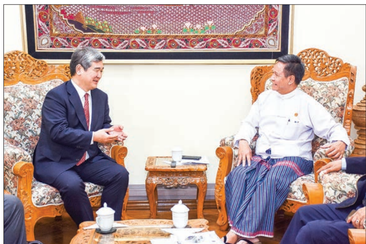
Deputy Commerce Minister U Aung Htoo receives WTO official in Nay Pyi Taw yesterday.