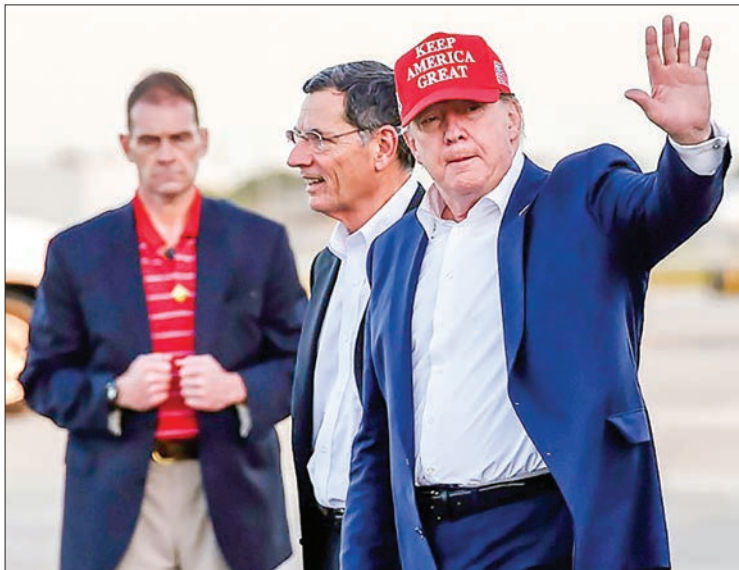
US President Donald Trump steps off Air Force One upon arrival in West Palm Beach, Florida, in November 2019.

"We cannot fairly be expected to participate in a hearing while the witnesses are yet to be named and while it remains unclear whether the Judiciary Committee will afford the President a fair process through additional hearings," White House counsel Pat Cipollone wrote in a letter to Jerry Nadler, the Democratic chairman of the House Judiciary