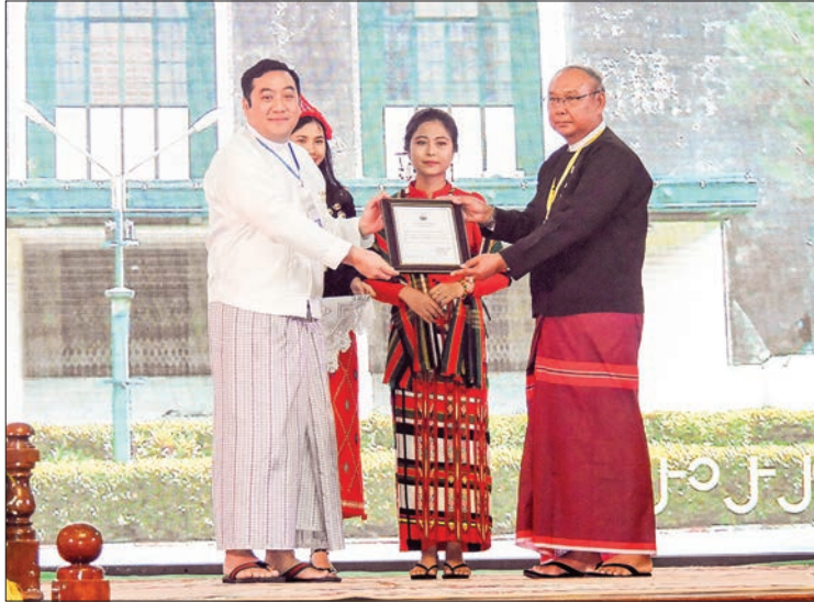
Amyotha Hluttaw Speaker Mahn Win Khaing Than presents a certificate of honour to a dignitary.