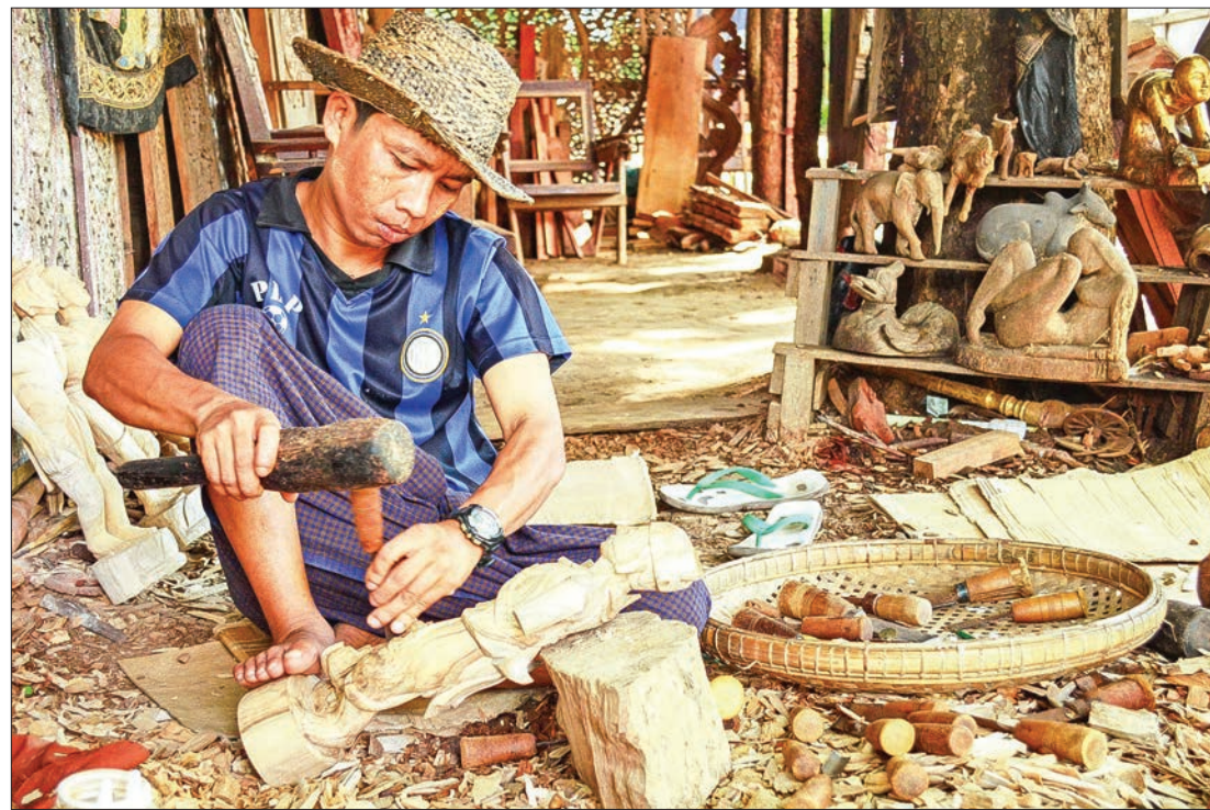
A man carves a wooden statue in Mandalay.