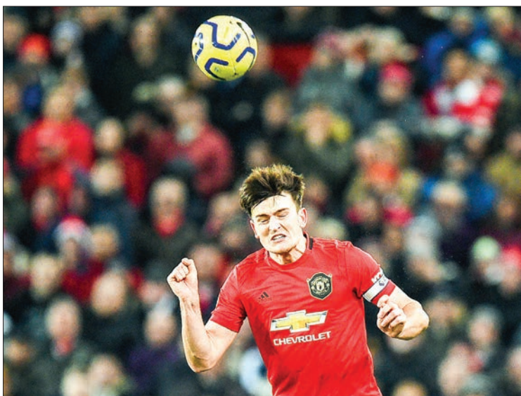
Manchester United defender Harry Maguire in action against Aston Villa.

"As a defender especially, it's frustrating," he added. "We haven't really conceded many chances or goals prior to the last two games and then we've conceded five."—AFP ■