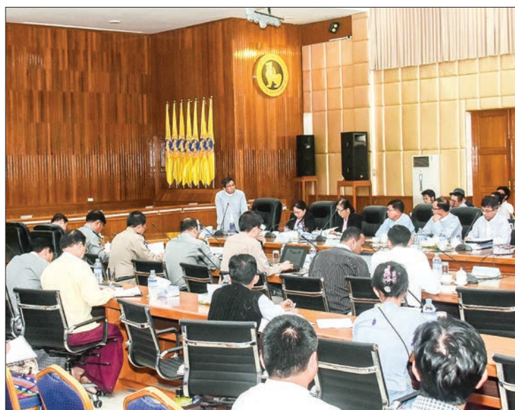
CBM Deputy Governor U Bo Bo Nge makes key-note remarks at the workshop on the rule for outward remittances businesses.