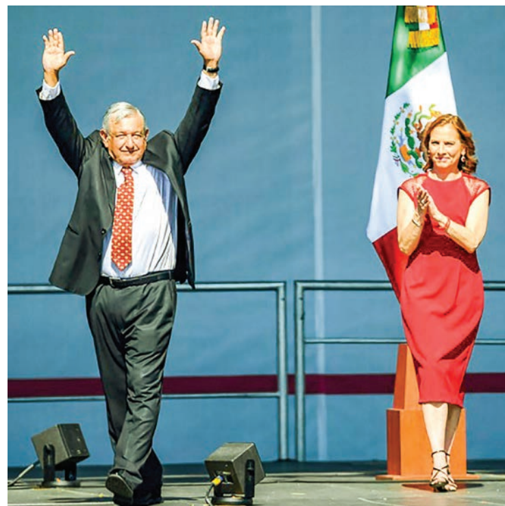
Mexican President Andres Manuel Lopez Obrador (left) waves next to his wife Beatriz Gutierrez Muller during a rally marking his first year in office at the Zocalo square in Mexico City on 1 December 2019.

MEXICO CITY (Mexico)— Mexican president Andres Manuel Lopez Obrador said Sunday that former Bolivian leader Evo Morales was the "victim of a coup d'etat."