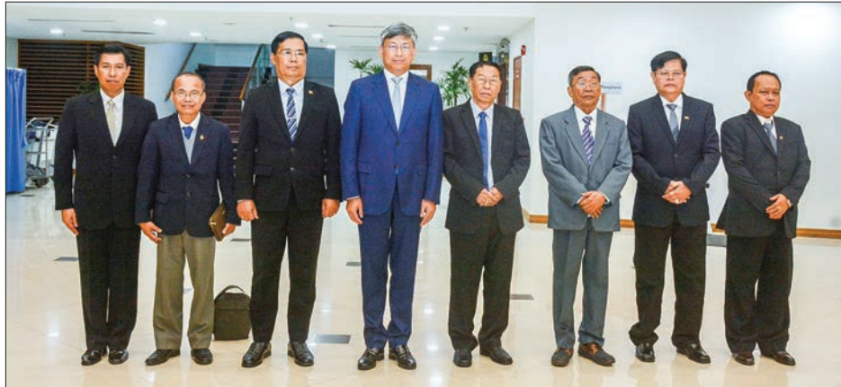
The Myanmar delegation led by Union Election Commission Chairman U Hla Thein is seen before departing for China.

UNION Election Commission U Hla Thein left for the People's Republic of China on 1 December night as study tour till 6 December on promoting understanding on election system be-