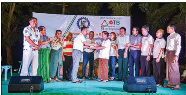
Winners of the Myanmar Tourism Bank Cup 2019 are awarded with prizes at the Myanmar Golf Club in the 9 th Miles, Yangon yesterday.