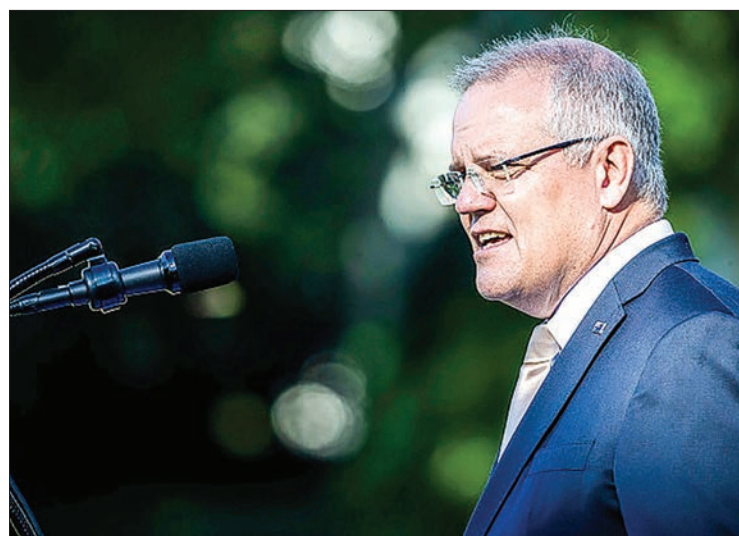
Australian Prime Minister Scott Morrison speaks during an official visit ceremony at the South Lawn of the White House on 20 September 2019 in Washington, DC. Prime Minister Morrison will participate in an Oval Office meeting, a joint news conference, and a state dinner during his state visit in Washington.

ization Nine, Bo “Nick” Zhao, a Melbourne-based luxury car dealer was approached by a Chinese intelligence group offering AU$1 million to fund his campaign for a lower house seat in last May’s general election.