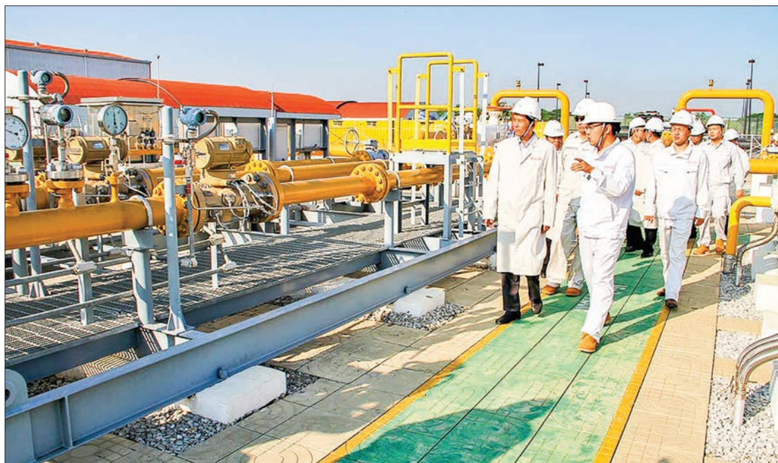
Deputy Minister Dr Tun Naing and party inspect the oil and gas stations in Mandalay Region yesterday.