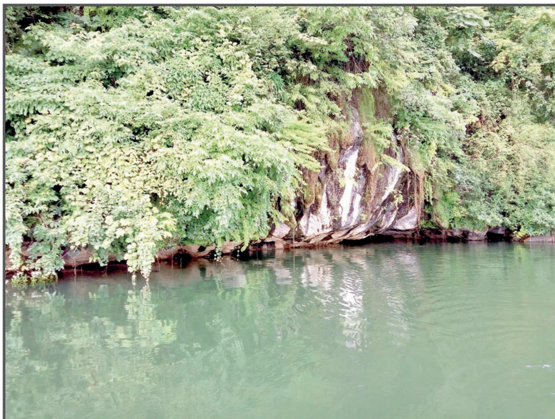
Saddan Lake.

seasons, as there is leakage of some water in the Cave, it is humid in it, or otherwise in summer seasons.