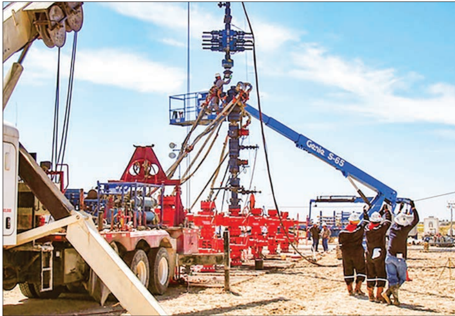
Drilling work is under way in the U.S. state of Texas to produce shale oil as seen in this file photo taken on March 13, 2014.

The growing role of the United States as a global energy supplier would exert downward pressure on oil prices. According to the data, U.S. oil exports