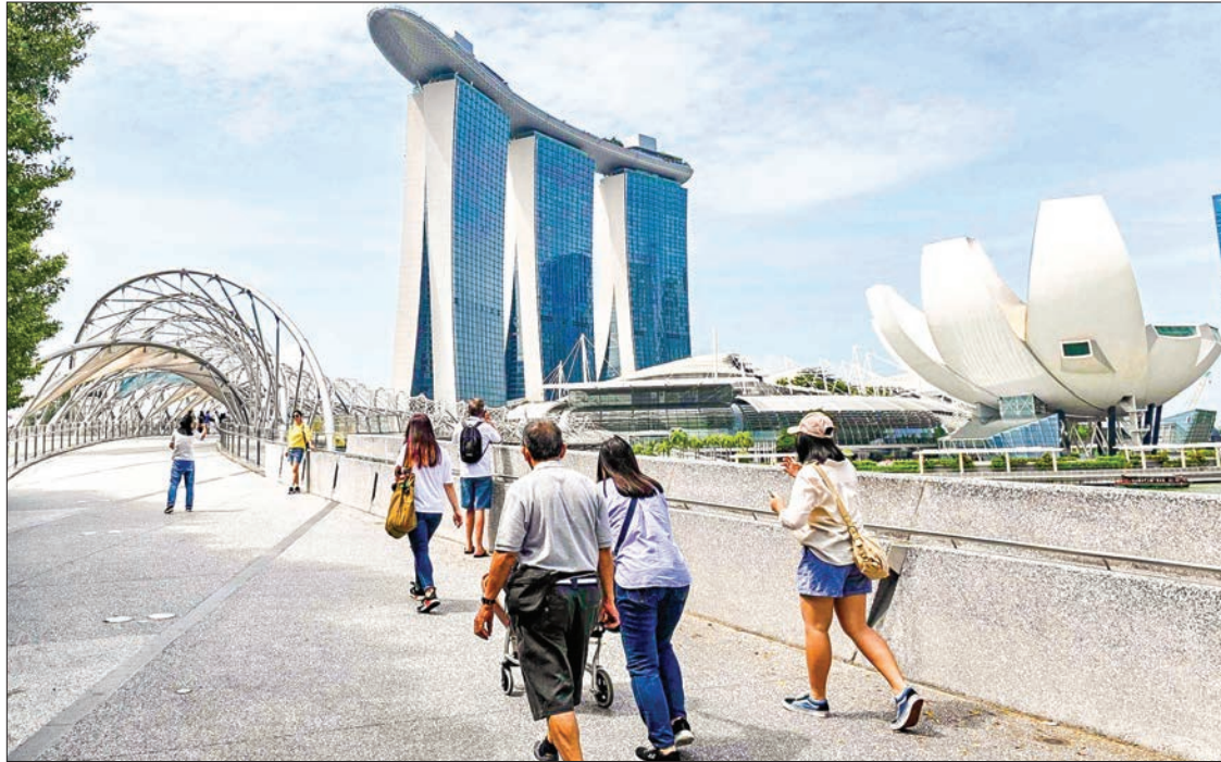
The Singapore government has ordered Facebook to issue a correction notice on an anti-government website's page after the site's editor remained defiant over an article it posted to the social networking site earlier this month.

The so-called Targeted Correction Direction, allows