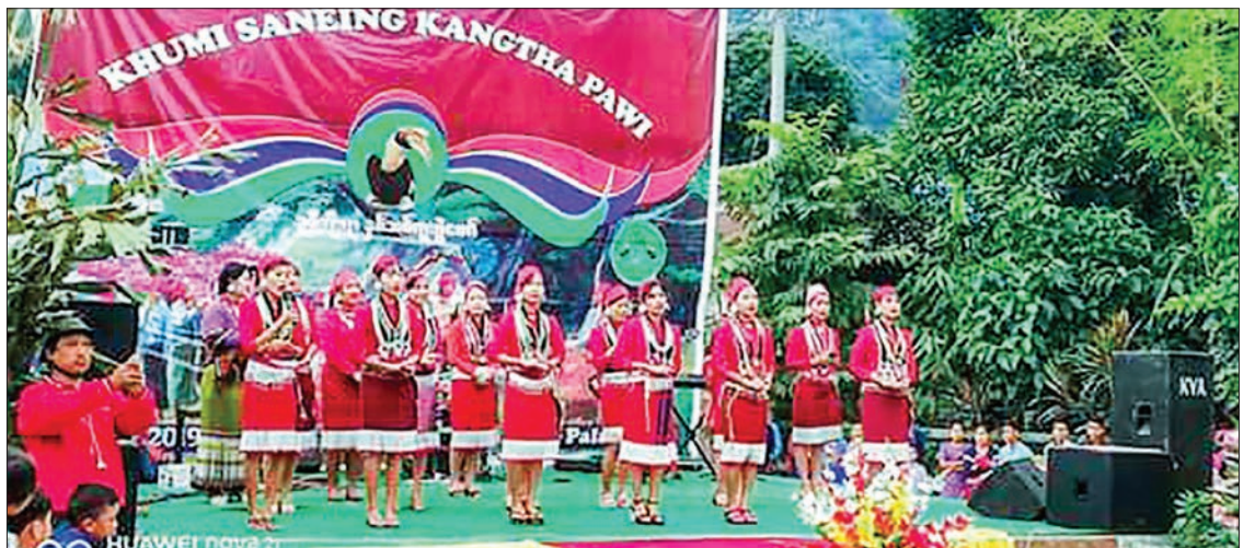
Khumi ethnic tribe perform with traditional dances and songs at the Khumi New Year festival in Paletwa yesterday.