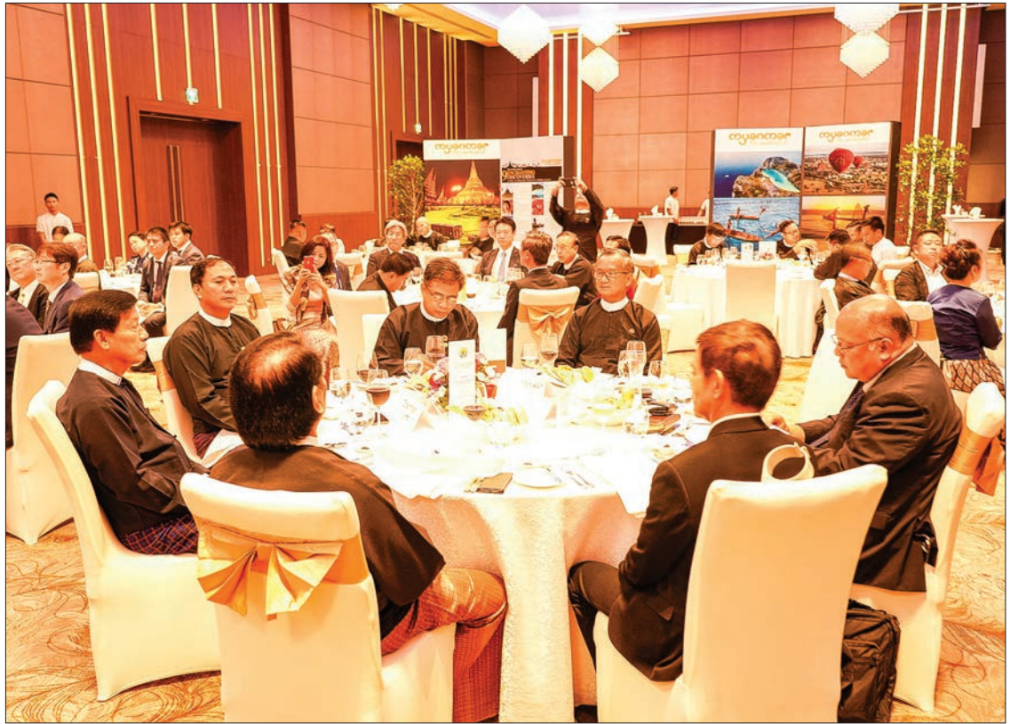
The welcoming dinner being hosted to honour the representatives of JATA Fam Trip from Japan.