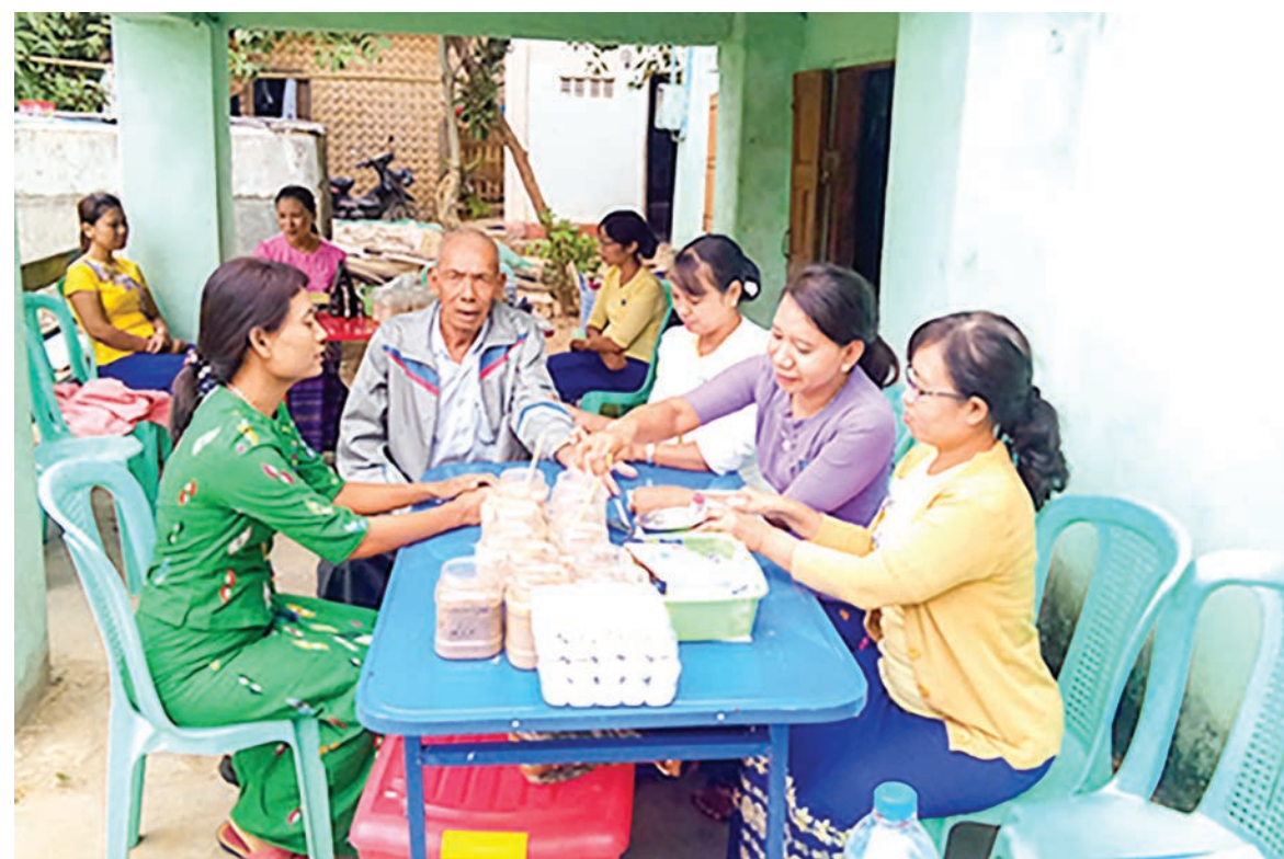
Traditional medicine practitioners provide health care to public.

It cannot be denied that there are some limitations in TM to explain every single thing under scientific terms as some practices go beyond the scientific field. But there are still many practices needed to promote into EBP for those clinical experi-