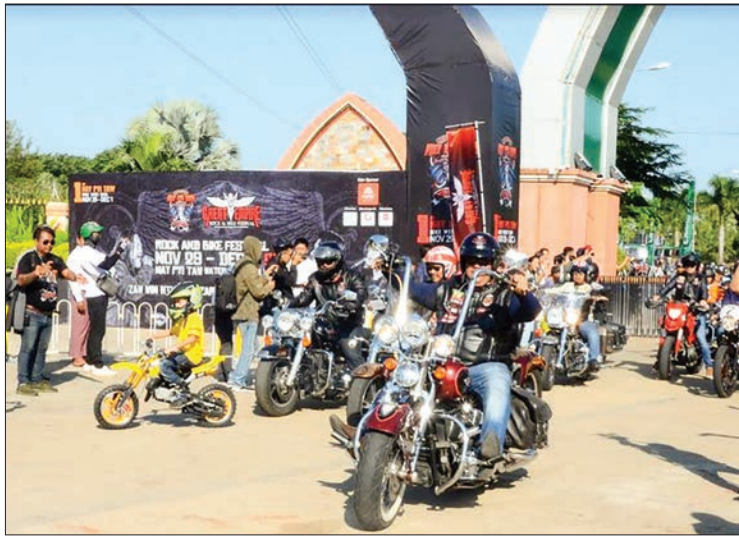
Bikers participate in the Nay Pyi Taw Bike Week 2019 event.

"This event is a gathering of motorcycle lovers from motorcycle clubs across the country. About 3,000 motorcyclists from over 100 motorcycle clubs participated in the festival. The