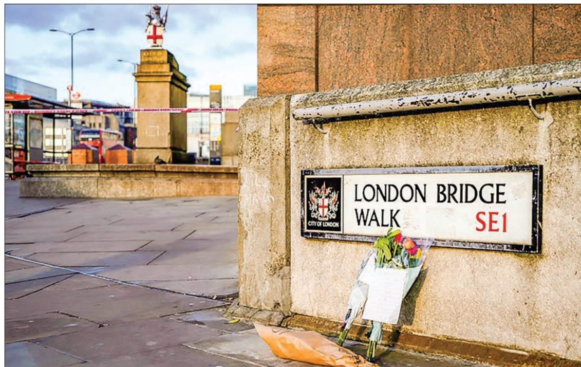
The incident comes two years after Islamist extremists in a van ploughed into pedestrians on the bridge before attacking people at random with knives.

The incident comes two years after Islamist extremists in a van ploughed into pedestrians on the bridge before attacking people at random with knives, killing eight people and wounding 48.—AFP ■