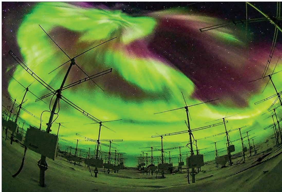
The PANSY radar is an active phased array of 1045 Yagi antennas.

Using the Program of the Antarctic Syowa Mesosphere-Stratosphere-Troposphere/Incoherent Scatter (PANSY) radar, the largest and fine-resolution atmospheric radar in the Antarctic, researchers performed the first incoherent scatter radar observations in the southern hemisphere in 2015. — ANI