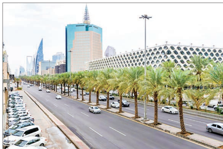
The G20 presidency, which Saudi Arabia takes over from Japan, will see it host world leaders for a global summit in its capital next November 21-22.

“This presidency... will be challenged by a central paradox: global risks like climate change, demographic developments, such as low birth rates, rising life expectancy and aging societies... but rising populism and nationalism are preventing progress at the multilateral level.”—AFP