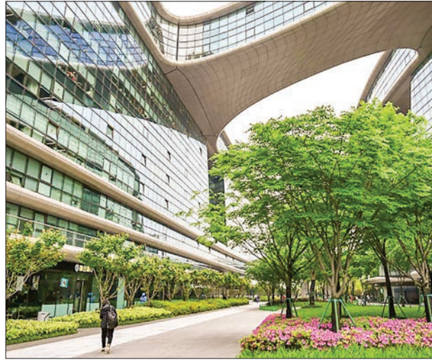
Jane Sun wants to drive female representation across the 45,000-strong Trip.com workforce.

As a working mother, she understands the challenges faced by many women in China, whose participation in the labour force has been falling for decades. She runs China's largest online tourism agency and is one of the country's business elite: a Silicon Valley returnee who moves in friendship circles