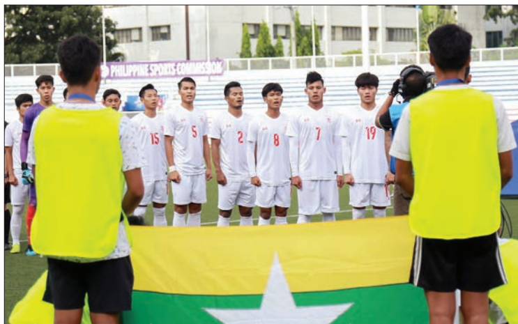
The Myanmar U-22 men's football team sing the national anthem ahead of their match against Timor Leste on 29 November at the Rizal Memorial Stadium in Manila, the Philippines.

THE U-22 men's national football teams of Myanmar and Cambodia will play a decisive Group A match in the men's football competition of the South East Asian Games today at the Binan Football Stadium in Binan, the Philippines.