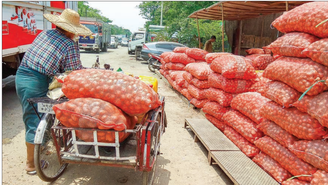
A man carrying sacks of onion near a warehouse in Yangon.

DESPITE the surge in onion prices in the local market, onion imports will not be allowed during harvest time, said Deputy Minister for Commerce U Aung Htoo.