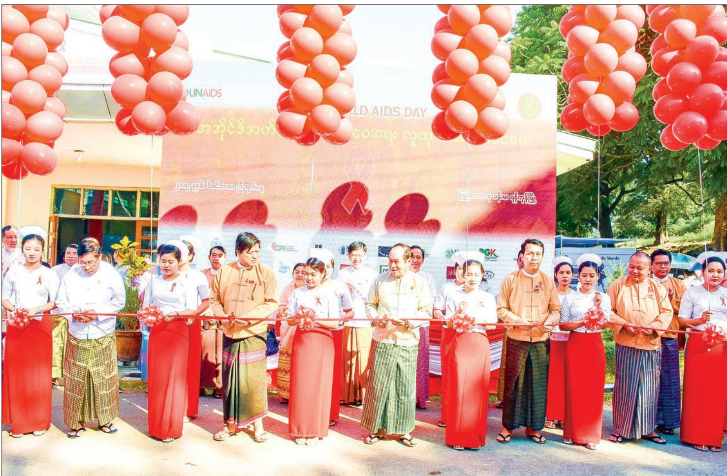
Union Minister Dr Myint Htwe and dignitaries open the World AIDS Day 2019 celebration in Yangon yesterday.

UNION Minister for Health and Sports Dr Myint Htwe attended the celebration of the World AIDS Day 2019, taken place at the Union Hall in Kyaikkasan Sports Ground in Yangon yesterday morning.