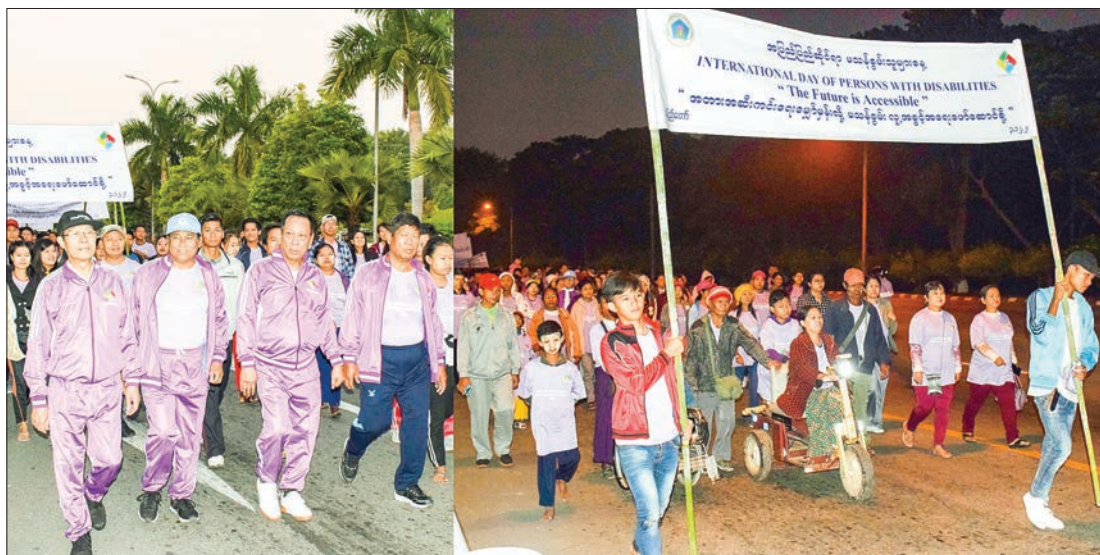
The mass walk event being held in Nay Pyi Taw yesterday morning to mark the 2019 International Day of People with Disabilities.

The event was taken part by Nay Pyi Taw Council Chairman Dr Myo Aung, and its members, Deputy Minister for Social Welfares, Relief and Resettlement U Soe Aung, departmental staff, the affiliated