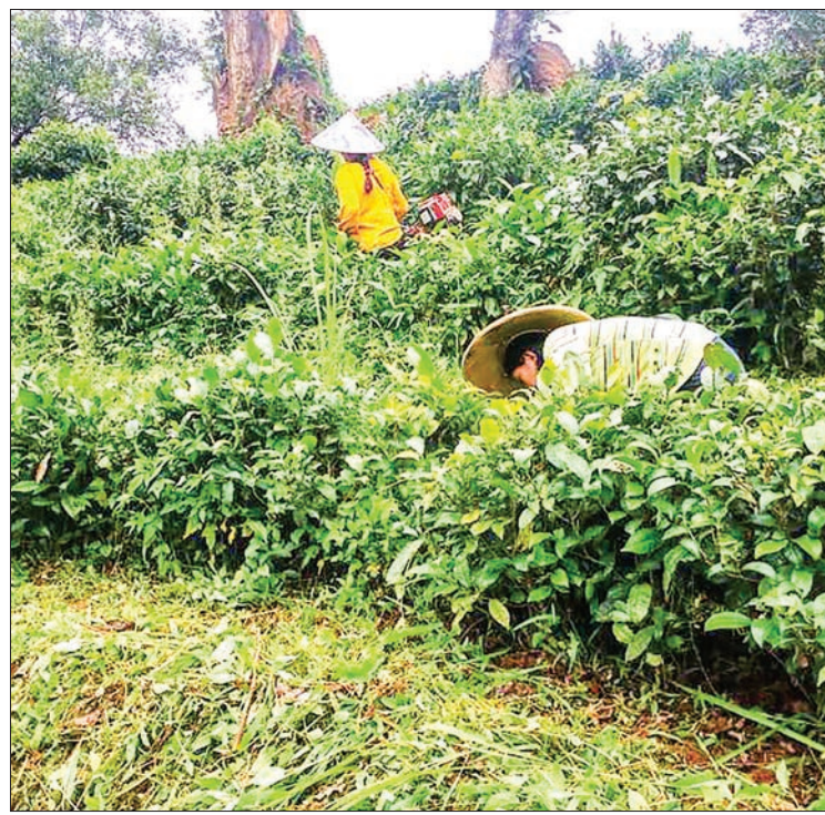
Farmers picking tea leaves in a farm in northern Shan State.