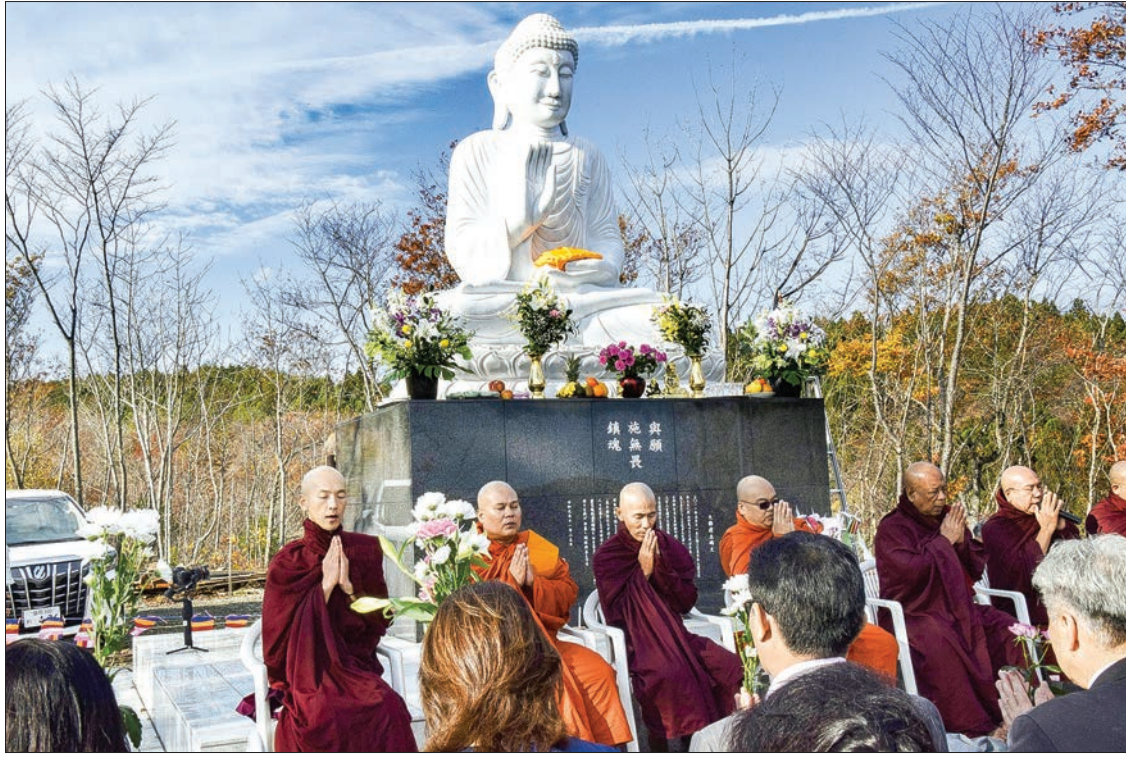
A Buddha statue donated by a company in Myanmar to Minamisanriku, Miyagi Prefecture, as pictured on Nov. 25, 2019.

SENDAI — A consecration ceremony was held on recently for a Buddha statue donated by Myanmar for victims of the devastating 2011 earthquake and tsunami that hit northeastern Japan.