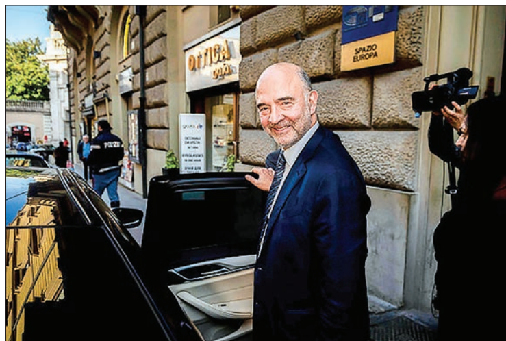
European Commissioner for Economic Affairs Pierre Moscovici leaves the press conference at the headquarters of the European Commission during the two-day visit to Italy, on November 22, 2019, in Rome. Italy.

BRUSSELS—The European Commission’s outgoing finance chief has called for reviving European initiatives to introduce a digital tax for the region if attempts to find a global solution fail.