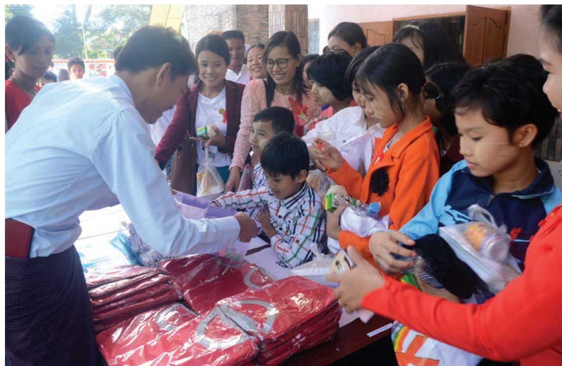
Children receive gift at the ceremony to mark the World AIDS Day in Sittway.