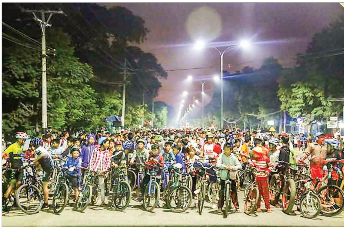
Young cyclists take part in the mass cycling event in Monywa on 1 December.

"The cycling event also includes 700 lucky draw programs for participants," an event organizer said.