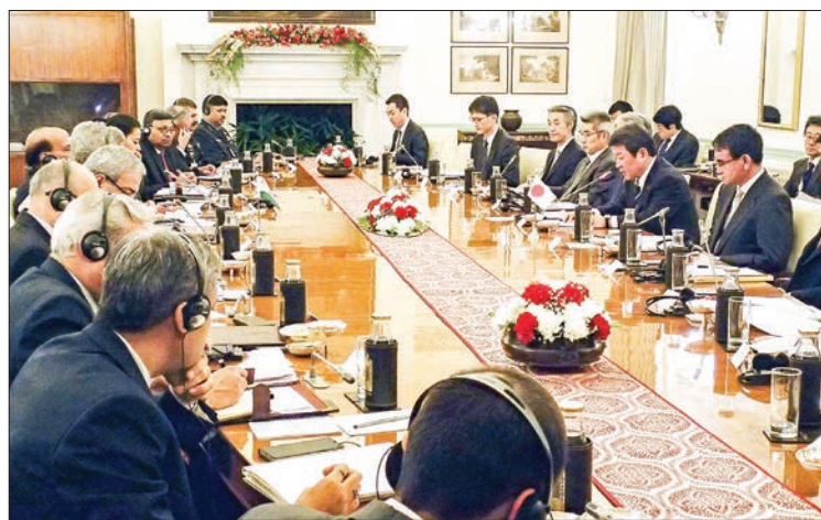
Japan and India agreed Saturday to conduct their first-ever joint fighter aircraft exercise in Japan.

NEW DELHI—Japan and India agreed Saturday to conduct their first-ever joint fighter aircraft exercise in Japan as part of efforts to promote bilateral security cooperation in the