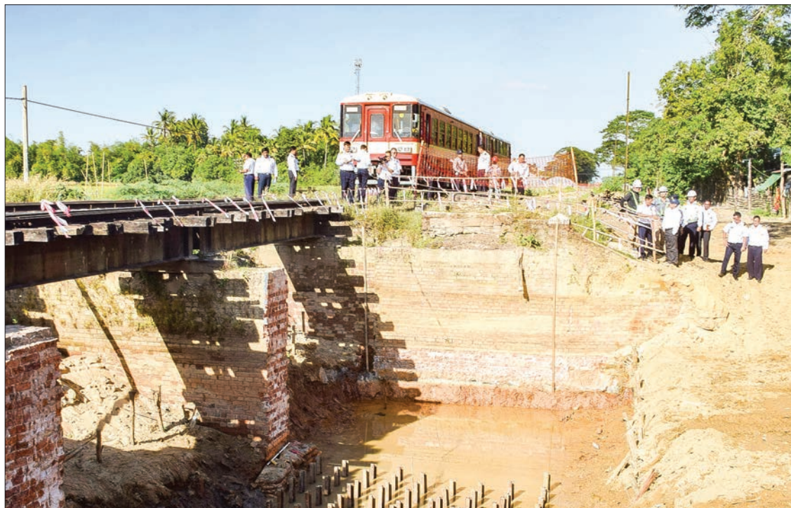
Union Minister U Thant Sin Maung and party inspect the bridge construction between Swa and Konegyi stations yesterday.