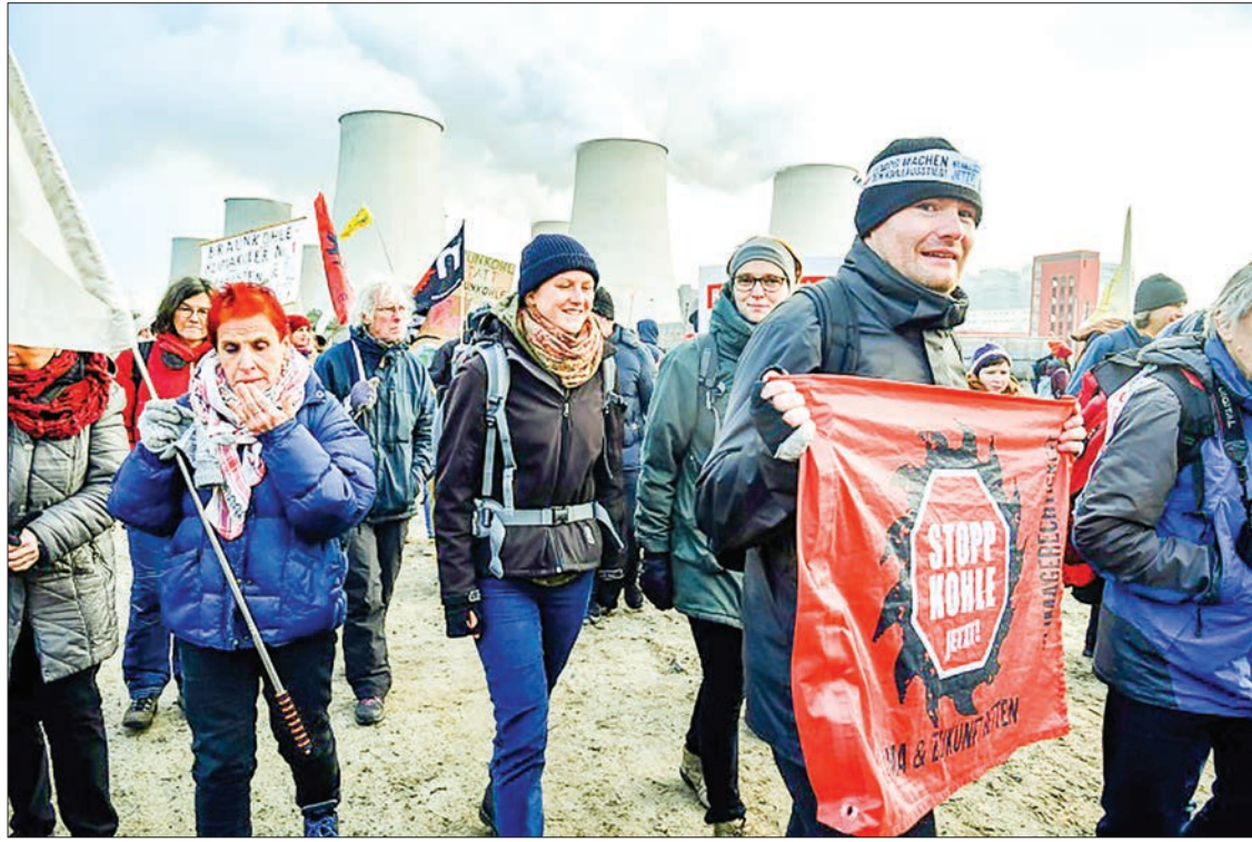
Campaigners say the government's plans to phase out coal by 2038 announced this year do not go far enough.

SPREMBERG — Thousands of activists on Saturday occupied several opencast coal mines in eastern Germany, seeking to put pressure on the government to phase out the fossil fuel — a divisive issue in the country's rust belt.