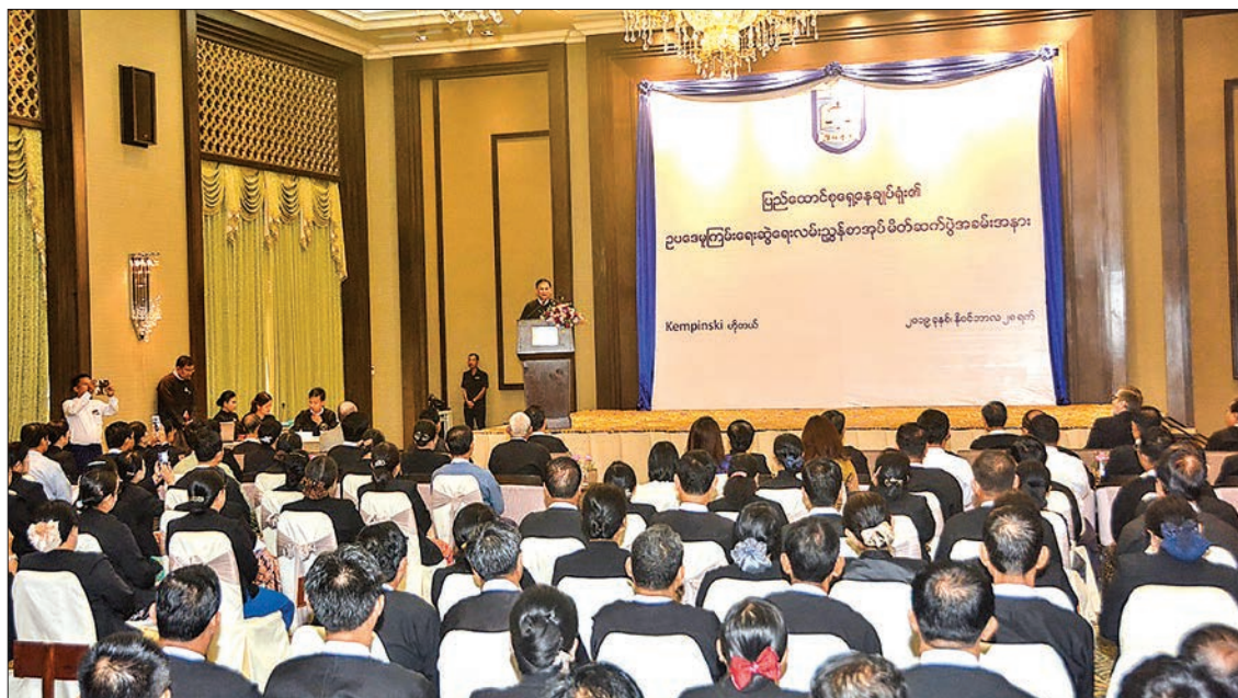
Union Attorney-General U Tun Tun Oo addresses the launching ceremony for Union Attorney-General's Office introduced a guidebook for drafting bills in Nay Pyi Taw yesterday.