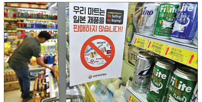
The South Korean boycott campaign has seen Japanese beer exports to the country wiped out, while shipments of instant noodles and sake have also taken a hit.

The historic dispute morphed into a trade spat between the two market economies, as Japan removed South Korea from a so-called “white list” of countries that enjoyed streamlined export control procedures.—AFP ■