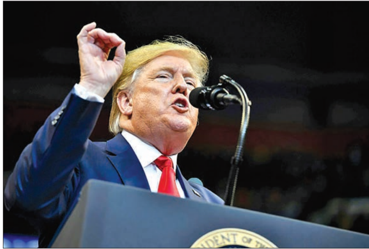
China said it would respond with ‘firm countermeasures’ after Donald Trump signed into law a bill recognising Hong Kong’s rights.

Trump on Wednesday put his name to the Hong Kong Human Rights and Democracy Act,