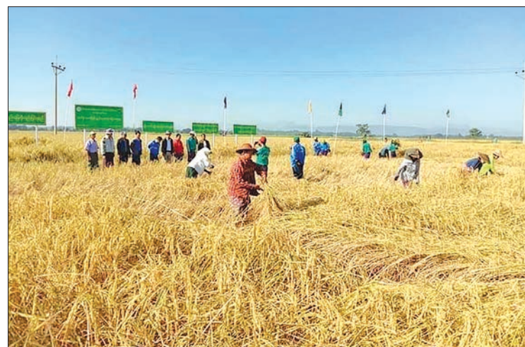
Farmers harvest paddy in Indaw Township.

The demonstration and harvesting were attended by