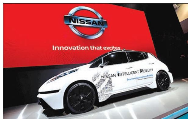
A Nissan Leaf, an electric vehicle is displayed at the Nissan Booth at CES 2017 at the Las Vegas Convention Center on January 5, 2017 in Las Vegas, Nevada.