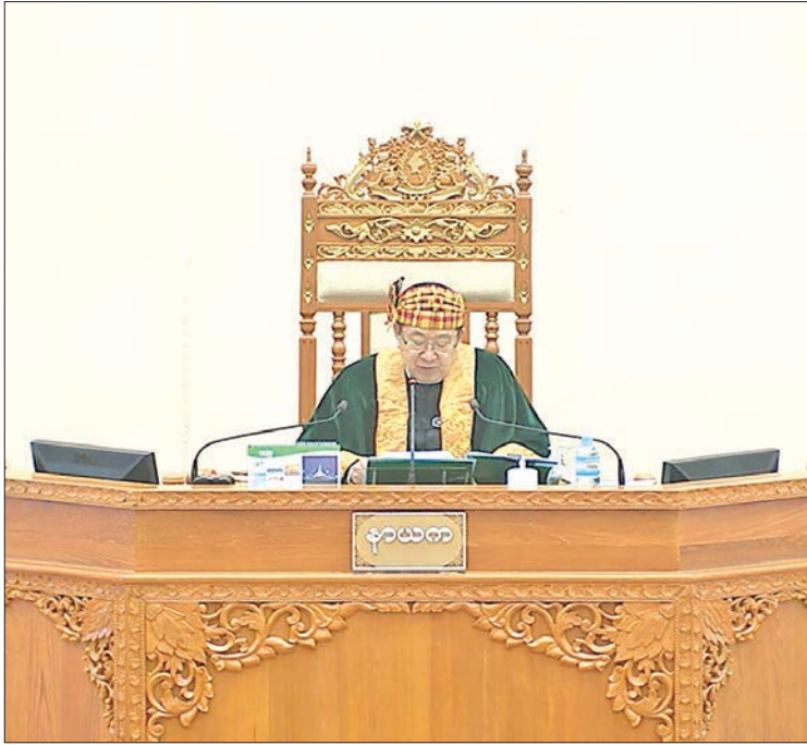
Pyidaungsu Hluttaw Speaker U T Khun Myat