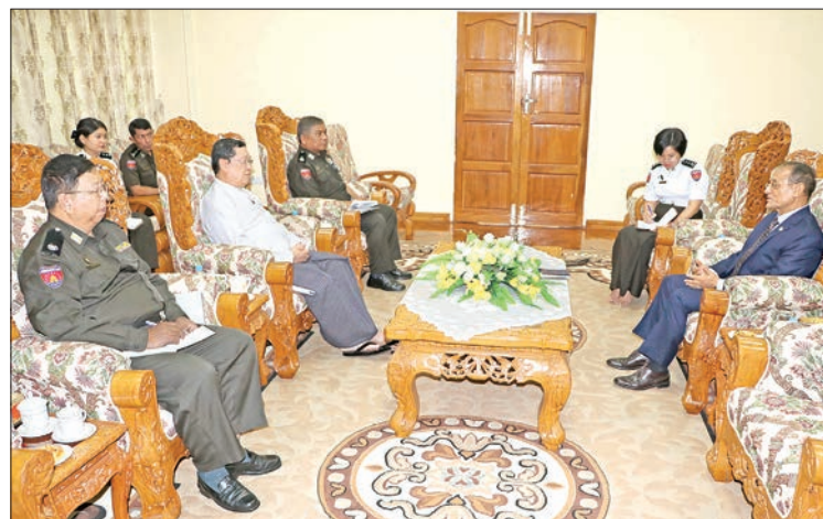
Union Minister U Thein Swe meets with Ambassador of Nepal Mr Bhim K Udas in Nay Pyi Taw yesterday.