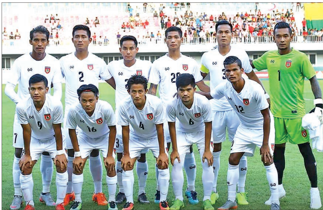
The Myanmar men's national football team seen at an international match.

THE Myanmar men's national football team has climbed 11 spots to 136 from 147 in FIFA rankings, according to a statement released yesterday by FIFA.