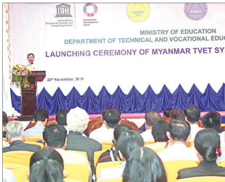
Union Minister for Education Dr Myo Thein Gyi addresses the Launching Ceremony of Myanmar TVET System Review Report in Nay Pyi Taw yesterday.