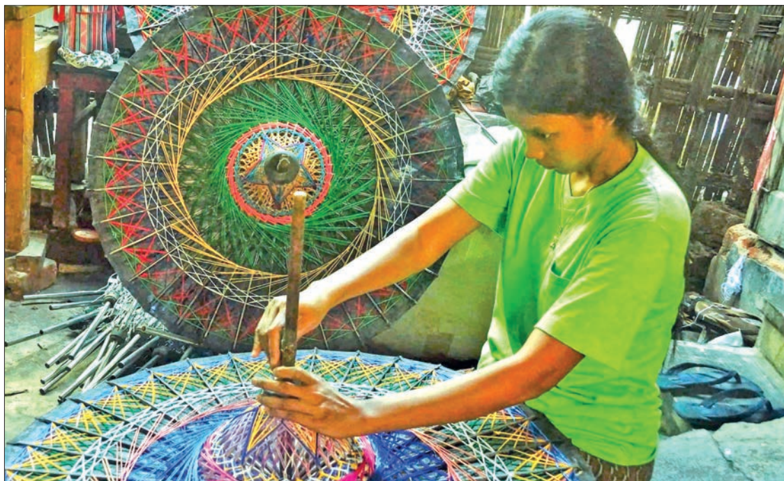
A woman is making one of the colorful Pathein parasol which is made from bamboo and fabric at an industry in Mahaangmye Township, Mandalay Region.

Traditional umbrellas are made completely by hand. First, bamboos are trimmed and dipped into water. Then, threads are connected to the trimmed bamboos and cloths are fixed onto the shaped bamboos with glue paste and then, the umbrellas are dried