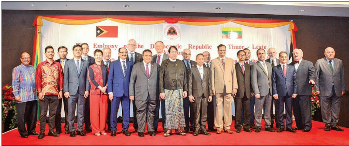
Union Minister Dr Pe Myint, Ambassador of Timor-Leste Mr Joao Freitas de Camara, diplomats and guests pose for a photo at the event to mark the Proclamation of Independence Day of Timor-Leste.

The Embassy of the Democratic Republic of Timor-Leste celebrated the 44 th anniversary of the Proclamation of Independence Day of Timor-Leste at the Lotte Hotel in Yangon yesterday and it was attended by Union Minister for Information Dr Pe Myint.