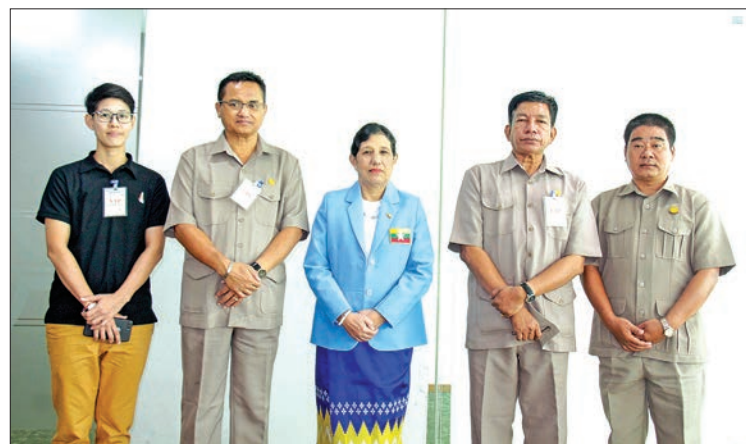
Deputy Minister Dr Mya Lay Sein seen off at the Yangon International Airport by officials before departing for the Philippines.