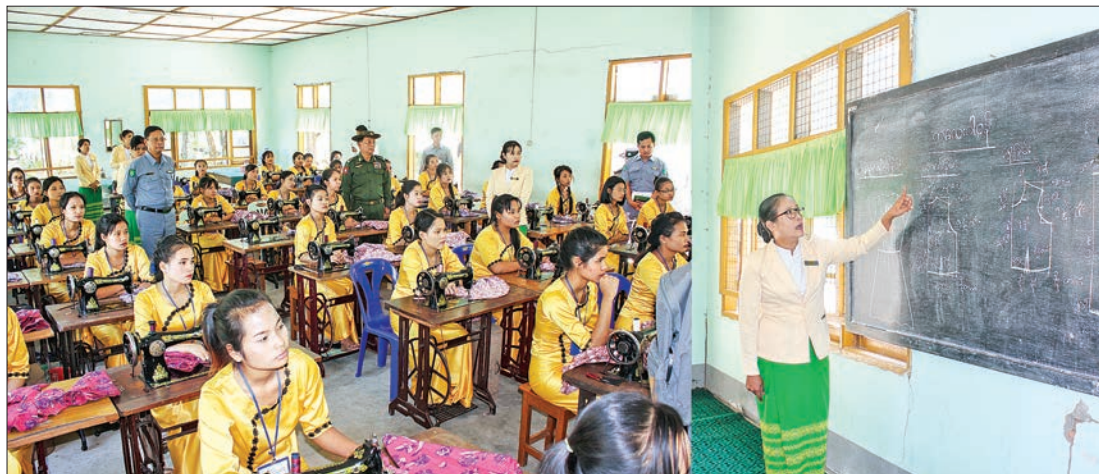
Union Minister Lt-Gen Ye Aung visits the Vocational Training School of Domestic Science for Women in Myawady Township on 27 November

UNION MINISTER for Border Affairs Lieutenant General Ye Aung visited Kayin State and inspected the regional development on 26 and 27 November.