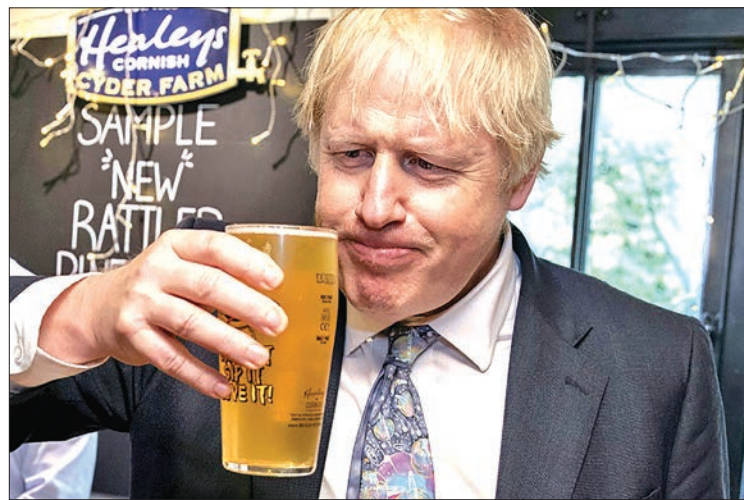
Britain's Prime Minister Boris Johnson is on course for an increased majority in next month's general election, a new poll says.

Dominic Cummings, a Johnson advisor who masterminded the 2016 Brexit campaign, warned just hours before the YouGov poll