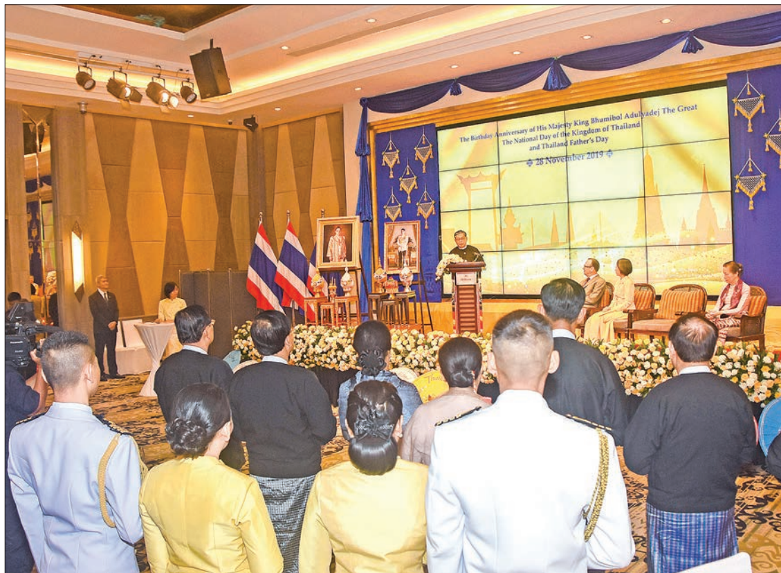
Union Minister U Kyaw Tint Swe addresses the celebration to mark the National Day of the Kingdom of Thailand and Thailand Father's Day in Nay Pyi Taw yesterday.

The reception was also attended by Union Ministers U Win Khaing, Dr Myint Htwe and U Kyaw Tin, Chief of General Staff (Army, Navy and Air) General Mya Tun Oo, senior military officers, Commander of Nay Pyi Taw Command, deputy ministers, permanent secretaries, departmental heads, ambassadors, diplomats and staff of the Embassy of Thailand and guests. —MNA (Translated by Kyaw Zin Lin)