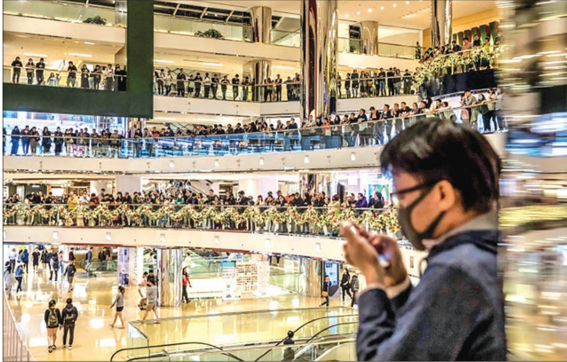
Hong Kong activists have welcomed the US move.

And Beijing’s liaison office in the city condemned Washington’s “disgusting conduct”, saying it would bring “trouble and chaos” to Hong Kong.—AFP ■