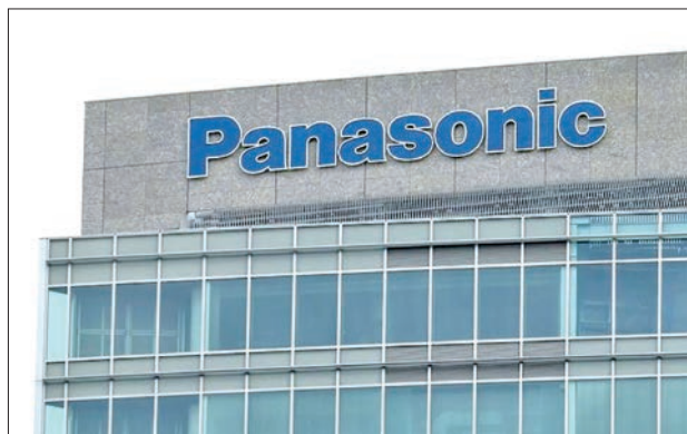
Japan's Panasonic has been gradually selling off some of its loss-making units.

However, traders cheered the news, with shares in the firm closing up 2.82 per cent at 1,009 yen. Only last week, Panasonic said it would end its production of liquid crystal display panels by 2021, again in the face of Chinese and South Korean manufacturers dominating the global market.—AFP ■