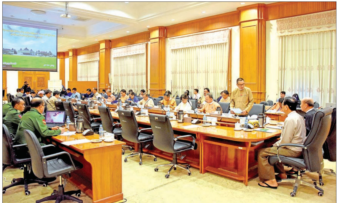
Pyidaungsu Hluttaw Deputy Speaker U Tun Tun Hein attends the meeting of the Joint Committee on Amending the 2008 Constitution 62/2019 in Nay Pyi Taw yesterday.