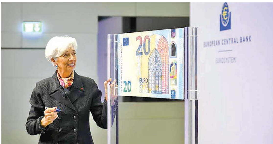
The new president of the European Central Bank (ECB) Christine Lagarde prepares to write her signature on a 20 Euro display banknote at the ECB headquarters in Frankfurt, Germany, 27 November, 2019.

As the ECB’s fourth president, Lagarde embarked on her eight-year term on 1 November, 2019.