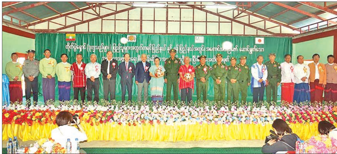
Union Minister Lt-Gen Ye Aung attends a completion ceremony of all-round development project buildings in Kayin and Mon states in Myawady Township, Kayin State.

UNION MINISTER for Border Affairs Lt-Gen Ye Aung attended a completion ceremony of all-round development project buildings in Kayin and Mon states held at Kayin State Myawady Township Lay Ke Kaw Town Duplaya High School hall yesterday afternoon.