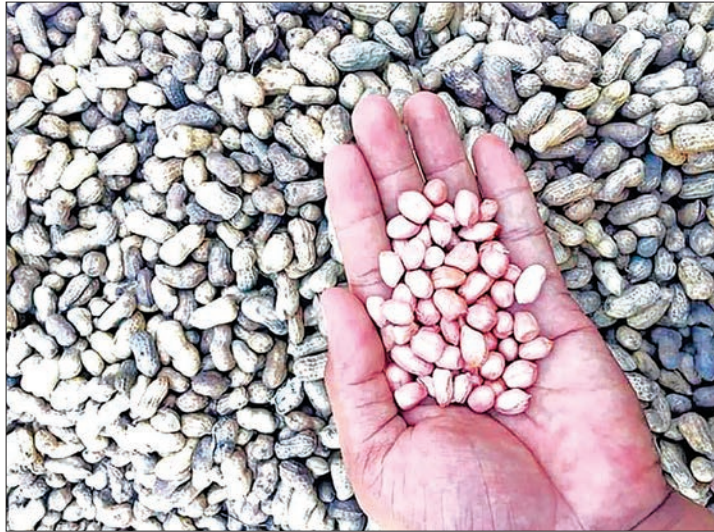
A man shows some of the white peanut in Monywa market.

The white and red peanuts are mainly exported to China market because they are widely used for food businesses. As the peanuts are available every season, the price fluctuations have occurred among the commodity depot depending on the qualities.