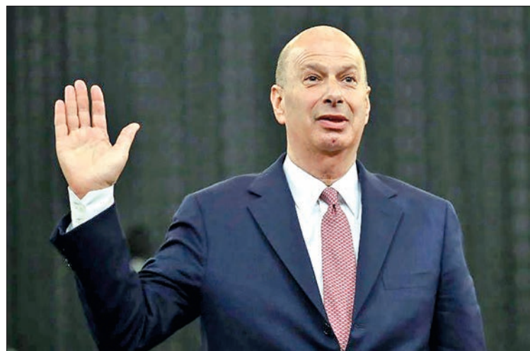
FILE PHOTO: Gordon Sondland, the US ambassador to the European Union, testifies before the House Intelligence Committee.

"Without a majority, the nightmare continues. All other MPs will gang together to stop Brexit and give EU citizens the vote," Cummings added.—AFP ■