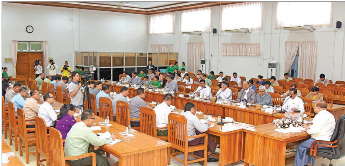
Union Minister for Investment and Foreign Economic Relations U Thaung Tun attends the 2 nd meeting of Investment Promotion Committee (IPC) in Nay Pyi Taw.

The meeting was attended by U Thaung Tun, Union Minister for Investment and Foreign Economic Relations and chairman of the IPC, U Aung Hla Tun, Deputy Minister for Information, U Hla Kyaw, Deputy Minister for Agriculture, Livestock and Irrigation, U Kyaw Myo, Deputy Minister for Transport and Communications, U Aung Htoo, Deputy Minister for Commerce, U Kyaw Lin, Deputy Minister for Construction, U Khin Mg Win, Deputy Minister for Electricity and Energy, U Win Maw Tun, Deputy Minister for Educa-